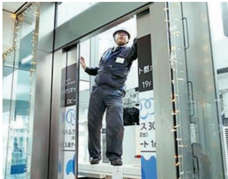
An official examines an elevator at Abeno Harukas, Japan’s tallest building, in Osaka, which was suspended after an earthquake with a preliminary magnitude of 6.1 jolted western Japan on 1 April 2016. No one was trapped in the elevator by the quake.

The latest launch of the short-range missile comes two days after a projectile was launched from North Korea’s east coast, with the Joint Chiefs of Staff saying they believed it was a test of a new multiple rocket launcher system.— Kyodo News