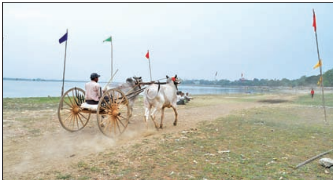
A bullock cart seen participating in the cart race.