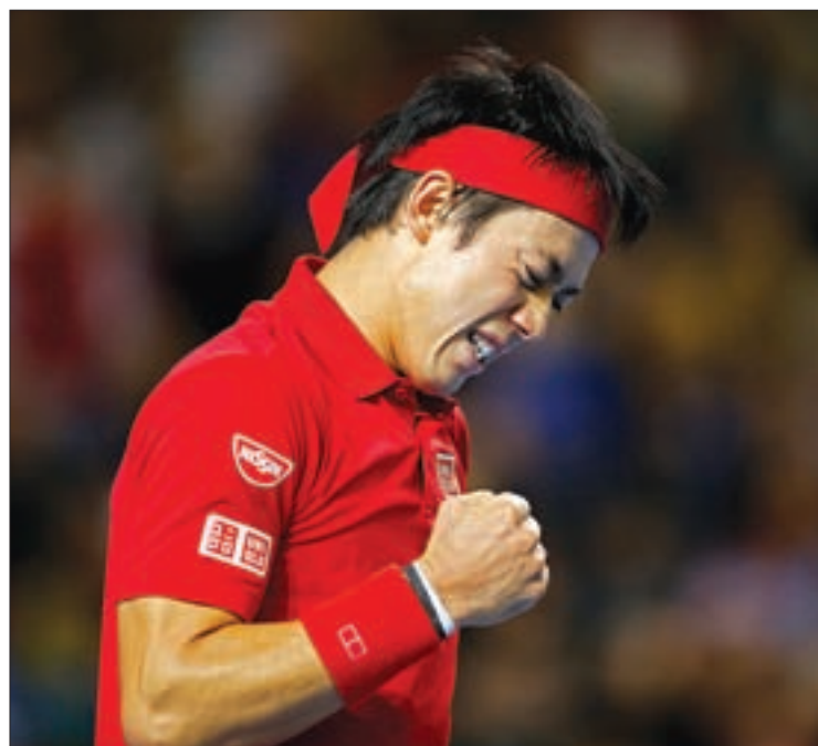
Japan's Kei Nishikori celebrates during his match against Great Britain's Andy Murray during Davis Cup World Group First Round at Barclaycard Arena, Birmingham on 6 March.

"To be honest I didn't think I was going to break during the match but I broke him in the first game. I came out really energetic and I got pretty lucky and that definitely made me more relaxed and made me play my game a little bit easier."—Reuters