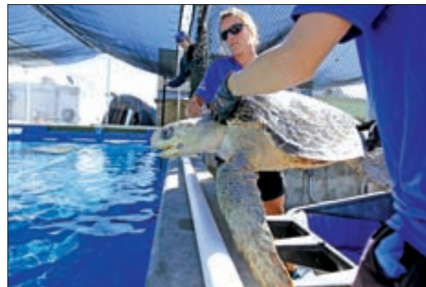
One of two rescued endangered olive ridley turtles is lifted into a waiting pool as it arrives at Sea World's animal rescue centre after being flown from the Oregon coast by the US Coast Guard to San Diego, California on 30 March.

"We have treated many scuba divers over the years for a gas bubble disease known as decompression sickness, which is also called 'the bends.' This is the first time we have been asked to assist in the care of