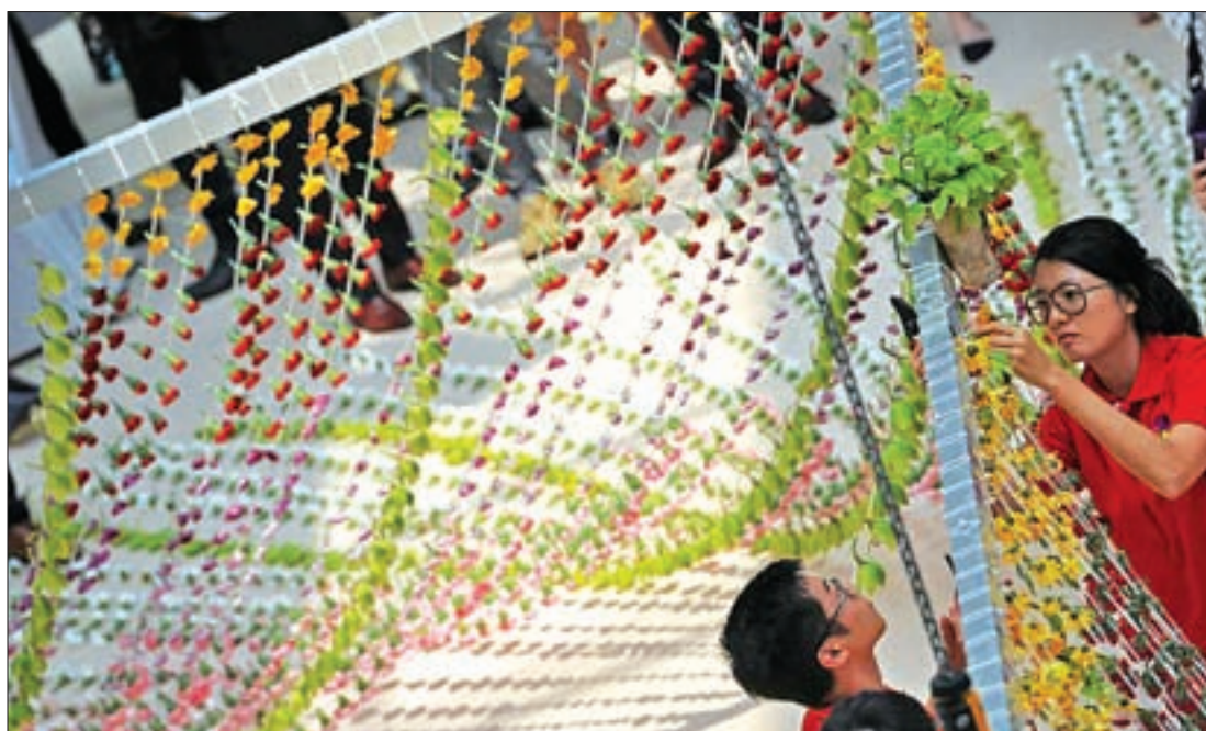
Workers prepare a large floral chandelier during a promotional event for the Singapore Garden Festival (SGF) at Singapore's Marina Square, on 1 April.

"Hope that this year's SGF will continue to inspire more people to develop a passion for gardening and all things green. Then we will not only flourish as a city in a garden, but also a city of gardeners and garden lovers," said Wong.—Xinhua