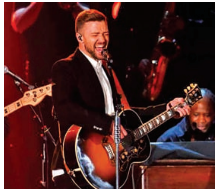
Justin Timberlake and Chris Stapleton (not pictured) perform a medley of songs at the 49th Annual Country Music Association Awards in Nashville, Tennessee in November 2015.

Copyright infringement lawsuits are relatively common in the music world. In one high-profile case last year, the estate of soul singer Marvin Gaye won a $7.4 million jury verdict against Robin Thicke and Pharrell Williams over their hit single "Blurred Lines."—Reuters