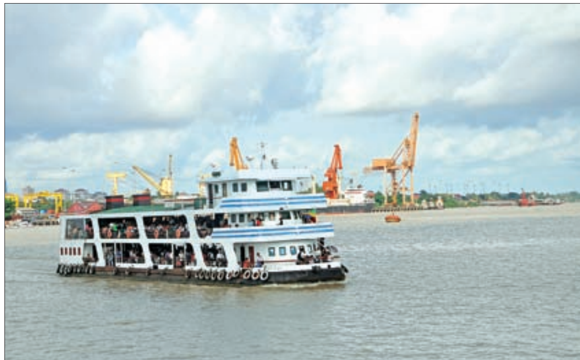
IWT's ship lines rescheduled for Thingyan.

SOME ship lines run by Inland Water Transport will not operate during the upcoming Maha Thingyan Festival according to the Delta Branch of the IWT.