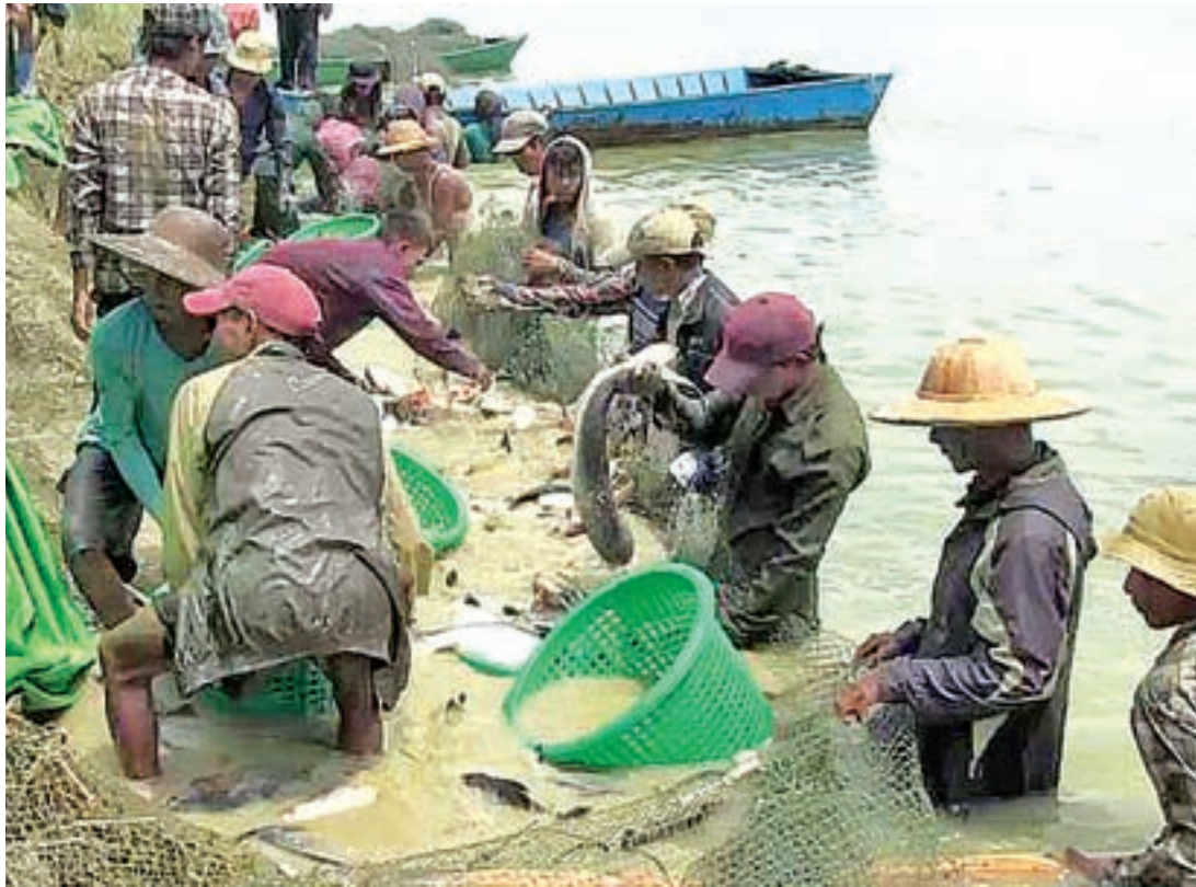
Men catch fish at the fish farm in Rakhine State.