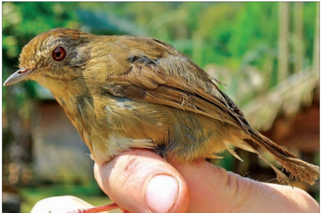
A new species discovered in Putao being seen.

(UNESCO), with the survey reporting the discovery of a bird species in Putao district of Kachin State. According to foreign expert Dr Swen C. Renner, its variety is yet to be identified and will require further zoological analysis. The team has collected 86 species of birds, 32 species of bats, 21 species of rodents and seven species of reptile amphibians, with plans to bring them to the UNESCO for assessment of their habits and genetic makeup.—(OUV).—Myanmar News Agency