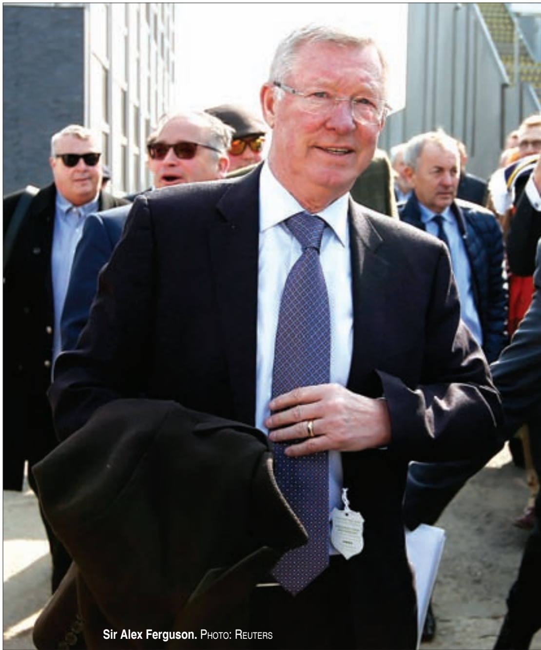
Sir Alex Ferguson.

Van Gaal's side host 12 th -placed Everton at Old Trafford in the league on Sunday.—Reuters