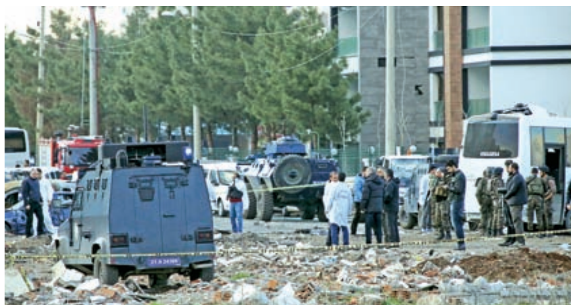
Forensic experts inspect the area after a car bomb attack targeting a minibus carrying members of the police special forces, occurred in the Kurdish-dominated southeastern city of Diyarbakir, Turkey on 31 March.

The government has announced an ambitious restoration plan for the southeast.—Reuters