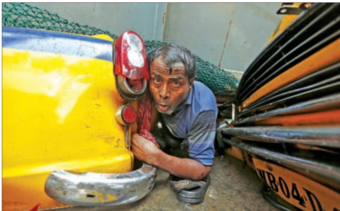
A man is seen trapped amid the debris of an under-construction flyover after it collapsed in Kolkata, on 31 March.

A senior IVRCL manager had drawn national condemnation