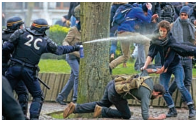
French gendarmes use tear gas during clashes with youths during a demonstration by employees, high school and university students against the French labour law proposal in Lille, France, as part of nationwide labor reform protests and strikes, on 31 March 2016.