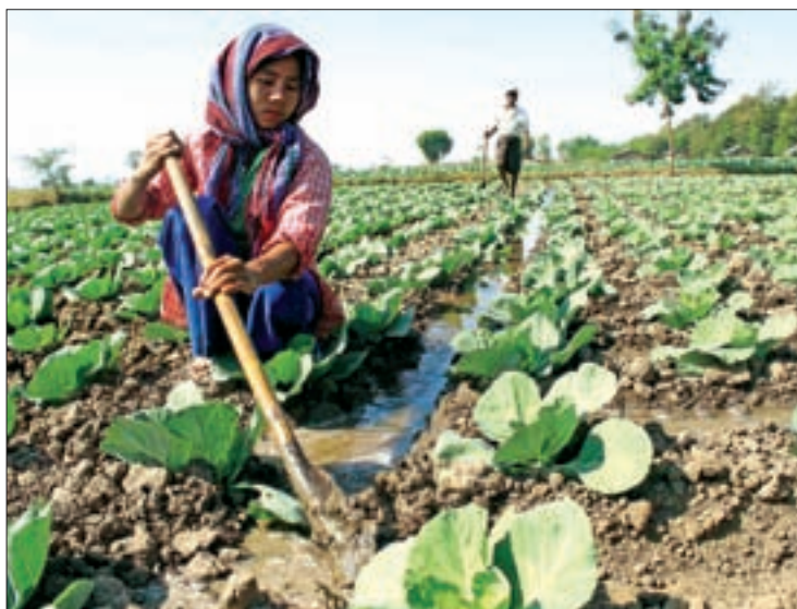
A woman works in cauliflower farm.

Boosting productivity – and thus profitability – will require reforms to increase the availability and adoption of modern farm technologies, as well as investments in seeds and extension services. For example, in 2013-2014, total spending by the Ministry of Agriculture and Irrigation on seed and extension programs was only 0.22 per cent of agricultural GDP (or 0.07 per cent of total GDP), well below the globally recommended benchmark of 1 per cent of agricultural GDP. Only one per cent of the demand for paddy seed is estimated to be met by supply in Myanmar, compared to nearly 100 per cent in Thailand and Viet Nam. Private investment can play a critical role in addressing these constraints, private investment which regulatory reforms can help unleash. Similarly, reforms in the land sector to in-