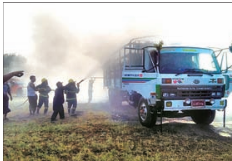
Fire fighters pulling out the blaze.

Police have taken action against Ko Aung.—Tin Tun Oo (Minbu)