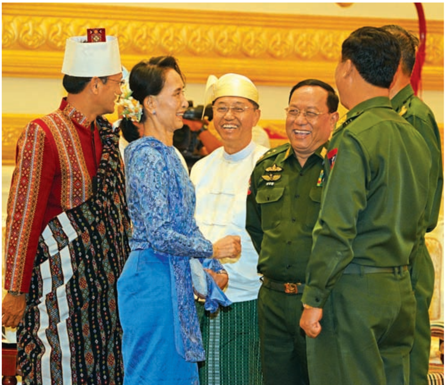
Daw Aung San Suu Kyi smiles with army Union ministers appointed by army the handover ceremony of presidency in Nay Pyi Taw.