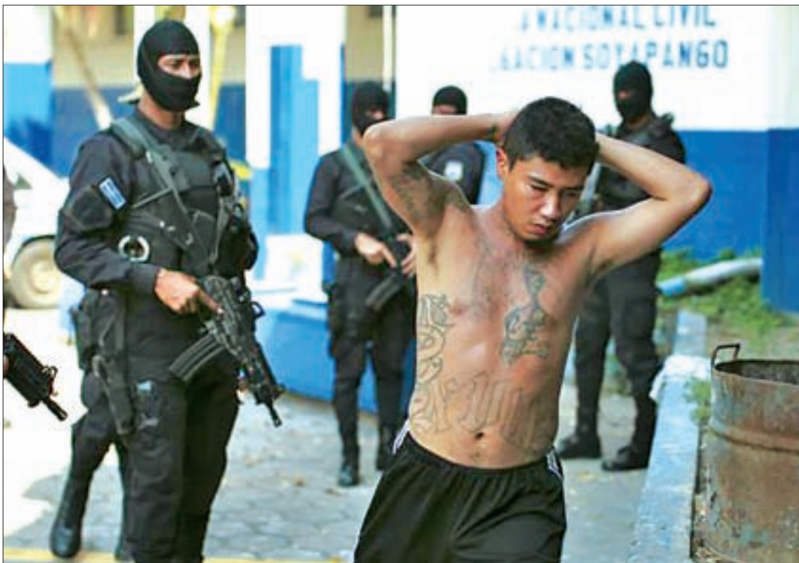
One of 13 suspected members of the 18 th street gang is presented to the media after being arrested by the police under the charges of homicide and terrorism, in Soyapango, El Salvador on 31 March.

During the first two months of the year there were an average 23.3 murders a day. That was 120 per cent up on the same period last year.—Reuters