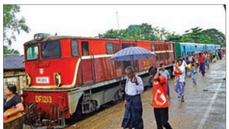
The circular train is seen at a station in outskirts of Yangon.