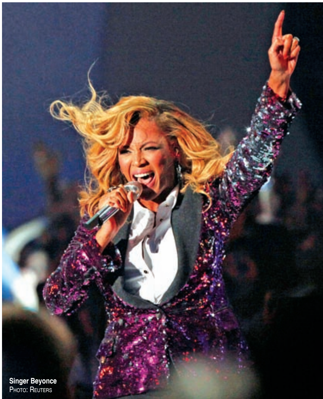
Singer Beyonce PHOTO: REUTERS

Topshop and Beyonce announced their joint partnership in October 2014.—Reuters