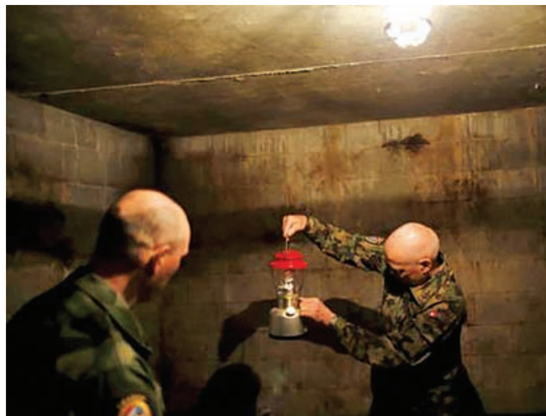
Swiss Army Major General Urs Gerber (R) and Swedish Major General Mats Engman check a lamp inside a bunker at the Neutral Nations Supervisory Commissions (NNSC) headquarters near the truce village of Panmunjom, South Korea, on 30 March.

the rich, democratic South are still technically at war after the 1950-53 conflict ended in the armistice, not a treaty. China and North Korea fought side-by-side against a US-backed South Korea, which joined forces under the UN flag.