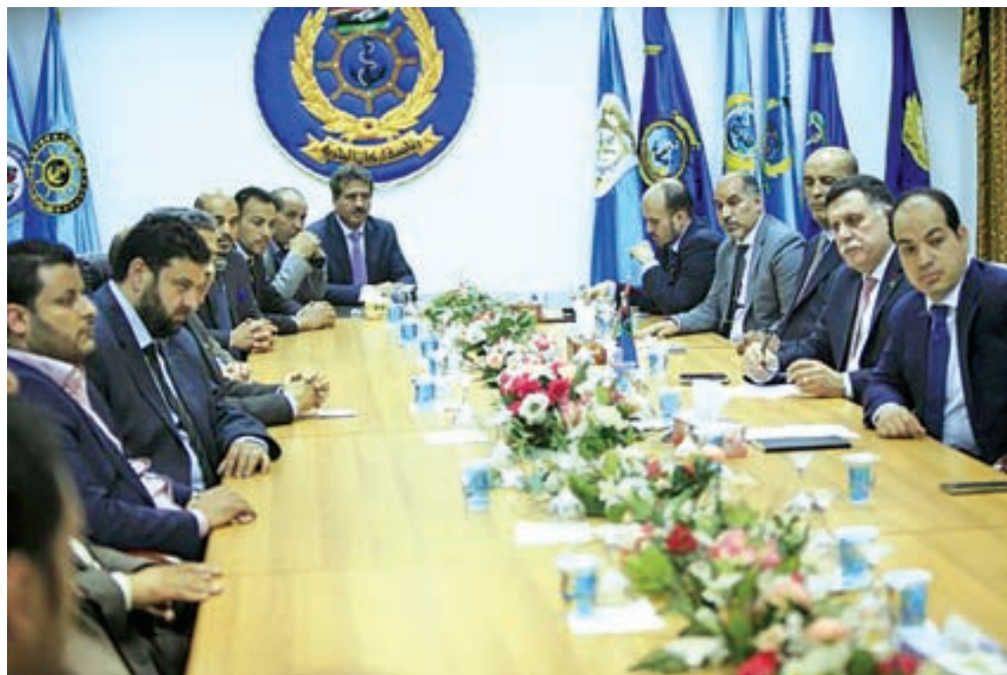
Fayez Seraj, Libyan prime minister-designate under the proposed unity government, attends a meeting with officials of municipal council of Tripoli in Tripoli, Libya, on 31 March.

TRIPOLI — Libya's UN-backed unity government held meetings at a heavily guarded naval base in Tripoli on Thursday and a senior