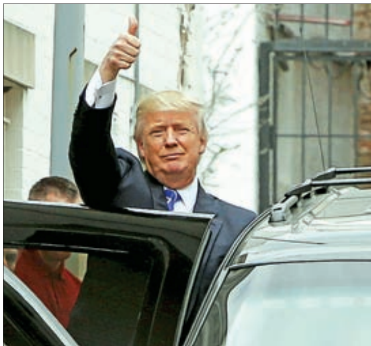
US Republican presidential candidate Donald Trump waves to onlookers and reporters as he departs through a back door after meetings at Republican National Committee (RNC) headquarters in Washington 31 March, 2016.

WASHINGTON — Republican presidential front-runner Donald Trump made a surprise closed-door visit to the Republican National Committee on Thursday after a tumultuous two days on the campaign trail that included a reversal of his pledge to support the party's nominee.