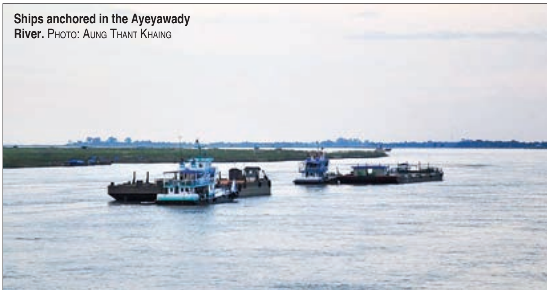
Ships anchored in the Ayeyawady River.

According to the director, the GIS team is currently surveying the water storage capacity of the dam, its durability and the socio-economic status of a nearby Chin village.— Po Thant