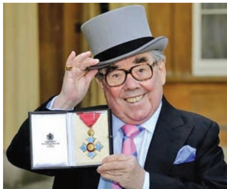
File photo of Ronnie Corbett posing for photographs after being presented with his Commander of the Order of the British Empire (CBE) medal by Queen Elizabeth during an investiture ceremony at Buckingham Palace in London in 2012.

LONDON — Ronnie Corbett, the bespectacled British comedian best known as the small half of the hit television double act "The Two Ronnies", has died surrounded by his family, his publicist said on Thursday. He was 85.