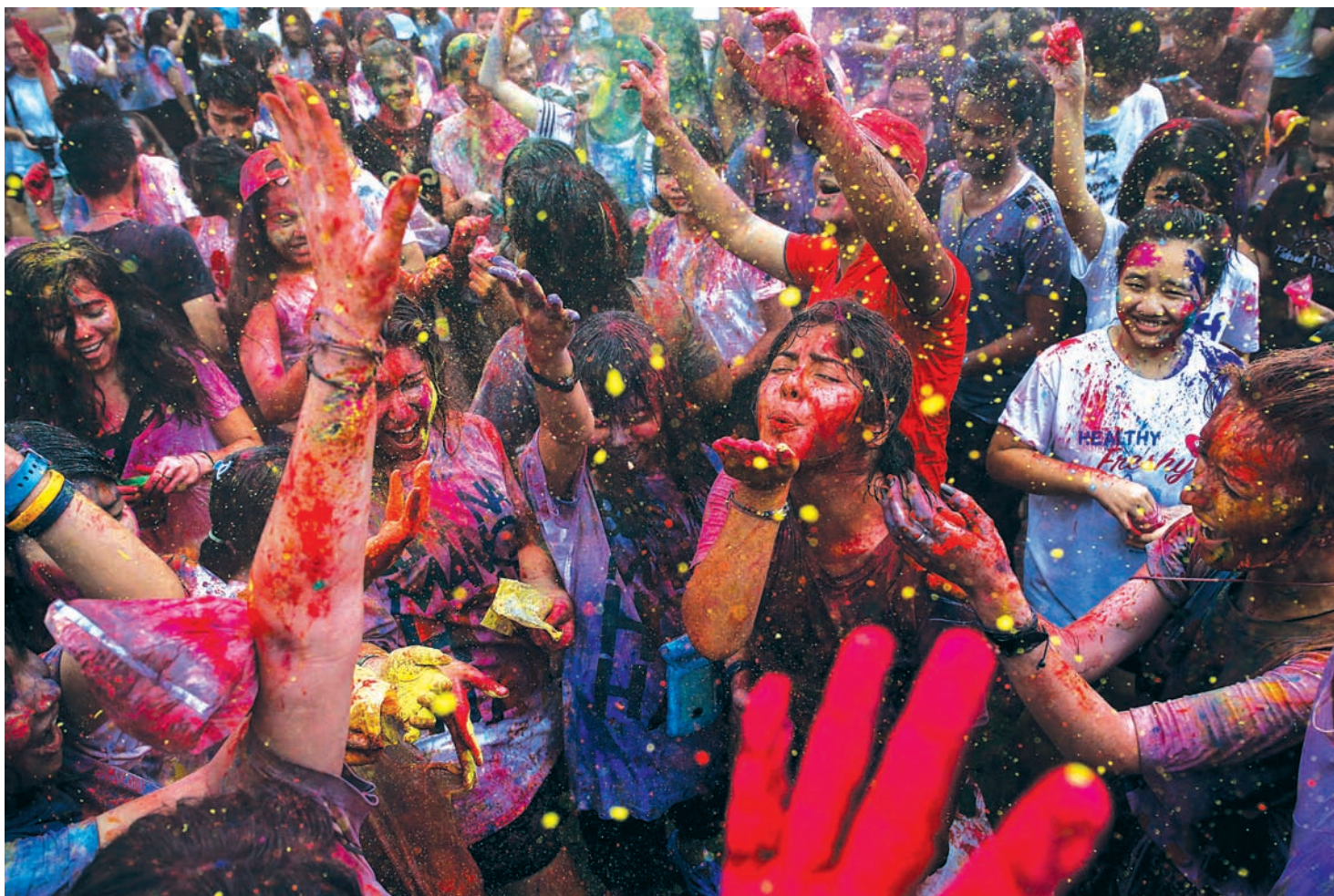
Revellers take part in the annual Holi Rangotsav Festival organised by Vishwa Hindu Parishad Association at a university in Bangkok, Thailand, on 27 March 2016.