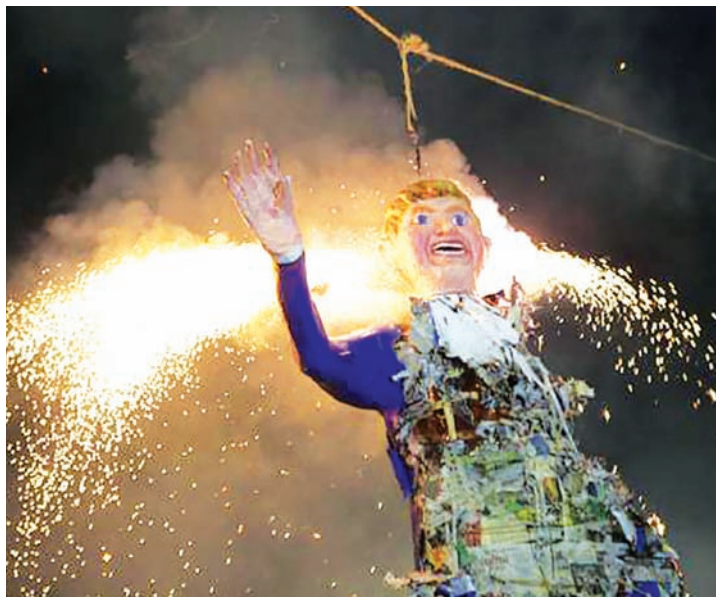
Mexicans burn an effigy of U.S. Republican presidential hopeful Donald Trump as they celebrate an Easter ritual late on Saturday in Mexico City's poor La Merced neighbourhood on 26 March 2016.

Trump, the front-runner to win the Republican nomination for the 8 November election, has drawn fire in Mexico with his campaign vow to build a wall along the southern US border to keep out illegal immigrants and