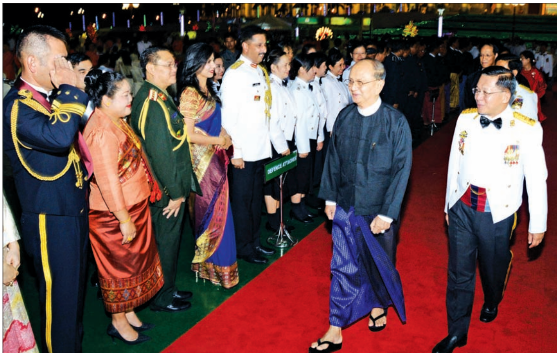
President U Thein Sein and Senior General Min Aung Hlaing greet military attaches' of embassies.