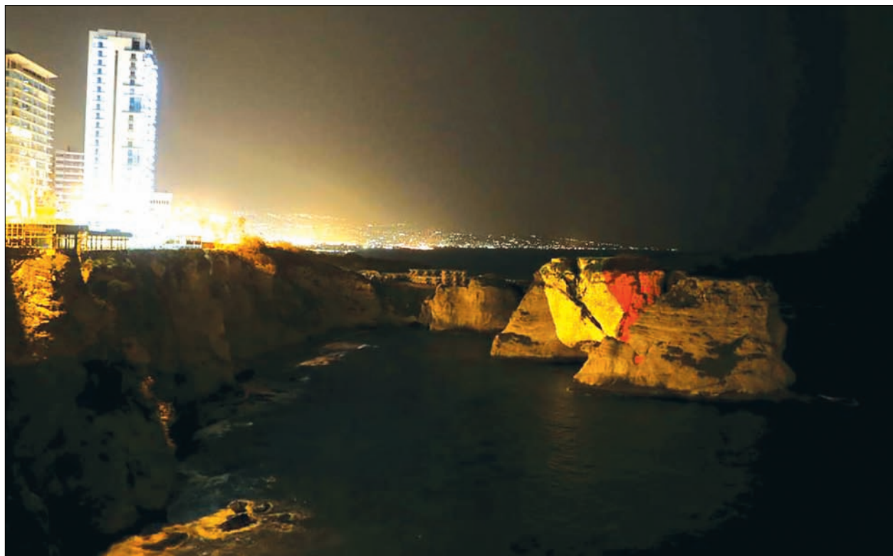
The Pigeon Rock in Beirut, Lebanon, is illuminated in the colours of the Belgian flag in a gesture of solidarity over the suicide attacks in Brussels, on 26 March 2016.

BEIRUT — The Lebanese capital Beirut lit up one of its landmarks in the colours of the Belgian flag on Saturday in a gesture of solidarity over the suicide attacks in Brussels which killed 31 people. The Mediterranean city