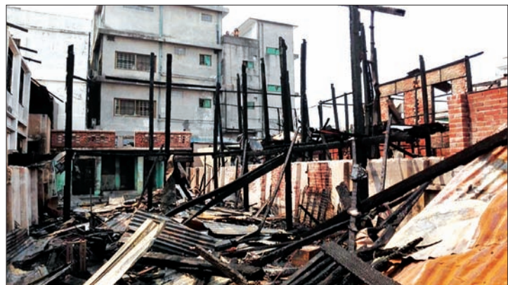
Damaged houses seen at the scene.

A HOME fire in Chanayethazan Township, Mandalay Region, has left over 80 people homeless. The victims have moved into temporary shelters.