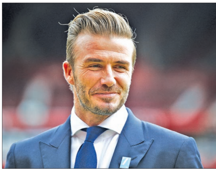
David Beckham.

Harper is David and Victoria's youngest child. The longtime couple also has three teenage sons, Brooklyn, Romeo and Cruz.