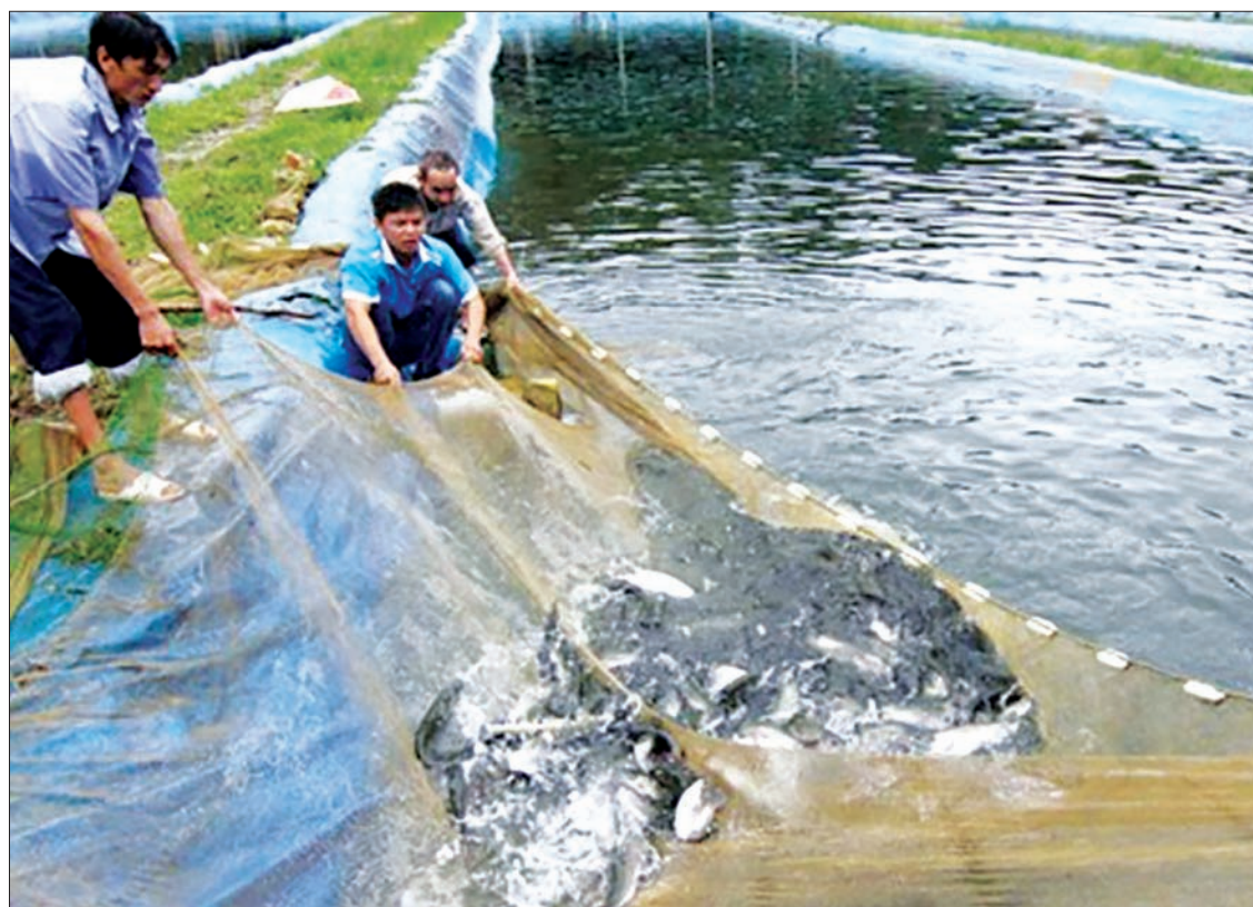
Workers catch fish at a fishfarm in Rakhine State.

PUBLIC consultations are due to take place during the end of April for the drawing up of community centred by-laws by the Rakhine Fisheries Partnership and Rakhine State Fisheries Department.