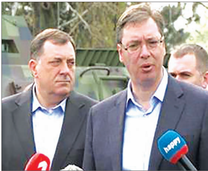
Serbian Prime Minister Aleksandar Vucic.

BELGRADE — Serbian Prime Minister Aleksandar Vucic said Saturday that he was heading a government to which crimes and criminals did "not differ in name and surname," but only in