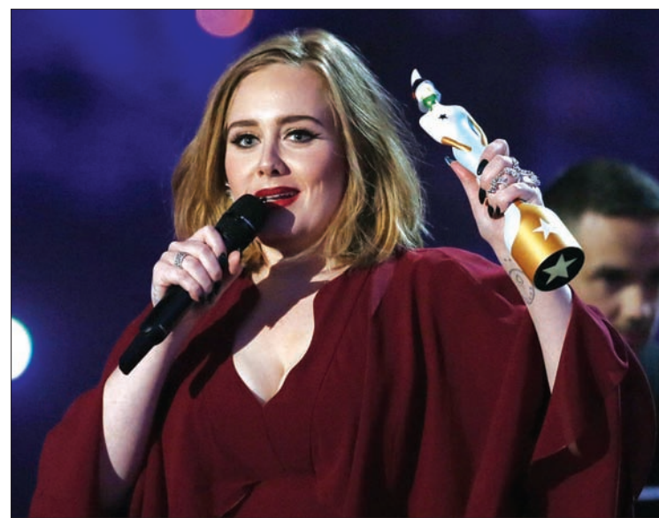
Singer Adele.

LONDON — Singer Adele has robbed veteran pop act James of their first number one UK album