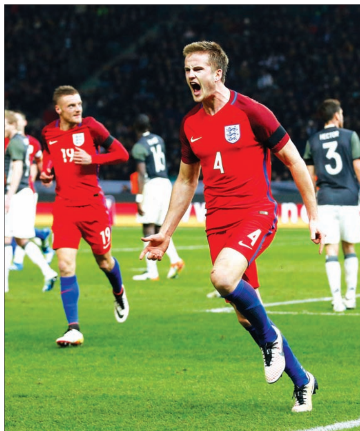
Eric Dier celebrates after scoring the third goal for England during International Friendly at Olympiastadion, Berlin, Germany on 26 March 2016.

BERLIN — Substitute Jamie Vardy scored with a stunning flick, his first international goal, and Eric Dier headed a last-gasp winner as England hit back from two goals down to beat old rivals Germany 3-2 in a friendly on Saturday.