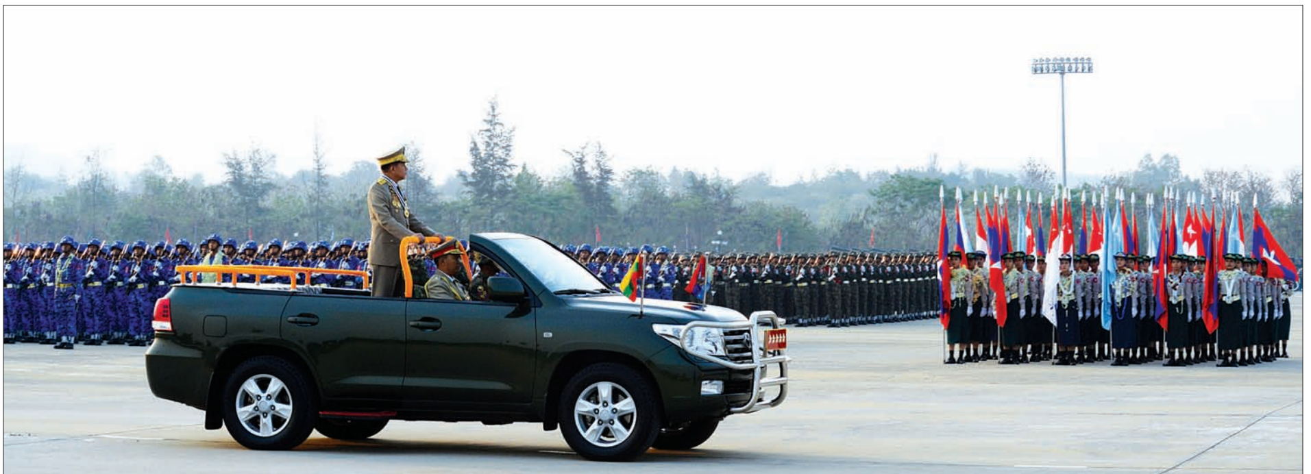
Commander-in-Chief Senior General Min Aung Hlaing inspects parade columns at 71 st Armed Forces Day commemoration in Nay Pyi Taw.

Commander-in-Chief addresses 71 st Armed Forces Day parade