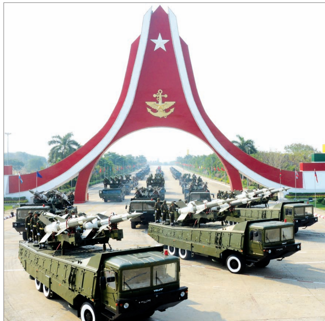
Missile carriers are seen at the 71 st Anniversary Armed Forces Day in Nay Pyi Taw.

“The two main hindrances in democratisation are the lack of abiding by the rule of law, regulations and the presence of armed insurgencies. These could lead to chaotic democracy.”