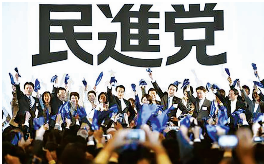
Lawmakers of the newly formed Democratic Party, created through the merger of the main opposition Democratic Party of Japan (DPJ) and the smaller Japan Innovation Party, raise their hands in celebration during the party's inaugural convention at a hotel in Tokyo on 27 March 2016. Katsuya Okada, former DPJ leader, was elected as the head of the new party.

The merger will officially be reported to the Internal Affairs and Communications Ministry on Monday.—Kyodo News