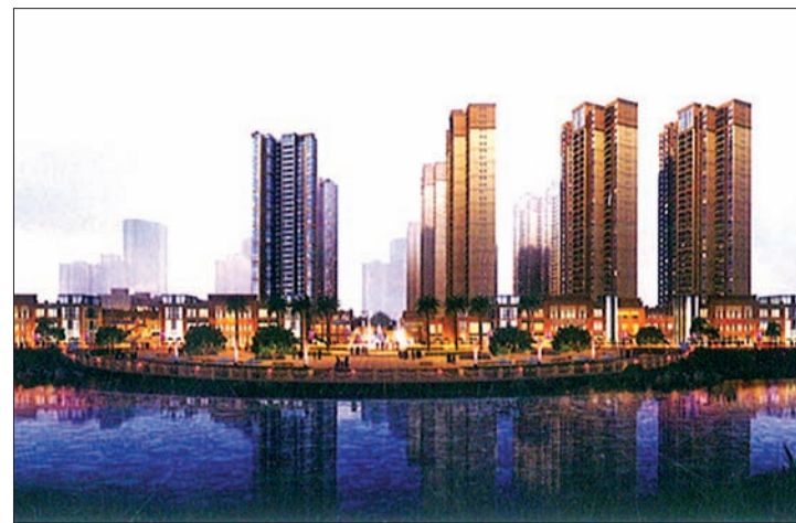
A small scale model of Sea View Condominium.

The two companies signed the agreement to develop the Sea View Condo project in the presence of Taninthayi Region Chief Minister U Myat Ko, at a ground-breaking ceremony on 25 March.—200