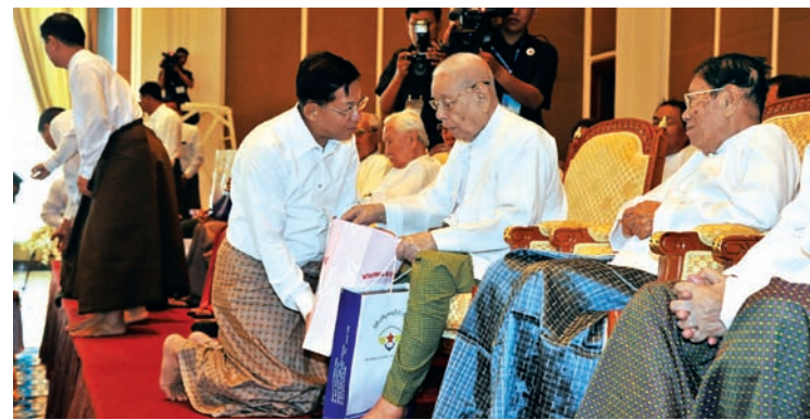
Senior General Min Aung Hlaing talks to veteran military officers.

FAMILIES of the army, the navy and the air forces paid respects to retired senior military officers who attended the 71 st anniversary Armed Forces Day yesterday.