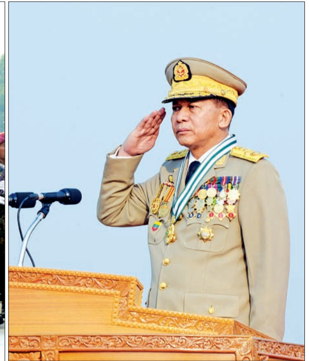
Senior General Min Aung Hlaing takes salute of the columns at the 71 st Anniversary Armed Forces Day parade in Nay Pyi Taw.