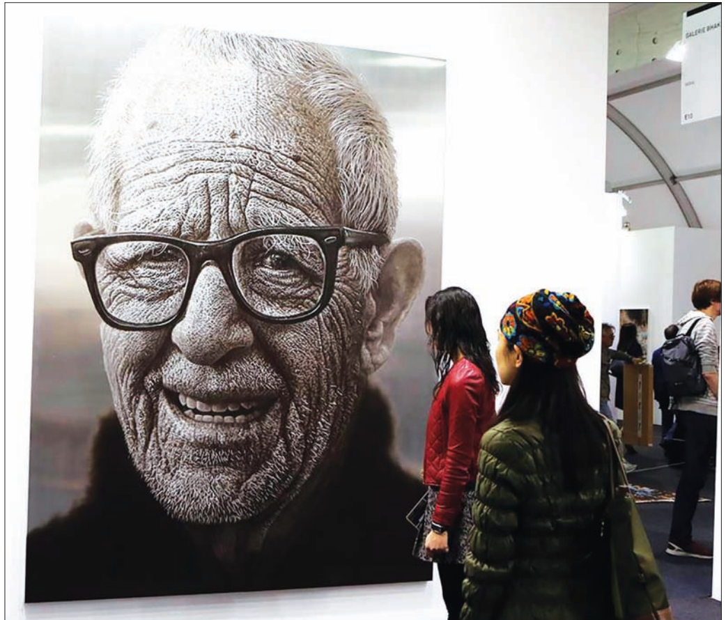
HONG KONG — Visitors watch a creation displayed at the Contemporary Art Expo in Hong Kong, south China, on 26 March 2016. More than 100 galleries from 21 countries and regions attended the Expo.