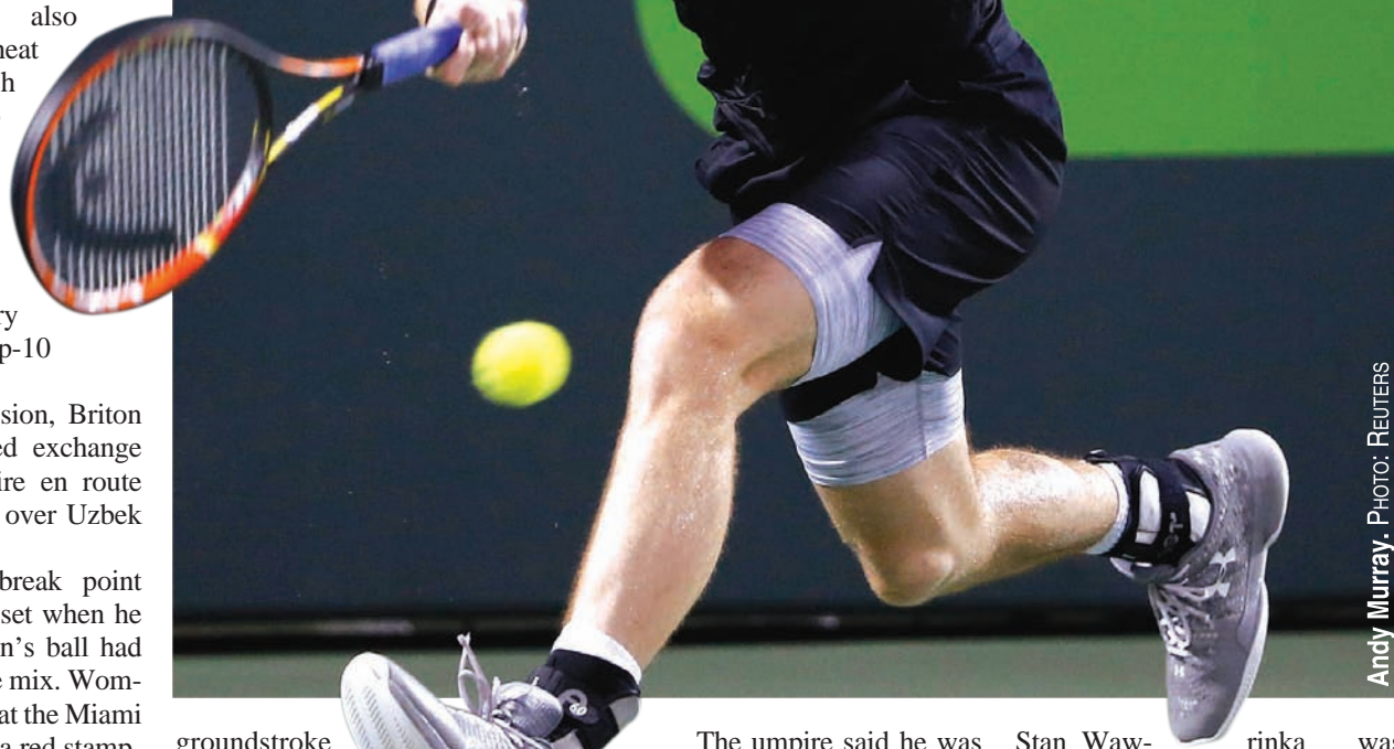
Andy Murray.

Though the rogue ball was removed from play, Murray was clearly flustered and netted a