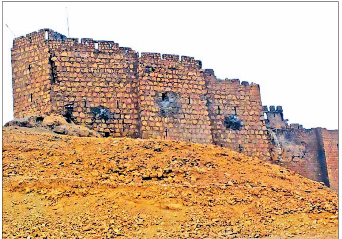
A general view shows the old citadel of Palmyra in Homs Governorate overlooking the city's ancient ruins, after forces loyal to Syria's President Bashar al-Assad recaptured it on Friday, in this handout picture provided by SANA on 26 March 2016.

The loss of Palmyra comes three months after Islamic State fighters were driven out of the city of Ramadi in neighbouring Iraq, the first major victory for Iraq's army since it collapsed in the face