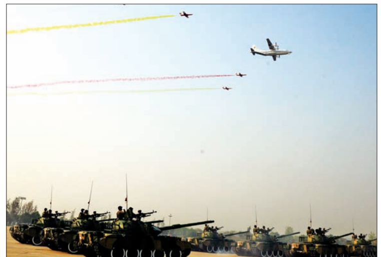
Armoured vehicles rolling into the parade ground where 71 st Anniversary Armed Forces Day is being held while planes of the Tatmadaw are flying over the parade.