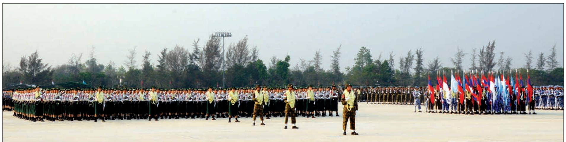
Columns participate in the parade of 71 st Anniversary Armed Forces Day in Nay Pyi Taw.