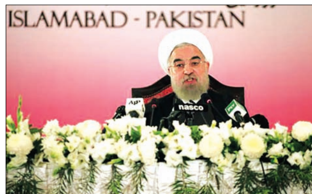
Iran's President Hassan Rouhani speaks during a news conference in Islamabad, Pakistan, on 26 March 2016.

ISLAMABAD — Iranian President Hassan Rouhani said on Saturday that Iran had completed work on its side of a much-delayed pipeline pumping natural gas to Pakistan and would be in a position to provide gas to its energy-starved neighbour in a few months.