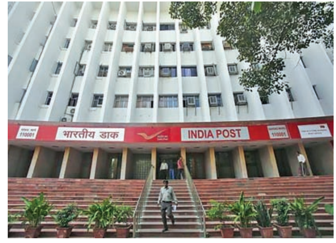
A man walks down the staircase of an Indian post office in New Delhi, India, on 9 October, 2015.

Indian banks said they could not cut their retail deposit and lending rates substantially when the small savings schemes