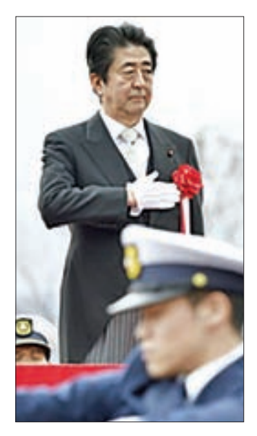
Prime Minister Shinzo Abe attends a Japan Coast Guard School graduation ceremony in the western Japan city of Maizuru on 19 March 2016.

MAIZURU (Japan) — Prime Minister Shinzo Abe mentioned the Japanese-controlled, China-claimed Senkaku Islands as he congratulated students yesterday at a Japan Coast Guard School graduation ceremony in Kyoto Prefecture, western Japan.