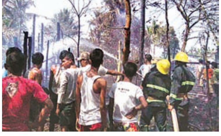
Firefighters and locals seen putting out the fire.

The fire was put out by firemen with three fire engines. Police have taken action against the MraukU house owner — Myat Wai