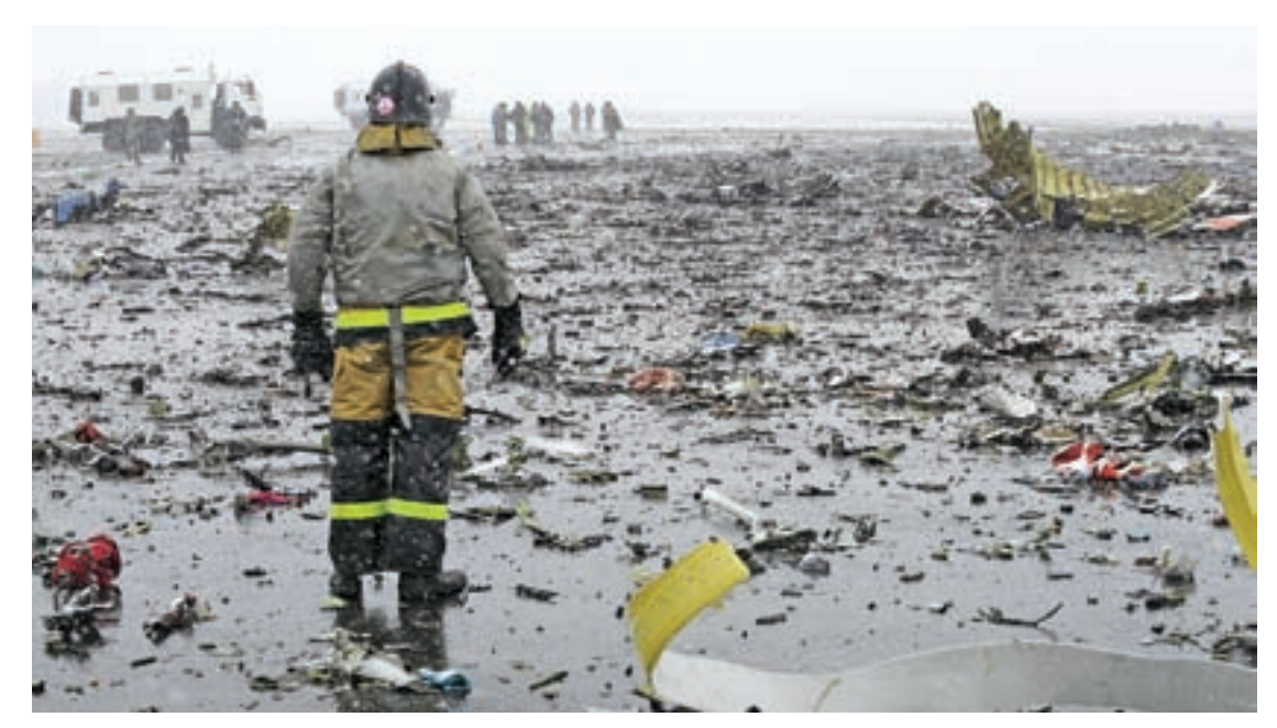
A view shows the crash site of Flight number FZ981, a Boeing 737-800 operated by Dubai-based budget carrier Flydubai, at the airport of Rostov-On-Don, Russia, on 19 March.

MOSCOW — All 62 people aboard a passenger jet flying from Dubai to southern Russia were killed when their plane crashed on its second attempt to land at Rostov-on-Don airport yesterday, Russian officials said.