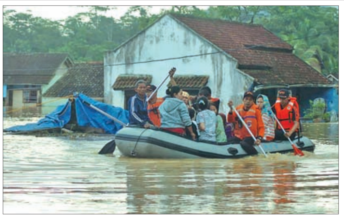
People are evacuated by boat at Tanjungsari village in Tasikmalaya, West Java, Indonesia, on 17 March 2016. Flood inundated four villages here due to the down break of the dam of Cikidang River.

Reports earlier this week said a panel nominated by university to probe its students facing sedition charges has recommended expulsion of five students including Kumar, Khalid and Bhattacharya for violating norms inside the campus.—Xinhua