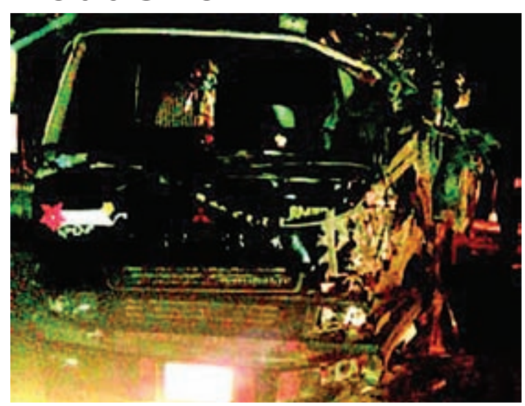
Damaged 12 wheel vehicle seen between mileposts 204/1-2 on Yangon-Mandalay road.

A 12-wheel vehicle collided head on with another 12 wheel vehicle on Yangon-Mandalay road, between mileposts 204/1-2, near Indine village, Thagara town, Yedashe township, Bago region on Friday.