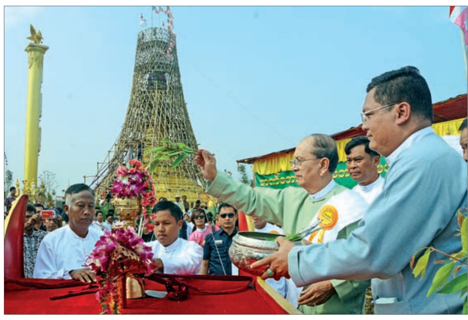
President U Thein Sein sprinkles scented water on the diamond orb before it was fixed atop a pagoda in Putao.

The ceremony was followed by a luncheon offered by the president to the members of the Sangha present at the event.