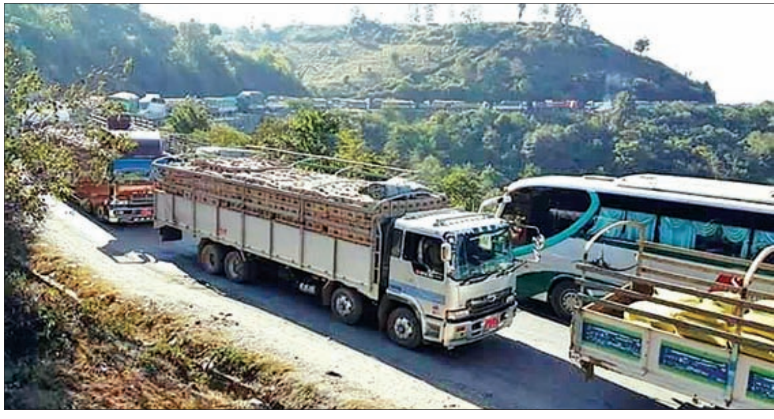
Trucks loaded with goods are seen en-route to China.

Paddy produced in Eastern Shan State is transported to China via Kengtung, up through Mong La on the Myanmar side of the boarder. If the 300 Chinese yuan in duty, which has to be paid for every ton of rice exported to China, could be reduced, or if expenses could be alleviated by exporting rice to