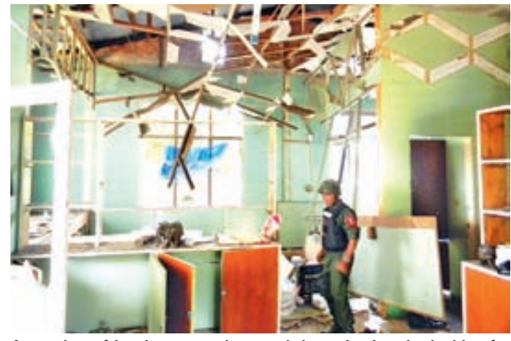
A member of local army engineer unit investigating the inside of a house where explosion occured.

AN Explosion occurred in a house owned by one Daw Khin Myo Tint in Sithar village on Mandalay- Pyin Oo Lwin road, Pyin Oo Lwin township on Friday.