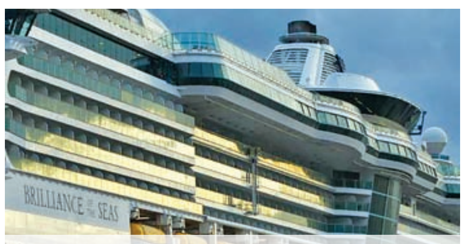
File photo of the Royal Caribbean cruise liner "Brilliance of the Seas" seen at sunset in Valletta's Grand Harbour on 14 December 2010.

COZUMEL, (Mexico) — A cruise ship off the Florida coast on Friday rescued 18 Cuban migrants who said nine fellow travellers died during their 22-day-long journey, the US Coast Guard said.