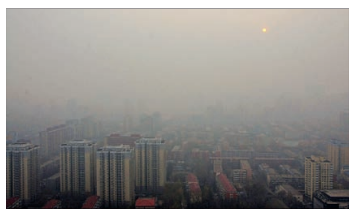
Buildings of a residential compound are seen in the haze during a polluted day in Beijing, China, on 17 March.

was paying "great attention" to this case and had ordered an investigation and for "serious pun-