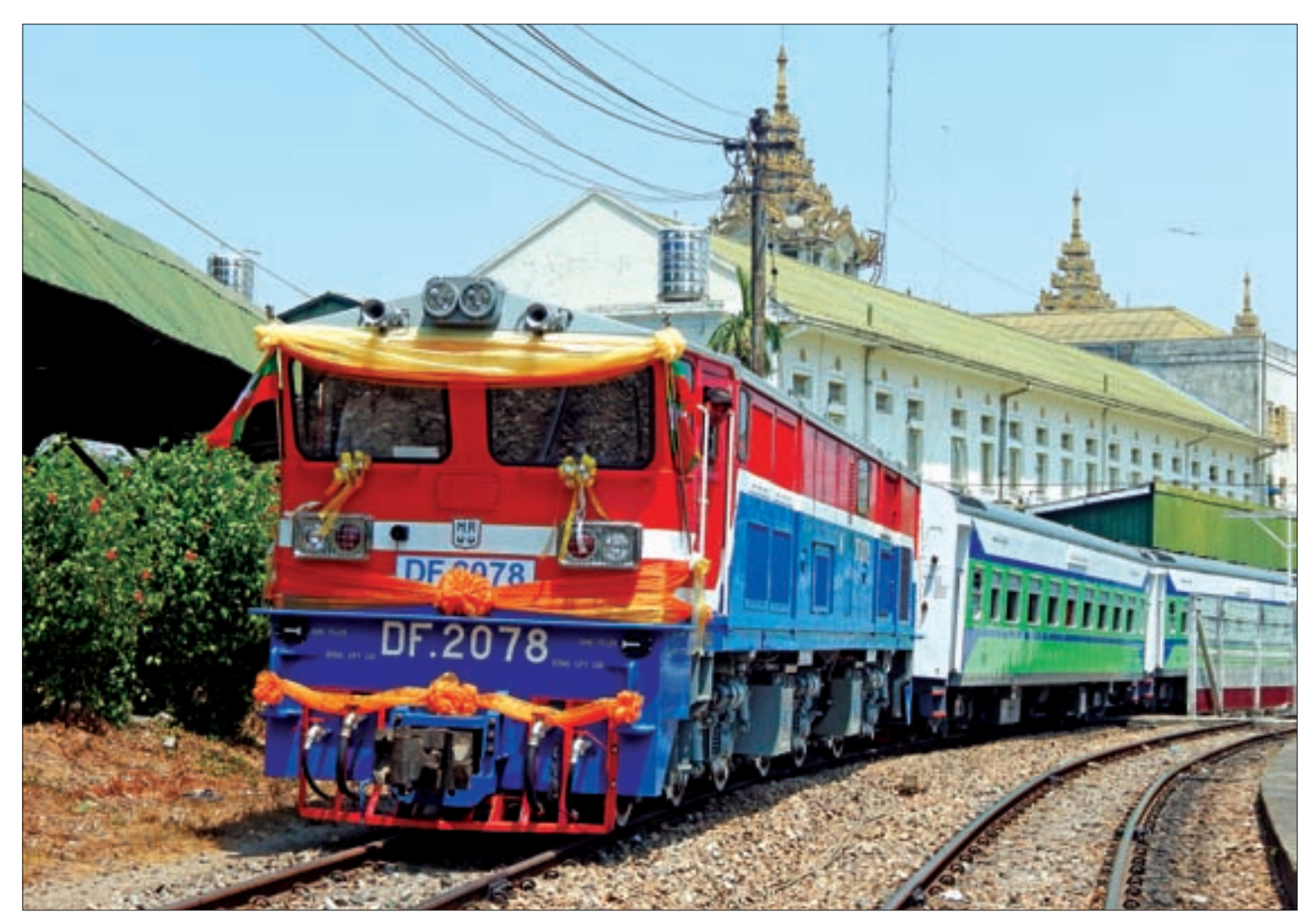
The 71-Up train equipped with modern facilities is ready to run on Yangon-Pyay Route. PHOTO: SOE WIN (MLA)PEOPLE

Myanma Railways building a factory in Nay Pyi Taw to build new coaches and to assemble locomotives. —Soe Win (MLA)