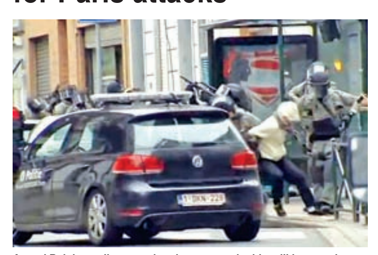
Armed Belgian police apprehend a suspect, in this still image taken from video, in Molenbeek, near Brussels, Belgium, on 18 March.

BRUSSELS — Europe's most wanted man was captured after a shootout in Brussels in a major coup for authorities investigating November's Islamic State attacks on Paris.