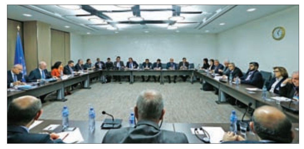
The delegation of the High Negotiations Committee (HNC) and UN mediator Staffan de Mistura are pictured at the start of a meeting during the Syria peace talks at the United Nations in Geneva, Switzerland, on 17 March.

Next week he aims to build "a minimum common platform" to better understand how to approach a post-war transition, which is the core issue to be tackled at the next round of talks in April, he said. "We are