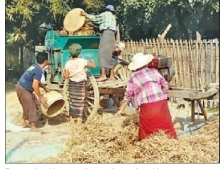
Farmers threshing groundnuts with use of machine.

Local farmers hire the threshing machine because they want to cultivate the summer crops in time.— Pe Htun Zaw