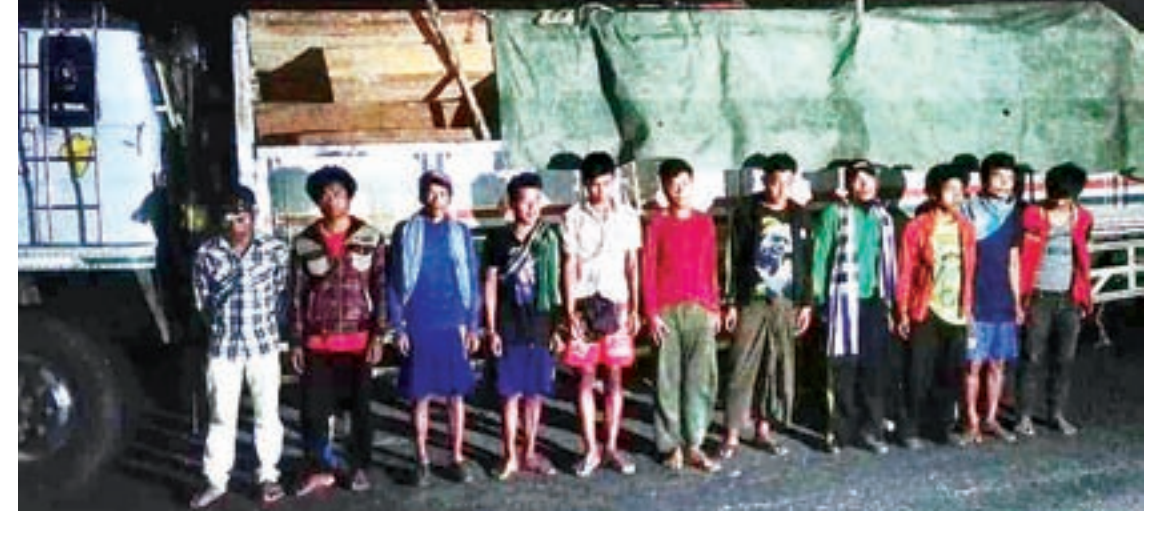
Culprits seen together with illegal sawn timber.

LOCAL authorities seized illegal sawn timber from a six-wheel vehicle near Shwe Pyi Thar Ward, Kawthoung, on Thursday.