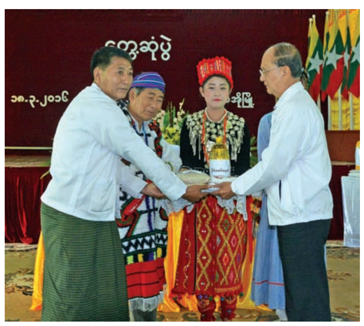
President U Thein Sein presents ration to organizations in Putao.

Located on the Namhtwam creek seven miles southwest of Putao, the Namhtwam hydropower project will have turbines with an installation capacity of 3.2 megawatts and is expected to be completed in March 2017.-Myanmar News Agency