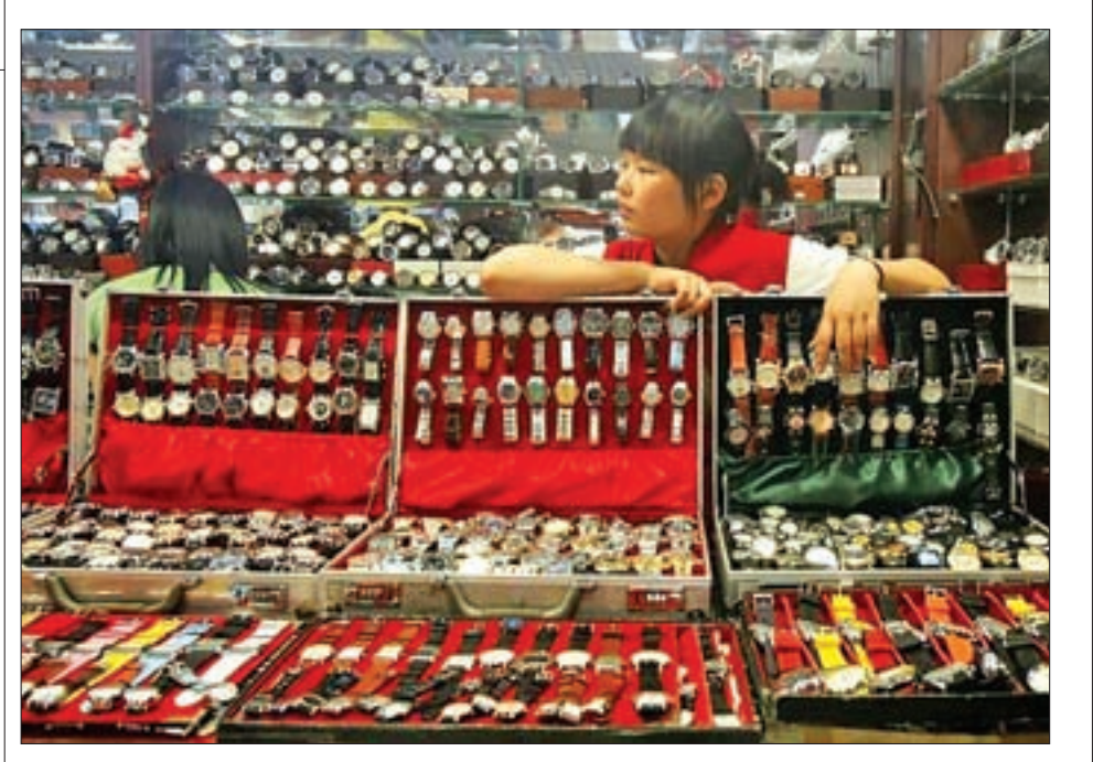
A shopkeeper, selling fake foreign brand watches, waits for customers in Beijing in 2008.

On Tuesday, China's annual consumer rights day TV show took aim at faked online sales, online food delivery apps and dodgy false teeth.—Reuters