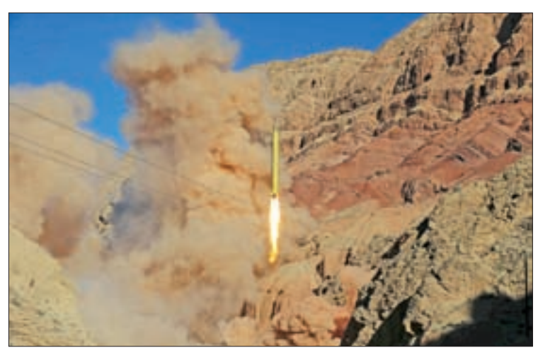
A ballistic missile is launched and tested in an undisclosed location, Iran, on 9 March 2016.

Britain said the missile launches show Iran's "blatant disregard" for the resolution, while France said it was "a case of non-compli-