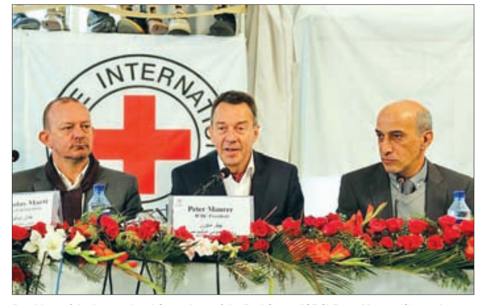
President of the International Committee of the Red Cross (ICRC) Peter Maurer (C) speaks during a Press conference in Kabul, capital of Afghanistan, on 18 March.

'We have increased our budget for Afghanistan for 2016, recognising the scale of the problem. We will explore the possibilities of further expanding our activities, including the evacuation of wounded people," he said.