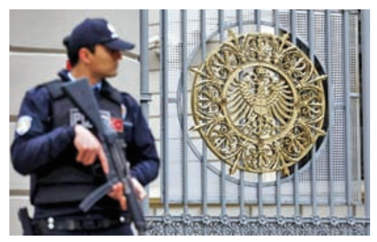
A police officer stands guard in front of the German Consulate, which is closed on indications of a possible imminent attack, in Istanbul, Turkey, on 17 March.

BERLIN — Germany will keep its diplomatic missions and German schools in Turkey closed until the weekend due to a highly credible security threat, a Foreign Ministry spokeswoman said yesterday.