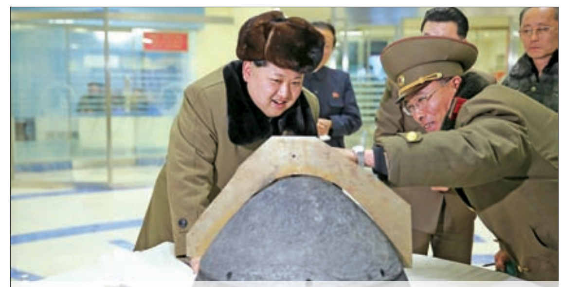
North Korean leader Kim Jong Un looks at a rocket warhead tip after a simulated test of atmospheric reentry of a ballistic missile, at an unidentified location in this undated photo released by North Korea's Korean Central News Agency (KCNA) in Pyongyang on 15 March.

Printed and published at the Global New Light of Myanmar Printing Factory at No.150, Nga Htat Kyee Pagoda Road, Bahan Township, Yangon, by the Global New Light of Myanmar Daily under Printing Permit No. 00510 and Publishing Permit No. 00629.