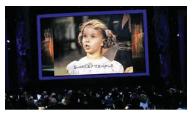
An image of actress Shirley Temple is shown during the In Memoriam segment at the 21st annual Screen Actors Guild Awards in Los Angeles. California, on 25 January 2015.

The ring will be auctioned on 19 April as part of Sotheby's Magnificent Jewels sale, and is es-