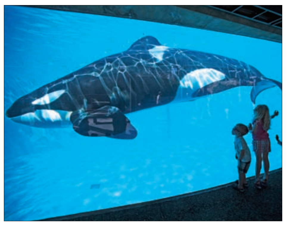
Young children get a close-up view of an Orca killer whale during a visit to the animal theme park SeaWorld in San Diego, California, in 2014.

SeaWorld, whose shares rose 9.4 per cent on Thursday, also said it will scrap plans for a $100 million project called "Blue World" to enlarge its orca