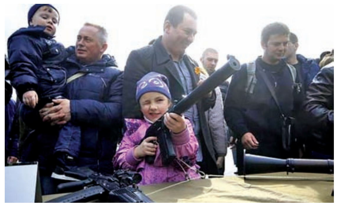
People inspect weapons during celebrations of thr Defender of the Fatherland Day in Sevastopol, Crimea, on 23 February.

The 28-nation EU imposed its Crimea sanctions in July 2014 and then tightened them in December 2014, banning EU citizens from buying or financing companies in Crimea, whose annexation has prompted the worst East-West stand-off since the Cold War.— Reuters