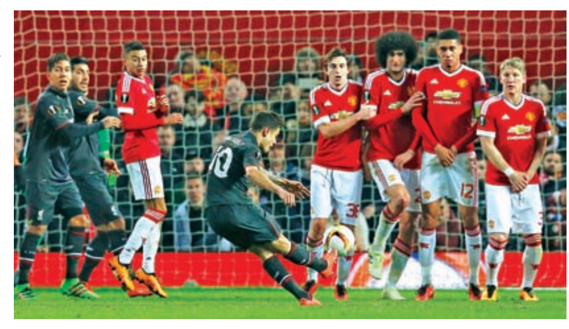
Liverpool's Philippe Coutinho shoots from a free kick during UEFA Europa League Round of 16 Second Leg at Old Trafford, Manchester, England, 17 on March.

The quarter-final lineup was completed by holders Sevilla, Athletic Bilbao, Shakhtar Donetsk, Braga, Sparta Prague and Villarreal with the draw taking place on Friday.