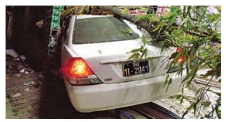
Vehicle crashes into a shop in Tachilek . Photo 200

A VEHICLE crashed into a shop selling medicines & bicycles when the driver lost control on Bogkyoke Aung San road, Tachilek township, Shan State