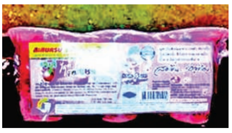
Expired coconut Jelly seized in Kawthoung.

LOCAL Authorities seized land. Although all of the Jellies had expired, the wholesale shop had already delivered some of the stocks to other regions. We are going to collect them, said a member of the police. —Kyaw