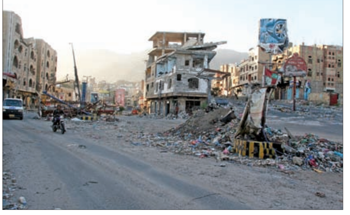
A view of buildings destroyed during recent fighting in Yemen's southwestern city of Taiz on 14 March.

However, the fighting then intensified as the coalition added small numbers of ground troops to