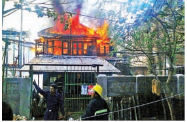
The house seen on fire.

A FIRE destroyed three houses on Ze Zawah road, ward 5, Shwe Pyi Tha township on Thursday.