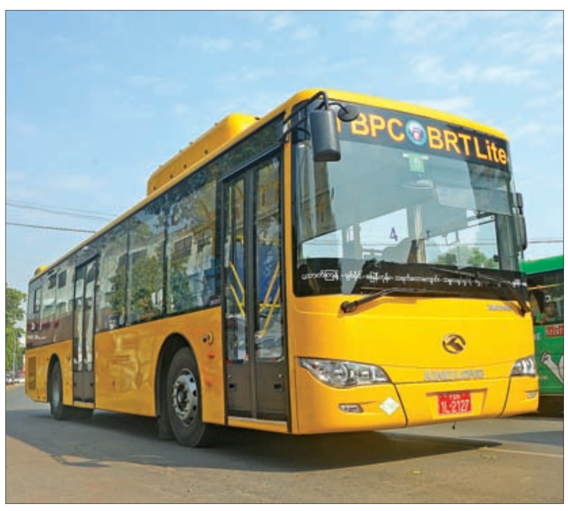
A modern bus from BRT bus line.