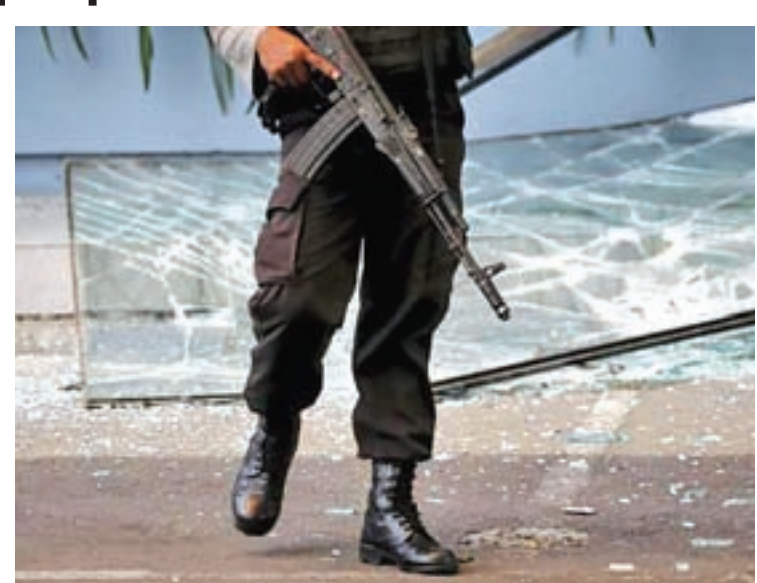
An Indonesian policeman holds a weapon while walking near a broken glass window from a Starbucks outlet in Jakarta, on 14 January.

Malaysia last April reintroduced a law under which individuals can be detained without trial for up to two years with two-year extensions thereafter. Australia has in recent years passed measures banning its citizens from returning from conflict zones in Syria and the Middle East, while making it easier to monitor domestic com-