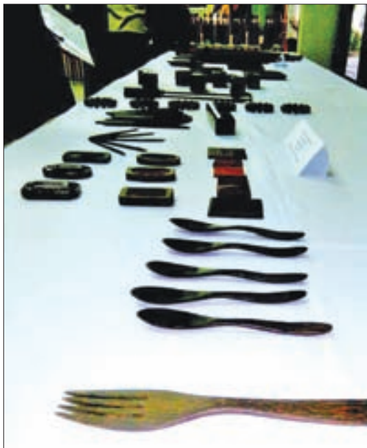
Spoons, forks and soap containers made by palm wood.

To raise their quality of life, local carpenters need the help of investors or government subsidies, U Aye Lwin added.— Kyaw Htay (Naung Oo)