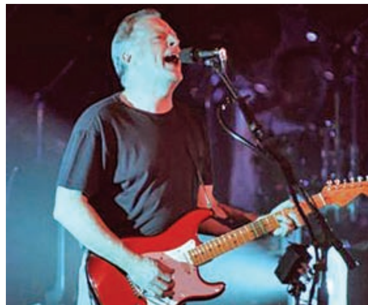
Lead singer of Pink Floyd David Gilmour plays at Earls court in 1994 in London.

"We are still treated like heretics if we step out of line and think outside the box," Madonna wrote on social media. "Too bad people don't know the art or of (sic) acting and playing a character... I could never do any of my shows high or drunk." The 57-year-old Material Girl is set to return to the stage in Brisbane yesterday night before finishing her tour in Sydney this coming weekend.—Xinhua