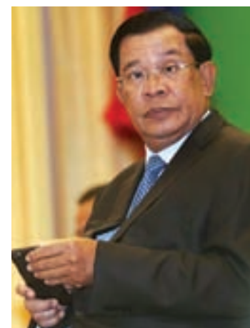
Cambodia's Prime Minister Hun Sen.

CPP officially won a disputed election in 2013 but its house majority was greatly reduced, signalling widespread disenchantment with Hun Sen's iron-fisted rule, even with eco-