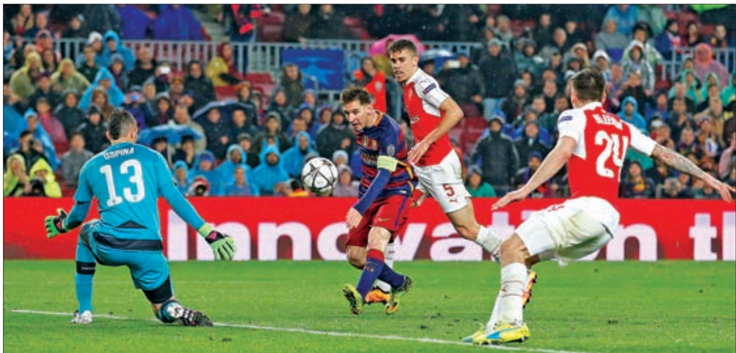
Lionel Messi scores the third goal for Barcelona against Arsenal during their UEFA Champions League Round of 16 Second Leg at Nou Camp, Barcelona, Spain on 16 March 2016.

"We know we need to attack and defend at the same level if we want to win," Barcelona coach Luis Enrique told reporters. The La Liga leaders remained on course for a second successive treble and their coach is not concerned about who they face in the last eight of Europe's most pres-