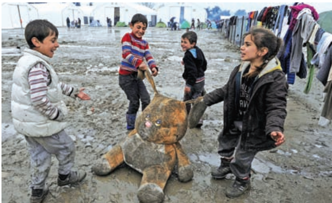
Refugee children play with a stuffed toy at a muddy makeshift camp at the Greek-Macedonian border, near the village of Idomeni, Greece on 15 March.

The draft, which was seen by Reuters, says the plan is "to break the business model of the smugglers and to offer migrants an alternative to putting their lives at risk". It stresses the plan is "a temporary and extraordinary measure which is necessary to end the human suffering and restore public order". —Reuters