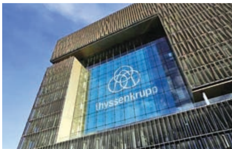
ThyssenKrupp AG's new company logo adorns its headquarters in Essen, Germany.

Australia announced in a long-awaited White Paper released last month that it would increase defence spending by nearly A$30 billion over the next 10 years in order to protect its strategic and trade interests in the Asia-Pacific region. —Reuters