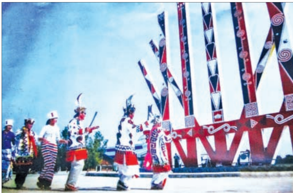
Yawan Cultural Festival seen.

THE Yawan Cultural Festival (Dabuaekhong-2016) is slated to be held on a grand scale from 19 April to 23 April.