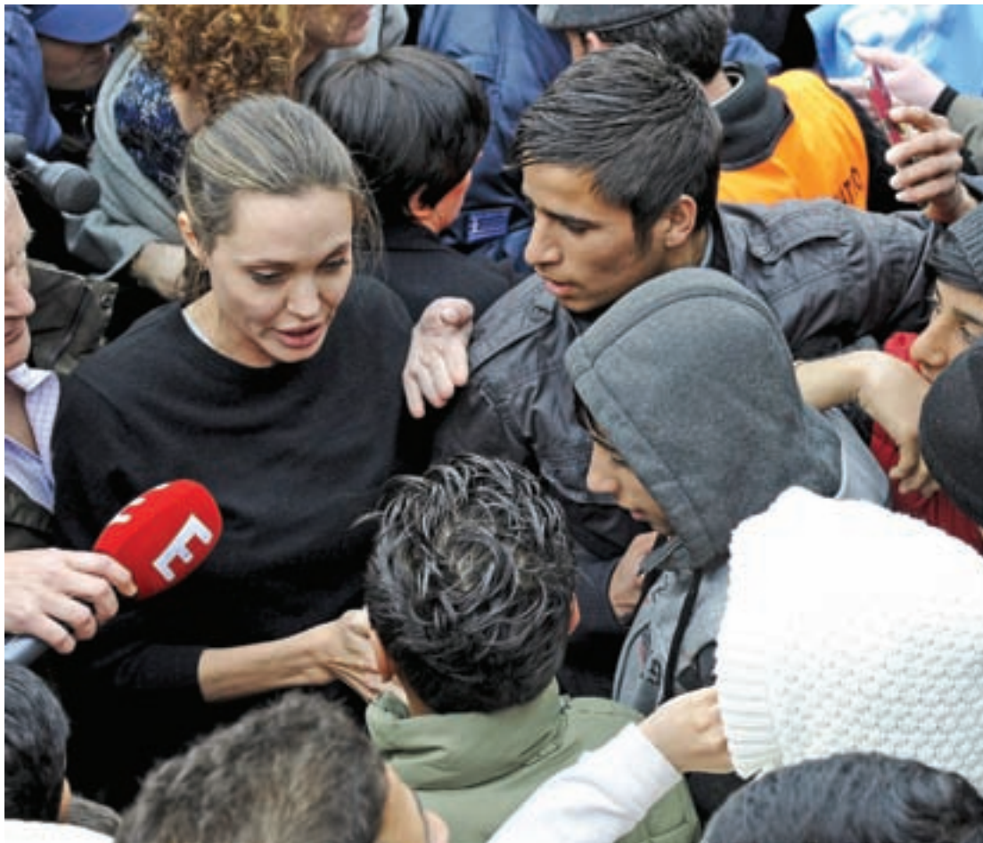
United Nations High Commissioner for Refugees (UNHCR) Special Envoy Angelina Jolie visits a shelter for refugees and migrants at the port of Piraeus, near Athens, Greece, on 16 March.