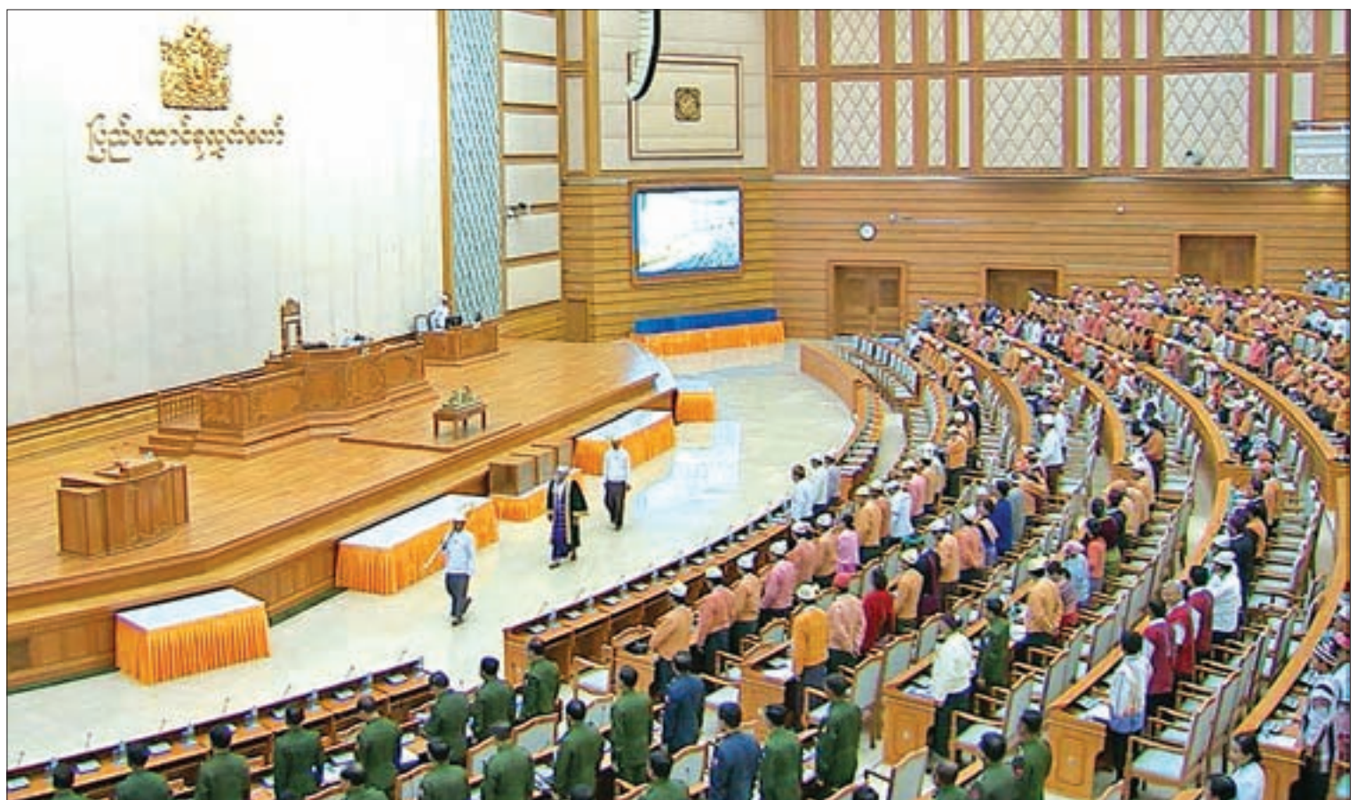
MPs stand up as the Speaker of Pyidaungsu Hluttaw leaves the parliament after yesterday session.

The ministries proposed by the president-elect are the Ministry of Foreign Affairs; Ministry of Agriculture, Livestock and Irrigation; Ministry of Transport and Communication; Ministry of Culture and Religious Affairs; Ministry of Resources and Environmental Conservation; Ministry of Electric Power and Energy; Ministry of Labour, Immigration and Population; Ministry of Planning and Finance; Ministry of Industry; Ministry of Health; Ministry of Education; Ministry of Construction; Ministry of Social Welfare, Relief and Resettlement; Ministry of Hotels and Tourism; Ministry of Commerce; Ministry of Information; Ministry of Ethnic Affairs;