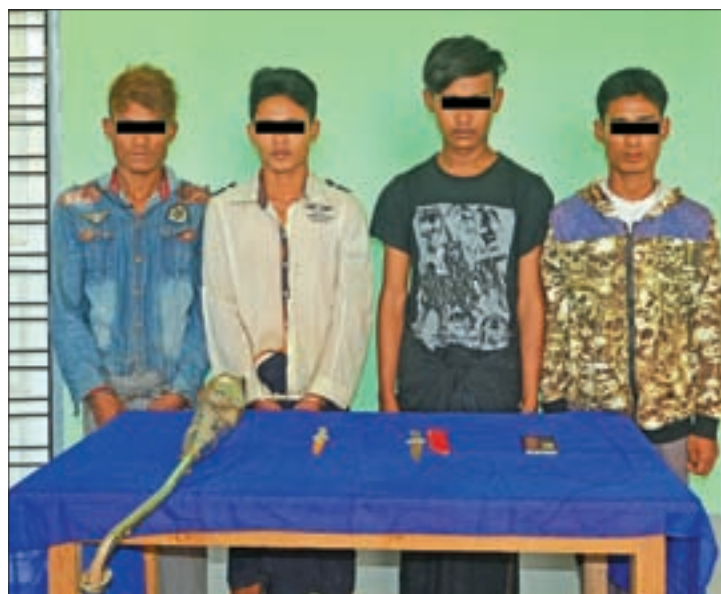
The four murderers are pictured with the weapons used in murder at Zabuthiri Myoma Police Station in Nay Pyi Taw.

THE juvenile court in Zabuthiri Township, Nay Pyi Taw, has convicted a teenager on two felony charges of murder and rape, which he had committed with his three adult friends.