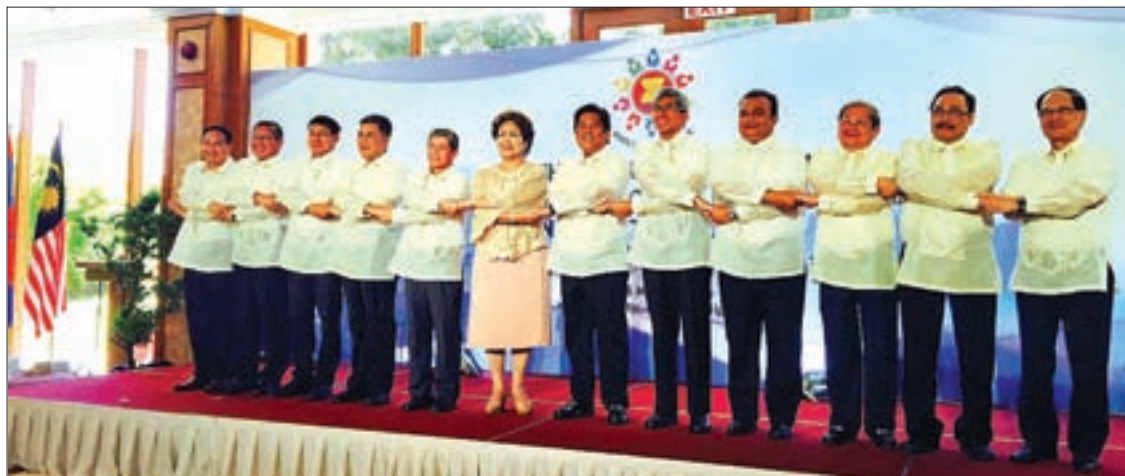
ASEAN ministers responsible for information pose for photo in ASEAN way at their 13 th Conference in the Philippines.

THE 13 th Conference of the ASEAN Ministers Responsible for Information took place in the Philippines from 15 to 17 March in conjunction with the 14th ASEAN Information Senior Officials Meeting and related meetings.