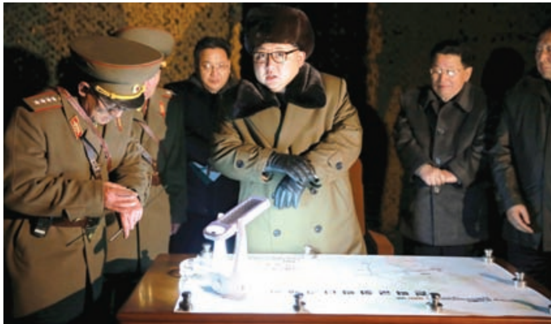
North Korean leader Kim Jong Un talks with officials at the ballistic rocket launch drill of the Strategic Force of the Korean People's Army (KPA) at an unknown location, in this undated photo released by North Korea's Korean Central News Agency (KCNA) in Pyongyang on 11 March.

BEIJING — China opposes any unilateral sanctions on North Korea, the Foreign Ministry said, after the United States imposed sweeping new curbs on the isolated country in retaliation for its nuclear and rocket tests.