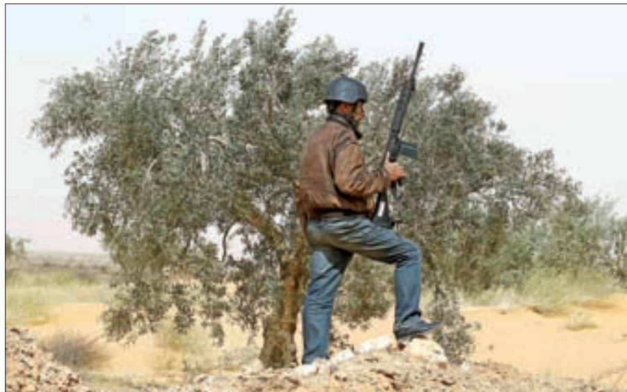
A Tunisian police officer stands guard during an operation to eliminate militants in a village some 50 km (31 miles) from the town of Ben Guerdane, Tunisia, near the Libyan border, on 10 March 2016.

More than 3,000 Tunisians have left to fight for Islamic State and other jihadist groups in Syria and Iraq. Security officials say Tunisians are taking more and more command positions in Islamic State in Libya. "There is a general concern about the impact of the Libyan crisis on Tunisia. Attack after attack, we see the link with Libya, where we see Tunisians in Libya turning against Tu-