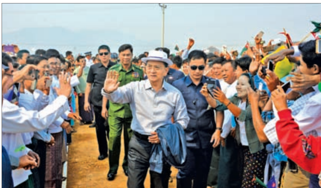
President U Thein Sein waves hands to residents on his tour of Madaya, Mandalay Region.

The Hsedawgyi Dam, built in 1987, has a water storage capacity of 334,280 acre feet, which provides for 93,000 acres of farmland and generates 12.5 megawatts of electricity.— Myanmar News Agency