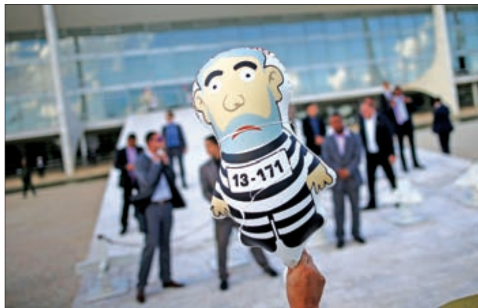
An anti-government demonstrator holds an inflatable doll known as 'Pixuleco' of Brazil's former president Luiz Inacio Lula da Silva, during a protest at the appointment of Lula da Silva as a minister in front of the Planalto Palace in Brasilia, Brazil, on 16 March 2016.

He admitted, however, there was no evidence they actually carried this out. One recording, made public by the court, showed Rousseff offering to send