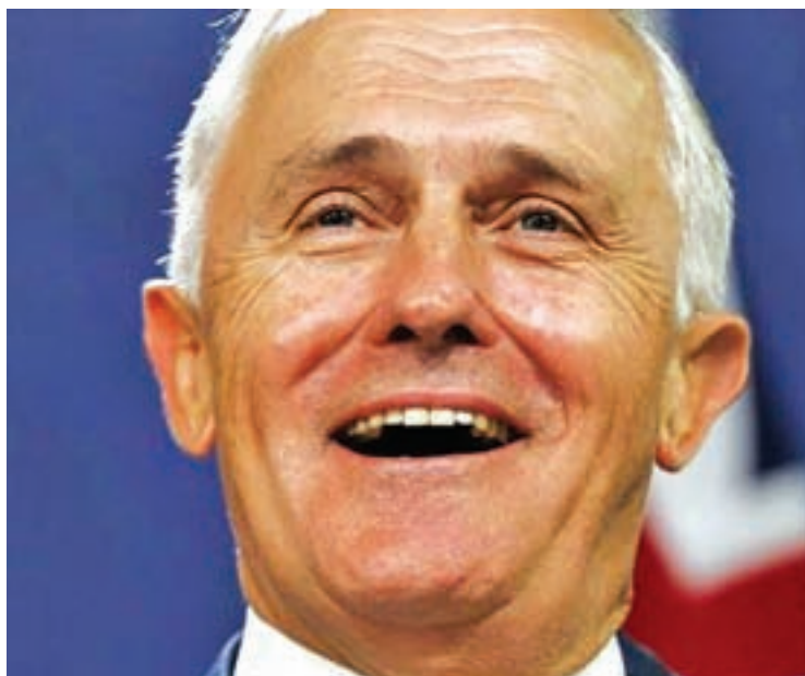
Australian Prime Minister Malcolm Turnbull.

asts Party Senator Ricky Muir was elected in 2013 with less than one per cent of the popular vote as a