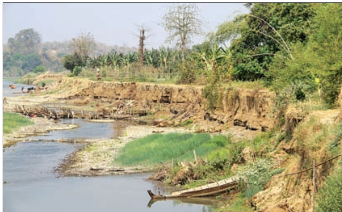
Farmland destroyed by erosion in Pandaung Township.

THE erosion of the Buyo River bank, which runs through the villages of Kwyal Ye, Sharphyu Kwin and Kyan Su in Padaung Township, Bago Region, has claimed over 100 acres of farmland, bringing local dwellings closer to the river's edge, according to villagers.