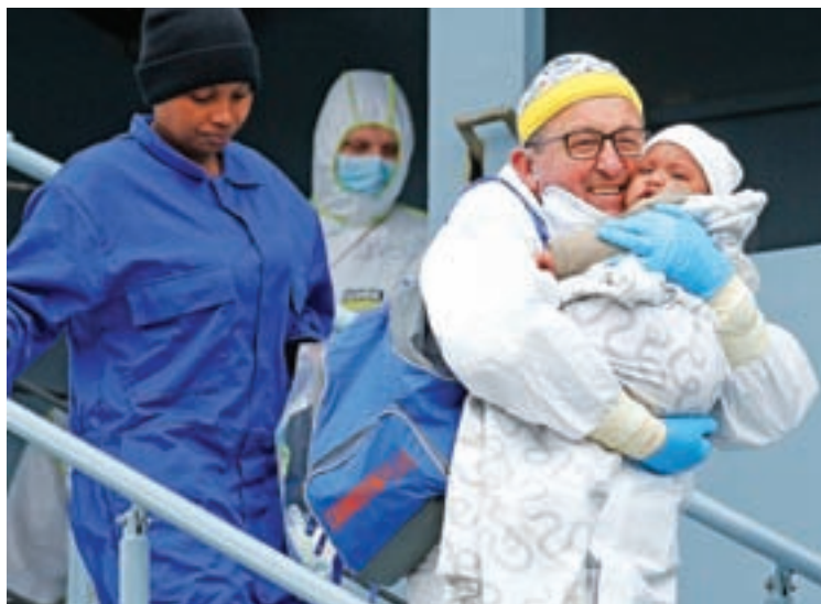
A rescue worker carries a child as they disembark the German naval vessel Frankfurt Am Main in the Sicilian harbour of Pozzallo, Italy, on 16 March.

Wednesday's rescues came after 951 people were plucked from the Strait of Sicily on Tuesday, the coast guard said. —Reuters