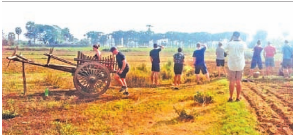
Tourists are observing traditional farming methods.

ALTHOUGH traditional farming techniques are gradually fading in some rural areas as farmers replace them with modern, mechanical techniques, farmers across the Bagan heritage zone are preserving agricultural traditions, much to the pleasure of international tourists.