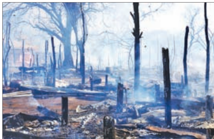
Fire destroyed 182 houses in Nyaung Pin Tha village.

A fire destroyed 182 houses in Nyaung Pin Tha village, Magway town on 16 March. The accident happened around 1pm when Daw Win Mar left the cowshed, not putting out the fire. The fire was