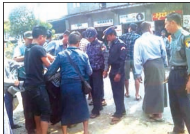
Police arrests the suspect for robbery in Kaley.

POLICE arrested a suspect in connection with a robbery at a gold shop yesterday in Kelay Township, Sagaing Region within one hour after the robbery, said local police.