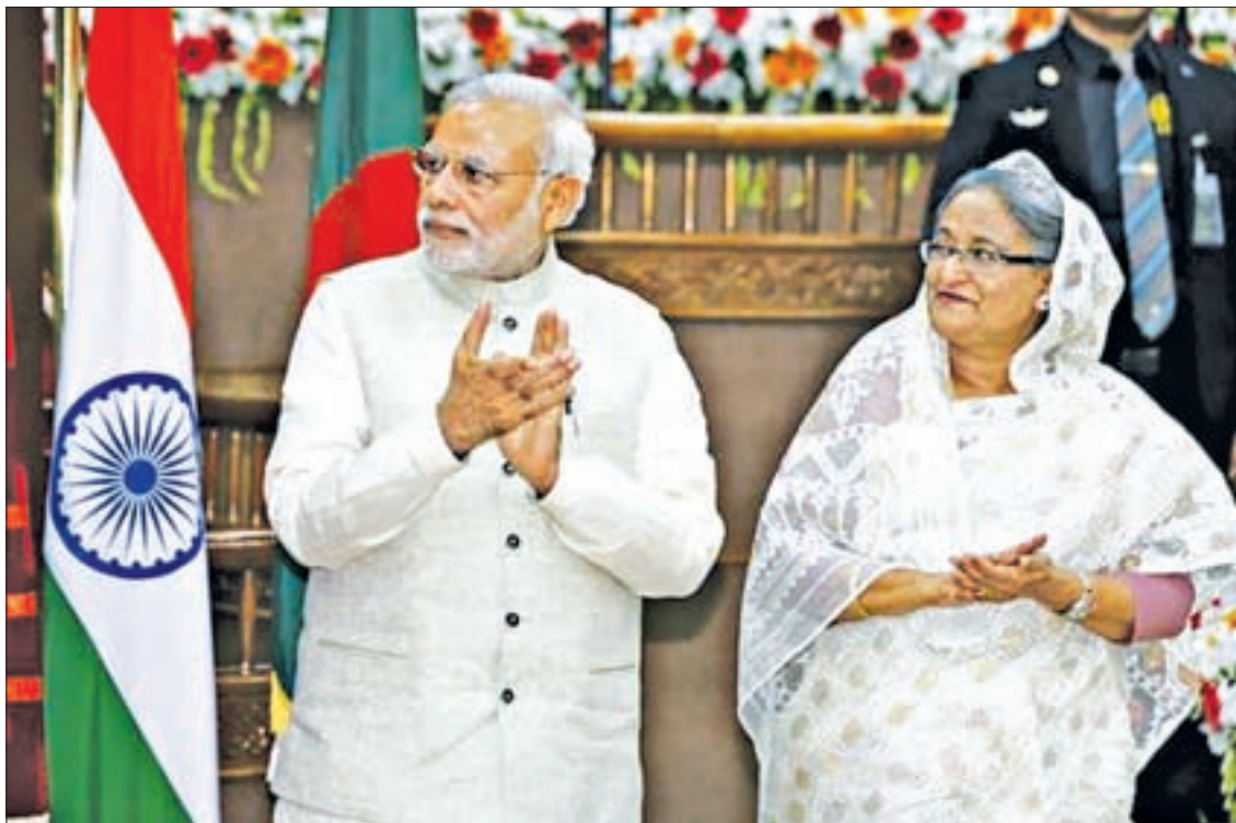
India's Prime Minister Narendra Modi and his Bangladeshi counterpart Sheikh Hasina Wajed clap during signing ceremony of agreements between India and Bangladesh in Dhaka, on 6 June 2015.

During Modi's visit, the two countries signed a land boundary agreement, more than four decades after the neighbours first tried to resolve the complex territorial disputes. Exim Bank is also in the process of extending $1.60 billion in buyer's credit to an India-Bangladesh joint venture to build a 1,320 megawatt thermal power plant project in Bangladesh.— Reuters