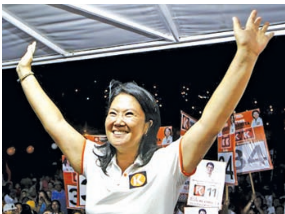
Peruvian presidential candidate Keiko Fujimori of the Fuerza Popular (Popular Force) party greets the media during a campaign rally in Villa Maria del Triunfo, on the outskirts of Lima, on 29 February.

Fujimori's opponents accuse her and her running mate of illegally dishing out gifts and prizes to voters while campaigning — accusations she called "absurd."