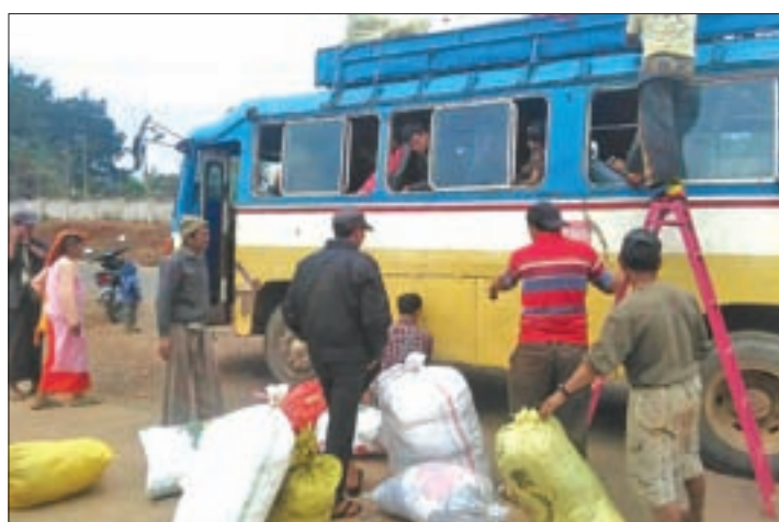
Photo shows internally displaced persons leaving a camp in Kyaukme.