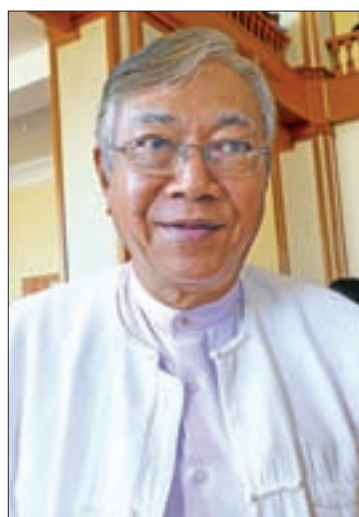
U Htin Kyaw.

Given his closeness with the NLD leader and that party's majority in the parliament, U Htin Kyaw is favoured to ascend to the