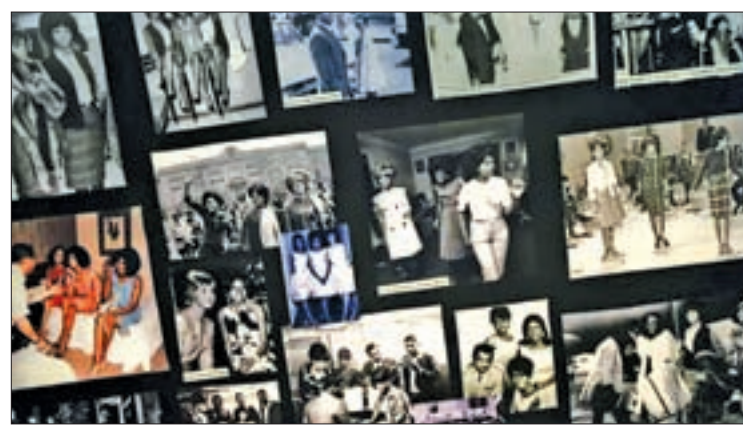
A board with period photos is seen backstage before a preview of Motown: The Musical, in New York in 2013.

From rhythm and blues, soul music as well as pop later on, the Motown Sound fea-