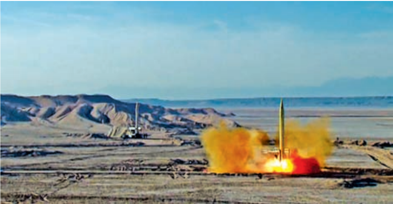
A ballistic missile is launched and tested in an undisclosed location, Iran, in this handout photo released by the official website of Islamic Revolutionary Guard Corps (IRGC) on 8 March 2016.