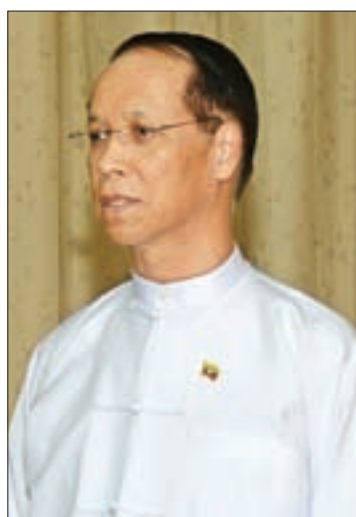
Dr Sai Mauk Kham.