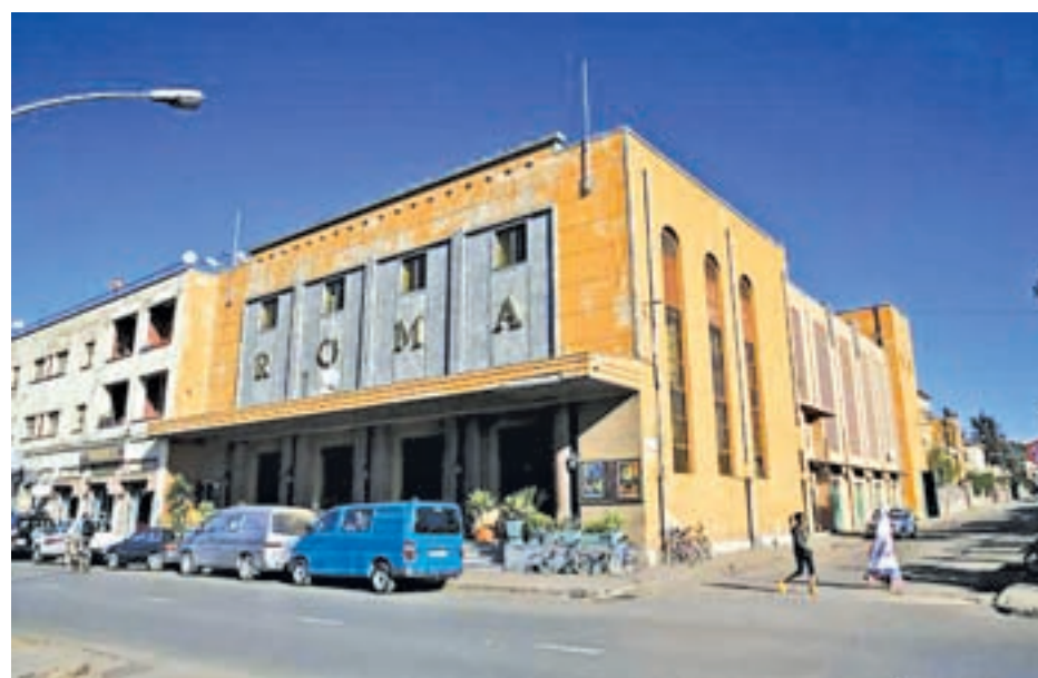
A general view shows the Roma Cinema on Samatat Avenue in Eritrea's capital Asmara, on 20 February.