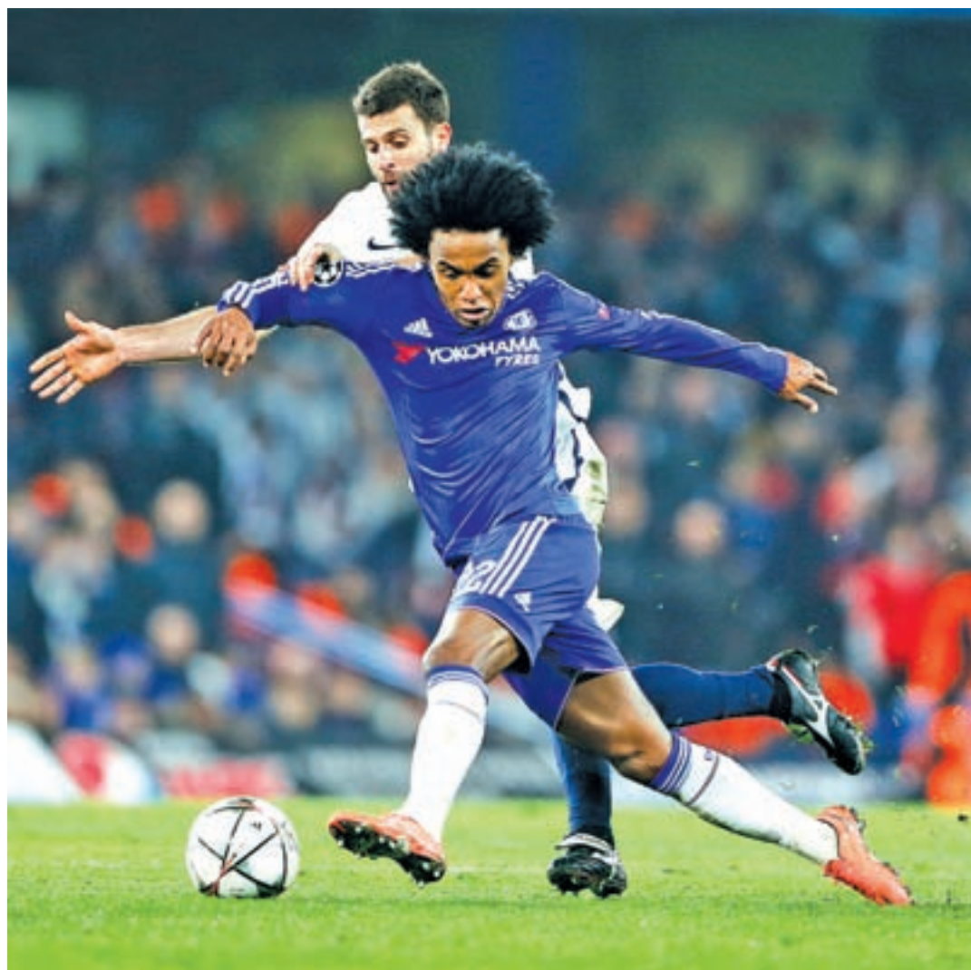
PSG's Thiago Motta in action with Chelsea's Willian during UEFA Champions League Round of 16 Second Leg at Stamford Bridge, London, England, on 9 March.

"It was a collective victory. Everyone knows how hard it is to play here. We kept calm and we