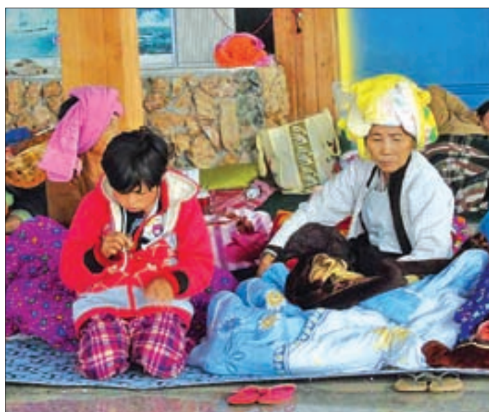
Internally displaced people are seen at a camp in Kyaukme.

According to staff from the Kyaukme IDP camps, the first week of March marked one month since displaced villagers started to arrive after fighting erupted in the surrounding area of Tawt Hsan Village on the morning of February 7.— Myit-makha News Agency