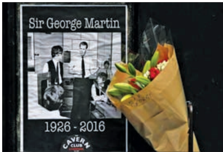
A floral tribute in memory of music producer George Martin is left outside the Cavern Club in Liverpool, Britain, on 9 March.