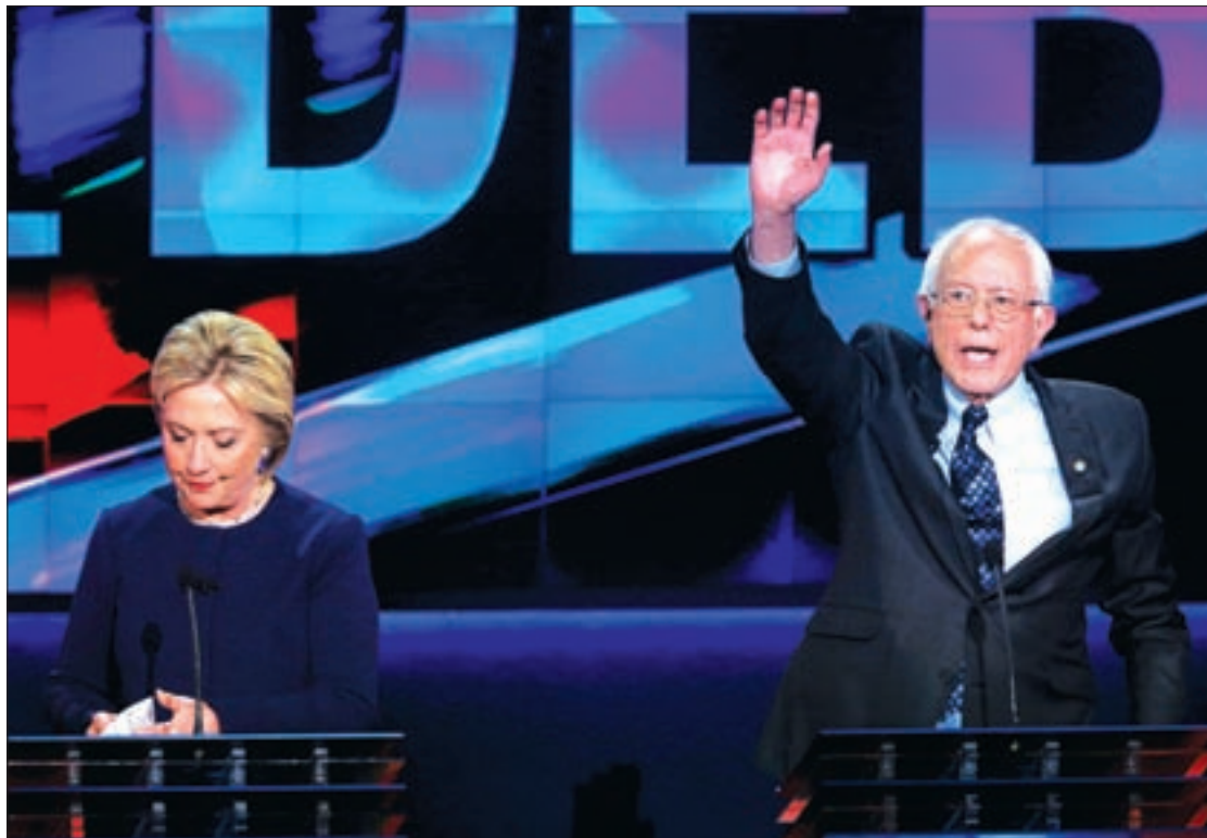
Democratic US presidential candidate Bernie Sanders (R) waves to the crowd as his rival Hillary Clinton gathers her papers at the conclusion of the Democratic US presidential candidates' debate in Flint, Michigan, on 6 March 2016.

MIAMI — Democratic presidential candidates Hillary Clinton and Bernie Sanders sparred over immigration at a debate on Wednesday night, days ahead of a crucial nominating contest in Florida, but directed their strongest fire on Republican front-runner Donald Trump.