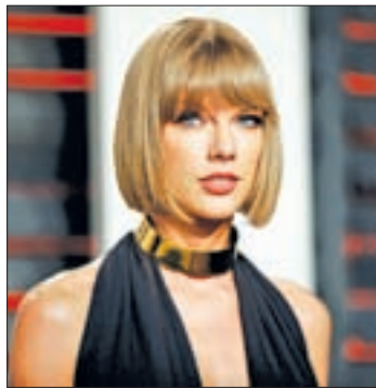
Singer Taylor Swift arrives at the Vanity Fair Oscar Party in Beverly Hills, California on 28 February.