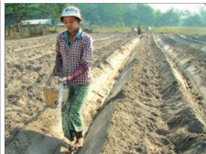
A farmer spreading fertilizers on sugarcane.

Founded in 2012, MAPCO is a private sector company and is seen as a key contributor to the development of agriculture in Myanmar.—GNLM