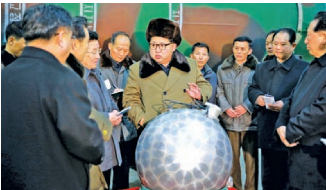
North Korean leader Kim Jong Un meets scientists and technicians in the field of researches into nuclear weapons in this undated photo released by North Korea's Korean Central News Agency (KCNA) in Pyongyang on 9 March 2016.

Mount Kumgang was the first major inter-Korean cooperation project. Thousands of South Koreans visited the resort between 1998 and 2008. Seoul ended the tours in 2008 after a North Korean soldier shot dead a South Korean tourist who wandered into a restricted zone.