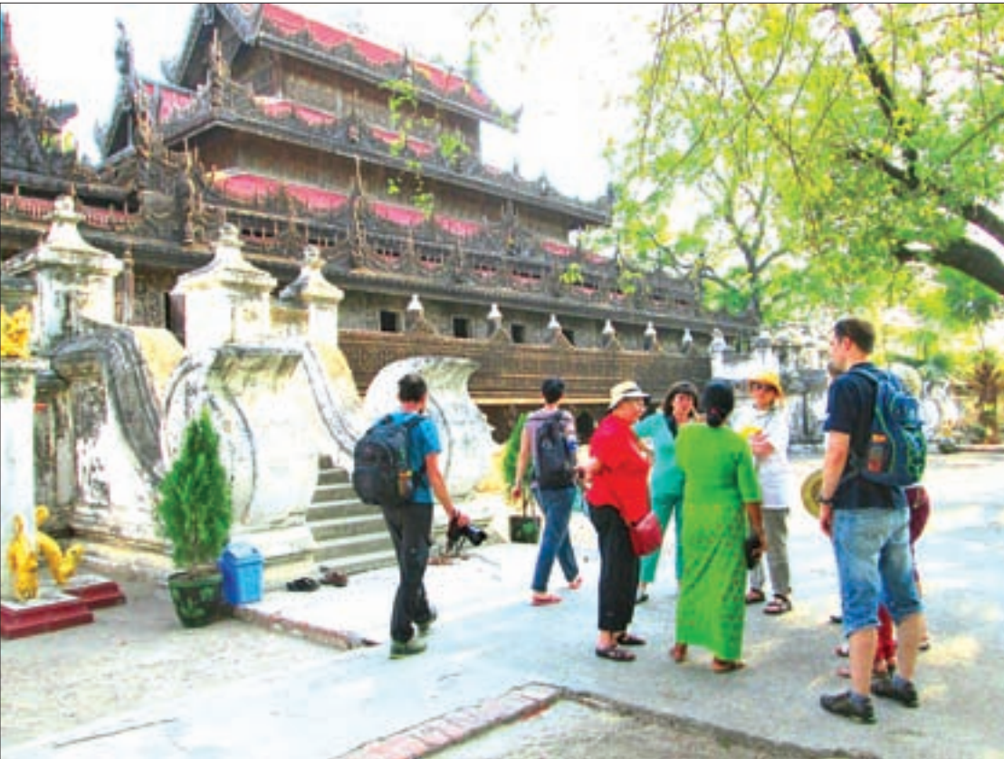
Myanansankyaw Golden Palace.