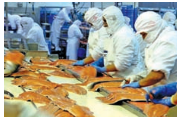
Chilean workers process farmed salmon in a plant in Puerto Ibanez near the town of Aysen, in the Chilean Patagonia region, some 1660 km (1031 miles) south of Santiago, in 2006.

Cutting their losses, producers convert those fish that can be saved into fish-