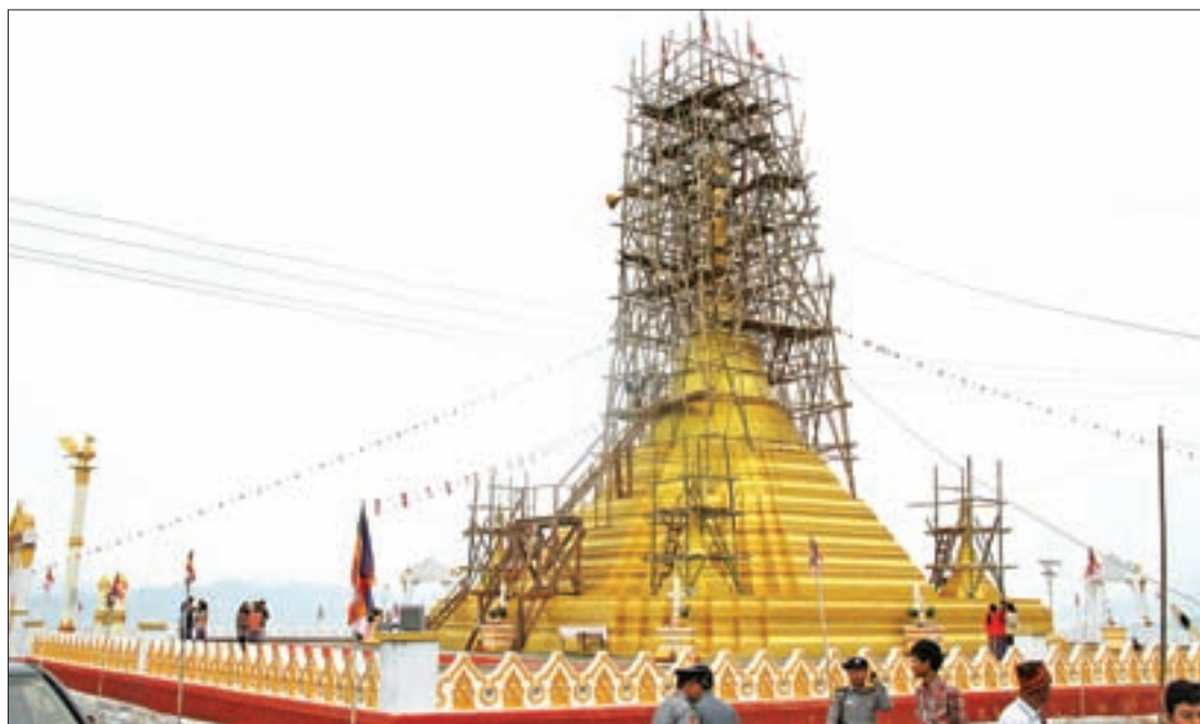
Thantikara Pagoda in Pansaung.