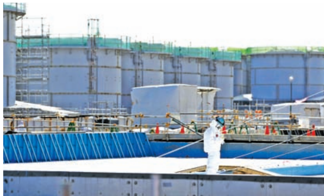
A worker, wearing a protective suit and mask, takes notes in front of storage tanks for radioactive water at Tokyo Electric Power Co's (TEPCO) tsunami-crippled Fukushima Daiichi nuclear power plant in Okuma town, Fukushima prefecture, Japan on 10 February 2016.

Much of the work involves pumping a steady torrent of water into the wrecked and highly radiated reactors to cool them down. Afterward, the radiated water is then pumped out of the plant and stored in tanks that are proliferating around the site. —Reuters