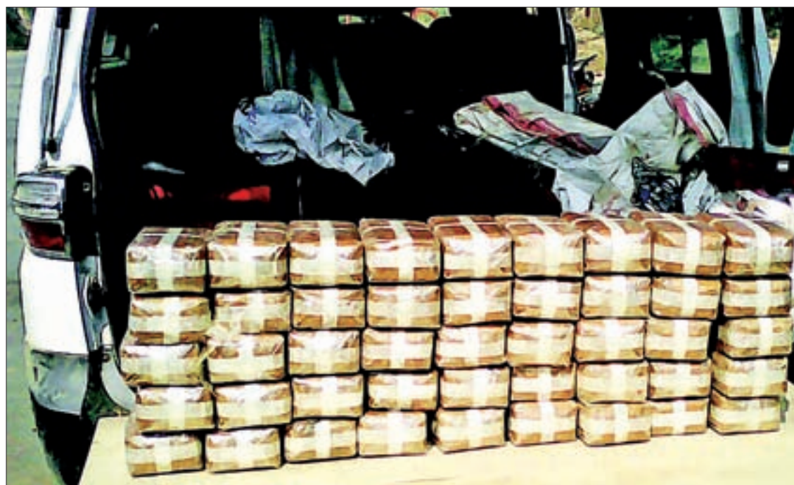
Illegal drugs seized are being seen.

AUTHORITIES seized a illegal drugs worth K1.8 billion (US$1,479,593) in Ma-i, Thandwe District, on Monday, arresting a man for drug smuggling.