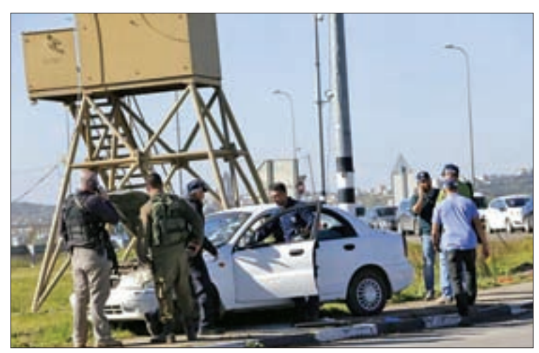
Israeli security forces inspect a car used by a Palestinian woman who, the Israeli military said, rammed it into an Israeli soldier before she was shot dead by the Israeli troops, at a main junction near the Israeli settlement bloc, Gush Etzion in the West Bank, on 4 March.

Since October, Palestinian stabbings, shootings and car rammings have killed 28 Israelis and a US citizen. Israeli security forces have killed at least 173 Palestinians, 115 of whom Israel says were assailants, while most others were shot dead during violent