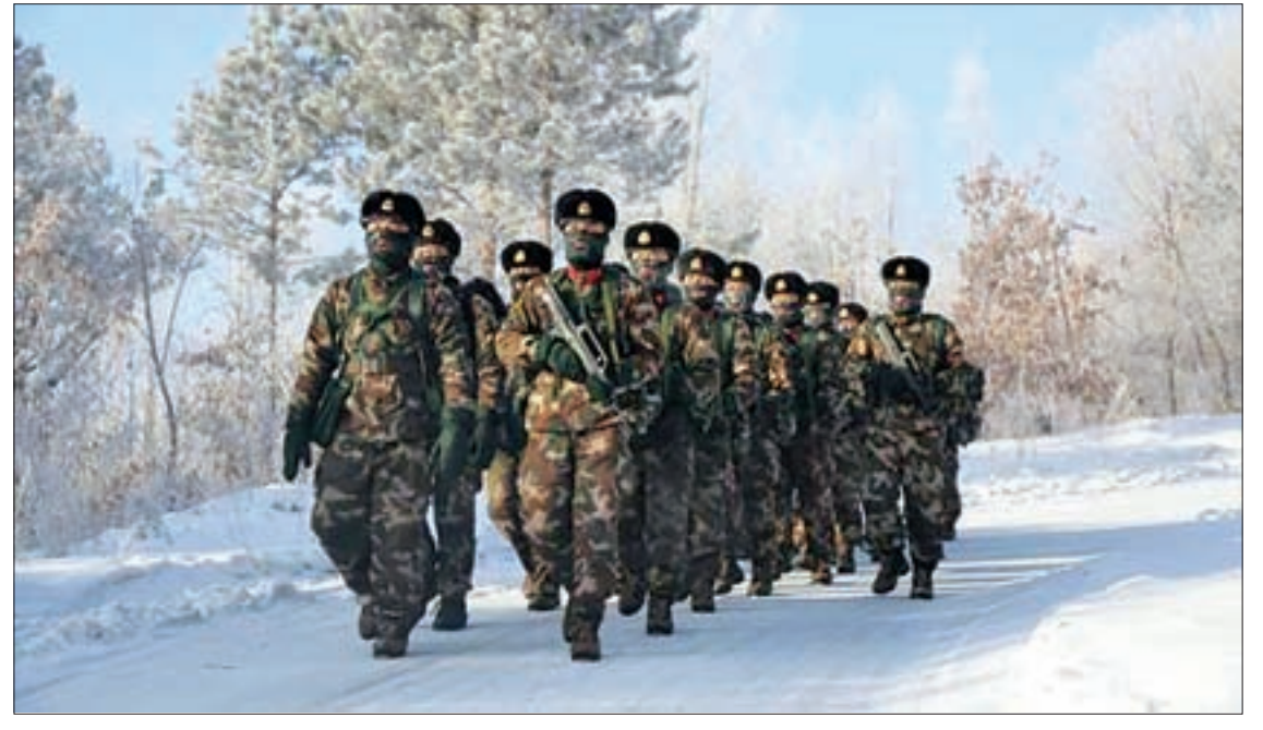
Soldiers of China's People's Liberation Army (PLA) take part in training in temperatures below minus 30 degrees Celsius (minus 22 degrees Fahrenheit) at China's border with Russia in Fuyuan, Heilongjiang Province, on 14 January 2016.

China's leaders have routinely sought to justify military modernisation by linking defence spending to rapid GDP growth. But growth of 6.9 per cent last year was the slowest in 25 years, and a further slowdown is widely expected in 2016.