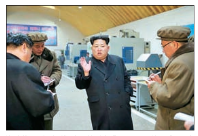
North Korean leader Kim Jong Un visits Taeseung machinery factory in this undated photo released by North Korea's Korean Central News Agency (KCNA) in Pyongyang on 2 March 2016.

Kim Jong Un ordered his country to be ready to use its nuclear weapons at any time and the military to be in "pre-emptive attack" mode in the face of growing threats from its enemies, state media said yesterday.