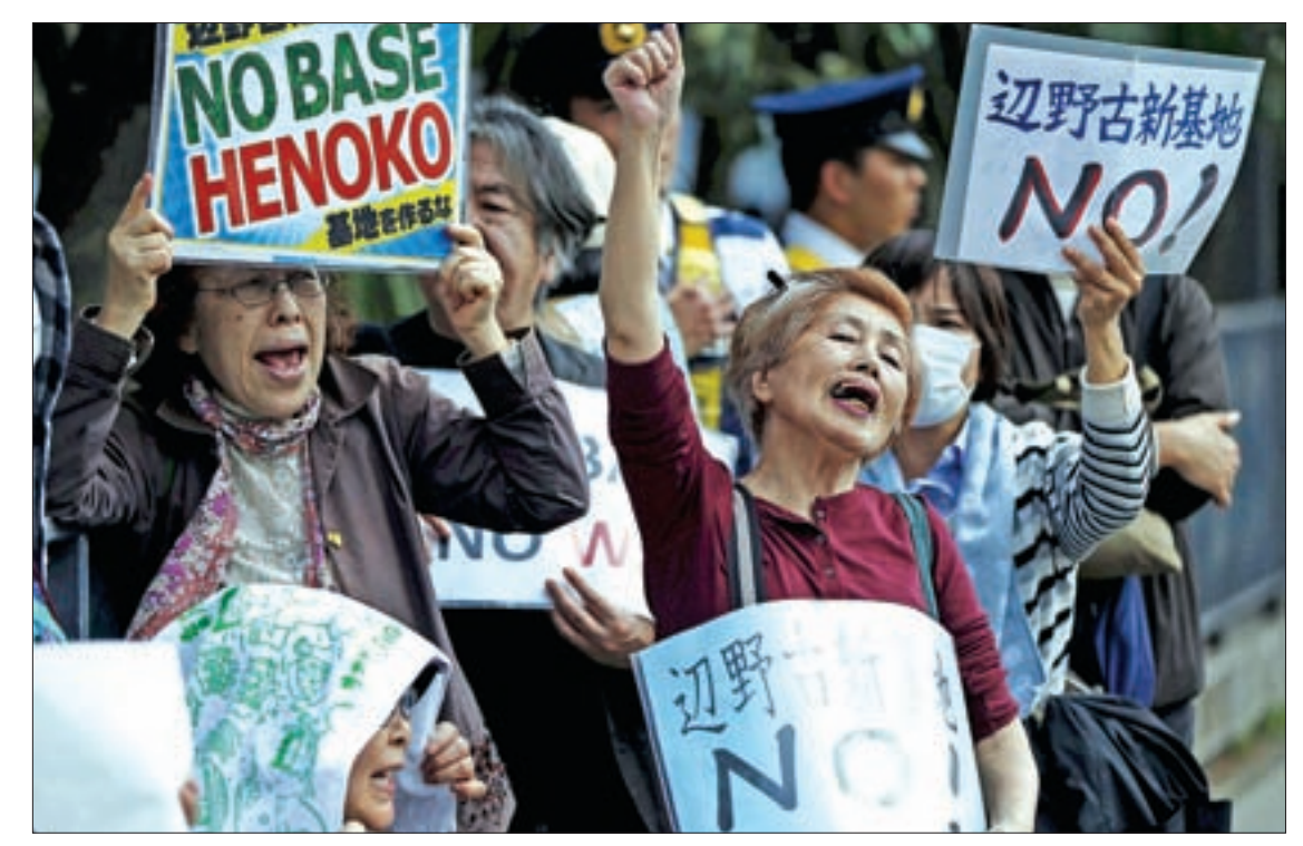
People protesting the planned relocation of the US military base to Okinawa's Henoko coast shout slogans at a rally in front of Prime Minister Shinzo Abe's official residence, as a meeting between Okinawa Governor Takeshi Onaga and Abe takes place, in Tokyo in 2015.

will accept a court-mediated settlement plan and suspend construction work for the planned relocation of a US airbase in Okinawa and will begin a new round of talks with local authorities who want the base moved off the island.