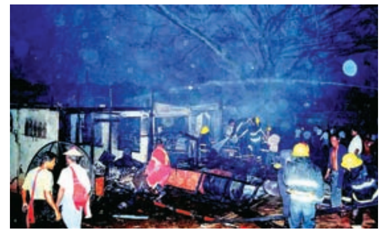
The scene of Myawady Fire.

A FIRE destroyed two houses near No.14 gate agriculture zone, ward 5, Myawady on Wednesday. According to an investigation, the fire broke out while Nay Tun Kyaw, 22, and Nay Ye Kyaw, 20, were filling petrol containers.