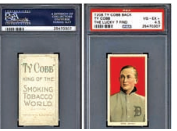
The front and back of a rare T206 Ty Cobb baseball card, one of the recently discovered "The Lucky 7 Find" cards that were authenticated, is seen in an undated photo provided by Professional Sports Authenticator. PHOTO: REUTERS

Myanmar Traditional Thatched Roofs: In-Leaf