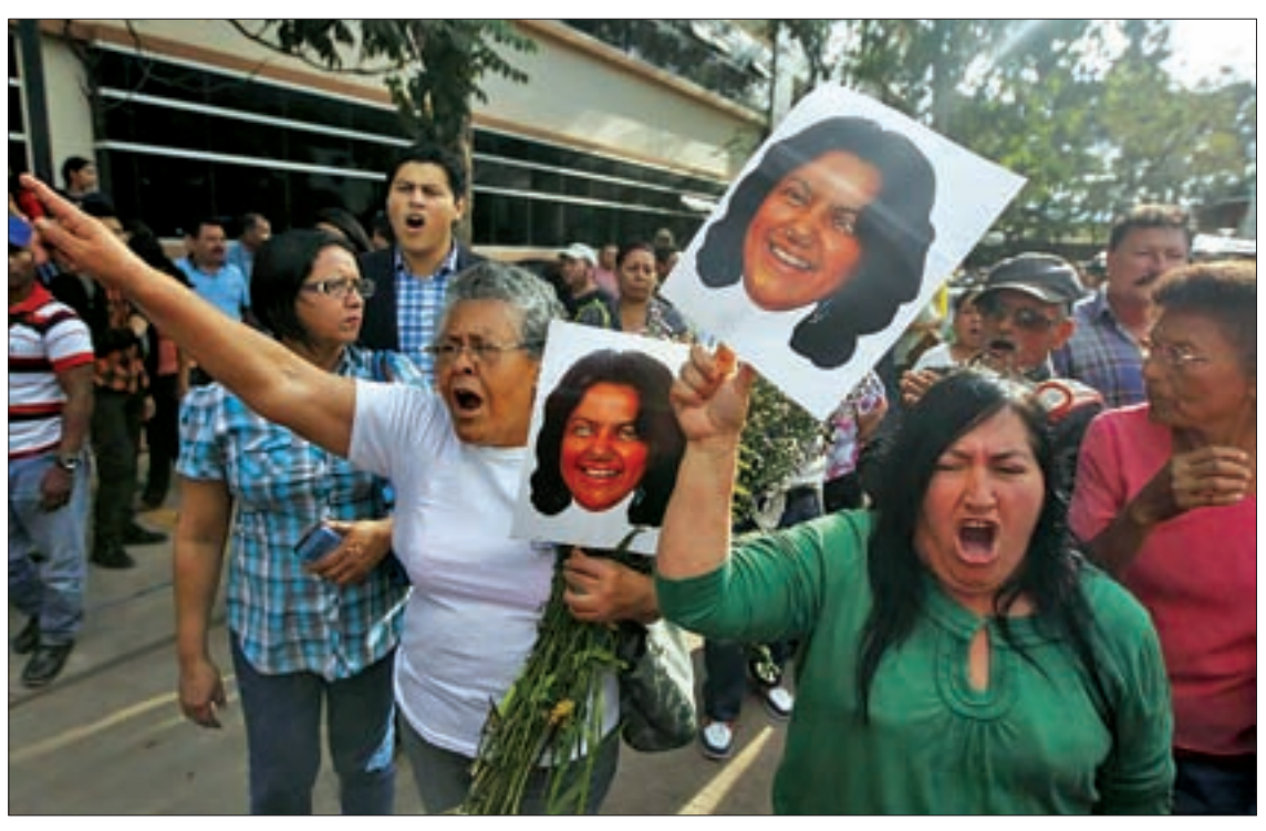
Activists hold photos of slain environmental rights activist Berta Caceres and shout after her body was released from the morgue in Tegucigalpa, Honduras, on 3 March.

The project, which was subcontracted by a local company to Chinese builder Sinohydro [SINOH.UL], has been temporarily suspended thanks to protests led by Caceres.—Reuters