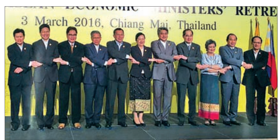
Union Minister Dr Kan Zaw poses for photo along with economic ministers from ASEAN countries.

UNION Minister for National Planning and Economic Development Dr Kan Zaw attended the meetings for successful implementation of ASEAN Economic Community Blueprint 2025 in Thailand on 2-3 March.