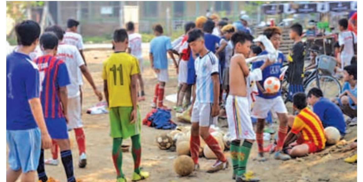
Trainees of football training course being seen.

A TOTAL of 200 students have registered to attend the summer sports trainings organised by the Education and Sports Promotion Committee under the Basic Education Department in Mayangon Township in Yangon West District.