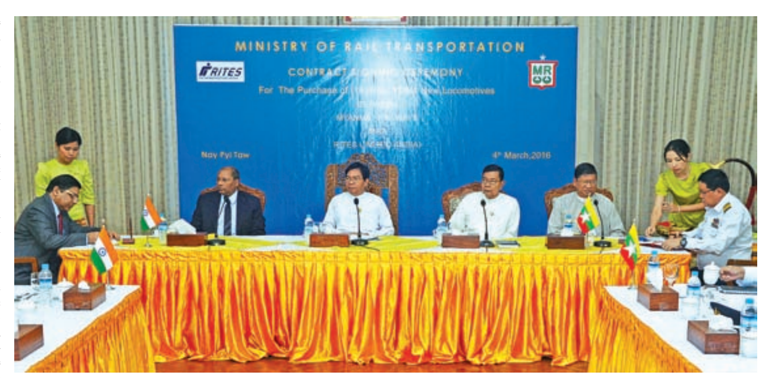
MoU signing ceremony in progress.