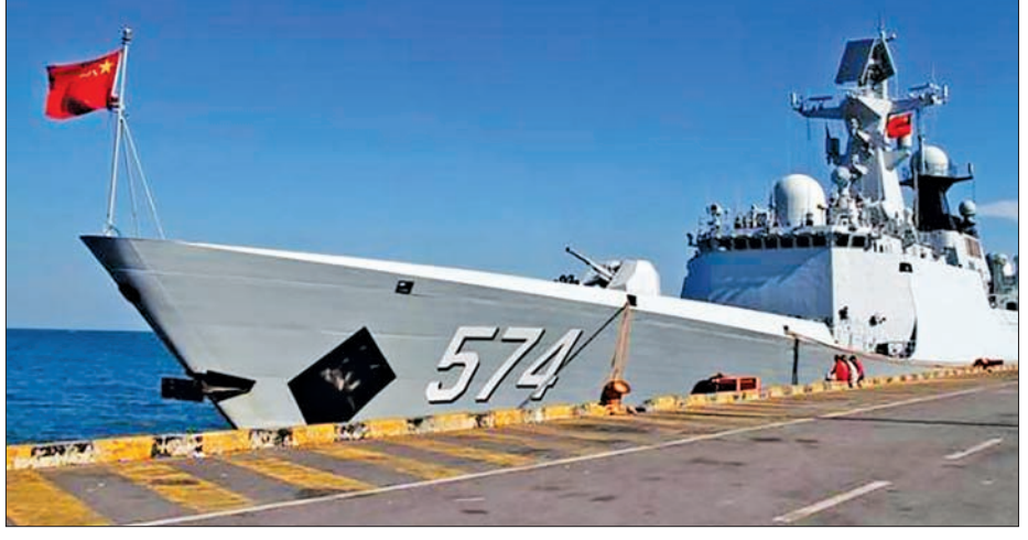
A Chinese navy ship is seen docked after an exercise with Cambodian naval officers in Preah Sihanouk Province, Cambodia, on 26 February.

Beijing has invested billions developing its homegrown weapons in-