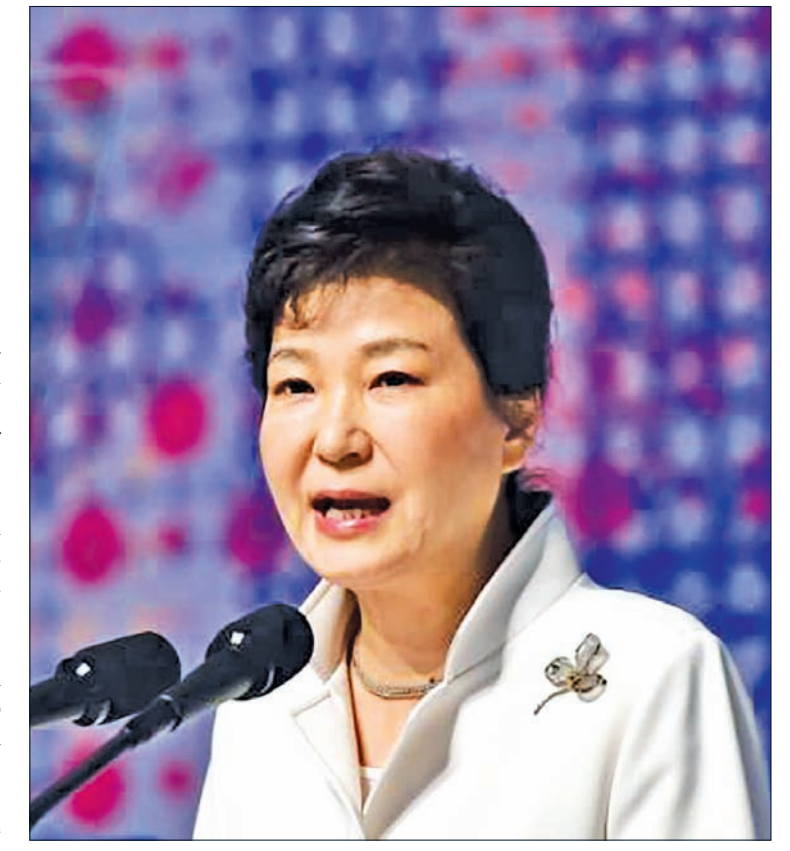
South Korean President Park Geun-hye delivers a speech during a ceremony to mark the anniversary of the 1919 independence movement against Japanese rule over the Korean peninsula, in Seoul, on 1 March.

The proposed new resolution would require UN member