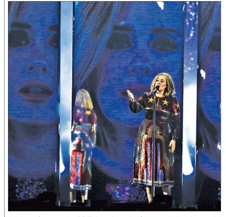
Adele performs at the BRIT Awards at the O2 arena in London, on 24

In a collection described as "lean, long and leggy", there were chunky cardigans in plaids and colourful stripes over similarly kaleidoscopic short dresses and leggings. There were For the finale, Armani, who also similar outfits in black and