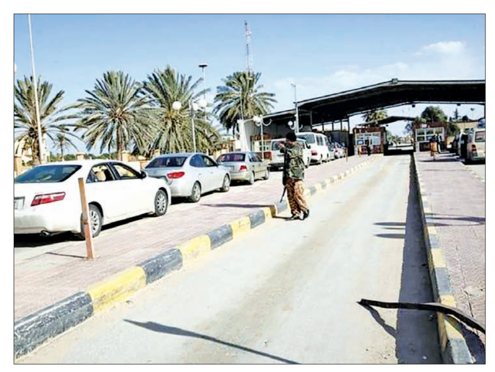
A security checkpoint is pictured at the Ras Jdir border, between Libya and Tunisia, 175 km west of Tripoli in December 2014.

"Before taking any military action in Libya, we would seek an invitation from the new Libyan Government," he said.—Reuters