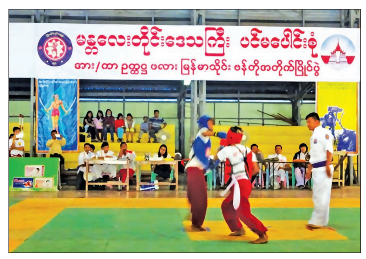
Myanmar Thaing Bando Competition in progress.

WITH the aim of promoting and conserving Myanmar martial arts techniques among younger generations, the Mandalay Region Sports and Physical Education Committee held the Myanmar Thaing Bando Competition of All Myanmar