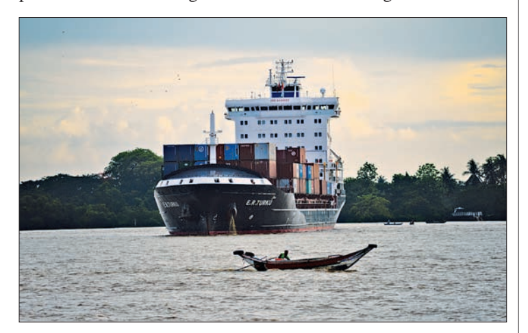
A cargo ship carrying containers leaving Yangon.

According to the MIC, the The import volumes for real estate sector has received this fiscal year were valued at the most foreign investment with a volume of $230 million for this fiscal year while the mining sector receiving over $2 million, the manufacturing sector $700 million, energy sector $50 million, Hotels and Tourism $100 million and others 131 million in foreign investment.