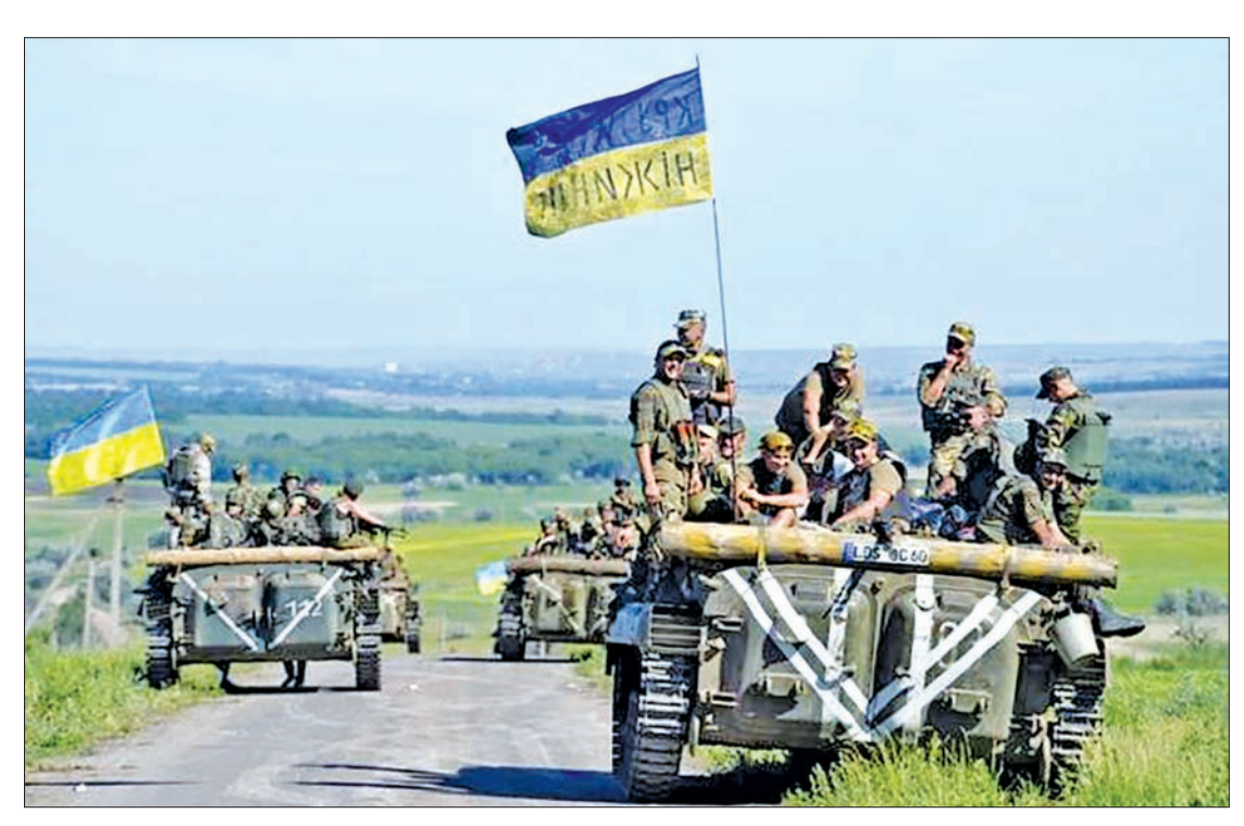
Members of the Ukrainian armed forces gather on armoured vehicles on the roadside near the village of Vidrodzhennya outside Artemivsk, Donetsk region, Ukraine, in 2015.

WASHINGTON credibility of the Minsk peace deal for eastern Ukraine will come under threat unless both sides in the conflict make faster progress in implementing the agreement, Germany's foreign minister said on Monday.