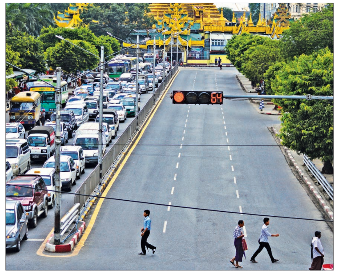
Yangon's traffic lights would be upgraded with CCTV cameras.