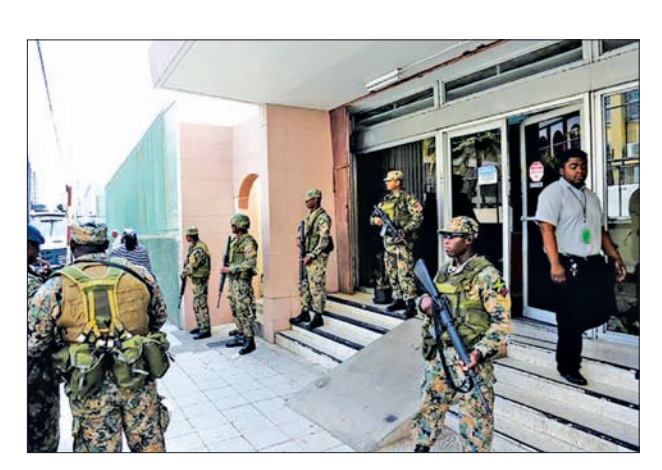
Soldiers of the Jamaica Defence Force (JDF) stand guard outside the Electoral Office of Jamaica in Kingston, on 29 February.