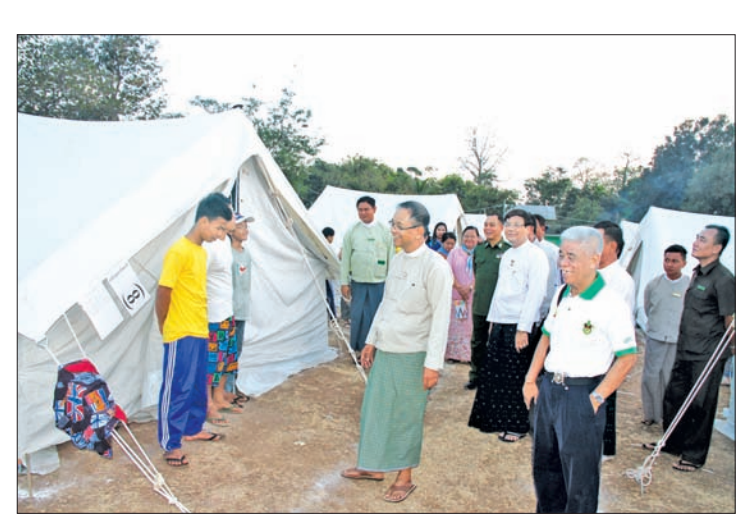
Mandalay Region Chief Minister U Ye Myint visits camps of scouts.

MANDALAY Region Chief Minister U Ye Myint met with scouts from basic education schools and universities and colleges across the country prior to their departure for the 4th scout camp at Mt. Popa at a school in Popa, NyaungU District of Mandalay Region yesterday.