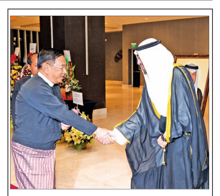
Mr. Ahmad Al Muzaini. Charge'd'Affaires a.i welcomes His Excellency U Htin Aung, Deputy Minister for Labour, Employment and Social Security and Madame on the Occasion of the 55th National Day & the 25th Anniversary of the Liberation Day of the State of Kuwait in Novotel Hotel, Yangon.

Also present at the calls were Deputy Pyithu Hluttaw Speaker U T Khun Myat, Daw Su Su Lwin, chair of Pyithu Hluttaw International Relations Committee, and officials of Pyithu Hluttaw Office. — Myanmar News Agency