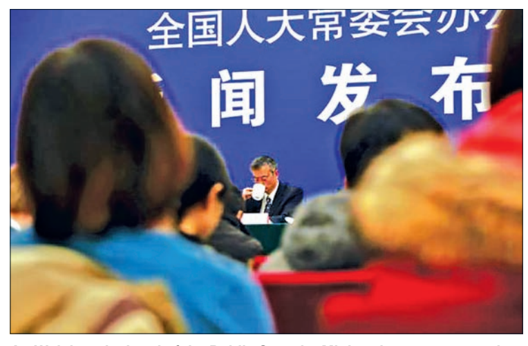
An Weixing, the head of the Public Security Ministry's counter-terrorism division, drinks a tea at a news conference after China's parliament passed a controversial new anti-terrorism law in Beijing, in this December 27, 2015.

Critics of the counterterrorism legislation, for one, say that it could be interpreted in such a way that even non-violent dissidents could fall within its definition of terrorism. The four ambassadors said areas of the counterterrorism law, which the National People's Congress passed in December, were vague and could create a "climate