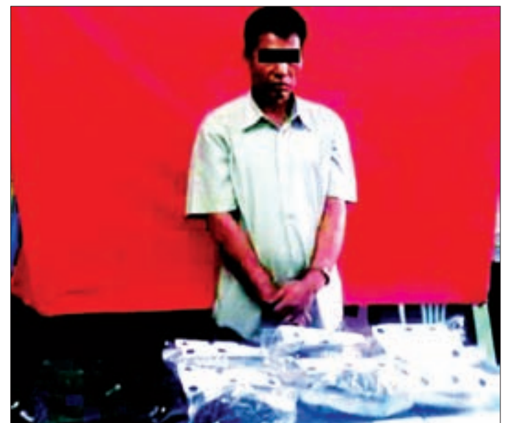
A drug dealers seen together with the drugs seized.