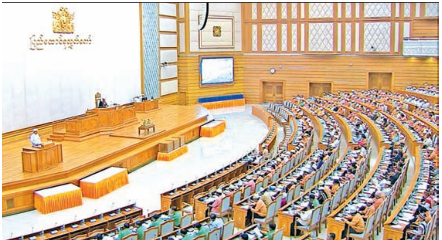
Pyidaungsu Hluttaw is convened yesterday in Nay Pyi Taw.

The original date was set only two weeks before the new government is scheduled to take office on 1 April.—GNLM