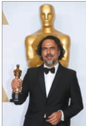
Mexican director Alejandro Gonzalez Inarritu, winner for Best Director for "The Revenant", poses with his Oscar backstage at the 88th Academy Awards in Hollywood, California, on 28 February.