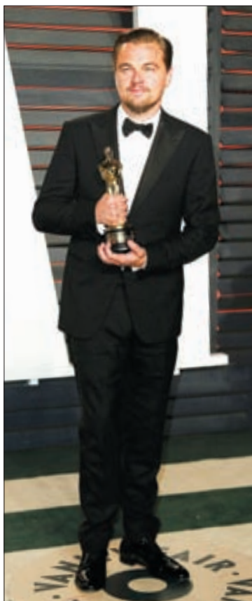
Actor Leonardo DiCaprio holds his award for Best Actor in the "The Revenant" as he arrives at the Vanity Fair Oscar Party in Beverly Hills, California, on 29 February.