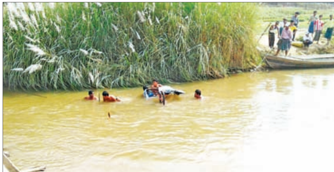
Villagers nearly seen rescuing the passengers.

All people involved in the case have been charged under the law.—Tin Win Hlaing (Kawkeyeik)