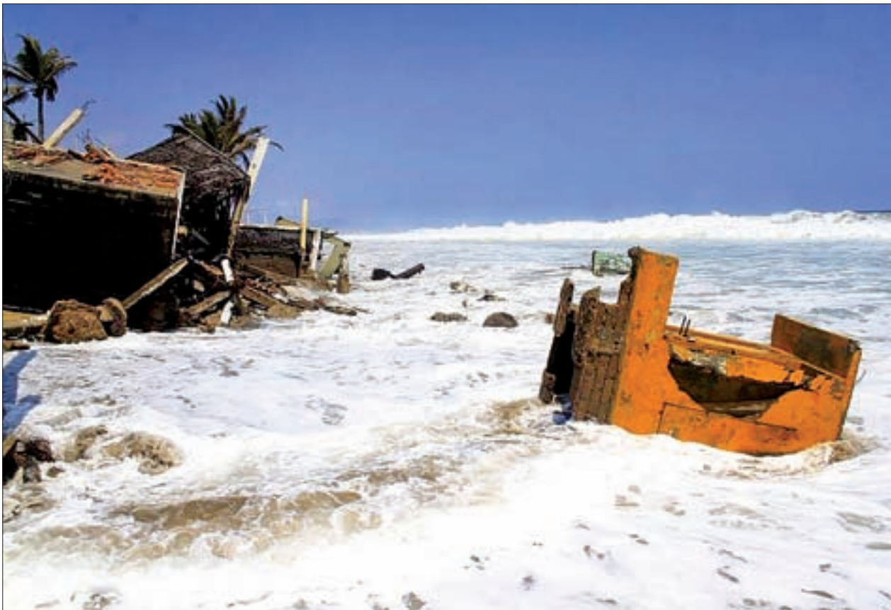
Buildings damaged by high waves are seen in Coyuca de Benitez, on the coast of Guerrero state, Mexico, in this 4 May, 2015 file photo.

The Potsdam scientists said that mathematical models they developed to estimate rising costs would work around the world. “You can apply it in Tokyo, New York or Mumbai,” Kropp said.