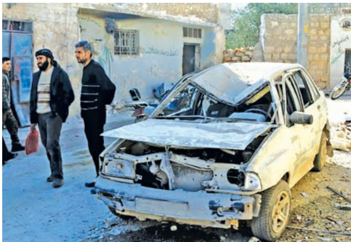
Residents stand near a damaged car in the town of Darat Izza, province of Aleppo, Syria, on 28 February.

Speaking during a joint news conference with visiting Danish Foreign Minister Kristian Jensen