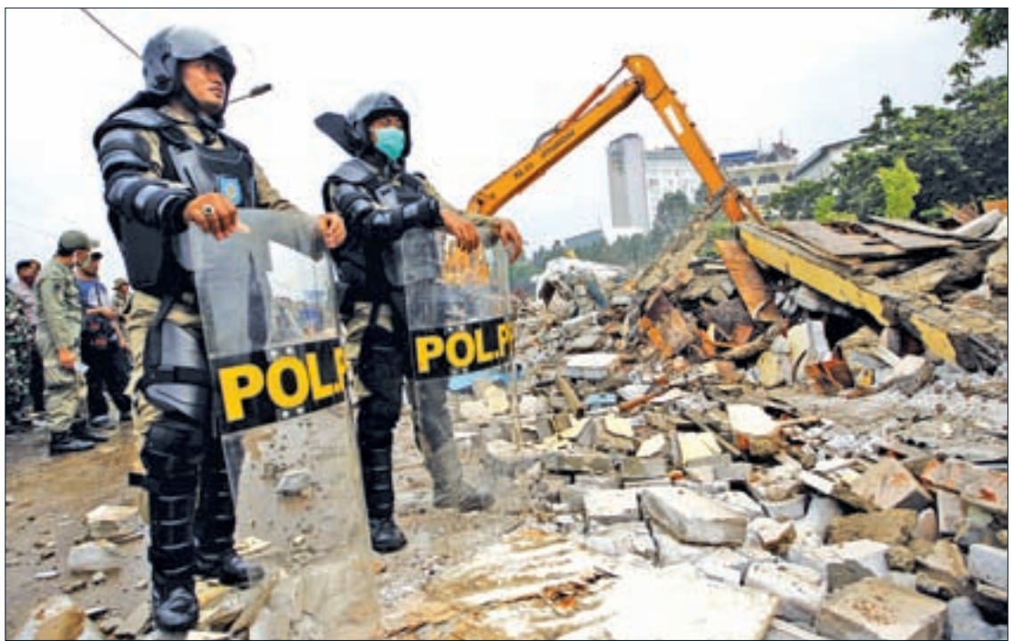
Civil service police watch the demolition of Kalijodo red-light district in Jakarta, Indonesia, on 29 February.

"First, we need to demolish all houses and revert the land to be used for a green open space, which has been the main function of the area since the very beginning. Once it is all completed, we will rebuild the area immediately," Anas Effendi, West Jakarta Mayor, told reporters.