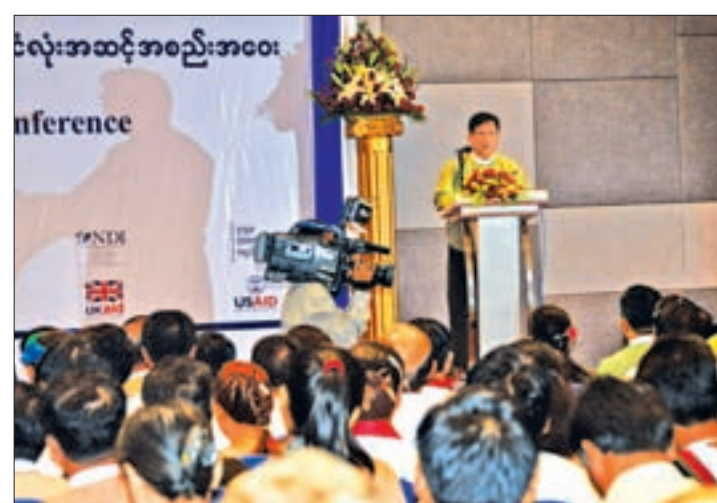
U Tin Aye delivers key-note remarks at post-election review conference.

During their stay in Tachilek, the Union ministers visited Tachilek Airport and heard reports on the upgrading of the Tachilek and Kengtung airports.— Myanmar News Agency