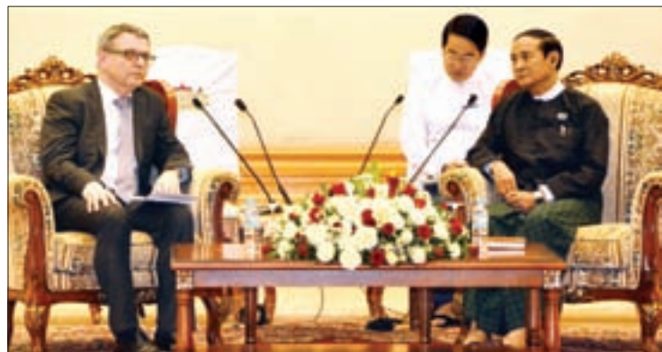
Speaker U Win Myint receives Mr Lubomir Zaoralek, Minister of Foreign Affairs of the Czech Republic.

SPEAKER of the Pyithu Hluttaw U Win Myint received a Czech delegation led by HE Mr Lubomir Zaoralek, Minister of Foreign Affairs of the Czech Republic, yesterday at the parliamentary building in Nay Pyi Taw. During the meeting, the parties discussed the promotion of cooperation between the two countries' parliaments, strengthening the friendship between the two countries and the two governments and matters