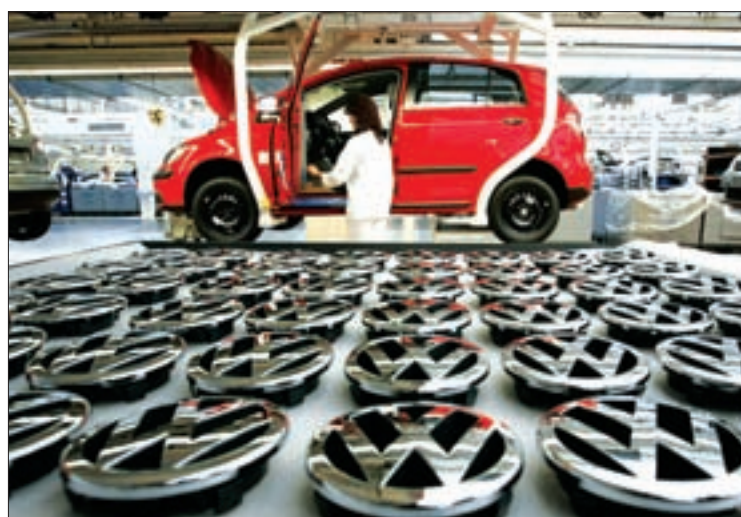
Workers assemble a Volkswagen Golf Plus in the production line in Wolfsburg, Germany.

"Though it is a safe car, its fuel consumption rate is high," said car dealer U Aung Naing.