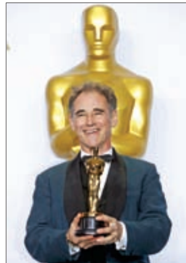
Mark Rylance, winner of the Oscar for Best Supporting Actor for the movie "Bridge of Spies", poses backstage at the 88th Academy Awards in Hollywood, California, on 28 February.

about the selection of an all-white acting nominee line-up for a second year were a running theme of the show, dubbed "the white People's Choice awards" by Rock, an outspoken black comedian.