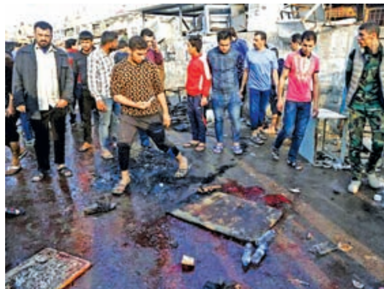
People gather at the site of suicide blasts in Baghdad's Sadr City, on 28 February.

Russia had itself received declarations of agreement from 17 armed groups from Syria's "moderate opposition", the centre said in a statement.—Reuters