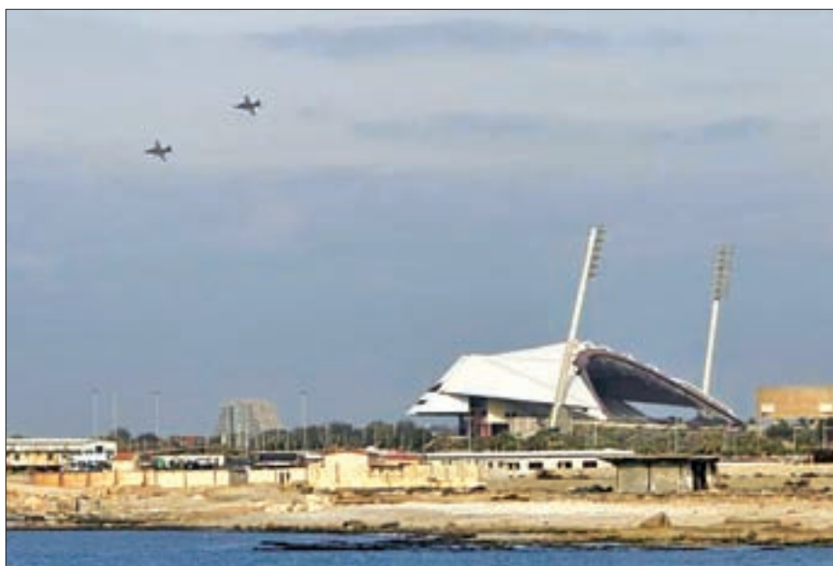
Russian warplanes fly in the sky over the Mediterranean coastal city of Latakia, Syria, on 28 January.

Arab state of Kuwait: "We have seen some encouraging developments that the ceasefire is largely holding but at the same time we have seen some reports about violations of the ceasefire. "This agreement and the full implementation of the agreement is the best possible basis for renewing the efforts to find a political negotiated peaceful solution to the crisis in Syria," he added. The deal, which is less binding than a formal ceasefire and was not directly signed by Syria's warring government and rebel forces, does not cover action against militants from Islamic State or the Nusra Front, an al Qaeda affiliate.—Reuters