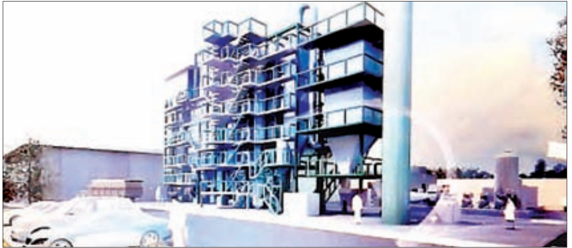
The waste-to-energy plant being seen in Shwepyitha.

The main purpose of establishing such project is to reduce methane and carbon dioxide transmission at a certain degree as both gas badly damage the natural environment and it is a root