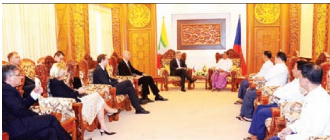
Union Minister for Foreign Affairs U Wunna Maung Lwin holding talks with Mr Lubomir Zaoralek, Minister of Foreign Affairs of the Czech Republic.

and exchanged views on promotion of bilateral relations and cooperation.— Myanmar News Agency