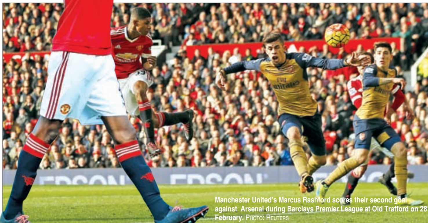
Manchester United's Marcus Rashford scores their second goal against Arsenal during Barclays Premier League at Old Trafford on 28 February.

Marcus Rashford, the 18-year-old who scored twice on his Manchester United debut in the Europa League on Thursday, inflicted the same punishment on Arsenal in the space of three minutes at Old Trafford on Sunday.—Reuters