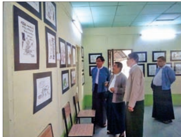
Cartoon exhibition seen with the visitors.

A CARTOON exhibition was held in the Kuthodaw Art Gallery in Mandalay jointly by the regional Health Department and Marie Stopes International from 26 to 28 February in order to raise public awareness on HIV.