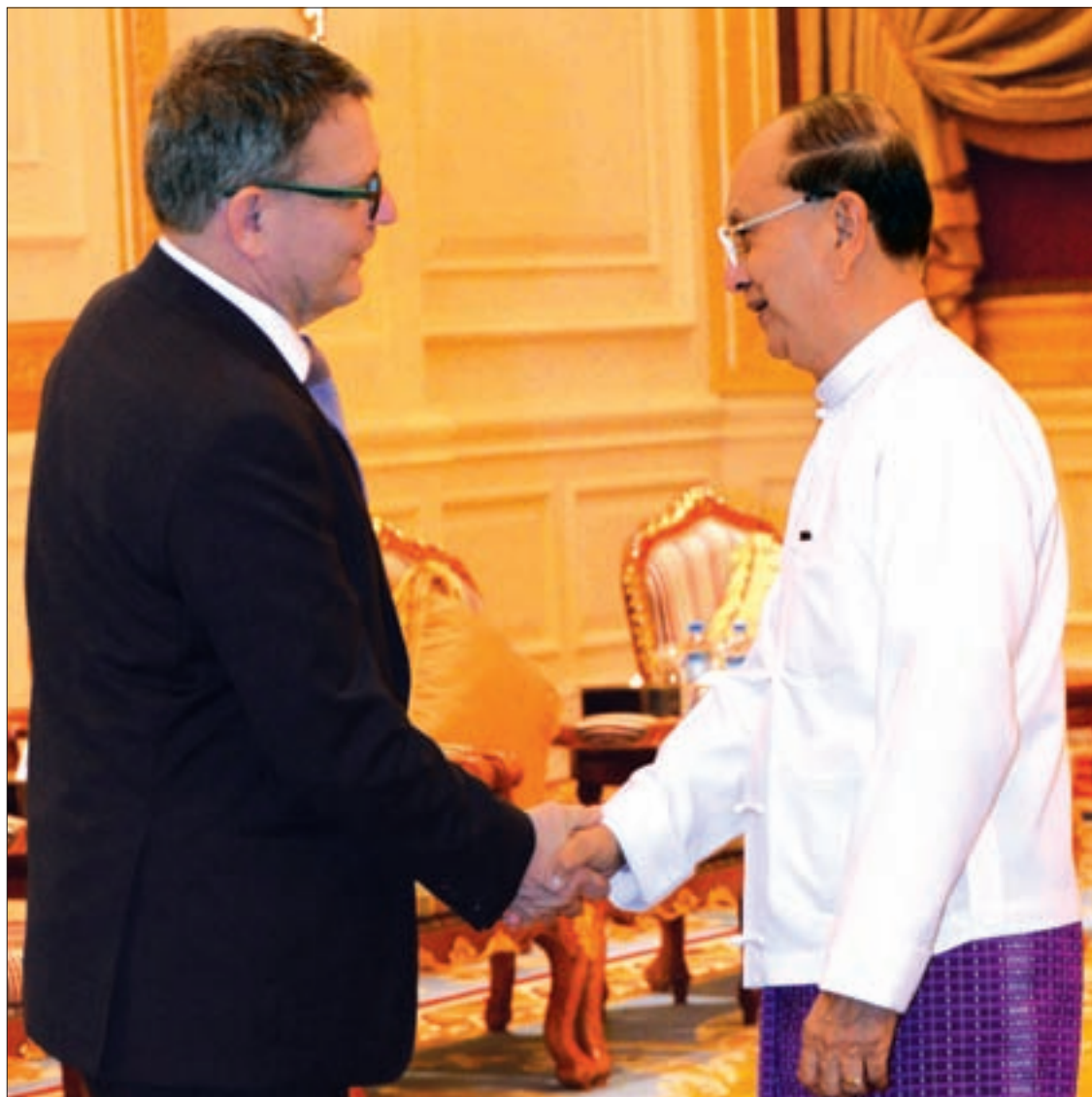
President U Thein Sein welcomes Mr Lubomir Zaoralek, Minister of Foreign Affairs of the Czech Republic at the Presidential Palace in Nay Pyi Taw.

the president were Union Ministers Lt-Gen Sein Win, U Wunna Maung Lwin, U Soe Thane, Dr Kan Zaw, U Ye Htut and officials while the Czech Foreign Minister was accompanied by Ambassador of Czech Republic to Myanmar.— Myanmar News Agency