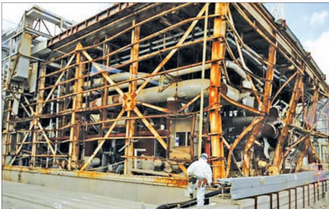
A worker, wearing a protective suit and a mask, is seen from a bus near the No. 3 reactor building at Tokyo Electric Power Co's (TEPCO) tsunami-crippled Fukushima Daiichi nuclear power plant in Okuma town, Fukushima prefecture, Japan, on 10 February.

The three, who are indicted without arrest, are likely to plead not guilty and the trial is expected to start next year, local media reported. Reuters could not im-