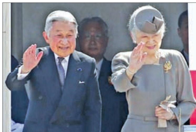
Visiting Japanese Emperor Akihito and Empress Michiko waves before boarding a plane during their departure at the international airport in Manila, on 30 January, after their state visit in the country.

TOKYO — Japanese Emperor Akihito, 82, has been diagnosed with influenza after suffering a fever over the weekend, the Imperial Household Agency said yesterday, without giving further details.