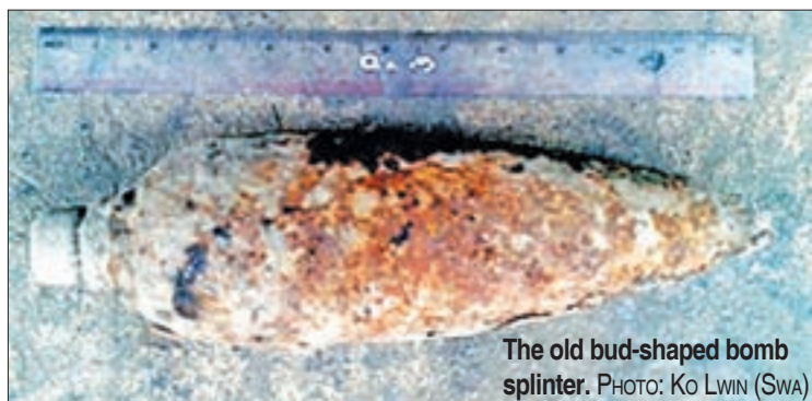
The old bud-shaped bomb splinter.

to designated areas in Shwepyitha, Hlawga in Mingaladon, Dagon Seikkan and Dala townships every day.—Tin Win Lay (Kyimyindaing)