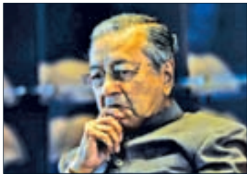
Malaysia's former prime minister Mahathir Mohamad.

KUALA LUMPUR — Malaysia's former premier Mahathir Mohamad said yesterday he is quitting the ruling United Malays National Organisation (UMNO) party, as it is being seen as "supporting corruption" under Prime Minister Najib Razak's leadership.