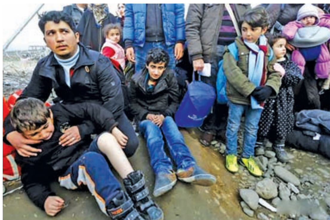
Syrian and Iraqi refugees wait to cross the Greek-Macedonian border on 27 February 2016 as the border crossing is briefly reopened near the Greek village of Idomeni.

ATHENS — European Union countries must work together to deal with the migrant crisis troubling the bloc and avoid blaming each other, German Foreign Minister Frank-Walter Steinmeier told Greek daily Ta Nea in an interview yesterday.