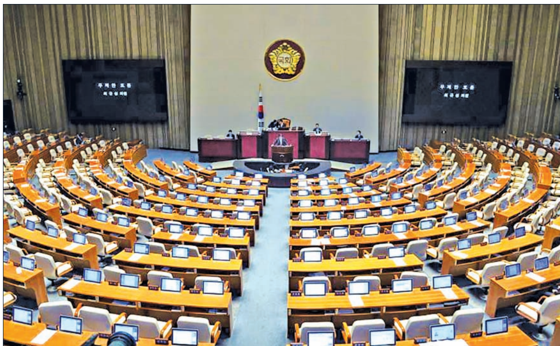
Choi Kyu-sung (C), a member of the main opposition Minjoo Party of Korea speaks at the National Assembly in Seoul, South Korea, on 28 February 2016.

Earlier this month, President Park Geun-hye’s office called for parliament to pass the stalled security bill, part of tough action taken by her government amid heightened tension with North Korea following its test launch of