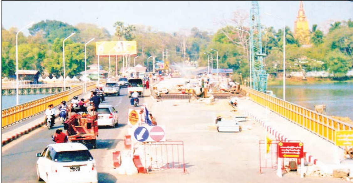
Meikhtila Lake bridge seen with vehicles using the new bridge side.

A BRIDGE across Meikhtila Lake is being extended in order to facilitate transportation. The bridge is located along the Meikhtila-Kyaukpadaung motorway in Meikhtila Township, where the Kyaukpadaung, Yangon, Mandalay, Myingyan and Taunggyi motorways meet, leaving the town congested.