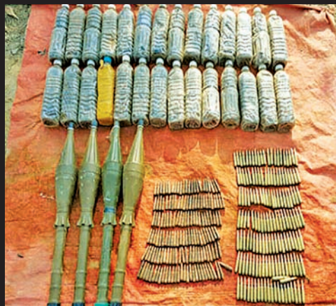
Arms and ammunition seized from Arakan Army.

POLICE searched a suspicious looking vehicle parked with its lights and engine on near Victor International School in Tamwe Township, Yangon Region, on 6 February.