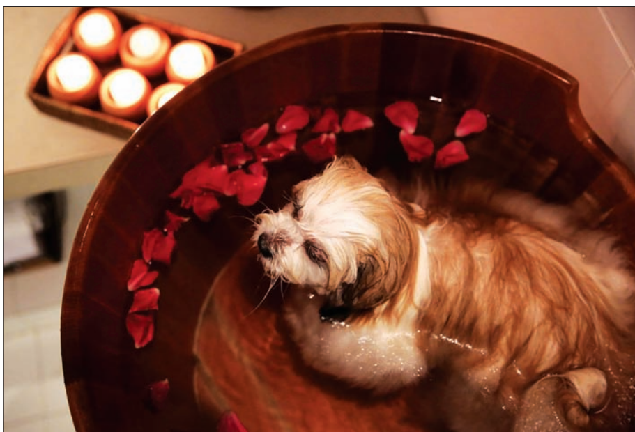
A Lhasa Apso sits in a bath with petals during a spa treatment for dogs at Gama Pet pet store at the Cidade Jardim mall in Sao Paulo, Brazil, on 24 February 2016.