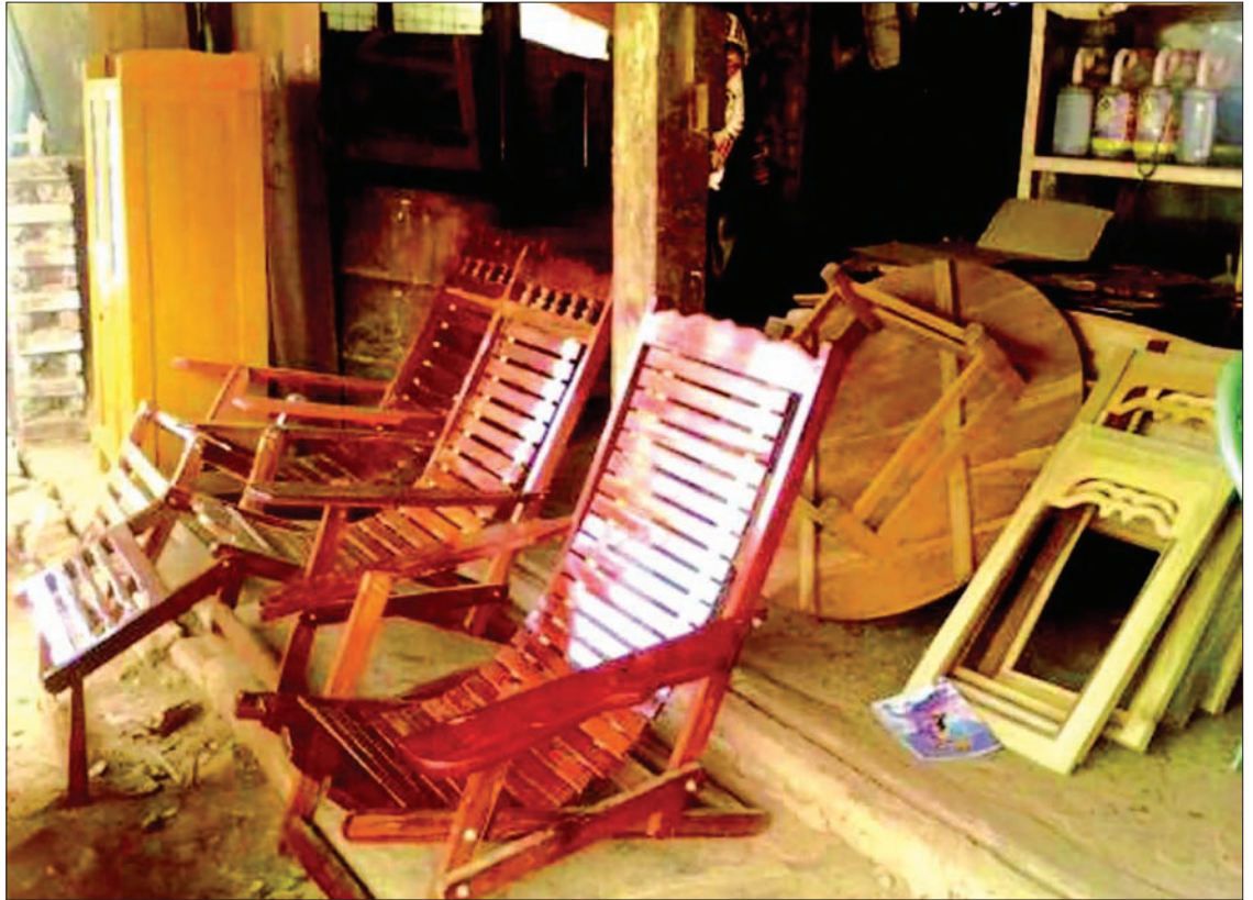
The demand for wooden furniture is in the decline.

The finished product is highly priced because the raw materials are costly. Besides, there is a shortage of professional artisans, the salesman added.— Htut Htut