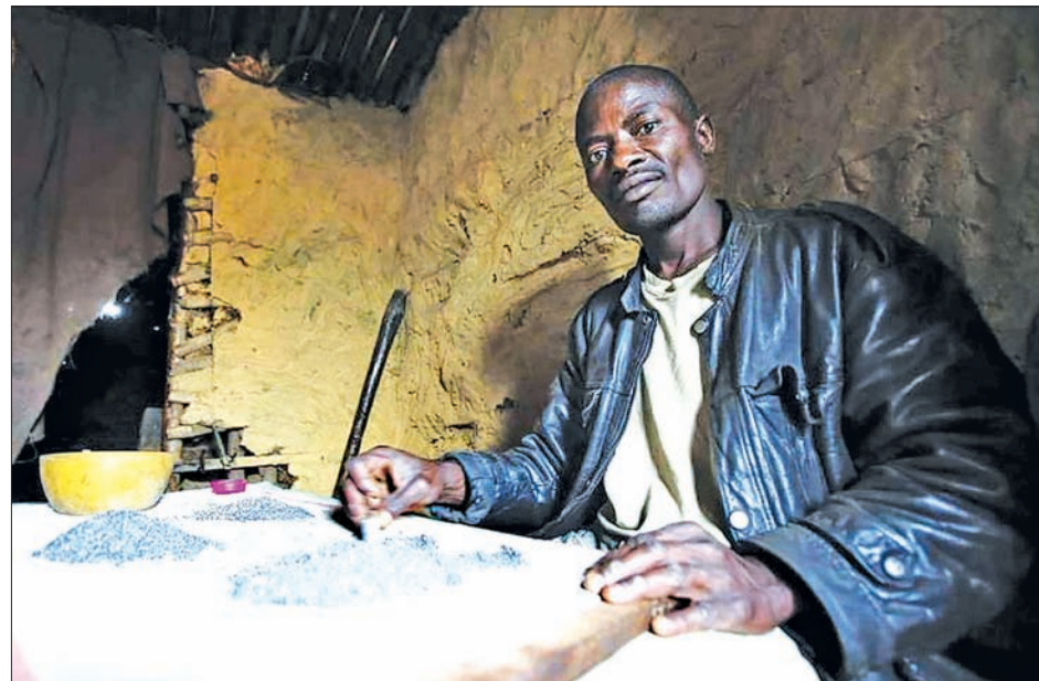
A Congolese worker separates coltan and cassiterite, or tin ore, in a mud hut at Numbi in eastern Congo on 24 July 2010.

Unfortunately, the law included an exception, which swallowed the rule: if there were a "consumptive demand" for the good, then it could be imported even if it was made with slave labour. For example, there is a high demand for cocoa for use in chocolate, and the exception has allowed its import regardless of how the cocoa was produced because we cannot grow cocoa beans in the United States. Today, our appetite for foreign-made goods is so ubiquitous that the consumptive demand exception has become an insurmountable obstacle