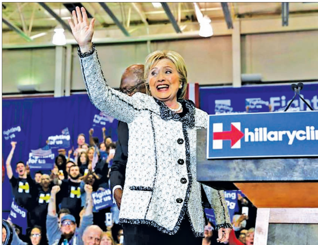
Democratic US presidential candidate Hillary Clinton waves to supporters as she arrives at her South Carolina night at a primary night party in Columbia, South Carolina, on 27 February 2016.

COLUMBIA — Fresh off a run-away win in the South Carolina primary, Democrat Hillary Clinton turned her sights to a possible match-up with Republican front-runner Donald Trump in the 8 November presidential election.