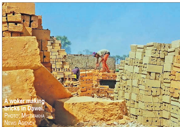
A worker making bricks in Dawei.

THE expansion of construction enterprises in Myanmar's southern Dawei District, located in Taninthayi Region, means good business for brick manufacturers.