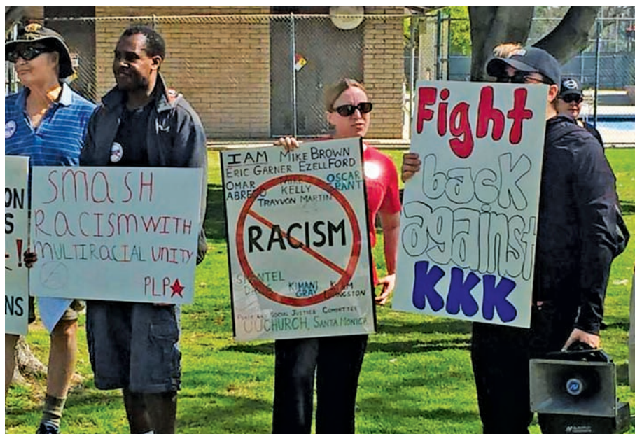
Counter protesters hold placards near a planned Ku Klux Klan rally in Anaheim, California on 27 February 2016.

Wyatt said four people were wounded in the ensuing confrontation. The person most seriously wounded was stabbed with a flagpole that had an American eagle finial at the top and taken to a local hospital in critical