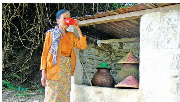
An aged woman drinks charity water in a rural aea.

Meanwhile, the Union government has also planned to allocate K2 billion ($1,616,815) to install water tanks in villages