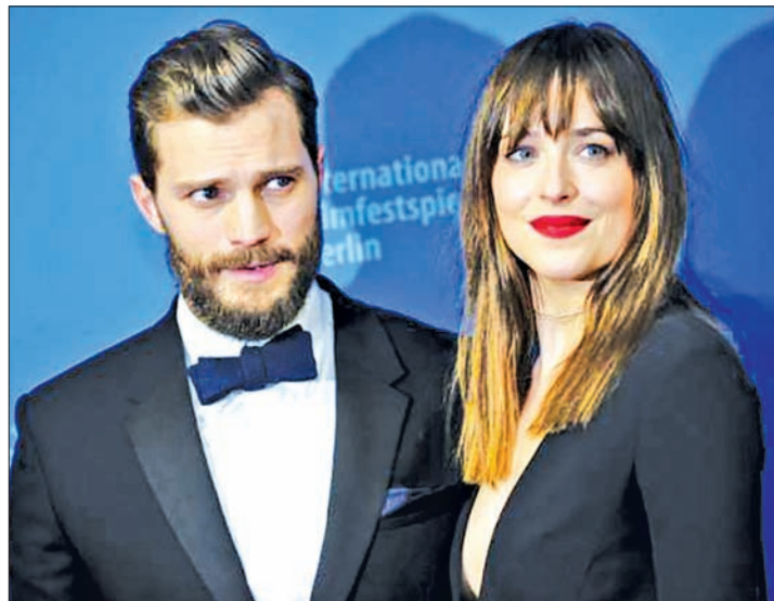
Actors Dakota Johnson and Jamie Dornan (L) arrive for the screening of the movie 'Fifty Shades of Grey' at the 65th Berlinale International Film Festival in Berlin on 11 February 2015.

SANTA MONICA, Calif — The erotic box office hit "Fifty Shades of Grey" led the pack on Saturday for the annual Razzie Awards, "honoring" Hollywood's worst films, while "Rocky" star Sylvester Stallone punched his way to a special Redeemer award for his Oscar-nominated turn in "Creed."