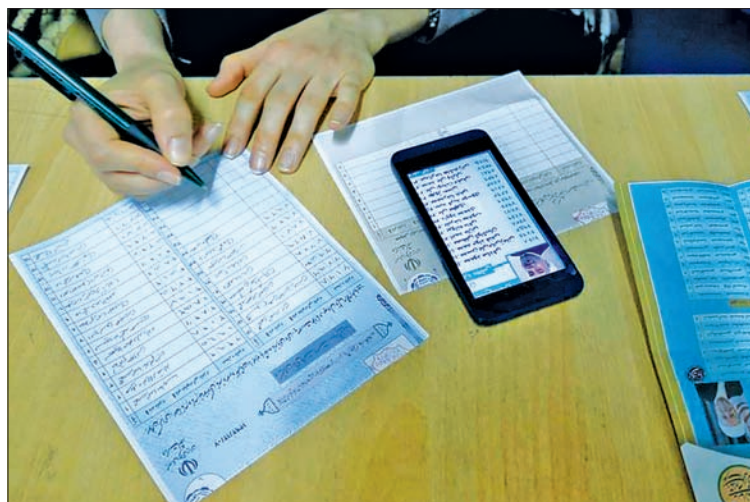
An Iranian woman fills in her ballot during elections for the parliament and a leadership body called the Assembly of Experts, which has the power to appoint and dismiss the supreme leader, in Tehran on 26 February 2016.

"Based on the votes that we have so far it looks like the principlists will lose the majority in the next Majlis (parliament) shy of 50 per cent. The reformists gained 30 per cent and independent candi-