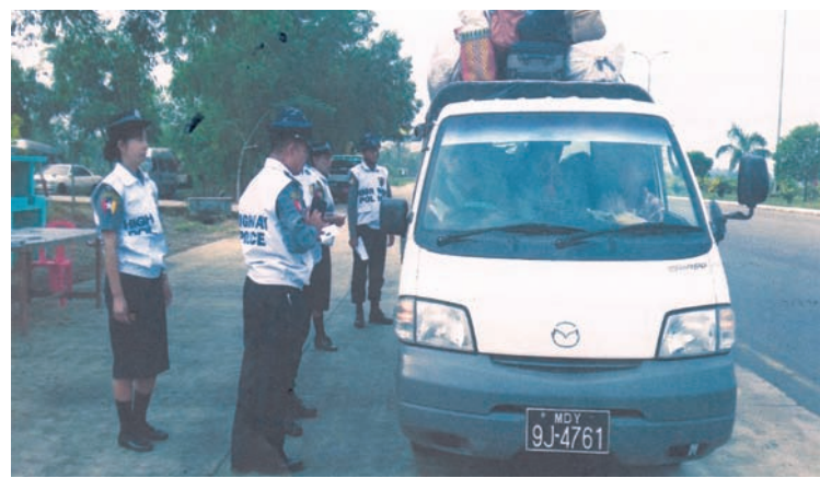
The traffic police distributes pamphlets to drivers as part of efforts for educating them on road safety.

A TOTAL of 11 car accidents took place on the Yangon-Mandalay Highway in January and February, killing three and injuring 46, according to traffic police.