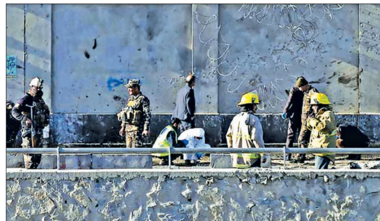
Afghan security forces inspect the site of a suicide attack in Kabul, Afghanistan on 27 February 2016.

Almost 100 Afghan army officers were removed or reassigned in Helmand in recent months, and the army abandoned its outposts in several of the most hotly contested districts to redeploy elsewhere.—Reuters