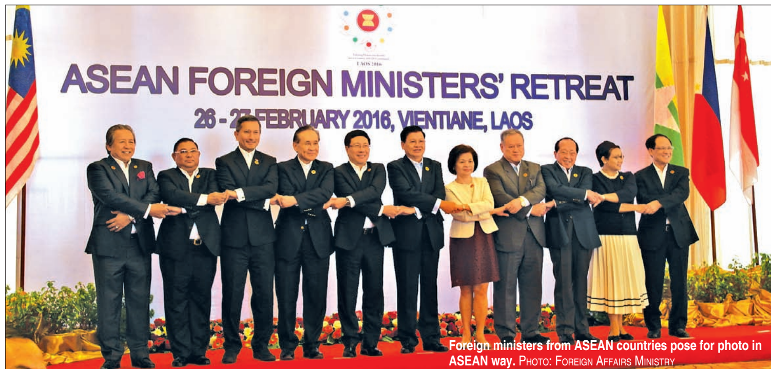
Foreign ministers from ASEAN countries pose for photo in ASEAN way.