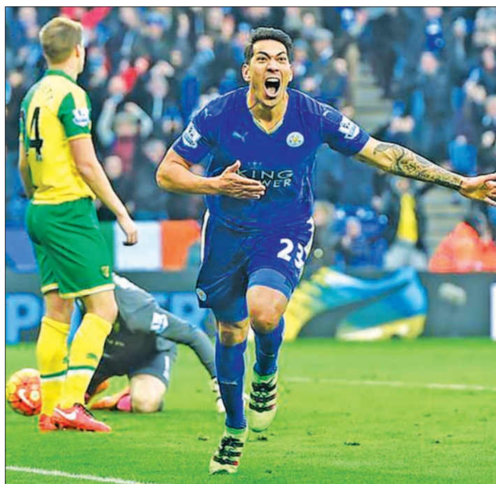
Leonardo Ulloa celebrates after scoring the first goal for Leicester City during Barclays Premier League at King Power Stadium on 27 February 2016.

More importantly, it demonstrated to manager Claudio Ranieri that, following the heartbreak of the stoppage-time