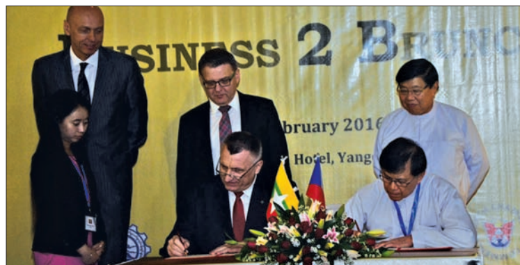
Myanmar and Czech prepare to boost economic cooperation between the two countries.

A BUSINESS delegation from the Czech Republic signed a memorandum of understanding (MoU) with the Union of Myanmar Federation of Chambers of Commerce and Industry yesterday to promote the further development of trade and economic cooperation between the two countries.