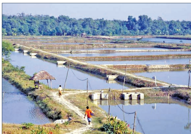
Shrimp farms.

DHAKA — Technology that uses Quick Reading Codes (QRC) — which work like universal bar codes — helps consumers of shrimps farmed in Bangladesh to trace the antecedents of what they are eating with a smartphone app.