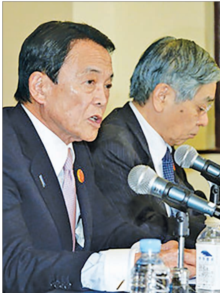
Japan's Finance Minister Taro Aso (L) and Bank of Japan Governor Haruhiko Kuroda attend a press conference in Shanghai on 27 February 2016, after finance leaders from the Group of 20 major economies agreed to use "all policy tools — monetary, fiscal and structural — individually and collectively" to strengthen market stability and prop up sagging growth.

SHANGHAI — Finance leaders from the world's 20 major economies on Saturday agreed to use "all policy tools — monetary, fiscal and structural — individually and collectively" to strengthen market stability and prop up sagging growth.