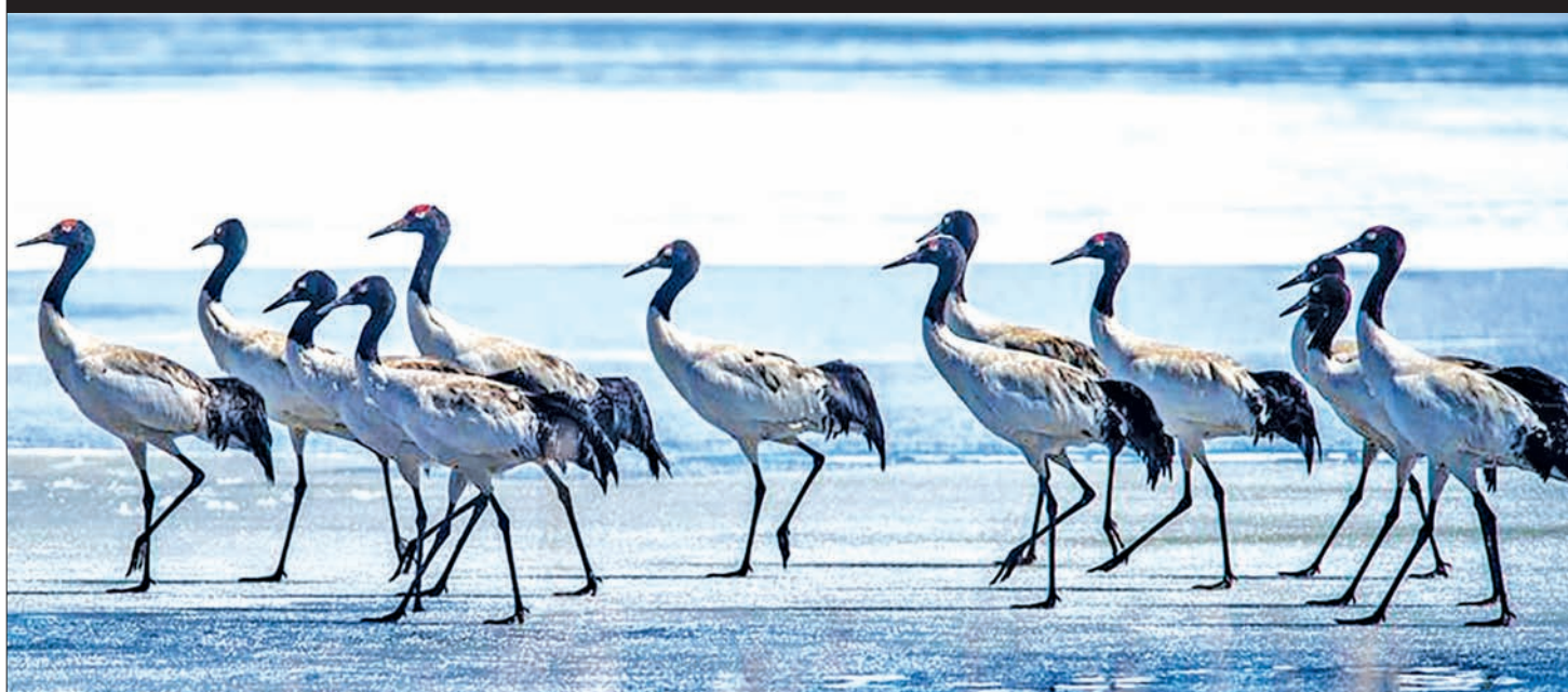
Black-necked cranes are seen at Dashanbao Black-necked Crane Nature Reserve, southwest China's Yunnan Province, on 26 February 2016. According to Dashanbao Black-necked Crane Nature Reserve, there were more than 1,100 black-necked cranes living through the winter here. Black-necked crane is evaluated as Vulnerable on the IUCN Red List of Threatened Species.