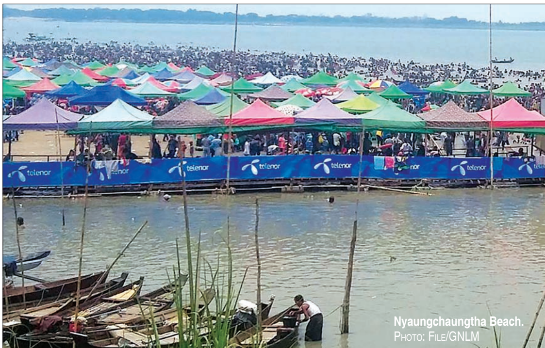
Nyaungchaungtha Beach.

Entry fees of K200 per person and K1,000 per vehicle will apply to future visitors.