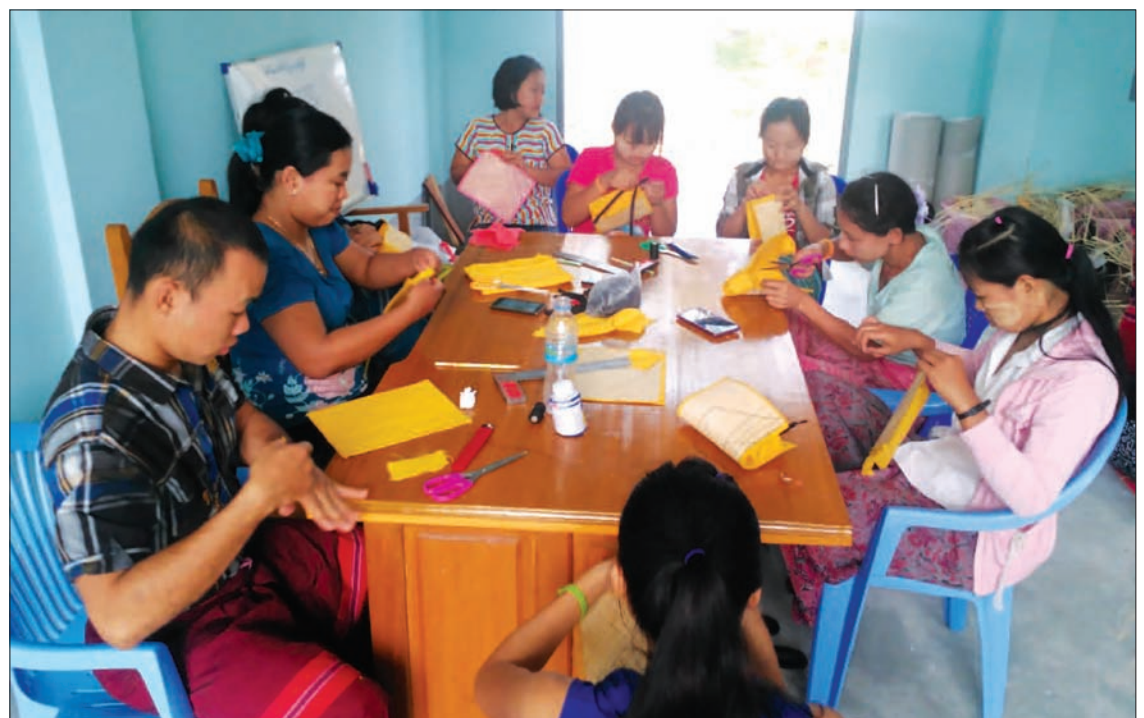
Trainees learning to make handicrafts.

Altogether, 30 trainees attended the 12-day craft courses, where they learned to make eight kinds of handicrafts, including tissue boxes, pen boxes, wallets and place mats. The trainees were awarded course completion certificates on 26 February.—Ko Myo Lwin (Pha-An)