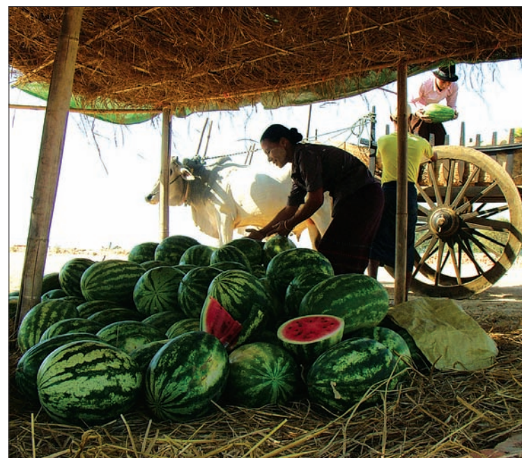
Farmers loading a bullock cart with watermelons.

Watermelons are planted in November and can be sold from the following January, and are commonly grown as a fruit in the wake of the monsoon paddy harvest season, according to local growers. The acreage of watermelons will decline later this year as a direct result of losses made from the fall in the price of trade from China, while current expenses of one acre of watermelons - including costs of seed, fertiliser, ploughing and irrigation - require an investment of up to around K1 million, it is known from region watermelon farmers.—Myitmakha News Agency