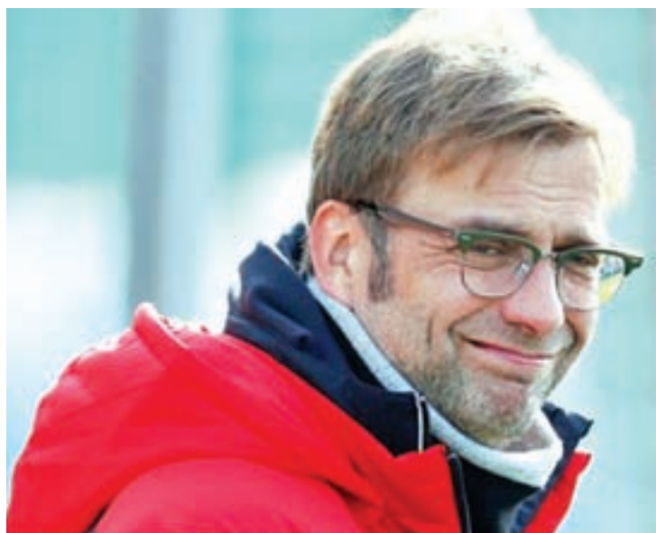
Liverpool manager Juergen Klopp.

LONDON — Liverpool can beat the "best team in the Premier League" when they take on Manchester City in the League Cup final at Wembley on Sunday, ac-