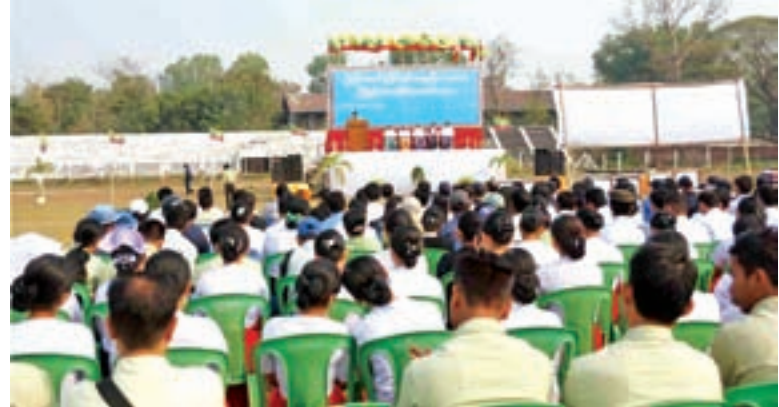
Hailing Ceremony of UPC holding at the Sport Ground of Taungoo.

Present at the ceremony were Departmental officials, members of the Maternal and Child Welfare Association, members of the Myanmar Women's Affairs Association, national races, teachers and students, trainees of the University of Nursing and local people.