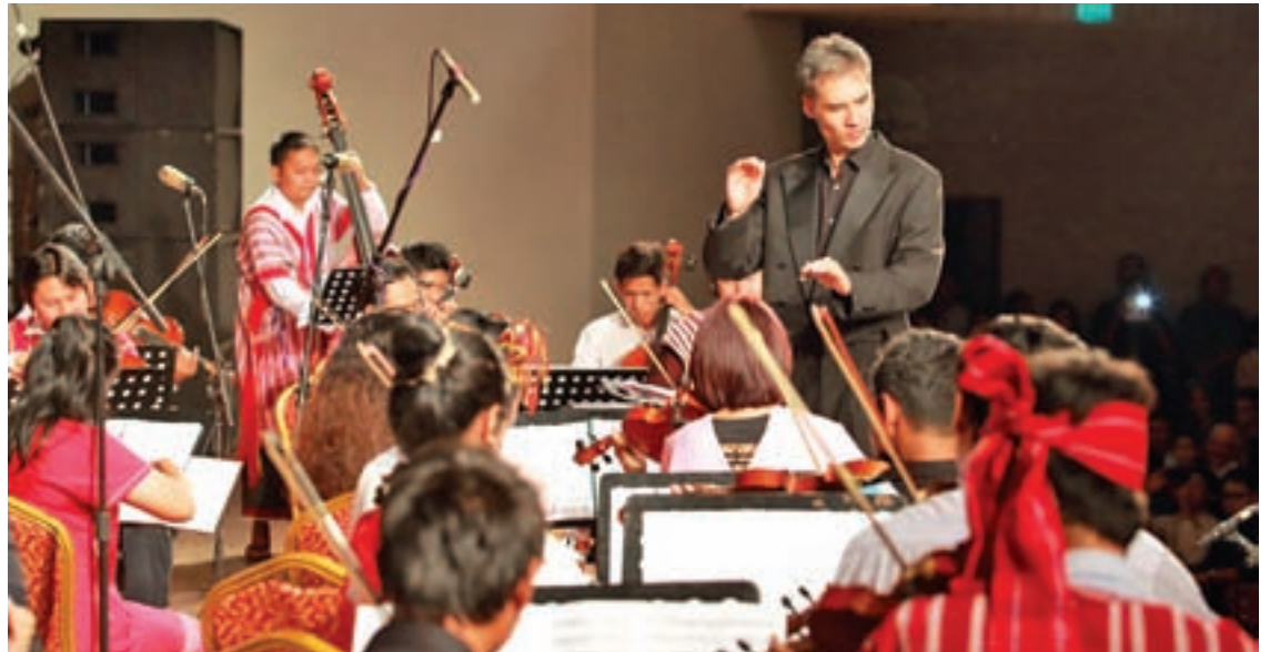
Orchestra for Myanmar seen in a practising session.