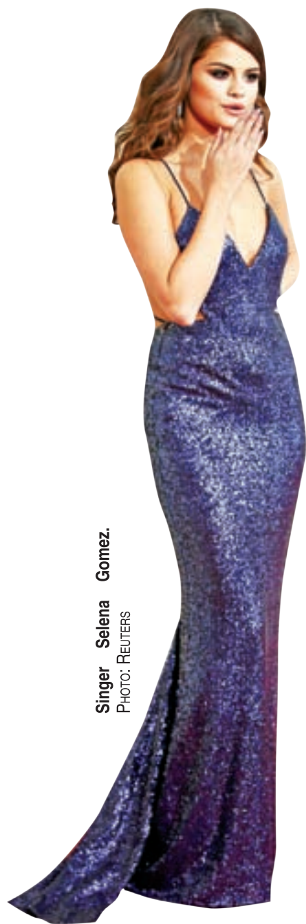
Singer Selena Gomez.

This is not the first time that Gomez has fired back at haters on social media. Back in 2014, she called out an Instagram user who said that Gomez should "burn in hell with cancer." Gomez wrote, "The comment you left about cancer was absurd. How distasteful of a young woman.—PTI