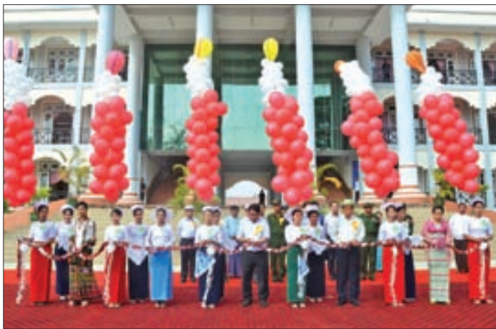
Dignitaries seen formally opening the training school for nursing and midwifery in the presence of President U Thein Sein.

The school will contribute to upgrading health standards and creating job opportunities for local people. It was formally opened by Union Minister for Health Dr Than Aung, Chief Minister of Sagaing Region U Tha Aye and Principal of the training school Dr Wai Wai Lwin.— Myanmar News Agency