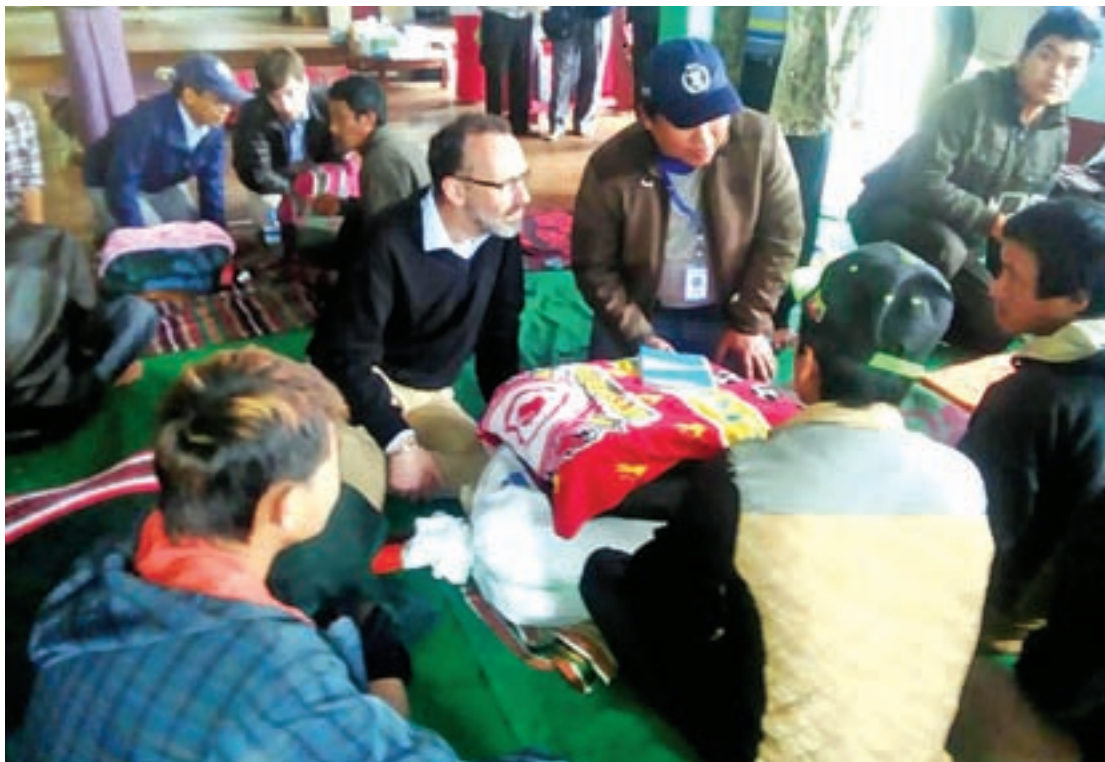
EU delegation seen visiting an IDP camp in Kyaukme.

AN EU delegation visited camps for the internally displaced persons (IDP) in Kyaukme, northern Shan State on Thursday, investigating their conditions.