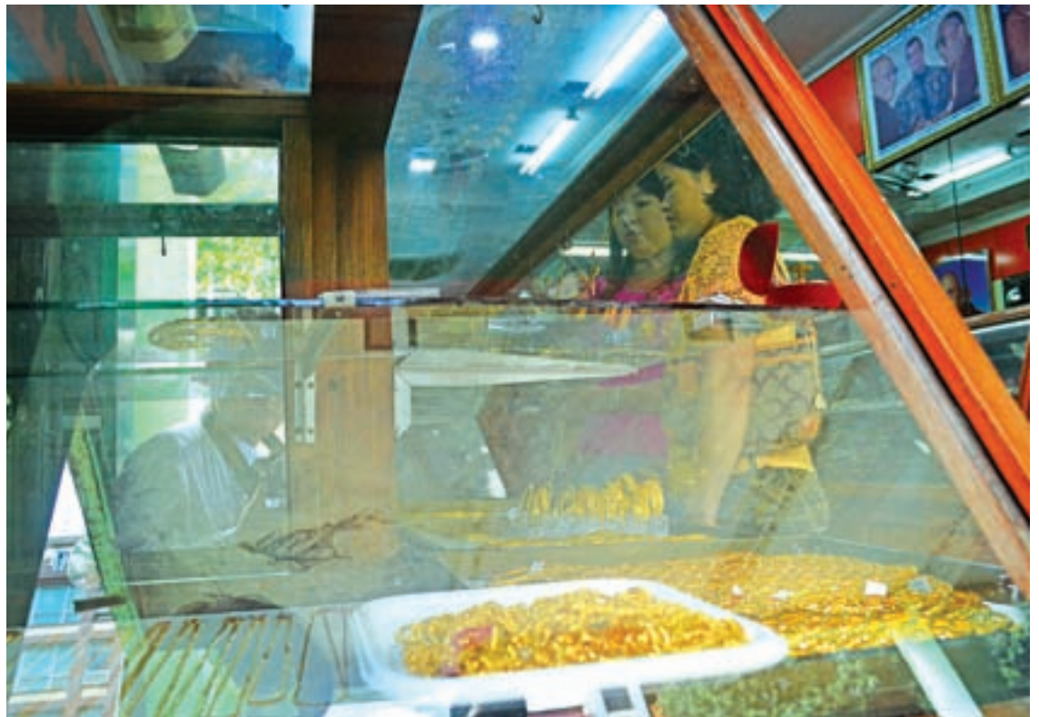
Golden jewellerys are displayed at a shop in Yangon.

In regard to how the markets fared on the evening of 22 February, the price of a tical of Myanmar pure gold fetched K795,000; a tical of 15 carat gold valued K750,000; an ounce of gold on the world market cost $1,215 while $1 bought K1,247, according to gold shopkeepers.— Myitmakha News Agency