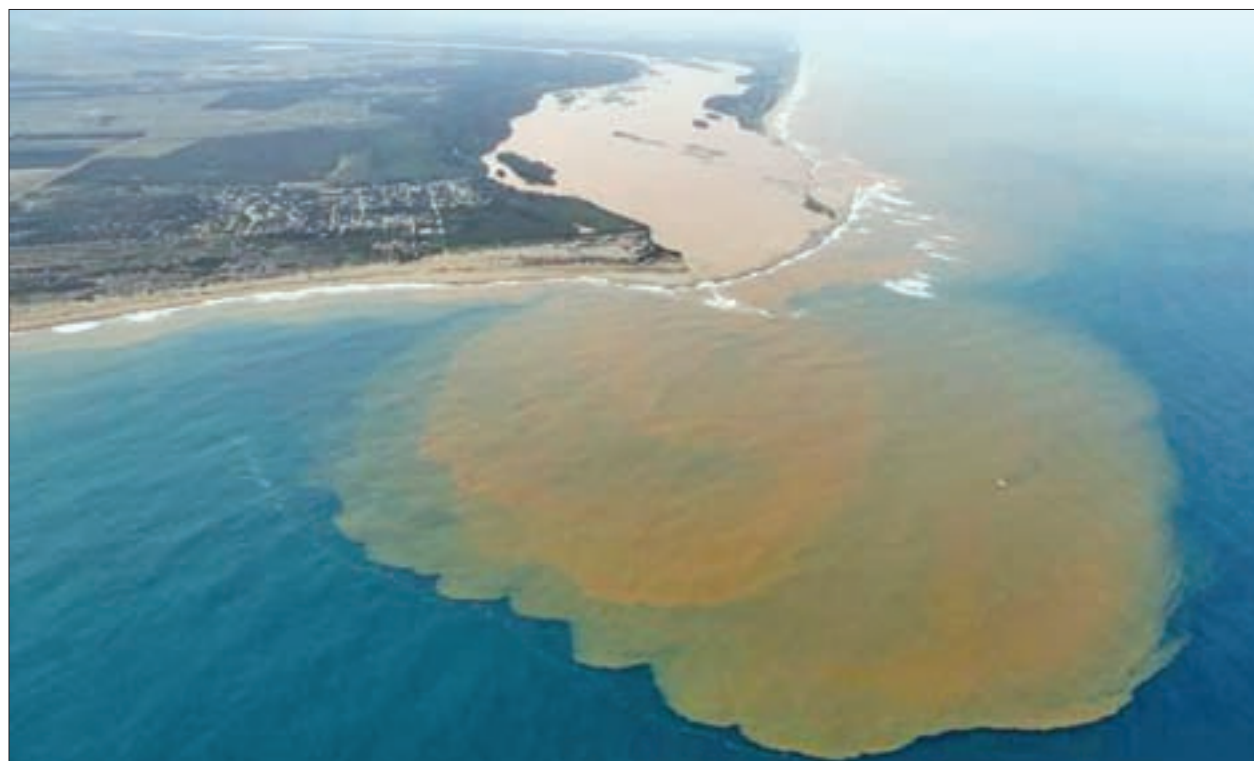
An aerial view of the Rio Doce (Doce River), which was flooded with mud after a dam owned by Vale SA and BHP Billiton Ltd burst, at an area where the river joins the sea on the coast of Espirito Santo in Regencia Village, Brazil, in 2015.