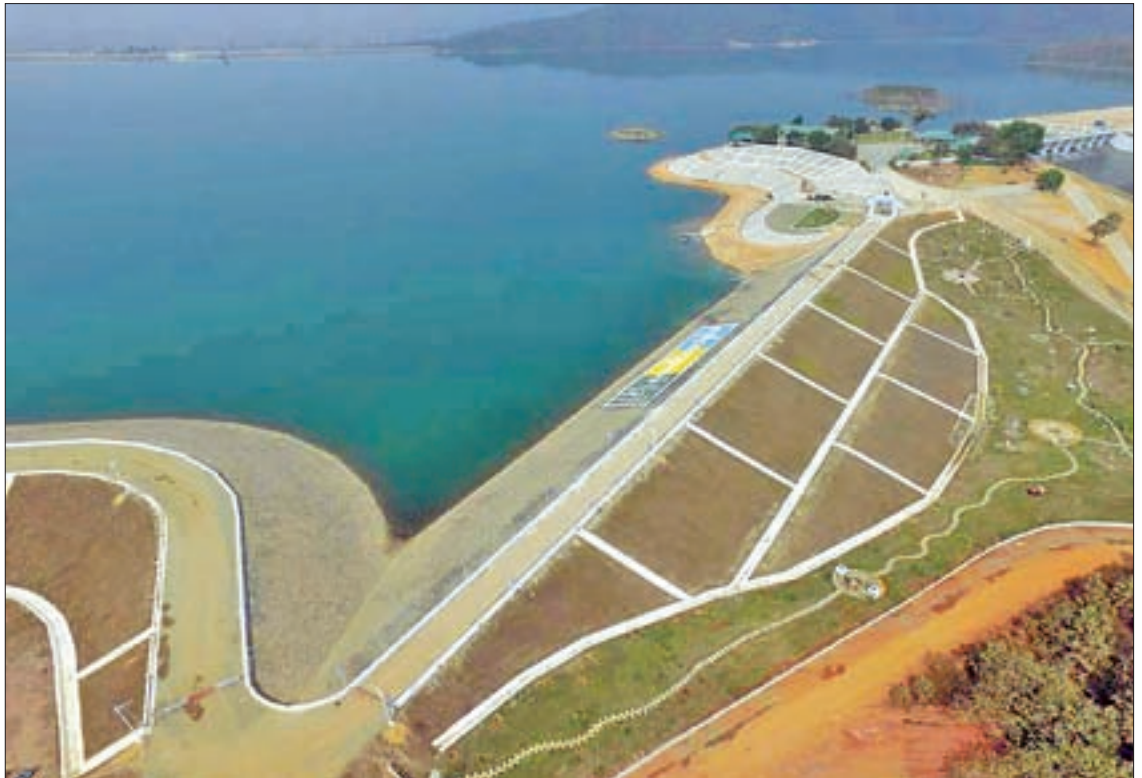
Aerial view of Yazagyo Dam.

Speaking at the meeting, the president asked the school teachers to provide quality education, to develop the rule-abiding habit, to convince them of the goodness of self-respect and to instil in them the patriotic spirit.— Myanmar News Agency