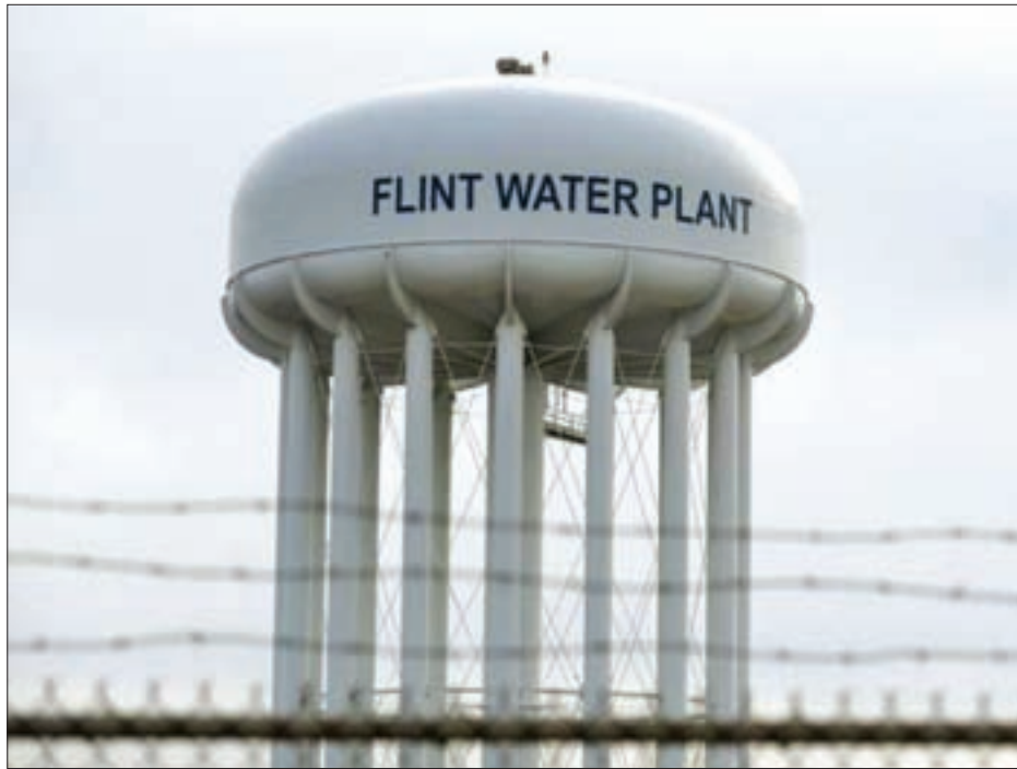
The top of the Flint Water Plant tower is seen in Flint, Michigan, on 7 February.

Snyder's aides discussed Flint's water quality problems as early as autumn 2014, with one calling the situation "downright scary,"