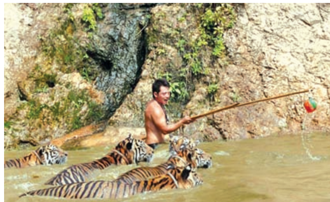
Tigers swim while being trained at the Tiger Temple in Kanchanaburi Province, west of Bangkok, Thailand 25 February 2016.