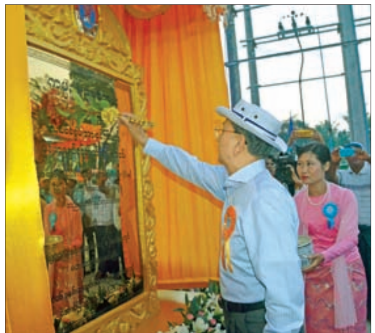
President U Thein Sein sprinkles scented water on stone plaque of the 66/11KV subpower station in Kale.

The government loses 22 kyats for every unit sold, with the union minister saying that the