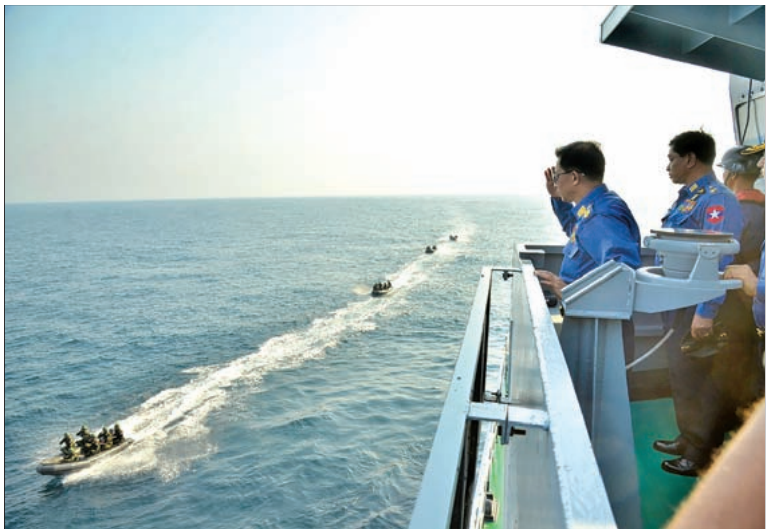
Senior General Min Aung Hlaing salutes naval forces involved in the combined fleet exercise-Sea Shield 2016.

While appreciating the naval personnel's accomplishment of mission, the Senior General explained to his men why capacity building is important and why they should always be on the alert. Afterwards, the Senior General went on to say that independence was lost because of disloyal acts (by some unscrupulous elements), that the political power, the economic strength and the defense capabilities are required to