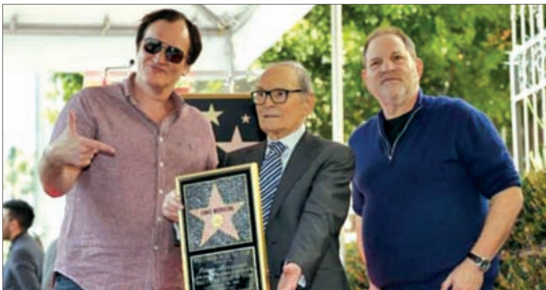
Italian composer Ennio Morricone (C) poses on his star with director Quentin Tarantino (L) and producer Harvey Weinstein after it was unveiled on the Hollywood Walk of Fame in Hollywood, California on 26 February 2016.

Roman Catholics make up about 80 per cent of a population of more than 100 million in the Philippines, where the church has strong influence, blocking legislation on the death penalty, divorce and same-sex marriage.—Reuters