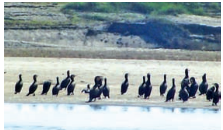
Migrant birds are seen on a sandbank in the Ayeyawady River.

However, the number of fish has decreased when compared to that of previous years as the inflow of water into the river has decreased year by year.