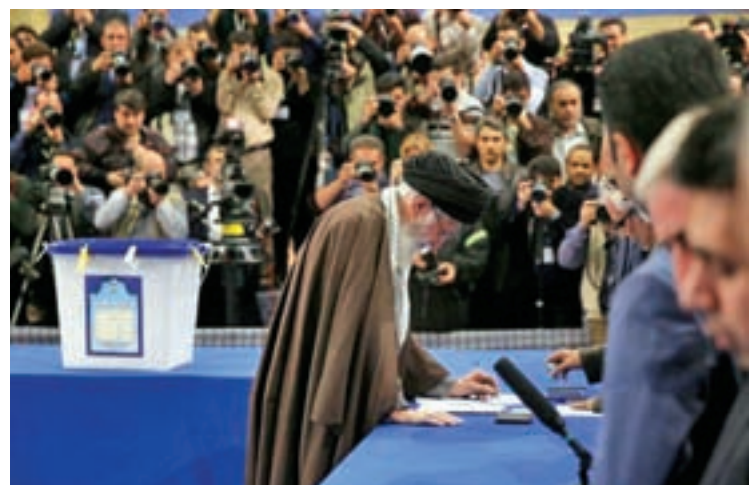
Iran’s Supreme Leader Ayatollah Ali Khamenei fills his ballot during elections for the parliament and Assembly of Experts, which has the power to appoint and dismiss the supreme leader, in Tehran, on 26 February.

TEHRAN — Iran started counting tens of millions of votes yesterday after hotly contested elections that could see reformists speed up Tehran’s opening to the world or long-dominant hardliners reassert the Islamic Republic’s traditional anti-Westernism.