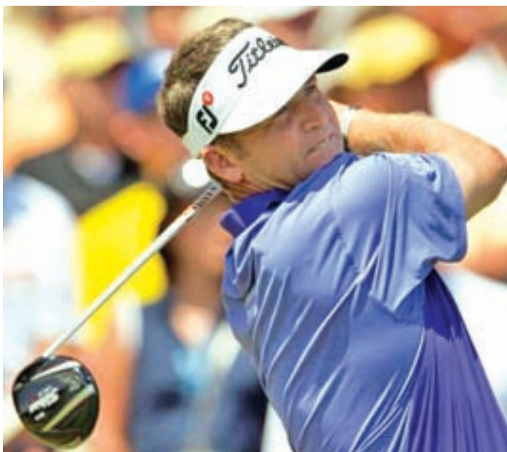
Jason Bohn of the US tees off the first hole during the final round at the Canadian Open golf tournament at the Glen Abbey Golf Club in Oakville, in 2013. PHOTO: REUTERS

Bohn, whose most recent PGA Tour win came at the 2010 New Orleans Classic, missed the cut at the Honda Classic after carding scores of 71 and 72.—Reuters