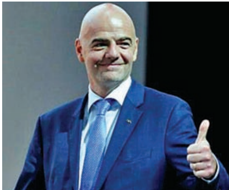
Newly elected FIFA President Gianni Infantino gives a thumb up as he arrives for a news conference during the Extraordinary FIFA Congress in Zurich, Switzerland, on 26 February.

ZURICH — Gianni Infantino vowed on Friday to lead FIFA out of years of corruption and scandal after the former UEFA general secretary was elected to succeed his Swiss compatriot Sepp Blatter as president of football's world governing body.