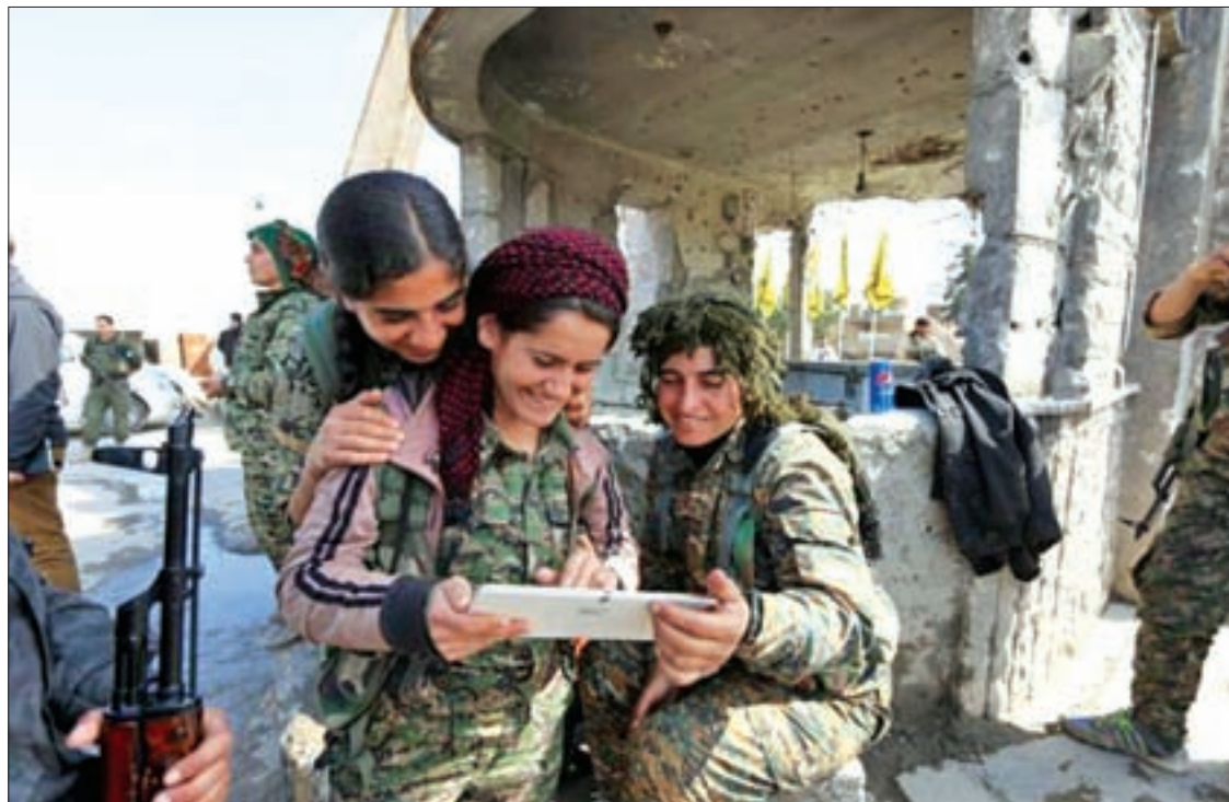
Female fighters from the Democratic Forces of Syria use a tablet in al-Shadadi town, in Hasaka Province, Syria, on 26 February.

“In Damascus and its countryside ... for the first time in years, calm prevails,” Observatory direc-