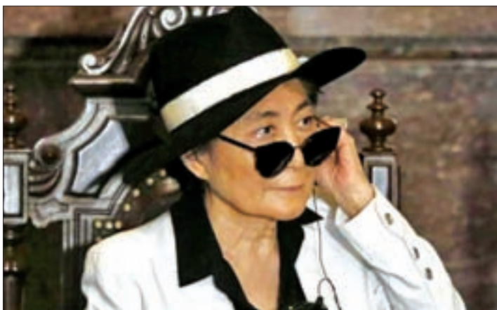
Artist Yoko Ono as she listens through an earpiece before she was honoured as 'Illustrious Visitor' by Mexico City's mayor Miguel Angel Mancera at Mexico City's town hall in Mexico City, on 3 February.

She and Lennon were married on 20 March, 1969, and their son, Sean, was born in 1975. Lennon was shot to death on 8 December 1980, outside the famed Dakota apartment building just west of New York's Central Park.—Reuters