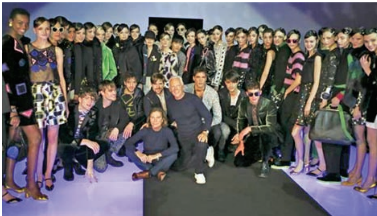
Italian designer Giorgio Armani poses with his models at the end of the Emporio Armani Autumn/Winter 2016 women's collection during Milan Fashion Week, Italy, on 26 February.

Small shapes — circles, squares and triangles — in pink, yellow, blue and green dotted the black, and a few white, coats, tops,