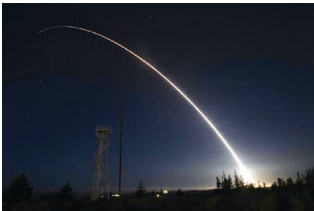
An unarmed Minuteman III intercontinental ballistic missile launches during an operational test from Vandenberg Air Force Base, California at 11:01pm on 25 February.

Work said it was the eighth consecutive successful test of a Minuteman III and the 27 th consecutive successful missile test in the nuclear force, including air-launched cruise missiles and submarine-launched missiles. — Reuters