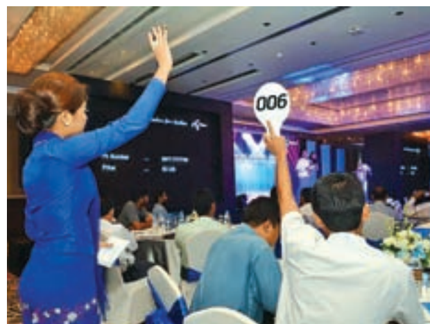
Telephone numbers are auctioned by Telenor Myanmar.

This was the first, but by no means the last, auction for Telenor, with similar auction events to be held in other States and Regions across the country, it is known.— Myitmakha News Agency