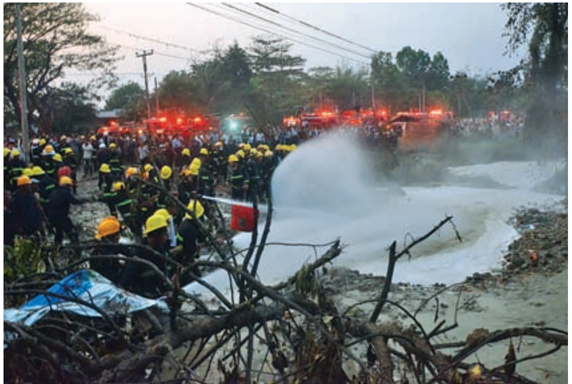
Fire fighters are bringing the gas leak fire in Shwepyitha under control. PHOTO: ZAW GYI (PANITA)

More than 400 firemen and 38 fire engines were involved in the fire fighting.— Zaw Gyi (Panita)