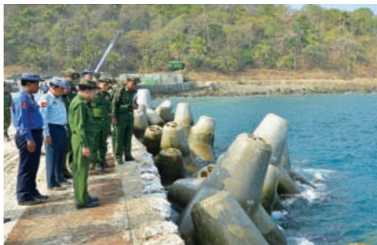
Senior General Min Aung Hlaing inspects construction of the jetty.

The Senior General and wife presented food to department personnel and the local people.