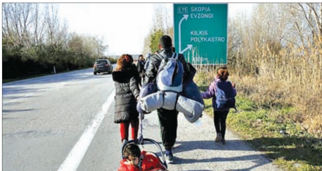
A stranded refugee pulls a crib with one of his children as his family walks along a national motorway towards the Greek-Macedonian border near the Greek town of Polykastro after ignoring warnings from Greek authorities that the border is shut, as hundreds of migrants set off on the country's main north-south motorway to Idomeni border crossing on 25 February, 2016.

BRUSSELS — Europe's cherished free-travel zone will shut down unless Turkey acts to cut the number of migrants heading north through Greece by 7 March, European Union officials said on Thursday.