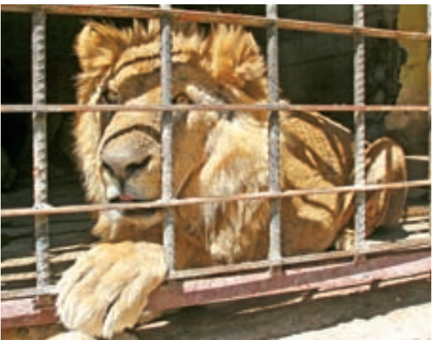
A lion sits inside its cage at a zoo in Yemen’s southwestern city of Taiz, on 22 February.

the capital Sanaa. The Houthis say it is fighting extremist groups in Taiz and around the country and denies blockading basic supplies. Residents say the Houthis have repeatedly shelled hospitals and civilian areas, while their network of checkpoints around the city mean locals must smuggle in cooking gas and bread through rutted mountain passes. A Saudi-led military coalition that backs the pro-government fighters bombs Houthi positions multiple times a day and residents live in constant fear of death. Medics in the city say at least 1,600 people have been killed in the city since the start of the war. At least 6,000 people have been killed in Yemen, according to the United Nations, around half of them civilians.—Reuters