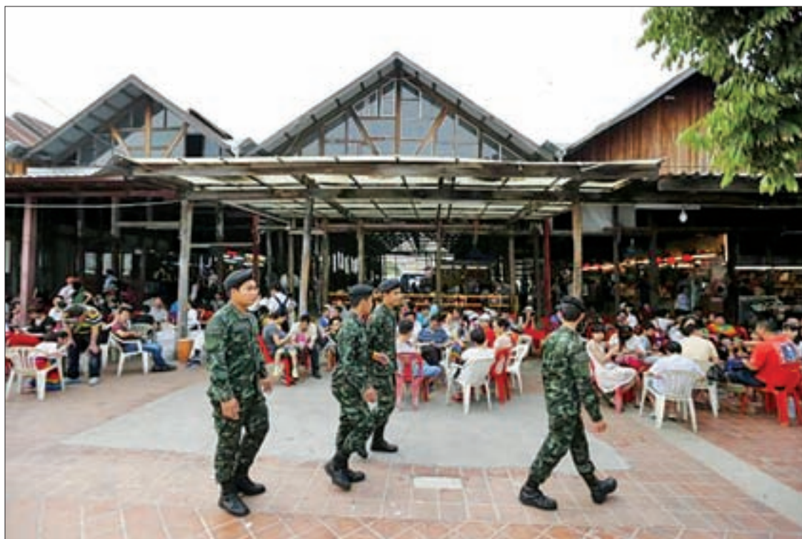
Thai army soldiers patrol a pier popular among Chinese tourists at Chao Phraya River in Bangkok on 16 February 2016.

Acknowledging that Chinese tourists were intentionally targeted could dent one of Thailand's biggest industries. A record 7.9 mil-