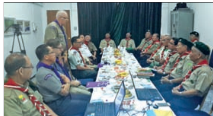
Scouts of Myanmar and Asia-Pacific Scout Committee are holding talks.