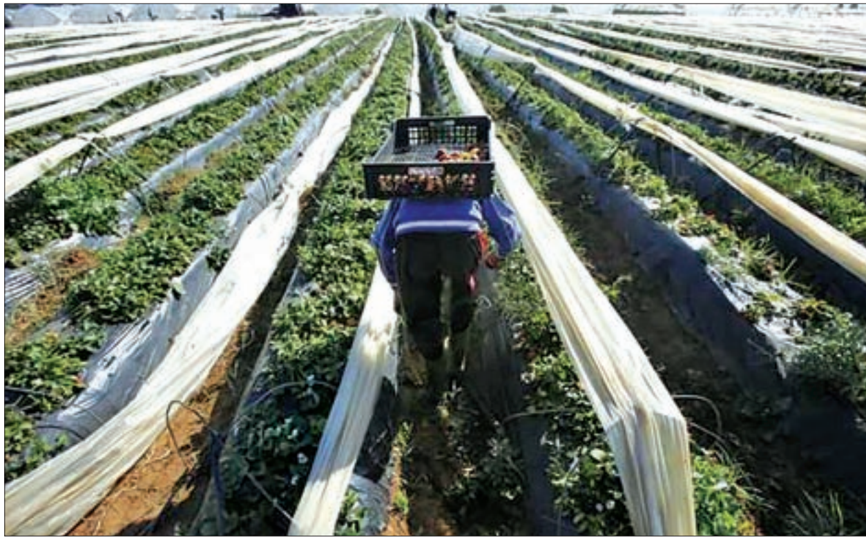
A farmer picks strawberries, to be exported, in a field in the town of Moulay Bouselham in Kenitra Province in 2014.

"Morocco cannot accept to be treated as a subject of a judicial process and to