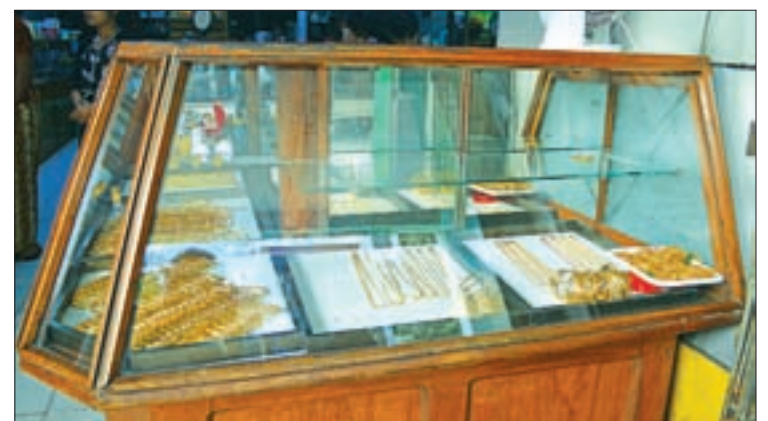
Golden jewellery are displayed at a shop in Yangon.

“The price of Myanmar gold has risen back up in the last couple of days because of the increase in the value of gold on the world market. It's difficult to estimate the trajectory of the value of gold for the coming months because of its current