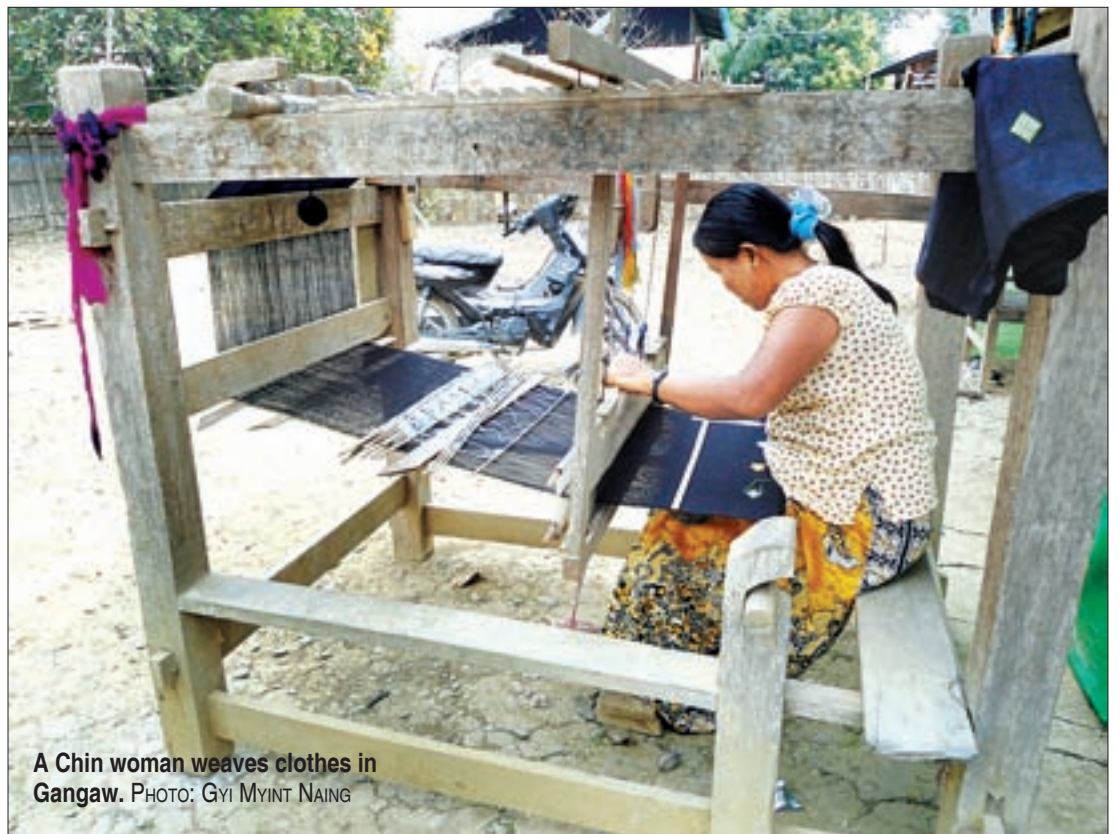
A Chin woman weaves clothes in Gangaw.