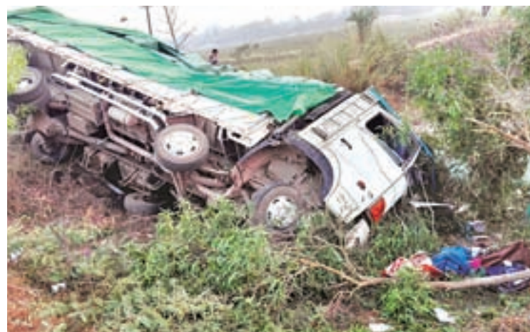
The 12-wheel truck being seen overturned.