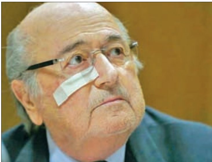
FIFA's suspended president Sepp Blatter.

Blatter told the newspaper: "And I would not accept such an offer because I am not a referee." —Reuters