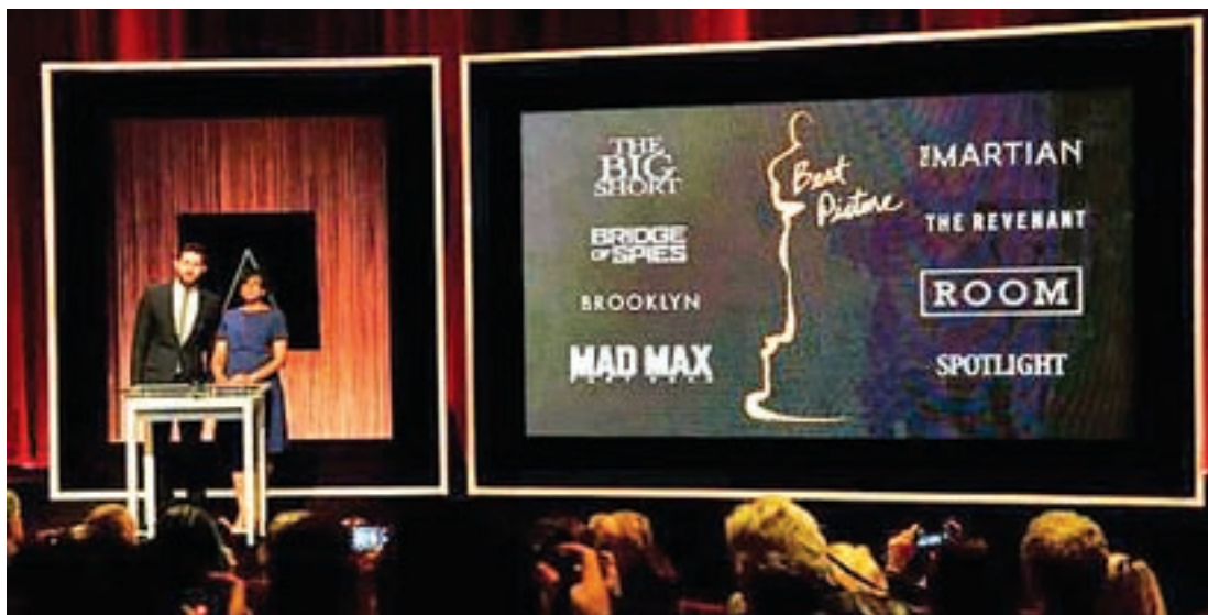
Actor John Krasinski (L) and Academy of Motion Picture Arts and Sciences President Cheryl Boone Isaacs announce the Best Picture nominees during the nominations announcements for the 88th Academy Awards in Beverly Hills, California, on 14 January.

"Brooklyn" and "Room," both female-driven films and whose leads are both nominated for best actress, are included in the pack, but neither film is predicted by awards pundits to win the best