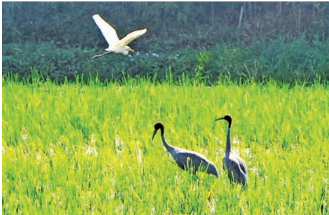
Sarus cranes, the endangered species, are native to Myanmar.

Thanda, a local observer said, "I saw two Sarus cranes last year within the compound