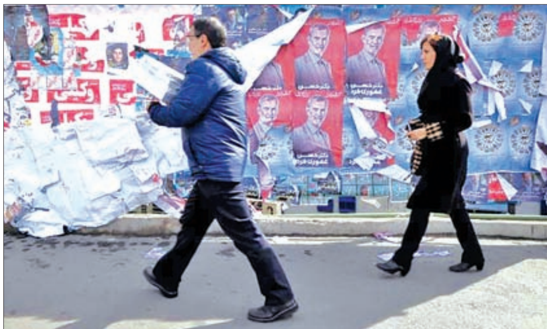
People walk past electoral posters for the upcoming parliamentary elections in central Tehran on 24 February.

Influential former president Ayatollah Akbar Hashemi Raf-