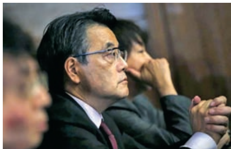
Leader of Japan's opposition Democratic Party of Japan, Katsuya Okada looks on at the plenary session for a vote on security bills at the Upper House of the parliament in Tokyo, Japan, in 2015.

TOKYO — Japan's biggest and third-largest opposition parties yesterday agreed to merge and reach out to smaller rivals, in what they hope will be a first step towards building an alternative to Prime Minister Shinzo Abe's