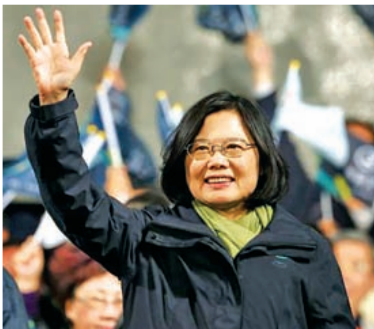
Democratic Progressive Party (DPP) Chairperson and presidential candidate Tsai Ing-wen waves to her supporters after her election victory at party headquarters in Taipei, Taiwan on 16 January 2016.

Wang said he hoped that, before Tsai assumes power in May,