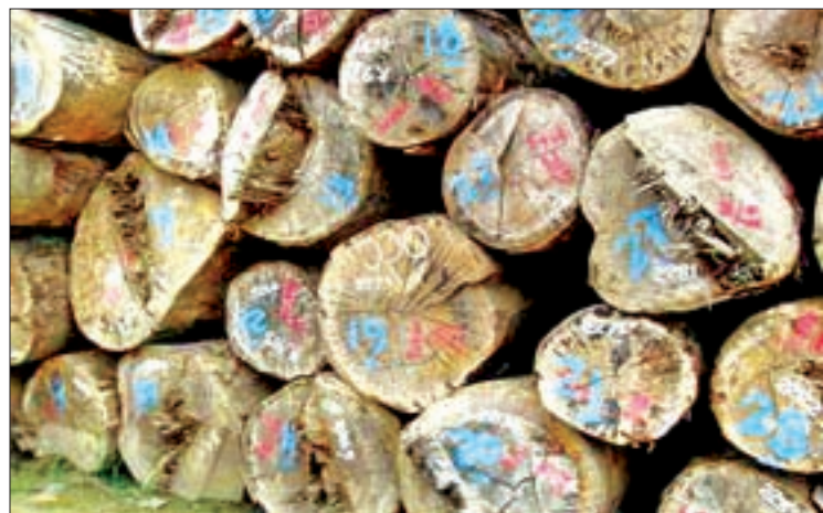
Logs to be tendered are piled in Yangon.

Apart from April, the MTE has conducted the open tender sales every month. We normally sell teak and hardwood produced from lower Myanmar—Yangon, Bago and Ayeyawady regions, Nay Pyi Taw council area, Kayah and Rakhine states—in the first week of a month and products from upper Myanmar—Sagaing and Mandalay regions, Shan and Kachin states in the third week of the month. Despite increase in both local and foreign consumption year by year the Myanma Timber Enterprise will fulfil the future market demand with an annual timber production of no more than 1,160,000 cubic tons, an official said.— Myo Min Thein (Mayangon)