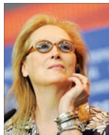
Actress Meryl Streep.

"I did not 'defend' the 'all-white jury,' nor would I, if I had been asked to do so. Inclusion —