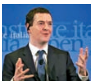
British Finance Minister George Osborne.

Osborne said he hoped G20 support for Britain staying in the EU would be an important outcome of a meeting on Friday and Saturday in Shanghai of finance ministers, the FT said, citing people close to the finance minister.