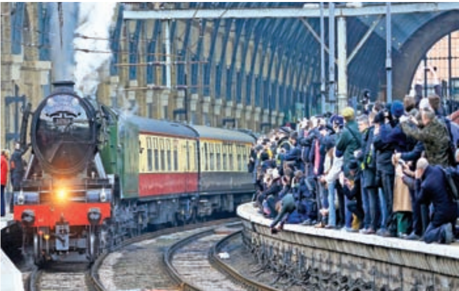
People watch from a railway platform as the Flying Scotsman steam engine prepares to leave Kings Cross station in London, on 25 February.

YORK, (England) — Legendary British steam train The Flying Scotsman returned to the tracks on Thursday after a 10-year, 4.2-million-pound ($5.9-million) refit, billowing smoke over train enthusiasts as it thundered from London to the northern city of York. Built in 1923 and now the sole survivor of its class, the train is considered a national treasure because of its longevity and popularity. It became too costly to run in 2004 but an appeal to save it attracted donations from thousands of people. “I’ve always loved