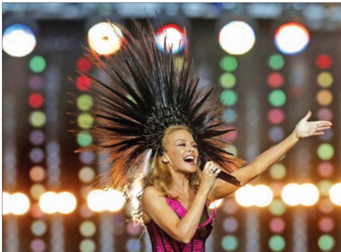
Singer Kylie Minogue.