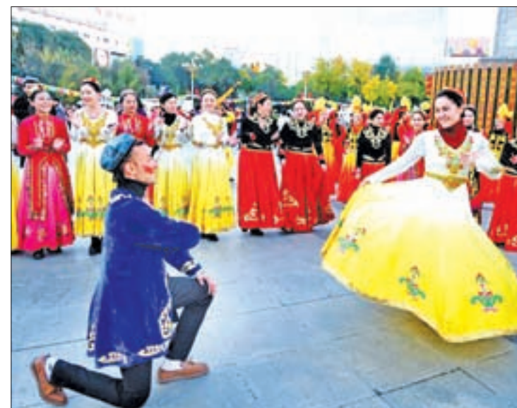
People wearing costumes perform at a square during a celebration on the 60 th anniversary of the founding of the Xinjiang Uighur Autonomous Region, in Urumqi, Xinjiang Uighur Autonomous Region, in 2015.

bilise the masses from all ethnicities to proactively and actively participate in the anti-terrorism struggle”, the paper said.