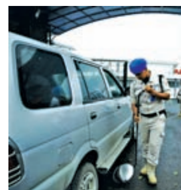
A security guard checks a car before entering the National Counter-Terrorism Agency building in Bogor, on 5 January 2016.

"We're working continuously with relevant institutions and with the public to maintain security," said Agus Rianto.—Reuters