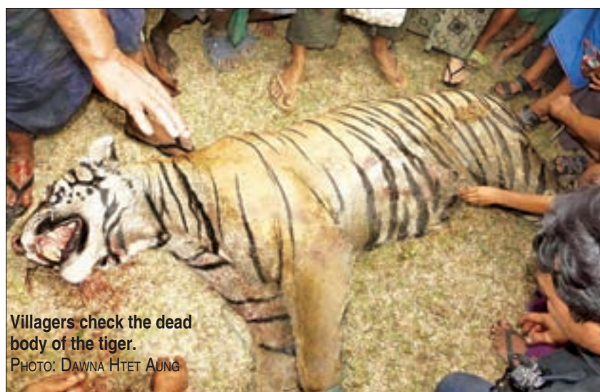
Villagers check the dead body of the tiger.

TWO people were injured in a tiger attack in Kawkayeik township, Kayin State, yesterday morning, according to a local army officer.