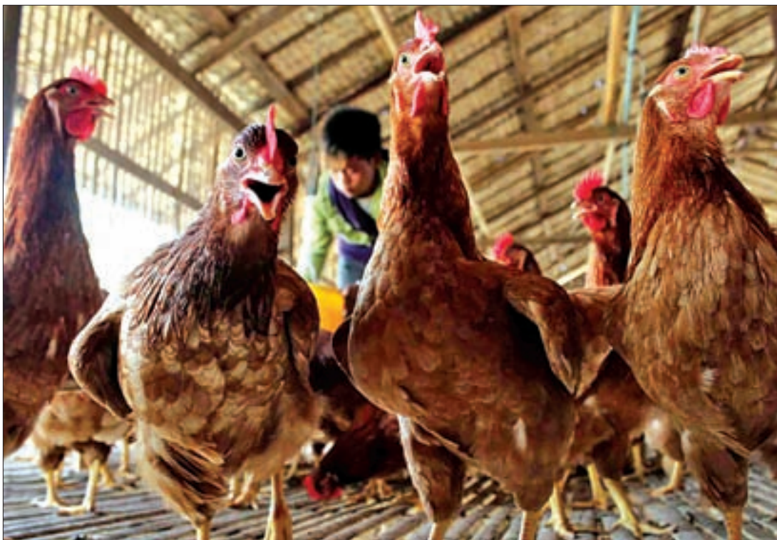
A worker feeds chicken at a farm in Tatkon.