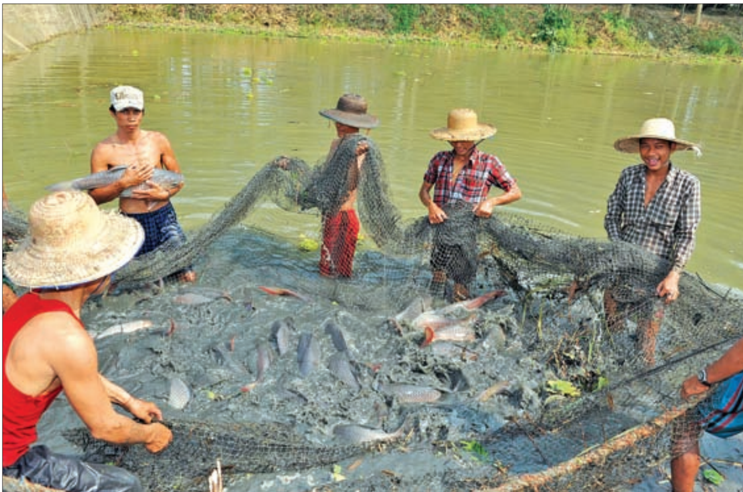
Workers are seen catching fish at a fishing farm.