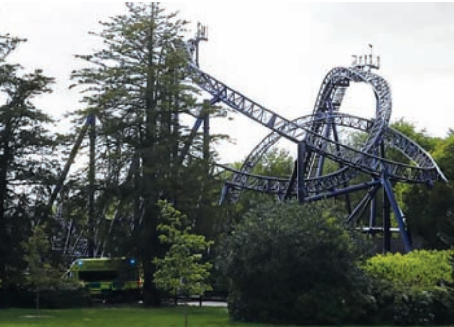
An ambulance drives past the Smiler ride at Alton Towers in Alton, Britain in June 2015.

LONDON — Merlin Entertainments (MER.L) reported flat profit for 2015, held back by a drop in visitors to its Alton Towers theme park in Britain after a rollercoaster crash in June left four people seriously injured. Merlin, the world's second-biggest visitor attractions group behind Walt Disney (DIS.N), said on Thursday it made a profit before tax of 250 million pounds in the year to 26 December. The company, which also operates attractions such as Madame Tussauds waxworks, Legoland and the London Eye, had previously forecast a result broadly in line with 2014's 249 million pounds. Like-for-like sales at the group's resort theme parks division, which includes Alton Towers, fell 12.4 per cent. Visitors stayed away from Alton Towers, one of Britain's biggest theme parks, after the "Smiler" ride crash, caused by human error, led to two teenagers having leg amputations. Visitor numbers and revenue at Merlin's other UK theme parks, including Thorpe Park and Chessington World of Adventures, also suffered. For the group as a whole, total revenue rose 3.9 per cent to 1.28 billion pounds at constant exchange rates as visitor numbers edged-up 0.3 per cent to 62.9 million. The group said it would pay a final dividend of 4.4 pence to give a total payout of 6.5p for the year, up 4.8 per cent.—Reuters