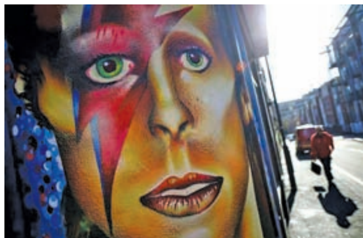
A man walks towards a mural of David Bowie in Sheffield, Britain, on 3 February.

LONDON — The late visionary British rock star David Bowie was honoured with a posthumous “Icon” award at the BRITs music ceremony in London on Wednesday night, just over a month after his death.