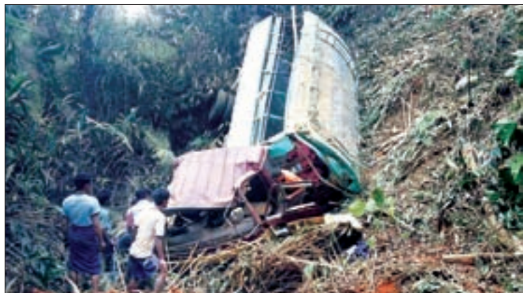
The vehicles seen after diving into the 80 foot ravine. PHOTO: MAUNG MUANG HTAY (IPRD)

was caused by overloading. The vehicle conductor and all five passengers sustained serious injuries. They are now receiving medical care at Thandwe general hospital.— Maung Muang Htay (IPRD)