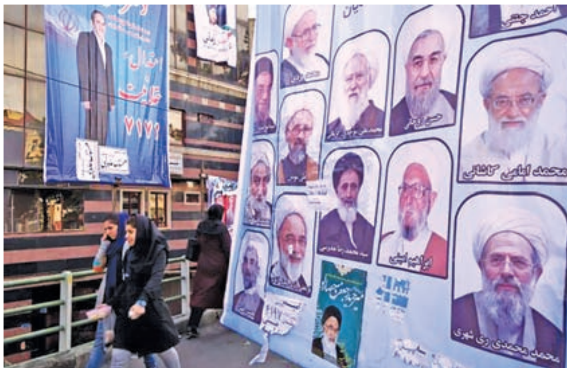
Women walk past electoral posters for the upcoming elections in central Tehran on 24 February.

"They complain (about) why we talk about infiltration all the