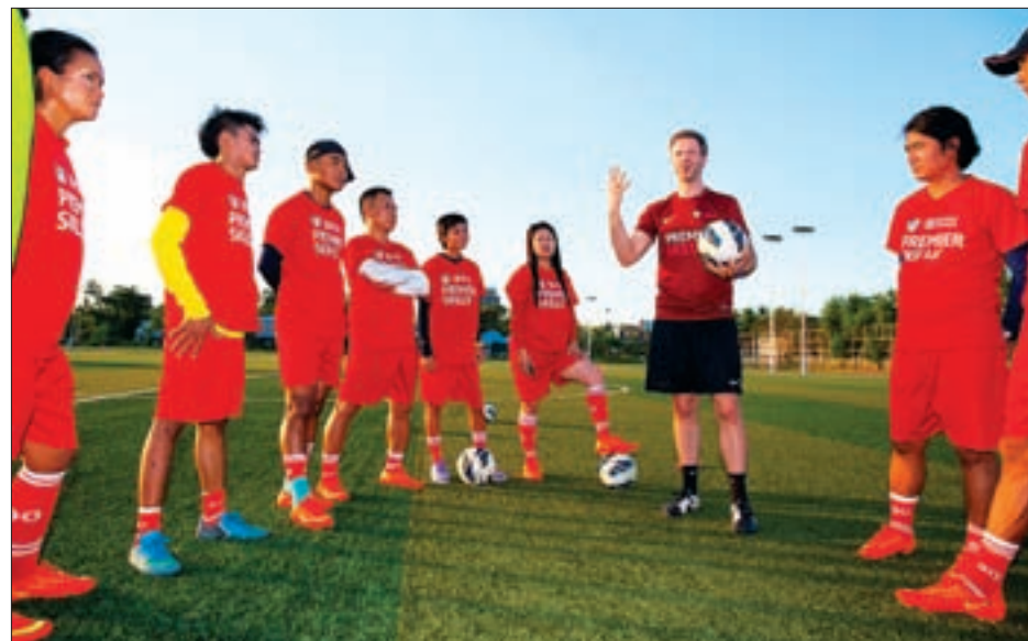
British Council in cooperation with Premier League.

A total of 12 local basic football trainers across the country were selected to attend the course,