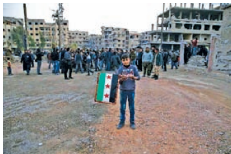
A boy carries an opposition flag as rebel fighters and civilians gather during the arrival of an aid convoy of Syrian Arab Red Crescent and United Nation (UN) to the rebel held besieged town of Kafr Batna, on the outskirts of Damascus, Syria on 23 February 2016.

BEIRUT/WASHINGTON — Syria's opposition indicated on Wednesday it was ready for a two-week truce in Syria, saying it was a chance to test the seriousness of the other side's commitment to a US-Russian plan for a cessation of hostilities.