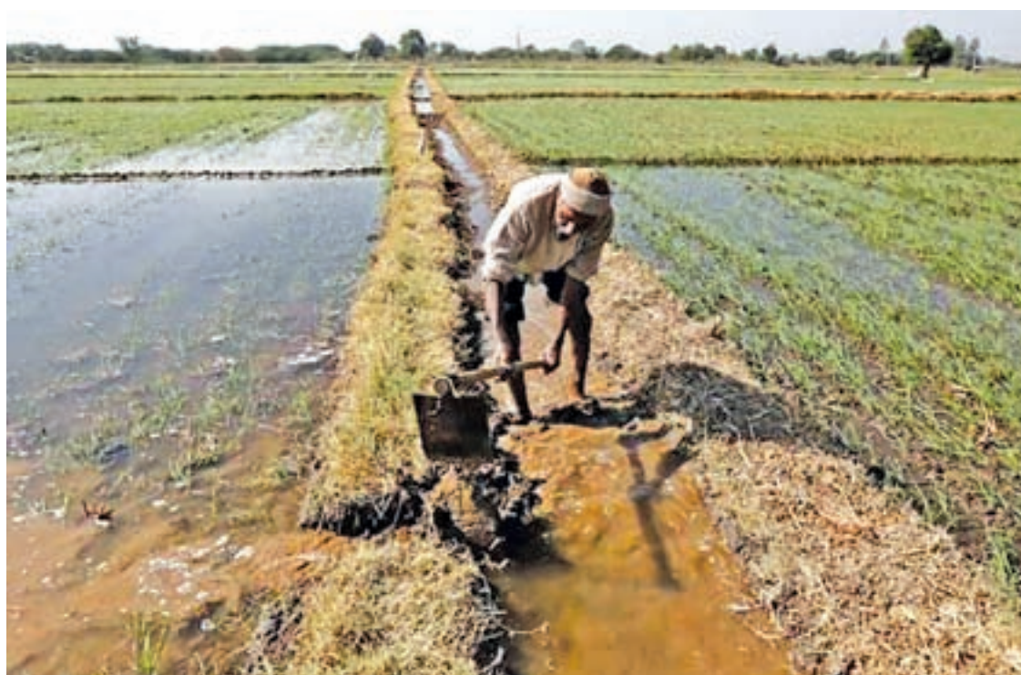
A farmer channels water to irrigate his wheat field on the outskirts of Ahmedabad, India, in December 2015.