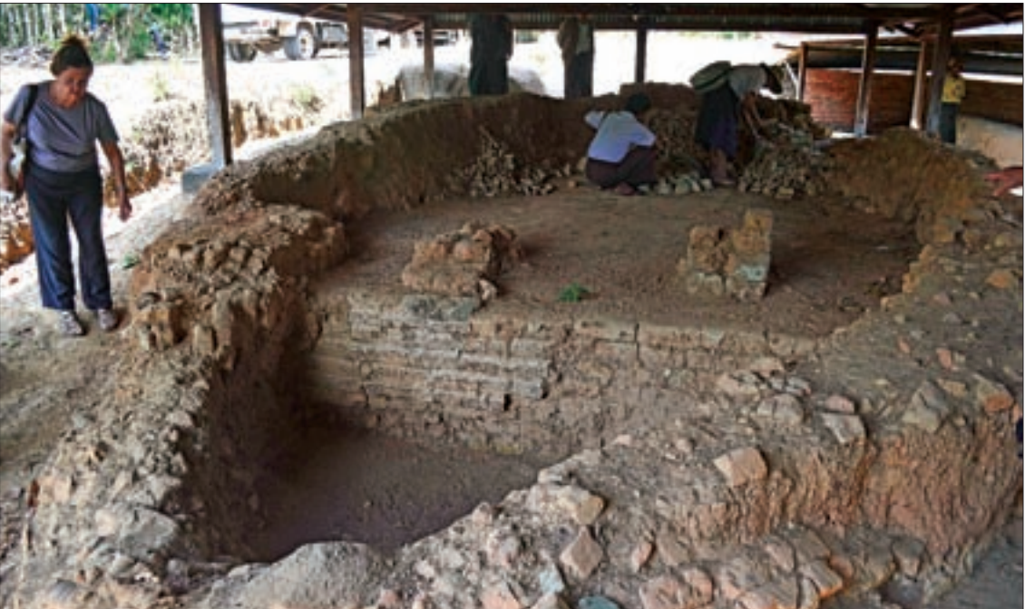
People visit an ancient kiln in Twantay, about 20 miles south of Yangon.

on the site of a earthen kiln located in Kawpalaing village, twenty odd miles from Mawlamyine, during which shards of large pots were discovered, leading to the belief that it was the former site of such a large scale pot producing earthen kiln. Furthermore, other pieces of pot were found in another plot of land within the same village, although the mound in which they were originally discovered has long since been destroyed, it is known.