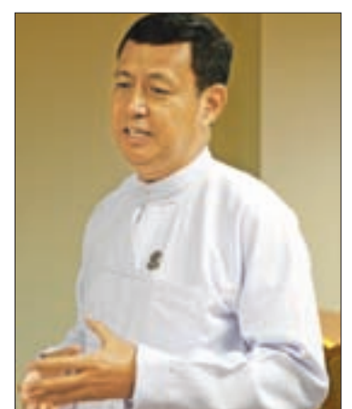
Union Minister for Information U Ye Htut.

Though members of the Union government will not appear in parliament, they will clarify to the people the issues raised by MP Daw Khin San Hlaing, the Union minister said.— Myanmar News Agency