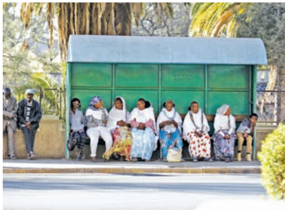
Passangers wait for public transport at a bus-stop in Eritrea's capital Asmara, on 20 February 2016.

Eritrea is raising national service salaries, printing new local currency notes to deter people-traffickers and investing in mining and other sectors, but diplomats are not convinced it is doing enough to retain its young