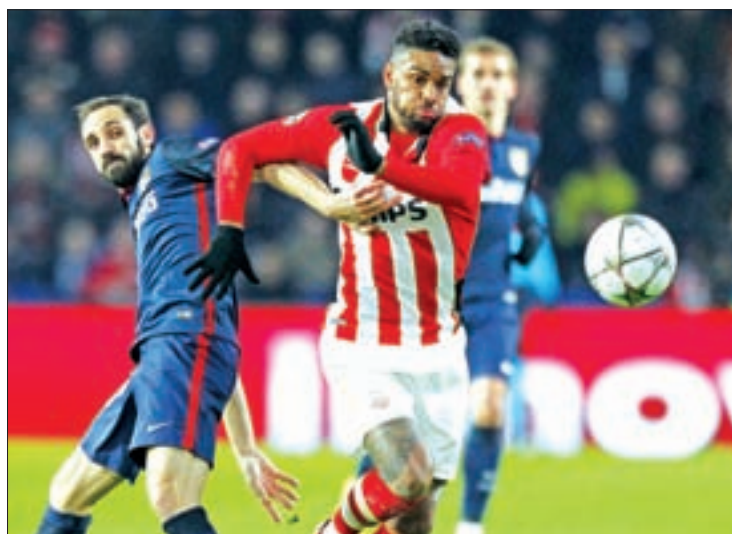
Atletico Madrid's Juanfran in action against PSV Eindhoven's Jurgen Locadia (R) during UEFA Champions League Round of 16 First Leg at PSV stadium, Eindhoven, Netherlands, on 24 February 2016.

were super good and super quick," PSV defender Jeffrey Bruma told reporters.