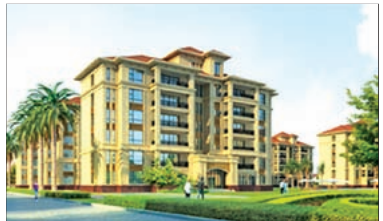
A scale model of Grand ACE Villa Project.

So far, 902,000 tons of beans and pulses have been exported, earning US$ 856 million, up to 22 January this year.