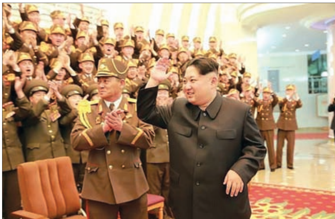
North Korean leader Kim Jong Un (R) waves during a concert marking the 70 th founding anniversary of the Korean People’s Army (KPA) military band in this undated photo released by North Korea’s Korean Central News Agency (KCNA) in Pyongyang on 23 February.