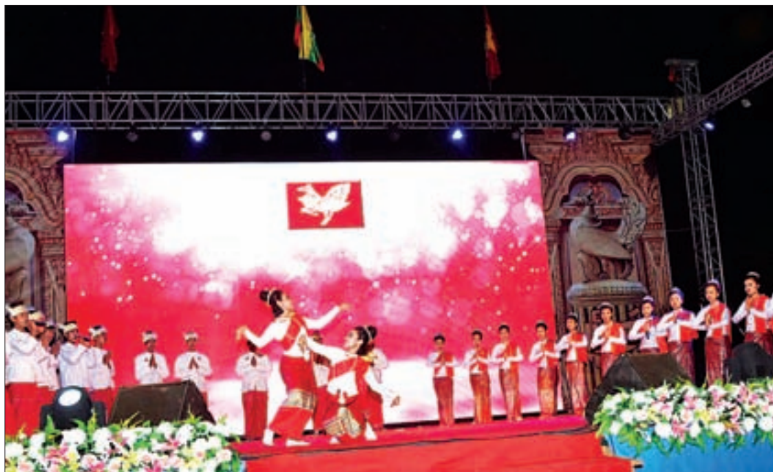
69 th anniversary Mon National Day in progress.

YANGON'S MON community celebrated the 69th Mon National Day at People's Square and People's Park on 24 February with a wide range of entertainment programmes.