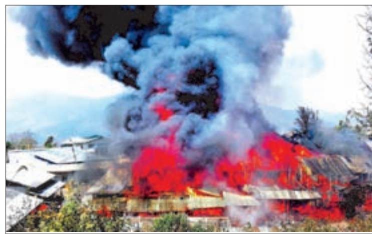
Fire breaking out at Mindat municipal market.