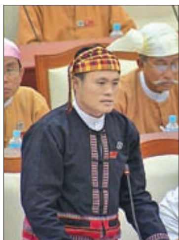
U Lagan Zal Jon.