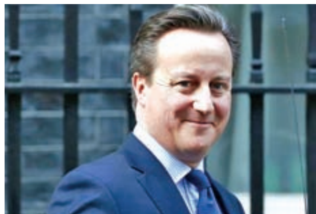
Britain's Prime Minister David Cameron leaves 10 Downing Street to travel to the Houses of Parliament in central London, Britain, on 22 February.

UNITED NATIONS — Britain on Wednesday registered with the United Nations a deal on new terms for its membership in the European Union ahead of a 23 June national referendum on whether Britain should stay or quit the