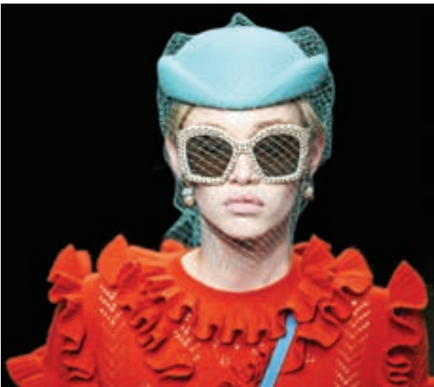
A model presents a creation from the Gucci Autumn/Winter 2016 woman collection during Milan Fashion Week, Italy, on 24 February.

MILAN — Six days of catwalk shows began in Milan on Wednesday with Italian luxury brands Gucci, Fay and Roberto Cavalli among the first to show the creations their designers hope will fill women's wardrobes next winter. In a first, Italian Prime Minister Matteo Renzi kicked off Milan Fashion Week with an industry lunch as international journalists and buyers descended on the city, home to fashion giants like Giorgio Armani and Prada. Gucci, which last week reported a forecast-beating sales rebound in the fourth quarter, presented a vibrant and colourful autumn/winter 2016/2017 collection, which designer Alessandro Michele called "Rhizomatic Scores". From one-colored outfits — including a pink furry coat teamed with pink tights, shoes, scarf and bag — to clashing print combinations and designs emblazoned with snake patterns,