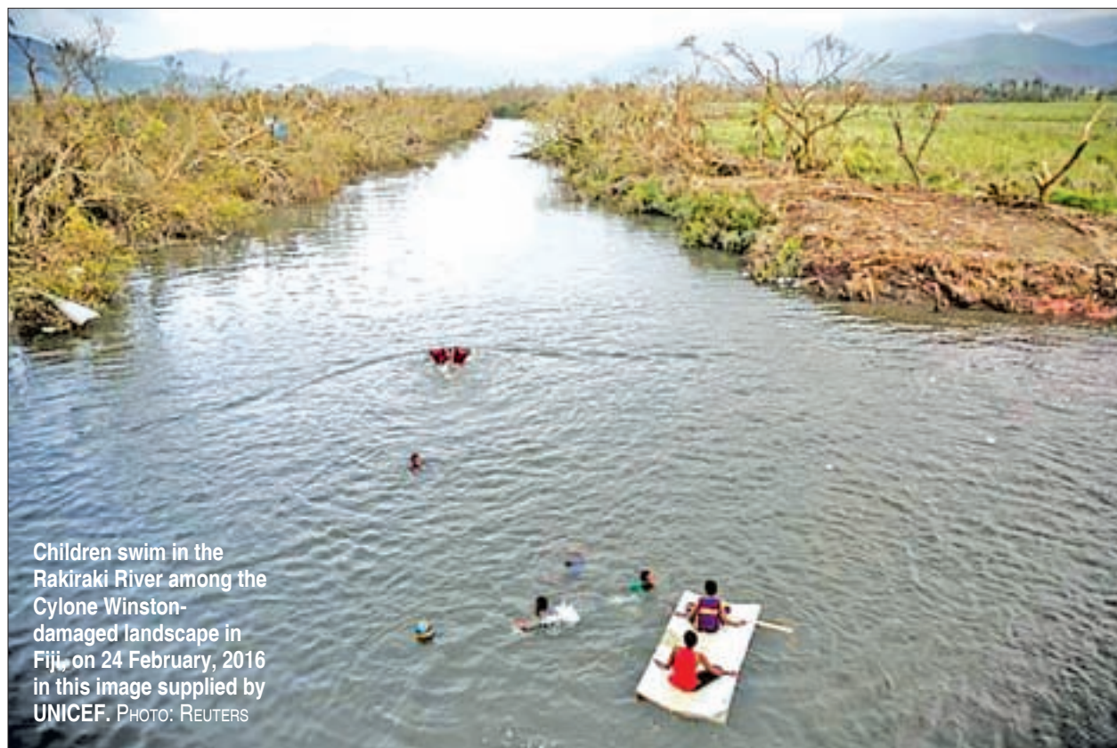
Children swim in the Rakiraki River among the Cyclone Winston-damaged landscape in Fiji, on 24 February, 2016 in this image supplied by UNICEF. PHOTO: REUTERS