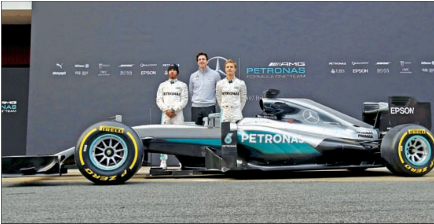
Mercedes Formula One drivers Lewis Hamilton of Britain (L), Nico Rosberg of Germany (R) and the team's Executive Director Toto Wolff pose behind the new Mercedes F1 W07 hybrid car before the first testing session ahead of the upcoming season at the Circuit Catalunya-Barcelona in Montmelo, Spain, on 22 February.