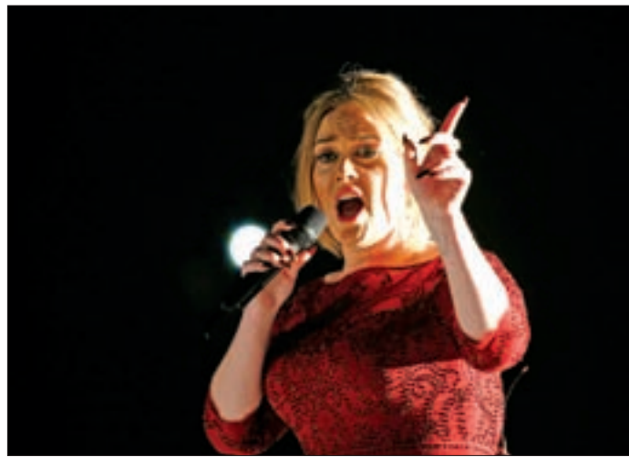
Singer Adele performs “All I Ask” on stage at the 58th Grammy Awards in Los Angeles, California on 15 February.

On the Digital Songs chart, which measures online song sales, Flo Rida’s “My House” held the top spot for a second week with 135,000 copies sold.—Reuters