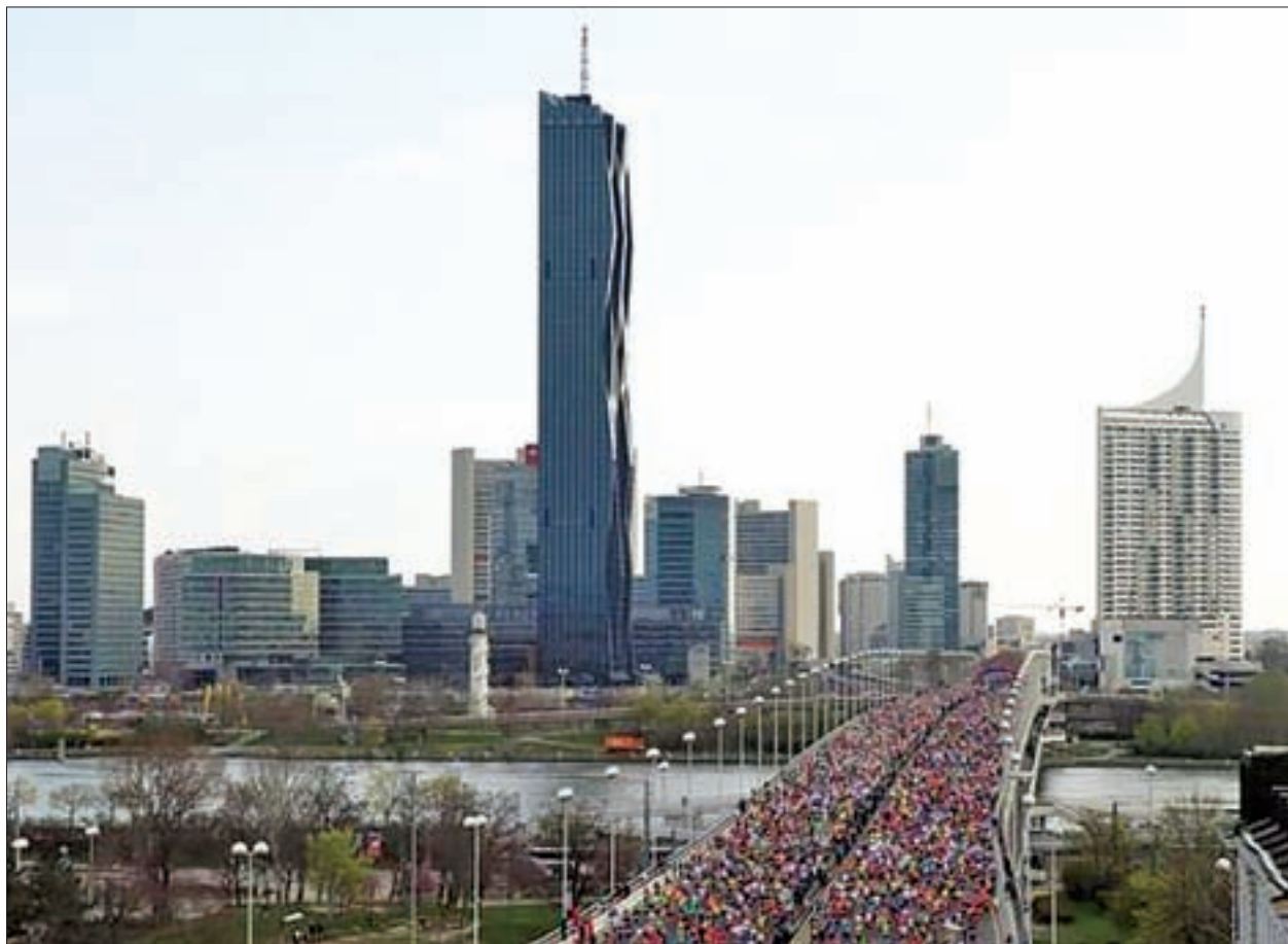
Runners cross the river Danube at Reichsbrücke bridge minutes after the start of the Vienna City Marathon in Vienna in 2015.

Baghdad was again ranked lowest in the world. Waves of sectarian violence have swept through the city since the American-led invasion in 2003.— Reuters