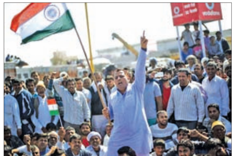
Demonstrators from the Jat community shout slogans as they block the Delhi-Haryana national highway during a protest at Sampla village in Haryana, India, on 22 February.

with at least 850 trains cancelled, 500 factories closed and business losses estimated at as much as $5 billion by one regional lobby group. India's largest car maker, Maruti Suzuki, shut two factories at the weekend because its supply of components was disrupted.