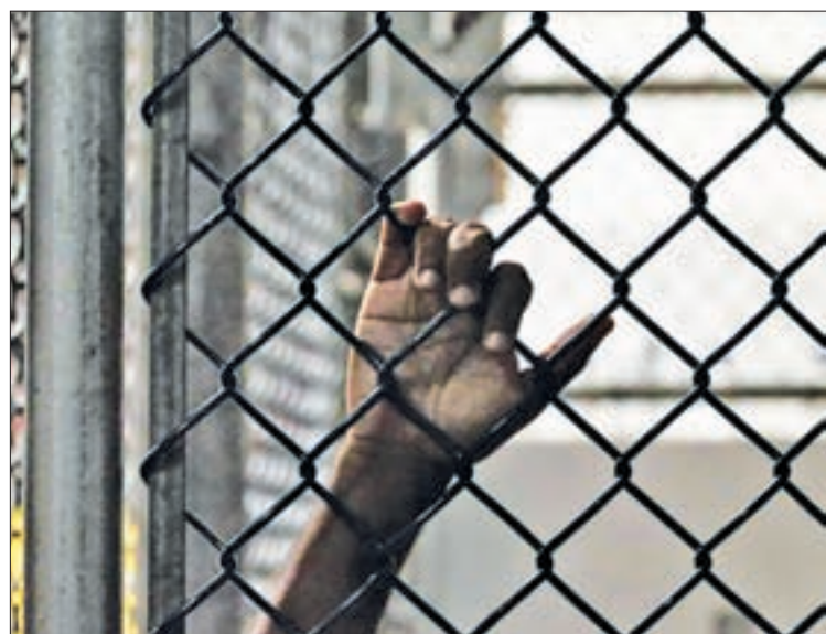
A Guantanamo detainee holds onto a fence inside the Camp 6 high-security detention facility at Guantanamo Bay US Naval Base in 2010.