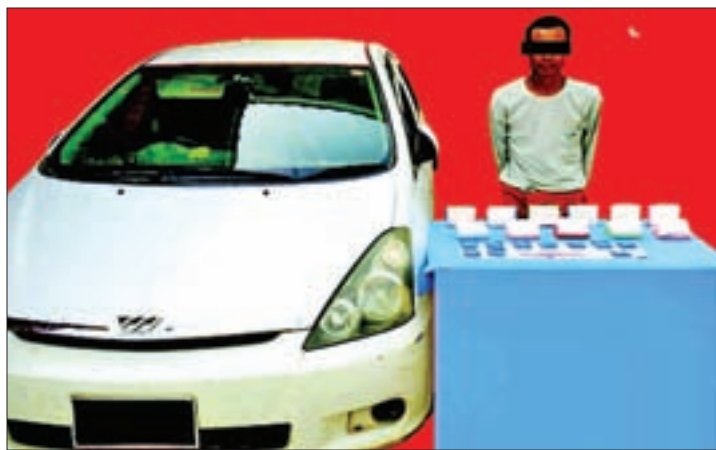
Sai Aik Paung. PHOTO: KYEMON

LOCAL Anti-Drug Squads could seize over 2,000 yabba pills and nearly one kilogram of marijuana within the two days in Shan State and Yangon Region.