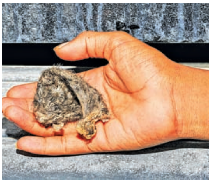
Edible bird's nest.

The current regional price for one viss (1.54 kilos) of black edible bird's nest fetches approximately K300,000, while white edible bird's nests are significantly more valuable, with the same weight going for as much as K6 million.— Myit-makha News Agency