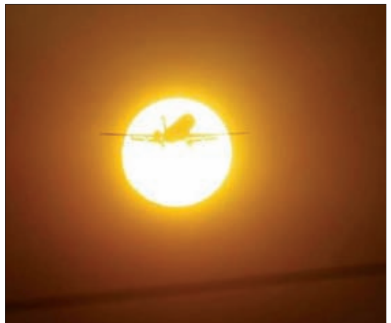
An aeroplane flies at sunset in Brasilia in 2011.

"When the industry banned the shipment of lithium-metal batteries, we saw instances of them being passed off as lithium ion batteries," said the expert, who was not authorized to speak publicly. "Those people who are not complying now won't comply with a prohibition."—Reuters