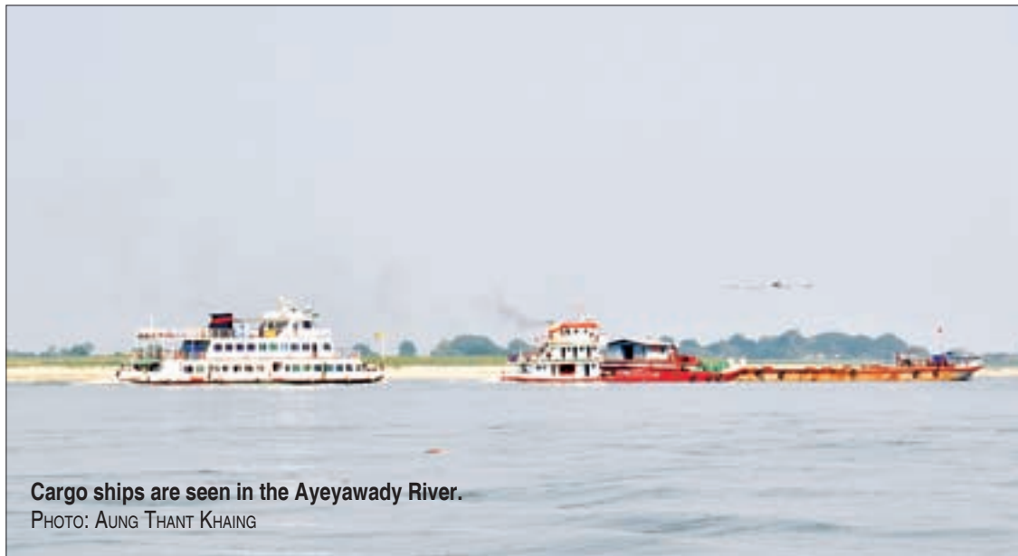
Cargo ships are seen in the Ayeyawady River.