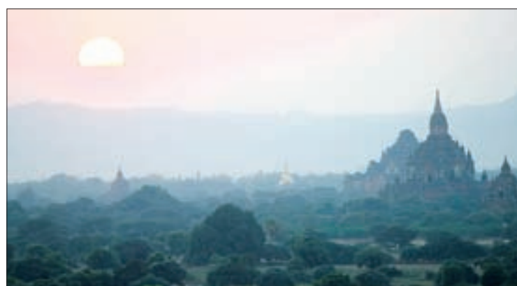
A popular destination: Ancient Bagan temples at sunset.

Tourist operators to Bagan have said the climbing of delicate