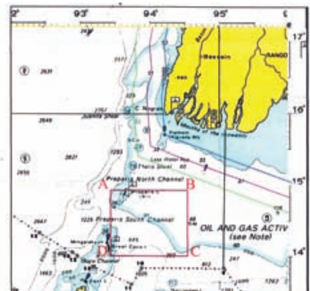
The map shows Combined Fleet Exercise (Sea Shield-2015).

The area has four points— A, B, C and D where A is between North Latitude 14 degree 56 minutes and East Longitude 93° 26', B is between North Latitude 14° 56' and East Longitude 94° 33', C is between North Latitude 14° 00' and East Longitude 94° 33' and D is between North Latitude 14° 00' and East Longitude 93° 26'