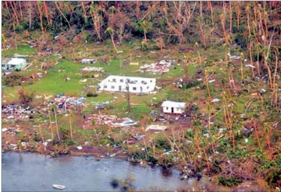
A remote Fijian village is photographed from the air during a surveillance flight conducted by the New Zealand Defence Force, on 21 February.

Prime Minister Frank Bainimarama reassured Fijians that the government was doing all it could amid growing criticism of the