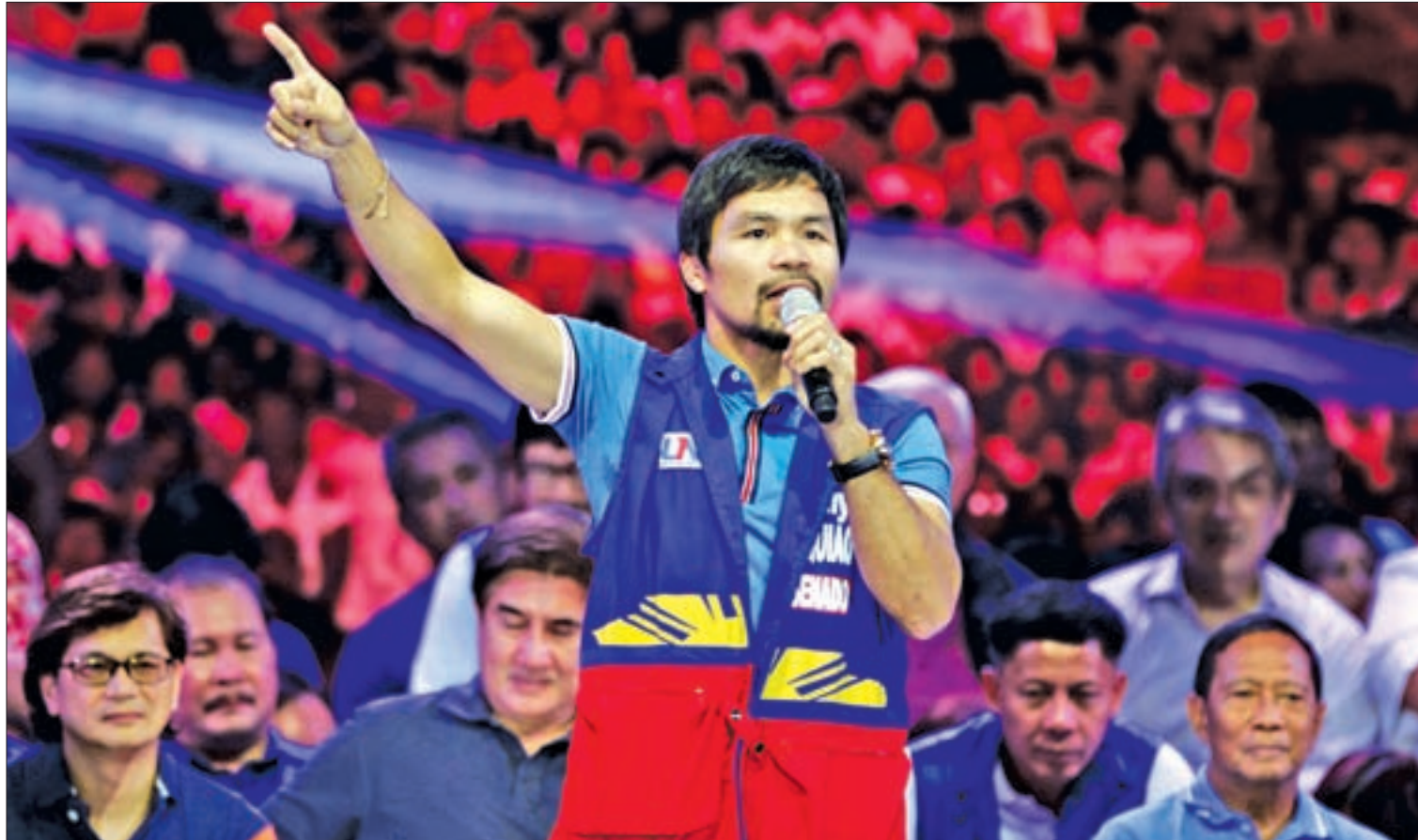
Filipino boxer Manny Pacquiao, who is running for Senator in the May 2016 national elections, speaks to supporters during the start of elections campaigning in Mandaluyong city, Metro Manila on 9 February.

MANILA — The Philippine election commission will decide on Tuesday whether a boxing match between Manny Pacquiao, who is standing in May's vote, and American welterweight champion Timothy Bradley violates polling rules.