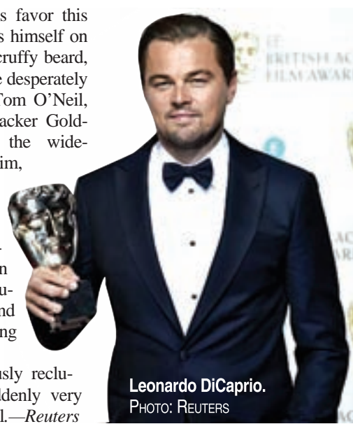
Leonardo DiCaprio.

“He’s a notoriously reclusive star who is suddenly very available,” said O’Neil.—Reuters