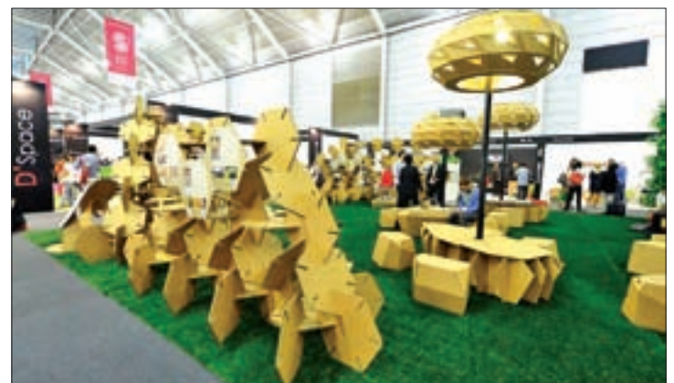
Furniture being display at the Singapore EXPO Convention and Exhibition Centre.

Six Myanmar Companies—two companies from the Wood Based Furniture Association and four from the Myanmar Rattan and Bamboo Entrepreneurs Association—will showcase their furniture products through 10 booths.—Soe Win (MLA)