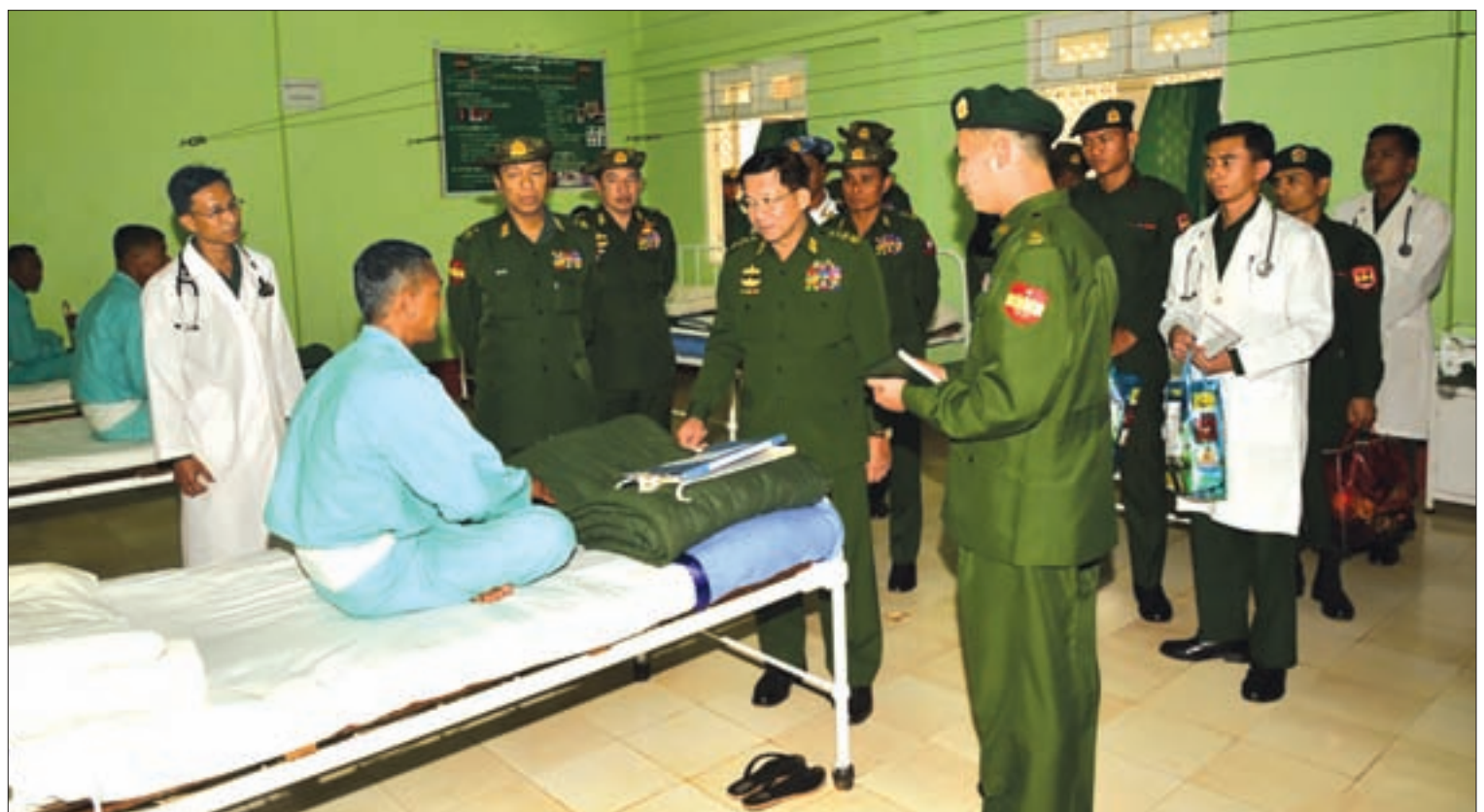
Senior General Min Aung Hlaing comforts members of the Tatmadaw receiving treatment at the military hospital.

If you look at the history of independence struggle, he claimed, our national leaders were assassinated by the disloyal traitors. And what is more, the nation has been faced with the threat of disintegration posed by the disloyal armed troops in the