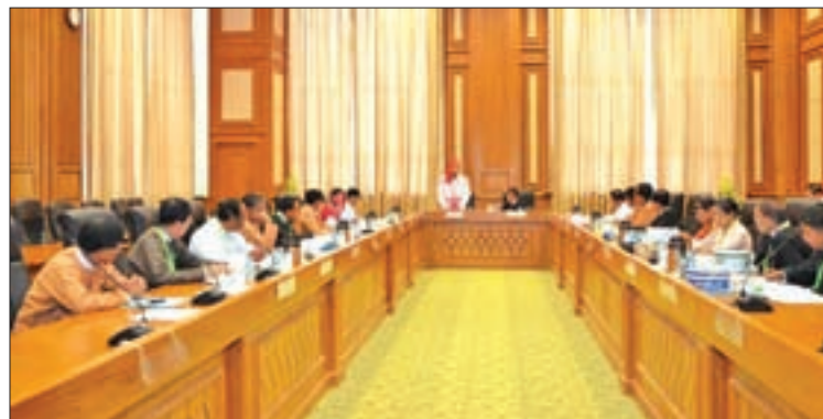
MPs discuss formation of Myanmar Parliamentary Union in Nay Pyi Taw.

SPEAKERS of Union and Region/State Parliaments approved the formation of Myanmar Parliamentary Union for the second