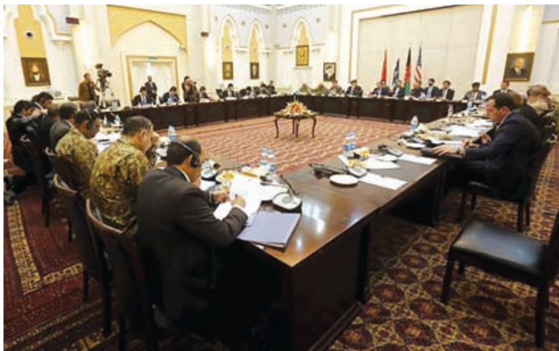
Delegations from Afghanistan, Pakistan, United States and China discuss during a meeting in Kabul, Afghanistan on 23 February.

On Monday, the powerful chief of the Pakistan army, Gen. Raheel Sharif met officials from Qatar, where the Taliban maintains a political office, to prepare the way for Tuesday's meeting, the fourth in a series of