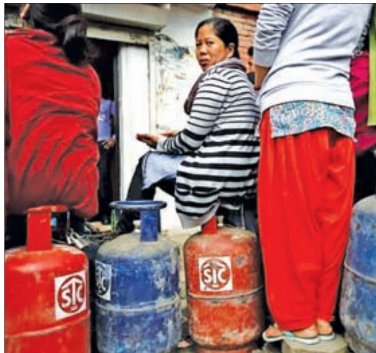
A woman sits on top of their empty cooking gas cylinders while waiting in a queue to buy cooking gas during the ongoing fuel crises that has been continuing for over a month now in Kathmandu, Nepal in October 2015.

KATHMANDU — Nepal ended months-long fuel rationing after supply from India improved, following the end of a border blockade by ethnic protesters against a new constitution, an official said yesterday.