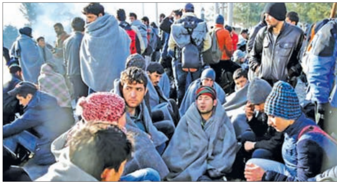
Migrants rest next to a border fence at the Greek-Macedonian border, after additional passage restrictions imposed by Macedonian authorities left hundreds of them stranded near the village of Idomeni, Greece, on 23 February, 2016.

ATHENS — Greek police started removing migrants from the Greek-Macedonian border yesterday after additional passage restrictions imposed by Macedonian authorities left hundreds stranded while more were ferried from islands to Greece's main Piraeus port.