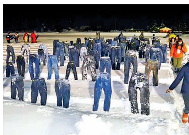
Pairs of jeans, frozen after being soaked in water and then exposed to the bitter cold outside, are erected in the snow in Sarabetsu village in Japan's northernmost prefecture of Hokkaido on 21 February, 2016.

KUSHIRO — A total of 295 pairs of frozen jeans were set up to stand in the snow Sunday in Sarabetsu village in Japan's northernmost main island of Hokkaido in an effort to secure recognition from Guinness World Records.