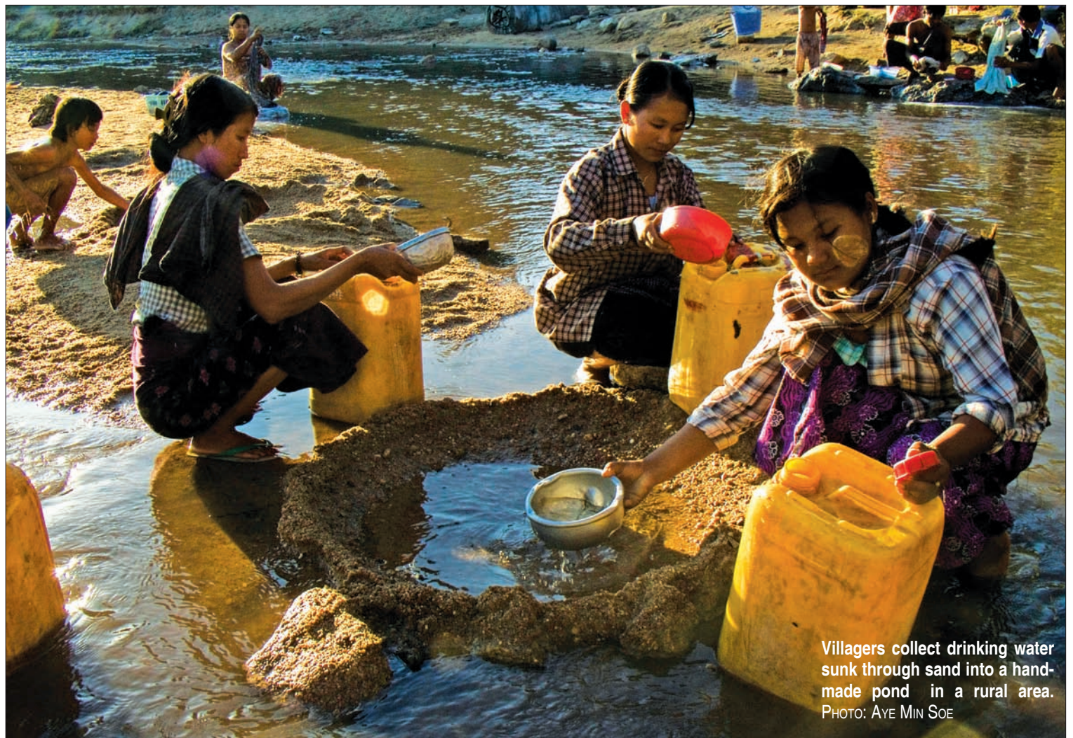
Villagers collect drinking water sunk through sand into a hand-made pond in a rural area.

Meanwhile, the Myanmar Rice Federation has urged the government to buy rice to bolster the