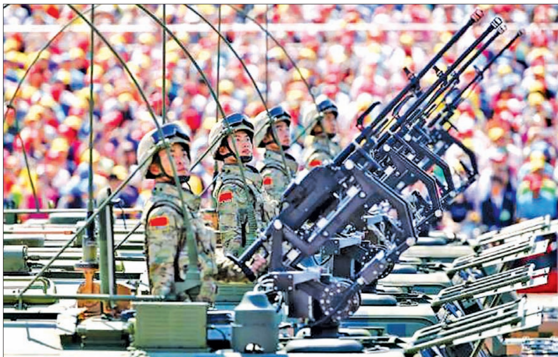
Soldiers of the People's Liberation Army (PLA) of China look from behind their weapons as they arrive at Tiananmen Square during the military parade marking the 70th anniversary of the end of World War Two, in Beijing, China, in 2015.