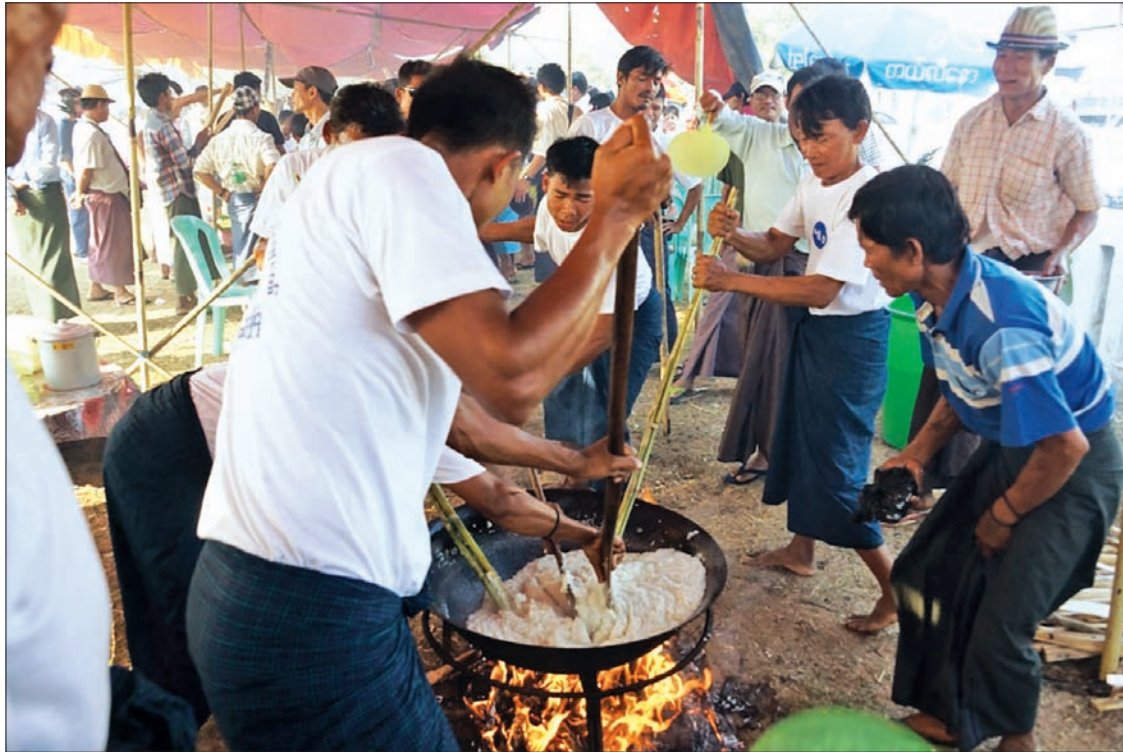
Contestants seen in action.

A COOKING competition for makers of Myanmar traditional htamanè pot pourri was held at the sports ground in Taungoo Township on 21 February.