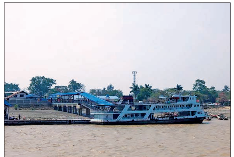
A ferry is seen at Dalla Jetty.