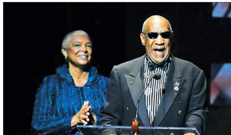
Comedian Bill Cosby addresses the crowd in front of his wife, Camille Cosby, after being honoured during the Apollo Theatre's 75th anniversary gala in New York, in 2009.

More than 50 women have publicly accused Cosby — best known for his role as the father in the 1980s television hit "The Cosby Show" — of raping them, often after plying them with alcohol or drugs in incidents dating back decades.