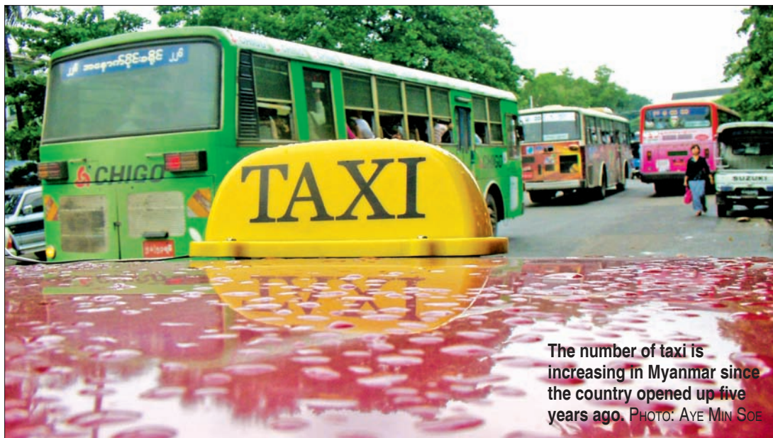
The number of taxi is increasing in Myanmar since the country opened up five years ago.