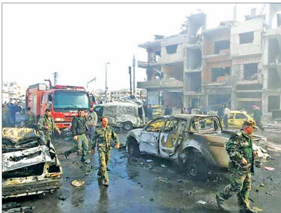
Syrian army soldiers inspect the site of a two bomb blasts in the government-controlled city of Homs, Syria, in this handout picture provided by SANA on 21 February.

He repeated the US position that Assad had to step