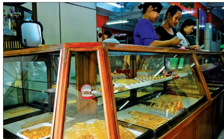
Gold jewellery is displayed at a gold shop in Yangon.

In regard to how the markets fared on the evening of February 22, the price of a tical of Myanmar pure gold fetched K795,000; a tical of 15 carat gold valued K750,000; an ounce of gold on the world market cost $1,215 while $1 bought K1,247, according to gold shopkeepers.— Myit-makha News Agency