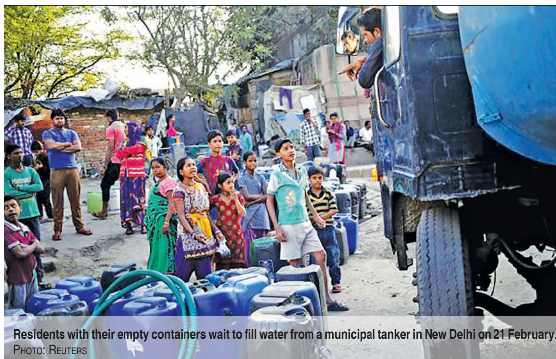
Residents with their empty containers wait to fill water from a municipal tanker in New Delhi on 21 February.. PHOTO: REUTERS

"Jats are determined to win the battle. They had to send the