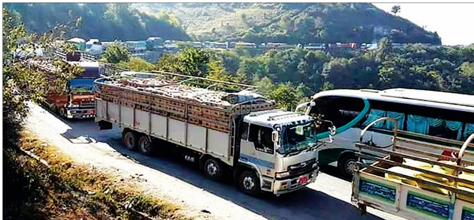
Trucks are crawling along Mandalay-Muse Road.

SMOOTH flow of traffic for passenger buses returned to Mandalay-Muse road section following a timetable for cargo trucks that blocked traffic flows on the road earlier, according to a driver.