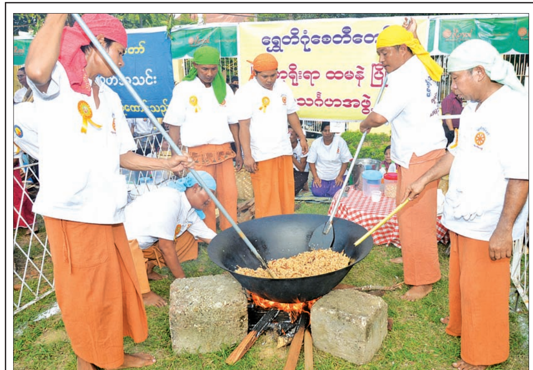
Men from a team participating in pot pourri contest seen yesterday. Htamane is a unique traditional food especially made on the full moon of Tabodwe.