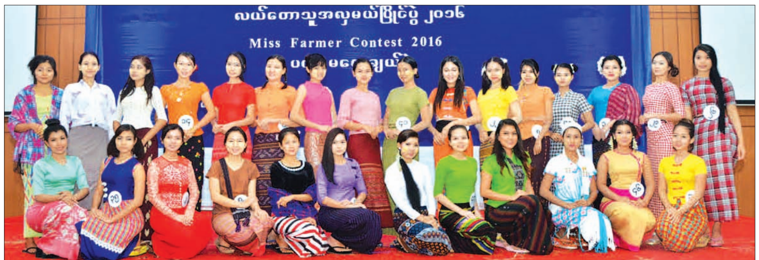
Miss farmer contestants posing for a group photo.

THE Myanmar Paddy Producers Association will organise the Miss Farmer Contest 2016, which is scheduled to take place on 6 March at Myanmar Convention Centre in Yangon.