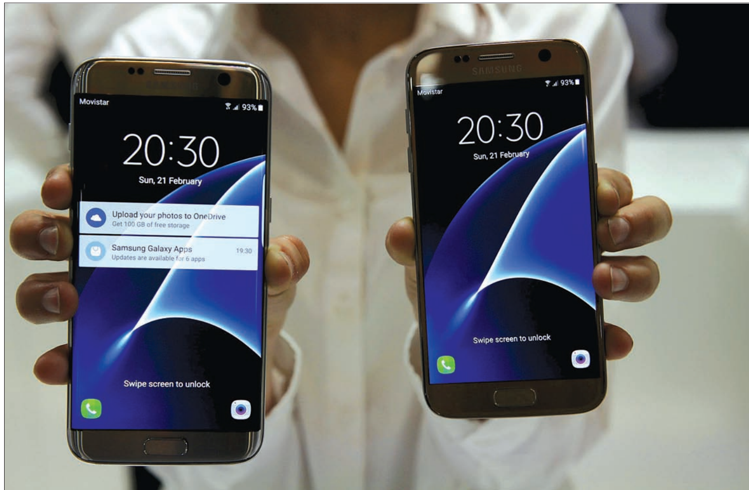
A woman displays new Samsung S7 (R) and S7 edge smartphones after their unveiling ceremony at the Mobile World Congress in Barcelona, Spain, on 21 February.

BARCELONA — Samsung Electronics Co Ltd and LG Electronics Inc unveiled their latest smartphones at the Mobile World Congress industry show in Barcelona on Sunday, seeking to buck the slowdown in industry growth.