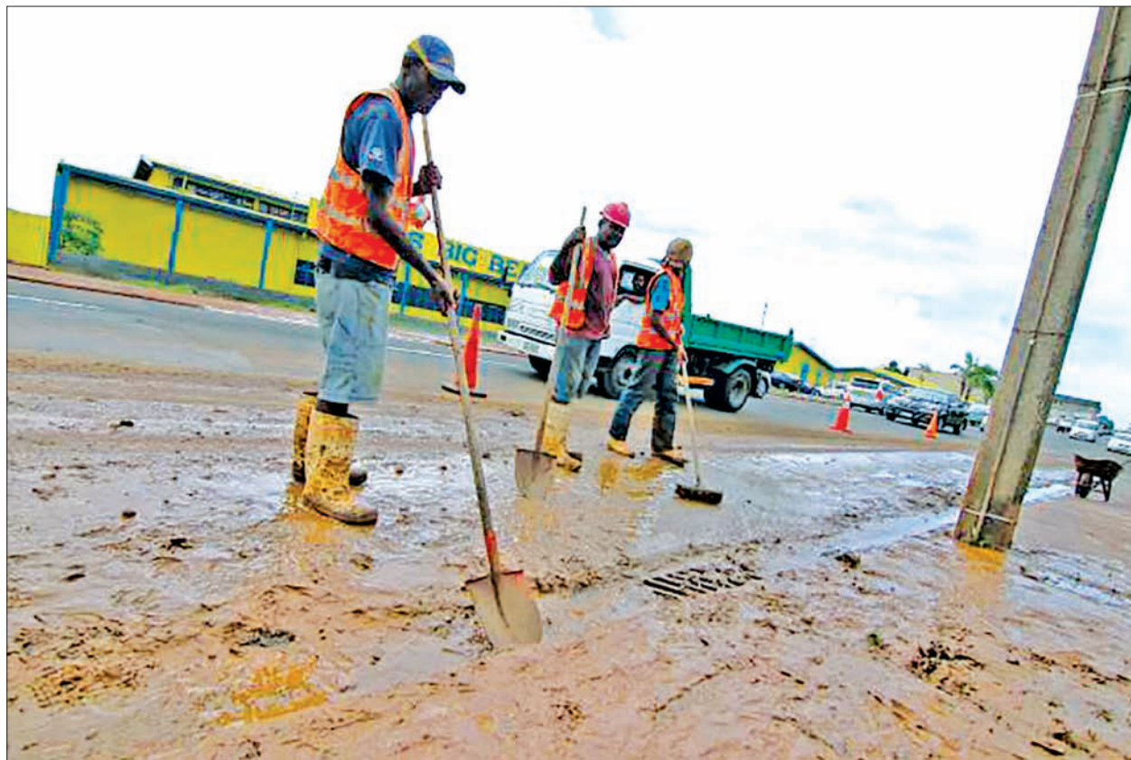
Suva City Council workers clean up mud from Grantham Road in the Raiwaqa suburb of Fiji's capital Suva, as a cleanup continues in the wake of Cyclone Winston, on 22 February.

"Given the intensity of the storm and the images we have seen so far, there are strong concerns that the