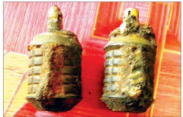
WWII-era bombs seem.

Police said the bombs are not dangerous.—Kyaw Zeya