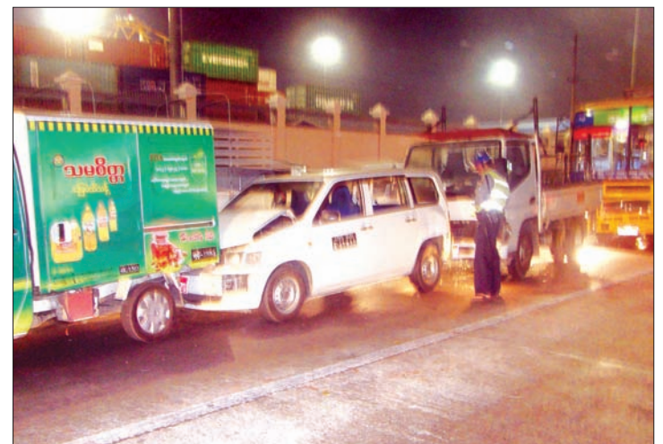
A police investigating at the site of the traffic accident.

THREE traffic accidents occurred in a single week on Kanna Road in Kyimyindaing Township, Yangon, according to local police.