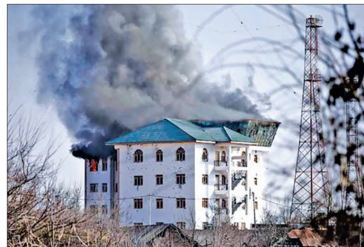
Smoke billows from a building, in which Indian authorities say suspected militants are holed up, during a gun battle on the outskirts of Srinagar on 21 February.

A similar recent attack on an Indian air base that lasted for four days stalled efforts to revive bilateral talks between nuclear-armed rivals India and Pakistan. India and Pakistan fought two of their three wars since independence in 1947 over Muslim-majority Kashmir, which they both claim in full but rule in part. The third was fought over the founding of Bangladesh.—Reuters