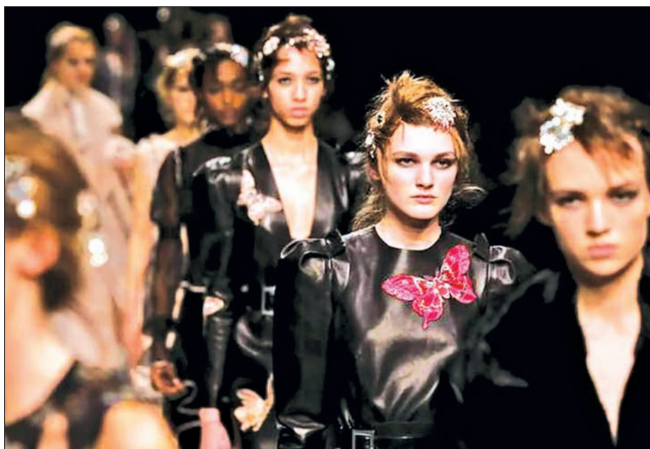
Models present creations at the Alexander McQueen catwalk show at London Fashion Week Autumn/Winter 2016 in London, Britain on 21 February.

"Slowly, slowly, there is definitely going to be a move," said designer Anya Hindmarch, whose lively