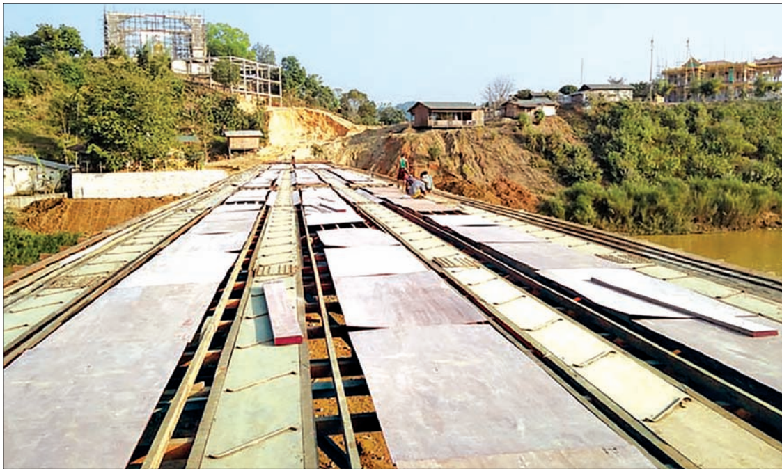
New Uru bridge seen under construction.