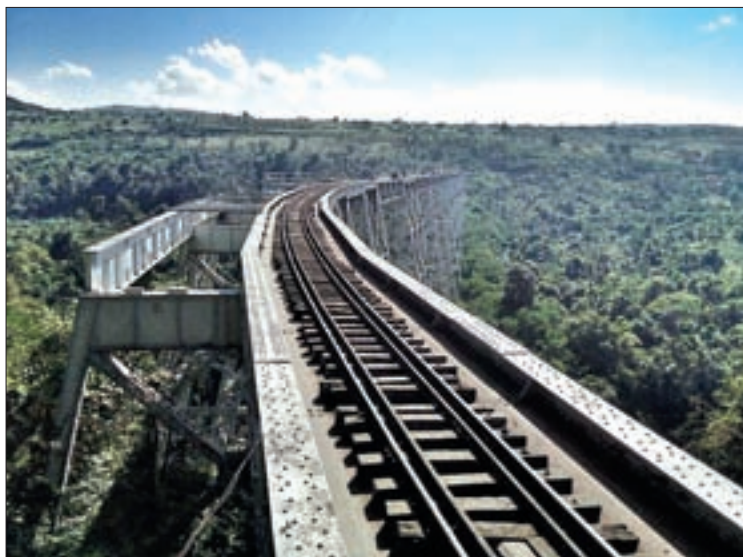
Gokteik Viaduct in northern Shan State.

MYANMA Railways (MR) has tendered out rail bus engine (RBE) service on the Gokteik Viaduct in northern Myanmar, inviting tender from local and foreign companies.