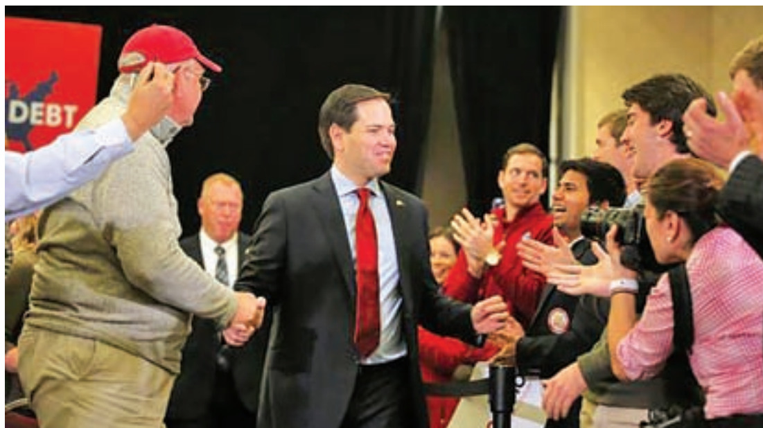
US Republican presidential candidate Marco Rubio greets supporters as he arrives for a campaign event in Columbia, South Carolina, on 19 February.

CHARLESTON — Republican presidential candidates Marco Rubio and Jeb Bush are locked in a bare-knuckled fight for third place in a South Carolina primary vote yesterday, afraid that anything less could blunt their White House hopes.