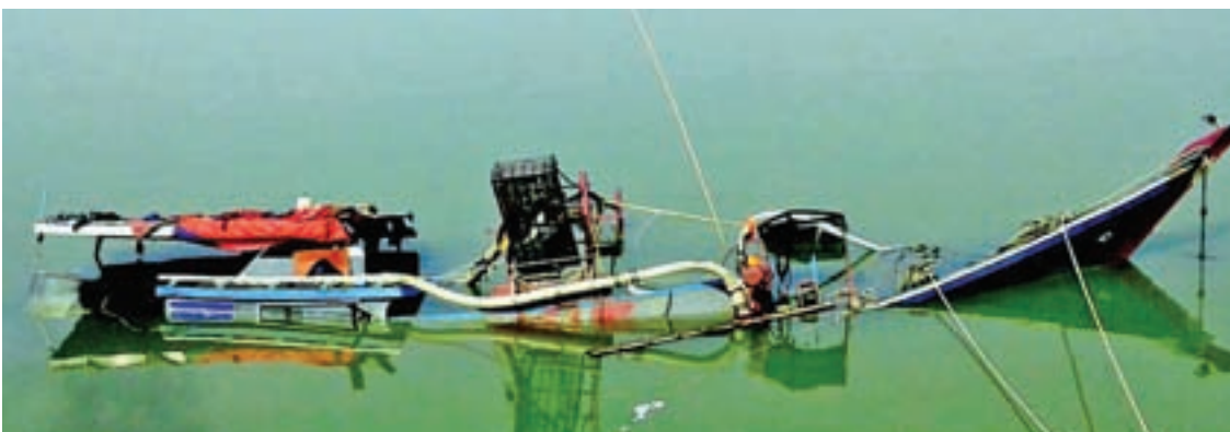
A sunken cargo vessel seen at the site of the incidence.

investigation, the vessel was carrying sand from the river. No one was injured in the sinking.— Tun Tun Htway (Hpa-An)