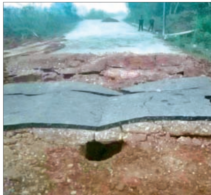
Photo shows the area on Kunlon-Chinshwehaw Road damaged by the two blasts.

During an investigation at the site, authorities found that the responsible individual(s) took position about 20 metres north of the site to blast the mines. The blast site is located near the Chinshwehaw Police Station. Police responded by closing the section of road but traffic returned to normal at around 8.30 am.— Han Htay (Lashio)