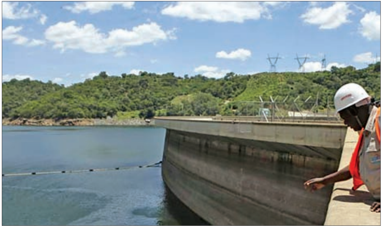
An official of the Zimbabwe Electricity Supply Authority (ZESA) inspects water levels on the Kariba dam in Kariba, Zimbabwe, on 19 February.

The drought has left 3 million people in need of food aid in Zimbabwe, and farmers in Zimbabwe have lost cattle and crops to drought but fear the worst is yet to come.—Reuters