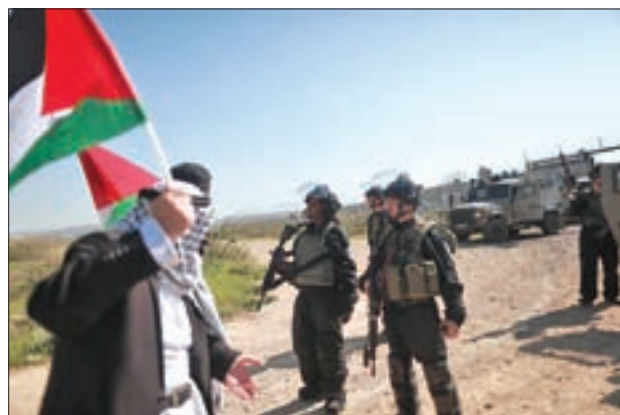
Palestinian protesters wave with national flags in front of Israeli soldiers during clashes at a demonstration marking the 11 th anniversary of their campaign against the controversial Israeli barrier, in the West Bank village of Bilin near Ramallah, on 19 February.

RAMALLAH/GAZA — Three Palestinians were killed and nine wounded on Friday in a flaring day of violent confrontations with Israelis, the Palestinian Health Ministry and Israeli Radio reported.