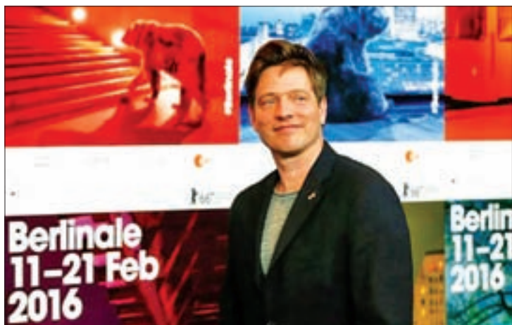
Director Thomas Vinterberg arrives for a news conference to promote the movie 'The Commune' at the 66th Berlinale International Film Festival in Berlin, Germany, on 17 February 2016.

BERLIN — Danish director Thomas Vinterberg says he hopes his film "Kollektivet" (The Commune) will help his countrymen recognise the importance of sharing — especially with refugees — despite curbs enacted in Denmark.