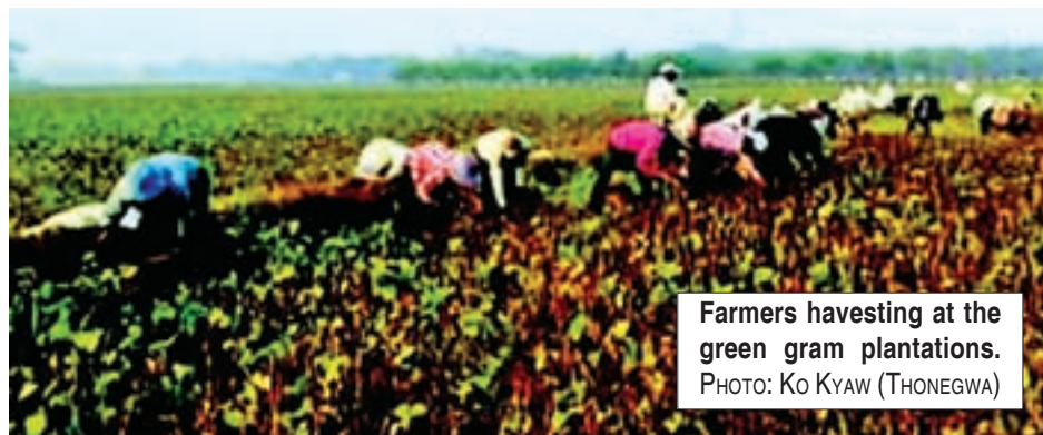
Farmers harvesting at the green gram plantations.

Plantation owners have to pay K500 for workers to pluck green grams due to the scarcity of fruit pickers. Most of pickers are women from Ayeyawady and Bago regions as well as the central and upper Myanmar. Farmers from 65 wards and villages in Thongwa Township cultivated popular species of bean on 130,800 acres of farmlands, 130,430 of which are green gram plantations.—Ko Kyaw (Thonegwa)