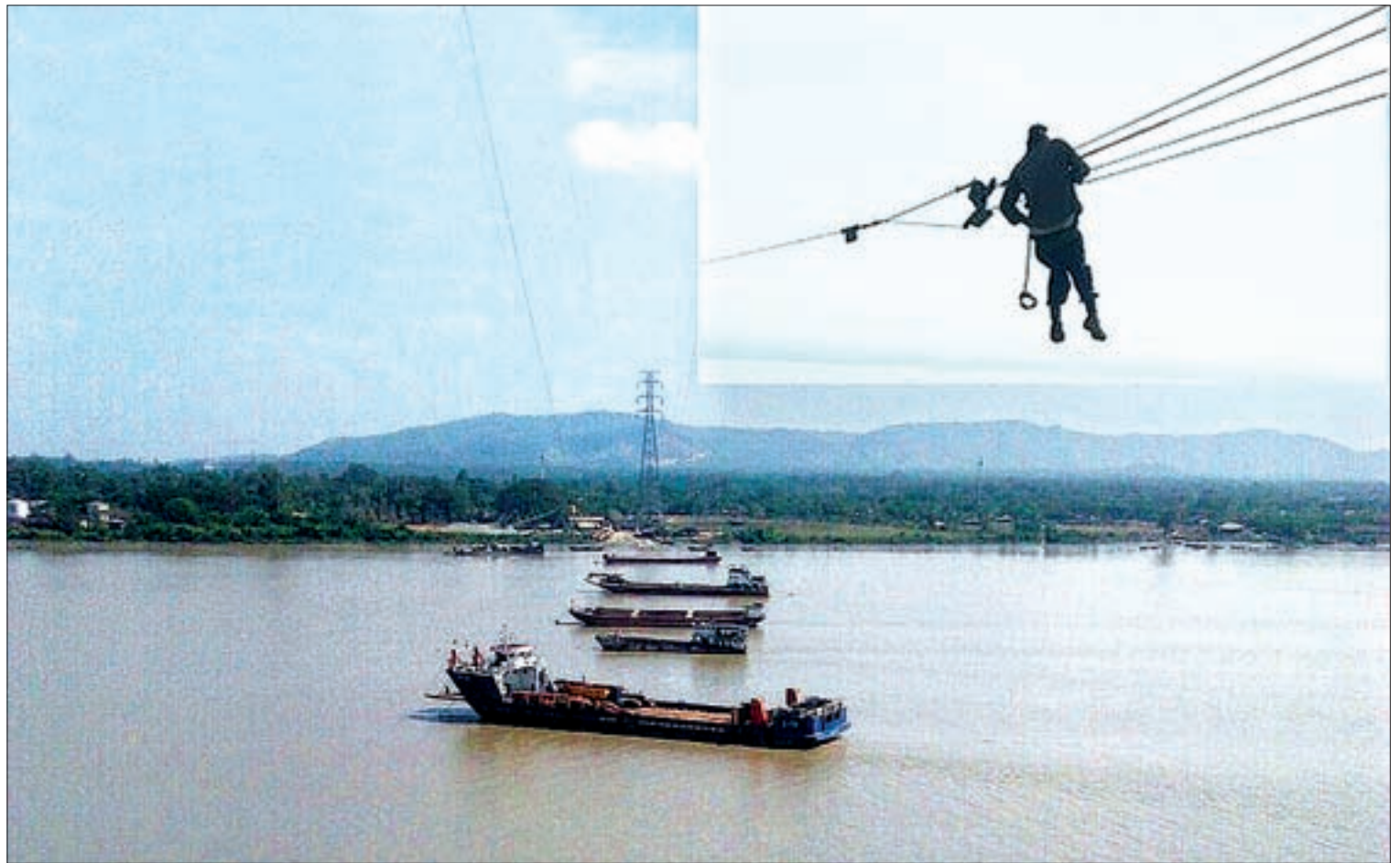
Employees of the Ministry of Electric Power have completed the installation of cables across the Thanlwin River on 16 January, bringing electricity to more than 1740 households around the clock.