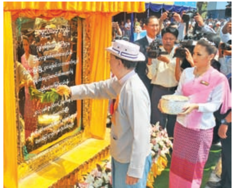
President U Thein Sein sprinkles scented water on the plaque of Gas & Biomass Power Plant in Mawlamyine.

After inspecting the control room at the power plant, the president and his entourage watched an entertaining documentary about the plant. — Myanmar News Agency