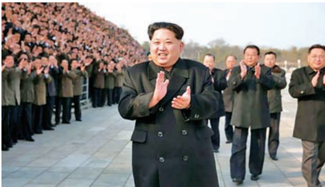
North Korean leader Kim Jong Un attends a photo session with the scientists, technicians, workers of earth observation satellite Kwangmongsong-4 in this undated file photo released by North Korea's Korean Central News Agency (KCNA) on 19 February 2016.

The South's office of the Joint Chiefs of Staff later said there were several rounds of artillery fire, revising a comment by the ministry official that there had been a single shot, and there were no other un-