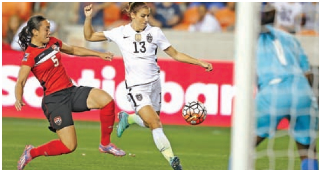
USA forward Alex Morgan (13) dribbles against Trinidad & Tobago defender Arin King (5) in the first half during the semifinals of the 2016 CONCACAF women's Olympic soccer tournament at BBVA Compass Stadium in Houston, TX, USA, on 19 February.

HOUSTON — Striker Alex Morgan scored a hat-trick as the United States booked a place in the Rio Olympic women's soccer tournament with a 5-0 demolition of Trinidad and Tobago in a semi-final at the CONCACAF qualifying tournament in Houston on Friday.