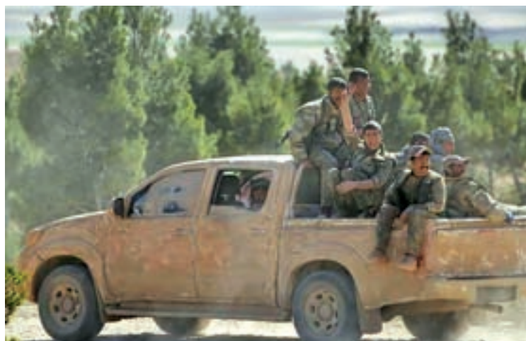
Democratic Forces of Syria fighters ride a pick-up truck near al-Shadadi town, Hasaka countryside Syria, on 18 February.

"Rather than trying to distract the world with the resolution they just laid down, it would be really great if Russia implemented the resolution that's already