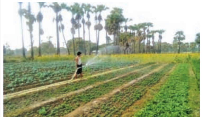
Farmers turn to seasonal crops to fulfil market demand.

The changing of crops can prevent soil degradation and the growers need to choose the right crops or flowers based on the market demand, said an agricultural expert. The commercial growers can gain more profit this way, he added.— Phay Htun Zaw(Yesagyo)