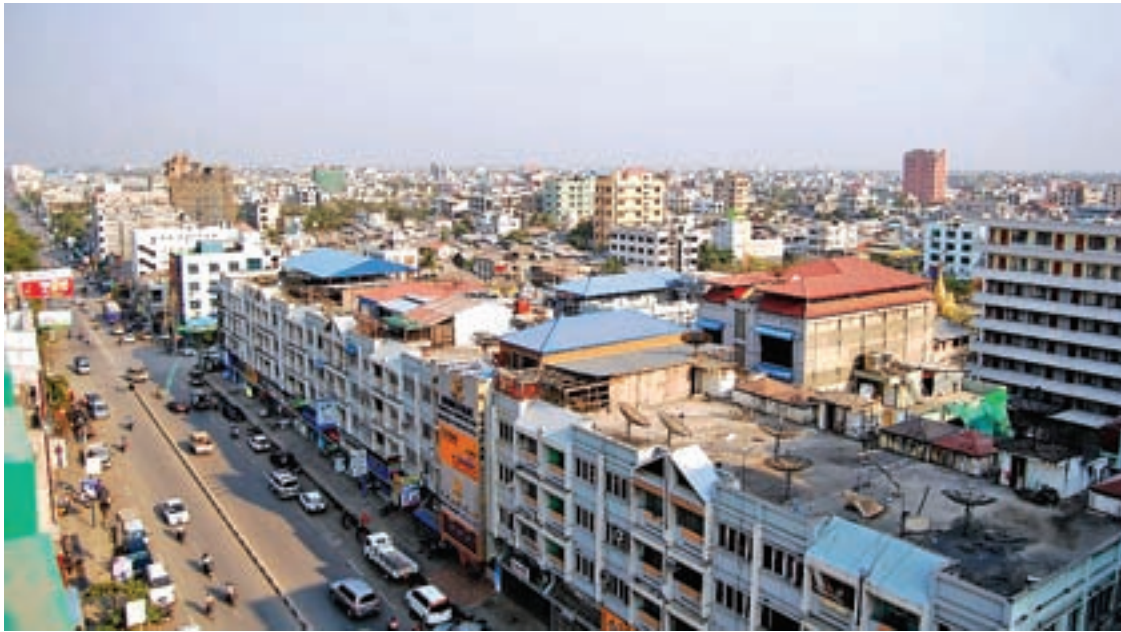
Real estate market in Mandalay has come to a halt.

THE trading of real estate in Mandalay has come to a halt of late as potential financial investors are holding off from purchasing real estate for want of monitoring the changing political climate.