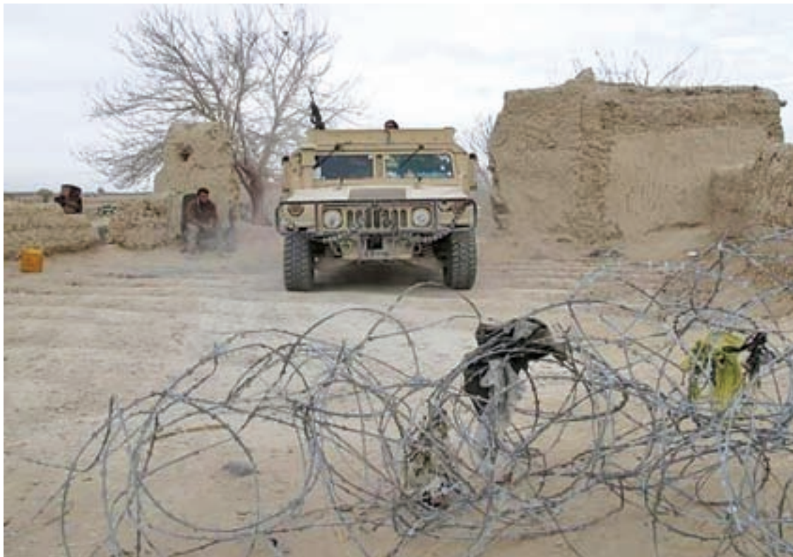
An Afghan National Army (ANA) vehicle is seen parked at an outpost in Helmand province, Afghanistan on 25 December 2015.

The Taliban said in a statement it had captured armoured personnel carriers, bulldozers and other equipment abandoned in Roshan Tower and nine other checkpoints. The withdrawal prompted speculation among local officials that the government had reached