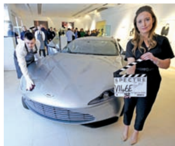
An employee poses as an Aston Martin DB10, one of the series of DB10s designed and engineered by Aston Martin for the James Bond film "Spectre", is polished during a media preview of "Spectre — the Auction", at Christie's auction house in London, on 15 February.

James Bond film in 53 years, has grossed some $879 million at the box office worldwide since its release in late October. —Reuters