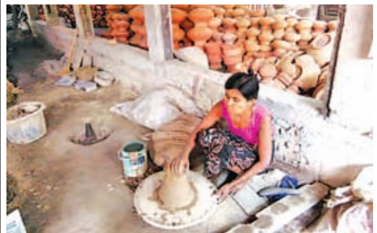
An earth ware manufacturer seen in action.

They have turned to other businesses within the past three years as earth wares are seeing less demand. At this time there are only five manufacturers remaining.— Nay Myo Htut (Ye)