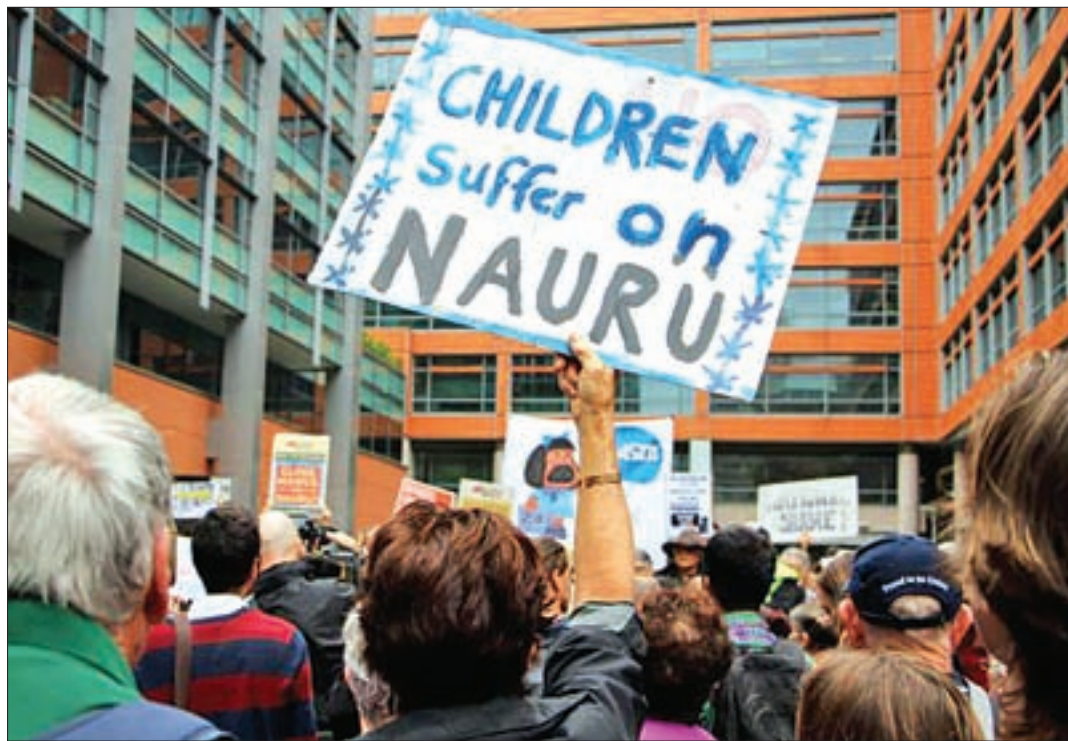
Activists hold placards and chant slogans as they protest outside the offices of the Australian Immigration Department in Sydney, Australia, on 4 February 2016.

Since 2012, people on boats trying to reach Australia have been turned back or taken to camps in Nauru, where there have been reports of assaults and systemic child abuse, or Papua New Guinea, where Canberra has set up processing centres.— Reuters