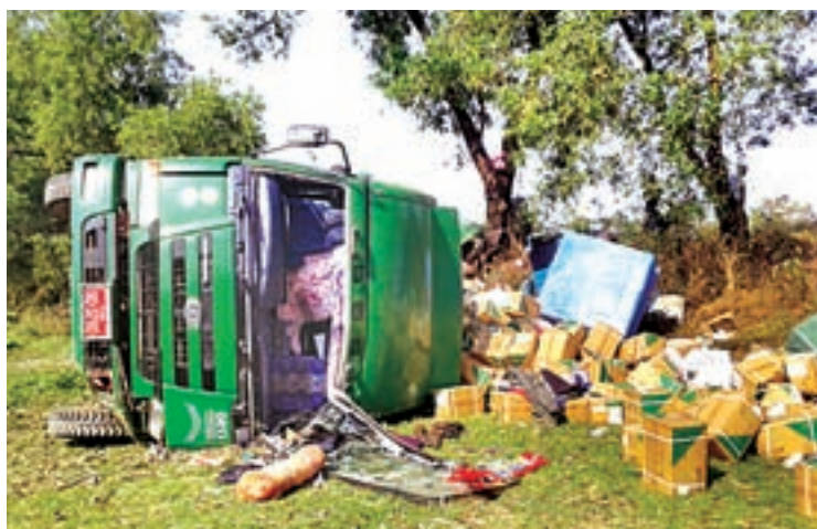
Overturning 12 wheel vehicle seen at the scene of accident.

A 12 wheel vehicle turned over beside Hpa-an-Thaton Highway near Myaing Kalay village, Hpa-an Township, Kayin State around 2pm on Tuesday.