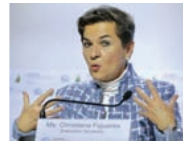
Christiana Figueres, Executive Secretary of the United Nations Framework Convention on Climate Change (UNFCCC).

PARIS — The UN's climate chief said on Friday she will step down in July, at the end of a six-year term, and praised governments for reaching a 195-nation deal in Paris in December to shift the world economy from fossil fuels to cleaner energies.