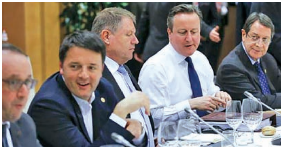
British Prime Minister David Cameron (2 nd R) attends a meeting with European Union leaders during a EU summit addressing the talks about the so-called Brexit and the migrants crisis, in Brussels, Belgium, on 19 February, 2016.

BRUSSELS — David Cameron hailed a landmark deal on Friday he said gave Britain “special status” in the European Union and pledged to campaign heart and soul to stay in the EU at a deeply uncertain referendum expected in June.