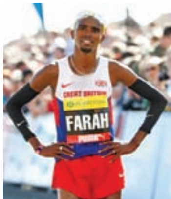
Great Britain's Mo Farah.

The African country missed last week's WADA deadline to implement new regulations and