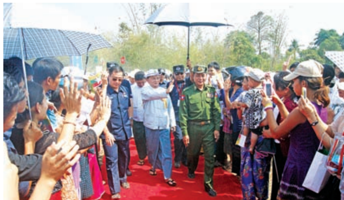
President U Thein Sein waves hands to local people as he arrives to open subpower station in Chaungson.