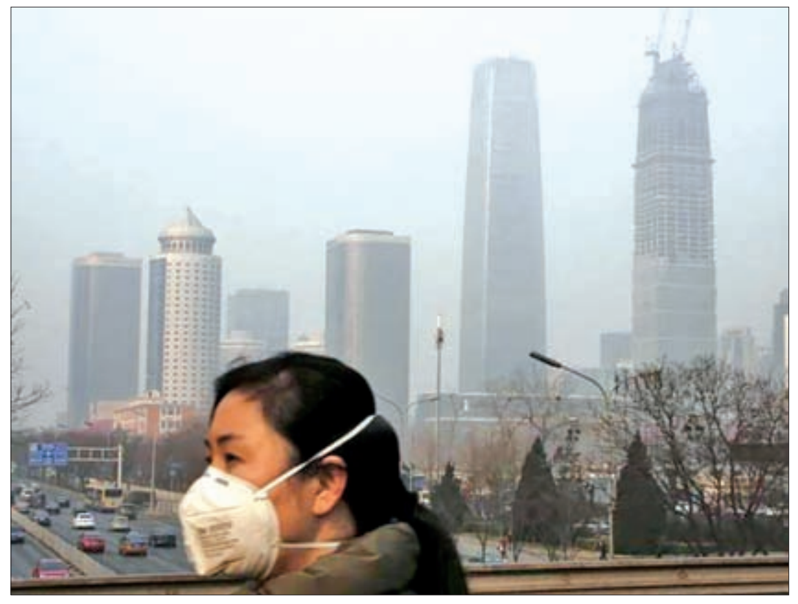
A woman wearing a protective mask makes her way in a business district on a heavily polluted day in Beijing, China on 3 January.

Hebei, which produces around a quarter of China's steel, had seven of the country's 10 smoggiest cities last year, despite