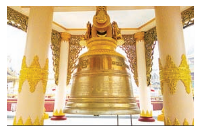
19 ton bronze bell.

With the aim of promoting public observation of the Buddhist culture to both local and foreign researchers, students and