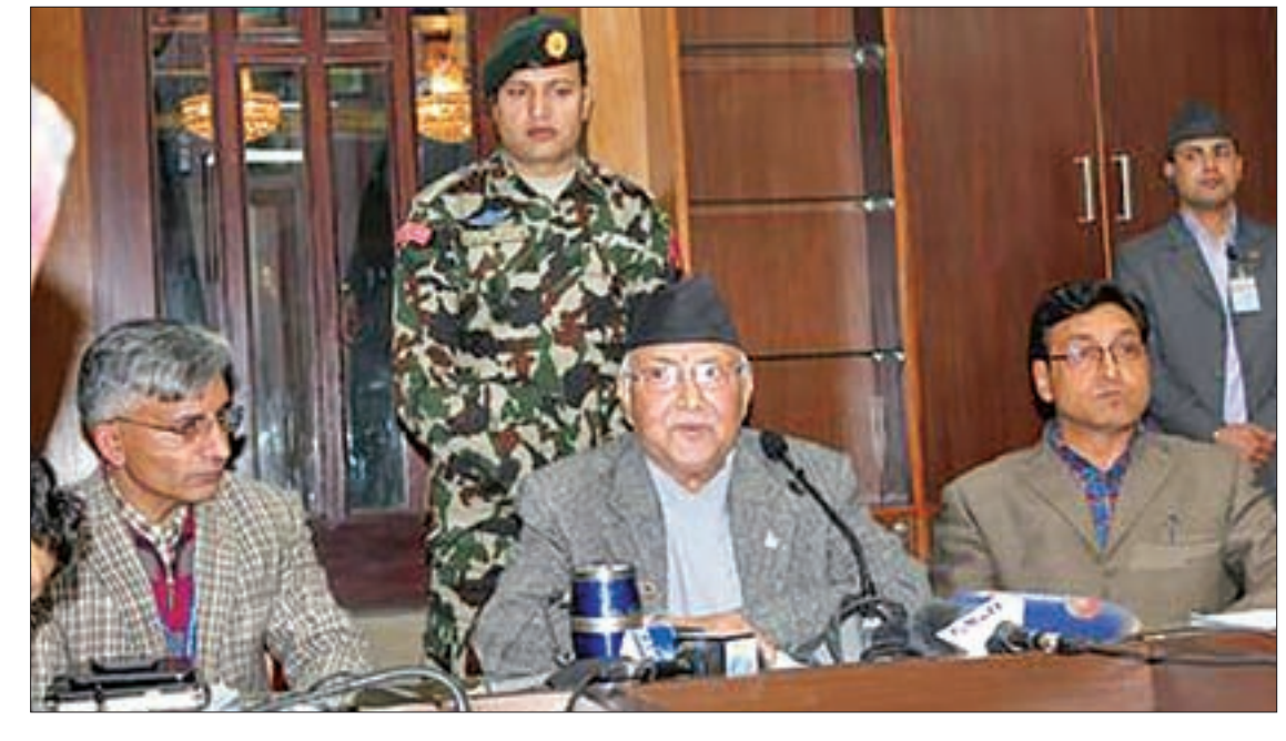
Nepal's Prime Minister Khadga Prasad Sharma Oli (C) announces an ambitious plan in Kathmandu on 18 February.

Nepal currently faces up to 14 hours of power cuts a day, with the country's predominantly run-of-river type hydropower projects generating just one-third of their total capacity because of receding water levels in the snow-fed rivers feeding their turbines.