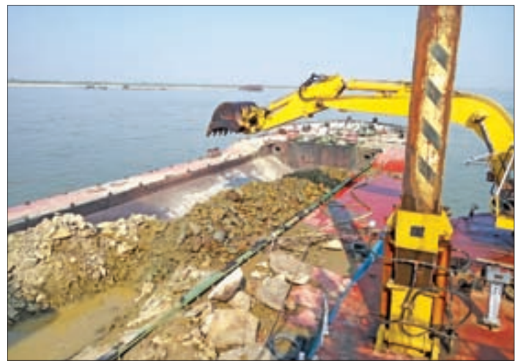
Ayeyawady River.