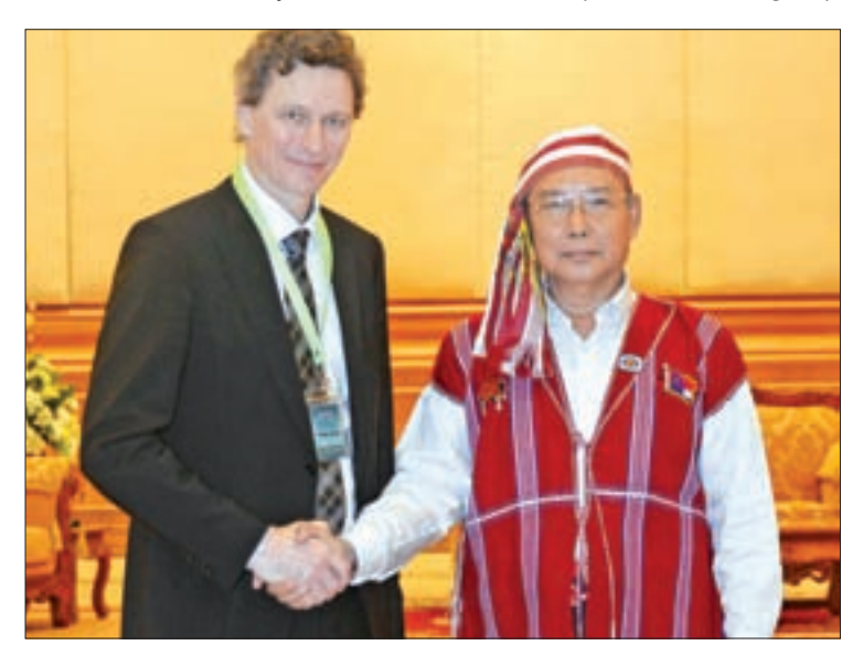
Speaker Mahn Win Khaing Than welcomes Mr. Tore Hattrem, Deputy Minister for Foreign Affairs of Norway.

Also present at the calls were Deputy Speaker of the PyidaungsuHluttaw and AmyothaHluttaw U Aye ThaAung and officials of the AmyothaHluttaw Office.—Myanmar News Agency