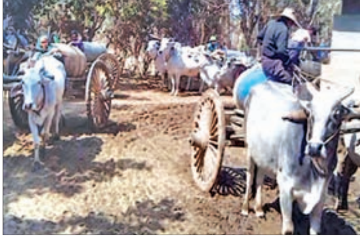
Villagers carrying tanks on the bullock are seen on their way to take to fetch water.