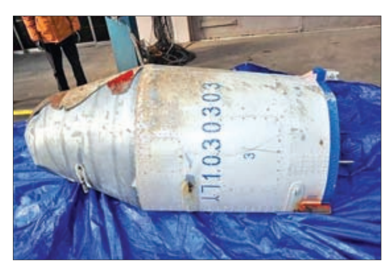
A metal object believed to be a part of North Korean long range rocket launched on 7 February, 2016, is seen in this undated handout picture provided by South Korean Defence Ministry and released by Yonhap on 9 February.

WASHINGTON — Korea's recently launched satellite is once again tumbling in orbit, after stabilising briefly, according to a US official and other sources.