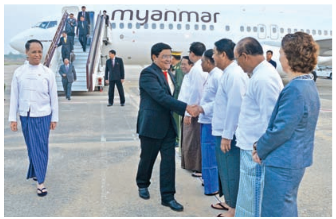
Vice President U Nyan Tun being welcomed upon arrival back in Nay Pyi Taw.