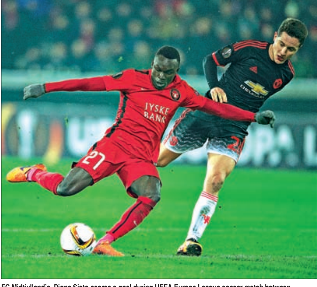
FC Midtjylland's Pione Sisto scores a goal during UEFA Europa League soccer match between Manchester United and FCM at MHC Arena Herning, Denmark, on 18 February 2016.

One of the Old Trafford club's biggest close-season acqui-