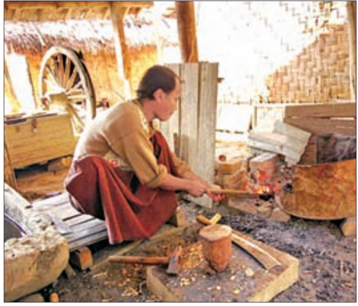
A blacksmith prepares for making a knife.

The traditional blacksmith craft emerged in the early Bagan period (11th century A.D) and improved in the mid Bagan Inwa and Yadanapon period.—