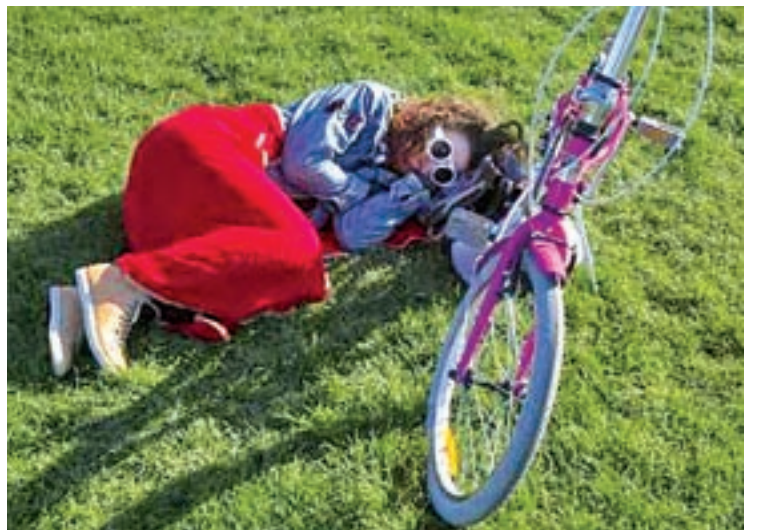
A woman takes a nap next to her bicycle in Central Park in New York in 2014.

Hungary has a single nuclear reactor at Paks, currently operating four updated Soviet-made reactors, and Budapest has signed an agreement with Russia to double the plant's capacity, using Russian technology and financing.—Reuters