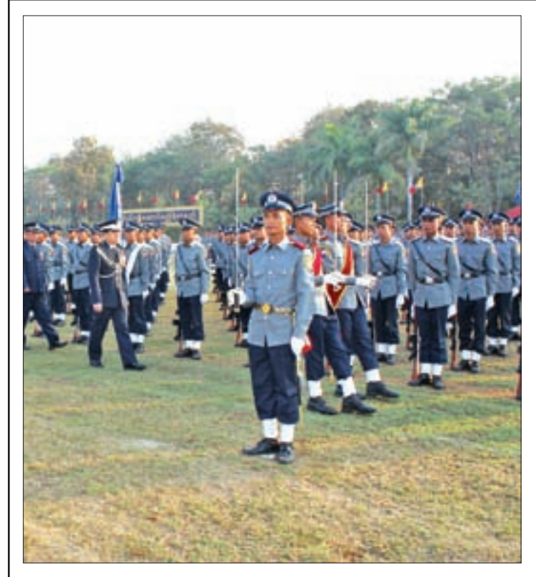
Myanmar Police Force concluded its Sub-Inspector Police Training Course No 81/2015 at Zibingyi, PyinOoLwin Township, on 19 February 2016, with a speech of Director-General of the Myanmar Police Force Police Maj-Gen Zaw Win. A total of 314: 211 men and 103 women graduates completed the Yethurein Company training course.