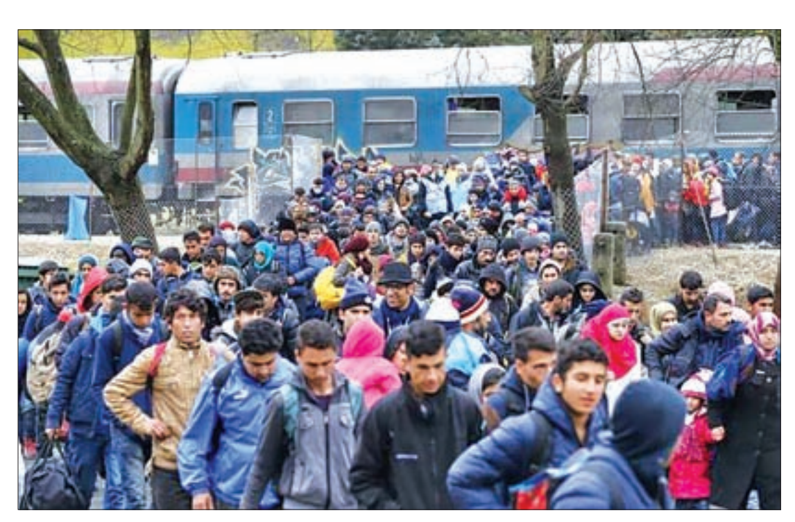
Migrants walk towards a makeshift camp close to the Austrian border town of Spielfeld in the village of Sentilj, Slovenia, on 16 February 2016.

BRUSSELS — Italian Prime Minister Matteo Renzi warned Eastern European leaders on Thursday that they may get less European Union development money if they do not help with the refugee crisis, participants at an EU summit in Brussels said.