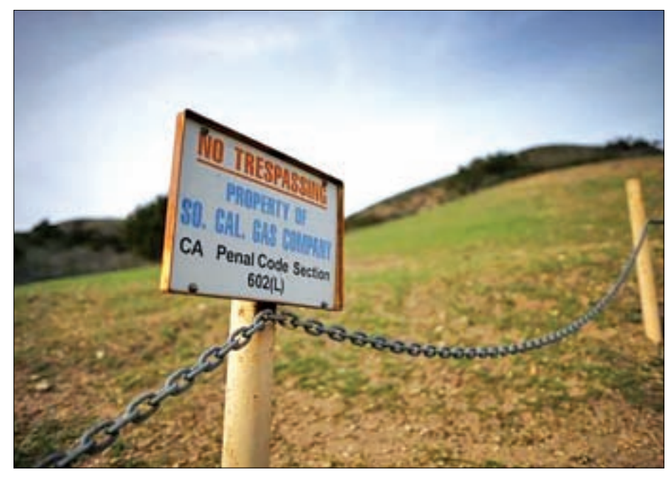
A gas company sign marks a fence near the site of the Aliso Canyon storage field where gas has been leaking in Porter Ranch, California, United States, on 21 January.

announcement The came a day after the utility, a division of San Diego-based Sempra Energy, pleaded not guilty to criminal misdemeanor charges stemming from the leak, which prosecutors said the