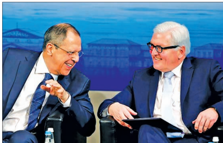
Russian Foreign Minister Sergei Lavrov (L) speaks to German Foreign Minister Frank-Walter Steinmeier at the Munich Security Conference in Munich, Germany, on 13 February.

On the eve of the conference, a meeting of major powers hosted by German Foreign Minister Frank-Walter Steinmeier agreed to a "cessation of hostilities" in Syria, providing a glimmer of hope in a five-year war that has killed at least 250,000 people. But within hours, signatories to the deal itself were calling it into question.