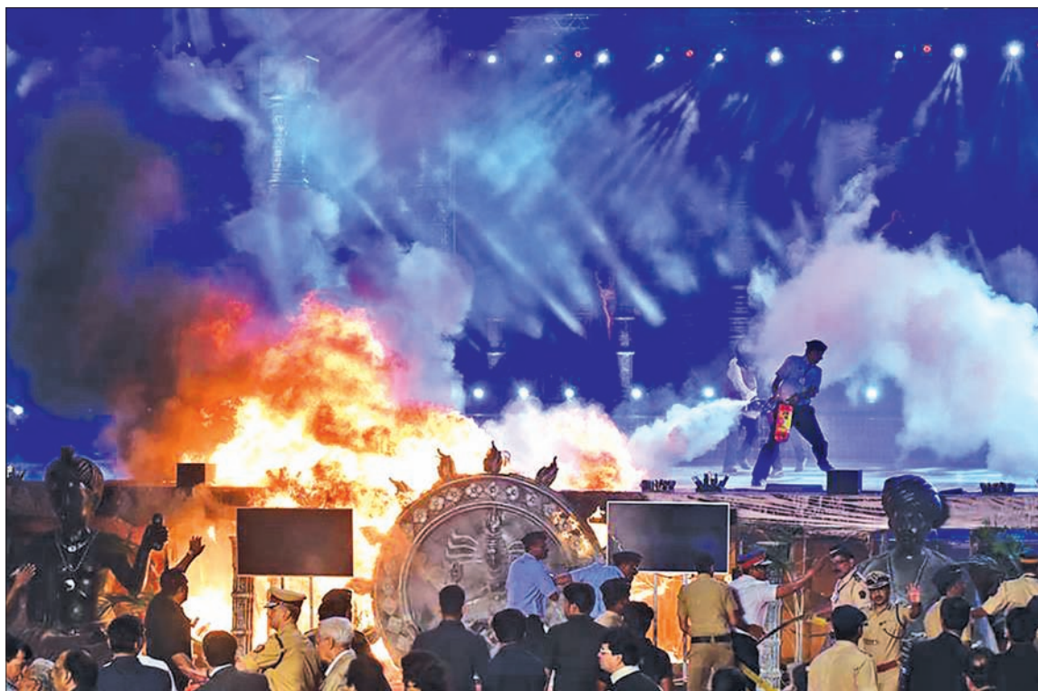
Guests leave a stage that is caught on fire during a cultural event in Mumbai, India, 14 February, 2016. A huge fire broke out Sunday evening at a cultural extravaganza for "Make in India Week" business forum in the Indian financial hub Mumbai, burning down a whole stage, said officials.

So far there is no report of casualty. Fire fighters were trying to put down the fire, according to the local media.—Xinhua