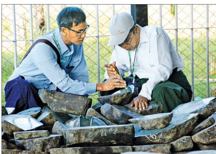
Merchants evaluate jade stones at Myanmar Jade Fair at the Maniyadana Emporium in Nay Pyi Taw, in December 2015.

During the programme, MPs will share knowledge about democracy and leadership, the duties and roles of MPs, the characteristics of a good MP, power-sharing and the role of MPs, sovereignty, checks and balances and challenges facing women MPs.— Myanmar News Agency