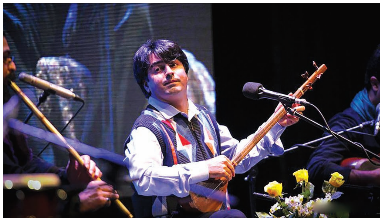
Members of an Iranian traditional music band play at a concert during the 31st Fajr International Music Festival in Tehran, Iran, on 14 February 2016.