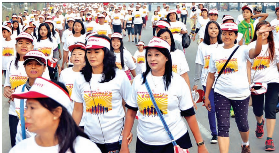
6000 women participated in Yangon's 3 rd Women's Walking Race which was held in Yangon.

THOUSANDS of people joined Yangon's 3 rd Women's Walking Race on 14 February, where participants received free examinations for anaemia.