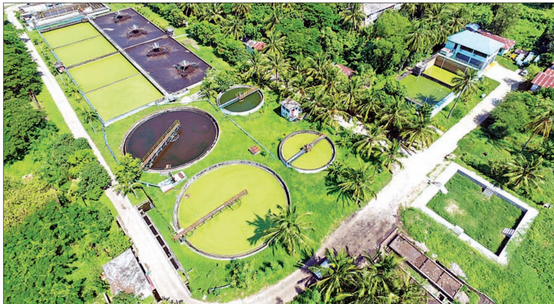
Sewage treatment plant in Botahtaung.