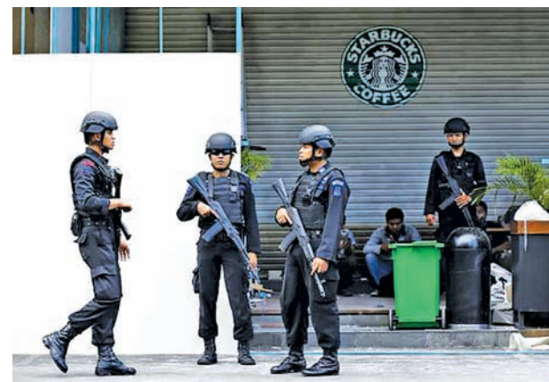
Indonesian police stand guard at the site of a militant attack in central Jakarta, Indonesia in 16 January, 2016.

Islamic State stamped its presence in the region for the first time last month when local supporters of the group launched a