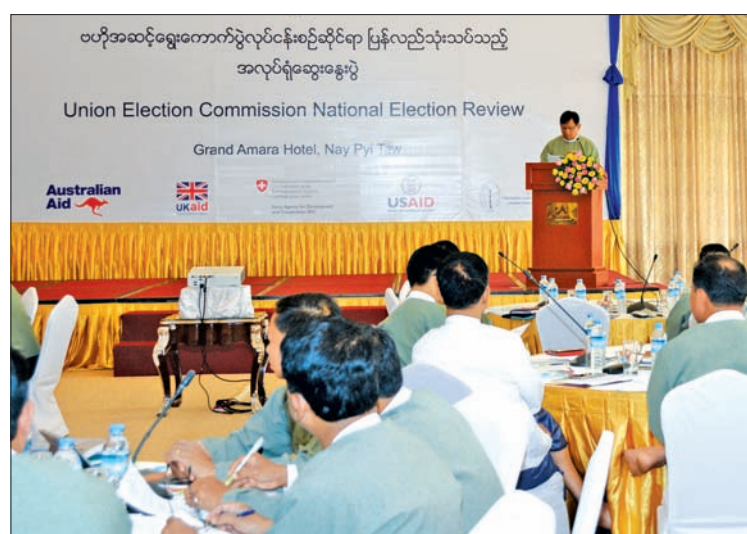
Union Election Commission chairman U Tin Aye delivers an address at the post-election review workshop.