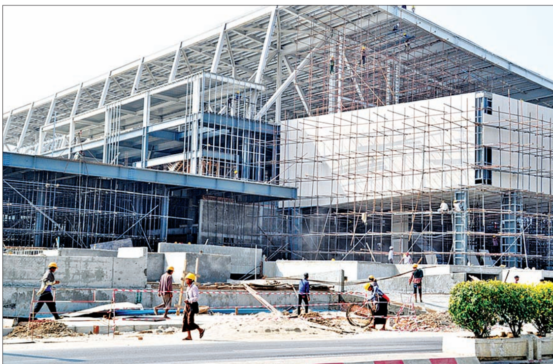
Mandalay Convention Centre is under construction.

The project’s first phase is set for completion by this June, and the whole project is expected