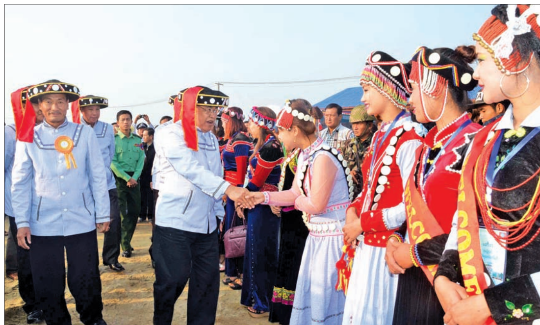
Union Minister U Soe Thane is welcomed by Lisu ethnic women at new year festival of the Lisu community in Myitkyina.

The union ministers took part in Lisu traditional dances and viewed the booths featuring traditions and cultures of the Lisu people on display at the festival.— Myanmar News Agency