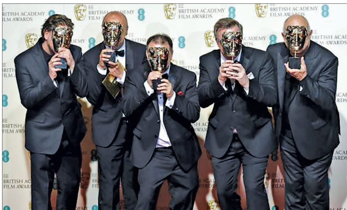
The sound engineers of The Revenant pose after winning their awards for best sound at the British Academy of Film and Television Arts (BAFTA) Awards at the Royal Opera House in London, on 14 February.

"All of this was not expected tonight ... Often we have talked about how difficult this movie