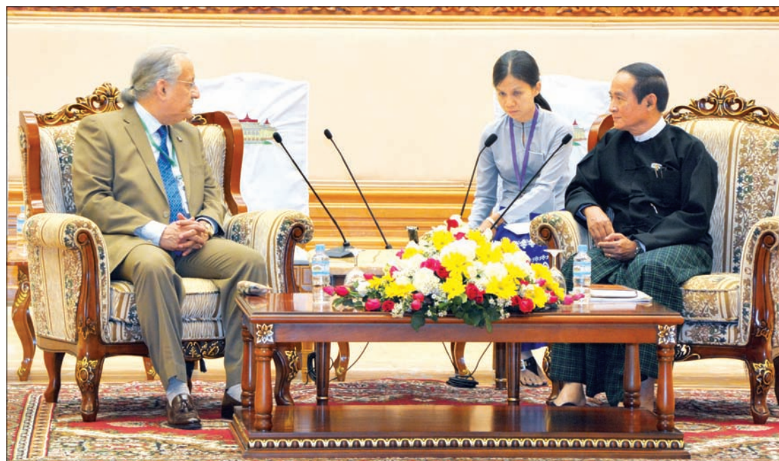
Speaker of Pyithu Hluttaw U Win Myint meets Mian Raza Rabbani, the Speaker of the Senate of the Islamic Republic of Pakistan.

the two parliaments. Deputy Pyithu Hluttaw speaker U T Khun Myat and officials from the Pyithu Hluttaw Office were also present at the meeting. — Myanmar News Agency