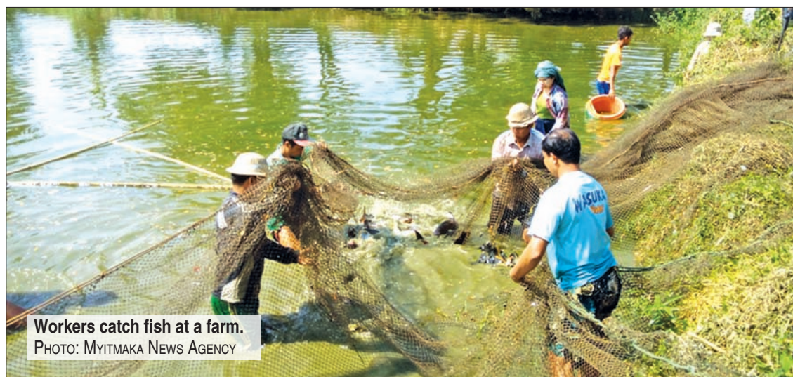
Workers catch fish at a farm.

with a seating capacity of 4,500, a conference hall with a seating capacity of 264, plus several seminar rooms. The centre is also set to be fitted with six escalators and lifts that can carry vehicles for automobile shows.