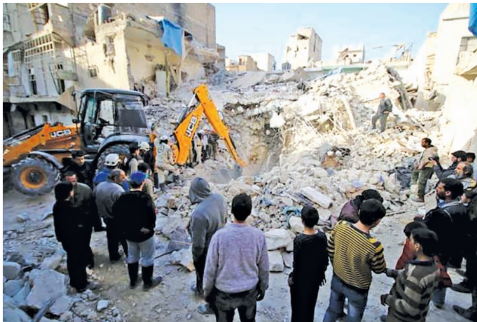
Civil defence members search for survivors after airstrikes by pro-Syrian government forces in the rebel held al-Qaterji neighbourhood of Aleppo, Syria, on 14 February 2016.

The Kremlin said President Vladimir Putin and Obama had spoken by tele-