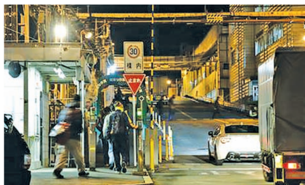
Employees at a Toyota Motor Corp. factory in the central Japan city of Toyota show up for work on 15 February, 2016, as the automaker resumed production there.

NAGOYA — Toyota Motor Corp. yesterday resumed production at its assembly plants in Japan following a weeklong suspension due to a supply disruption.