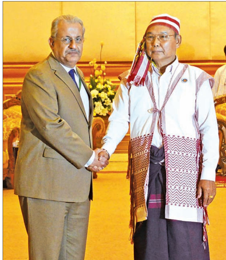
Pyidaungsu Hluttaw Speaker Manh Win Khaing Than welcomes Mian Raza Rabbani, Speaker of the Senate of Pakistan.

SPEAKER of Pyidaungsu Hluttaw and Amyotha Hluttaw Mahn Win Khaing Than received Ms. Renata Lok-Dessallien, United Nations Resident Coordinator and Humanitarian Coordinator, and Mian Raza Rabbani, Speaker of the Senate of the Islamic Republic of Pakistan, separately