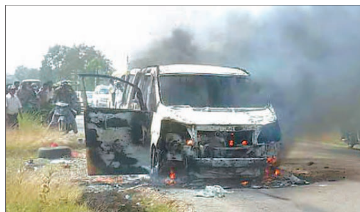
Damaged car seen at the place of accident.

AN automobile fire broke out near mile post No. 27/6 on the Patheingyi-Yangon Road in Kyaunggon Township in Ayeyawady Region on 14 February, leaving a woman tourist injured.