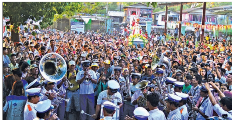
Myanmar's catholic community celebrates the National Marian Pilgrimage.

THE Roman Catholic community in Myanmar celebrated the National Marian Pilgrimage in Nyaunglebin, Bago Region, and praying for a peaceful transition in the country.