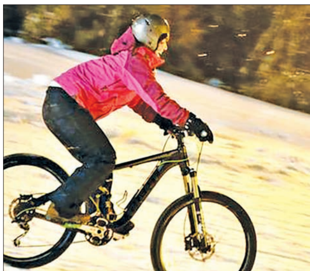
A participant in an event riding a bicycle on a slope at the Togari Onsen ski resort in Iiyama, Nagao Prefecture on 31 January.