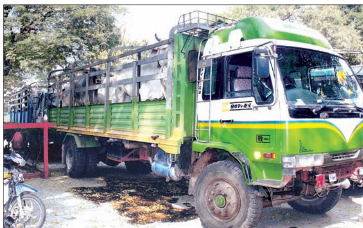
Oxen seized by local police.

Police found 56 oxen—14 in a car driven by Nyi Nyi Aung; 14 in a car driven by Ko Shine Maung; 13 in a car driven by Zarni Aung; and 15 in a car driven by Aung Myo. Police have filed charge against all suspects. —Win Maung