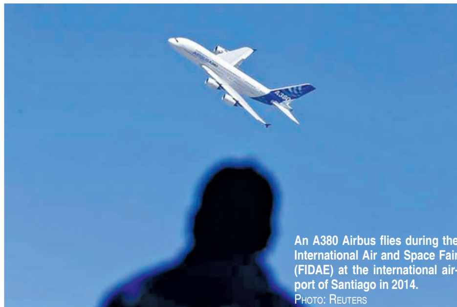
An A380 Airbus flies during the International Air and Space Fair (FIDAE) at the international airport of Santiago in 2014.

the mental health and security issues that were exposed in these tragedies, aviation continues to work to minimise the risk that such events will happen again," said Tyler. IATA said the 2015 global jet accident rate, measured in hull losses per 1 million flights, was 0.32, compared with 0.27 in 2014 and 0.46 in the previous five years.— Reuters