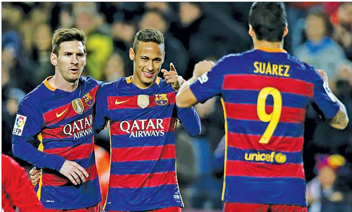
Barcelona's Neymar, Lionel Messi and Luis Suarez.

LONDON — Barcelona will turn their gaze from domestic honours to Europe in their quest for a second straight treble when the holders return to Champions League duties against Arsenal in the last 16, which starts this week.