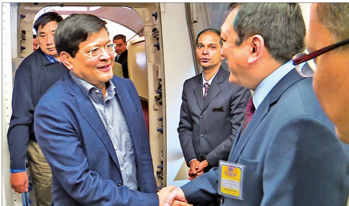
Vice-President U Nyan Tun being welcomed by a Myanmar diplomat on his arrival at Los Angeles.

Next, the Myanmar delegation left for Rancho Mirage where US-ASEAN Leaders Summit will take place, and arrived at Westin Mission Hills Hotel at 4.10 pm local time.— Myanmar News Agency