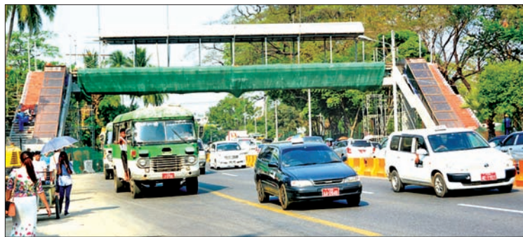
Fourth pedestrian overpass seen under construction in Yangon.

the project said: "We are building pedestrian overpasses in crowded places in Yangon. The construction of this overpass aims to ensure the safety of pedestrians." A resident of Bahan Township said: "The authorities are building pedestrian overpasses one after another. The public, on their part, must use these facilities in a disciplined manner. Sometimes, some road users fail to abide by the traffic rules. The authorities should tighten the traffic rules." Other four pedestrian overpasses—Sule Pagoda, near Thanzay, Inya and Mala Hostel—are currently under construction in Yangon.—Maung Sein Lwin