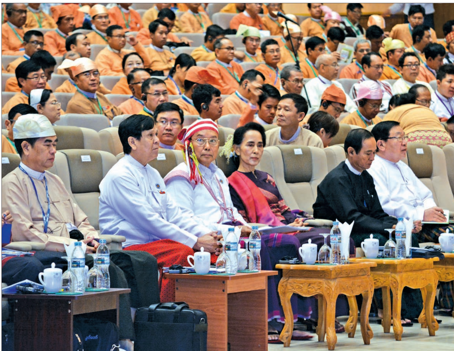
Speakers and lawmakers attend the ceremony to open the induction programme for MPs of the second Hluttaw.

New MPs get crash course on legislative procedures