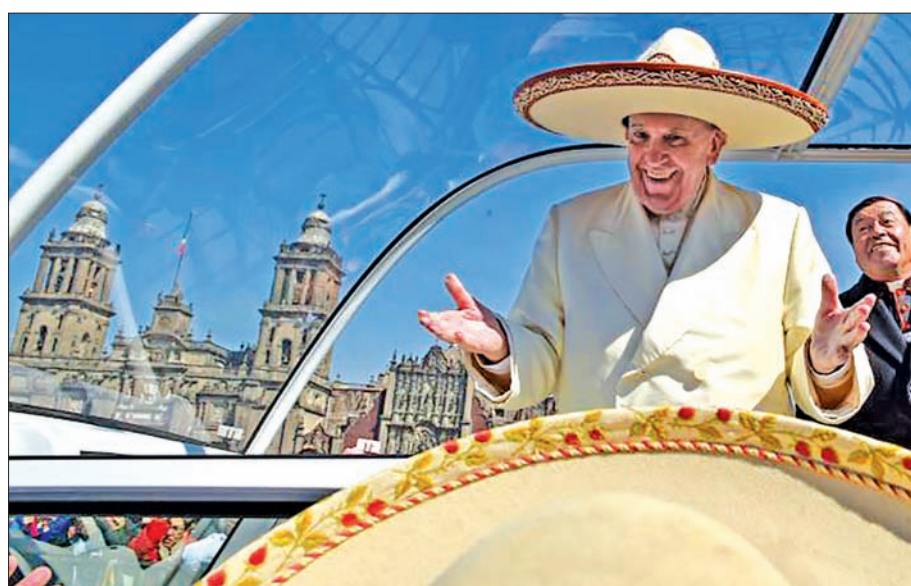
Pope Francis gestures while wearing a Mariachi hat given to him by someone in the crowd on Zocalo Square in Mexico City, on 13 February.

The pope warned Mexicans not to succumb to evil: "You cannot dialogue with the devil because he will al-