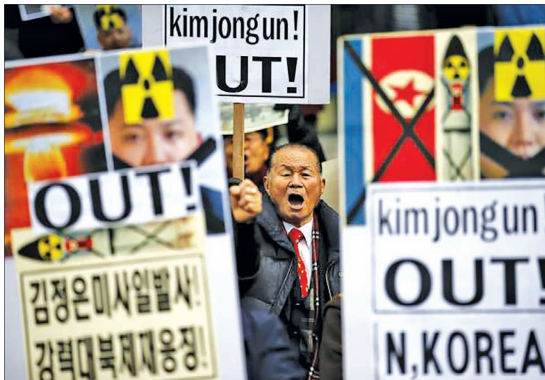
A man chants slogans during an anti-North Korea rally in central Seoul, South Korea, on 11 February 2016.

He said South Korea should be independent from ally Washington's so-called nuclear umbrella to deter North Korea's nuclear threat, or reconsider deployment of US tactical nuclear weapons, which were withdrawn from