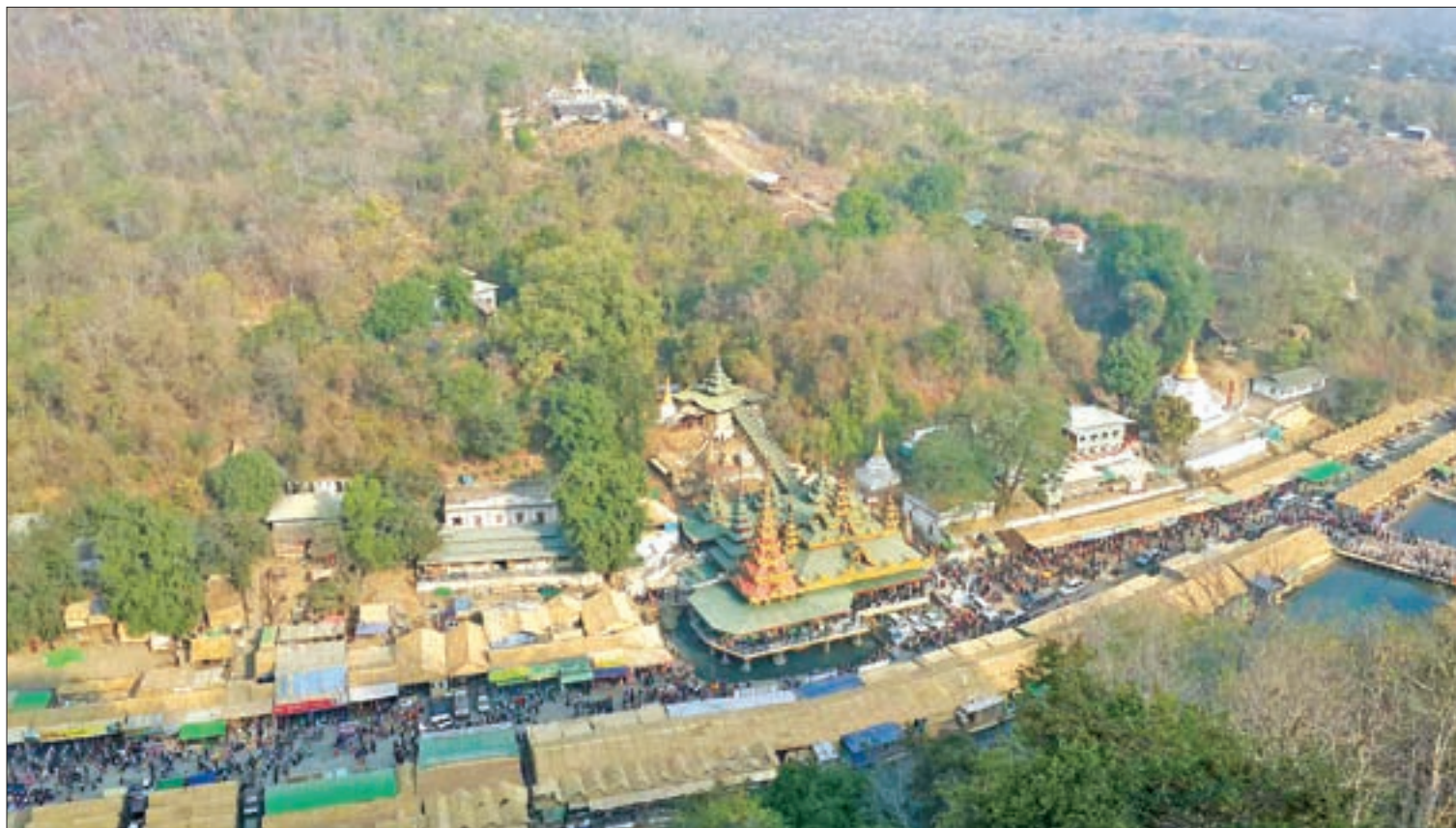
Photo shows Mann Shwe Settaw in Minbu during the pagoda's festival in 2015.