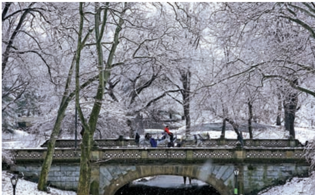
A horse carriage crosses a bridge in Manhattan's Central Park during a snowfall in New York City, on 5 February.

"Name a Roach," a campaign to benefit New York's Bronx Zoo, has been so wildly popular among rejected lovers and others