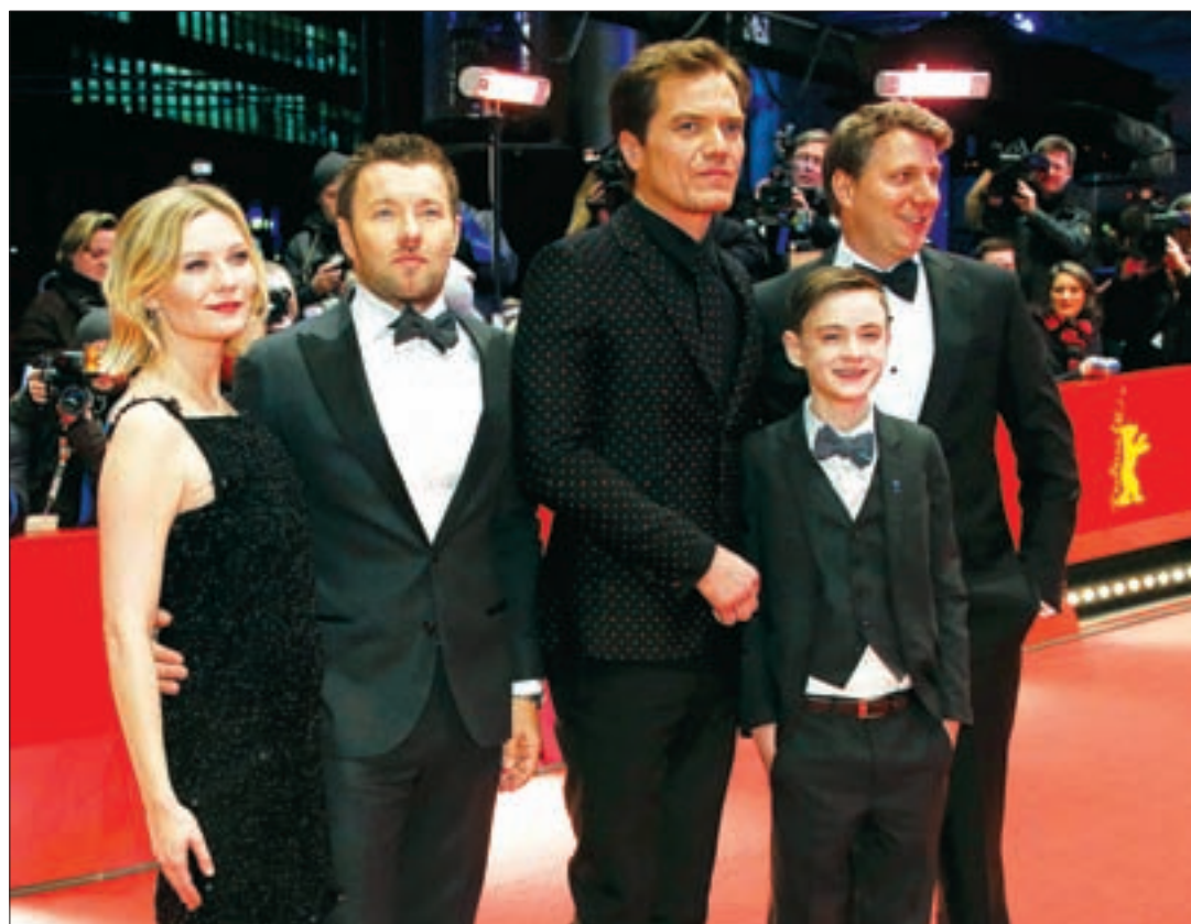
Actors Kirsten Dunst, Joel Egerton, Michael Shannon, Jaeden Lieberher and director Jeff Nichols (L-R) arrive on the red carpet for the screening of the movie 'Midnight Special' at the 66 th Berlinale International Film Festival in Berlin, on 12 February.

West is due to perform on TV sketch show "Saturday Night Live" this weekend to promote his new album "The Life of Pablo." It was not clear on Friday whether he would attend the Grammys on Monday.