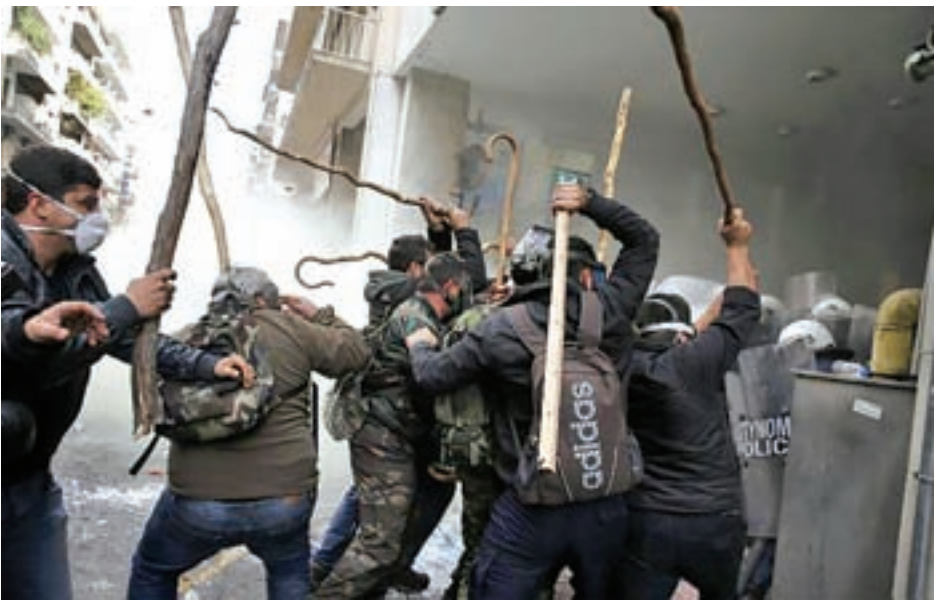
Greek farmers from the region of Crete clash with police during a protest against planned pension reforms outside the Agriculture ministry in Athens, Greece, on 12 February.

ATHENS — Angry Greek farmers clashed with riot police in Athens then paraded their tractors and pick-ups outside parliament on Friday, in their first big protest in the capital against pension reform plans after weeks of road blockades. Officers guarded the entrance to the agricultural ministry and fired tear gas to disperse protesters who hurled tomatoes, eggplants and stones at the building, smashing windows and using shepherd's crooks to repel police during scuffles. "They won't make us bend!," the protesters shouted. After the afternoon violence died down, farmers drove their vehicles through crowds outside parliament, blocking the road and shouting slogans against the pensions overhaul which will bring in tax hikes and a tripling of their social security contributions. Cheered on by supporters waving Greek flags, they honked horns as police in riot gear stood guard. A few demonstrators burnt olive branches while others unfurled a large banner reading: "Take back this monstrous reform plan." Some farmers pitched