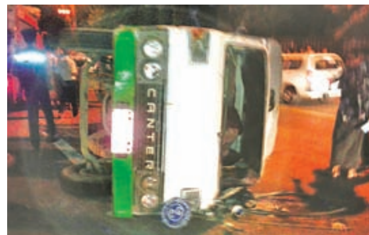
A light truck seen overturned.

Police are searching for the driver and have filed charges against him.