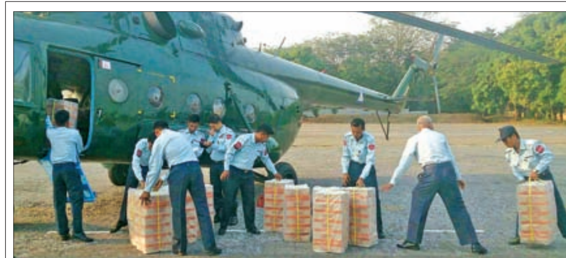
Members of the Tatmadaw loading aid onto a helicopter to send to fire victims in Palaw. MYAWADY ( News on page 1)