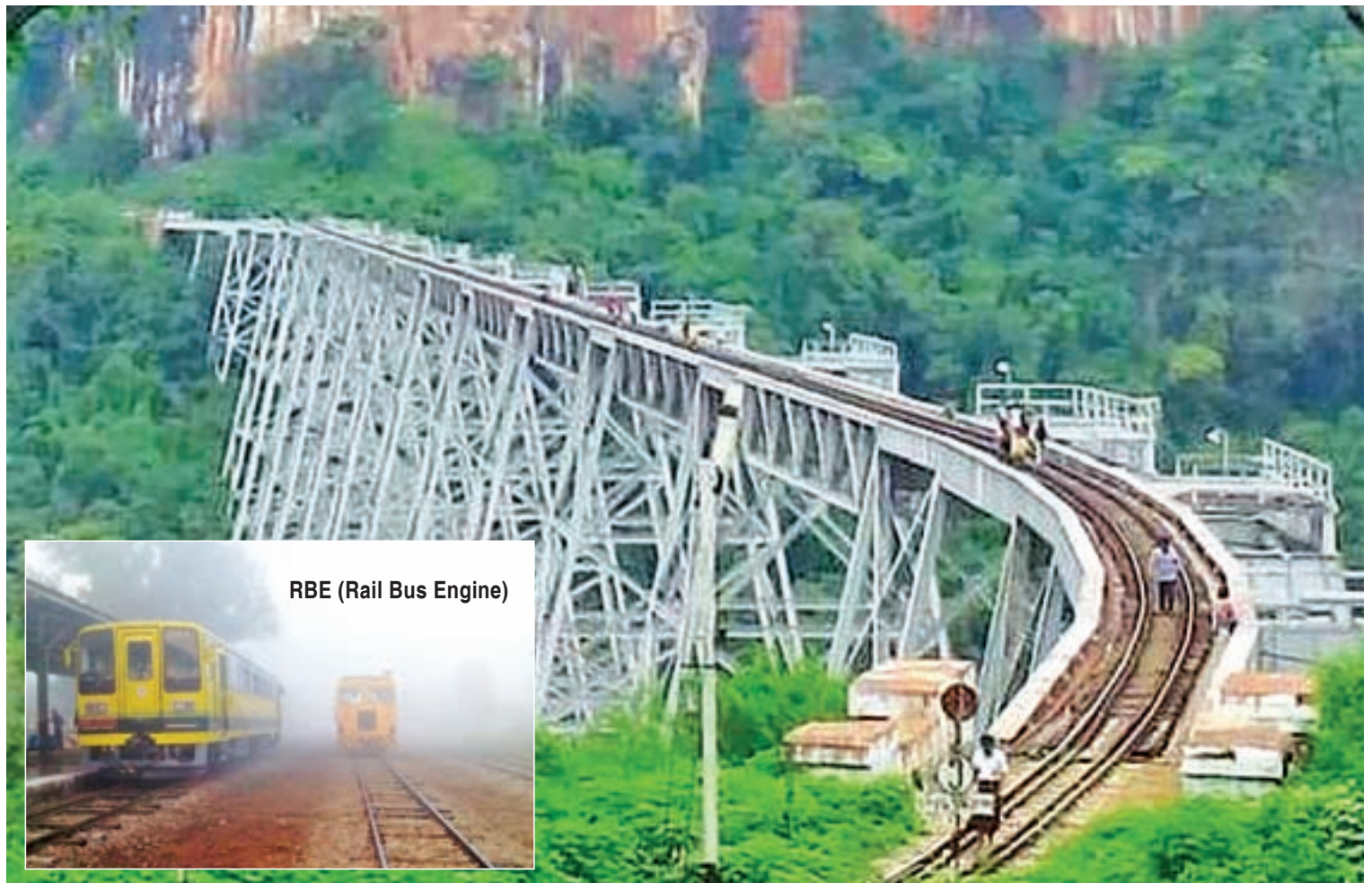
Gokteik Viaduct in northern Myanmar.

The Gokteik viaduct is recognised as the "The World's Largest Trestle" and was built by the Pennsylvania Maryland Bridge & Construction Co. Ltd in 1930. The construction period was nine months and the entire project came in at a cost of £113, 200. A total of 4,300 tonnes of metal was used in its construction.