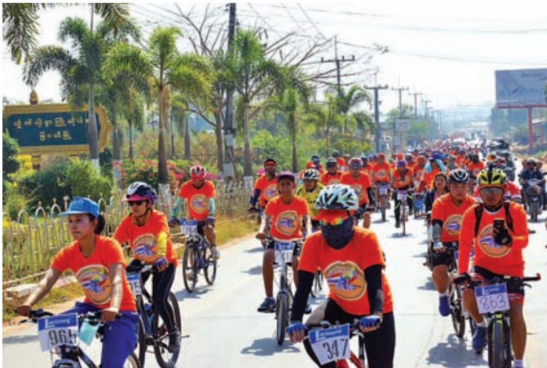
Cyclists seen at the 17 th Thai-Myanmar Friendship Bicycle Rally.

TO promote the bilateral relationship between Myanmar and Thailand and to strengthen ties between citizens of both countries the 17 th Thai-Myanmar Friendship Bicycle Rally was held at the No. 1 Thai-Myanmar Friendship Bridge in Myawady yesterday.