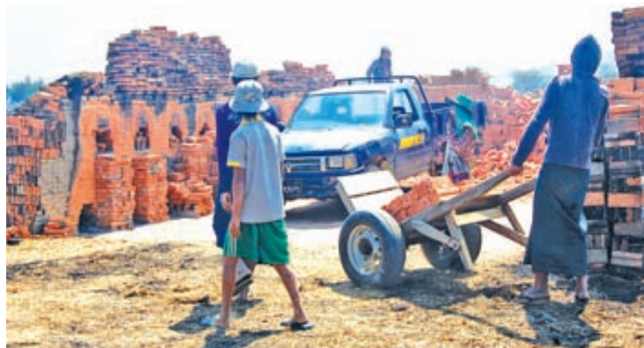
Workers in an earthen brick workplace in Thahton Township.

LOCAL earthen brick makers in Thahton Township, Mon State reported a small decline in their profits as they are seeing low demand for their products this year compared with 2015.