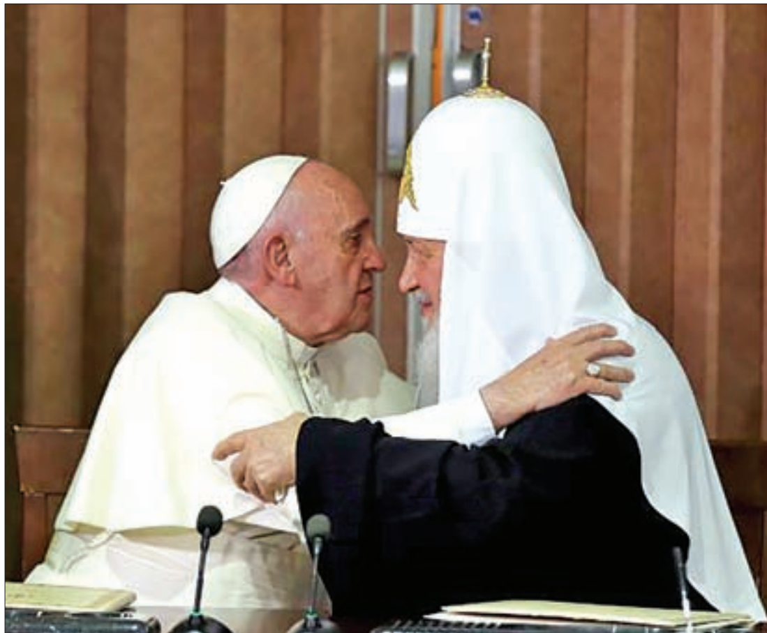
Pope Francis (L) and Russian Orthodox Patriarch Kirill hug each other after signing agreements in Havana, on 12 February.

HAVANA — Pope Francis and Russian Orthodox Patriarch Kirill embraced and kissed on Friday in a historic meeting, uniting to issue a global appeal for the protection of Christians under assault in the Middle East.