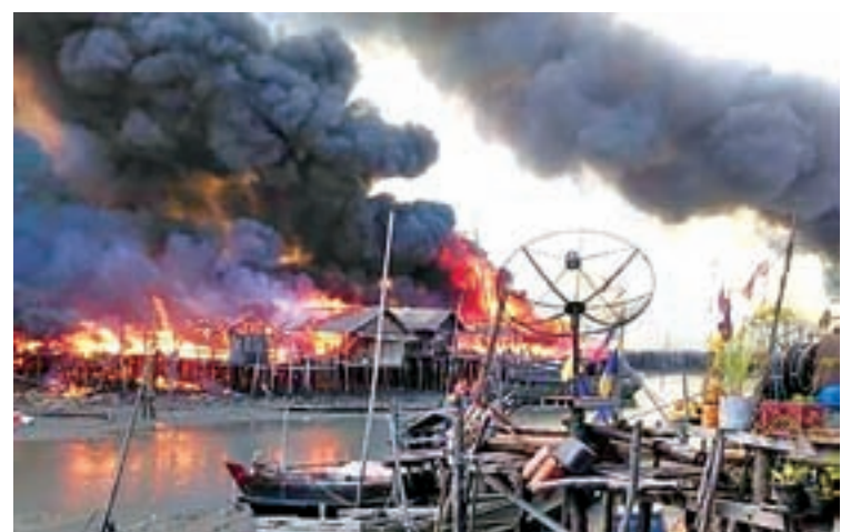
Fire engulfs homes in Kyaukka Village in Palaw Township.

In the evening, families of the navy, the army and the air forces sent 200 cartons of noodles alongside kitchen utensils on two military helicopters. —Myit Oo (Myeik)