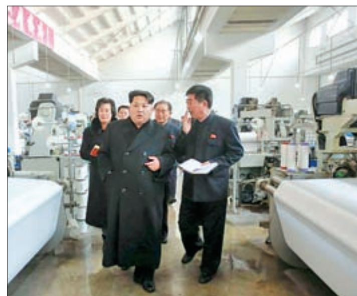
North Korean leader Kim Jong Un provides field guidance to the Kim Jong Suk Pyongyang Textile Mill, in this undated file photo released by North Korea's Korean Central News Agency (KCNA) in Pyongyang on 28 January 2016.

Penalties include seizure of assets, visa bans and denial