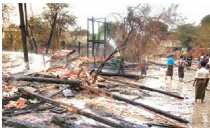
Damaged houses seen in Sint Kwin village.