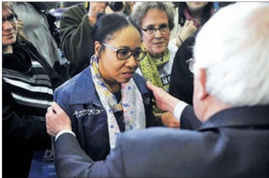
US Democratic presidential candidate Bernie Sanders speaks to a supporter at a campaign rally at Iowa Wesleyan University in Mount Pleasant, Iowa in a 29 January.

ORANGEBURG, (S.C.) — If Democratic hopeful Bernie Sanders has a chance of drawing African-American voters away from rival Hillary Clinton in South Carolina's presidential nominating contest on 27 February, his best opportunity will be among the young.