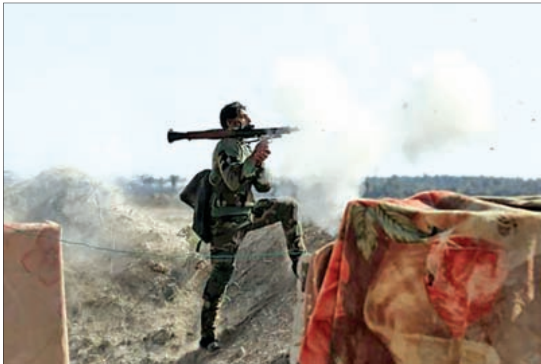
An Iraqi soldier launches a rocket-propelled grenade towards Islamic State militants, west of Falluja, on 4 February.

huge boost for Iraqi forces who, backed by air strikes from a US-led coalition, reclaimed the western city of Ramadi from Islamic State in late December.