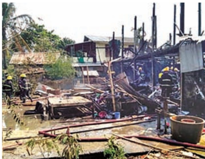
Burnt houses seen on Mahar Swe road in Hlaing Thayar.

On the same day, a fire broke out due to mosquito coils on Nawaday road. According to the investigation Daw Myint, who lives in squatter's hut, used the mosquito coil and left the hut. A fire broke out and quickly got out of control. Local police have filed charges against Daw Myint, 43, and Ma Wah Wah, 26.— Than Htet (HlaingThayar)