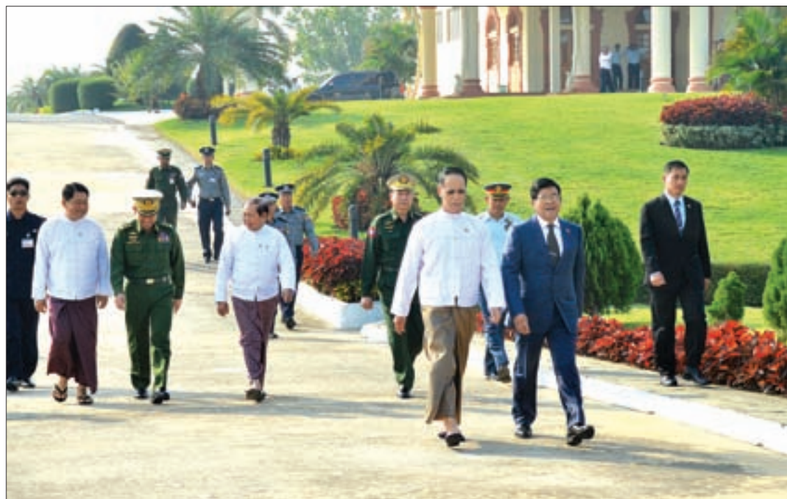
Vice President U Nyan Tun is seen off by Vice President Dr Sai Mauk Kham as he departs from Nay Pyi Taw to the United States of America.