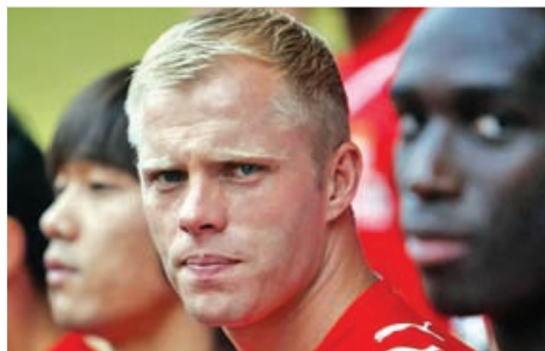
Eidur Gudjohnsen of Island (C) poses with Chu-Young Park of South Korea (L) and Yannick Sagbo of France (R) during the official team photo of A.S Monaco soccer team in Monaco in 2009.

OSLO — Former Chelsea and Barcelona striker Eidur Gudjohnsen has signed a two-year deal with Norwegian side Molde as he bids to secure a place in Iceland’s 2016 European Championship squad.