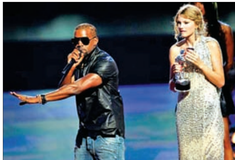
Kanye West (L) interrupts the acceptance speech from best female video winner Taylor Swift (R) at the 2009 MTV Video Music Awards in New York, in 2009.

NEW YORK — Looks like Taylor Swift and Kanye West are never, ever getting back together.