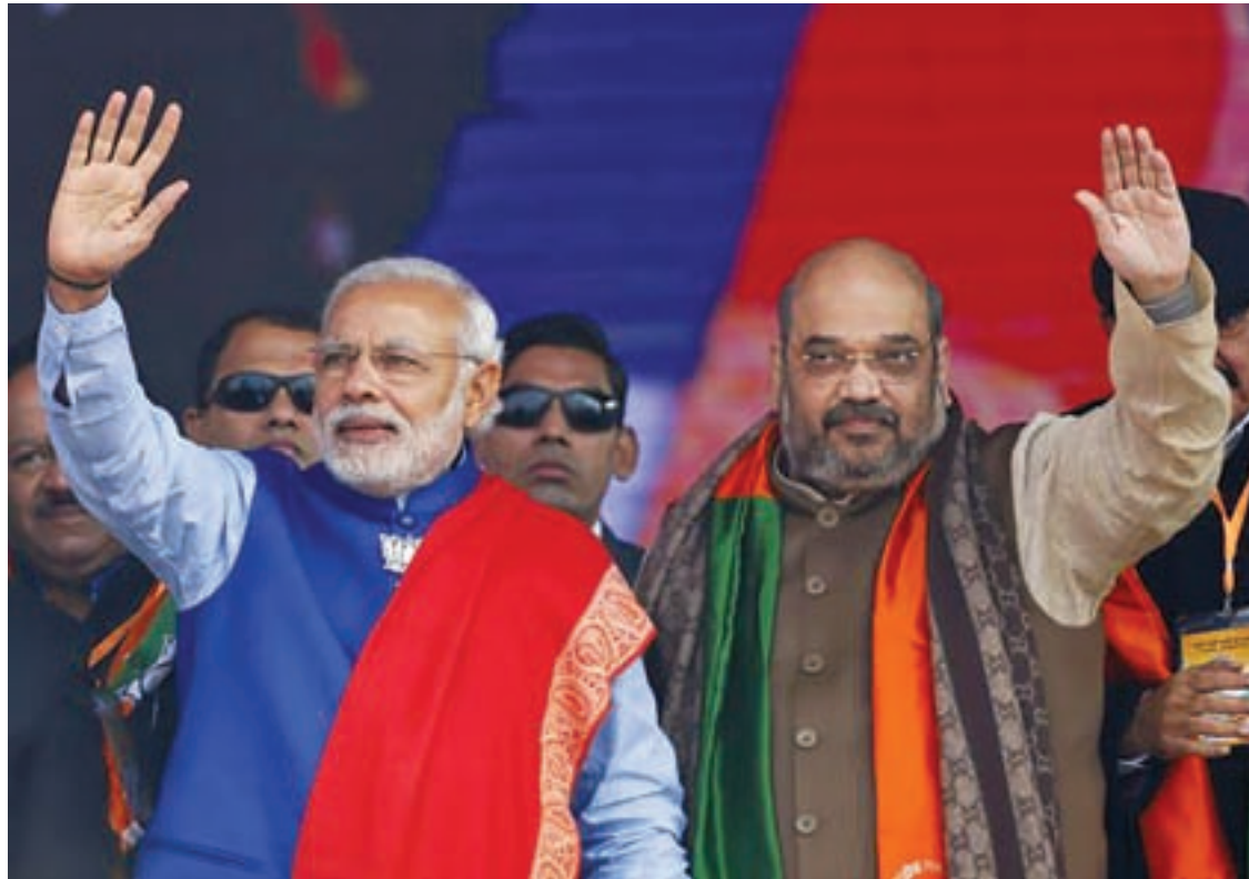
Indian Prime Minister Narendra Modi and Amit Shah, the president of India's ruling Bharatiya Janata Party (BJP), wave to their supporters during a campaign rally ahead of state assembly elections at Ramliila ground in New Delhi, India, in 2015.

Despite two major state poll defeats since, the BJP recently re-appointed Amit Shah as its campaign manager, counting on