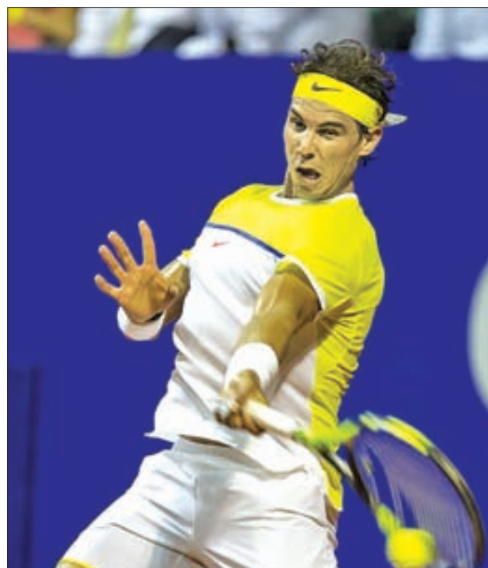
Spanish tennis player Rafael Nadal hits a return to Argentina’s Juan Monaco during the match of the ATP Argentina Open at Buenos Aires Lawn Tennis Club in Buenos Aires, capital of Argentina, on 11 February.

Tomorrow, in order to contest a place in the final, Nadal will face Australia’s Dominic Thiem, who saw off Serbia’s Dusan Lajovic in the quarter-finals.—Xinhua