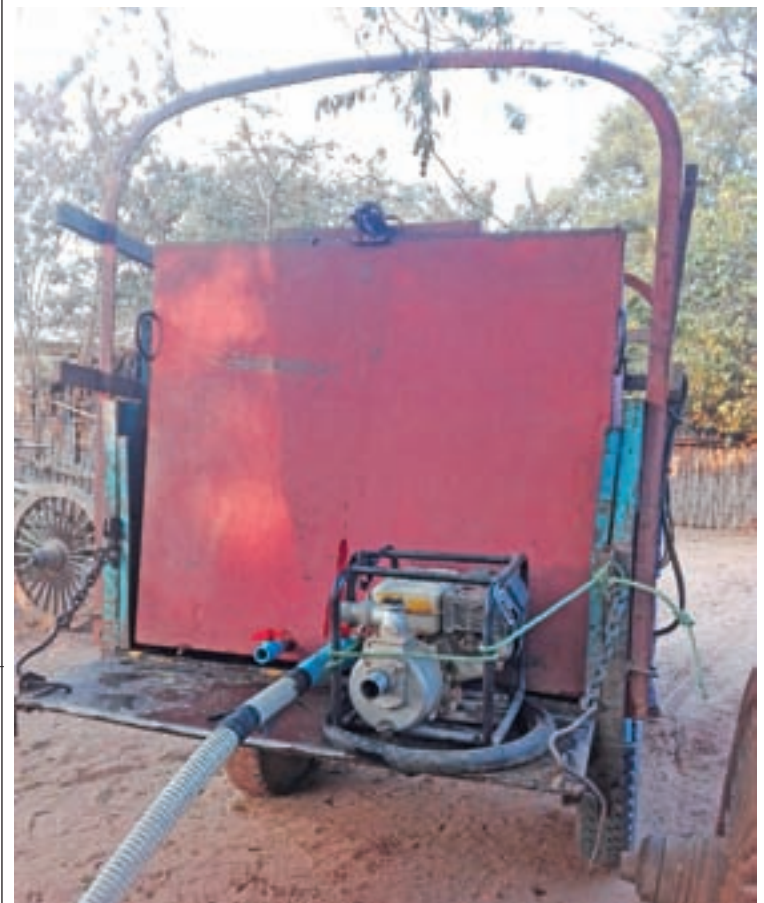
A water bowser seen.

"We normally collect water from the Kyaukku River Pump and a drain near Myenaelay Village," a water-seller said. "This business produces good profit because of the falling price of petroleum." — Myo Min Aung