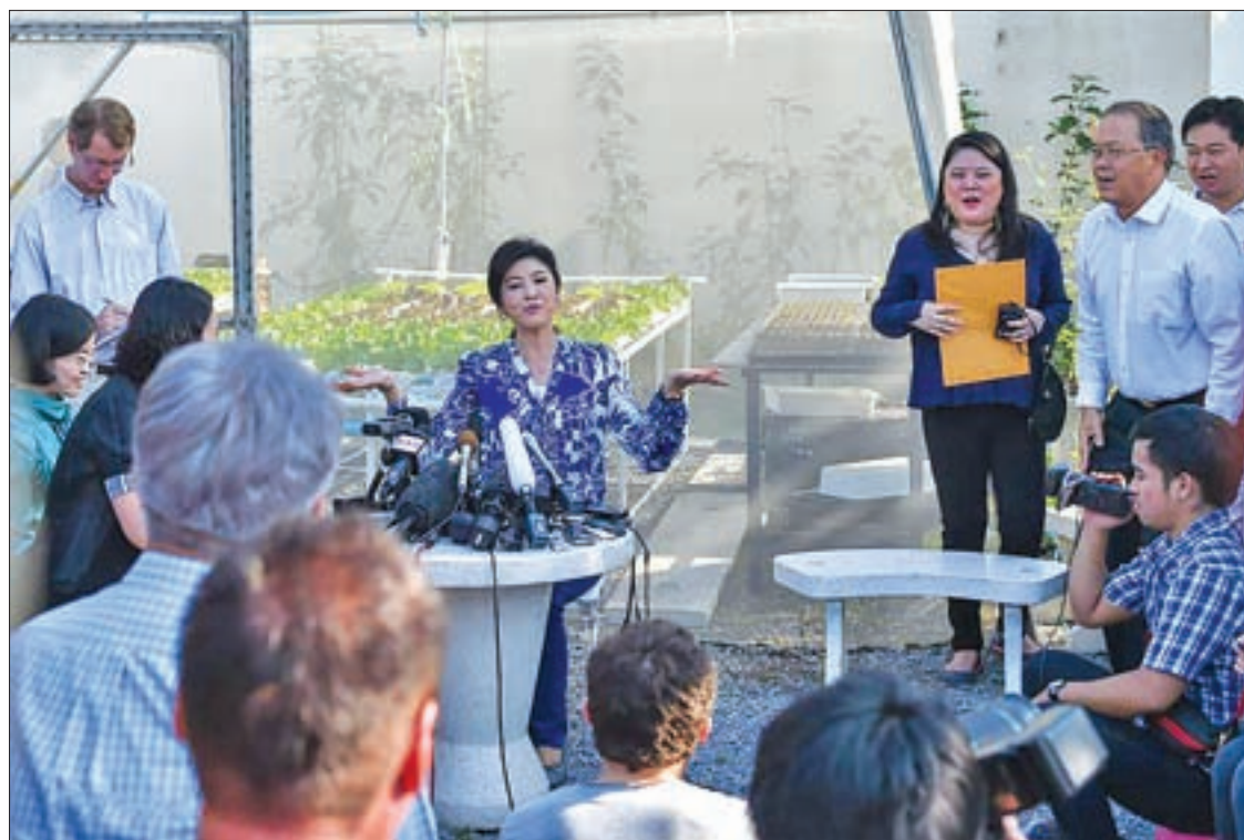
Former Thai Prime Minister Yingluck Shinawatra talks with foreign journalists during a reception at her residence in the northeastern suburb of Bangkok, Thailand, on 12 February 2016. Yingluck met with foreign journalists and attended a joint interview during a reception held at her residence on Friday.

Besides multiple charges in court, Yingluck faces a five-year