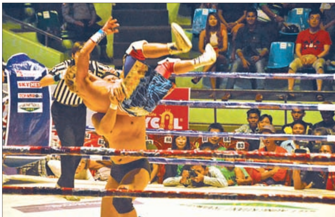
Two wrestlers competes in first WWE-like wrestling in Yangon.

Last July and August, 12 of 14 regions and states across the country encountered unprecedented floods which left hundreds of thousands homeless and destroyed farmlands.—Ko Thet (Botahtaung)