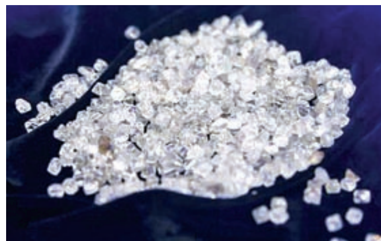
Diamonds are seen during an exhibition in Gaborone, Botswana, in November 2015.

Of 5,090 minerals known worldwide, fewer than 100 make up 99 per cent of the Earth's crust. Most are from common elements such as oxygen, silicon and aluminum. Some of the 2,550 rare minerals defined in the study might have commercial properties, from electronics to batteries, if they could be manufactured, the authors said. —Reuters