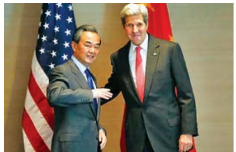
US Secretary of State John Kerry and China's Foreign Minister Wang Yi chat before a bilateral meeting in Munich, Germany, on 12 February 2016.

In Seoul, the US military stationed in South Korea said it had deployed an additional Patriot