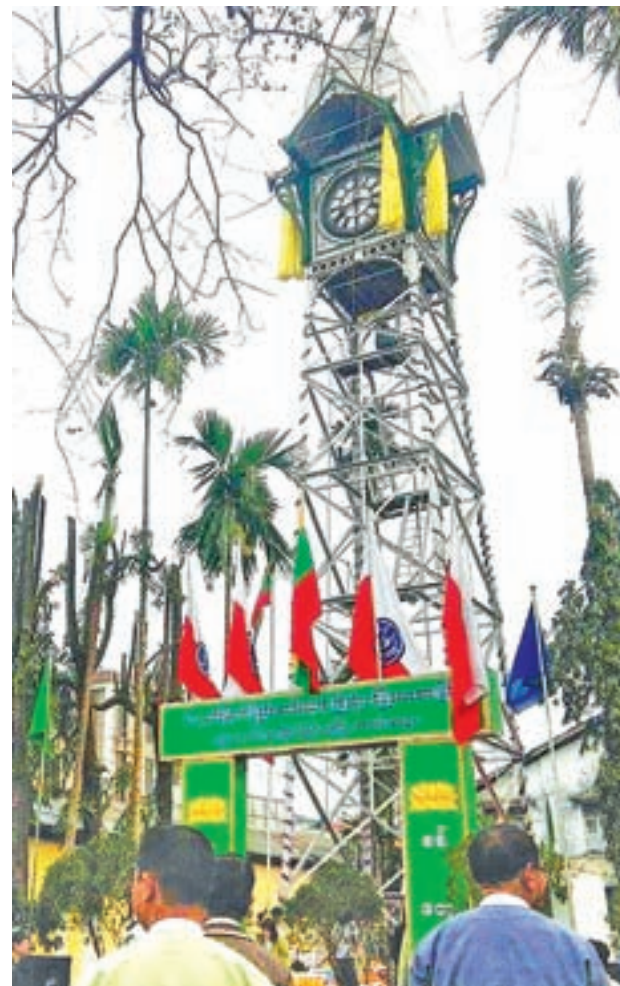
The 127-year-old clock tower in Sittway.

The clock broke down in 1988 and has now been opened once again following renovations. — Myat Wai