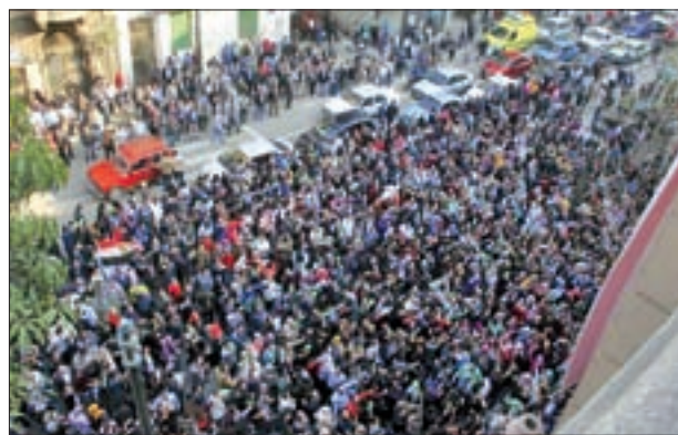
Egyptian doctors demonstrate in front of the Doctors Union in Cairo, Egypt, on 12 February.