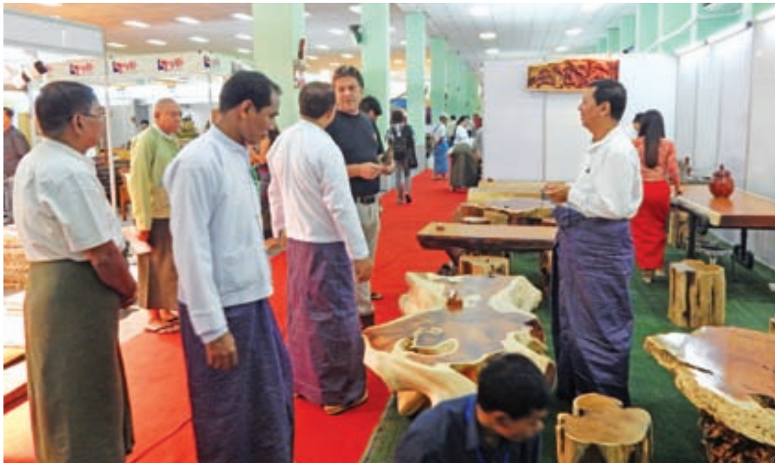
Visitors look at the furniture at Myanmar International Furniture Expo 2016 at the Tatmadaw Hall.

THE four-day Myanmar International Furniture Expo 2016 was opened at the Tatmadaw Hall in Yangon on Friday in grand fashion.