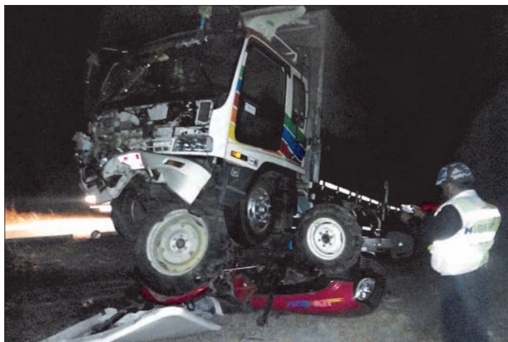
An official investigates the site of the incidence.