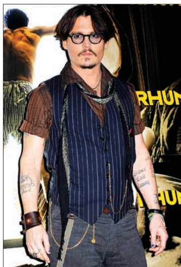
Johnny Depp.

"I'd say the absolute truth is that I respect Leo a lot. He worked really hard on that film and spent a lot of time researching. He came to set and he was ready to work hard and all his ducks were in a row."