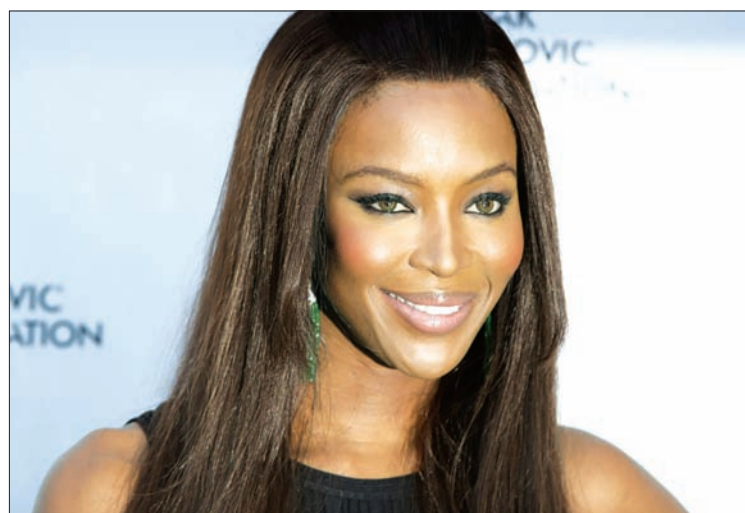
Model Naomi Campbell.

LONDON — Model Naomi Campbell gave Gigi Hadid a catwalk masterclass before the Victoria's Secret fashion show.