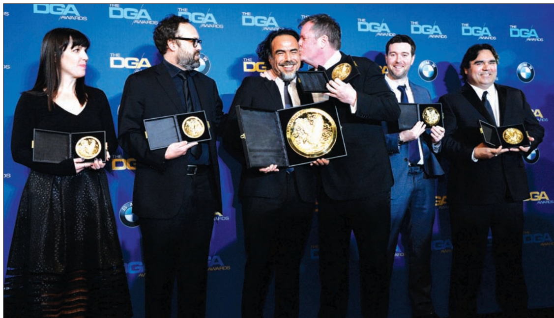
Alejandro G. Inarritu (3 rd L) accepts the Feature Film award for "The Revenant" as he poses with crew members during the 68 th annual DGA Awards in Los Angeles on 6 February 2016.

LOS ANGELES — Hollywood's directors named Alejandro Inarritu the best film director of 2015 for "The Revenant" at a gala ceremony on Saturday, helping focus the race for the Oscars.