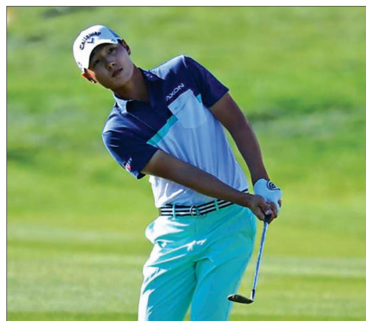
Danny Lee watches his fairway shot on the 17 th during the third round of the Waste Management Phoenix Open golf tournament at TPC Scottsdale.

"Pleased to get that round out of the way," said the world number four. "I didn't have my best stuff out there, saw a lot of putts slide by. "I was giving the greens a little too much credit and they were a little slow."—Reuters