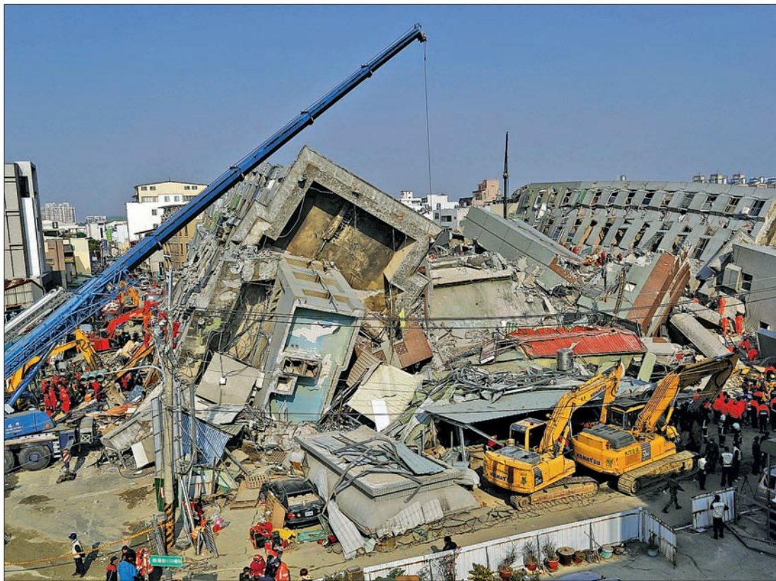
Rescue personnel work at the site where a 17-storey apartment building collapsed, after an earthquake in Tainan, southern Taiwan on 7 February 2016.

TAINAN — Rescuers in Taiwan pulled more people alive from a collapsed apartment tower on Sunday, a day after a strong earthquake shook the island, and kept searching for about 120 people still believed trapped in the ruins of the building.