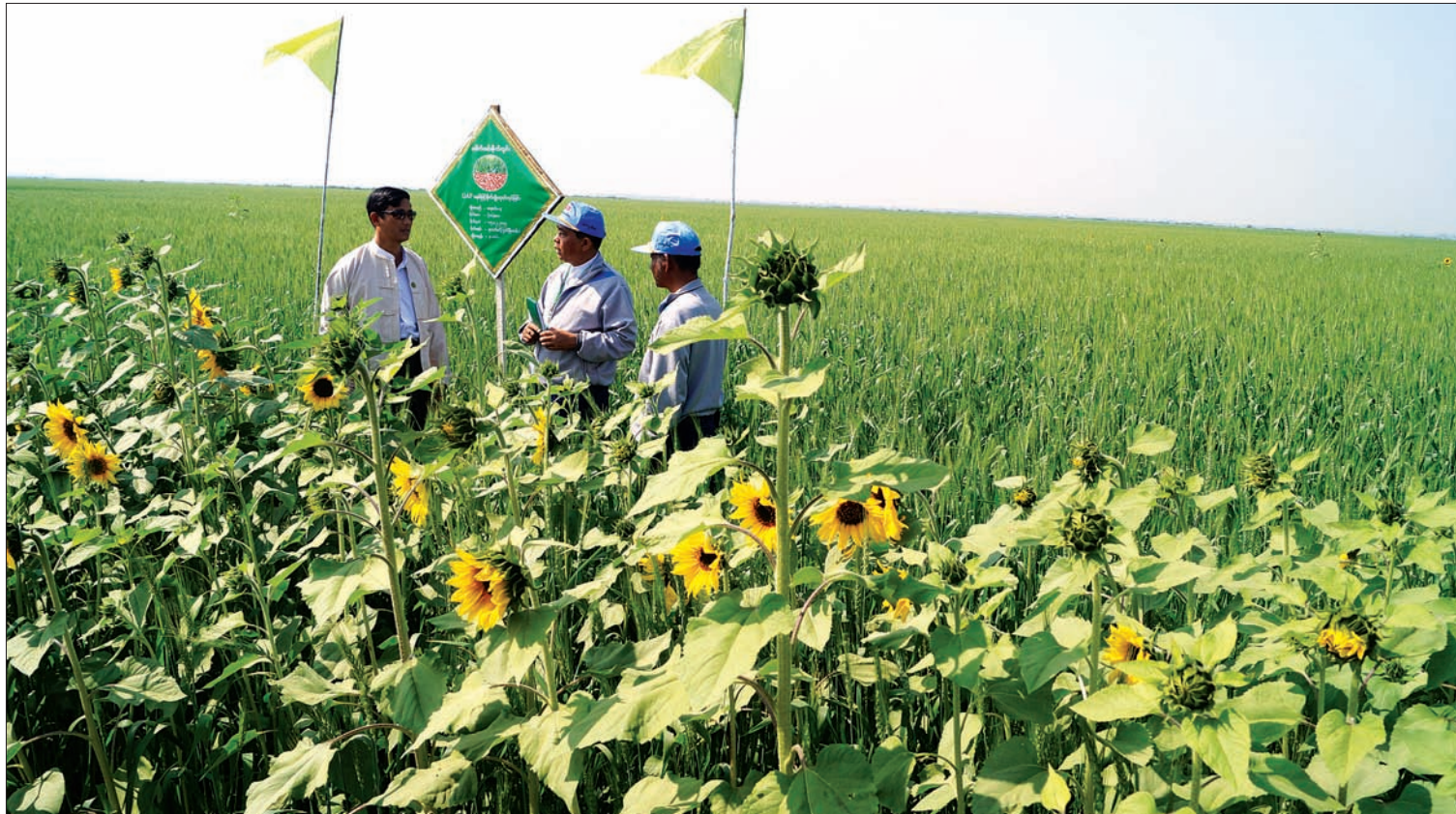
Officials inspect the sunflower plantation.

FARMERS in Lewe Township, Nay Pyi Taw Council Area, who saw losses in revenue due to downward prices and a low yield last year, have anticipated the fetching of good prices for their crop this year.