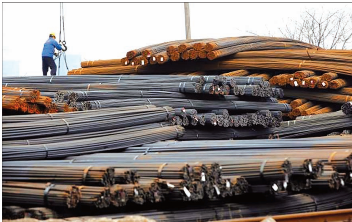
A labourer works at a steel market in Shanghai in 2013.

BEIJING — China's Ministry of Commerce said that claims it was dumping steel in Europe should be put to the World Trade Organisation (WTO), responding to reports that the European Commission (EC) was preparing to impose duties on imported Chinese steel.