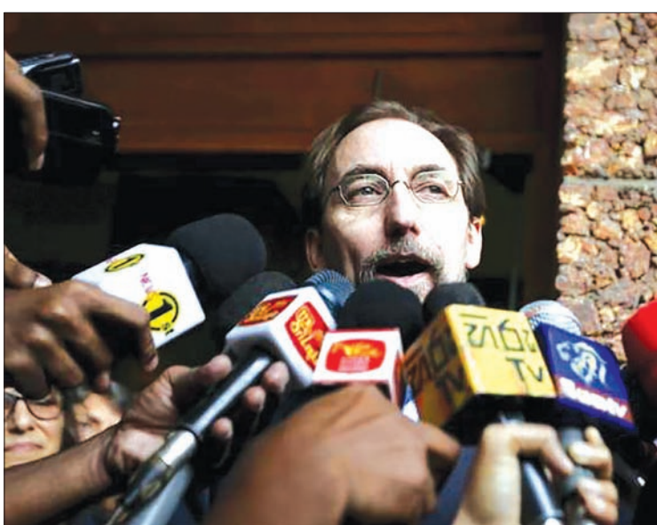
United Nations High Commissioner for Human Rights Zeid Ra'ad Al Hussein speaks to the media in Colombo, on 6 February 2016.

However, many Sri Lankans oppose foreign involvement and supporters of former president Mahinda Rajapaksa believe the