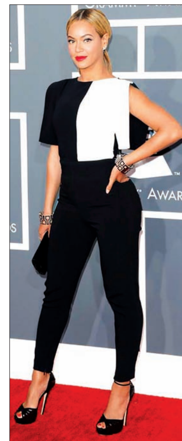
Pop diva Beyonce.

Last month, Queen Bey starred in the music video for Coldplay's single "Hymn for the Weekend." —PTI