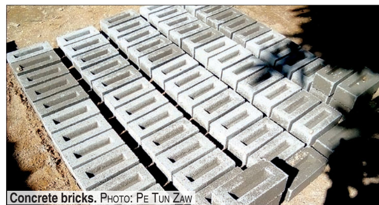
Concrete bricks.

One bag of cement can yield between 150 and 180 bricks, said a brick maker from Ward 8 in the township.—Pe Tun Zaw