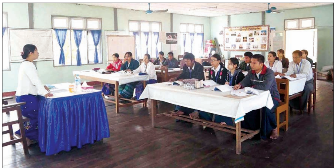
Capacity Building Course for government servants in progress.

TO improve the capacity of the staff, a refresher course for capacity building of government servants has been conducted at the office of the Information and Public Relations Department (IPRD) of Taungoo District.