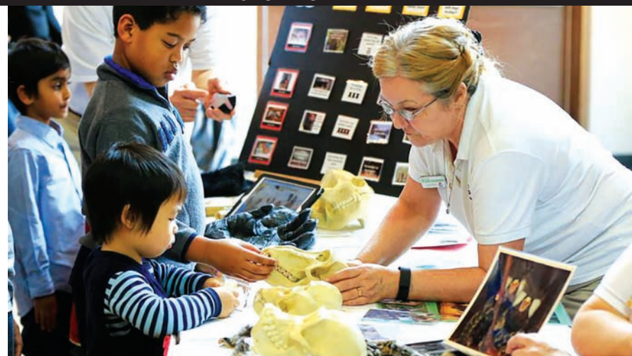
Kids learn about the knowledge of monkey during the 2016 Chinese New Year Celebration event at Chinese Cultural Centre of Greater Toronto in Toronto, Canada, on 6 February 2016.