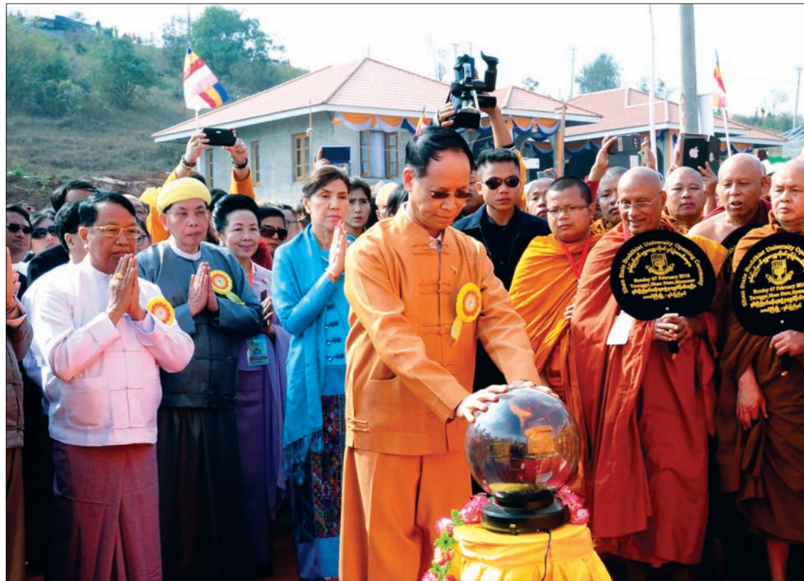
Vice President Dr Sai Mauk Kham opens Buddhist University in Taunggyi.

DURING a visit to Taunggyi, Vice President Dr Sai Mauk Kham attended several celebrations in honour of the 69th Shan State Day yesterday morning.