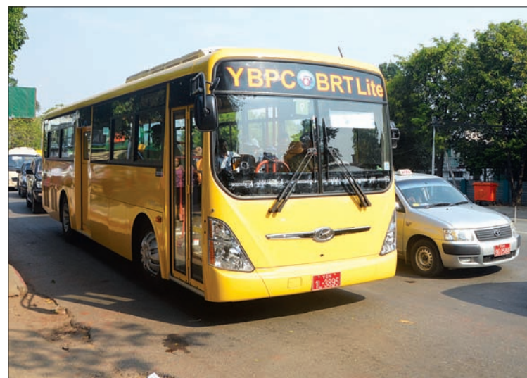
A BRT Bus seen playing.

Each bus can carry over 80 passengers. Plans are in place to run a line along Kabaraye Pagoda Road at the end of this month, during the project's second phase.— GNLM