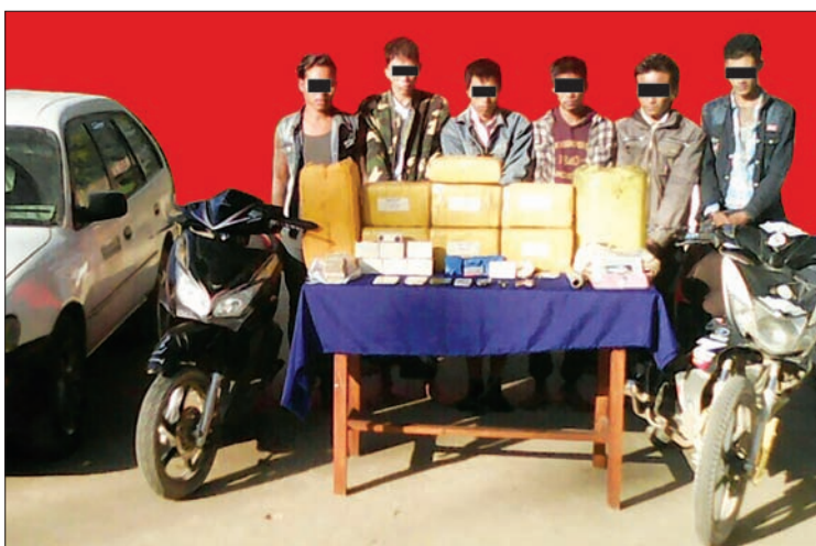
AN —anti-drug squad in Kalaw discovered 1,580 Yabba pills in the rooms at the Thama hotel and 13 kilograms of Marijuana in a