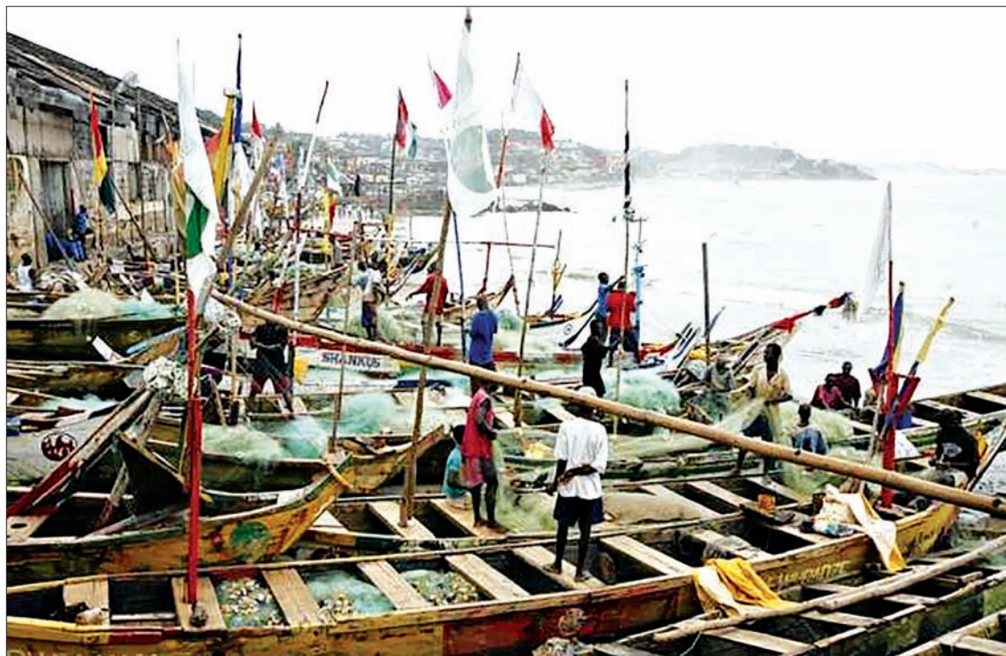
General view of the local fishing community in the Ghanaian town of Cape Coast on 9 July 2009.

NEW YORK — A cell phone tool to survey working conditions of Ghanaian fishermen and a mobile system to collect forced labour data are among the finalists in a global competition to harness technology to identify enslaved workers in supply chains, organizers said on 1 st February.