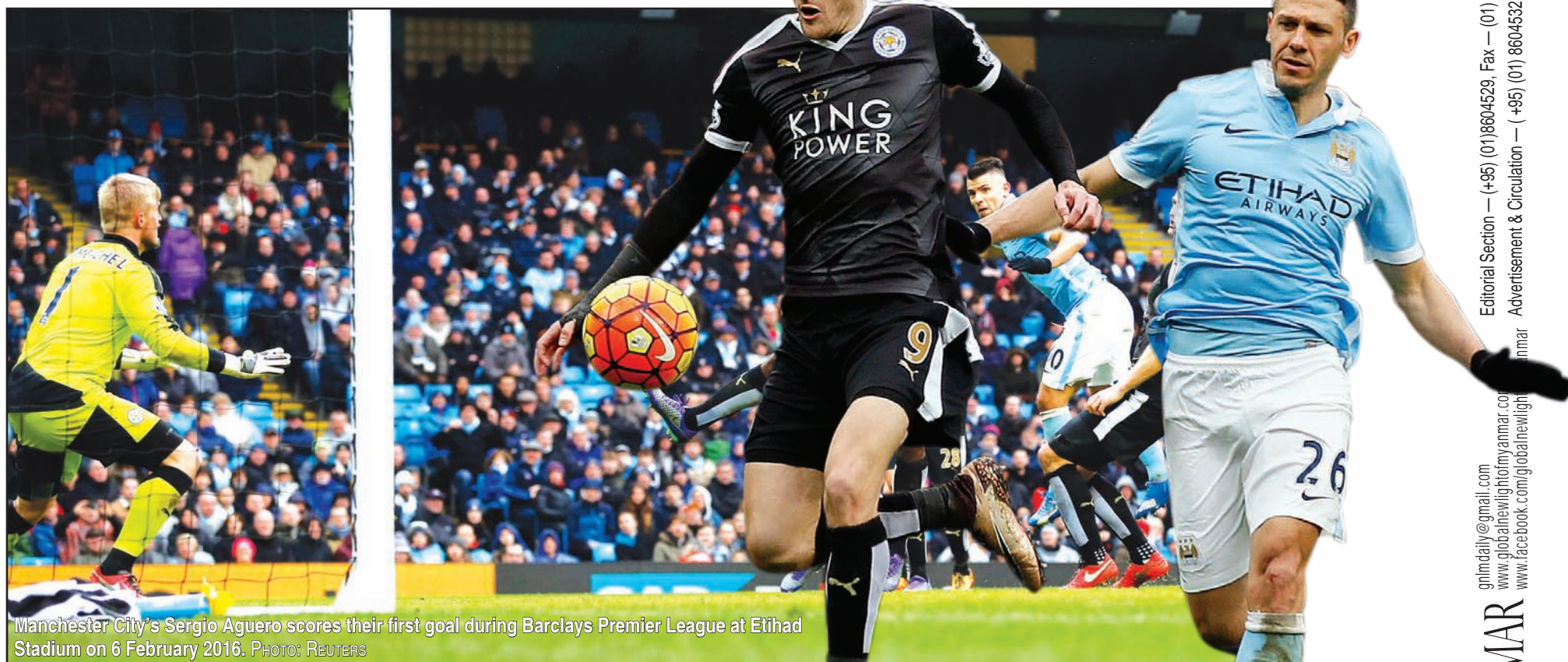
Manchester City's Sergio Aguero scores their first goal during Barclays Premier League at Etihad Stadium on 6 February 2016.