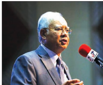
Malaysia's Prime Minister Najib Razak.

KUALA LUMPUR — Digitally savvy Malaysian police have been taking to social media to issue warnings to critics of scandal-hit Prime Minister Najib Razak in an unusual online campaign that critics say is unlikely to work.