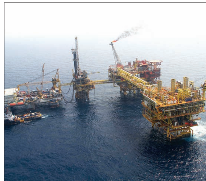
Yedagun offshore natural gas rig.

During his visit, the minister advised workers on how to speed up the implementation of project.— Myanmar News Agency