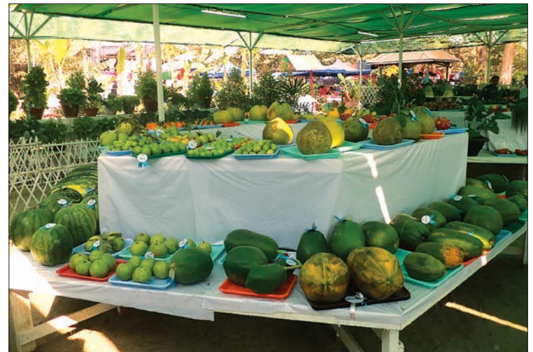
Fruits are displayed on the stand.