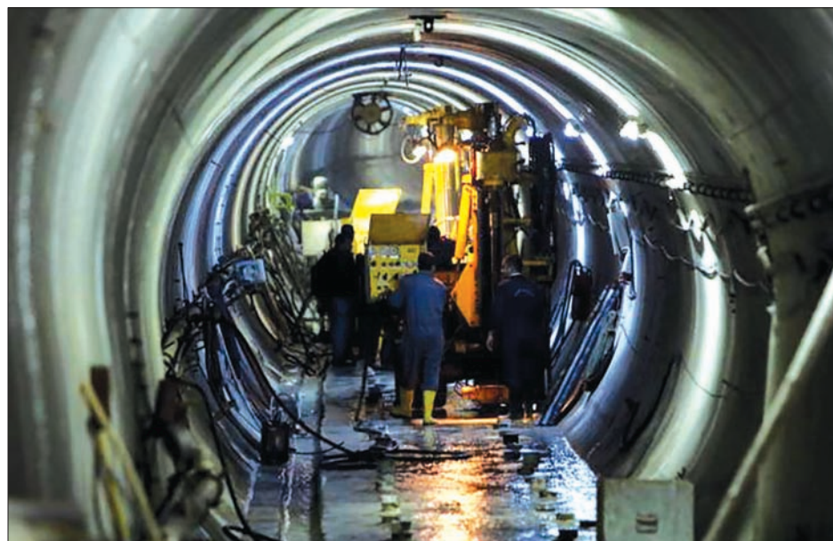
Employees work at strengthening the Mosul Dam in northern Iraq, on 3 February 2016.

BAGHDAD — Iraq's minister of water resources on Saturday played down warnings that Mosul dam will collapse, estimating only a "one in a thousand" chance of failure and saying the solution was to build a new dam or install a deep concrete support wall.