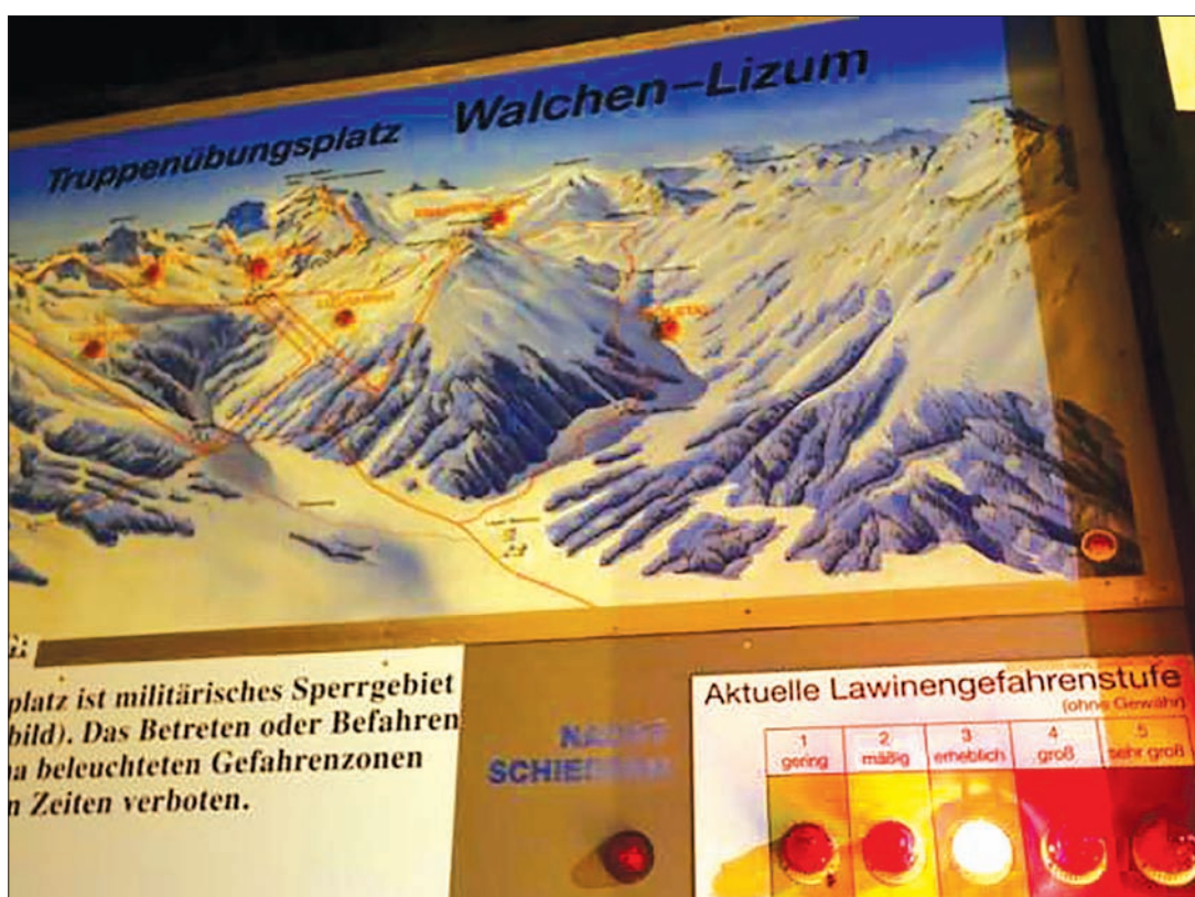
An avalanche warning sign is pictured in Wattental valley in Austria's skiing region of Tyrol on 6 February 2016.

The entire skiing region had been on a 'level three' avalanche alert, out of a maximum five, and several avalanches were also reported elsewhere.—Reuters