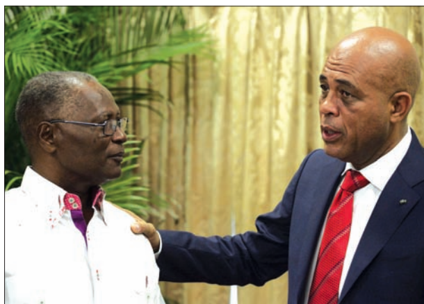
Haiti's President Michel Martelly (R) speaks with Senate President Jocelerme Privert after an agreement signing at the National Palace in Port-au-Prince, Haiti, on 6 February 2016.

"Despite this agreement, we will need to continue to remain vigilant because there are people who won't agree," Martelly said at an event with foreign diplomats at the palace.