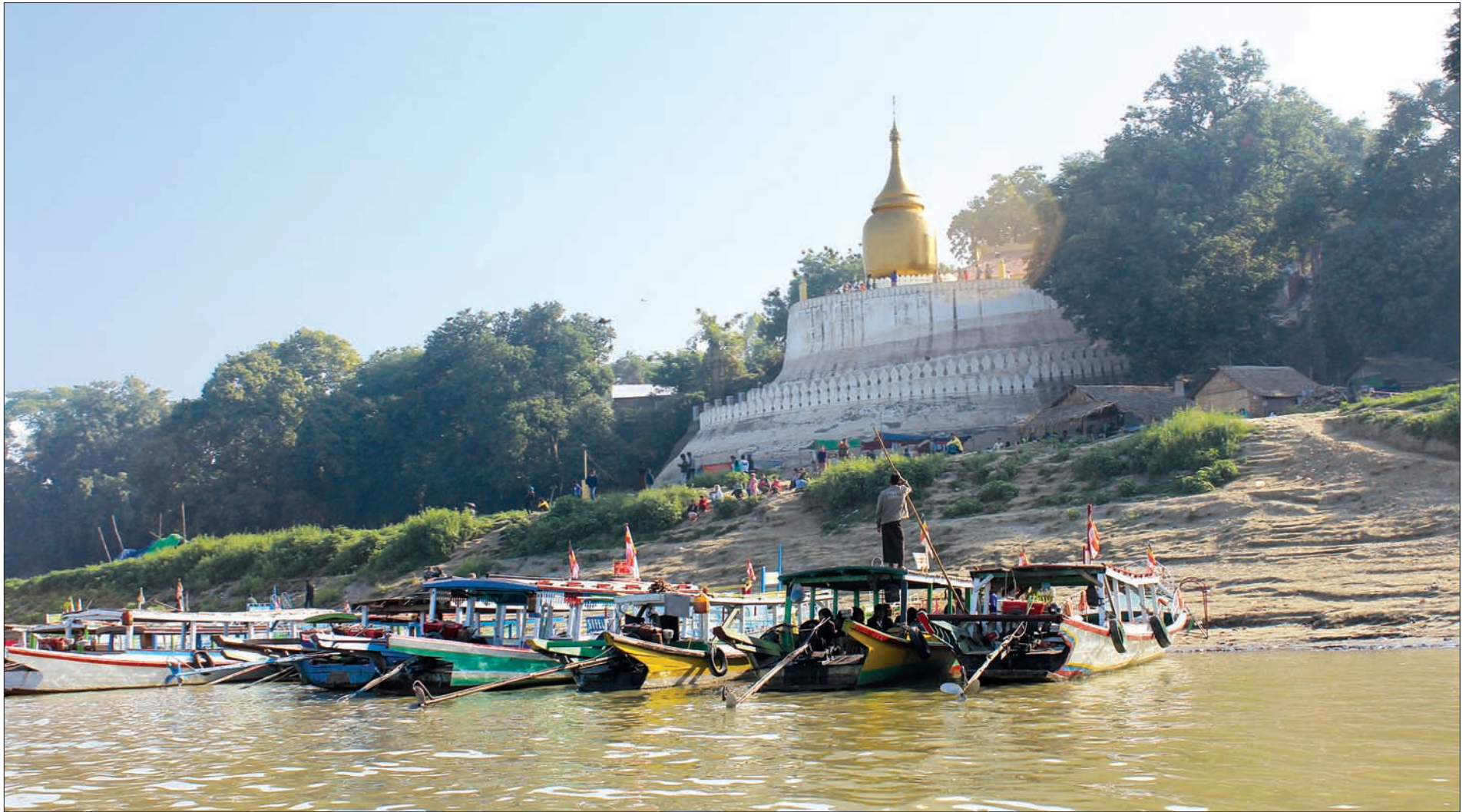
Boats are anchored in the Ayeyawady River in Bagan.

Vessels in Ayeyawady, Chindwin rivers charged new toll fees