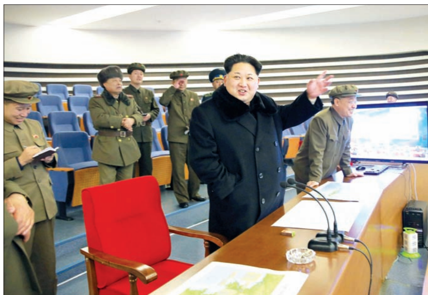
North Korean leader Kim Jong Un (C) reacts as he watches a long range rocket launch in North Korea, in this photo released by Kyodo on 7 February 2016.

Japan's Fuji Television Network showed a streak of light