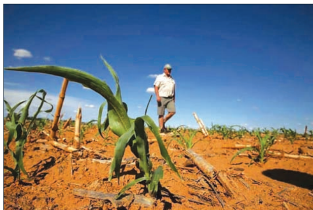
A farmer inspects his maize field in Hoopstad, Free State province, South Africa, on 22 January 2016.