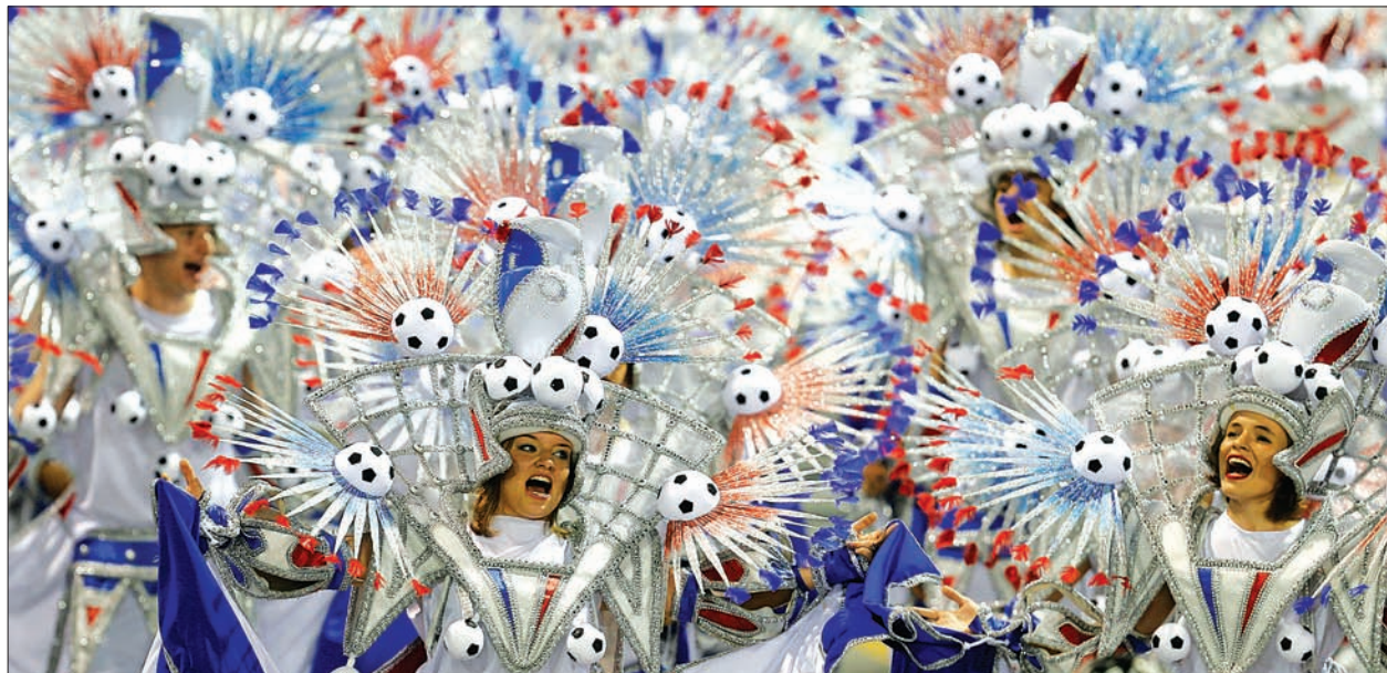
Revellers parade for the Vai-Vai samba school during the carnival in Sao Paulo, Brazil, on 7 February 2016.

Skoch said Chicago is a leader in the gourmet donut trend nationwide, ahead of New York and Portland, so it makes sense that new shops want to take on a local favourite.—Reuters