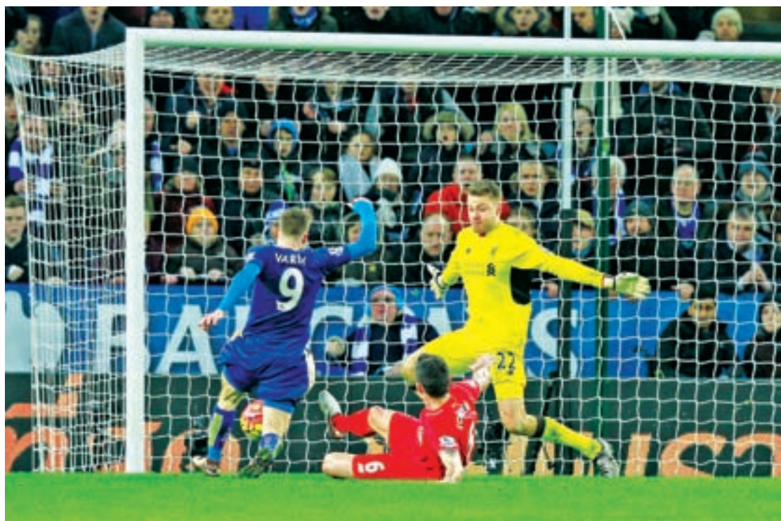
Jamie Vardy scores the second goal for Leicester City against Liverpool during their Barclays Premier League at King Power Stadium on 2 February.

They had not scored in the first half of their last 11 home matches, piling pressure on the Dutchman, but they turned on