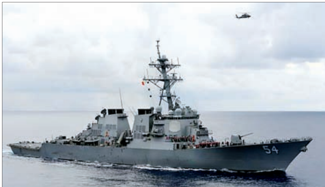
The US Navy guided-missile destroyer USS Curtis Wilbur patrols in the Philippine Sea in 2013.

MANILA — The United States is open to the possibility of joint naval patrols with the Philippines in the South China Sea, a US diplomat said yesterday, stressing it would continue to exercise “freedom of navigation” in the disputed waters.