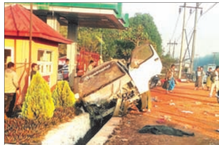
Super Custom seen perching on a drainage.

Police from Theinzeik station are searching for the driver and have deemed him guilty of careless driving.— Khon (Win Pa)