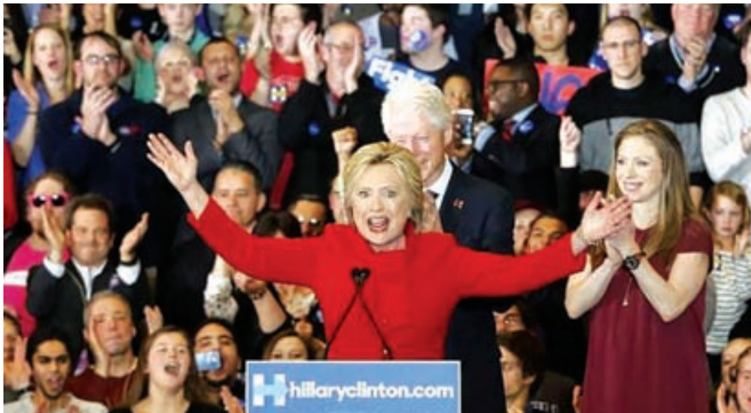
Former US President Bill Clinton applauds his wife, Democratic U.S. presidential candidate Hillary Clinton, as they appear with their daughter Chelsea (R) at Mrs. Clinton's caucus night rally in Des Moines, Iowa, on 1 February.

DES MOINES, (Iowa) — Hillary Clinton's struggle in Iowa to fend off underdog Bernie Sanders, a self-described democratic socialist, reignited questions about her ability to close the deal with Democratic voters and turned up the pressure on her high-profile White House campaign.