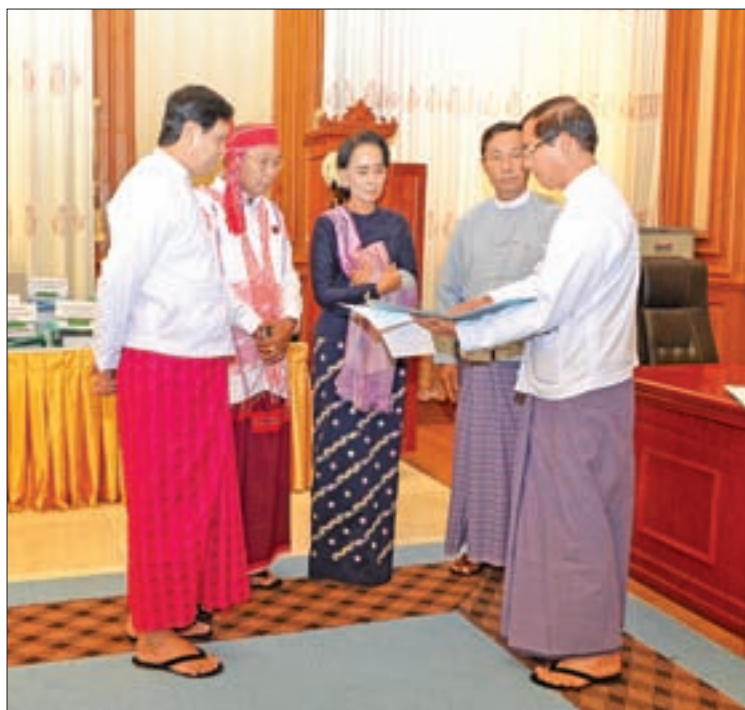
Thura U Shwe Mann hands over parliamentary procedures to incoming Pyidaungsu Hluttaw Speaker U Mann Win Khaing Than.

THURA U Shwe Mann who served as First Pyidaungsu Hluttaw Speaker congratulated Speaker of Amyotha Hluttaw Mann Win Khaing Than who is going to serve as the Speaker of the Second Pyidaungsu Hluttaw, elaborating on parliamentary procedures at the office of Pyidaungsu Hluttaw Speaker in Nay Pyi Taw yesterday.