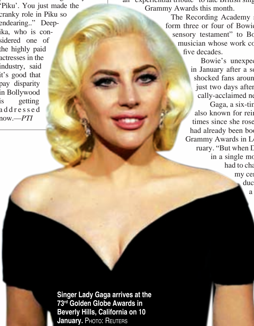
Singer Lady Gaga arrives at the 73rd Golden Globe Awards in Beverly Hills, California on 10 January.

Adele is far from the only pop or rock star to have seen politicians co-opt their music for political purposes. Rock band R.E.M. lashed out in September at Trump for using its hit song, "It's the End of the World" at a rally, and Frankie Sullivan complained about the use of the band's 1982 hit "Eye of the Tiger," at a news conference in September featuring Kim Davis, a county clerk in Kentucky briefly jailed for refusing to issue gay marriage licenses.—Reuters