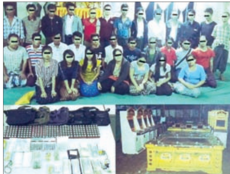
Gamblers and owner of gambling centre in Mayangone Township are seen.

THE Yangon Policed Force raided a gambling centre in Mayangone Township, Yangon, and arrested the owner, shop assistants and gamblers on Tuesday.