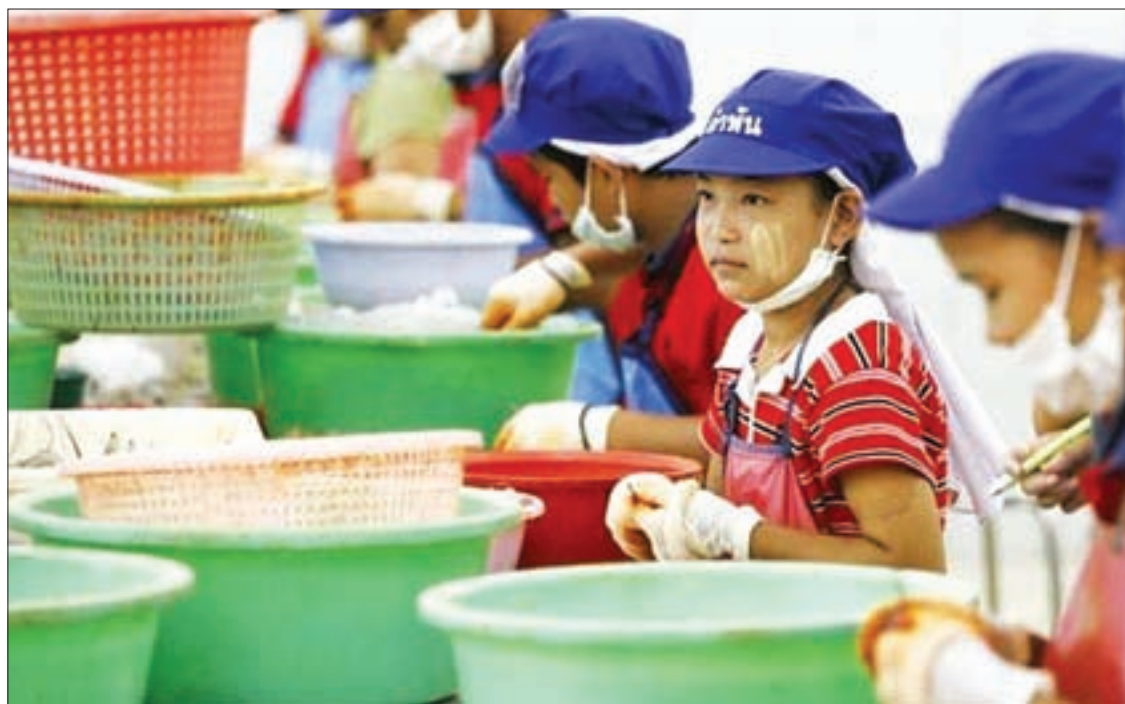
Tae (C), a 13-year-old girl from Myanmar, peels shrimp at a factory in Samut Sakhon, nearly 40 km (25 miles) south of Bangkok in 2007.

downgraded Thailand in 2014 to its "tier 3" of worst offenders for human trafficking, while the European Union gave it a "yellow card" in April for failing to clamp down on problems in its fishing industry.