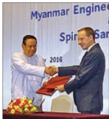
Officials exchange the documentary at the signing ceremony.