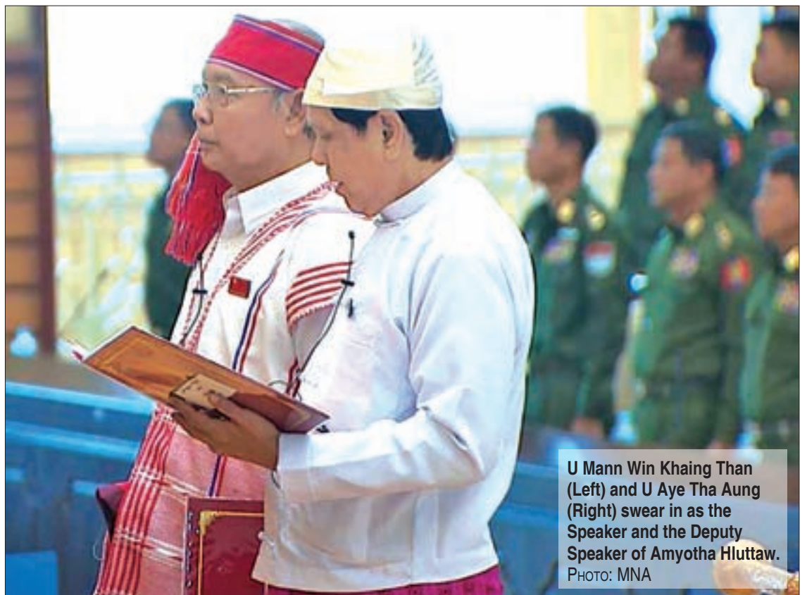
U Mann Win Khaing Than (Left) and U Aye Tha Aung (Right) swear in as the Speaker and the Deputy Speaker of Amyotha Hluttaw.

The meeting ended at 11am. The second meeting of the Amyotha Hluttaw is scheduled for today.—GNLM