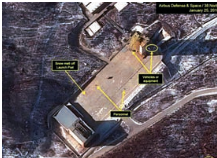
Airbus Defence & Space and 38 North satellite imagery dated January 25, 2016 shows three objects at the base of the gantry tower that are either vehicles or equipment at Sohae Satellite Launching Station in North Korea in this image released on January 28, 2016.

Russel said negotiations were "active" at the United Nations and