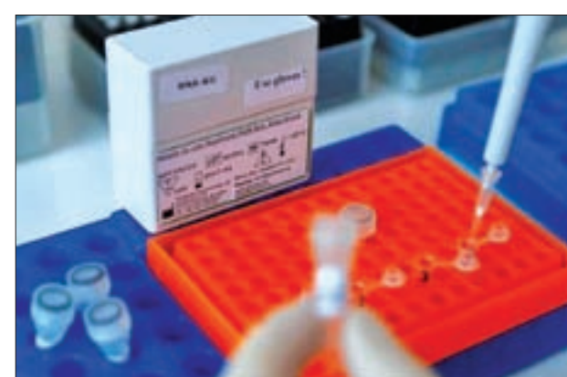
An employee examines a tube with the label 'Zika virus' at Genekam Biotechnology AG in Duisburg, Germany, on 2 February.

The American Red Cross on Tuesday asked blood donors who have traveled to Zika virus outbreak areas such as Mexico,