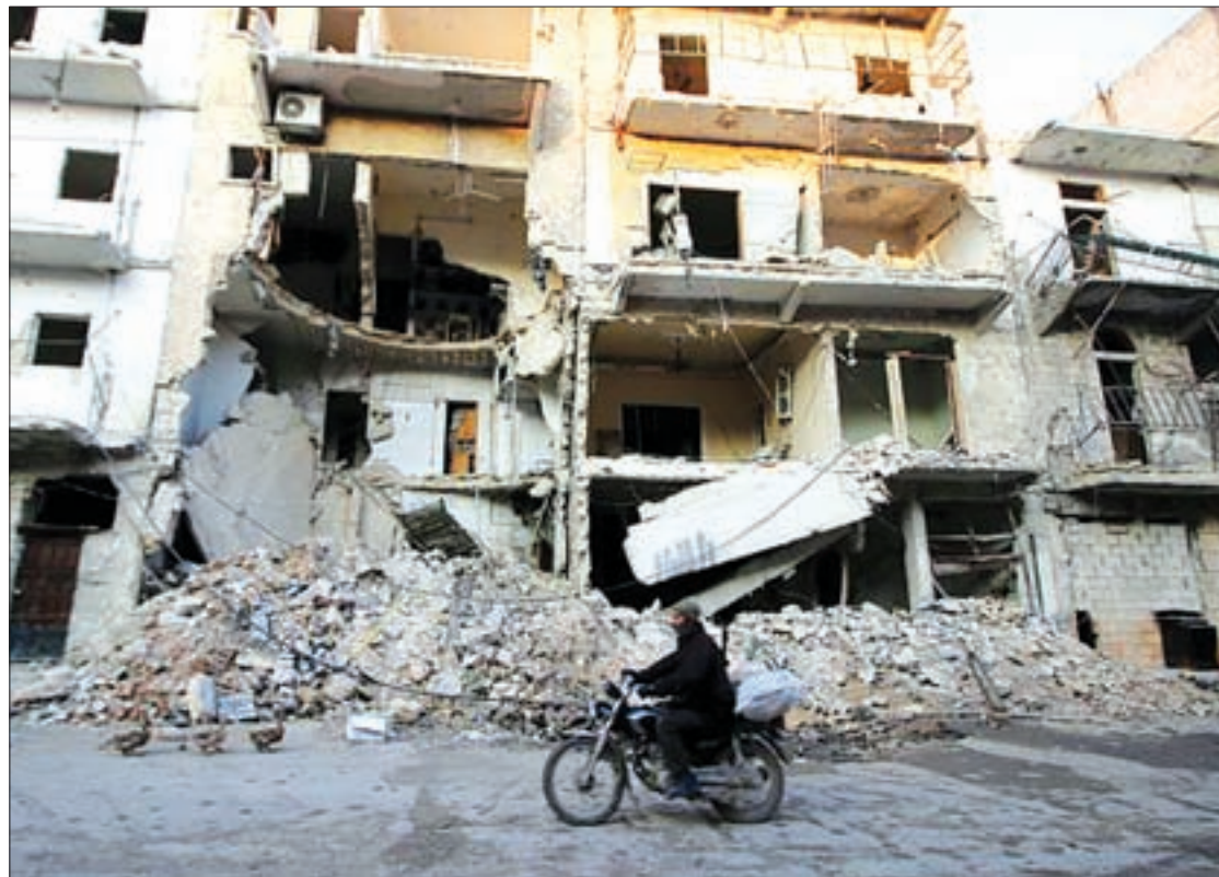
A man rides a motorcycle past damaged buildings in al-Myassar neighbourhood of Aleppo, Syria on 31 January.

BEIRUT/AMMAN/GENEVA — A Syrian military offensive backed by heavy Russian air strikes threatened to cut critical rebel supply lines into the northern city of Aleppo on Tuesday, while the warring sides said peace talks had not started despite a UN statement they had.