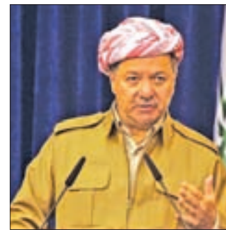
Iraq's Kurdistan region's President Massoud Barzani.

ERBIL, (Iraq) — Iraq's autonomous Kurdistan region should hold a non-binding referendum on independence, its president said on Tuesday, despite the numerous crises it is facing.