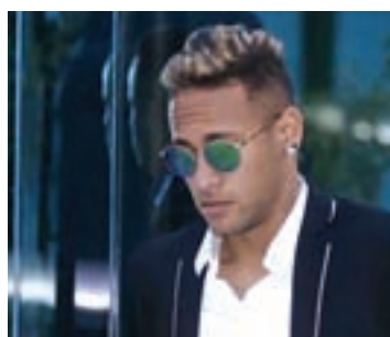
Barcelona's Neymar.