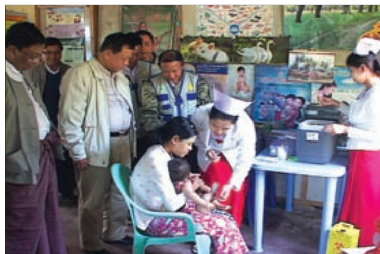
Deputy Minister Dr Win Myint oversees health care services in Rakhine State.

The Ministry of Health provides health care to local residents in Rakhine State, including Bengalis.— Myanmar News Agency