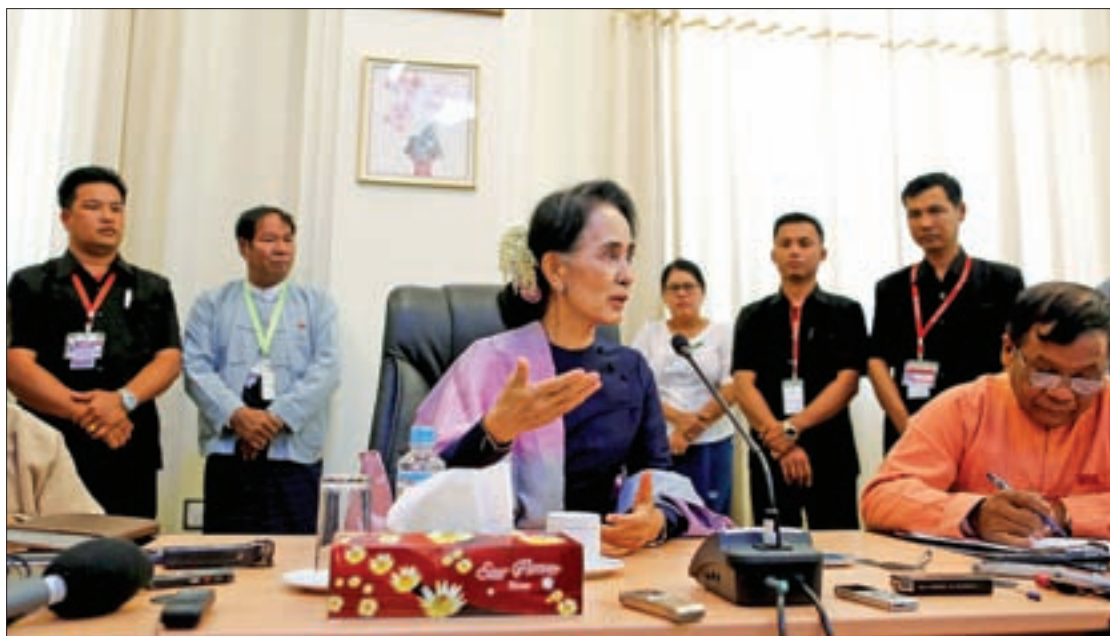
Chairperson of National League for Democracy leader Daw Aung San Suu Kyi talks to journalists during her meeting with the media in her office at the parliament in Naypyitaw, February 3, 2016.

NATIONAL League for Democracy Chairman Daw Aung San Suu Kyi met local and foreign correspondents