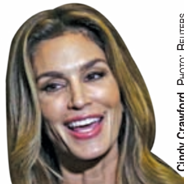
Cindy Crawford.

LOS ANGELES — Supermodel Cindy Crawford on Monday denied reports that she planned to retire from modeling this month, saying she had made no final statements and that her "retirement" was a running joke in her family.