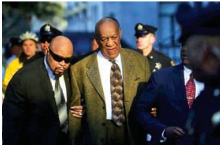
Actor and comedian Bill Cosby (C) arrives for a preliminary hearing on sexual assault charges at the Montgomery County Courthouse in Norristown, Pennsylvania on 2 February, 2016.

NORRISTOWN (Pa) — Comedian Bill Cosby on Tuesday sought to derail Pennsylvania prosecutors' effort to make him stand trial on sexual assault charges, contending that a deal reached over a decade ago gave him immunity from prosecution.