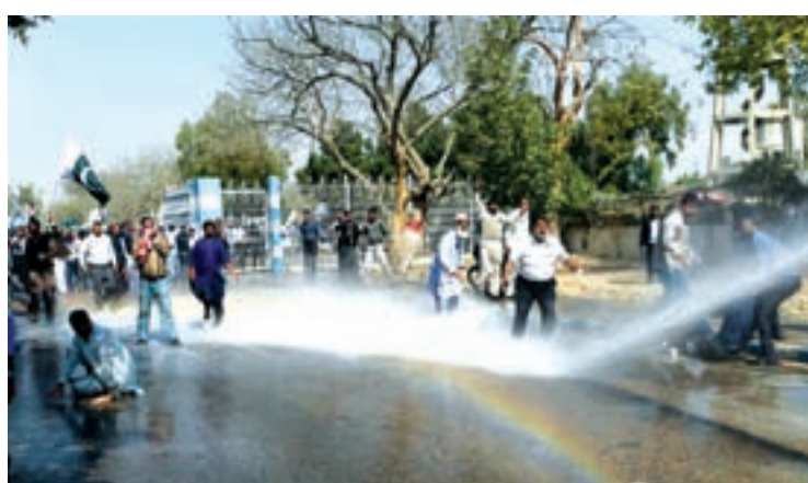
Employees of Pakistan International Airlines (PIA) shout slogans as police use a water cannon on them during a protest near Jinnah International Airport in southern Pakistani port city of Karachi, on 2 February.

The Civil Aviation Authority also confirmed cancel-