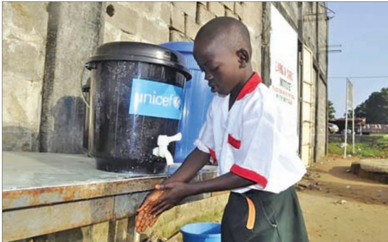
A boy washes his hands as part of Ebola prevention methods, before school starts in Paynesville, Liberia, in 2015.