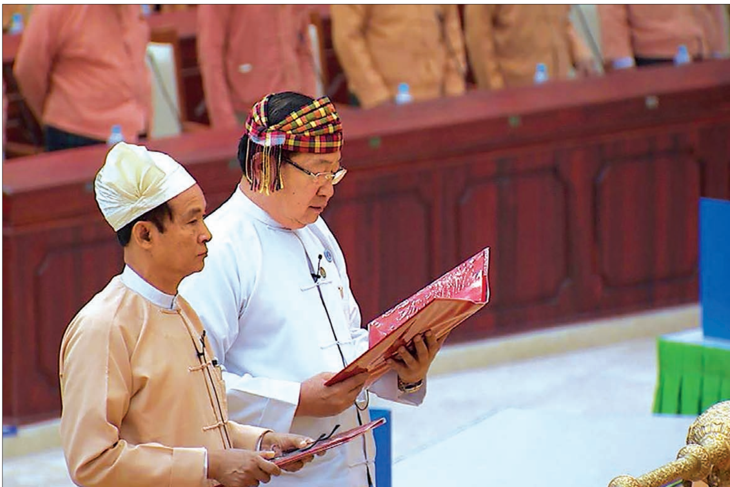
U Win Myint (Left) and U T Khun Myat (Right) are sworn in as Speaker and Deputy Speaker of the Pyithu Hluttaw.

THE first regular session of the second Pyithu Hluttaw (Lower House) was convened in Nay Pyi Taw yesterday, electing U Win Myint as speaker and U T Khun Myat as deputy speaker.