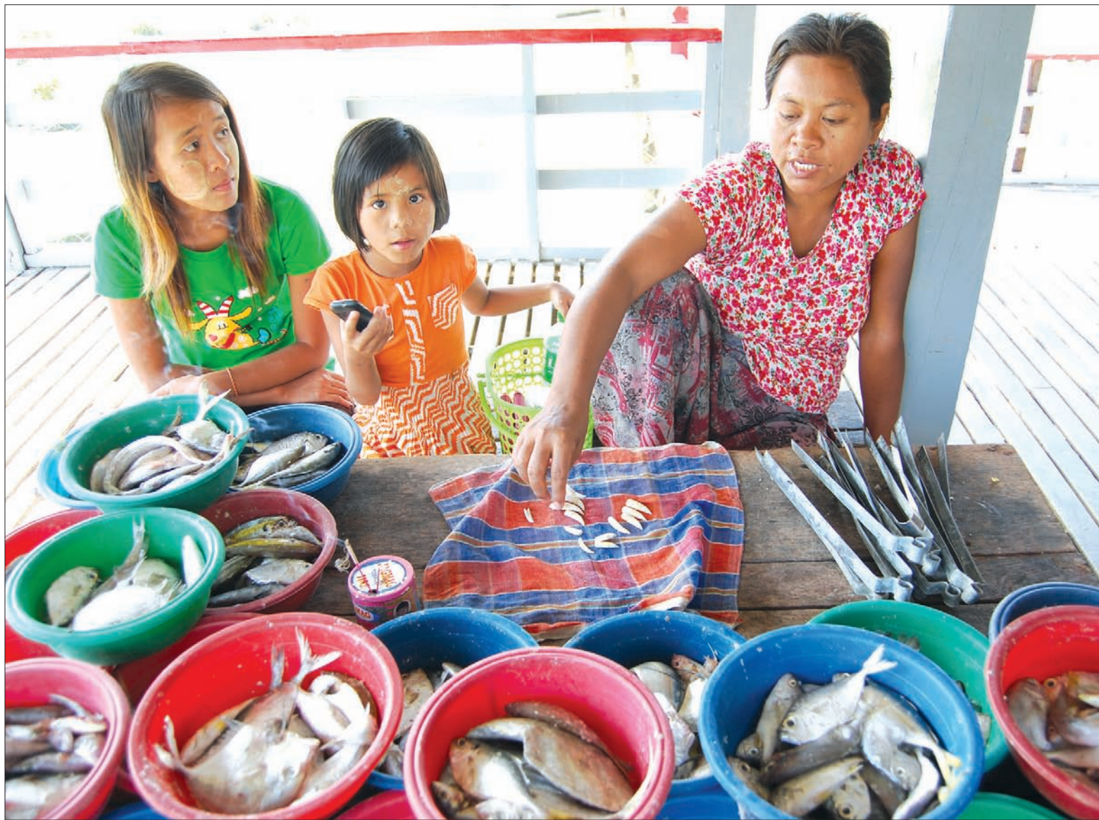
A local family sells fish and discarded crocodile teeth to eager visitors.

He started his job as the man in charge of Yangon's strangest wildlife institution five months ago, during which time has learned what