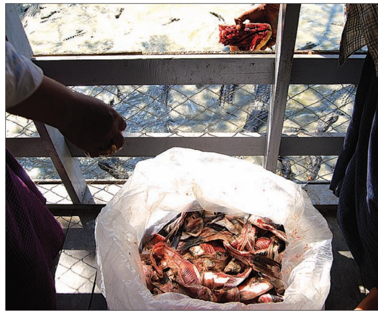
Visitors toss fish into the hungry crocs' jaws.

CITES is an agreement between signatory governments to ensure that the trade of plants and animals does not threaten their species' survival.