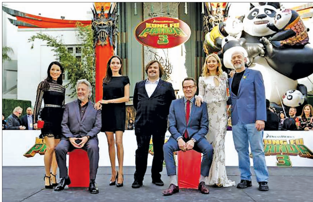
Cast members Lucy Liu, Dustin Hoffman, Angelina Jolie, Jack Black, Bryan Cranston, Kate Hudson and JK Simmons (L-R) pose at the premiere of 'Kung Fu Panda 3' at the TCL Chinese theatre in Hollywood, California in January. The movie opens in the US on 29 January.

The cartoon also helped the US box office turn in a respectable performance following a dismal weekend that saw business hit hard by the massive East Coast snowstorm. Leonardo DiCaprio's