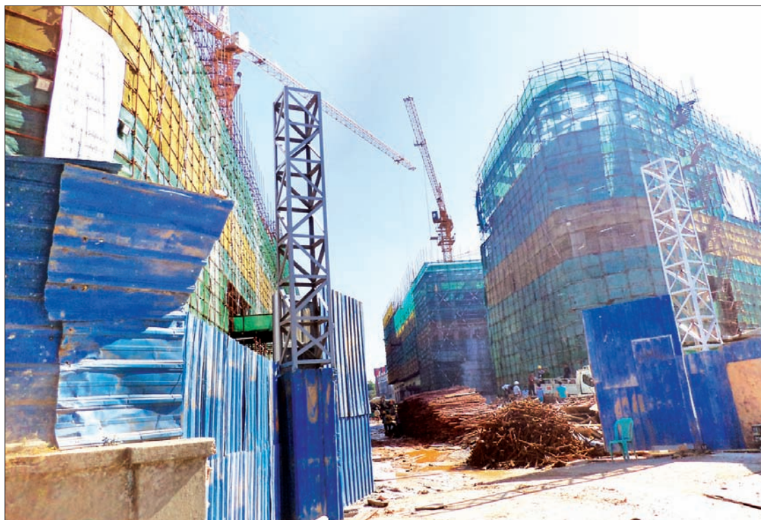
The buildings are under construction. PHOTO:163

DEMAND for housing in Yangon, Myanmar's commercial city, has been on the rise as the city sees a swelling population. The government and private construction companies are implementing several housing projects in Yangon to fulfil people's housing needs.