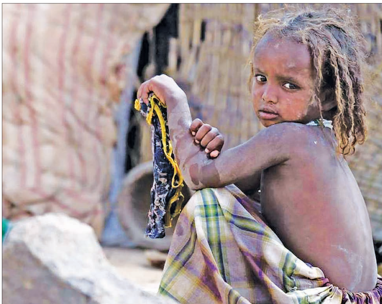
A girl sits outside a temporary shelter in the drought stricken Somali region in Ethiopia, on 26 January .

In the years since, Ethiopia has transformed under a government that promotes rapid economic development, although it is criticised for limiting many political freedoms. One of its signature schemes is a rural support programme