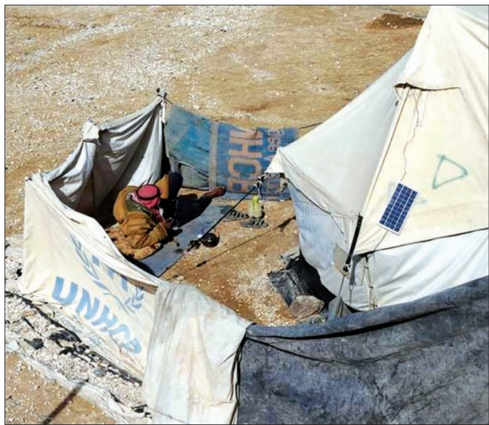
A Syrian refugee man sits in front of his tent at Al Zaatari refugee camp in the Jordanian city of Mafraq, near the border with Syria, on 30 January.

BEIRUT — A report by international charity Oxfam yesterday showed some of the countries most deeply involved in Syria's civil war, including Russia, Saudi Arabia and France, are among the least generous in helping its victims.