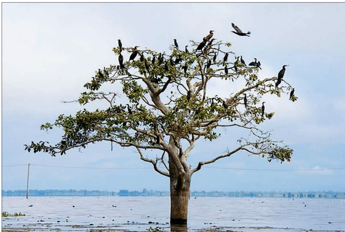
Indawgyi Lake view.

Firewood extraction and consumption have been reduced through fuel-efficient stoves and community forestry. To improve fisheries management, local communities participated in the designation of fish conservation zones to protect fish breeding and nursery grounds. The Department of Fisheries just approved nine community-managed fish conservation zones, including a 'no-fishing zone' around Shwe Myint Zu Pagoda, an iconic cultural building on the western side of the lake.