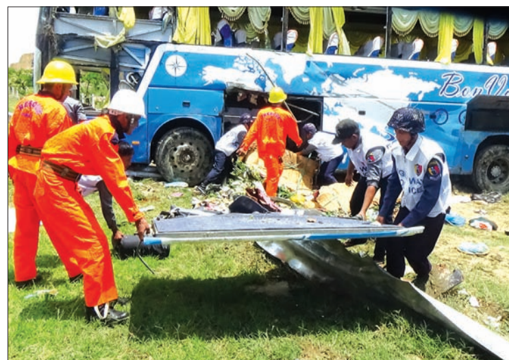
File photo shows highway Police and rescuers prepare to send the injured from a road accident to the hospital.

Likewise, the Fire Department has also established 15 fire stations accompanied by 15 fire engines and about 100 fire-fighters to attend to calls for rescue on the expressway.