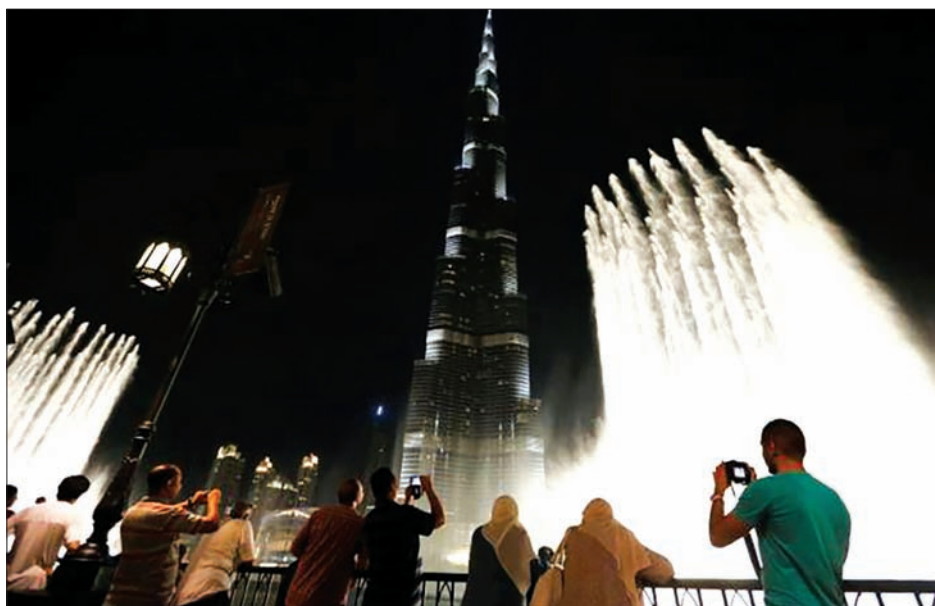
People watch a fountain in front of Burj Khalifa in Dubai in 2013.

DUBAI — Bookings in Dubai's tourism industry are looking strong for the first quarter of this year despite the fire which swept through a downtown hotel on New Year's Eve, the head of the emirate's tourism department told Reuters on Sunday.