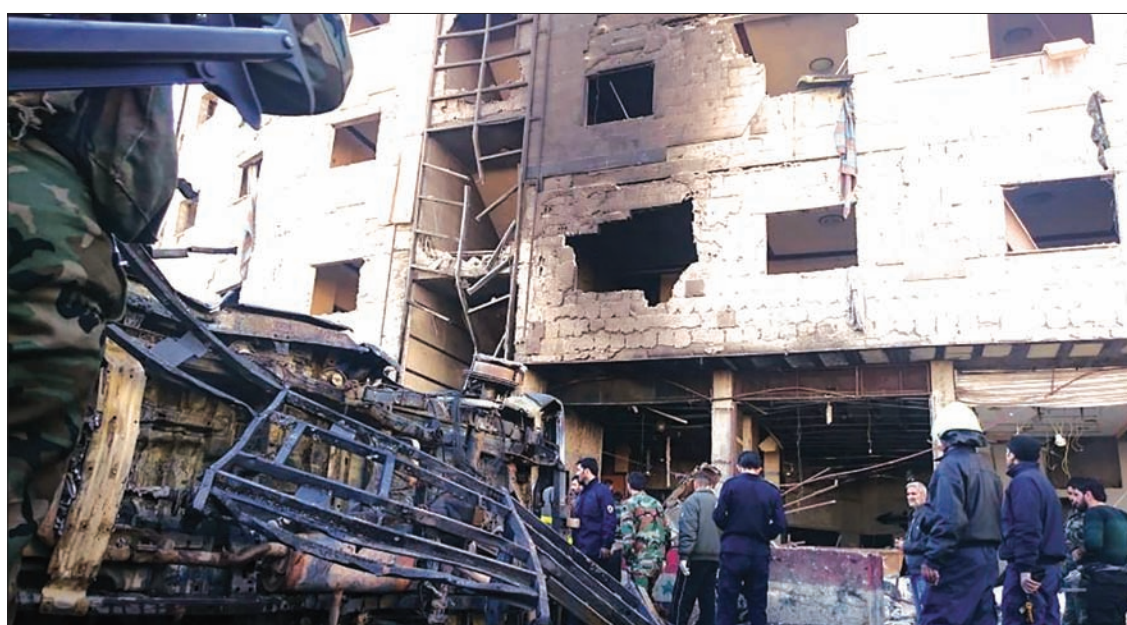
Residents and soldiers loyal to Syria's President Bashar al-Assad inspect damage after a suicide attack in Sayeda Zeinab, a district of southern Damascus, Syria on 31 January.

The area witnessed heavy clashes in the first few years of the war, prompting the army and allied Shi'ite militias to tighten security, notably with roadblocks.—Reuters