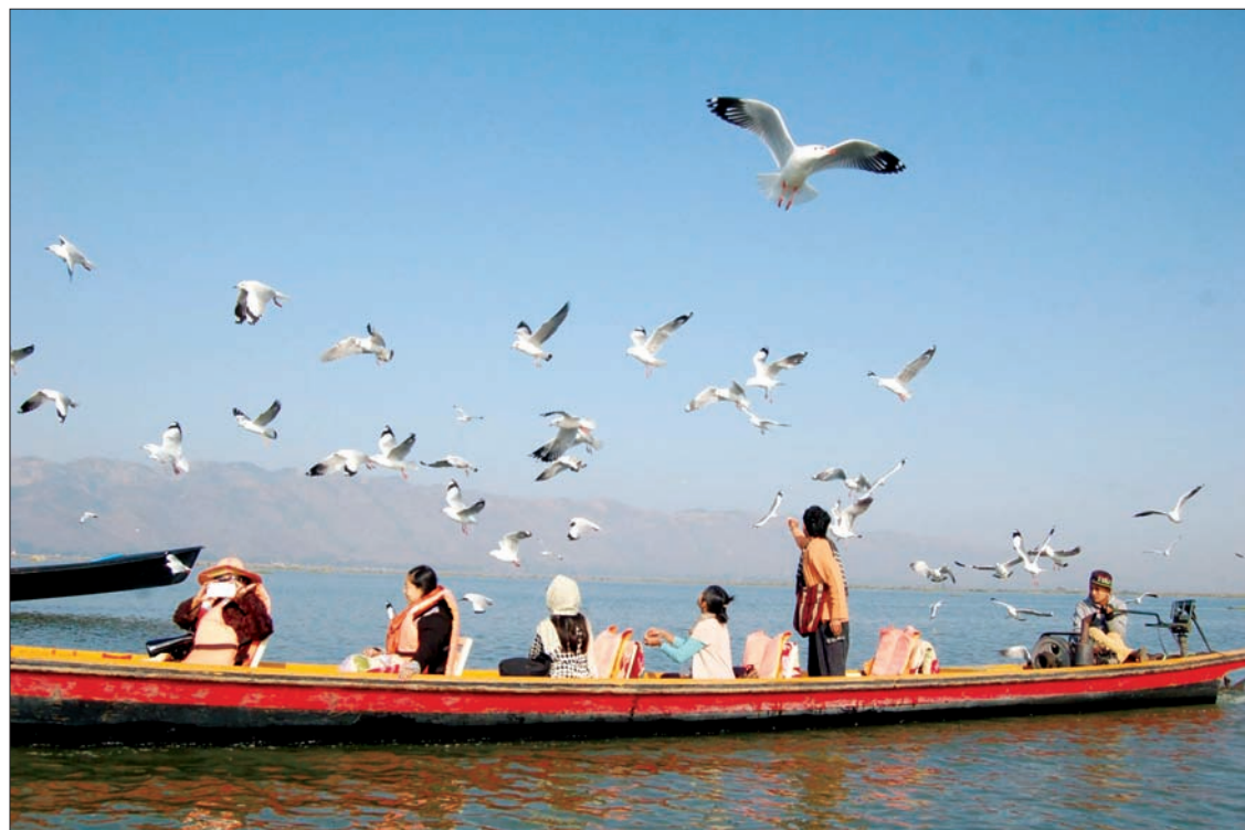
Visitors feed seagull as they take a boat trip in Inle Lake.

SINCE it was designated as Myanmar's first biosphere reserve and as a natural world heritage site in 2013, Inle Lake has drawn more attention from international tourists, seeing increasing tourist arrivals year after year.