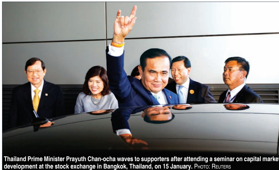
Thailand Prime Minister Prayuth Chan-ocha waves to supporters after attending a seminar on capital market development at the stock exchange in Bangkok, Thailand, on 15 January.

BANGKOK — Thailand's Prime Minister Prayuth Chan-ocha said yesterday that a general election will take place in 2017, amid criticism that a draft constitution unveiled last week would delay the poll.