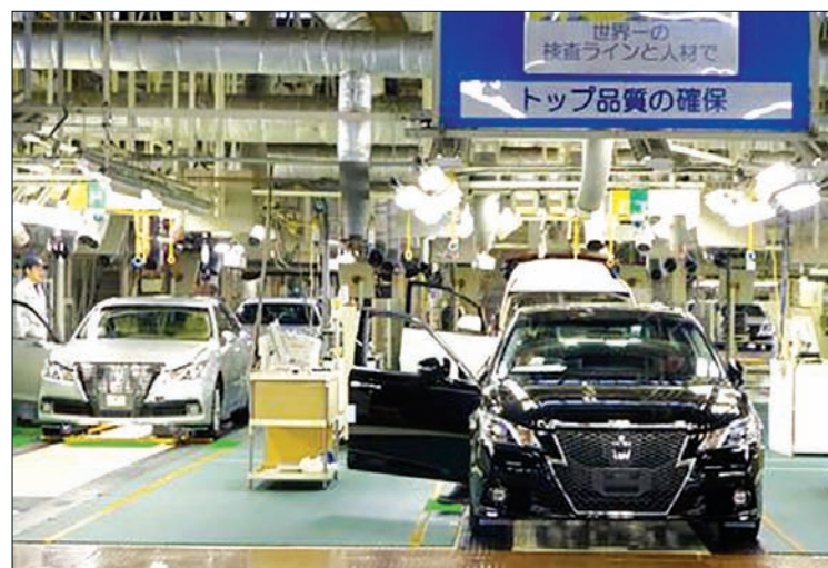
Toyota Motor Corp's Motomachi Plant, where the luxury sedan Crown is produced, in the central Japan city of Toyota. The automaker said 1 February, 2016, that it will suspend all domestic production of its vehicles from 8 February through 13 February as an explosion at a steel plant in central Japan in January has caused parts shortages.

While Toyota recently beefed up its production amid robust orders for new models, including the fourth-generation Prius hybrid released in December, the blast has prompted the automaker to cancel overtime work at all of its plants in the country during weekdays this week.— Kyodo News