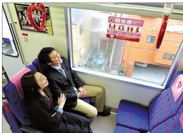
A couple rides the "Keikyu Love Train" featuring four non-reserved box seats decorated with heart designs in Tokyo on 1 February, 2016.

Valentine's Day on 14 February has been marketed in Japan as a day on which women give chocolates to men, with White Day on 14 March promoted as an occasion for men to return the favour.—Kyodo News