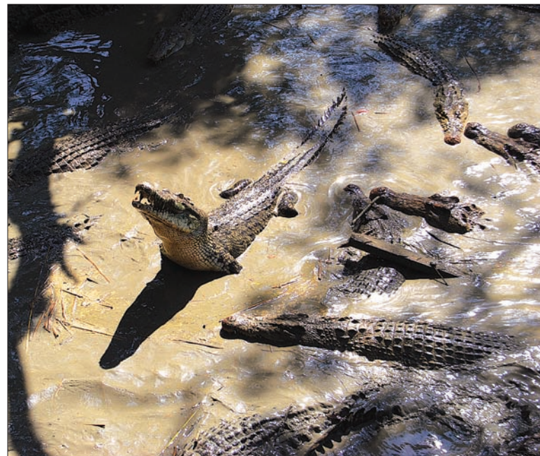
A beast in captivity ponders life in the wild.

But that changed in 1997, when Myanmar signed onto the Convention on International Trade in Endangered Species of Wild Fauna and Flora (CITES). The