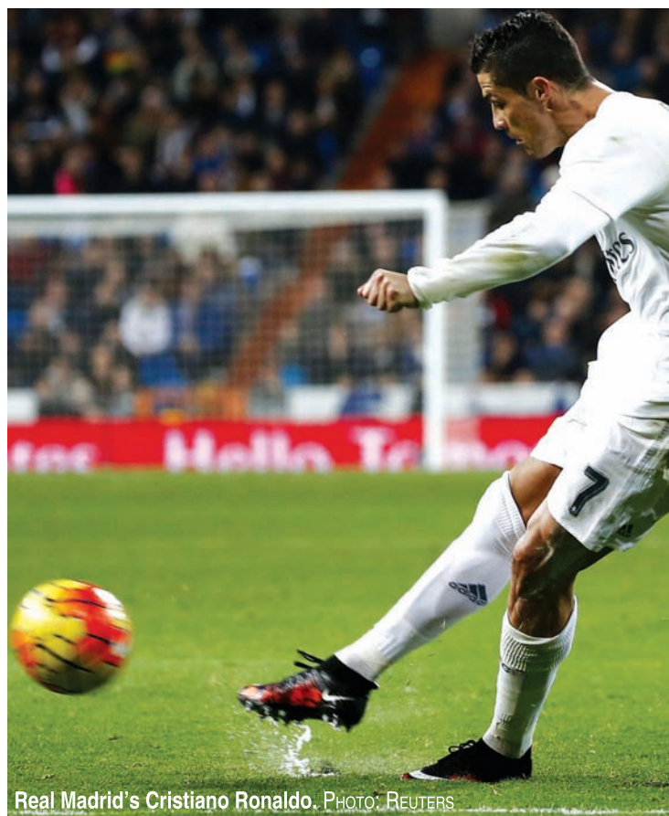
Real Madrid's Cristiano Ronaldo.

MADRID — Prolific Cristiano Ronaldo hit a 35 th hat-trick for Real Madrid who swept aside Espanyol 6-0 in a ruthless attacking display in La Liga on Sunday.