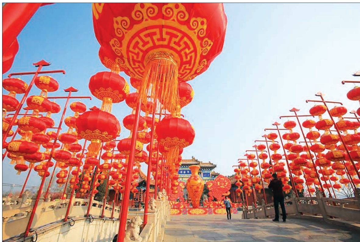
Tourists take pictures beside red lanterns in the Hanyuan Forest of Steles in Kaifeng, central China's Henan Province, on 1 February, 2016. The Longting scenic spot in Kaifeng was decorated with red lanterns for the traditional Spring Festival, or lunar New Year, which starts from 8 February this year.