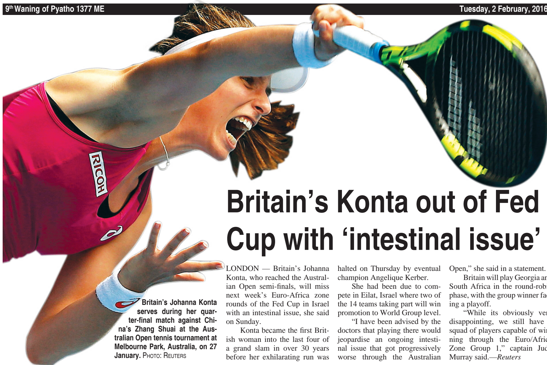
Britain's Johanna Konta serves during her quarter-final match against China's Zhang Shuai at the Australian Open tennis tournament at Melbourne Park, Australia, on 27 January.