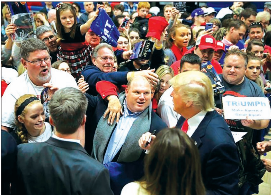
US Republican presidential candidate Donald Trump speaks during a campaign event at the Orpheum Theatre in Sioux City, Iowa on 31 January.

NEW YORK — Donald Trump likes to boast to his supporters that he's so rich he doesn't need outside money to pay for his presidential campaign. His fans seem happy to oblige him, according to financial disclosures released on Sunday.