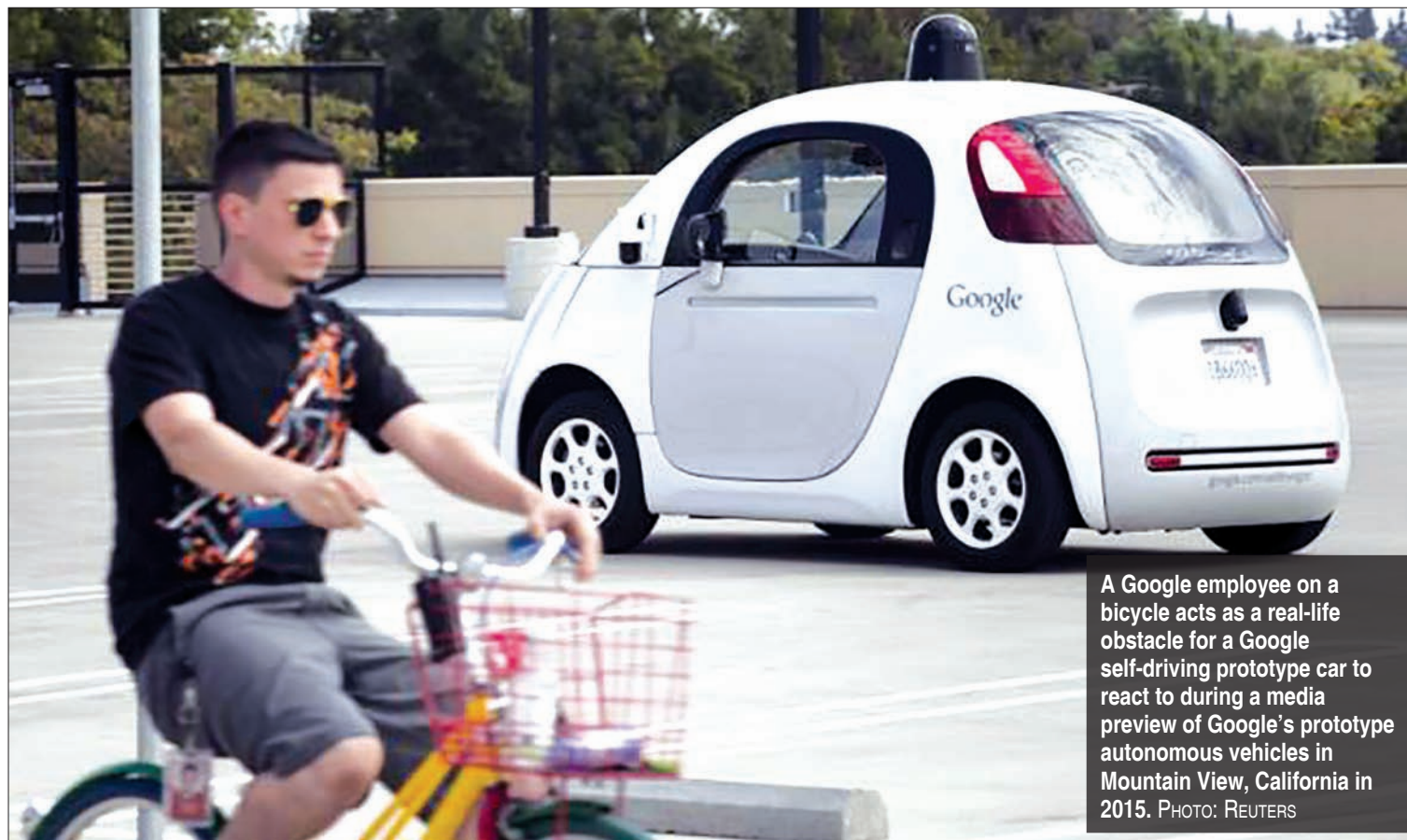
A Google employee on a bicycle acts as a real-life obstacle for a Google self-driving prototype car to react to during a media preview of Google's prototype autonomous vehicles in Mountain View, California in 2015.

SAN FRANCISCO — How much is Google-parent Alphabet Inc (GOOGL.O) spending on “moonshots” — self-driving cars, glucose-monitoring contact lenses, Internet balloons and other ambitious projects?