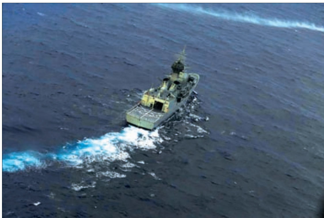
The Royal Australian Navy ship HMAS Perth is guided into position by a Royal New Zealand Airforce (RNZAF) P-3K2 Orion aircraft to recover an object in the southern Indian Ocean, as the search continues for missing Malaysia Airlines flight MH370 in 2014.

“The towfish collided with a mud volcano which rises 2,200 metres from the seafloor resulting in the vehicle's tow cable breaking,” the Joint Agency Coordination Centre (JACC), the agency overseeing the search efforts, said in a statement.