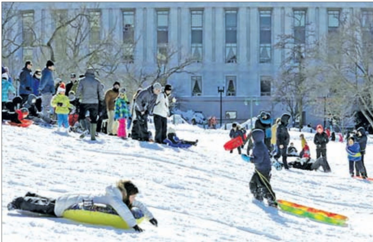
People sled on a hill at the US Capitol after a major winter storm swept over Washington on 24 January.

NEW YORK/WASHINGTON — New York City emerged on Sunday from a massive blizzard that paralyzed much of the US East Coast, while snowy gridlock gripped the nation's capital and surrounding areas, where federal, state and local offices planned to remain closed yesterday.