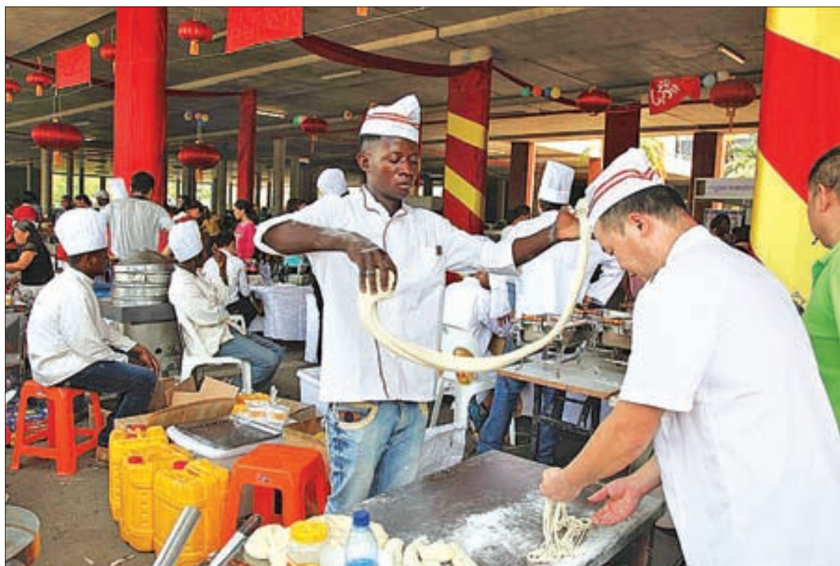
A local chef makes noodles during the temple fair held in Lusaka, Zambia, on 24 January, 2016. The temple fair was held on Sunday to celebrate the upcoming Chinese Spring Festival in Lusaka.