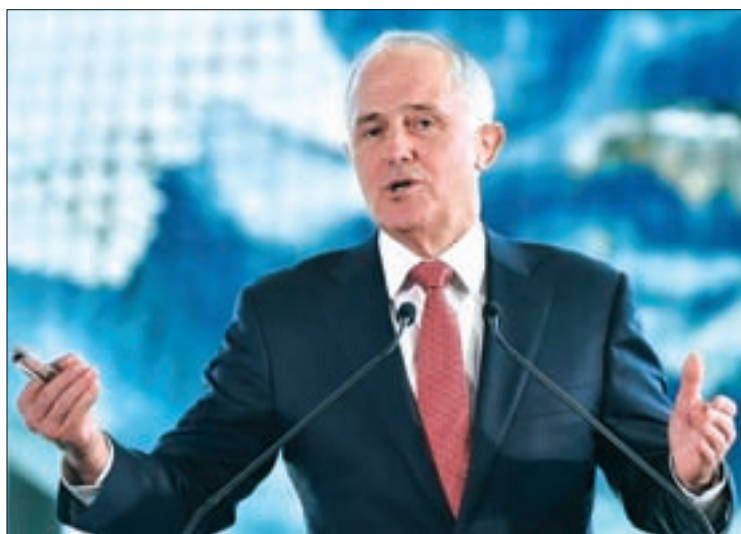
Australian Prime Minister Malcolm Turnbull.

“It's well past time for Australia to become a sovereign nation,” said South Australia Premier Jay Weatherill, who signed the declaration. “Any self-respecting, independent country would aspire to select one of its own citizens as its head of state,” he said in a statement.