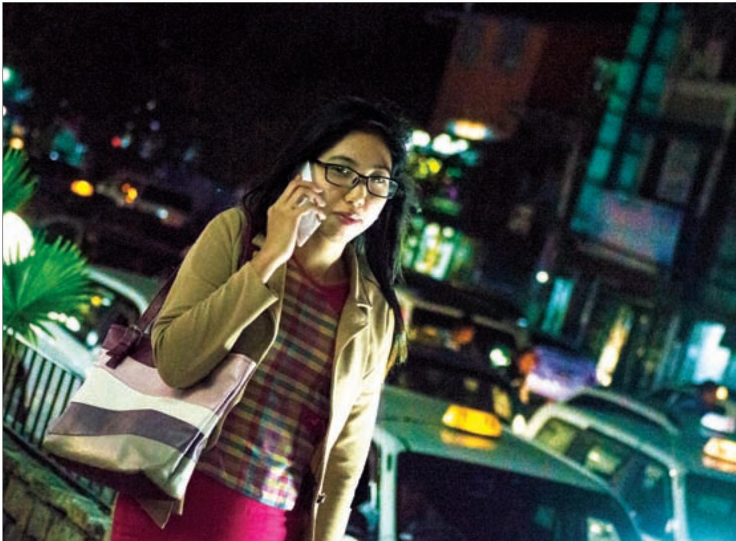
The number of mobile phone subscribers is rising rapidly in Myanmar.