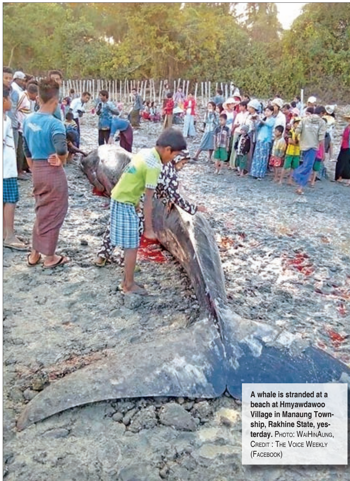
A whale is stranded at a beach at Hmyawdawoo Village in Manaung Township, Rakhine State, yesterday.