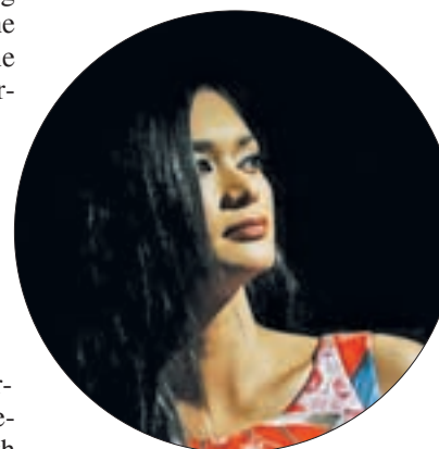
Winner of the 2015 Miss Universe Pageant Pia Alonzo Wurtzbach from the Philippines, poses during an interview with Reuters in New York on 5 January.

Filipino candidates have made the top 10 in Miss Universe pageants for each of the past six years. "I have confidence in the girls that they're going to do well considering the training we have here and inspiration that winners will be giving to them," Wurtzbach told Reuters, speaking about the country's performance in coming pageants.—Reuters