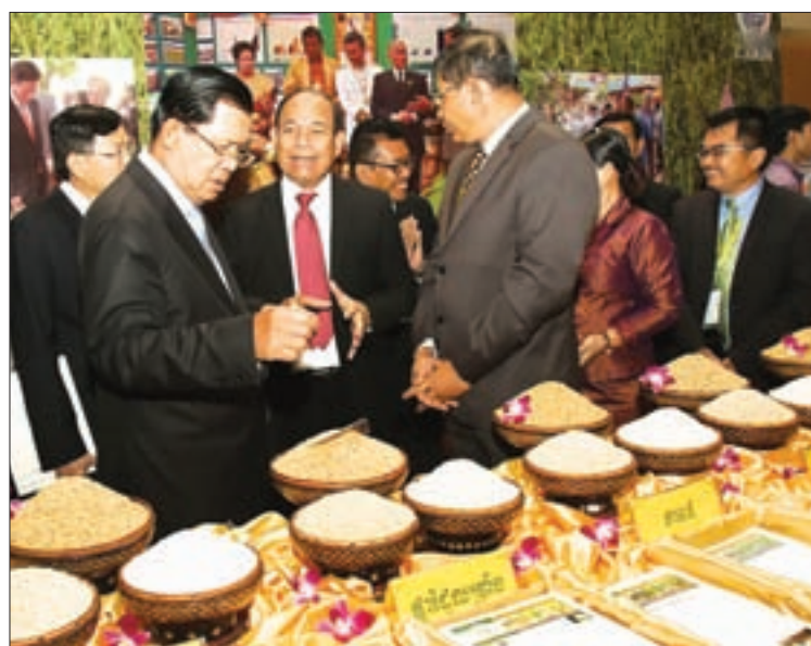
Cambodian Prime Minister Hun Sen visits a rice stall at the 5th Cambodia Rice Forum in Phnom Penh, Cambodia, on 25 January. Hun Sen on Monday called for more investment in rice storage facilities and drying machines in order to increase the country’s rice export capacity.