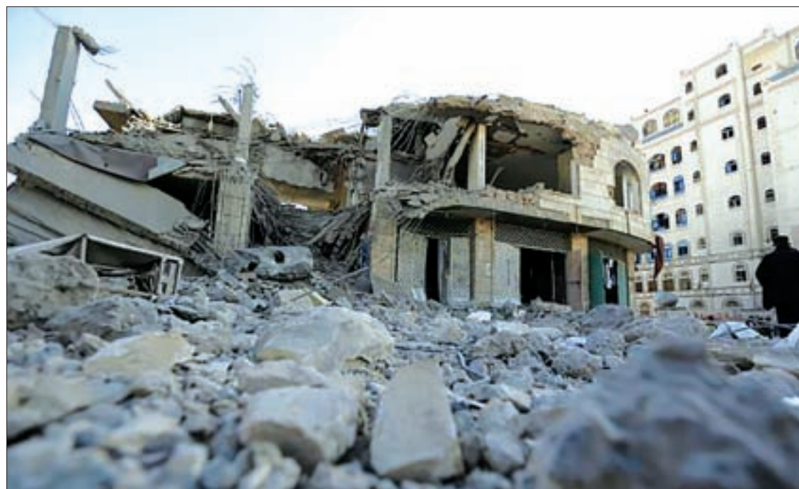
A view of the house of court judge Yahya Rubaid after a Saudi-led air strike destroyed it, killing him, his wife and five other family members, in Yemen's capital Sanaa on 25 January.

CAIRO — A Saudi-led coalition air strike killed a Yemeni judge and seven members of his family in the capital Sanaa on Sunday, residents said, as an aid convoy delivered food to a besieged southern city for the first time in months.