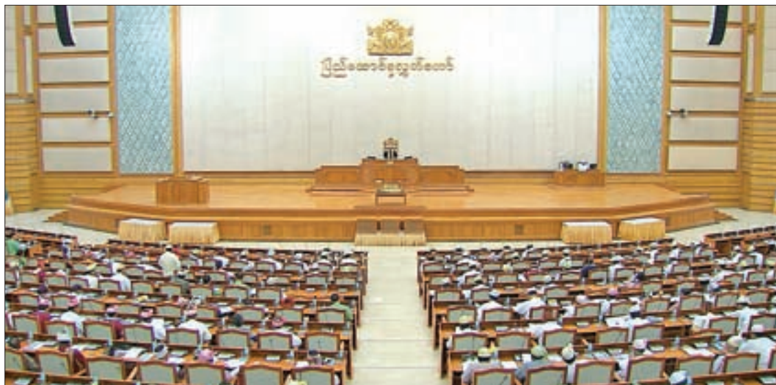
Pyidaungsu Hluttaw is being convened in Nay Pyi Taw.