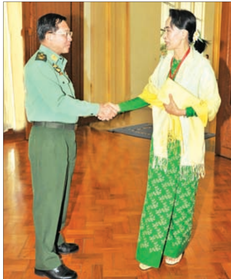
Senior General Min Aung Hlaing welcomes Daw Aung San Suu Kyi on her arrival at the Bayintnaung Guest House in Nay Pyi Taw.

During the meeting, the participants discussed matters relating to the post-election transitional period, peace and stability, parliamentary affairs, the formation of the next government and the peace process as laid out by the Nationwide Ceasefire Agreement.— Myawady