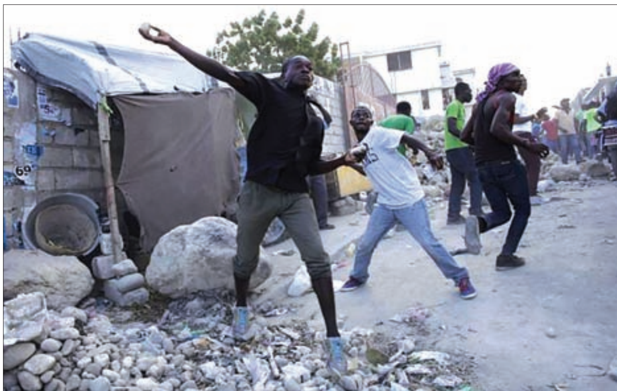
Protesters throw rocks during a demonstration rallying for the resignation of President Michel Martelly in Port-au-Prince, Haiti, on 23 January.

Haiti was due to choose Martelly’s replacement on Sunday, but the two-man race was postponed indefinitely after opposition candidate Jude Celestin refused to participate over alleged