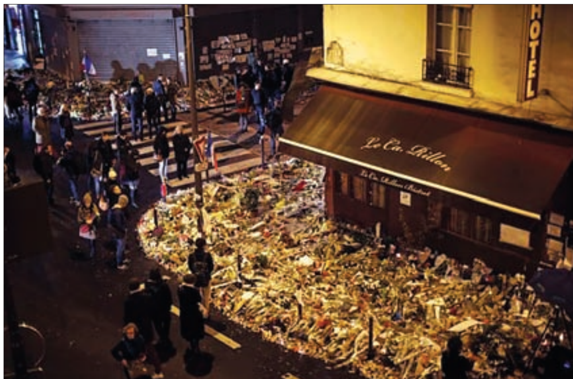
People mourn outside "Le Petit Cambodge" and "Le Carillon" restaurants a week after a series of deadly attacks in the French capital, in Paris, France, in November 2015.

the video by noms de guerre referring to their nationalities — three French, four Belgian and two Iraqis, referred to as Ali al-Iraqi and Ukashah al-Iraqi.