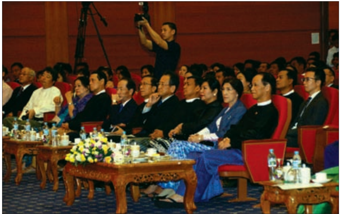
Vice President Dr Sai Mauk Kham and wife enjoy Myanmar National Symphony Orchestra Concert.

VICE PRESIDENT Dr Sai Mauk Kham enjoyed the Myanmar National Symphony Orchestra Concert at the Myanmar International Convention Centre in Nay Pyi Taw yesterday.