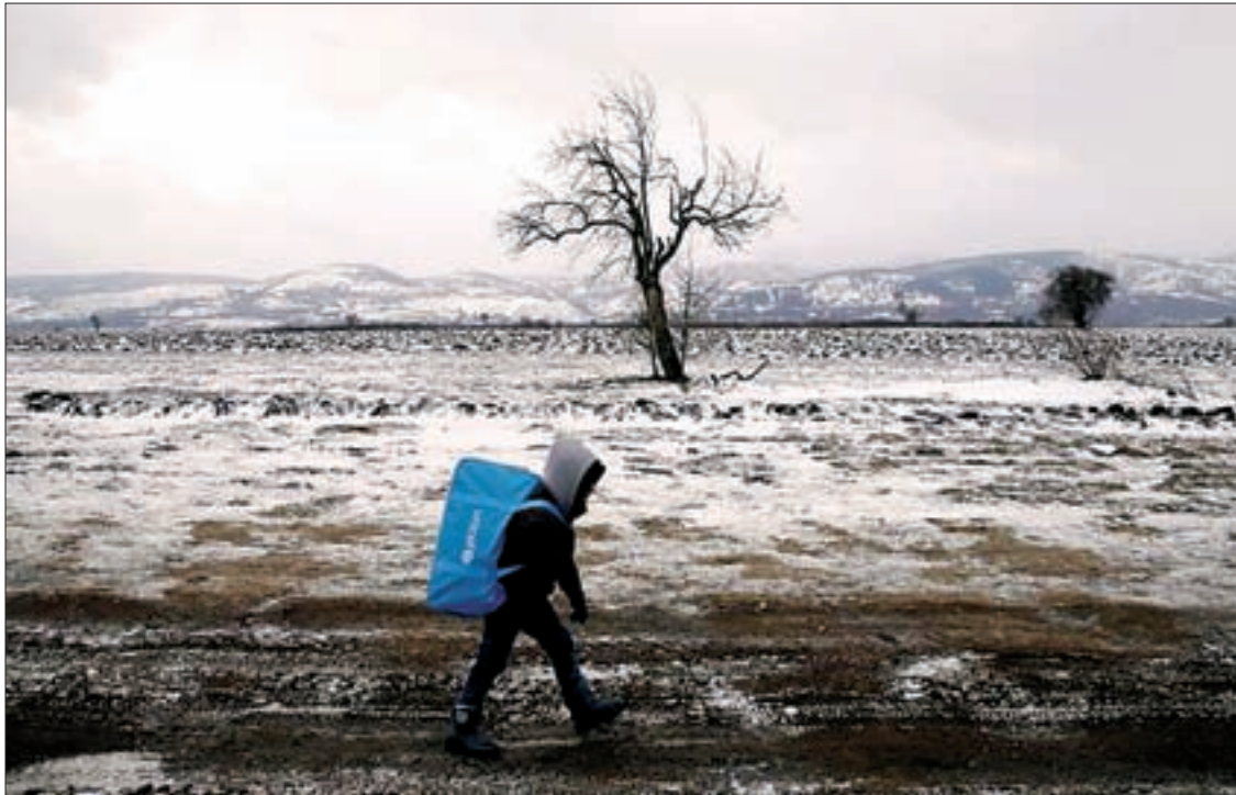
A migrant child walks through a frozen field after crossing the border from Macedonia, near the village of Miratovac, Serbia, on 18 January.

Critics say that response has been meagre when compared with the 1.1 million asylum seekers who arrived in Germany last year. Campaign groups and more than 80 Church of England bishops have urged Cameron to do more.— Reuters