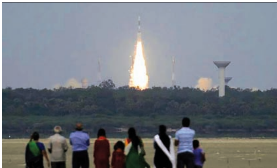
People watch as India’s Geosynchronous Satellite Launch Vehicle (GSLV-D6) blasts off carrying a 2117 kg GSAT-6 communication satellite from the Satish Dhawan space centre at Sriharikota, India, in 2015.

The Indian Space Research Organisation (ISRO) will fund and set up the satellite tracking and data reception centre in Ho