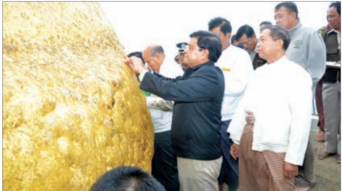
Vice President U Nyan Tun applies gold foils on Kyaik-hti-yoe Pagoda.

VICE-President U Nyan Tun inspected development tasks and environmental works being undertaken in the region of Kyaik-hti-yoe Pagoda in Mon State yesterday.