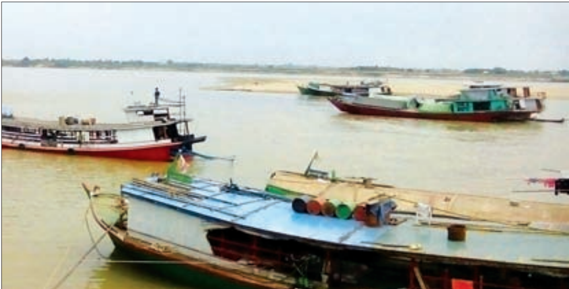
Motor boats anchored near a sandbank in the Ayeyawady River.

CARGO vessels along the Ayeyawady River near Katha Township, Sagaing Region, are facing problems as the water level of the river is gradually declining. Currently, boats and ships loaded with commodities travelling along the Ayeyawady River carefully control their ships to avoid serious problems, such as sandbanks. Some vessels frequently get caught on sandbanks during their trips. "Normally, we send cargo from Mandalay to Bamho with the use of river transport services over the course of a week. Now, it takes 10 to 15 days to complete the Mandalay-Bamho return trip due to marine traffic along the river near Katha Township," said one private shipmaster. Merchants traditionally use river transport to ship their commodities from Mandalay to Bamho, Mandalay to Katha and other areas.— Maung Nyein Wint