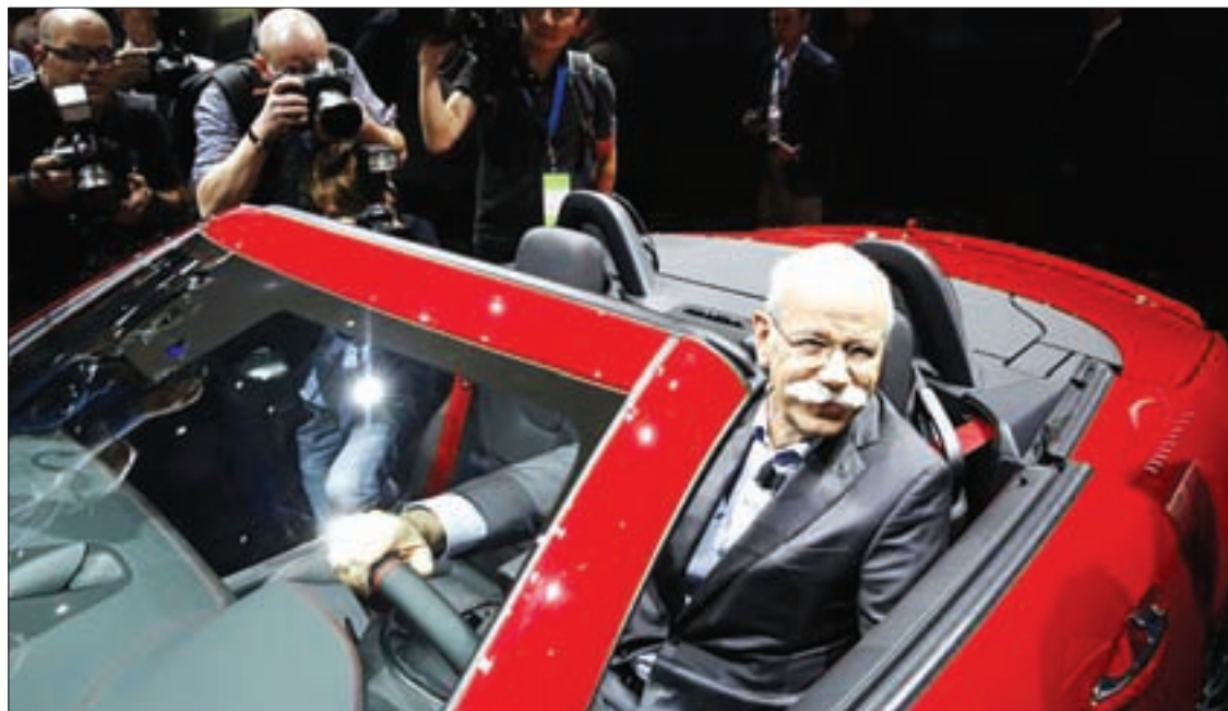
Dr Dieter Zetsche, Chairman of the Board for Daimler AG and Head of Mercedes-Benz, sits in the 2016 Mercedes-AMG SLC 43 at the North American International Auto Show in Detroit, Michigan, on 11 January.

FRANKFURT — Daimler Chief Executive Dieter Zetsche told German weekly Welt am Sonntag that a recent trip to Silicon Valley revealed that Apple and Google have made more progress on automotive projects than he had assumed.