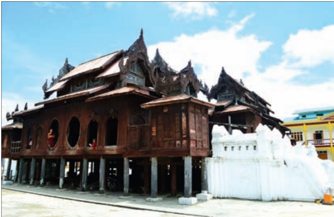
Century old monastery in Nyaung Shwe.

SWELLING numbers of international tourists have been visiting the famous century-old Sawbwas' Monastic Chambers located in the southern Shan State township of Nyaung Shwe. "Foreigners are coming here every day. The monastery is over a century old. People fast on top of the mountain every fullmoon. Different foreign tour groups of all kinds come here — it's a place full of historic artefacts," said U Hpo Chun, a 78-year-old Pa-O man who fasts every day on the mountain. The foreign tourists visit the ancient wooden monastery when they come to the region to visit Inle Lake, one of Myanmar's top tourist sites. According to tourist operators in the Inle region, most foreign tourists visiting the area in 2016 have been Koreans, followed by French, Italian and Indian tourists. "The people here today have come from India. All the tourists that come to Inle come here. The numbers are only going to continue to grow. At the moment, most tourists are from Korea," said Aung Soe U, a tour guide from the Asian Tour Company. The building of the monastery was a result of the charitable efforts of two Shan sawbwas in 1886 and 1887 and was constructed with a black wood finish. As such, the monastery building is dubbed the 'sawbwa' — or 'Shan chieftain' — monastic chambers by locals after those responsible for its construction. The monastic chambers are located within the grounds of the Shwe Yan Pye monastery in the town of Nyaung Shwe.— Myit-makha News Agency