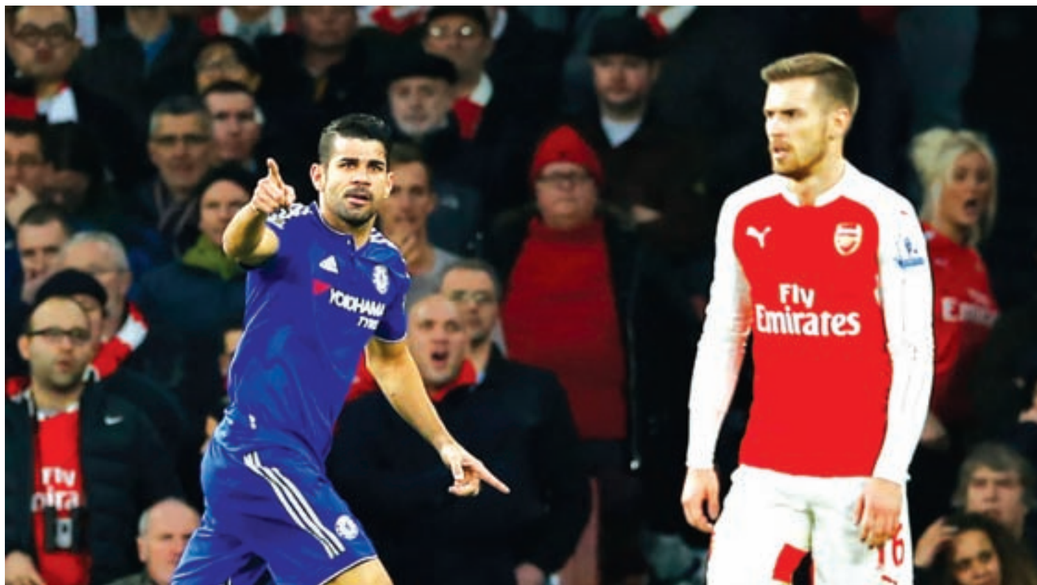
Diego Costa celebrates after scoring the first goal for Chelsea during Barclays Premier League at Emirates Stadium on 24 January.

Arsenal, who took off striker Olivier Giroud after the send-