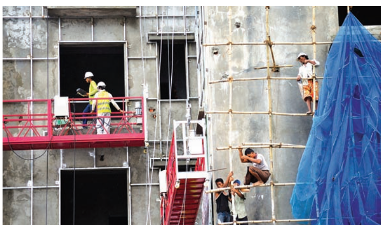
Workers seen at a worksite in Yangon.

"The fishermen who use electric shock for fishing do not intend to kill dolphins. Unfortunately, the dolphins follow the fish and die when they are shocked or captured," U Kyaw Hla Thein said. "We will step up our efforts to educate them." Local fishermen also spotted an Irrawaddy dolphin in the country's Ayeyarwady delta in September.