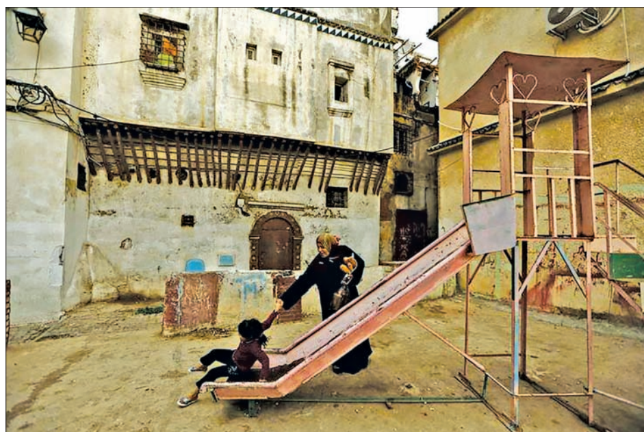
A woman helps her daughter as she plays on a slide in the old city of Algiers Al Casbah, Algeria December 3, 2015.

If the heirs to a Casbah property agree to give it to the state, they can each be rehoused in apartments per-