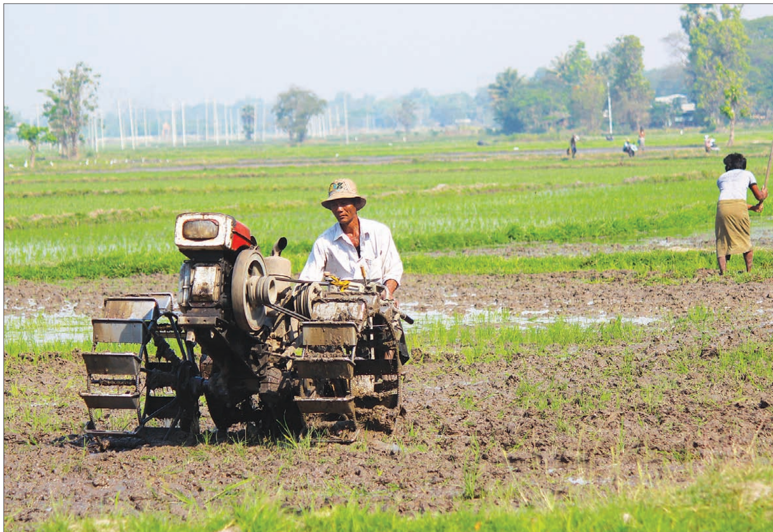
A farmer ploughs a farmland to grow rice at a village near Nay Pyi Taw.

TECHNOLOGY and machinery will assist with increasing crop yields in the western Bago Region of Pyay, and the southern Magway Region of Aungmye, in a bid to re-