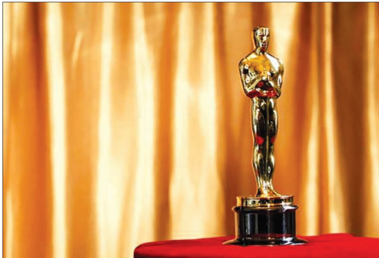
An Oscar statuette.

But Ava DuVernay, who became the first black filmmaker to earn a Golden Globe bid for her for Oscar-nominated civil rights drama "Selma" last year, said the academy's action was a long time in coming and taken only under duress.— Reuters