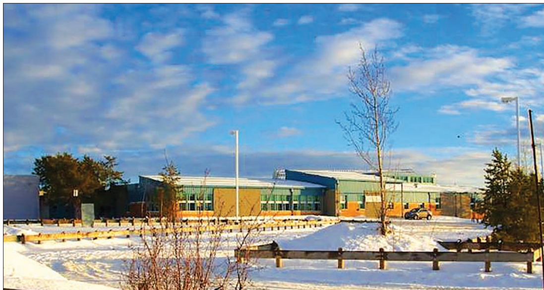
The Dene high school campus of the La Loche Community School.

WINNIPEG (Manitoba) / VANCOUVER — The gunman suspected of killing four people and injuring several others in Canada's worst school violence in a decade first shot his two brothers at home before opening fire at the remote community high school, a family friend and the town's acting mayor said on Friday.