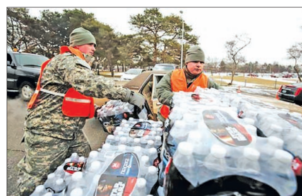
Michigan National Guard members help to distribute water to a line of residents in their cars in Flint, Michigan on 21 January 2016.

Residents complained about the water within weeks of the change in supplies, but officials did not take action until October 2015 after tests