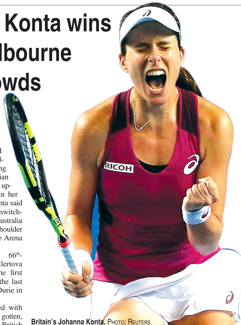
Britain's Johanna Konta.

"I have been amazed with how much support I've gotten, but I don't know if that's a British contingent here or if that's from my Australian roots," Konta told reporters. "I'm just very grateful for all the people that do come out. Whether they are supporting me or the player I'm playing against, it's always good to have a lot of people around. It brings good energy." The loss of locally born athletes to other nations, particularly those who end up representing arch-rival Britain, is difficult for sports-obsessed Australia to swallow.