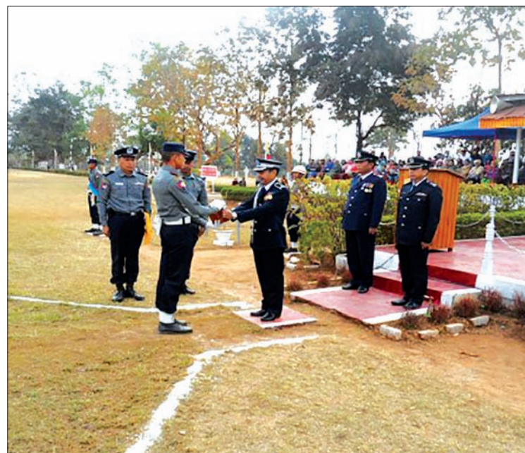
Police Brig-Gen presenting outstanding award to a trainee.

POLICE private training course 47/2015 came to an end on Friday at No.4 Police Training School (Taung Lay Lon).