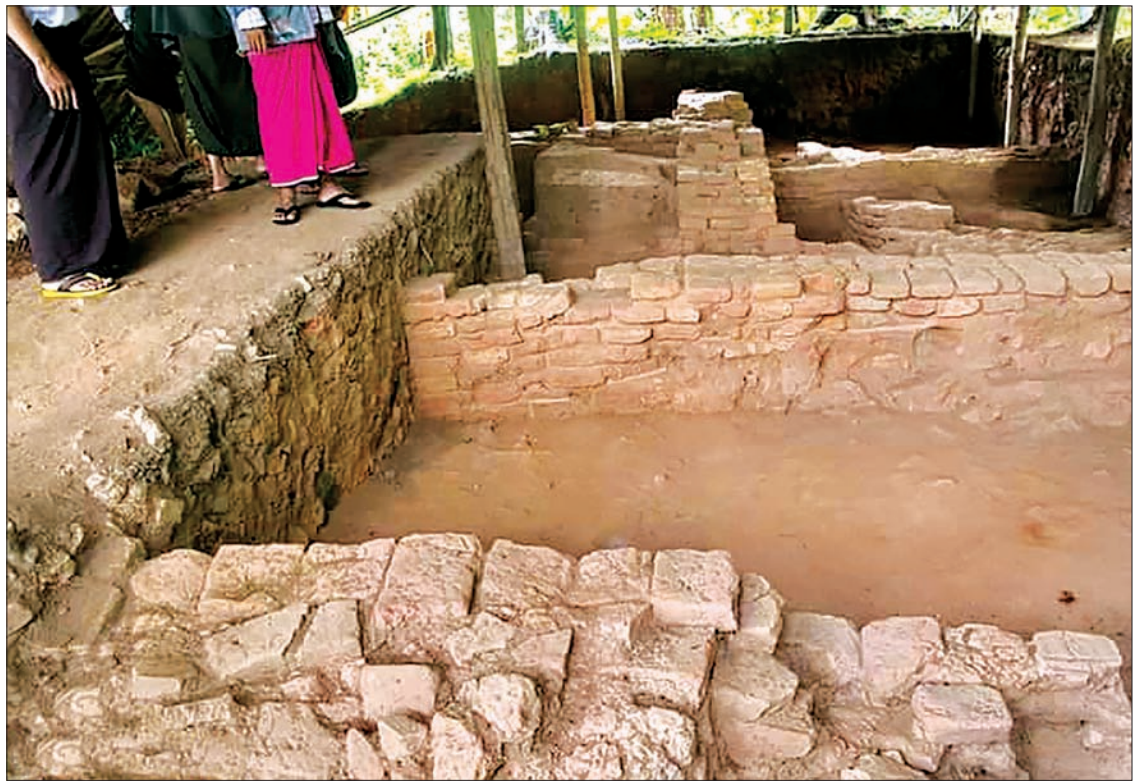
A stalled archaeological dig in Mon State.

It is also known that uncovered ancient town walls and religious buildings could be those of the ancient Thuwunnabumi city. As such, efforts will be