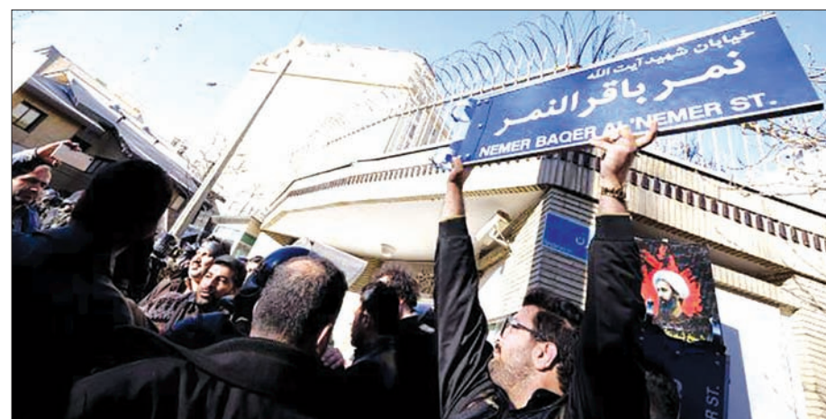
An Iranian protester holds up a street sign with the name of Shi'ite cleric Sheikh Nimr al-Nimr during a demonstration against the execution of Nimr in Saudi Arabia, outside the Saudi Arabian Embassy in Tehran on 3 January.

The official added the United States had no plans to engage on the issue of facilitating a Saudi-Iranian rapprochement, and that Washington — which has no diplomatic ties with Tehran — was not well placed to do so. He added that Kerry had emphasised to the Iranian and Saudi foreign ministers the importance of reconciliation and that Pakistan's Prime Minister Nawaz Sharif, who visited Riyadh this week, also discussed this with Saudi authorities.—Reuters