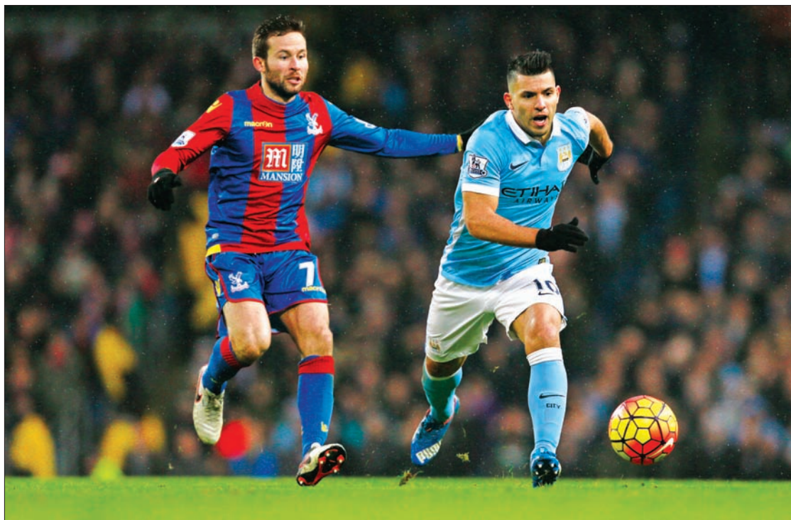
Crystal Palace's Yohan Cabaye in action with Manchester City's Sergio Aguero during Barclays Premier League at Etihad Stadium on 16 January 2016.

LONDON — It rains hard and often and is a far cry from the beaches of Barcelona, yet Argentina striker Sergio Aguero believes world player of the year Lionel Messi would find Manchester to his liking.