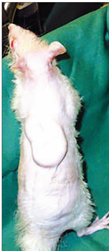
A rat with cartilage in the shape of a human ear implanted on its back. The University of Tokyo and Kyoto University said on 22 January 2016, they have succeeded in creating human ear cartilage from iPS cells.

Induced pluripotent stem cells could grow into various human tissues and they are considered promising in the field of regenerative medicine.—Kyodo News