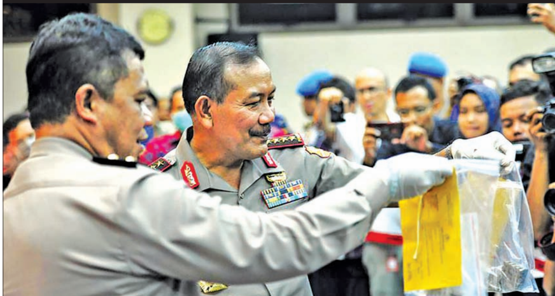
Indonesian National Police Chief General Badrodin Haiti (2 nd L) and Spokesman of National Police Inspector General Anton Charliyan (L) show plastic bags containing guns used by militants in the 14 January attack during a press conference at the national police headquarters in Jakarta, Indonesia, 22 January.