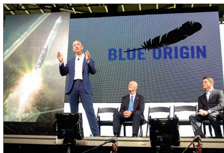
Amazon founder and Blue Origin founder Jeff Bezos (L) announces plans to build a rocket manufacturing plant and launch site at Cape Canaveral Air Force Station, Florida in 2015.

The company is working on a more powerful rocket engine, with testing slated to begin this year, Bezos said.