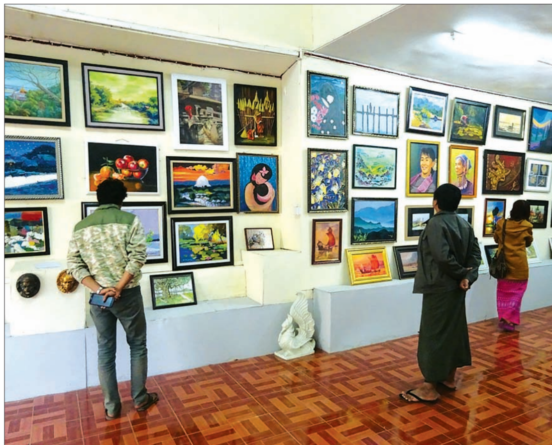
Painting fans are observing the paintings.

AN art exhibition titled “Mandalay Cold Season Remembrance-2”, organised by Mandalarian Artists, was opened at the Mandalay Hill Art Gallery in Aungmyethazan