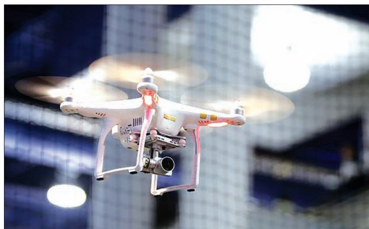
A DJI Phantom 3 Professional drone with 4K video flies in a drone cage during the 2016 CES trade show in Las Vegas, Nevada on 8 January.

WASHINGTON — Nearly 300,000 recreational drone owners have registered their unmanned aircraft in a new federal database intended to help address a surge of rogue drone flights near airports and public venues, US regulators said on Friday.