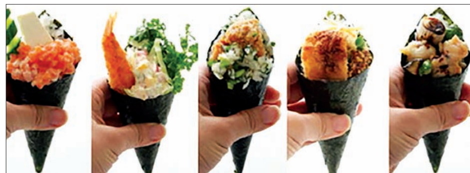
Various "temaki," or the Brazilian version of hand-roll sushi, cooked with recipes created by vinegar maker Mizkan Holdings Co.

Mizkan will provide its temaki recipes to restaurants in Japan and ask them to adopt temaki as new menu items. "We hope temaki will become an everyday item in Japan as well," a company official said.—Kyodo News