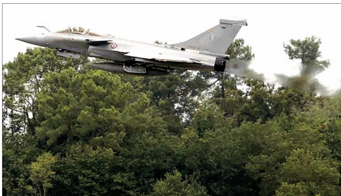
A Rafale fighter jet flies over the air base in Mont de Marsan, southwestern France, in 2015.