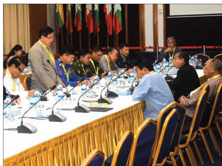
Union Peace Dialogue Joint Committee meeting at Myanmar Peace Centre in Yangon.

U Thu Wai, a representative of political parties, described the effort as an important milestone in the history of the country, calling for greater cooperation and unity in the peace process. A brief account of the Union Peace Conference is expected to come out in February and its reports in March.—Ye Khaung Nyunt