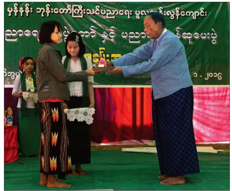
Speaker U Khin Aung Myint presents prize to an outstanding student at a monastic post-primary school in Pyawbwe, Mandalay Region.

After presenting awards to outstanding students, Speaker U Khin Aung Myint inspected the classrooms and computer labs in the monastic post-primary school.