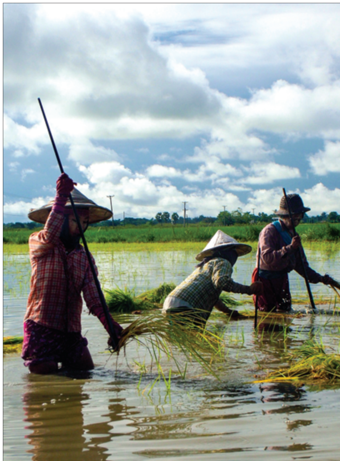
Paddy cultivations work in a field in Bago.