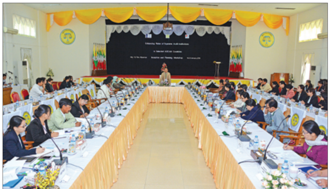
A workshop titled "Enhancing Roles of Supreme Audit Institutions in Selected Countries of the Association of Southeast Asian Nations".

The technical assistance was approved by the Asian Development Bank in December 2014 with funding from the Government of Japan's Japan Fund for Poverty Reduction. The supreme audit institutions of the Philippines, Viet Nam and Lao PDR are also included in the R-CDTA programme.— GNLM