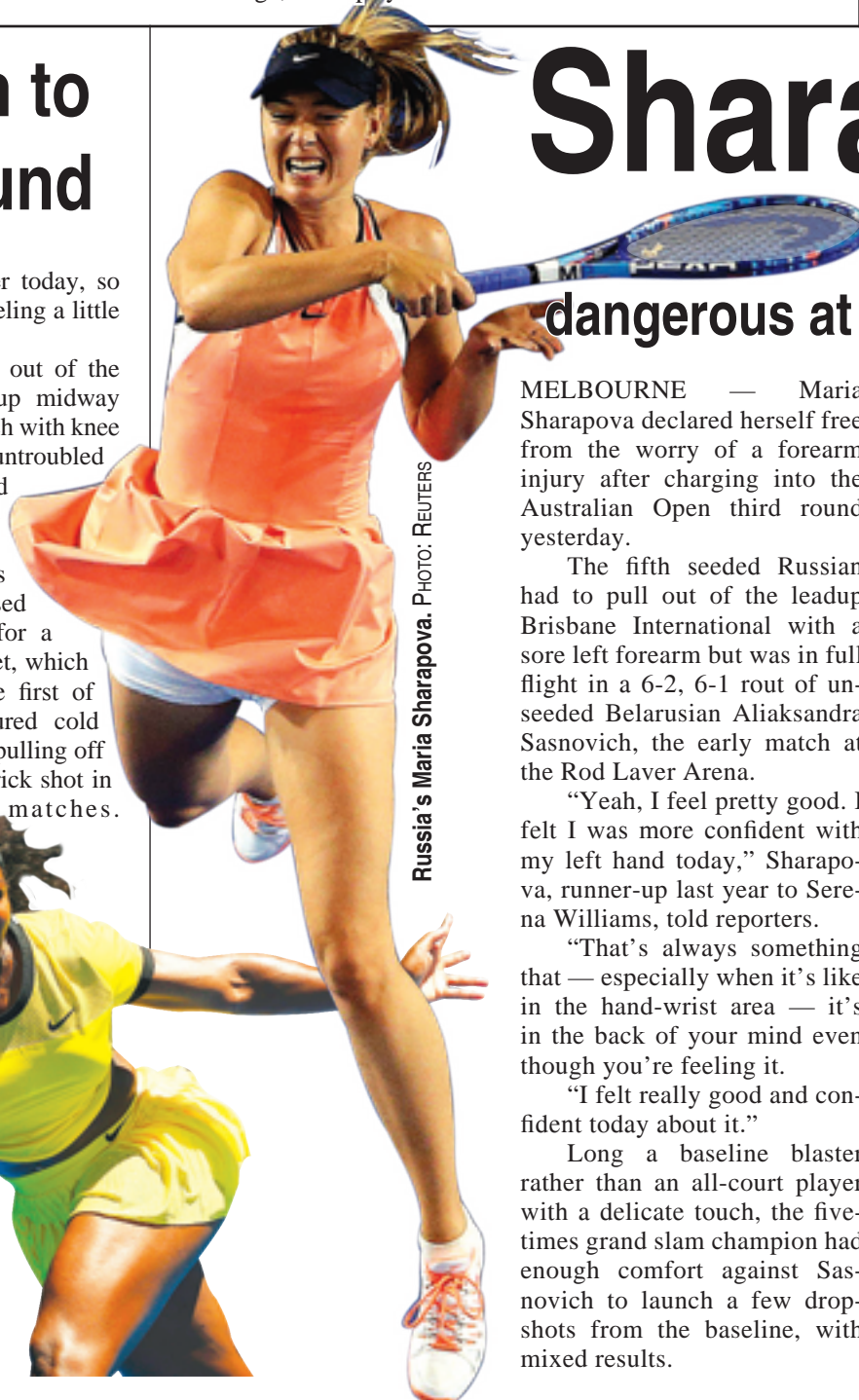
Russia's Maria Sharapova.

MELBOURNE — Maria Sharapova declared herself free from the worry of a forearm injury after charging into the Australian Open third round yesterday.