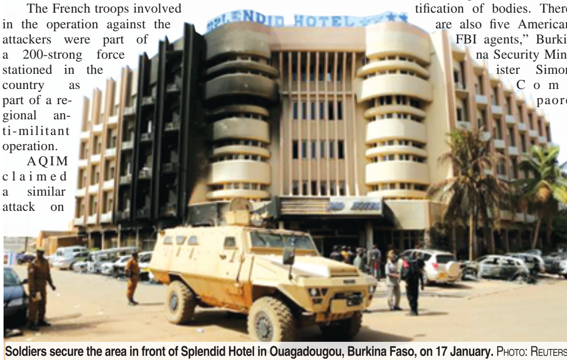
Soldiers secure the area in front of Splendid Hotel in Ouagadougou, Burkina Faso, on 17 January.