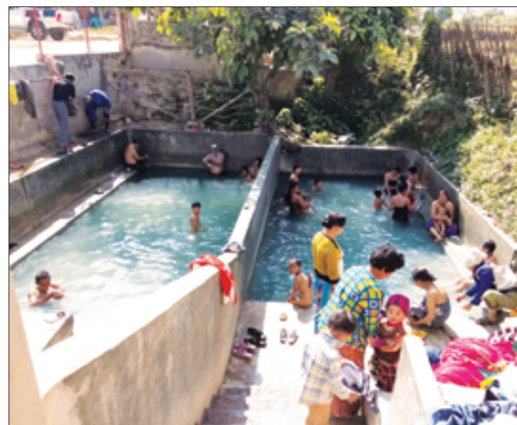
Natural hot spring in Hsipaw.

An average of 200 people visit the Kyankhin hot spring each day. Organisers collect K200 per visitor to raise funds for preservation of the natural hot spring.— Sai