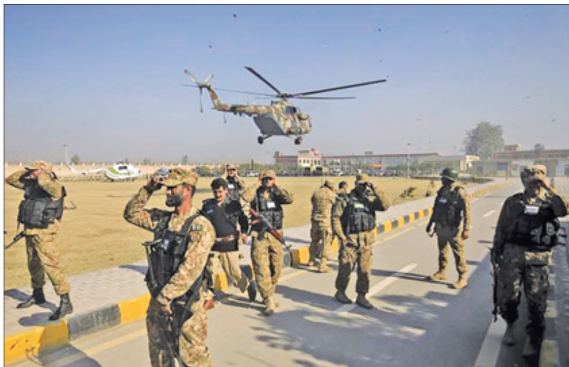
Soldiers holds their caps as a helicopter flies past during an operation, after a militant attack at Bacha Khan University in Charsadda, Pakistan, on 20 January.

Many of the dead were apparently shot in the head execu-