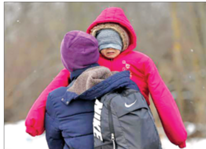
A migrant carries a child as they walk through a frozen field after crossing the border from Macedonia, near the village of Miratovac, Serbia, on 18 January.

GENEVA —Thousands of refugee children travelling along the migration route through Turkey and southeastern Europe are at risk from a sustained spell of freezing weather in the next two weeks, the United Nations and aid agencies said on Tuesday.