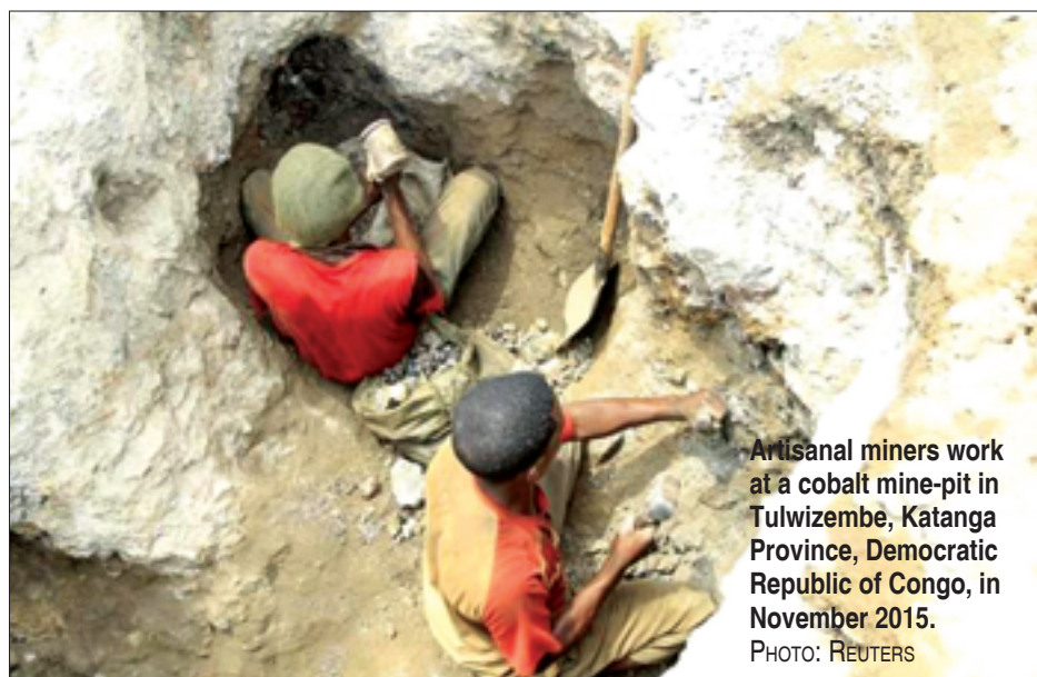
Artisanal miners work at a cobalt mine-pit in Tulwizembe, Katanga Province, Democratic Republic of Congo, in November 2015.

Sony did not respond to emailed requests for comment. Millions of Congolese work in informal mining,