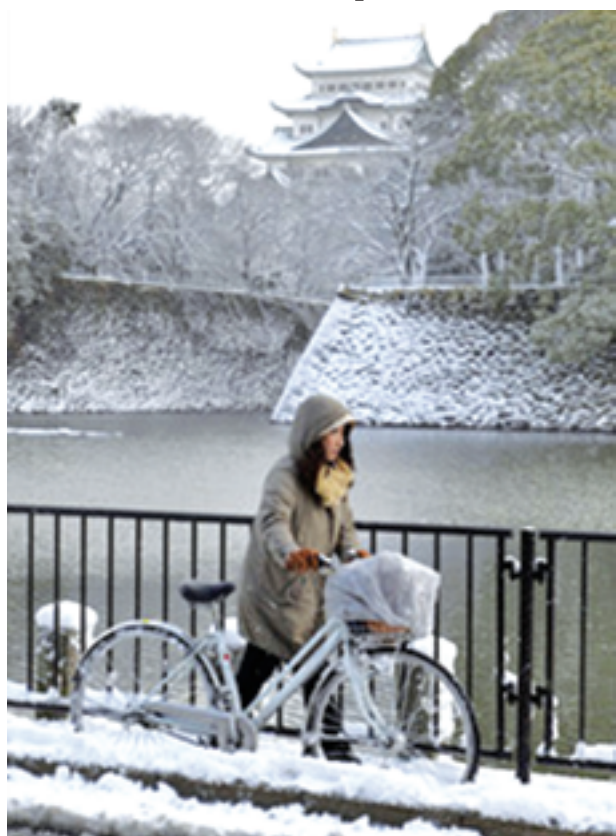
A woman walks her bicycle on a snow-filled road near Nagoya Castle in central Japan on 20 January. Heavy snow and stormy winds were expected to continue on the day in wide areas of the country, mainly along the Sea of Japan coast.

NAGOYA — Heavy snow hit wide areas of the Japanese archipelago yesterday, with traffic disrupted in the Tokai region of central Japan which is usually unaccustomed to snowfall.