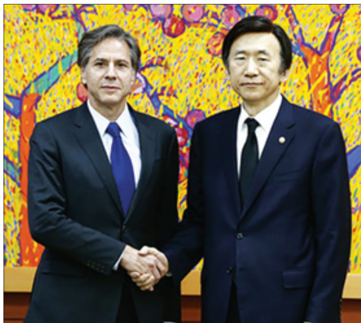
US Deputy Secretary of State Antony Blinken (L) meets with South Korean Foreign Minister Yun Byung Se in Seoul on 20 January.

Vice Foreign Minister Lim Sung Nam, who also held talks with Blinken, told reporters that