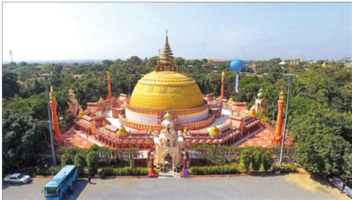
Sitagu International Buddhist Academy in Sagaing.

THE World Buddhist Peace Conference will take place on a grand scale at Sitagu International Buddhist Academy in Sagaing Region from 22 to 24 January, focusing on making the world more peaceful, according to the academy.