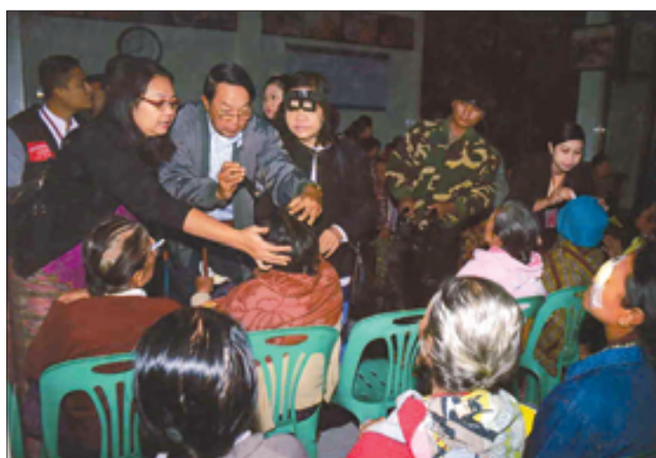
Eye specialist team gives treatment to patients.