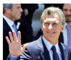
Argentina's President Mauricio Macri.

It came days after the end of a two-week manhunt for three criminals convict-