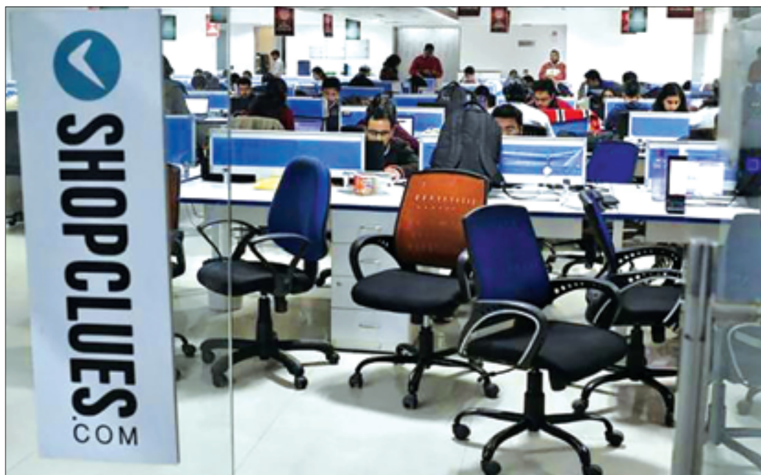
Employees of Shopclues.com, an online marketplace, work inside their office in Gurgaon, on the outskirts of New Delhi, India, on 19 January.

Shopclues.com raised funds last week from investors including Singapore sovereign wealth fund GIC and Tiger Global that valued the firm at more than $1.1 billion — helped by detailing plans to hit profitability by the first half of next year, Aggarwal said.—Reuters