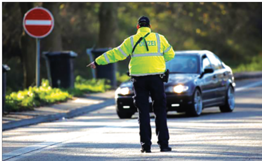
German police conduct a control at the German-Belgian border in Aachen, Germany, to check vehicles and verify the identity of travellers in November 2015.