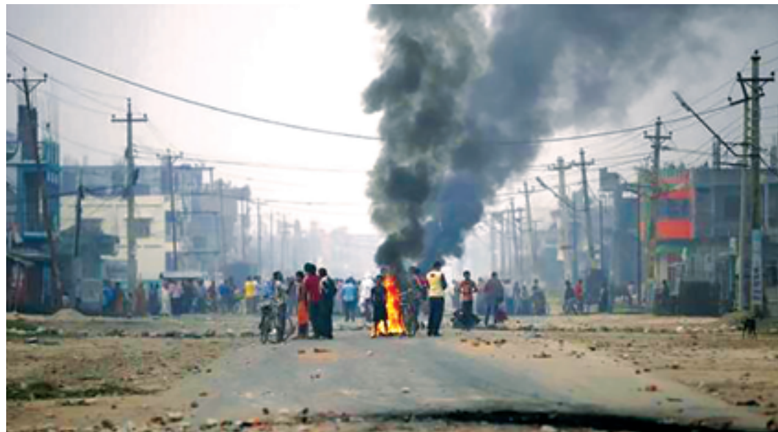
Protesters stand near burning tyres as they gather to block the highway connecting Nepal and India, during a general strike called by Madhesi protesters demonstrating against the new constitution in Birgunj, Nepal in November 2015.