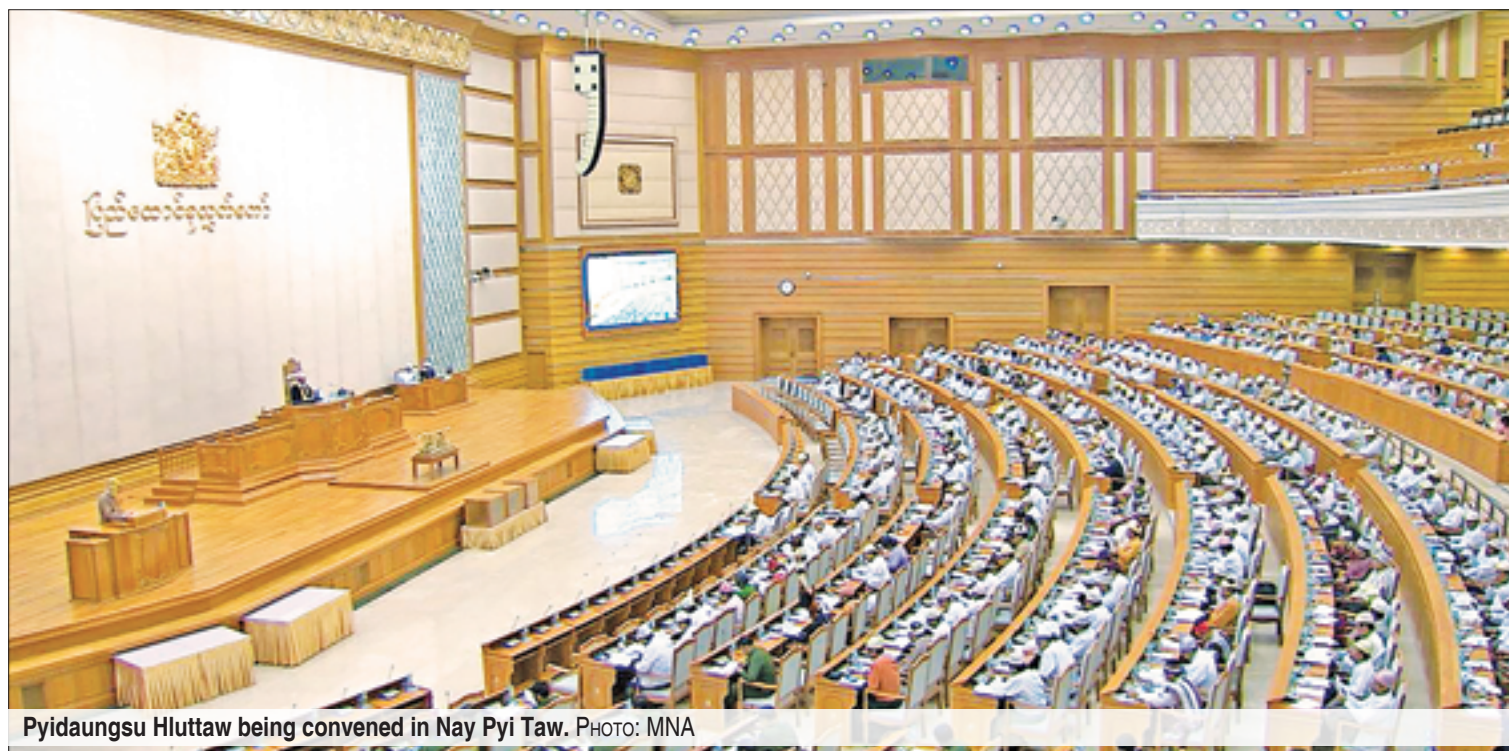
Pyidaungsu Hluttaw being convened in Nay Pyi Taw.

THE Pyidaungsu Hluttaw put a law on record yesterday and discussed one bill and a national