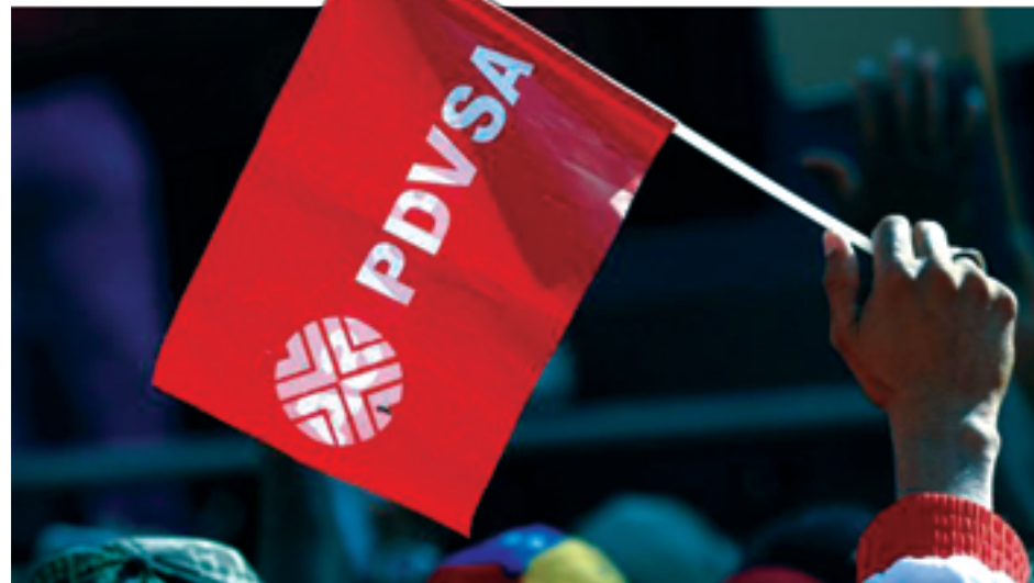
A worker of the Venezuelan state oil company PDVSA holds a flag with the company logo, during a meeting with Venezuela's President Nicolas Maduro outside Miraflores Palace in Caracas on 12 January 2016.