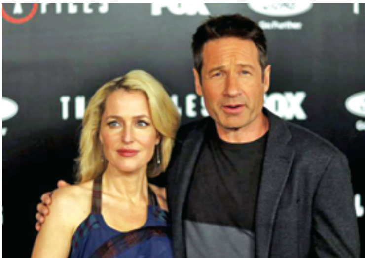
Cast members Gillian Anderson and David Duchovny pose at a premiere for "The X-Files" at California Science Centre in Los Angeles, California on 12 January.

"Conspiracy has gone mainstream," Carter told Reuters.