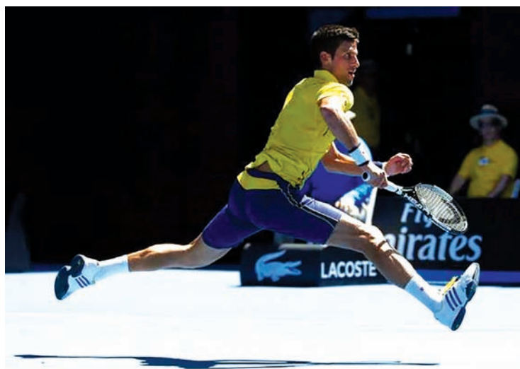
Serbia's Novak Djokovic runs and jumps to hit a shot during his first round match against South Korea's Hyeon Chung at the Australian Open tennis tournament at Melbourne Park, Australia, on 18 January.