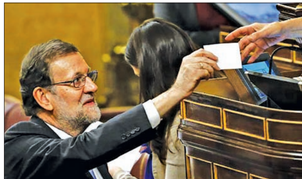
Spain's acting prime minister Mariano Rajoy votes during the first session of parliament following a general election in Madrid, Spain, on 13 January.

MADRID — A political logjam in Spain expected to last at least several months is set to slow the pace of economic reforms sharply, storing up obstacles for growth in a country seeking to extend a recovery from deep crisis.