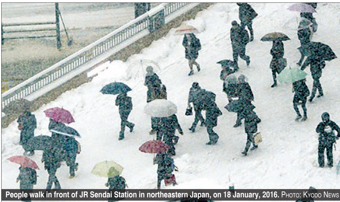
People walk in front of JR Sendai Station in northeastern Japan, on 18 January, 2016.