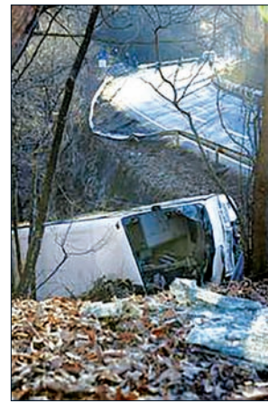
A tour bus veered off a road in the central Japanese town of Karuizawa earlier 15 January.

Tokyo-based ESP provided its drivers with an instruction document together with a basic itinerary given by Keyth Tour, the travel company that organised the tour, but the ministry judged the document and itinerary did not meet standards under the law, saying they were insufficient to ensure proper and safe bus operations, according to the officials.