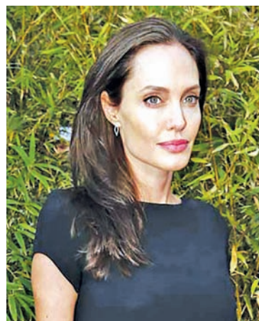
Angelina Jolie.

Munn, 35, who is dating buff sportsman Aaron Rodgers, admits she likes the way she feels now she has a toned physique: "I feel very strong and it's an awesome feeling." — PTI