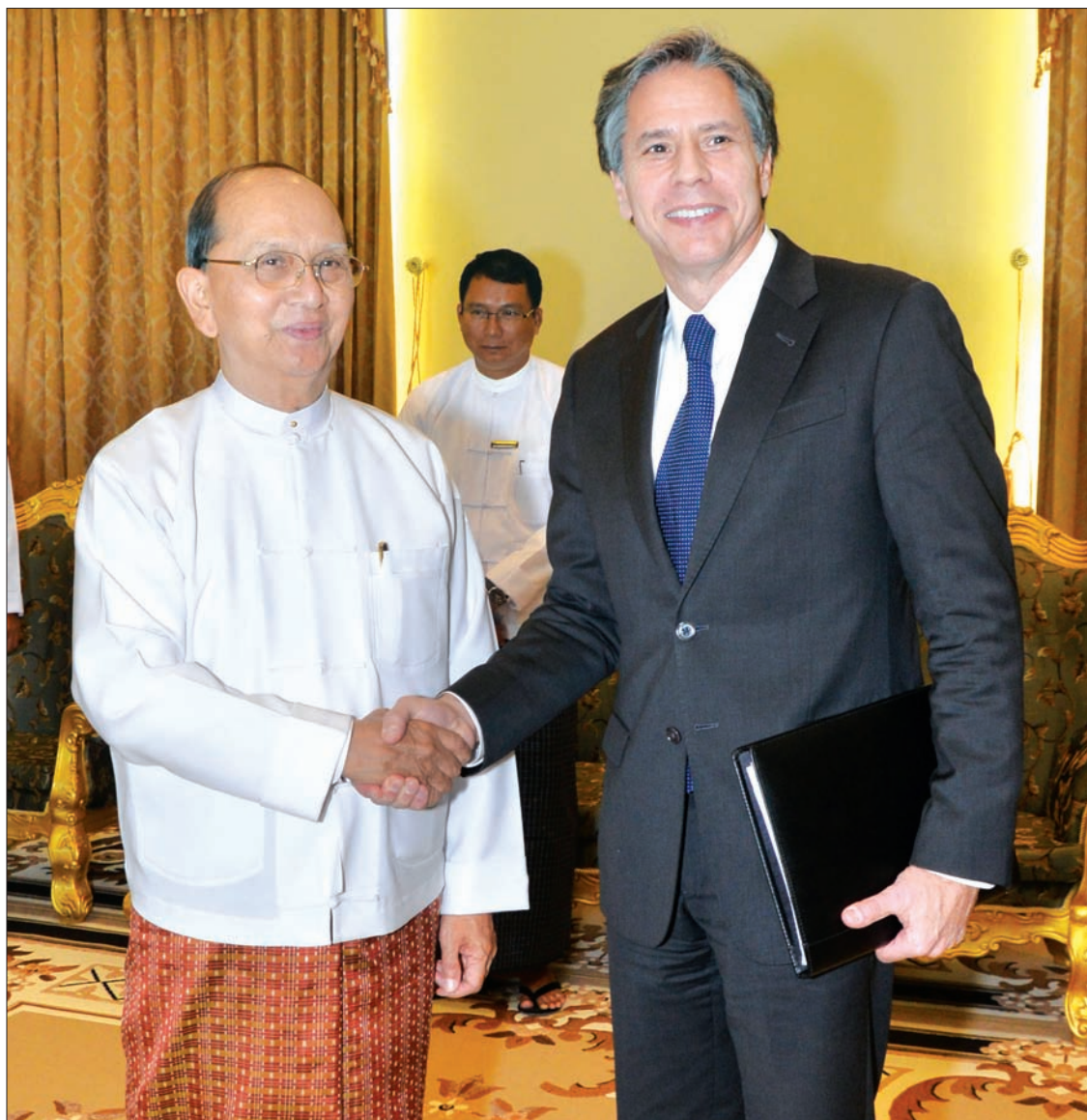
President U Thein Sein welcomes HE Mr Anthony Blinken, the US Deputy Secretary of State.

PRESIDENT U Thein Sein received a US delegation led by HE Mr Anthony Blinken, the US Deputy Secretary of State, at the Presidential Palace in Nay Pyi Taw yesterday.