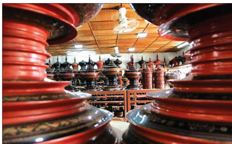
Lacquerware are displayed at a souvenir shop.

THE substitution of lacquerware, ceramic and bamboo handicrafts for households items made of plastic could potentially cause the disappearance of the traditional handicraft industry, say Myanmar craftsmen, who have called on the government take action to