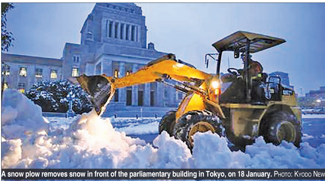
A snow plow removes snow in front of the parliamentary building in Tokyo, on 18 January.

TOKYO — Heavy snow fell in parts of eastern and northeastern Japan early yesterday, with snowfall reaching 6 centimetres in downtown Tokyo, resulting in injuries to more than 100 people and disruptions to transport.