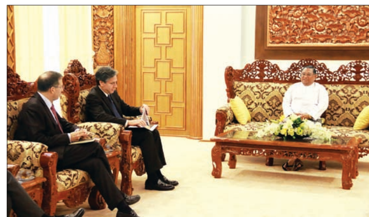
Union Minister U Wunna Maung Lwin meets H E Mr Anthony Blinken, Deputy Secretary of State of the United States.

At the meeting, they cordially exchanged views on furthering bilateral relations and cooperation and ASEAN-US relations and on matters of mutual interest.— Myanmar News Agency