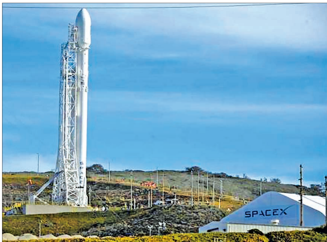
A SpaceX Falcon 9 rocket with the Jason-3 spacecraft onboard is shown at Vandenberg Air Force Base Space Launch Complex 4 East in Vandenberg Air Force Base, California, on 16 January.

A successful ocean landing would have marked a second milestone for SpaceX a month after it nailed a spaceflight first with a successful ground landing in Florida, a key step in Musk's quest to develop a cheap, reusable rocket. The company's two previous ocean-landing attempts in 2015 were also unsuccessful. Being able to land at sea would give the company flexibility to