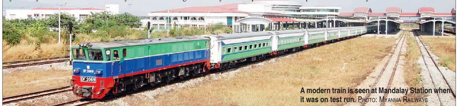
A modern train is seen at Mandalay Station when it was on test run.

The trains will have a top speed of 110 kilometres per hour, according to Myanma Railways.— GNLM