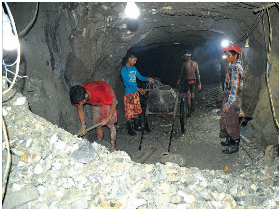
Workers of a legal mining company are digging stones in a canal at a depth of 250ft in 2014.

BANMAUK Township in Sagaing Region is facing deforestation and water pollution due to illegal gold mining, locals say.