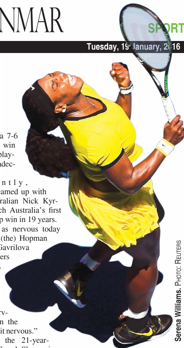
Serena Williams.

Editorial Section — (+95) (01)8604529, Fax — (01) 8604305 Advertisement & Circulation — (+95) (01) 8604532