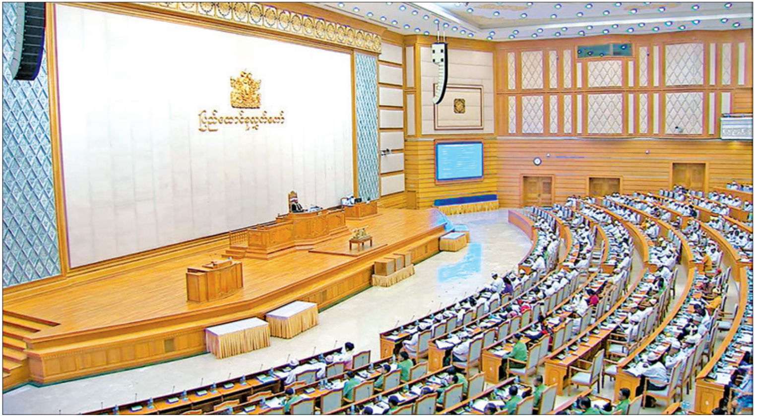
Pyidaungsu Hluttaw being convened in Nay Pyi Taw.

The parliament also approved the Insecticide Bill, the New Plant Species Protection Bill and the Bill Amending the Penal Code, which were sent back to parliament with the president's remarks.