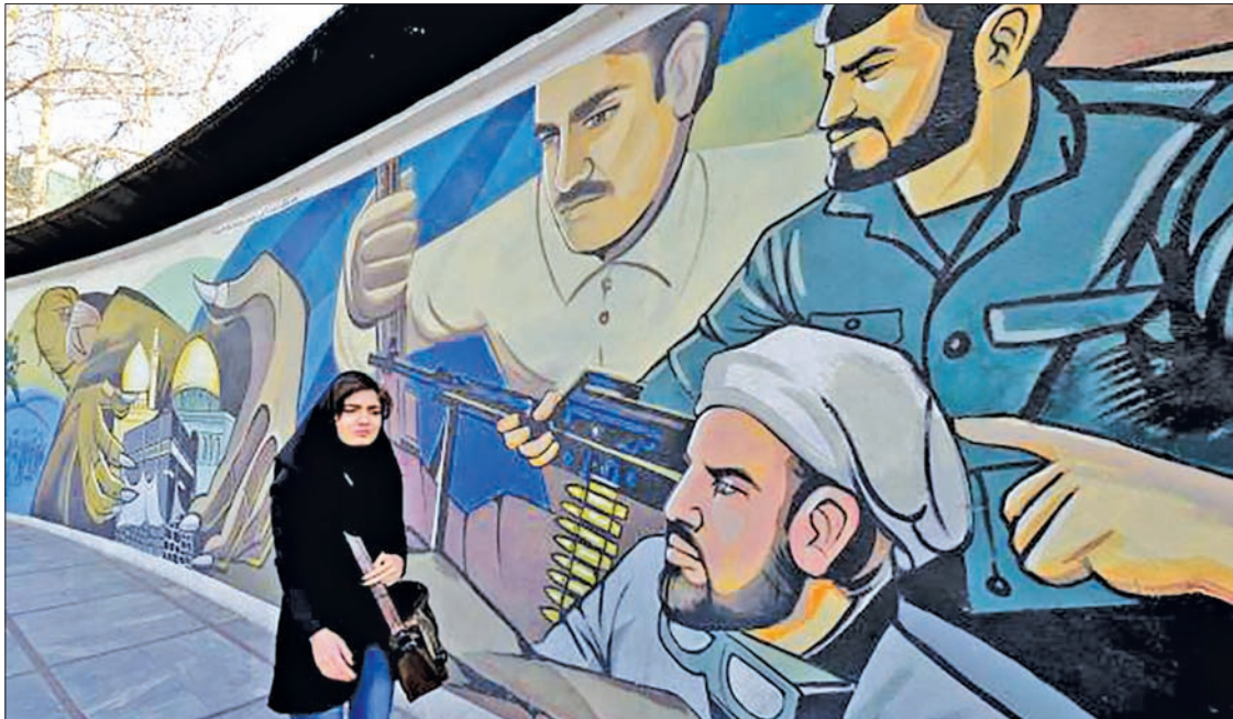
An Iranian woman walks past a revolutionary mural in Tehran, Iran, on 17 January.

"Sanctions are back!" ran the Kayhan headline. The article pointed out that Tehran's top authority, Supreme Leader Ayatollah Ali Khamenei, had said new sanctions under any pretext would constitute a breach of the nuclear deal.— Reuters