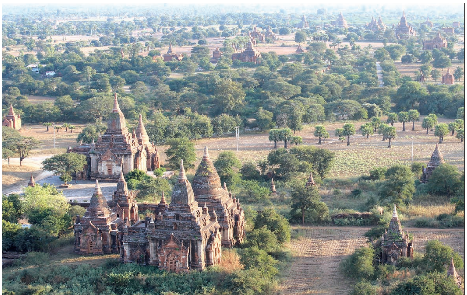
Ancient pagodas in Bagan, one of tourists attractions of Myanmar.

Skilled staff from the Archaeology Department used a GPS tracking system to locate the unearthed pagodas during the in-