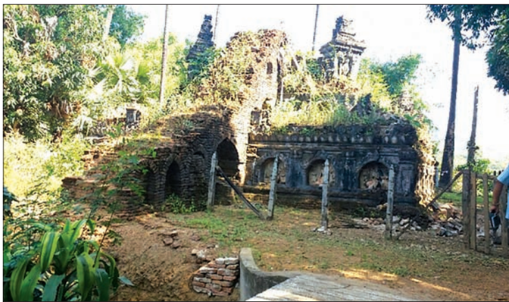
Mausoleum of King U Aung Zeya is seen in the grounds of the Theyettaw Monastery in a village in Bilin Township in the Thaton District of Mon State.

"This mausoleum used to be very tall, but it slowly crumbled away. The figures that encircle the mausoleum have also broken