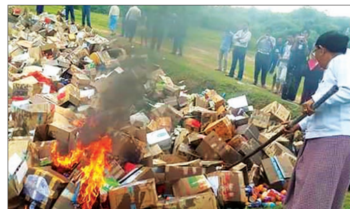
Authorities destroys unsafe food and expired drugs.

attended by Mandalay Mayor U Aung Maung, Deputy Mayor U Nyunt Maung, members of the Mandalay City Development Committee, personnel from the companies that handed over expired drugs to the authorities and officials from the Mandalay Region Food and Drugs Administration.— Maung Pyi Thu