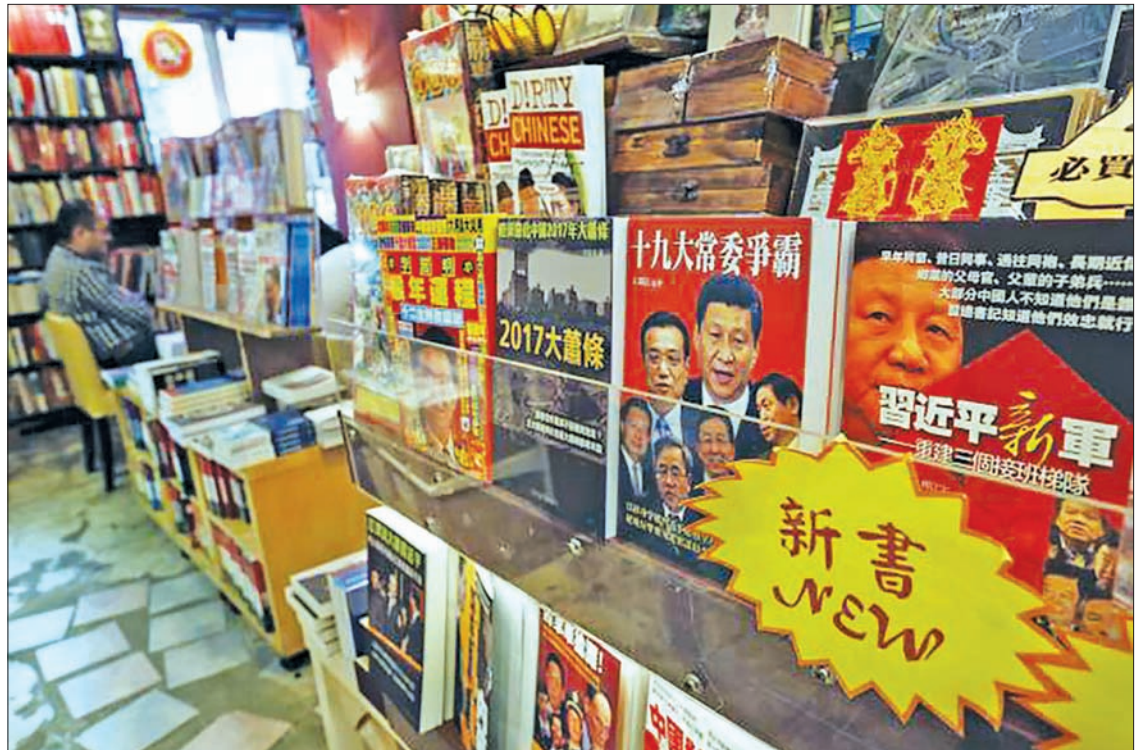
Books on China politics and senior leaders are displayed inside a bookstore in Hong Kong, China on 8 January 2016.

relationship with Gui also subsequently disappeared.