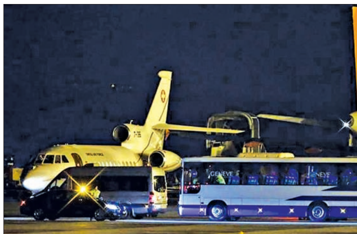
A bus and a van are parked in front of a plane carrying three Iranian-Americans, who left Tehran under a prisoner swap, after it landed at Cointrin airport in Geneva, Switzerland on 17 January.

Several Iranian-Americans held in US prisons after being charged or convicted for sanctions violations have also been released, their lawyers told Reuters on Sunday. Rezaian told two Post senior editors in a phone call on Sunday night that he was doing "a hell of a lot better than I