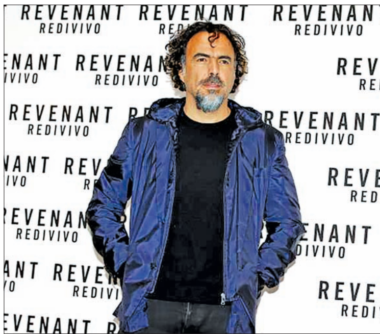
Director Alejandro Gonzalez Inarritu poses during a photo call for the movie "The Revenant" in Rome, Italy on 16 January.

Mexico's Attorney General, Arely Gomez, has since said Penn's meeting with Guzman in