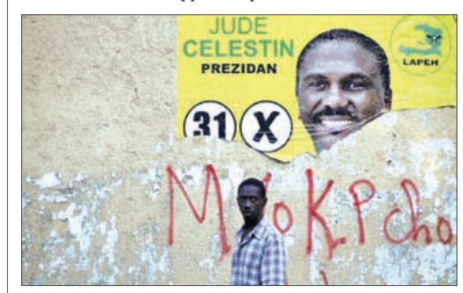
A man walks next to a ripped electoral poster of presidential candidate Jude Celestin in Port-au-Prince, Haiti on 15 January.

The independent investigators found a range of irregularities including incompetence of clerks at voting booths and in some cases attempts to rig the vote. The investigators called for a reshuffle of the nine-member electoral council tasked with organising the ballot, citing a lack of credibility, and urged dialogue to resolve the impasse.—Reuters