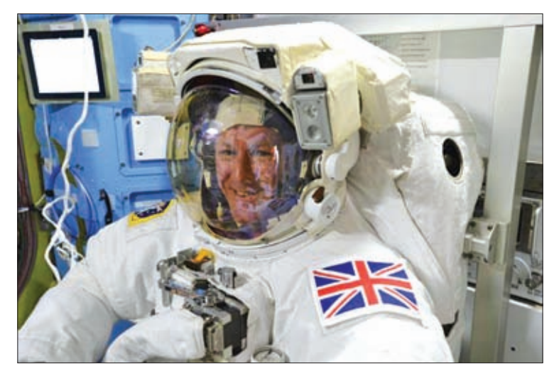
British astronaut Tim Peake poses in his spacesuit aboard the International Space Station.

NASA tightened its flight rules after a spacesuit worn by Italian astronaut Luca Parmitano leaked during a spacewalk in July