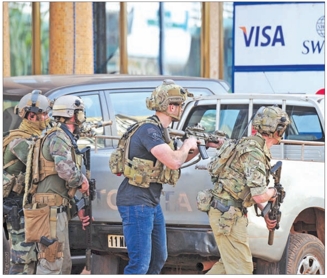
French soldiers arrive at the site of the attack in Ouagadougou, Burkina Faso, on 16 January.

However, the nationalities of those killed in the assault were not immediately known.—Reuters