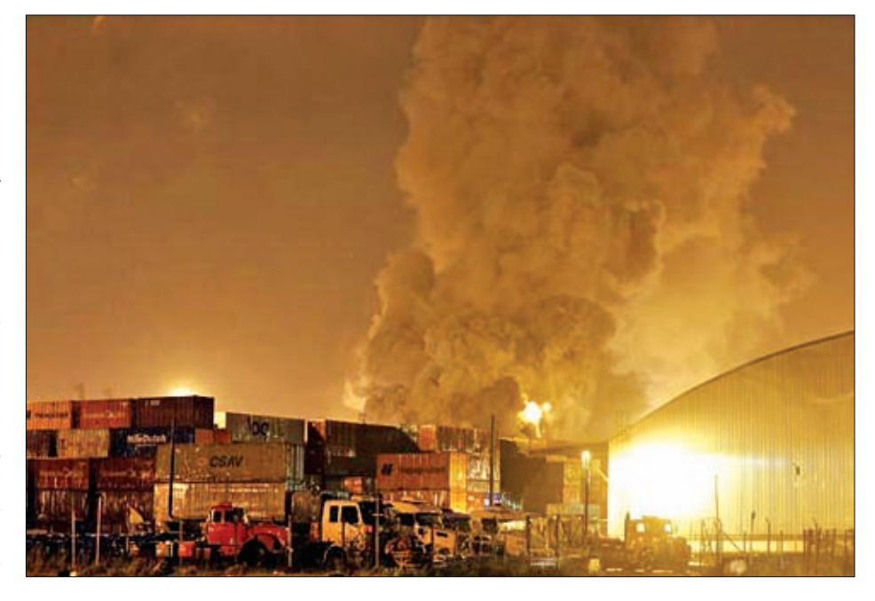
Smoke rises from chemical containers from logistic company Localfrio in Guaruja, Brazil, on 14 January.

But the other 53 terminals are operating normally with stocks, the port spokeswoman said. Representatives at TEAG and TEG bulk sugar and grain terminals in Guaruja said late on Thursday that loading continued despite the nearby fire.—Reuters