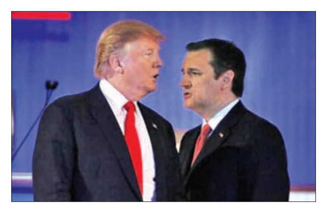
Republican US presidential candidate businessman Donald Trump and rival candidate Senator Ted Cruz cross paths during a break at the Fox Business Network Republican presidential candidates debate in North Charleston, South Carolina on 14 January.