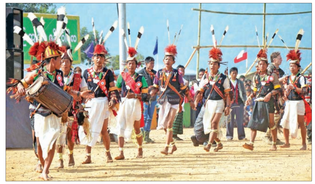
Naga ethnic tribal men dance as they celebrate traditional new year festival in Lahe.