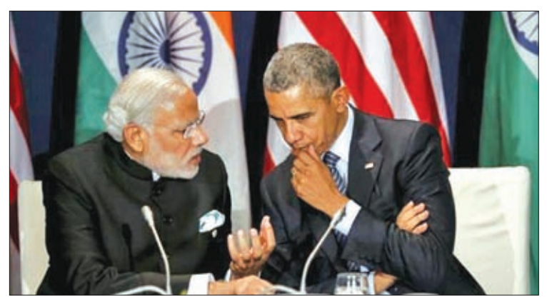
US President Barack Obama (R) meets with Indian Prime Minister Narendra Modi at the climate change summit in Paris, November 30, 2015.

NEW DELHI — Toshiba Corp's Westinghouse Electric hopes to clinch a deal to build six nuclear reactors in India by end-March, its CEO said, in time for a possible visit by Prime Minister Narendra Modi to Washington to attend a global nuclear summit.