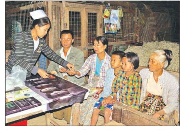
A nurse give elephantiasis vaccine to residents at Thayettaw Village in Kyungyaung Village Tract.

The program was launched on 10 January and will end on the 19 January.