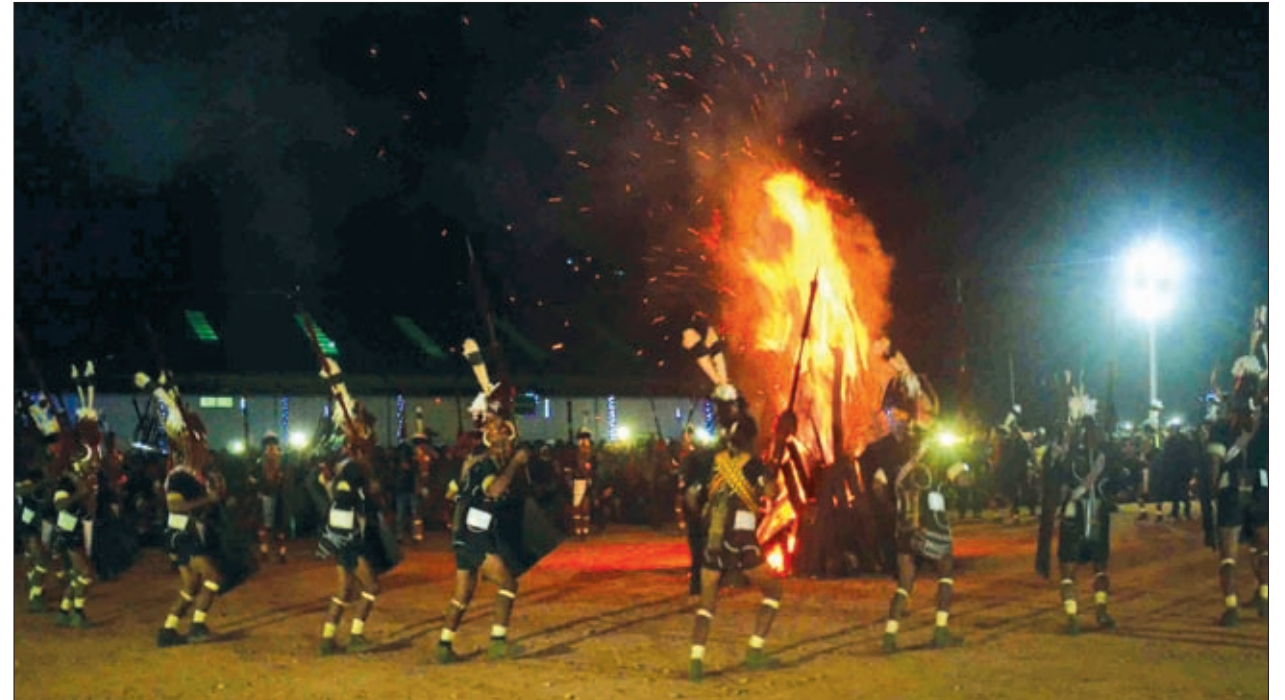
Naga ethnic men dance around bonfire at night as they celebrate traditional new year festival in Lahe.