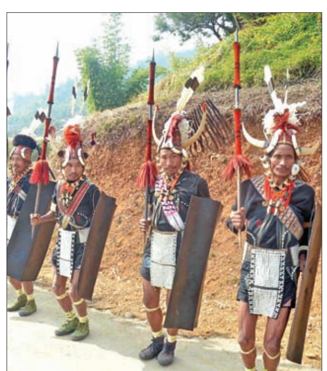
Naga men line the street as they wait to welcome visitors to the new year festival in Lahe.