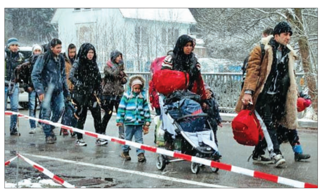
Migrants stay in queue during heavy snowfall before passing Austrian-German border in Wegscheid in Austria, near Passau in November 2015.