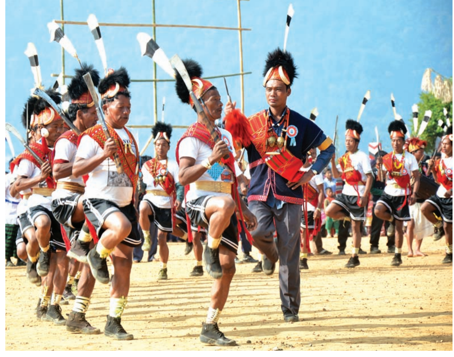
Naga ethnic people are dancing at festival ground at traditional new year festival in Lahe.

The annual festival is held for two full days each January. The first day is set aside for rehearsing traditional dances, with the second day for the festival proper. Ethnic tribes people strut their stuff in the afternoon and