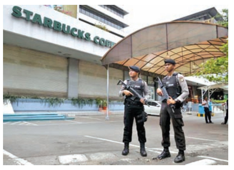
Indonesian police stand guard at the site of this week's militant attack in central Jakarta, Indonesia on 16 January.

Earlier on Saturday, Indonesia said it had shut down at least