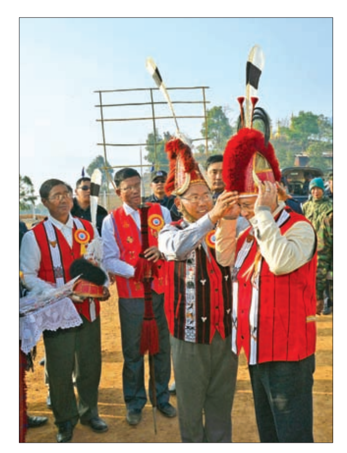
U Ru San Kyuu, the chairman of Naga Self-administered region, puts the Naga traditional hat on President U Thein Sein.