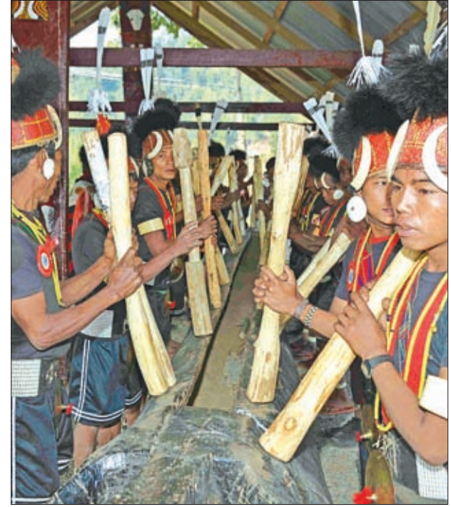
Naga men strike wooden gong upon arrival at the festival ground in Lahe.