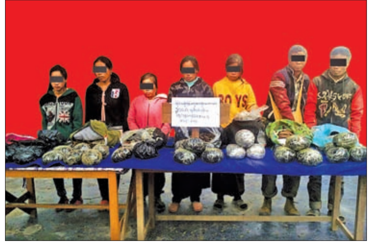
Suspects are seen with drugs seized from them.

The police are filing charges against the suspects under the Anti- Narcotic Law.— Mirror