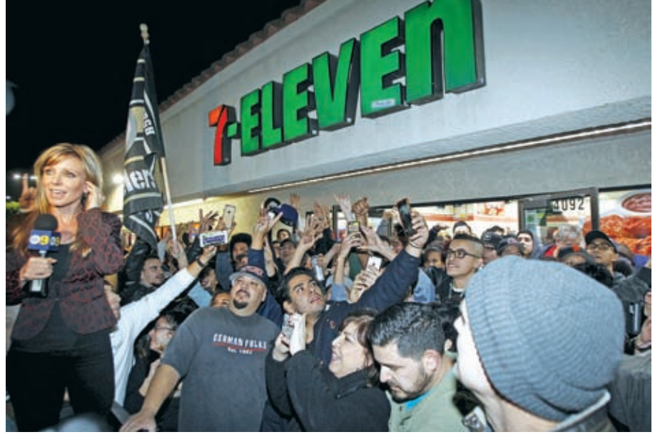
A crowd gathers in front of the 7-Eleven store where a winning Powerball ticket was sold, in Chino Hills, California on 13 January.

Under the rules, a winner has up to a year to do so. All three states with winners have laws requiring their names to be released publicly, according to the Powerball website.— Reuters