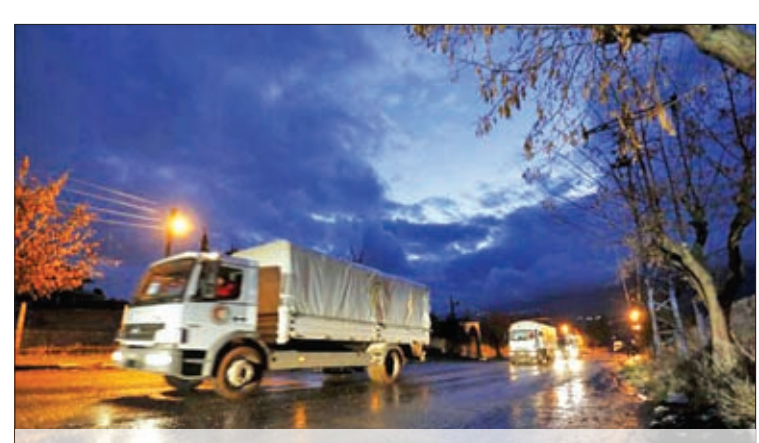
A Red Crescent aid convoy enters Madaya, Syria, on 14 January.

The siege of Madaya, where people have reportedly died of starvation, has become a focal issue for Syrian opposition groups who want all such blockades lifted before they enter negotiations with the government planned for 25 January.