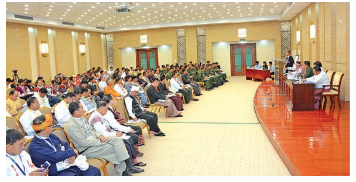
Representatives discuss farmland and environmental issue at Union Peace Conference.

Next, the Speaker of the Pyidaungsu Hluttaw announced that parliamentary approval will be sought on the National Planning Bill 2016-2017 as of 18 January.—Myanmar News Agency