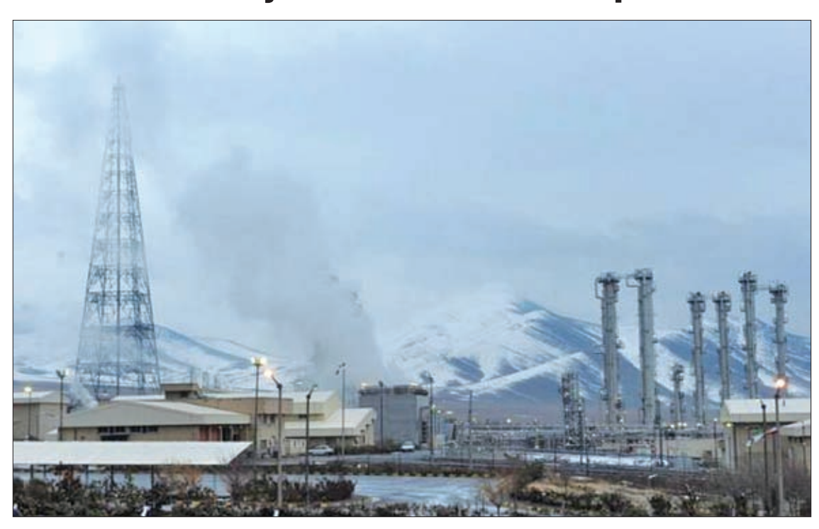
A general view of the Arak heavy-water project, 190 km (120 miles) southwest of Tehran.

ANKARA — Iran has removed the sensitive core of its Arak nuclear reactor and UN inspectors will visit the site on Thursday to verify the move crucial to the implementation of Tehran's atomic agreement with major powers, state television said on Thursday.