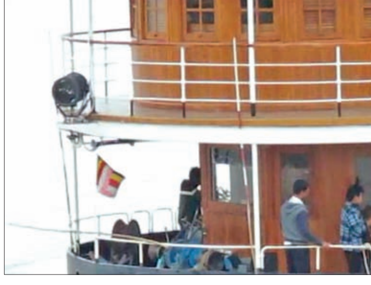
Chindwin River cruises become popular for holiday makers.

Royal Voyage Co. Ltd brought two groups, each comprising 16 British tourists, on trips along the river last December and this January, a spokesperson from the ministry said. They visited Monywa and Kalay townships and nearby villages along the river to observe traditional culture, customs