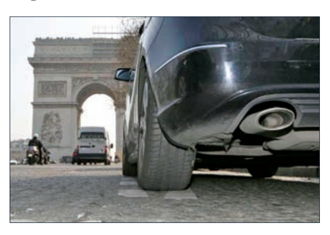
A car drives near the Arc de Triomphe in Paris, in 2014.

The diluted deal would allow cars to carry on emitting more than twice official limits on nitrogen oxide (NOx) emissions, blamed for premature death and respiratory diseases.