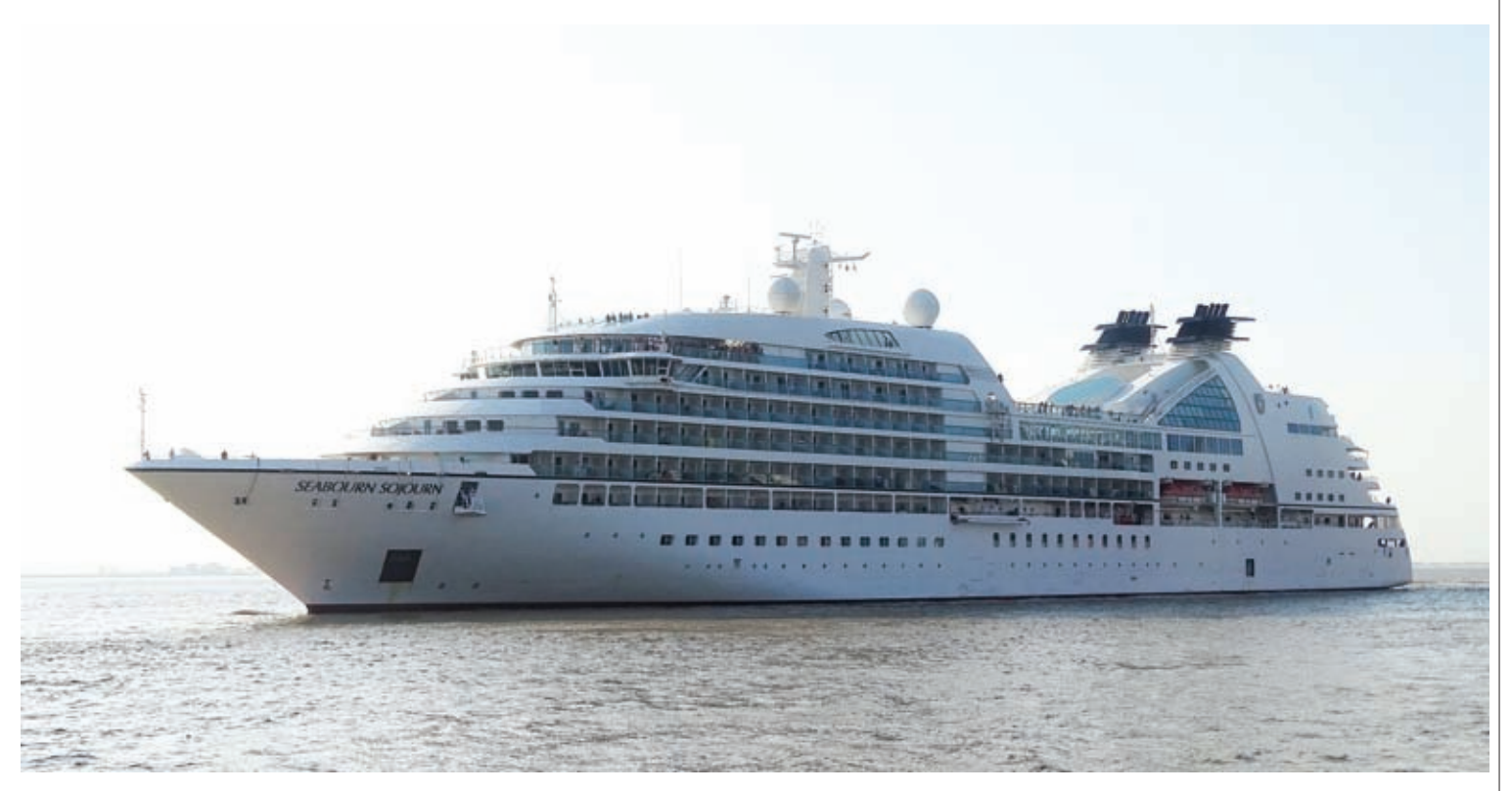
Myanmar becomes a population destination for cruise ship visitors.