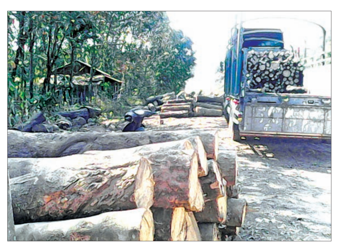
Logs of rubber trees are piled in Thaton before transported to Yangon.

DOWNWARD prices of rubber has caused farmers to resort to cutting down their trees and selling them in Thaton Township.