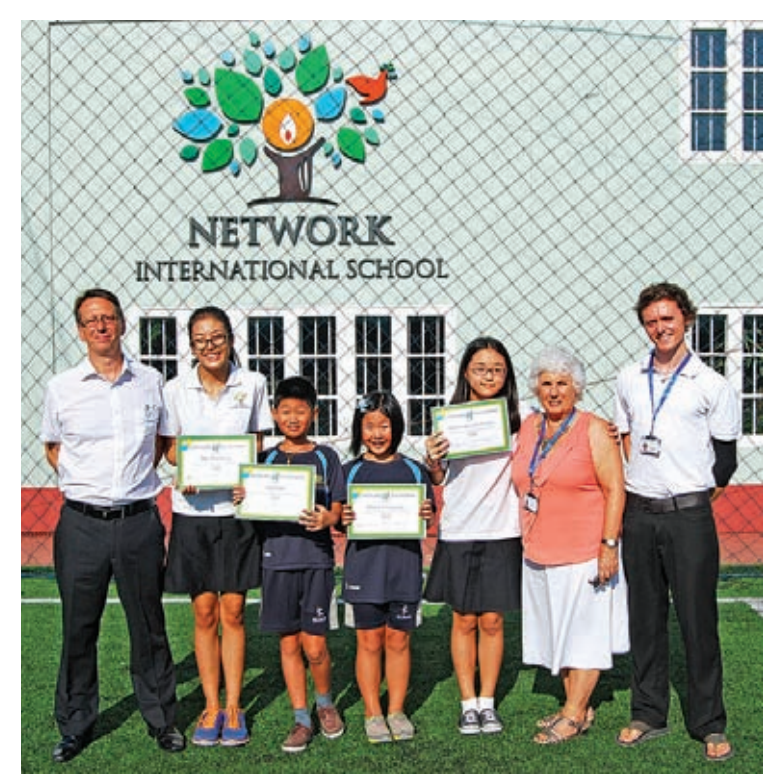
The winners and the judges.

If Myanmar's future leaders have the same commitment to progress, communication skills and empathy as the students at Network International School, we will all be in good hands.