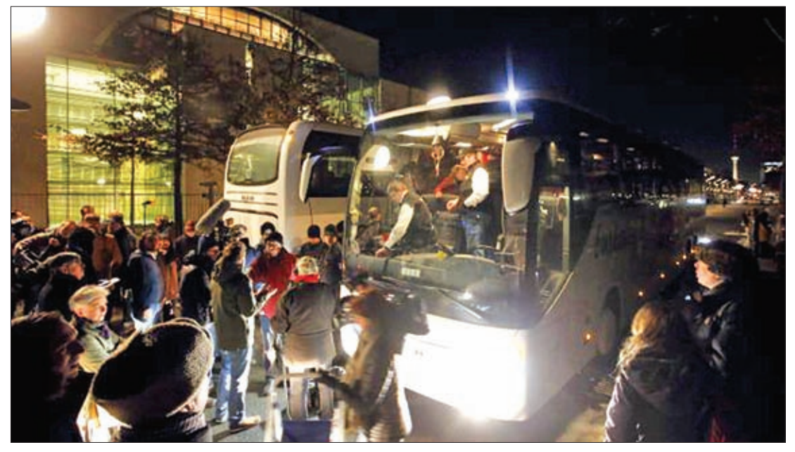
A bus (R) with refugees from the Bavarian town of Landshut is pictured after its arrival to the Chancellery building in Berlin, Germany, on 14 January.

The frustration in Bavaria, the main entry point for most migrants, is especially strong with Merkel's conservative allies, the Christian Social Union (CSU), repeatedly calling on her to introduce a formal cap on migrant numbers. She has resisted such a cap, arguing it would be impossible to enforce.— Reuters