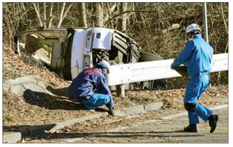
Police officers investigate the spot where a tour bus with 41 people bound for a ski resort veered off a road in Karuizawa town in the central Japan prefecture of Nagano on 15 January. The accident left 14 people dead and 27 injured.

separately searched the offices of Yamamoto apologised to the fam-