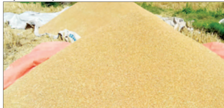
Rice farmers in Singaing Township are facing low yield of this summer harvest due to insufficient supplementary water to fields.

Residents have asked local authorities to prevent the lakes from disappearing by digging out soil and removing garbage with the use of heavy machinery before monsoon season.— Yaung Ni Tin Win