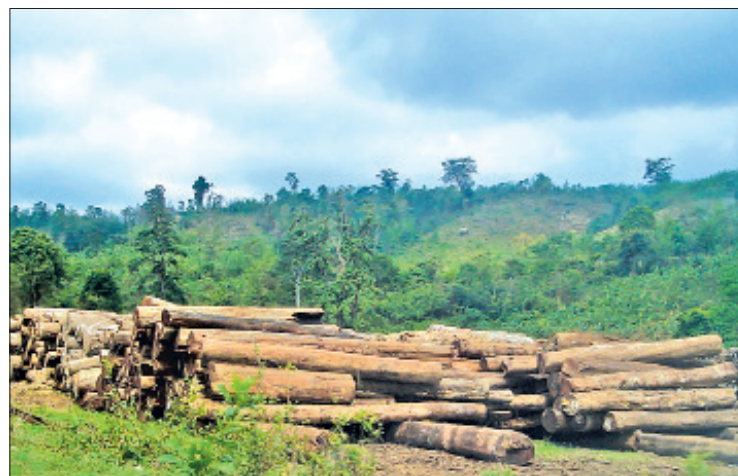
Teak logs are piled near a forest.

The aforementioned CSOs also called for the MECF to recognise the letter, to consider its contents and to open transparent inroads for discussion. Last year, 152 Chinese nationals were caught carrying out illegal logging in Kachin State. Two loggers were sentenced to 10 years in jail, while the rest were sentenced to life imprisonment at the Myitkyina court on 22 July 2015. However, they were later released on 31 July in an amnesty after an official announcement was made by the Chinese embassy in Yangon that the punishments were too severe. —Myitmakha News Agency