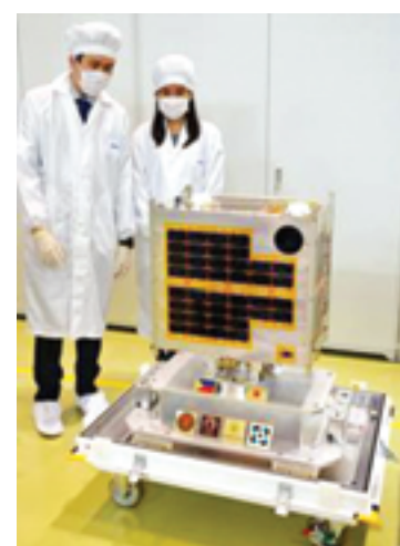
The Philippines' first satellite developed with the country's involvement is unveiled at the Tsukuba Space Centre of the Japan Aerospace Exploration Agency in Tsukuba, northeast of Tokyo, on 13 January 2016. The micromini satellite, scheduled to be launched in March, was jointly developed by researchers at two Japanese universities and the Philippine Department of Science and Technology.

Under the plan, a US rocket will carry the satellite to Japan's Kibo laboratory on the International Space Station in March before it is released into space, which can take place as early as April. In March 2015, Hokkaido and Tohoku universities said they would help the Philippines develop its first satellites over a period through 2017. Manila has so far purchased satellites from foreign countries.—Kyodo News