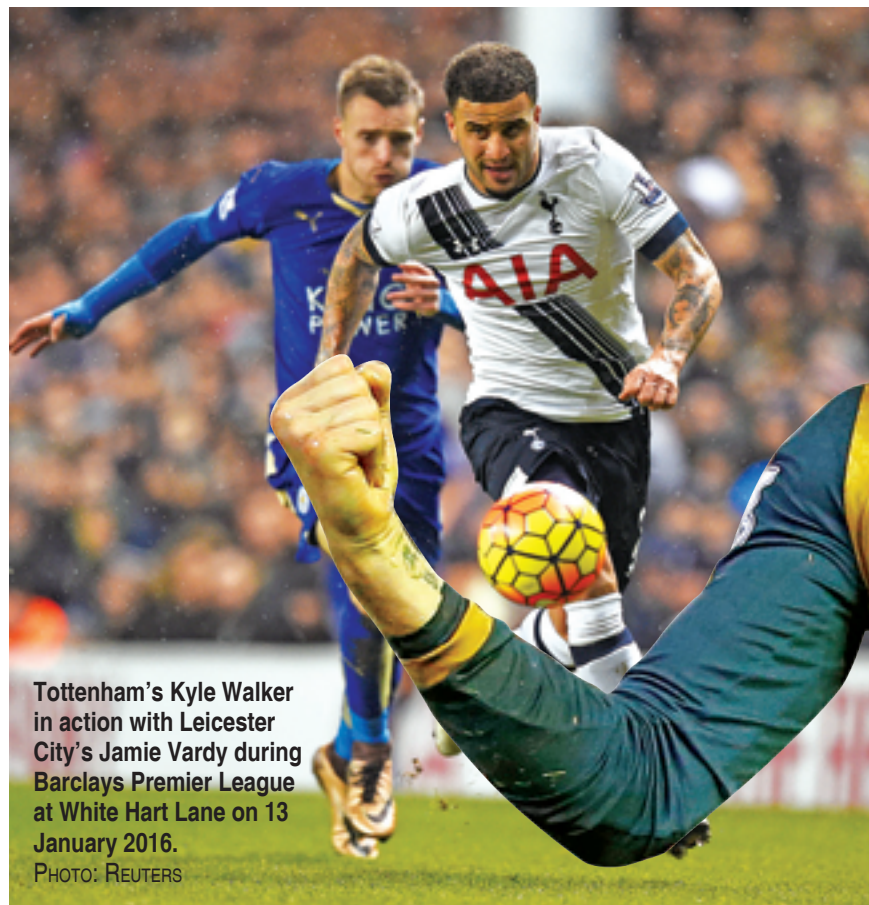
Tottenham's Kyle Walker in action with Leicester City's Jamie Vardy during Barclays Premier League at White Hart Lane on 13 January 2016.

“I’m disappointed because I think we played better ... All the stats are positive for us but then football is about scoring and we didn’t score.”—Reuters