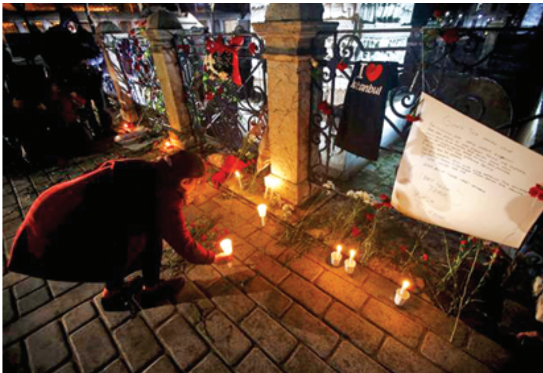
A woman places a candle at the site of Tuesday's suicide bomb attack at Sultanahmet square in Istanbul, Turkey on 13 January.

Turkey has kept an open border to refugees from Syria's civil war and is now home to more than 2.2 million, the world's largest refugee population. But its border has also been used by foreign fighters seeking to join Islamic State or return from its ranks to commit atrocities abroad. "This individual was not somebody under surveillance. He entered Turkey normally, as a refugee, as someone looking for shelter," Davutoglu told a news conference, adding he had been identified from fragments of his skull, face and nails. "After the attack his connections were unveiled. Among these links, apart from Daesh, we have the suspicion that there could be certain powers using Daesh," he said, using an