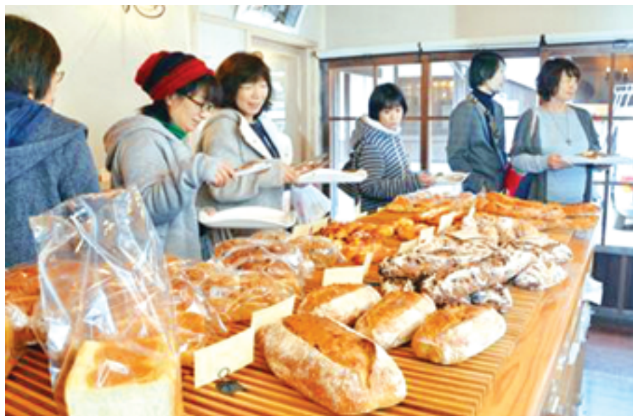
The inside of German bakery Hidaka in Oda, Shimane Prefecture, crowded with shoppers from within and outside the prefecture in December 2015.

MATSUE — An authentic German-style bakery near the UNESCO World Heritage-listed Iwami Ginzan silver mine in Oda, Shimane Prefecture, is drawing customers from far afield and helping keep alive a small town.