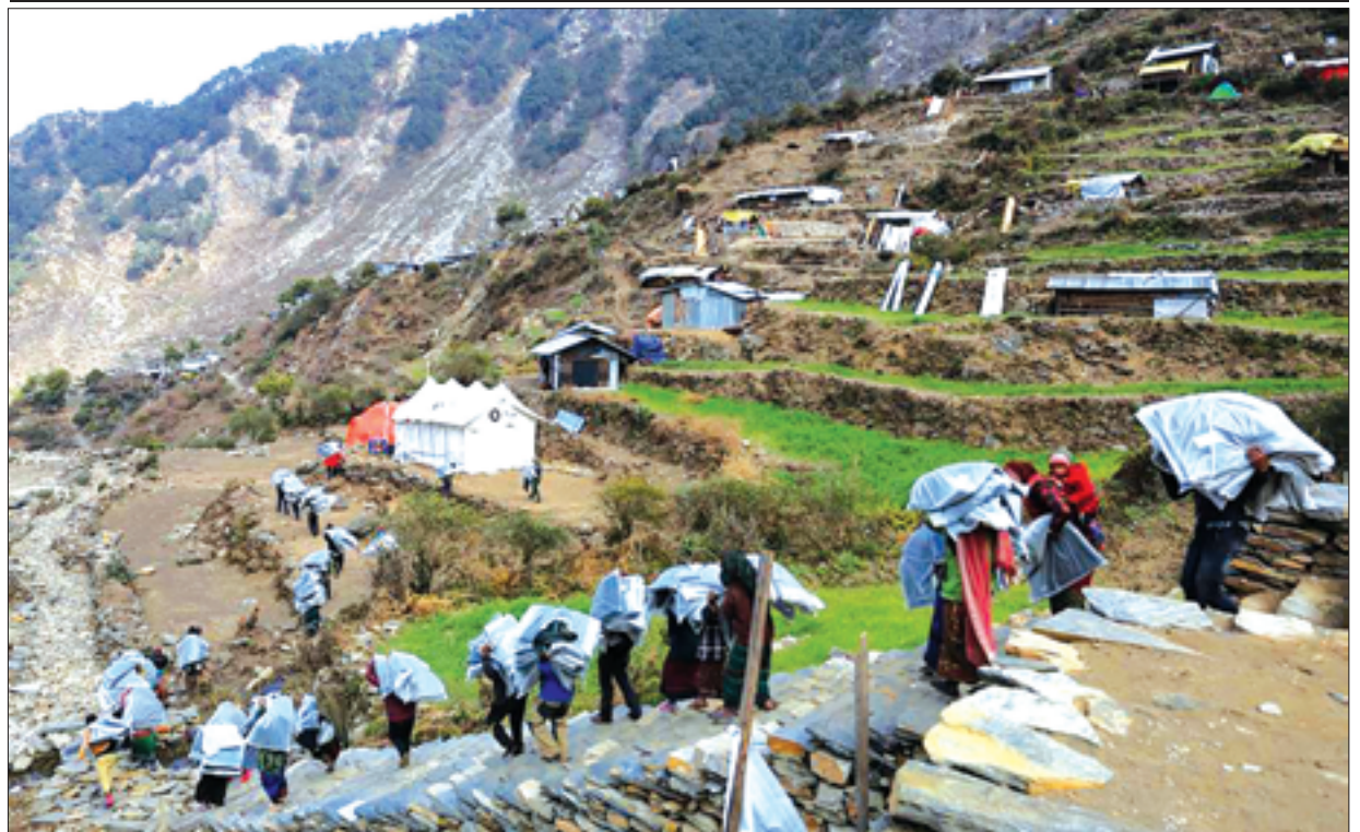
Earthquake victims return back after receiving blankets distributed by Nepal Army at Kerauja, one of the worst quake-hit villages in Gorkha, Nepal, on 13 January 2016. Nepal Army distributed blankets to earthquake victims residing in those shelters. Earthquake victims in Gorkha District are in difficulties due to heavy snowfalls in recent days amid harsh winter.