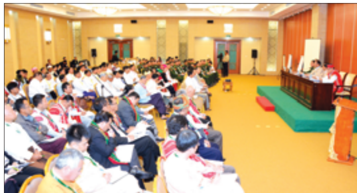
Representatives discuss economic issue.

The third day of the Union Peace Conference concluded following a recording of the day's events. — Myanmar News Agency