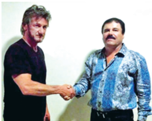
Actor Sean Penn (L) shakes hands with Mexican drug lord Joaquin "Chapo" Guzman in Mexico on 10 January.

Mexico's government says it plans to extradite Guzman to the United States, where he is wanted on charges including drug trafficking, kidnapping and murder.