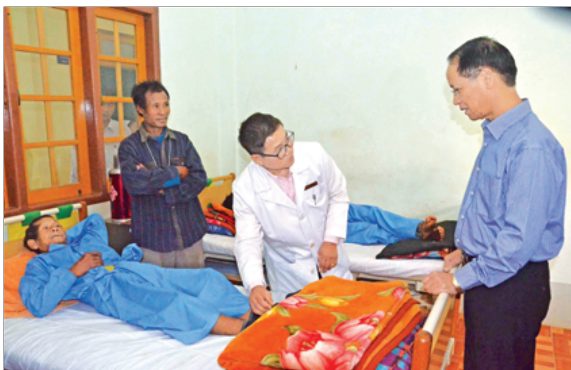
Vice President Dr Sai Mauk Kham inspects health care treatment at 500-bed People's Hospital in Loikaw.

Highlighting the role of teachers in the education sector, he said that it is essential for the country's education system to be of good quality so that the quality of the education system improves, thereby contributing towards national development. — Myanmar News Agency