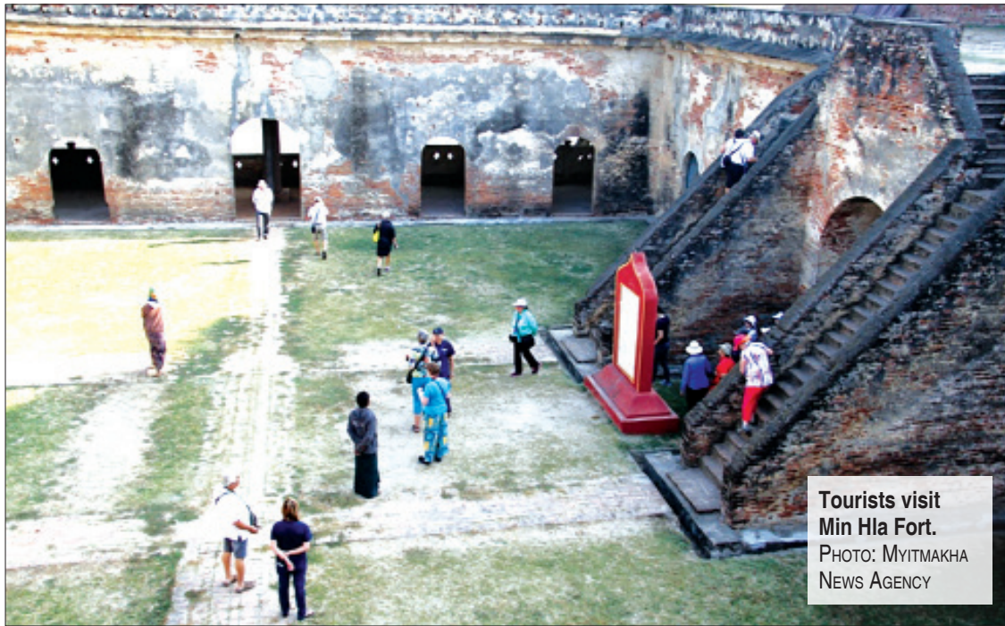
Tourists visit Min Hla Fort.

OVER 3,200 foreign tourists visited the ancient fort of Min Hla, located along a stretch of the Irrawaddy river in Magway Region, by boat during 2015, according to the Department of Ancient Research at the town of Min Hla.