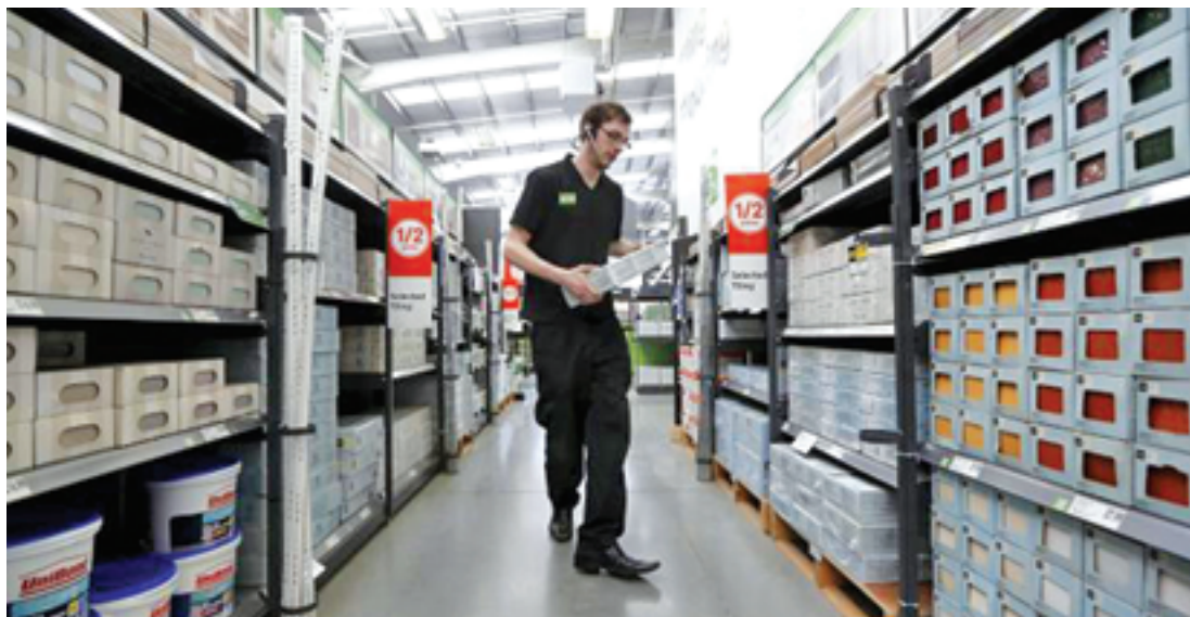
A sales assistant carries tiles at a Homebase store in Aylesford, England in 2013.

LONDON — British takeover target Home Retail (HOME.L) said on Wednesday it was in advanced talks to sell its Homebase home improvement stores to Australia's Wesfarmers (WES.AX) for 340 million pounds in cash, allowing it to focus on its Argos chain.