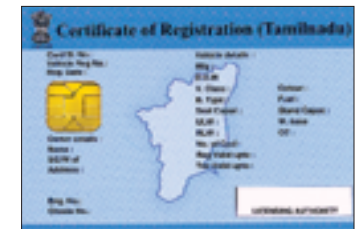
A smart card with Demerit Points System from Indian transport department.

Those who exceed the limit for demerit points will be required to reapply for licences. —Thant Zin Win