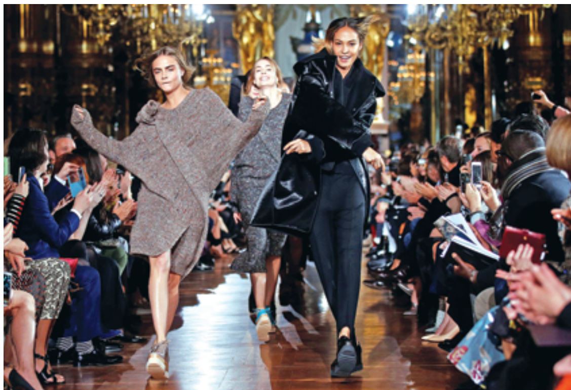
Cara Delevingne and Joan Smalls present creations by British designer Stella McCartney as part of her Autumn/Winter 2014-2015 women's ready-to-wear collection show during Paris Fashion Week.

The show drew big names like Gwyneth Paltrow, Kate Hud-