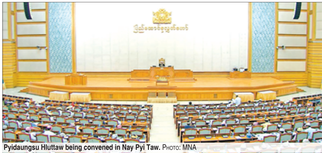
Pyidaungsu Hluttaw being convened in Nay Pyi Taw.

THE 13 th regular session of the first Pyidaungsu Hluttaw held its 30 th meeting yesterday, seeking parliamentary approval for two bills and debating one draft law.