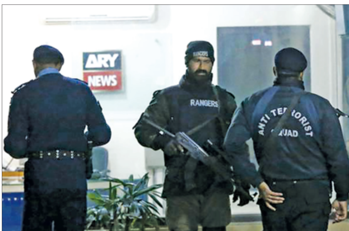
Paramilitary soldiers stand guard at the ARY News offices after a blast injured several people and caused property damage in Islamabad, Pakistan on 13 January, 2016.

The pamphlets left behind said "Islamic State Khorasan Province" claimed responsibility for attacking media that it accused of "siding with the apostate army and government of Pakistan in their global crusade against Islam".