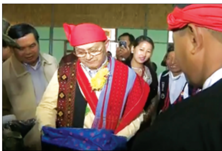
President U Thein Sein in Naga traditional dress accepts gifts from Naga ethnic people.

After hearing reports on work progress at Chindwin hall, the President gave a speech on the opening of Arts and Science colleges, vocational training schools and the extended cultivation of rubber and tea plantations in Homalin.