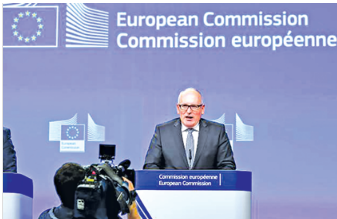
European Commission First Vice-President Frans Timmermans gives a news conference at the European Commission headquarters in Brussels, Belgium, on 13 January.

BRUSSELS — The European Union began an unprecedented inquiry on Wednesday into whether Poland's new conservative, Eurosceptic government has breached the EU's democratic standards by taking more control of the judiciary and public media.