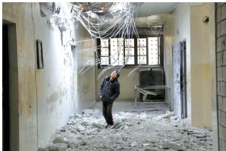
A boy inspects damage inside his school, due to what activists said was an air strike carried out yesterday by the Russian air force in Injara town, Aleppo countryside, Syria, on 12 January.

GENEVA — The United Nations Special Envoy for Syria said after meeting representatives of the United States, Russia and other major powers on Wednesday that Syria peace talks were still planned to start in Geneva on 25 January.