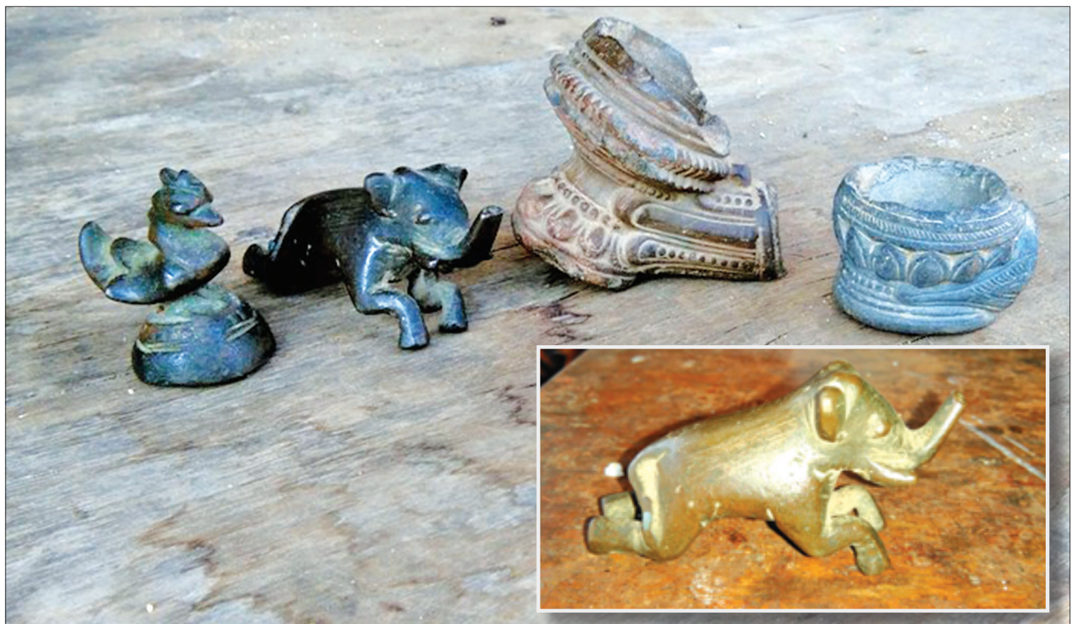
Artifacts believed to date back to Pyu era were discovered in Hpo Lay Lone village in Magway township.

Local residents reportedly believed the existence of the brick wall to be merely rumour, letting it go unrec-