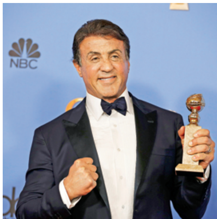
Sylvester Stallone.

"I didn't expect to be there; the last time I was there was maybe 1977, there was maybe 10 tables and it was indoors, it wasn't televised — it was surreal for me — here is my wife my three kids — and Rocky, he just comes through."—Reuters