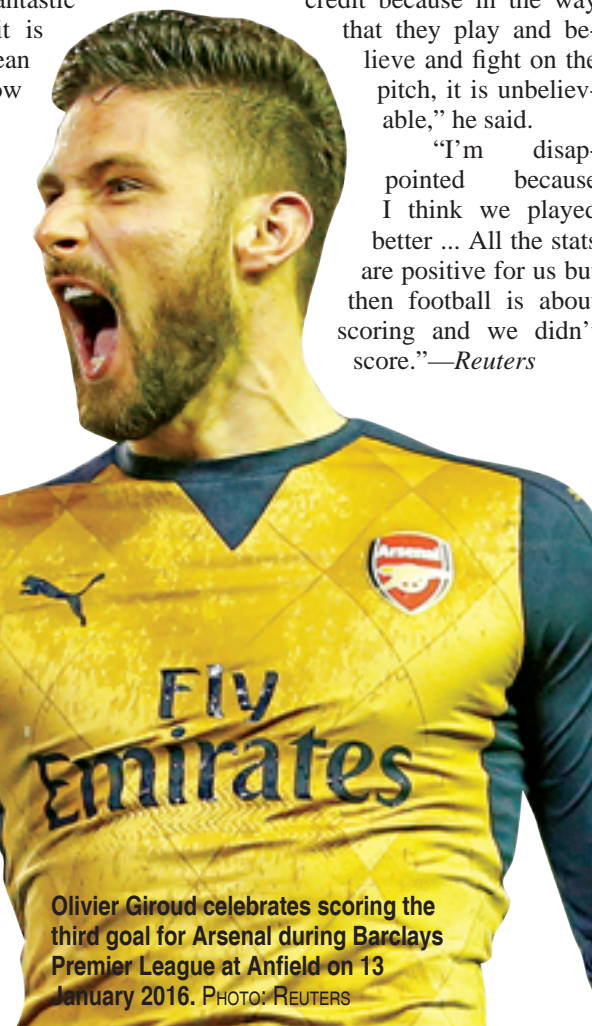
Olivier Giroud celebrates scoring the third goal for Arsenal during Barclays Premier League at Anfield on 13 January 2016.