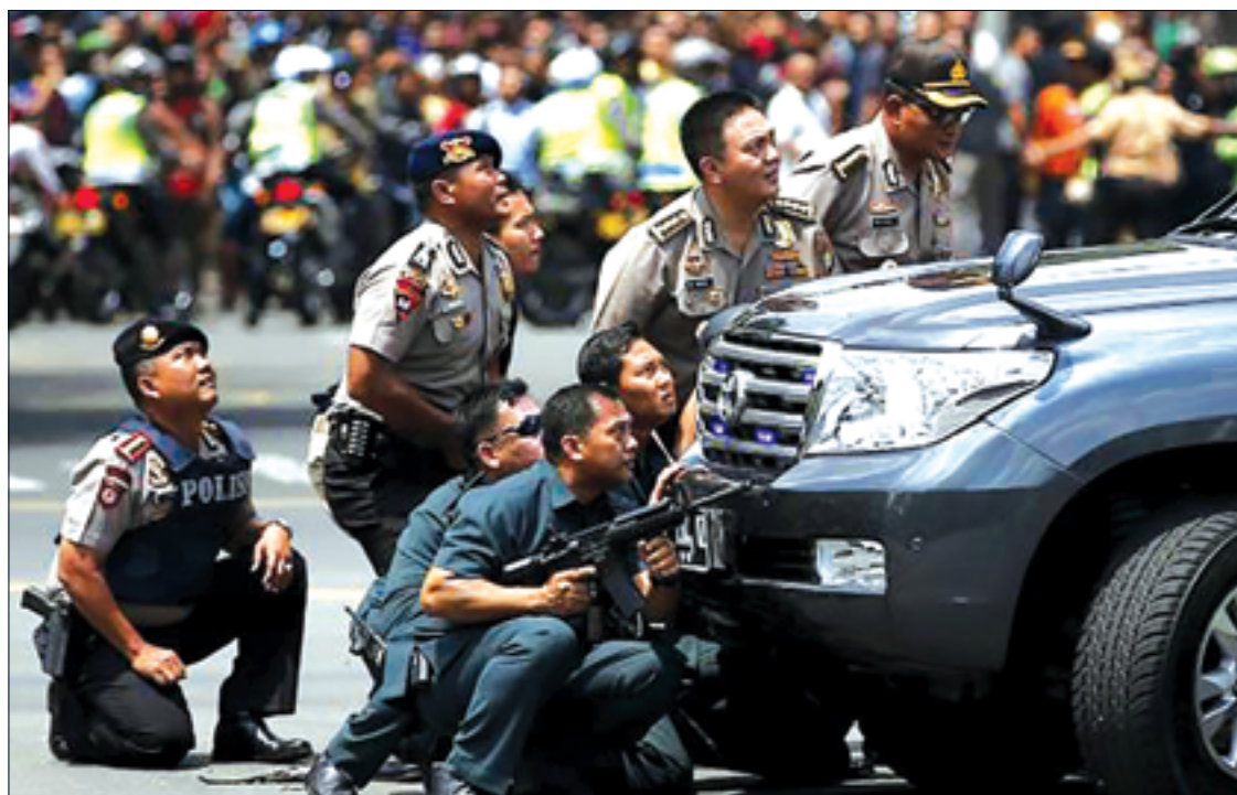
Police officers react near the site of a blast in Jakarta, Indonesia, on 14 January.

"Islamic State fighters carried out an armed attack this morning targeting foreign nationals and the security forces charged with protecting them in the Indonesian capital," Aamaaq news agency, which is allied to the group, said on its Telegram channel. Jakarta's police chief told reporters: "ISIS is behind