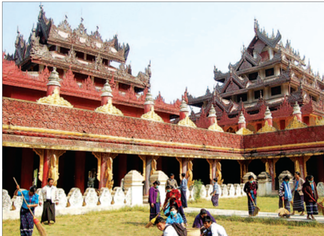
People are volunterring for cleanliness in the compound of Bagaya Monastery.

BAGAYA Monastery, the popular and highly revered site of traditional culture, which is seen as a symbol of the country, has had its preservation ensured by the Ministry of Culture from fading or the loss of its physical details.