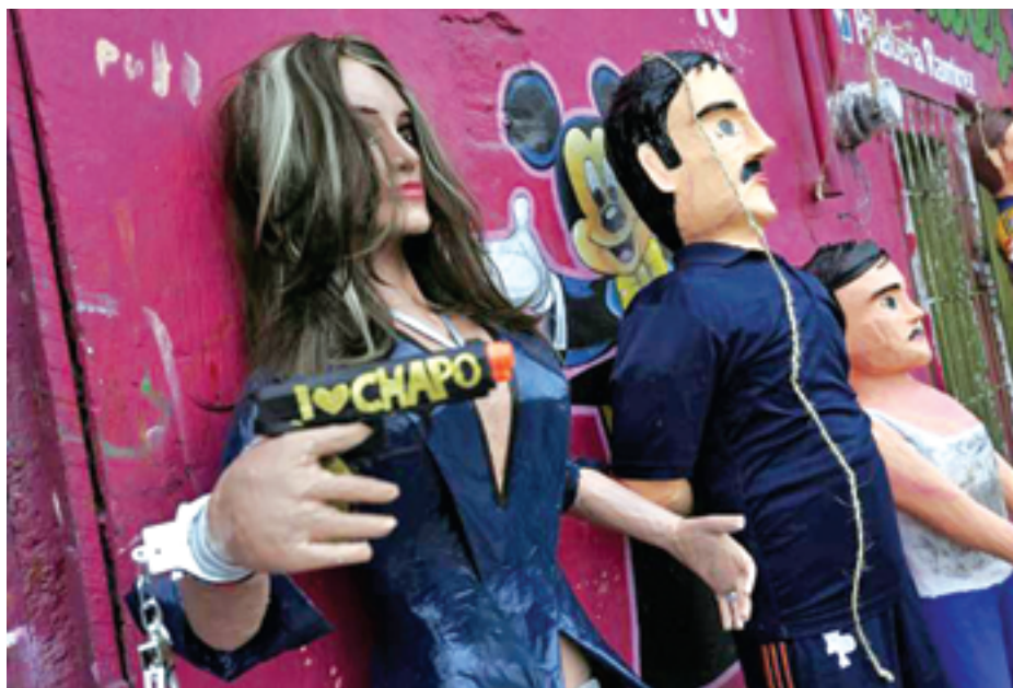
Pinatas depicting Mexican actress Kate del Castillo (L) and the drug lord Joaquin 'El Chapo' Guzman are displayed outside a workshop in Reynosa, in Tamaulipas state, Mexico, on 13 January.

MEXICO CITY — Details of flirtatious phone messaging chats between Mexican drug lord Joaquin "El Chapo" Guzman and actress Kate del Castillo have gripped Mexico, and an official said his "obsession" with her led him to lower his guard and be caught.