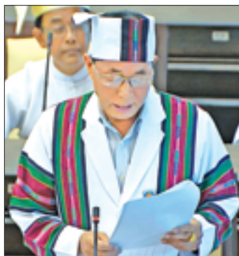
U Kyun Khan, MP from Chin State.