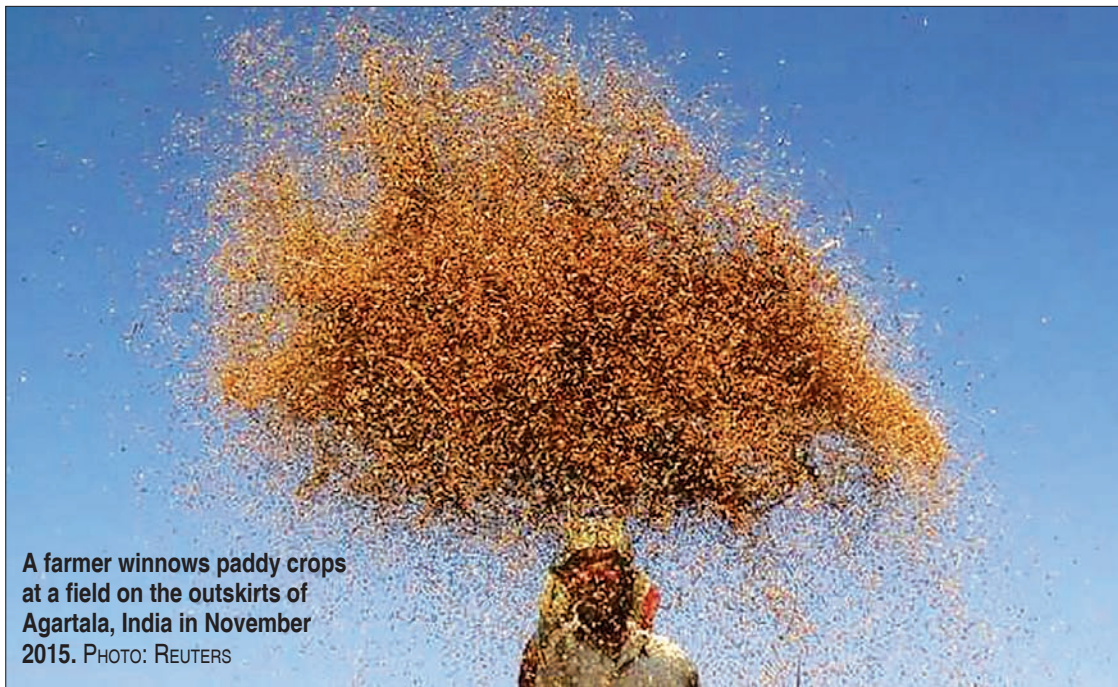
A farmer winnows paddy crops at a field on the outskirts of Agartala, India in November 2015.

Agriculture Minister Radha Mohan Singh said last week that New Delhi will launch the crop insurance scheme in the fiscal year starting 1 April.— Reuters