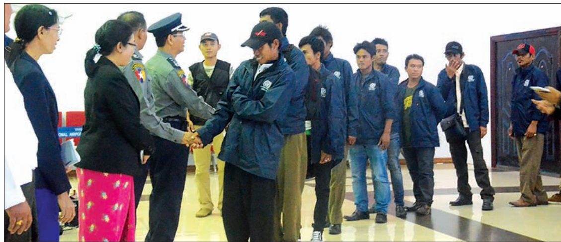
Fishermen are being welcomed by authorities on their arrival at Yangon International Airport.