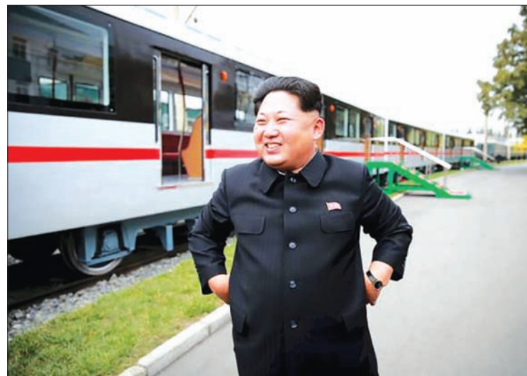
North Korean leader Kim Jong Un.

On Tuesday, the US House of Representatives voted nearly unanimously to pass legislation that would broaden sanctions over North Korea's nuclear programme.