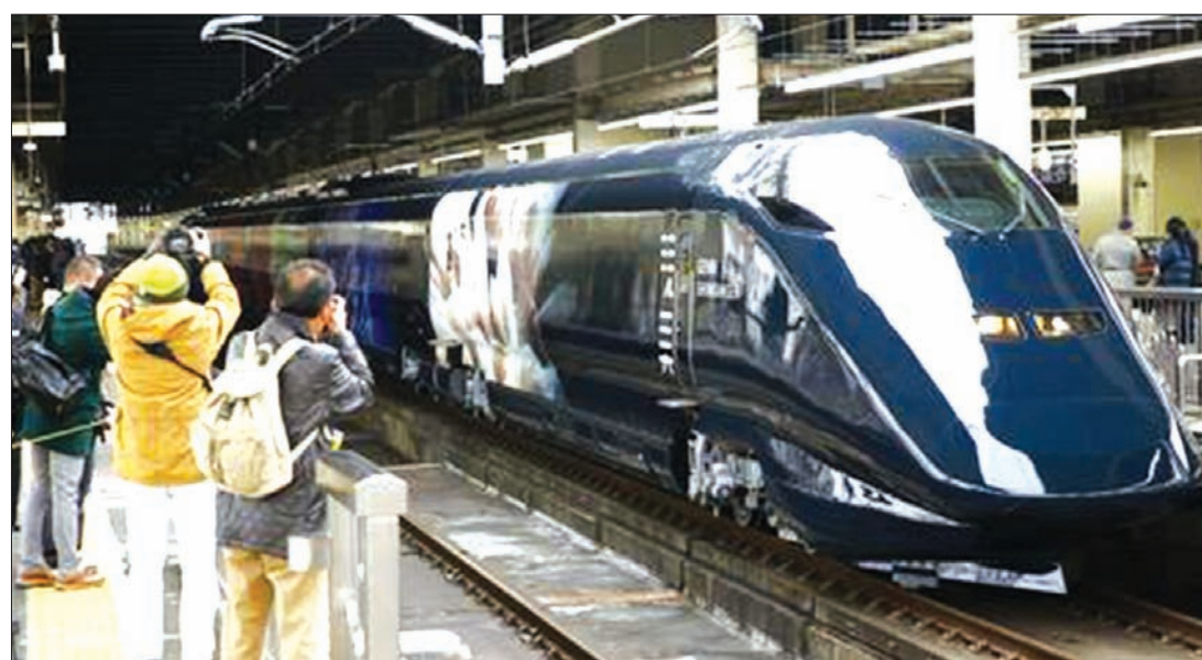
The Genbi Shinkansen, a six-car bullet train adorned with images of fireworks taken by renowned Japanese photographer Mika Ninagawa, is unveiled at JR Omiya Station, north of Tokyo, on 12 January 2016. East Japan Railway Co. will run the train, which displays modern art inside, between Echigo-Yuzawa and Niigata stations on the Joetsu Shinkansen Line mainly on the weekends and holidays from this spring.