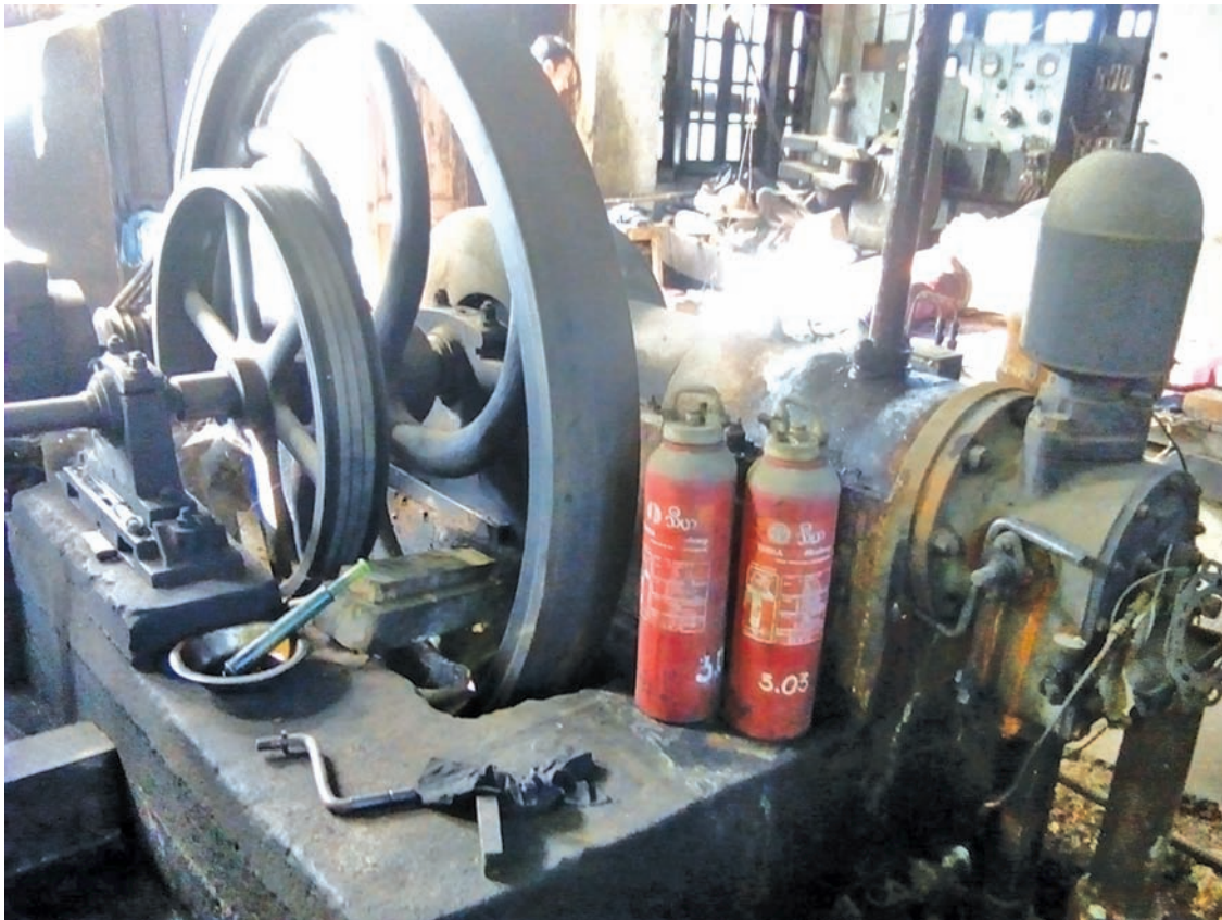
130-year-old generator.

SITUATED beside Sawhmaw Creek, Nabar Village in Katha District could become a popular tourist attraction if the 130-year-old generator in the town can be showcased for public observation, residents have said.