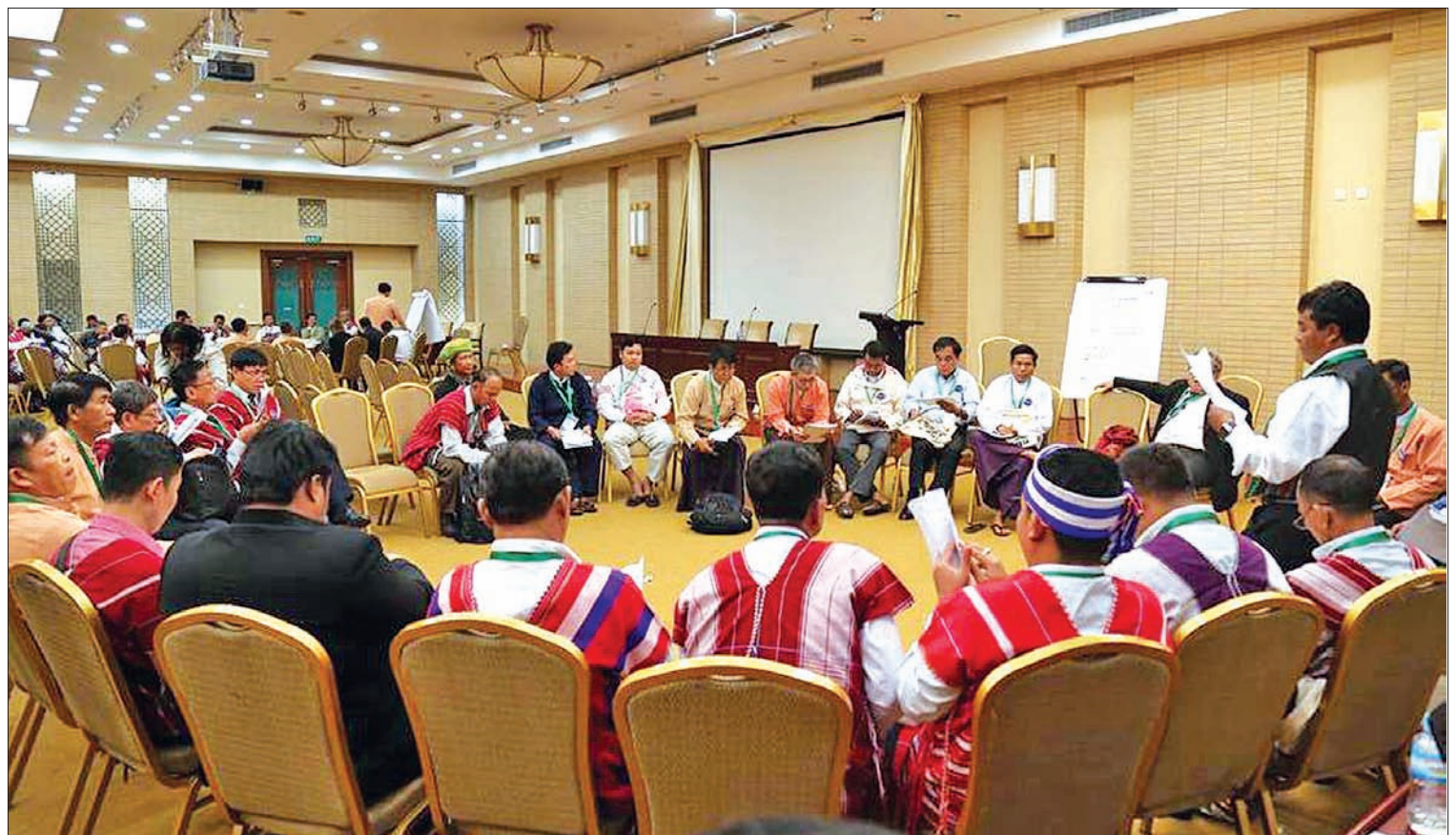
Roundtable discussion of the stakeholder group of ethnic armed organisations is seen at the country's first political dialogue in Nay Pyi Taw yesterday.