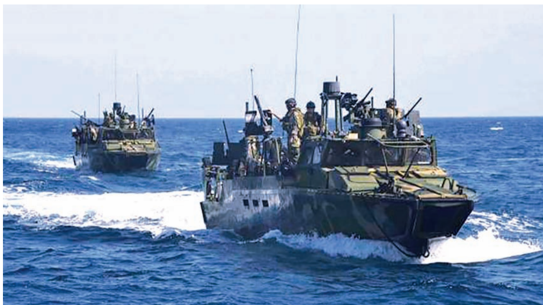
Riverine command boats assigned to Coastal Riverine Squadron (RIVRON) 4, transit open water in the 5 th fleet area of responsibilities in this June 27, 2013 handout photo provided by the US Navy, on 12 January 2016. PHOTO: REUTERS

On each occasion the sailors were released unharmed after several days.— Reuters