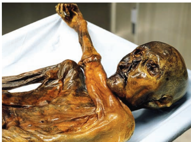
Iceman, the mummy that was found perfectly preserved in a Tyrolean glacier, is seen at the European Academy (Eurac) in Bolzano, northern Italy, on 4 December 2015.

pure strain, an unmixed strain yet and we can say that the history of Helicobacter population genetics in Europe is different from previously thought,” said