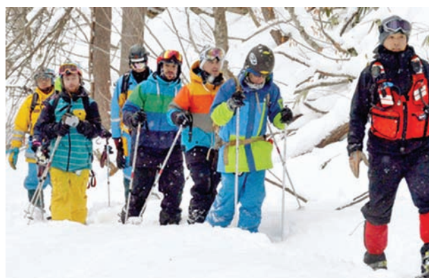
Australian skiers (back) are escorted down Mt. Nekomagata by police in Fukushima Prefecture, northeastern Japan, at 7:17am on 13 January 2016 after going missing the previous day while back-country skiing. Six Australians —four men and two women — were found around 10:30pm after going missing on the 1,404-metre mountain.

their children as of November last year. The tendency for children to be put to bed later was greater among mothers aged 40 or older or less than 20, with University of Yamanashi that analysed the results saying the higher figure for the older parent group may be due to the presence of older children. —Kyodo News