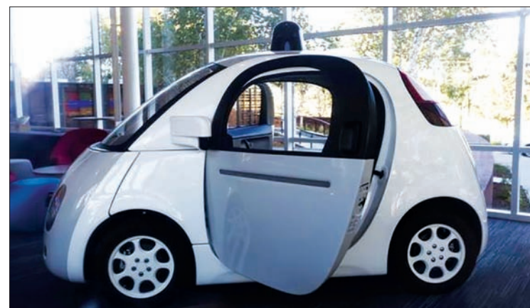
A Google self-driving car is seen inside a lobby at the Google headquarters in Mountain View, California on 13 November 2015.

Most automakers, including General Motors Co, Tesla Motors Inc, Daimler AG, and Nissan Motor Co, are pushing to get cars on the road that allow hands-free driving under certain conditions, but require the driver to take over in more complex situations such as city driving.— Reuters