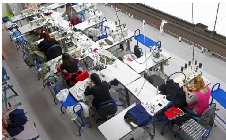
Women work on sewing machines at the Fashion Enter factory in London, England, on 8 January 2016.

"This ... report is the straw that breaks the camel's back," J.P. Morgan economist Malcolm Barr said. "Recent disappointment in the pay data and the drop in oil prices had already put our call for the MPC to raise rates in May at risk."