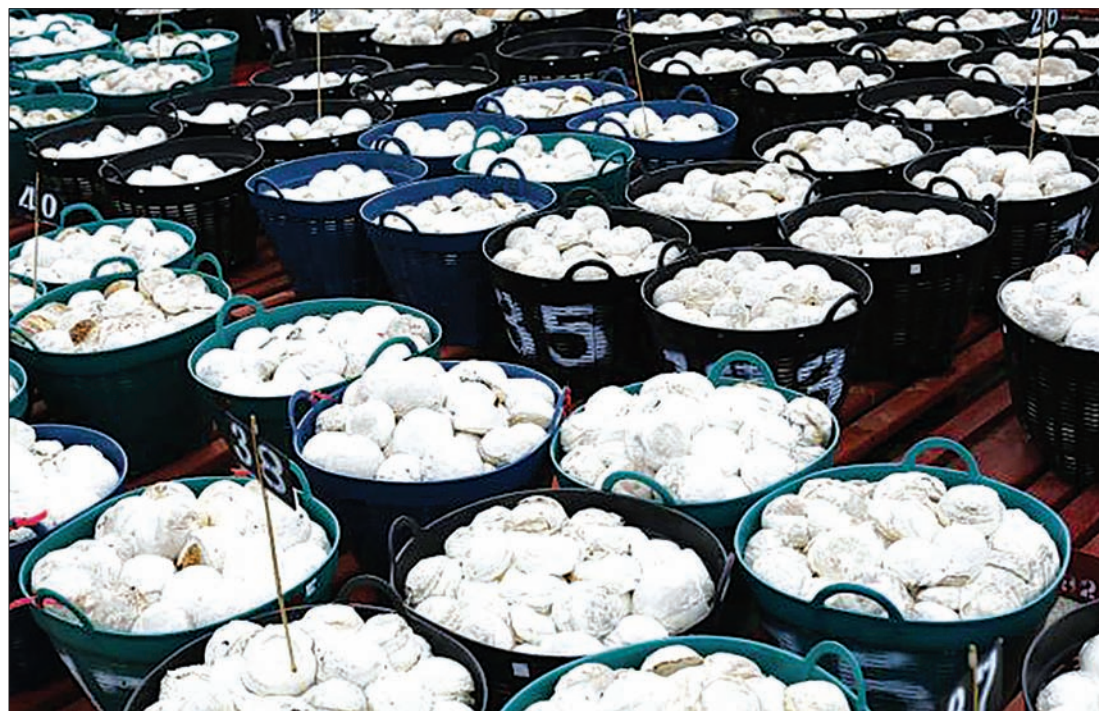
Baskets filled with rubber are seen at the central rubber market in Nong Khai, Thailand, in September 2015.

BANGKOK — Steps announced this week by Thailand’s ruling junta to help rubber producers grappling with plunging prices do not go far enough, some farmers said yesterday.