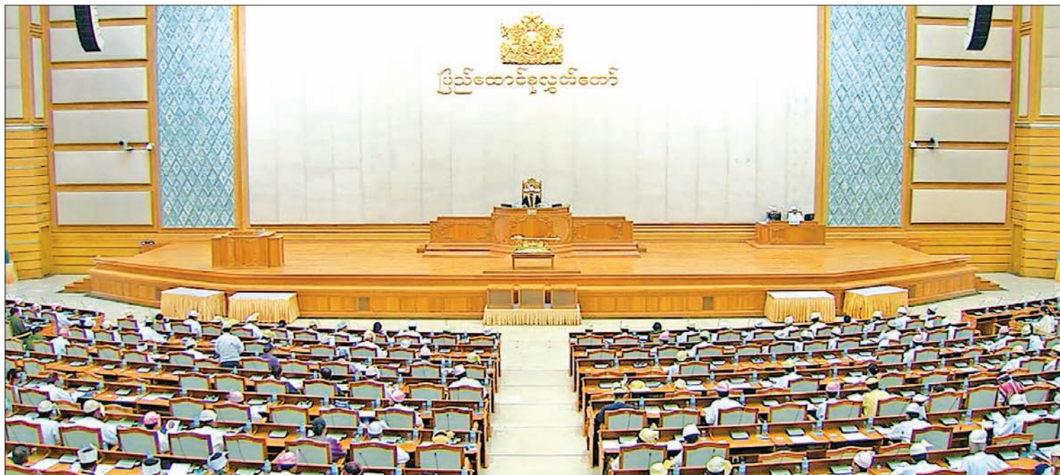
Pyidaungsu Hluttaw being convened in Nay Pyi Taw.