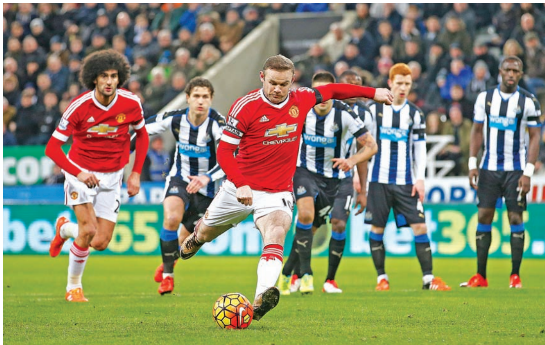
Wayne Rooney scores the first goal for Manchester United from the penalty spot during their Barclays Premier League at St James' Park on 12 January.

The home team had appeared to be in for another 90 minutes of struggle when Palace's Wilfried Zaha struck Villa's post inside