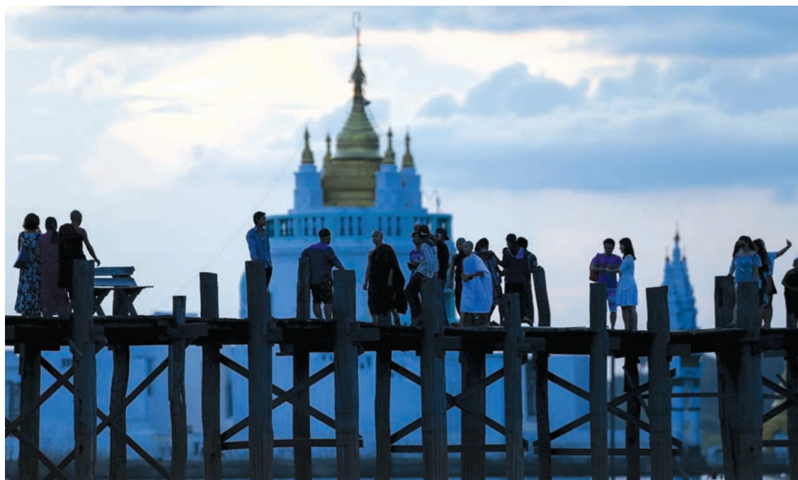
U Pein bridge

Myanmar's construction engineers used traditional methods of scaling and measuring to accomplish their work. The joints were intertwined and the teak posts supporting the whole Bridge were hammered into the lake bed seven feet deep. At the foot of each post were two props affixed into it. The top of each post was curved conical to let rain water stream down easily. Originally, there were 984 teak posts supporting the Bridge. There were two wide verandas, right and left on the Bridge, and the floor has three layers of teak planks. Later, the two approach brick bridges, each on one end of