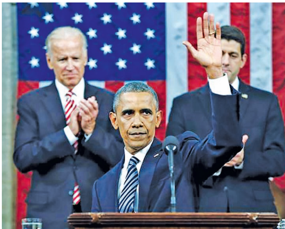
US President Barack Obama waves at the conclusion of his final State of the Union address to a joint session of Congress in Washington on 12 January.

president’s strategy to defeat Islamic State is flawed and insufficient.