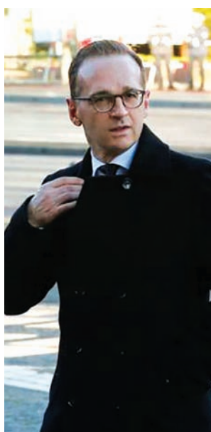
German Justice Minister Heiko Maas.

More than 600 women have complained of being attacked on New Years Eve