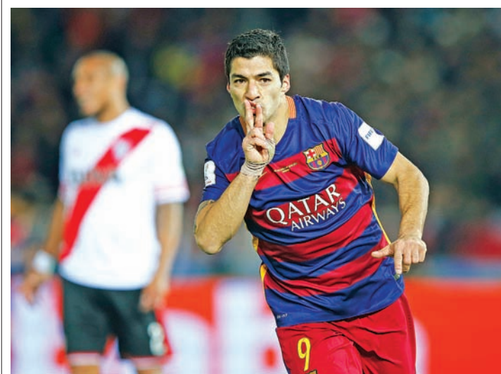
FC Barcelona's Luis Suarez.

MADRID — Barcelona's appeal against Luis Suarez's two-match King's Cup ban for allegedly provoking a fracas in the tunnel after last week's game against Espanyol has been rejected, the Spanish football federation (RFEF) said.