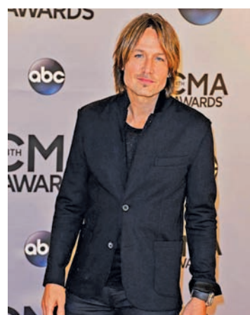
Keith Urban.

“I want to bring in some other elements to the show mu-