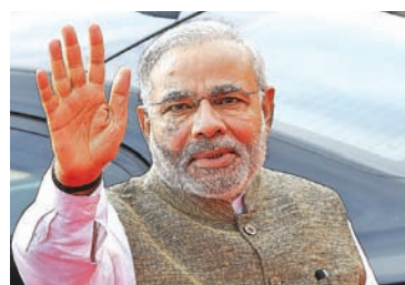
Indian Prime Minister Narendra Modi.

However, some new faces may be inducted into the Cabinet and some non-performing ministers are likely to be dropped given Modi is looking to firm up delivery on the governance front,