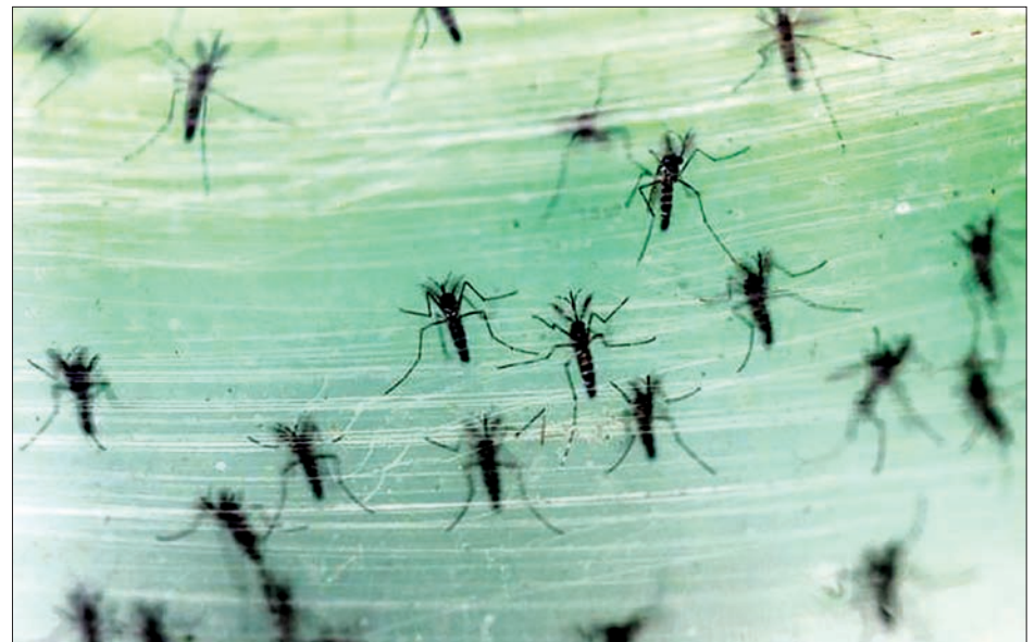
Male Aedes albopictus mosquitoes are seen in this picture. Zika virus is among the viruses spread by the species. PHOTO: REUTERS

Zika is usually a mild illness with fever, rash and joint pain. There is no preventive vaccine, according to the CDC.—Reuters