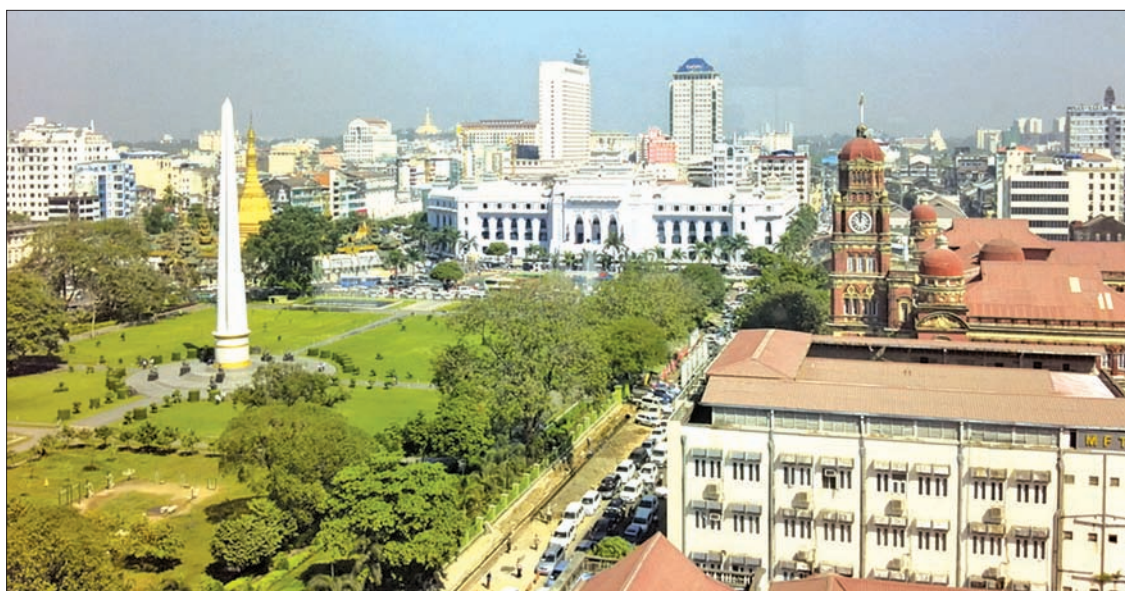
The prices of rooms, houses, land and apartments have risen with booming of property market.

FOREIGN investors have shown more interest in commercial spaces in downtown Yangon after the election period in November, said U Aung Ko Ko, manager of House.com.mm, an online marketplace for property listings in Myanmar.