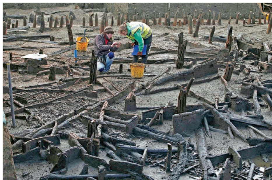
Archaeologists from the University of Cambridge Archaeological Unit, uncover Bronze Age wooden houses, preserved in silt, from a quarry near Peterborough, Britain, on 12 January 2016.

"This time so much more has been preserved — we can actually see everyday life during the Bronze Age in the round," he said. "It's prehistoric archaeology in 3D with an unsurpassed finds assemblage in terms of range and quantity." —Reuters