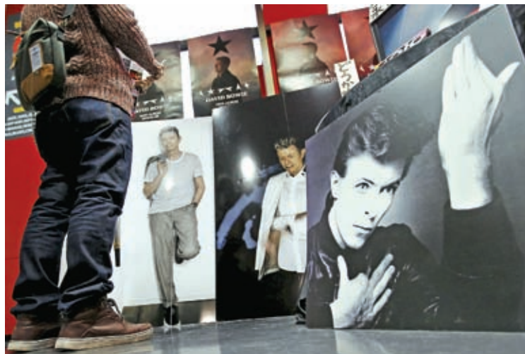
A Japanese fan takes a photo of portraits of British rock star David Bowie at a music retailer in Tokyo, Japan on 12 January.