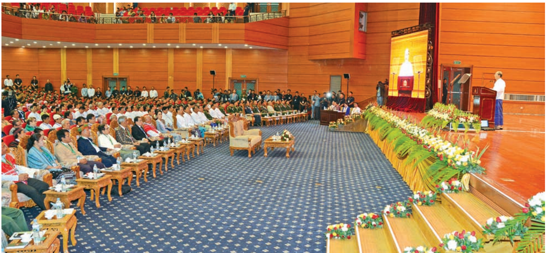
President U Thein Sein delivers speech at the opening of the Union Peace Conference in Nay Pyi Taw.

THE Union Peace Conference, the very first inclusive political dialogue, kicked off at the Myanmar International Convention Centre-2 in Nay Pyi Taw yesterday with the attendance of representatives from the government, parliament, the Tatmadaw, armed groups and political parties.