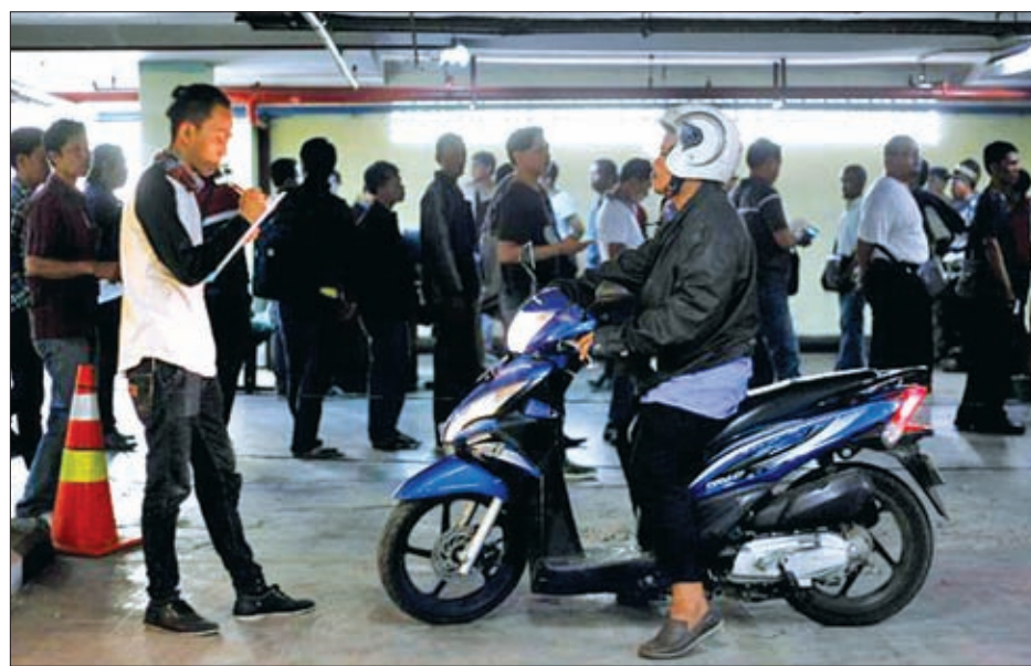
A motorcycle-taxi driver candidate sits on his motorcycle during a test at a basement car park in Jakarta, on 9 January.

When the company launches in a month or two with some 3,000 drivers, customers will be able to