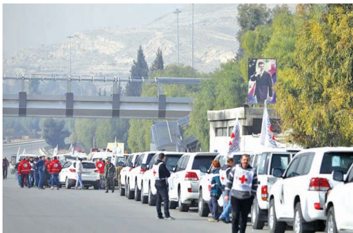
A convoy consisting of Red Cross, Red Crescent and United Nations (UN) gather before heading towards to Madaya from Damascus, and to al Foua and Kefraya in Idlib Province, Syria, on 11 January.

Madaya is besieged by pro-Syrian government forces, while the two villages in Idlib Province are encircled by rebels