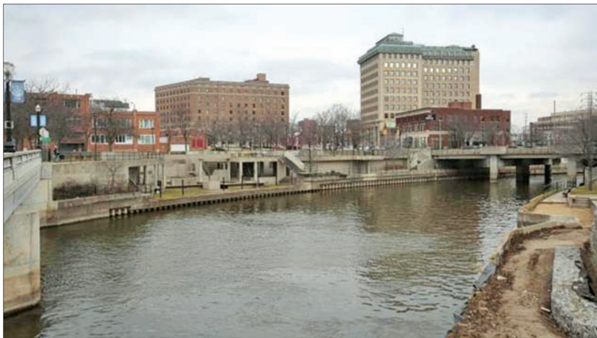
The Flint River is seen flowing through downtown Flint, Michigan, in 2015.

Flint residents have filed a federal lawsuit accusing the city and state of endangering their health.—Reuters