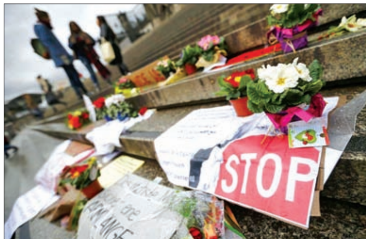
Flowers and posters are placed in the square between the city cathedral and the railway station in Cologne, Germany, on 11 January 2016, where the vast majority of dozens of New Year Eve assaults on women took place.

BERLIN — German Chancellor Angela Merkel faced growing pressure to harden her line on refugees on Monday as the first extensive police report on New Year's Eve violence in Cologne documented rampant sexual assaults on women by gangs of young migrant men.