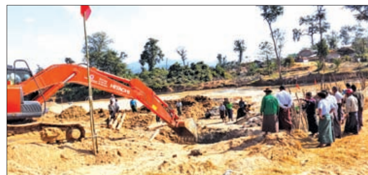
Workers are carrying out earth work near a new bridge construction.

After finishing the project, the bridge will link Banmouk, Homalin and Pinlebu townships providing access to public transportation.