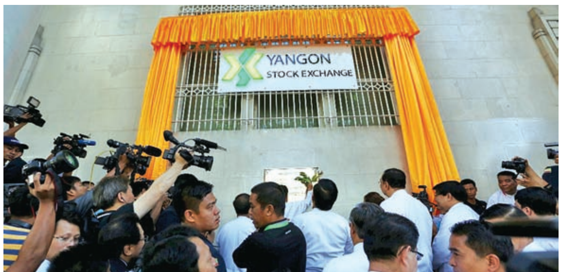
Journalists gather outside the Yangon Stock Exchange centre on 9 December 2015.

Trading is expected to begin by March at the latest.—MNA