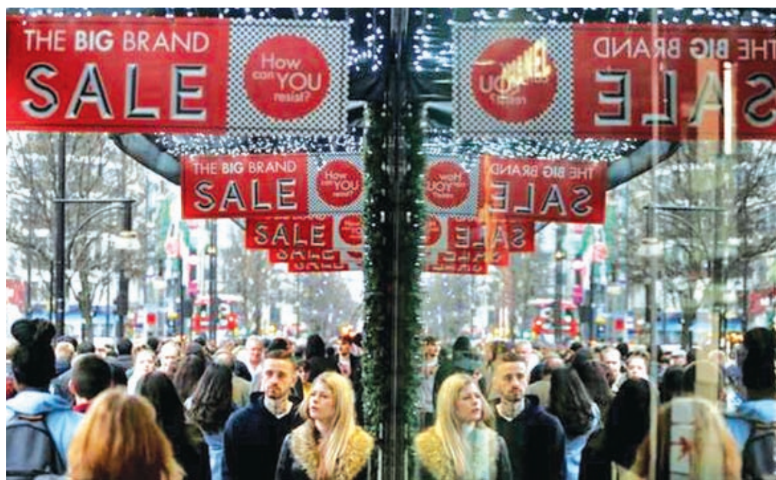
Shoppers are reflected in a store window as they pass sales advertisements on Oxford Street in London, Britain in December 2015.

Although Britain's economy probably ended last year as one of the fastest-growing in the developed world for a second year in a row, there are concerns that the