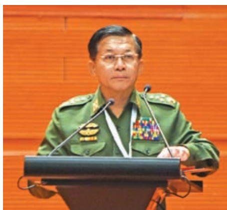
Senior General Min Aung Hlaing.