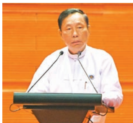
Thura U Shwe Mann.