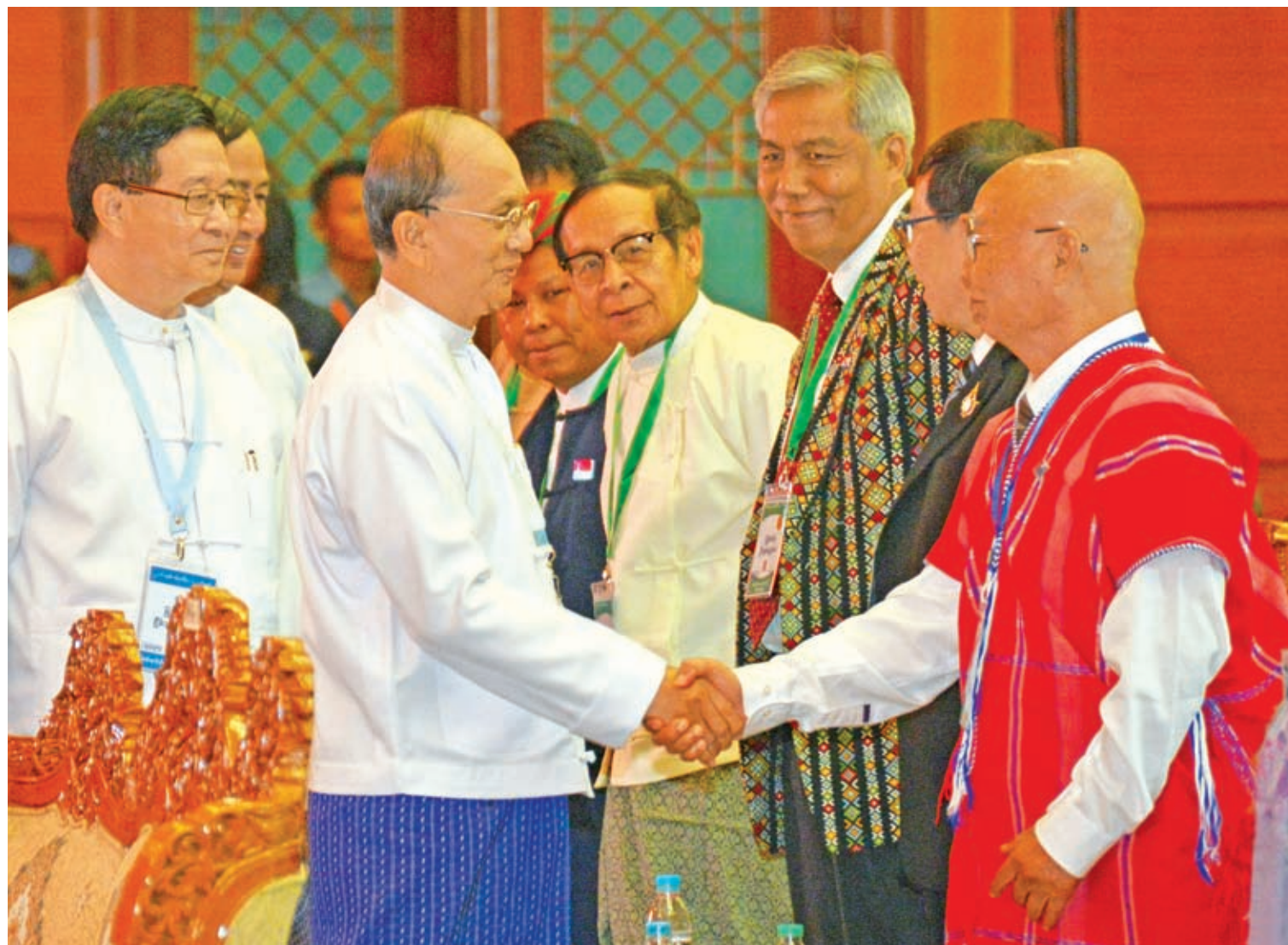
President U Thein Sein shakes hands with Saw Mutu Say Poe, Chairman of the Karen National Union, at Union Peace Conference.

The following are the excerpts from the speech delivered by President U Thein Sein at the opening of the Union Peace Conference, held at MICC-2 in Nay Pyi Taw yesterday.