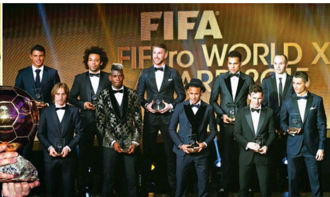
Winners of the FIFA/FIFPro World XI 2015 pose with their trophies during the FIFA Ballon d'Or 2015 soccer awards ceremony in Zurich, Switzerland, on 11 January 2016.

"I'm a big enemy of the Ballon d'Or. Who will win it? You know as well as I do that it's certainly Messi who will win it. I think so. Overall I'm not a big fan of that," the Frenchman said earlier on Monday.