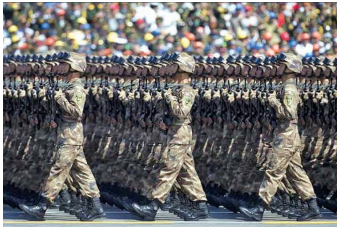
Chinese soldiers march during a military parade to commemorate the 70 th anniversary of the end of World War II in Beijing in 2015.

BEIJING — China’s military has set up 15 new units — covering everything from logistics to equipment development, political work and fighting corruption — as part of an on-going drive to modernise the world’s largest armed forces, the Defence Ministry said.