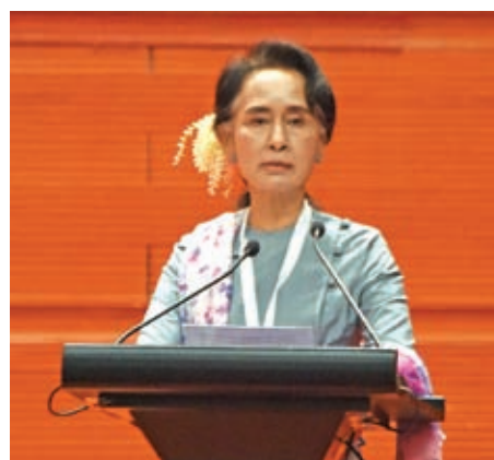
Daw Aung San Suu Kyi.