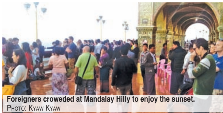
Foreigners crowded at Mandalay Hilly to enjoy the sunset.