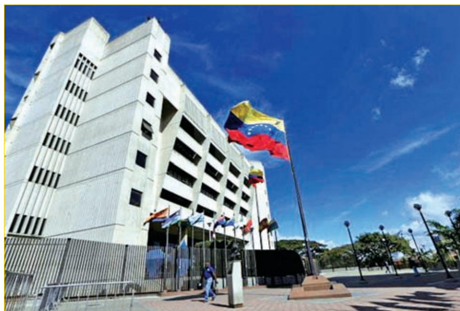
A man walks in front of a building of the Venezuela Supreme Court in Caracas in 2015.