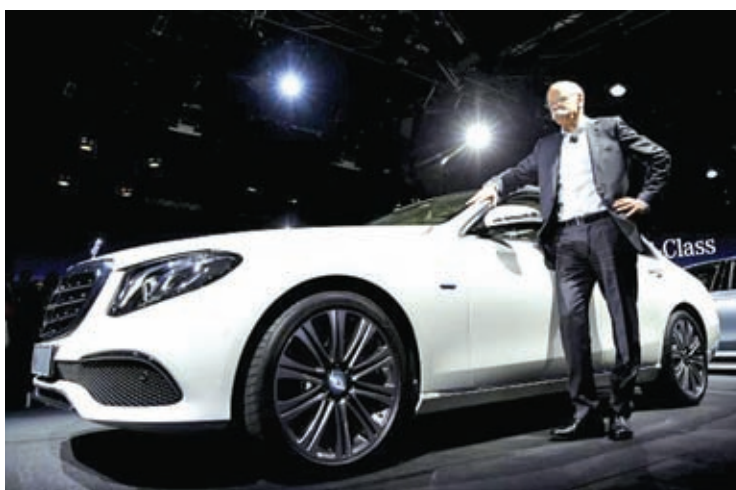
Dr Dieter Zetsche, Mercedes-Benz Chairman of the Board of Management, attends the Mercedes-Benz new E-Class introduction prior to the opening of the North American International Auto Show in Detroit on 10 January.

date of the new E-Class was better timed to take advantage of improvements in computing and sensor technology, as well as regulatory changes needed to make autonomous and semi-autonomous driving a reality.