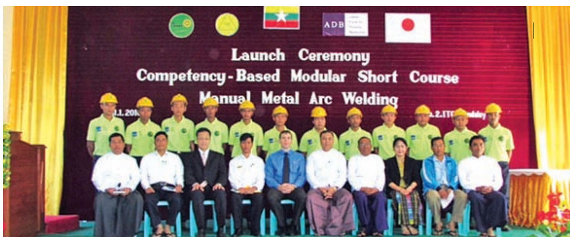
Trainees of Manual Metal Arc Welding course pose for photo with officials at launch ceremony.