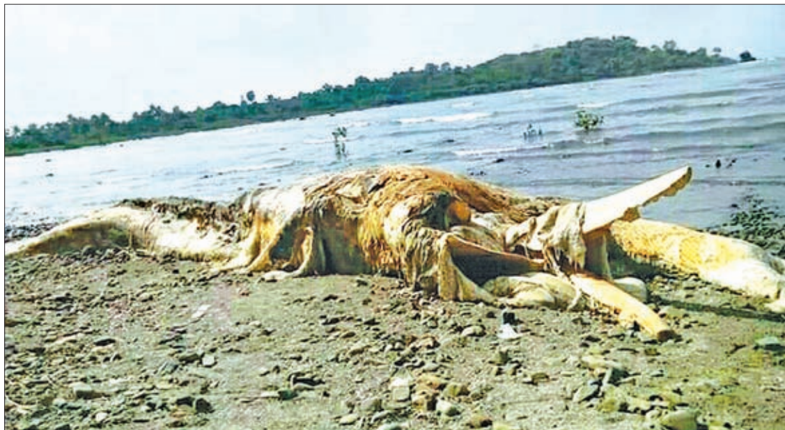
A giant dead fish is stranded on the beach in Gwa.

A GIANT dead fish was found on the sands of the Launkyo Village beach in Gwa Township, Thandwe District, Rakhine State on Sunday.