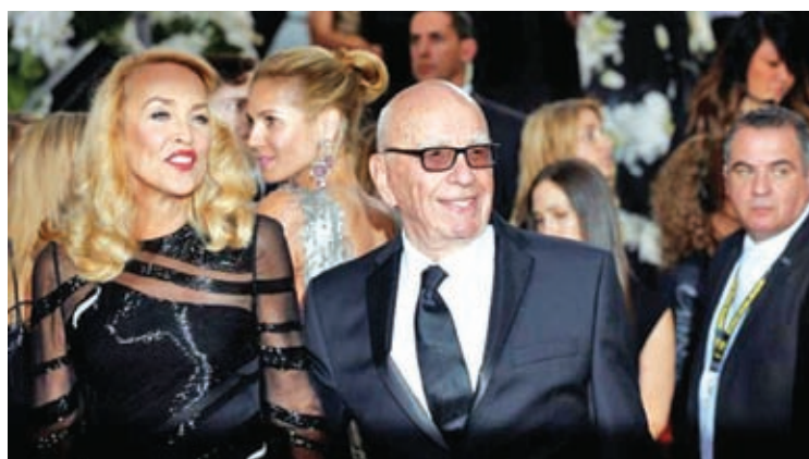
Model Jerry Hall and media magnate Rupert Murdoch arrive at the 73rd Golden Globe Awards in Beverly Hills, California on 10 January.

and actress, was married to The Rolling Stones frontman Mick Jagger for more than 20 years, although in divorce proceedings, Jagger claimed that they were never legally married.