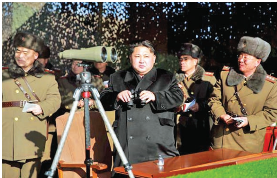
North Korean leader Kim Jong Un watches a firing contest of the KPA artillery units at undisclosed location in this photo released by North Korea's Korean Central News Agency (KCNA) in Pyongyang on 5 January.

The CNS analysis shows two frames of video from state media where flames engulf the missile and small parts of its body break away. "North Korea used heavy video editing to cover over this fact," Hanham said in an email. "They used different camera angles and editing to