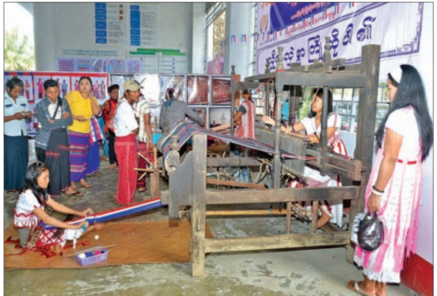
Kayin women demonstrate traditional weaving of clothes at National Races Village in Yangon.