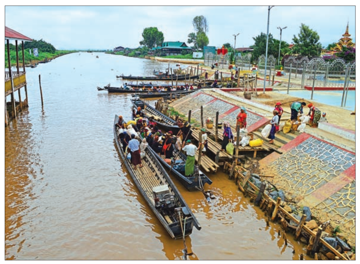
Pilgrims arrive PhaungdawOo Pagoda by boat in Inle Lake.

Visitors are flowing into the lake these days and all water ways are navigable despite the water level decrease a bit, said Ko Aung Moe Win, the motor boat driver. —Nay Myo Thu Rein