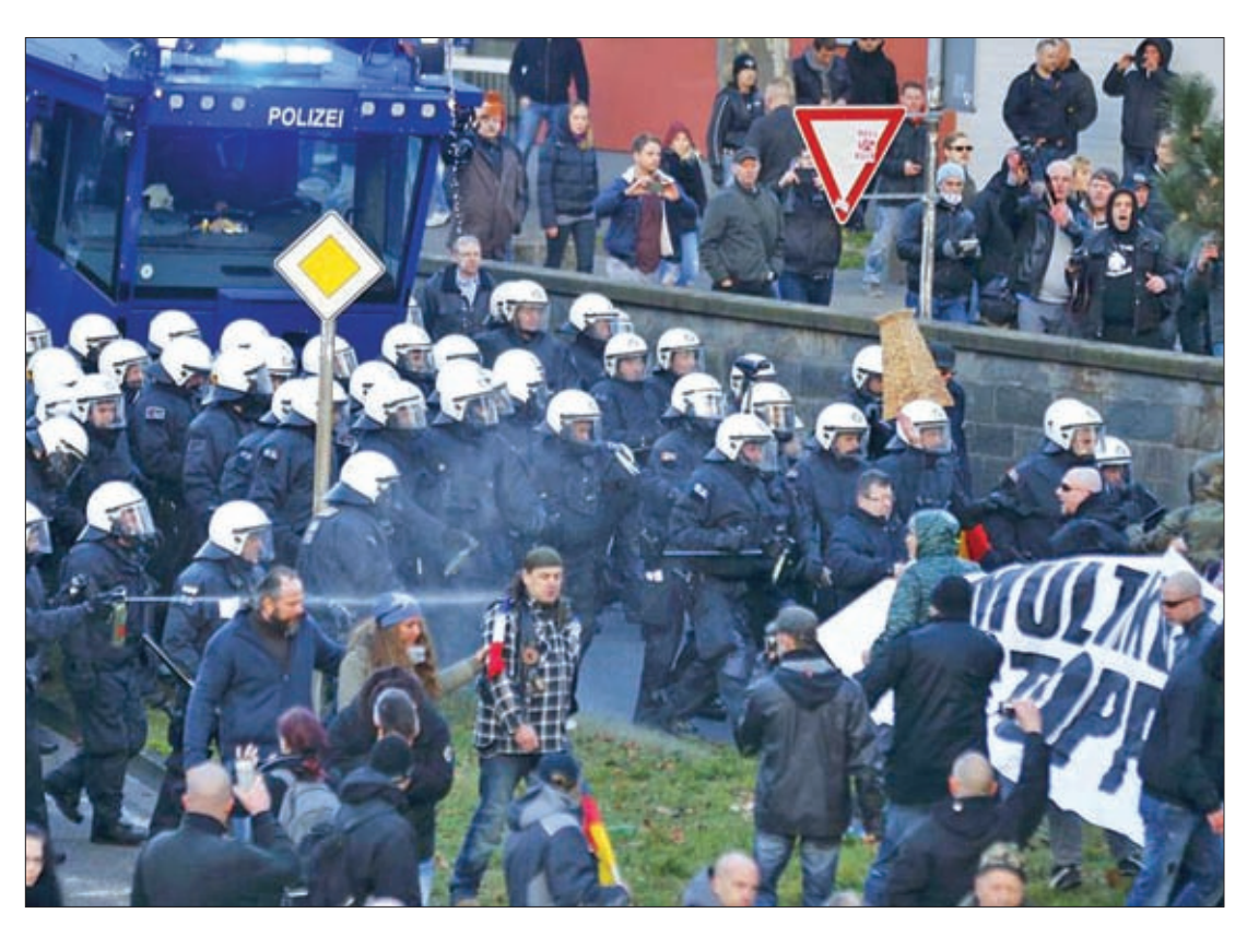
Police use pepper spray against supporters of anti-immigration right-wing movement PEGIDA (Patriotic Europeans Against the Islamisation of the West) during a demonstration march, in reaction to mass assaults on women on New Year's Eve, in Cologne, Germany, on 9 January 2016.

COLOGNE — Riot police broke up far-right protesters in Cologne on Saturday as they marched against Germany's open-door migration policy after asylum seekers were identified as suspects in assaults on women on New Year's Eve.