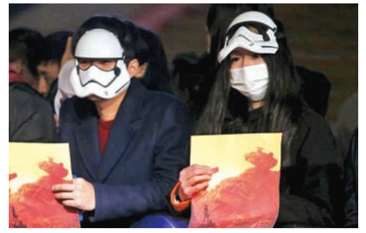
A fan wearing a face mask waits for a red carpet event before the China premiere of the film "Star Wars: The Force Awakens" amid heavy smog in Shanghai, China, on 27 December 2015

The "Star Wars" film saga that began in 1977 had not been a cultural phenomenon in China like it was in other countries. The original movies weren't shown in Chinese theaters until last June. Disney launched a marketing blitz to build buzz, featuring 500 Stormtroopers on the Great Wall and promotions with a pop star dubbed China's answer to Justin Bieber.—Reuters