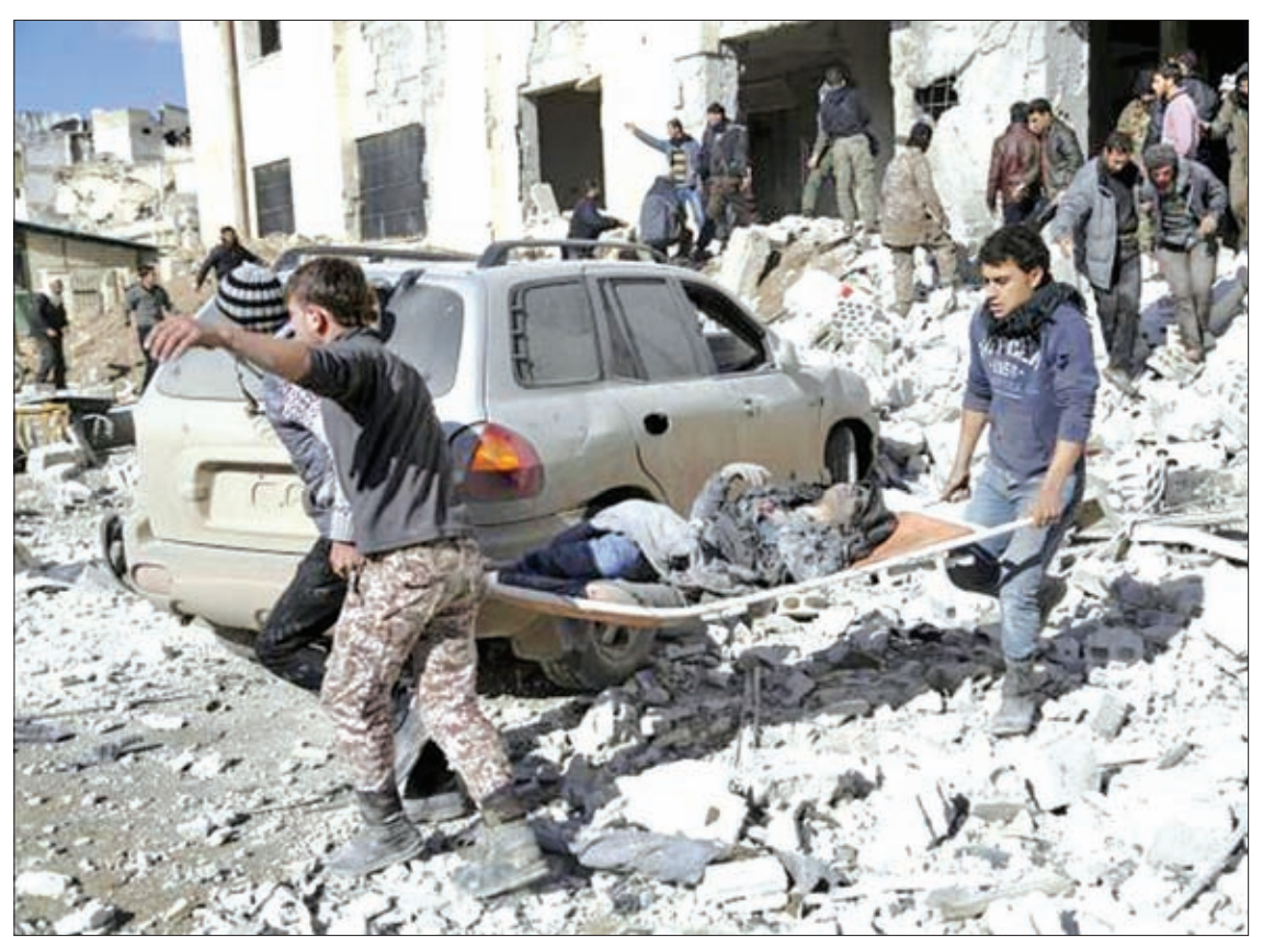
Residents carry an injured woman on a stretcher in a site hit by what activists said were airstrikes carried out by the Russian air force in the rebel-controlled area of Maaret al-Numan town in Idlib province, Syria on 9 January 2016.

The aid deal agreed on Saturday will result in humanitarian supplies being sent to the opposition-held town of Madaya at the Lebanese border, and to two villages in the northwestern province of Idlib that are blockade by rebels. Aid agencies have warned of widespread starvation in Madaya, where some 40,000 people are at risk. The United Nations said on Thursday that Damascus had agreed to allow access to all three areas, but did not say when the delivery would take place. "Both date and time have been set. Aid will go to three towns on Monday morning, all at the same time," said a source familiar with the matter. A second, pro-Syrian government source confirmed the details.— Reuters