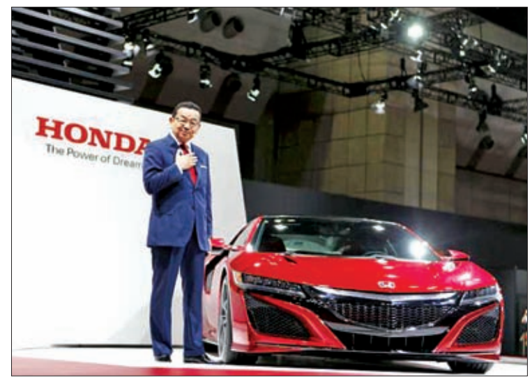
Honda Motor Co President and Chief Executive Takahiro Hachigo speaks next to NSX during a presentation at the 44th Tokyo Motor Show in Tokyo, Japan, on 28 October 2015.

Meanwhile, American and European automakers will showcase a variety of models to drum up excitement about their product lines as US consumers continue to flock to showrooms in model. record numbers.