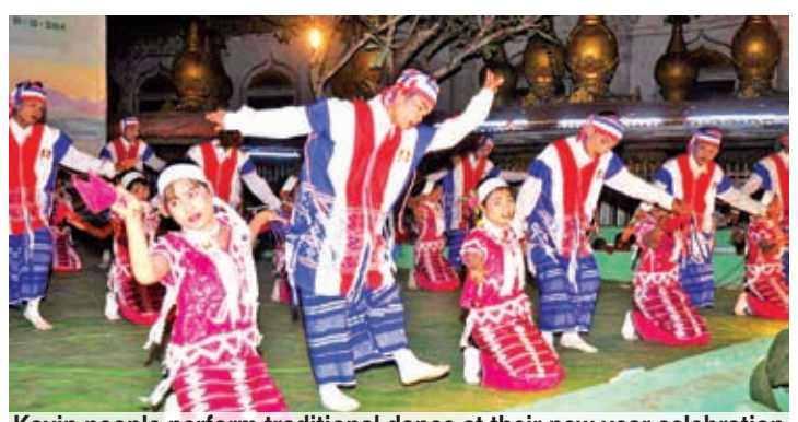
Kayin people perform traditional dance at their new year celebration in Insein township.

event, and the ceremony was followed by several entertainment programmes, including dancing competitions, which are held every year. The Kayin New Year Festival has been held in this form since 1938 with the aim of showcasing the lives and culture of Kayin people and creating links among them. Organised by Yangon Region Kayin New Year Festival Central Committee, the threeday event comes will end on 11