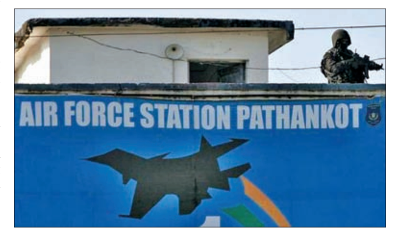
An Indian security personnel stands guard on a building at the Indian Air Force (IAF) base at Pathankot in Punjab, India, on 5 January 2016. Photo: Reuters

It remains unclear how the attackers infiltrated the fortified base, which has a 24-km (15-mile) perimeter surrounded by a 3-metre (10-foot) wall topped with concertina wire.— Reuters