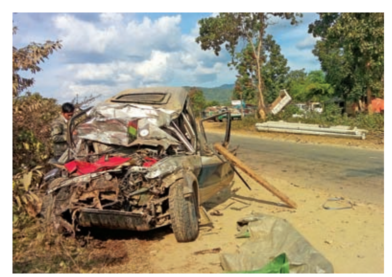
PAJERO car is seen after head on collision with 10-wheel truck.

A 10-wheel truck collided head on with Pajero in Indaw township, Sagaing region on Thursday, leaving one dead and four others injured.