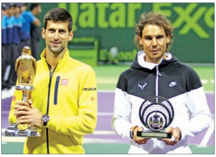
Novak Djokovic of Serbia holds the trophy as he stands next to second place Rafael Nadal of Spain after winning his Qatar Open men's single tennis final match in Doha, Qatar, on 9 January 2016.

Nadal was powerless to stop Djokovic as he watched 16 winners fly past him in the opening