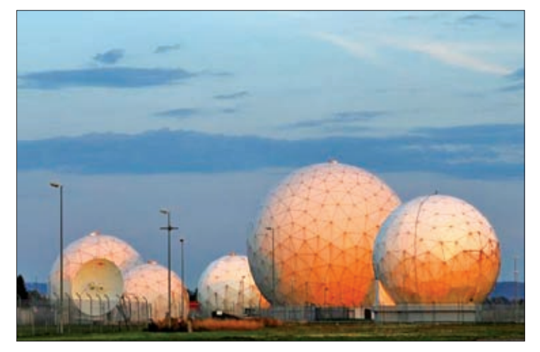
A general view of the monitoring base of the US intelligence organisation National Security Agency (NSA) in Bad Aibling south of Munich, in 2013.

In response to the Munich security alert, which was probably the result of a tipoff from a friendly intelligence service, German Interior Minister Thomas de Maiziere called for closer cooperation with foreign security services.—Reuters