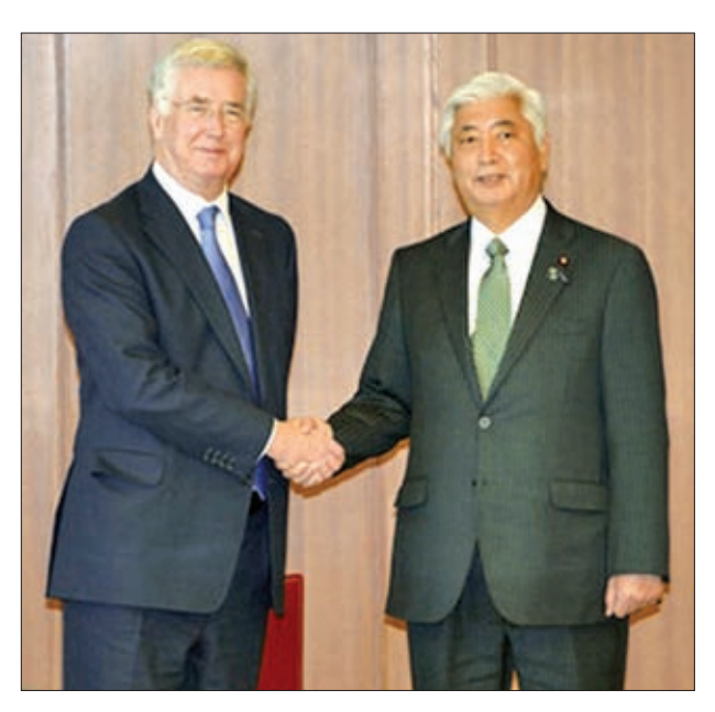
British Defence Secretary Michael Fallon (L) and Japanese Defence Minister Gen Nakatani shake hands before their talks in Tokyo on 9 January 2016.

TOKYO — Japanese and British defence ministers agreed Saturday to seek Britain's greater involvement in the Asia-Pacific region, in the wake of North Korea's latest nuclear test and China's maritime assertiveness in the South