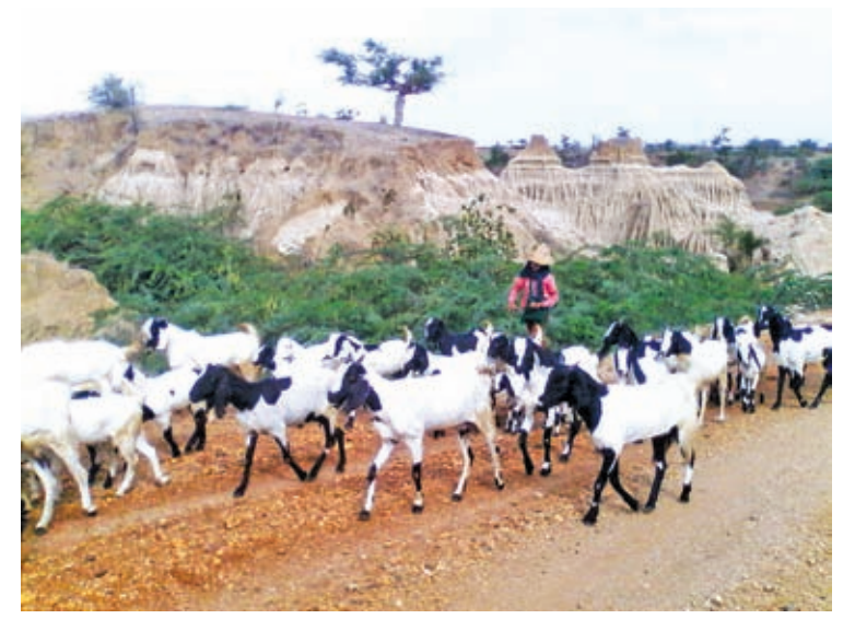
A farmer drives goats to graze in Salin.