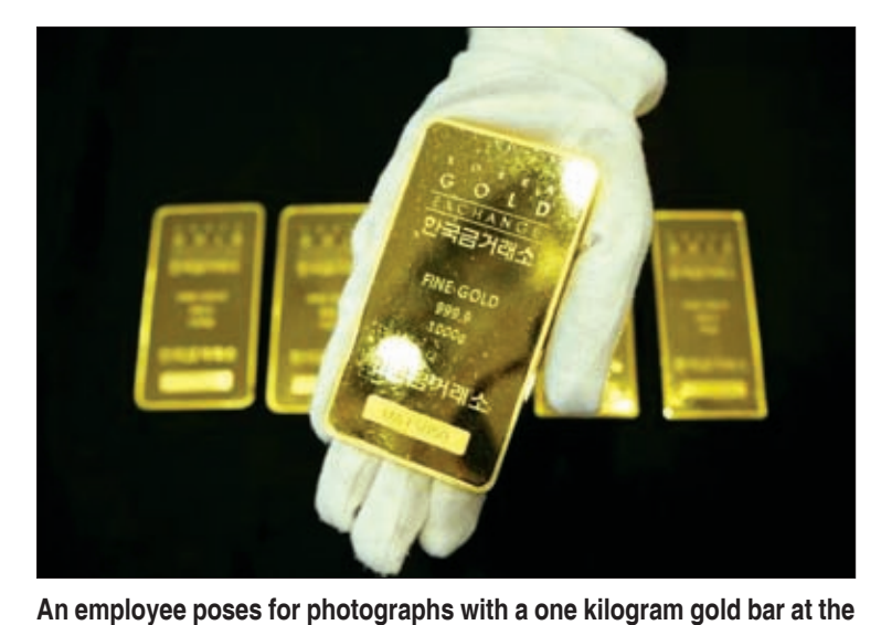
Korea Gold Exchange in Seoul, South Korea, on 31 July 2015.

NEW YORK — Gold fell further from an earlier nine-week high but was still on track for its strongest week since August on Friday stronger-than-expected US payrolls data boosted the dollar and stock markets, shoring up a recovery in equities.