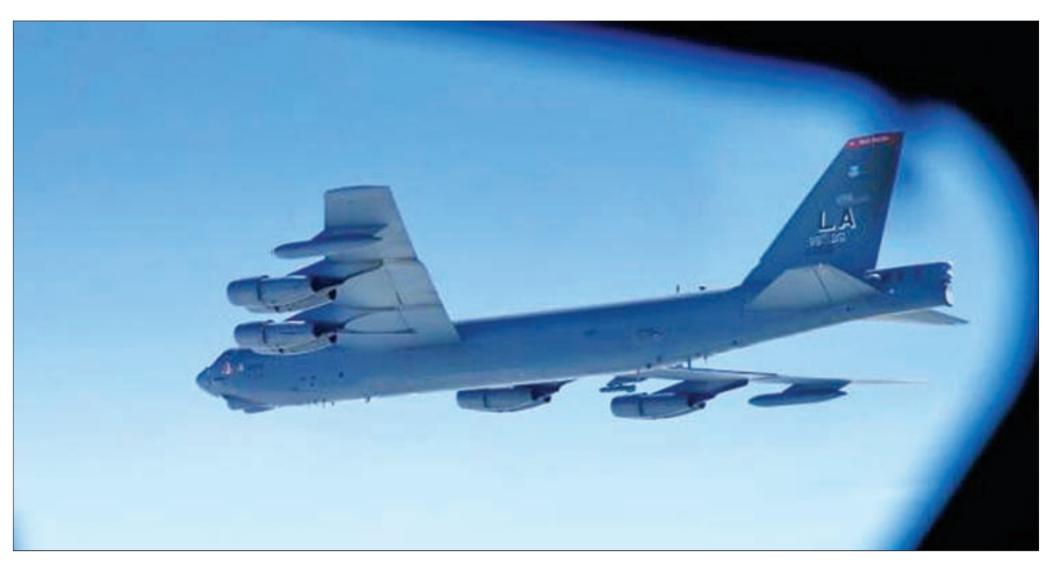
US Air Force B-52 is seen through the window of another during a training mission in the United Kingdom's airspace in 2014.

SEOUL — The US military yesterday dispatched a nuclear-capable B-52 bomber on a flight over South Korea, in an apparent show of force to North Korea following its globally condemned fourth nuclear test.