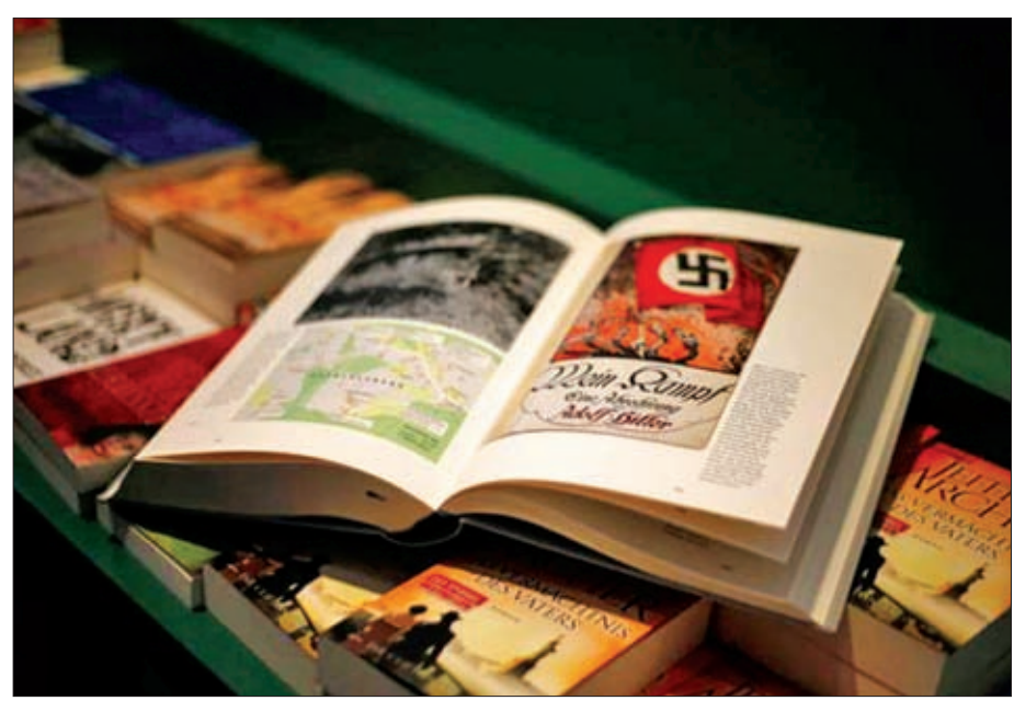
A copy of the book 'Hitler, Mein Kampf. A Critical Edition' lies on a display table in a bookshop in Munich, Germany, on 8 January 2016.

The publication has unleashed fierce debate in