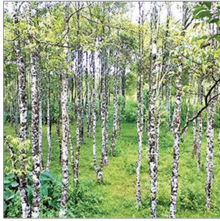
Agarwood trees are seen at a plantation.

According to the MAEA, the quality of Myanmar's agarwood is higher than it is in other countries, and its price is high compared to foreign market prices.