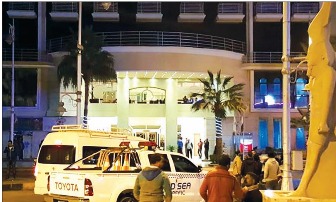
Security is ramped up outside a hotel where two attackers opened fire in the Egyptian Red Sea resort town of Hurghada, Egypt, on 8 January.

The Islamic State militant group said on Friday that an attack on Israeli tourists in Cairo on Thursday had been carried out by its fighters, in response to a call by the group's leader, Abu Bakr al-Baghdadi, to target Jews