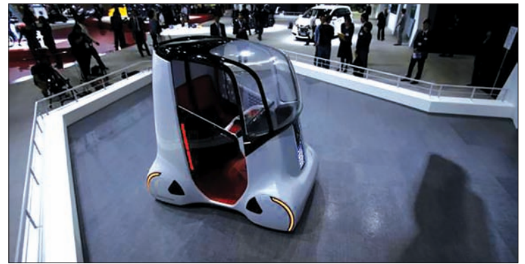
Honda Motor Co's personal mobility concept self-driving car "Wander Stand" is seen at the 44th Tokyo Motor Show in Tokyo, Japan, on 28 October 2015.

A 2015 National Highway Traffic Safety Administration study found about 60 per cent of property-damage-only crashes and 24 per cent of all injury crashes are not reported to the police.