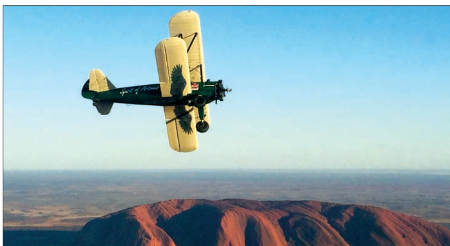
British aviator Tracey Curtis-Taylor pilots her biplane past Australia's Uluru rock formation during her historic England-to-Australia journey on 6 January.

"We have done something like 54 stops and that is what