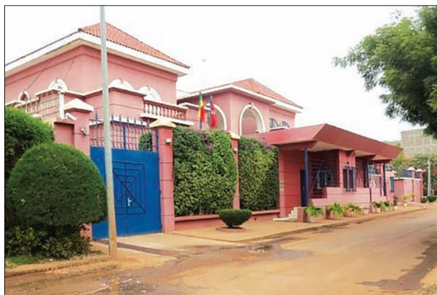
The Swiss embassy is seen in Bamako, Mali, on 8 January.

BAMAKO — Armed men kidnapped a Swiss missionary from her home in Timbuktu on Friday, nearly four years after she was abducted by Islamist militants from the same house, Malian and Swiss authorities said.