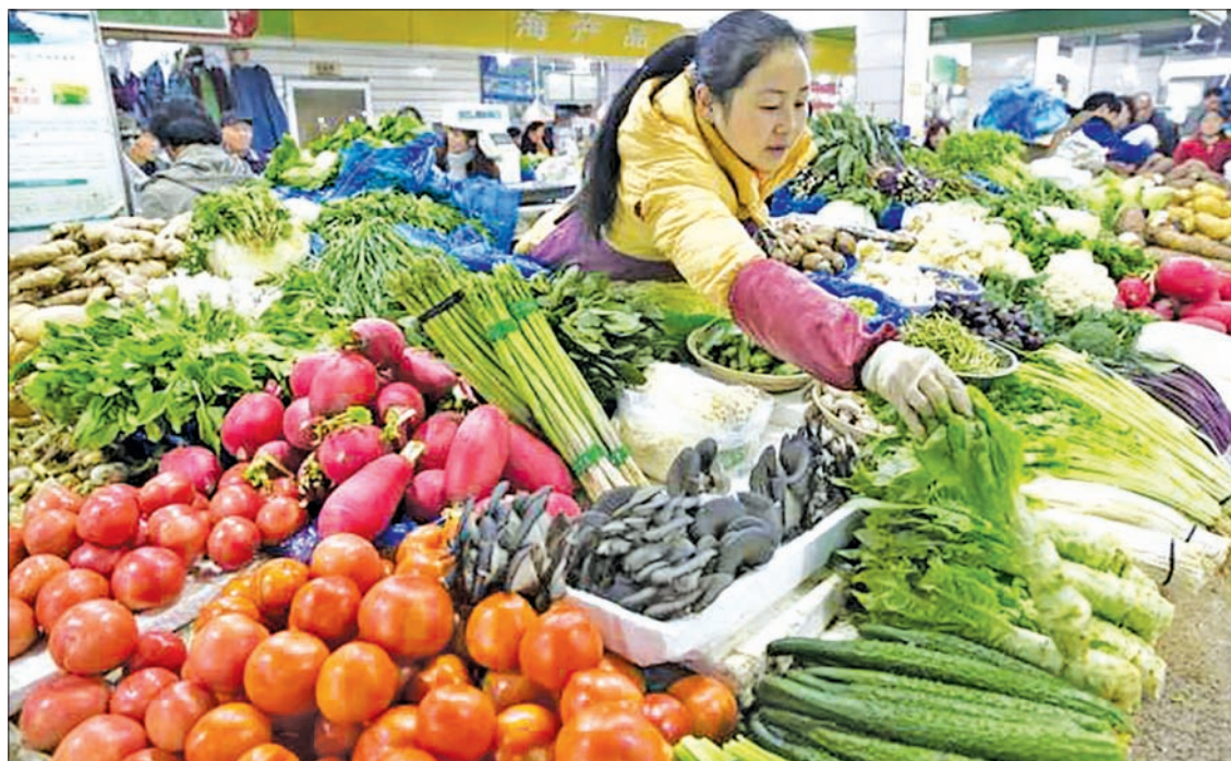
A vendor arranges vegetables at her stall at a market in Nanjing, Jiangsu Province, China, in December 2015.

A rising chorus of policy advisers and industrial constituencies is lobbying for an even deeper devaluation to the currency, by as much as 10 to 15 per cent, despite the risk of a potential currency war of competing devaluations in Asia.—Reuters