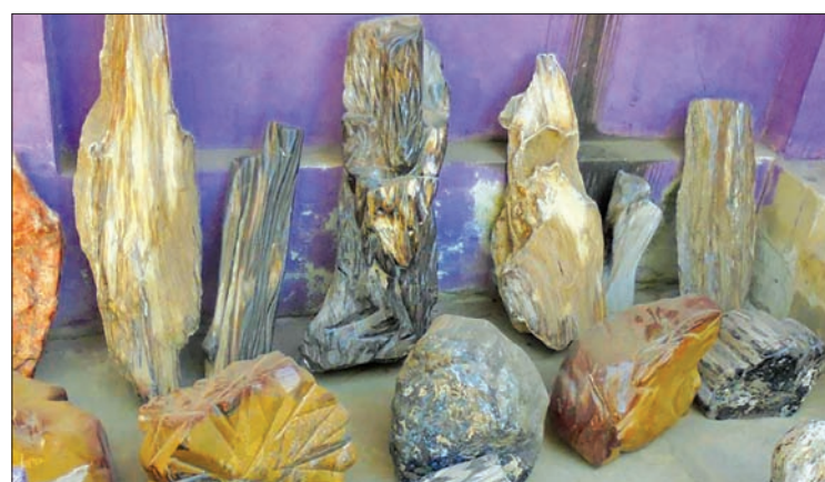
Agate stones are seen at a factory in Monywa.

wa Jewellery display necklaces, which are made from Jasper, Agate, Quartzite and palm stone.