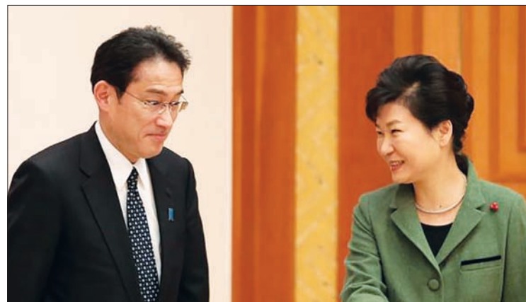
Japan's Foreign Minister Fumio Kishida (L) is greeted by South Korea's President Park Geun-hye at the Presidential Blue House in Seoul, South Korea, on 28 December 2015.

view of what can be done to improve security cooperation (with Japan)," a senior South Korean official, who asked not to be identified, told Reuters. Nothing specific has yet been discussed, he said.