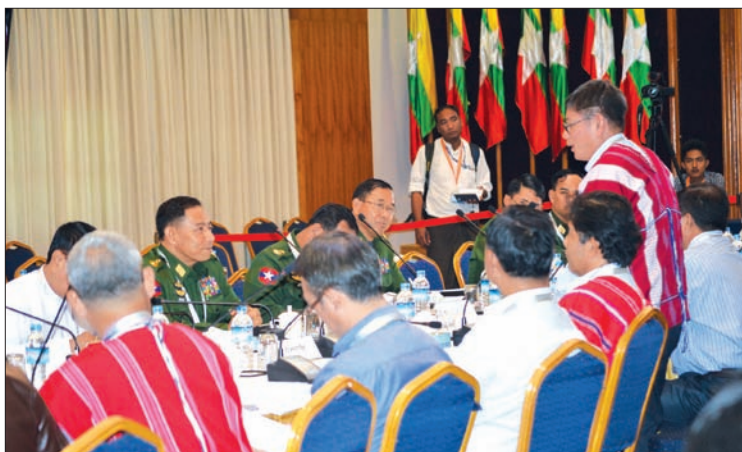
Lt-Gen Yar Pyae, chairman of the Joint Monitoring Committee-Union level, speaks at the committee's third meeting at Myanmar Peace Centre in Yangon on Friday.

JMC is the committee formed under the terms of the