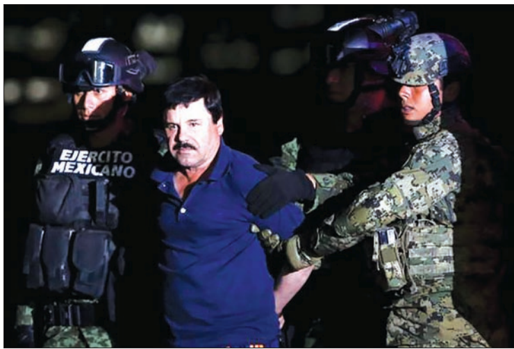
Joaquin 'El Chapo' Guzman is escorted by soldiers during a presentation at the hangar belonging to the office of the Attorney General in Mexico City, Mexico on 8 January.

"Mission accomplished: We have him," Peña Nieto said on his Twitter account. "I want to inform all Mexicans that Joaquin Guzman Loera has been arrested." For Peña Nieto, the capture of a trafficker who twice slipped out of Mexican prisons is a sorely-needed victory after his presi-