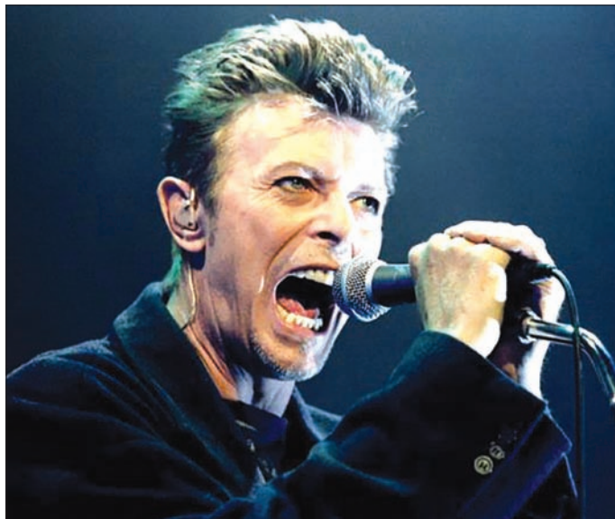
David Bowie performs during a concert in Vienna, Austria in 1996.

LONDON — David Bowie marked his 69 th birthday on Friday with the release of a new album, "Blackstar", with critics giving the thumbs up to the latest work in a long and innovative career.