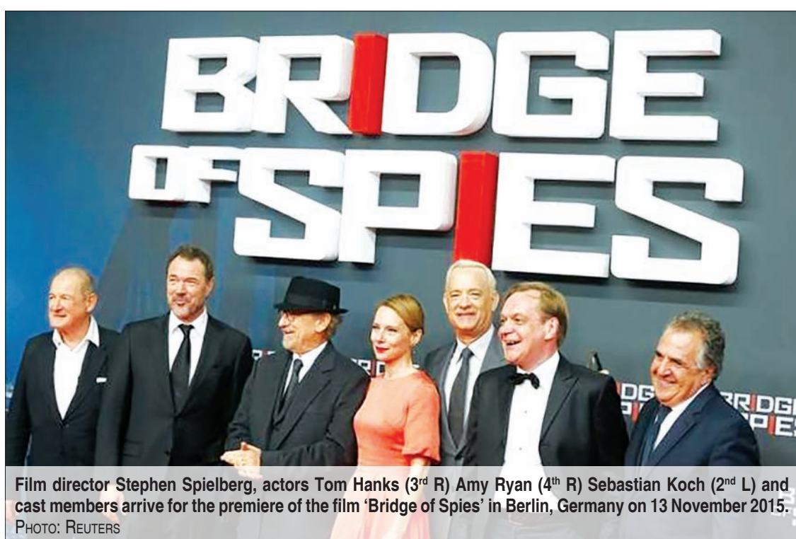
Film director Stephen Spielberg, actors Tom Hanks (3 rd R) Amy Ryan (4 th R) Sebastian Koch (2 nd L) and cast members arrive for the premiere of the film 'Bridge of Spies' in Berlin, Germany on 13 November 2015.

Last year's BAFTA leading actor winner Eddie Redmayne is in the running for his role in transgender movie "The Danish Girl", which was nominated for outstanding British film. Co-star