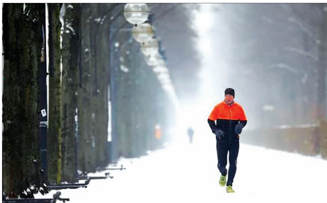
A jogger runs along a snow covered path in Berlin, Germany, on 6 January.