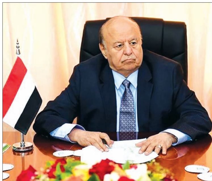
Abd-Rabbu Mansour Hadi sits during a meeting with government officials in the country's southern port city of Aden, in December 2015.

Ankara has acknowledged there was a "miscommunication" with Baghdad over the troop deployment.—Reuters