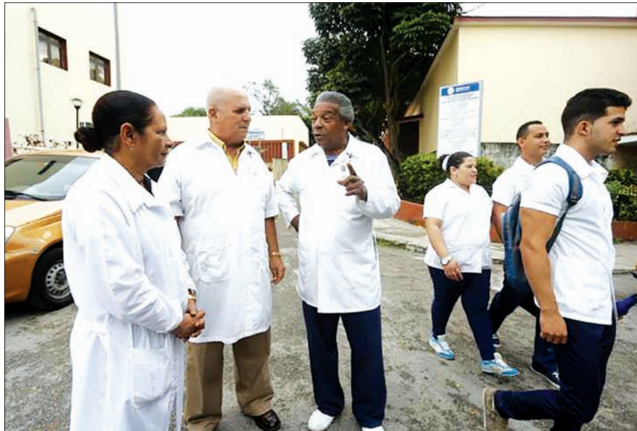
Doctors chat at the entrance of a hospital in Havana, on 8 January.

icy, and I think as we look at the whole totality of the relationship, this is something that we felt was worth being in the list of things that we consider," Rhodes told Reuters.