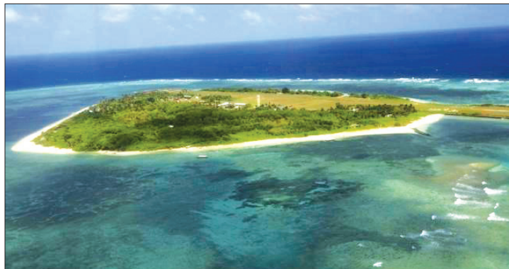
An aerial view shows the Pagasa (Hope) Island, part of the disputed Spratly group of islands, in the South China Sea located off the coast of western Philippines on 20 July 2011.

MANILA — Philippine President Benigno Aquino on Friday urged Southeast Asian neighbours to put pressure on China to agree on a binding code of conduct to ease tension in South China Sea following Chinese test flights to an island it has built.