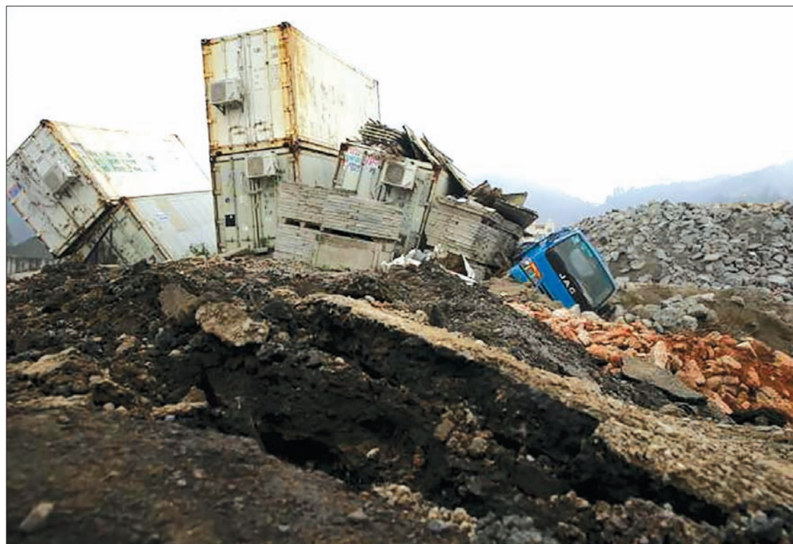
Damaged vehicles and containers are seen at an industrial estate hit by a landslide in Shenzhen, Guangdong province, on 23 December 2015.

The disaster is the latest accident to raise questions about China’s industrial safety standards and lack of oversight over years of breakneck economic growth.— Reuters