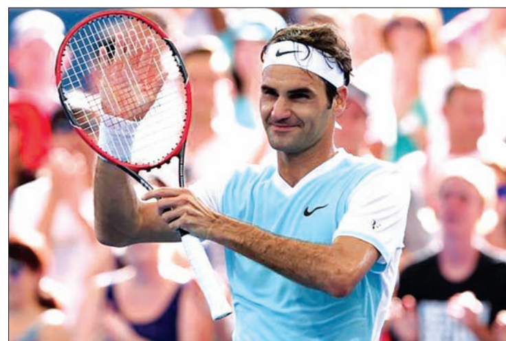
Roger Federer of Switzerland celebrates after defeating Dominic Thiem of Austria in their semi-final match at the Brisbane International Tennis Tournament in Brisbane, on 9 January.

"I really thought I hit the ball very well," the evergreen 34-year-old, lathered in sweat