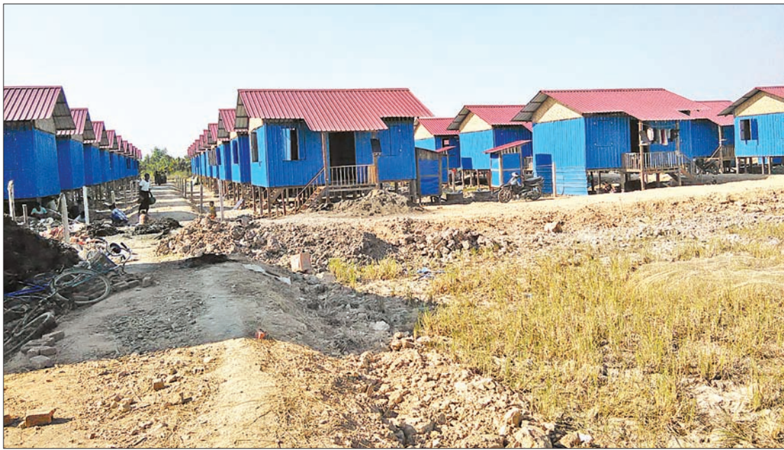
Houses are ready to be handed over to people in flood-hit areas in Mrauk U.