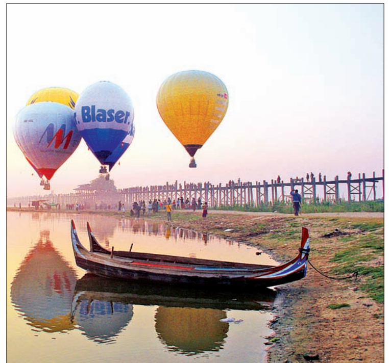
Hot air balloonists are seen during 17th tour over Taungthaman Lake in Mandalay

December and January are apparently the most popular months for good ballooning weather.— Myo Win Tun (Monywa)