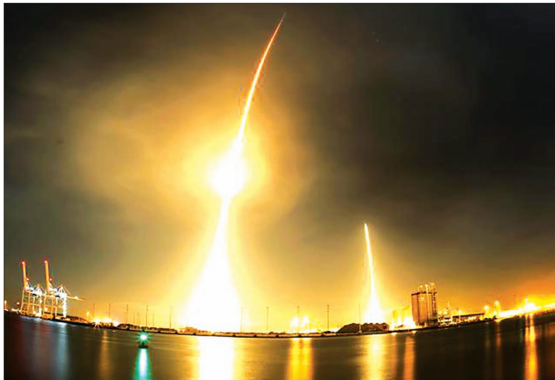
A long exposure photograph shows the SpaceX Falcon 9 lifting off (L) from its launch pad and then returning to a landing zone (R) at the Cape Canaveral Air Force Station.

“It is worthy of note that the response of the regions and districts so far are appropriate and adequate and we expect these response actions to contain and halt the outbreak,” he said in the statement. Yellow fever is an acute viral hemorrhagic disease transmitted by infected mosquitoes. It can kill up to 50 per cent of victims if adequate treatment is not administered. There are an estimated 200,000 cases of yellow fever, causing 30,000 deaths worldwide each year, with 90 per cent occurring in Africa. Symptoms of the disease include fever, jaundice, muscle pain with prominent backache, and headache. Vaccination is the most important preventive measure against the disease.—Xinhua