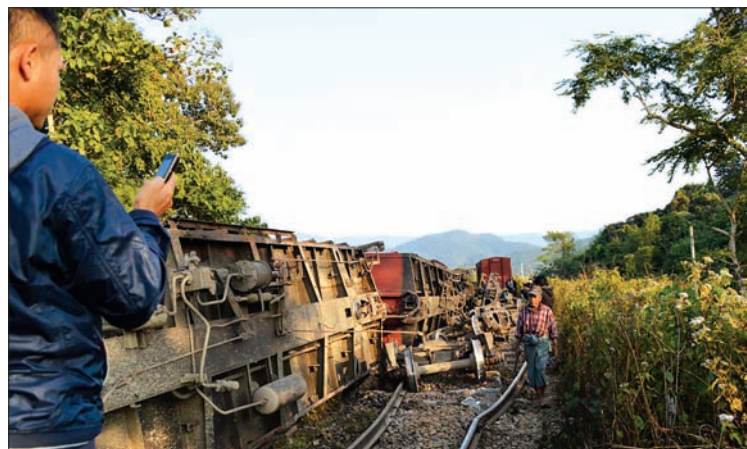
Officials inspect derailment of cargo train.

Engineers and workers from Nabar and Indaw stations together with local police and service personnel of a local battalion are carrying out efforts to remove the cars and repair the road. - Maung Chit Lin (Indaw)