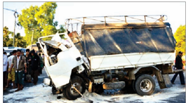
12-wheel truck is seen after the accident in Toungoo.

The head on collision killed U Kyin Lone and injured the seven passengers on board.