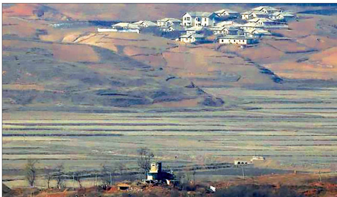
A North Korean guard post (bottom) is seen in front of the North Korea's propaganda village Kaepoong in this picture taken from the Unification Observation Platform, near the demilitarised zone which separates the two Koreas in Paju, South Korea, on 7 January 2016.

In retaliation for the test, South Korea on Friday unleashed a ear-splitting propaganda barrage over its border with the North. The last time South Korea deployed the loudspeakers, in August 2015, it triggered an exchange of artillery fire. "Jealous of the successful test of our first H-bomb, the US and its followers are driving the situation to the brink of war, by saying they have resumed psychological broadcasts and brought in strategic bombers," Kim Ki Nam, head of the ruling Workers' Party propaganda department, said at Friday's rally. State media published imag-