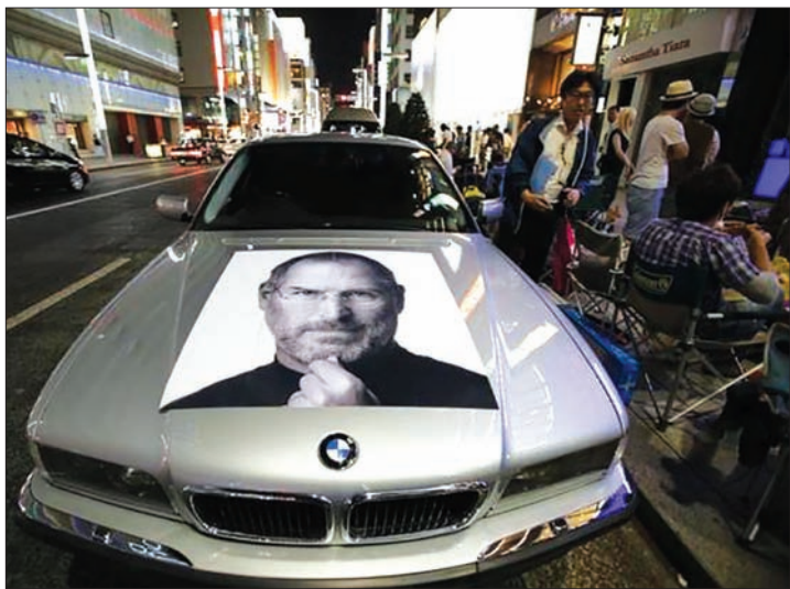
A portrait of Apple's co-founder Steve Jobs is seen on a BMW car in Tokyo's Ginza shopping district.

Car technology has become a prime area of interest for Silicon Valley companies including Google Inc, which has built a prototype self-driving car.—Reuters