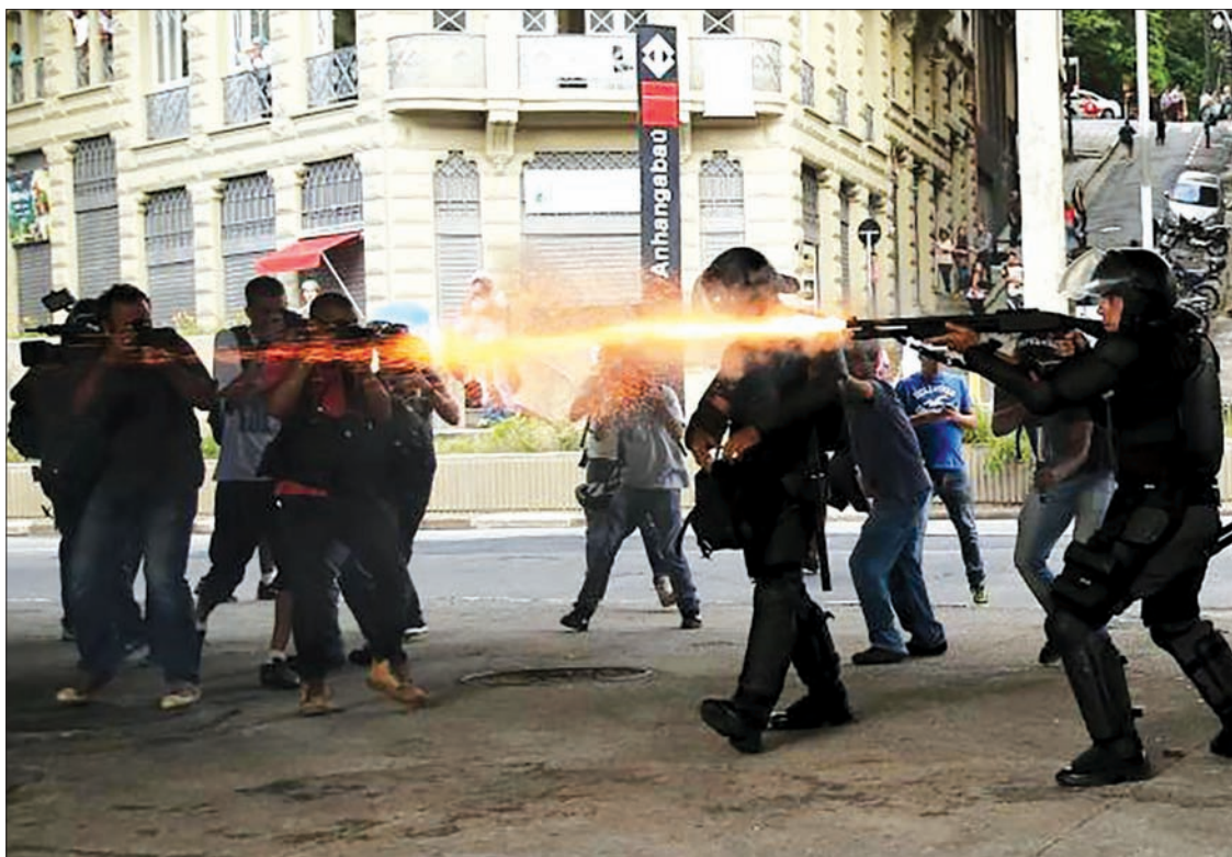
Riot police fire tear gas at demonstrators during a protest against fare hikes for city buses in Sao Paulo, Brazil, on 8 January.

faces impeachment proceedings in Congress. Some political analysts say the mood on the streets towards her government could play an important role in determining the outcome of the impeachment process. —Reuters