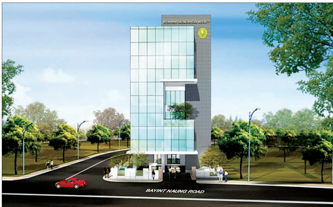
A small scale model of the Myanmar Geoscience Society building.

The building will be constructed on a 60ft by 80ft plot at the corner of Bayintnaung Road and Aungchanthar Road in North Dagon Township.— Soe Win (MLA)