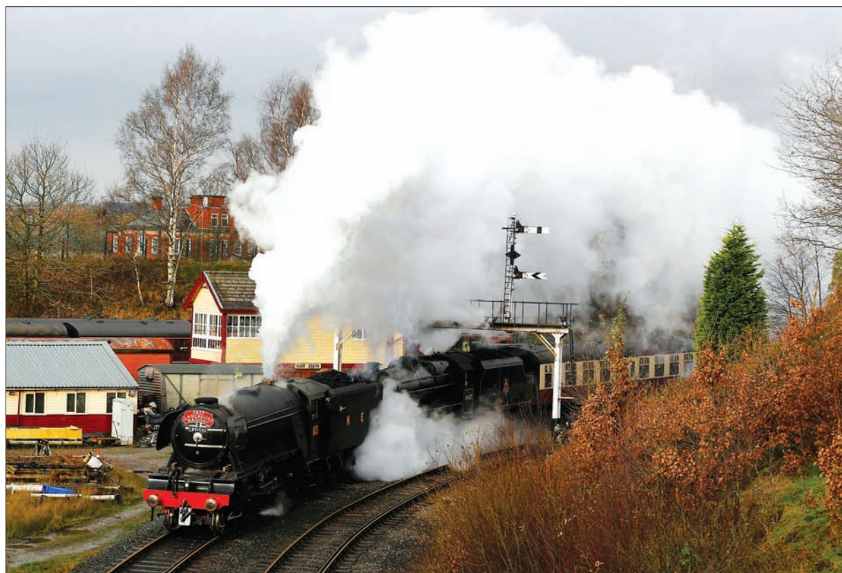
The Flying Scotsman steam engine leaves East Lancashire Railway in Bury, Britain, on 8 January. PHOTO: REUTERS

The first mainline test run is expected to be from Manchester to Carlisle, over the scenic Ribbleshead Viaduct, on 23 January. Next month the Scotsman will run between Kings Cross station in London to the railway museum in York, northern England, where it will be based.—Reuters