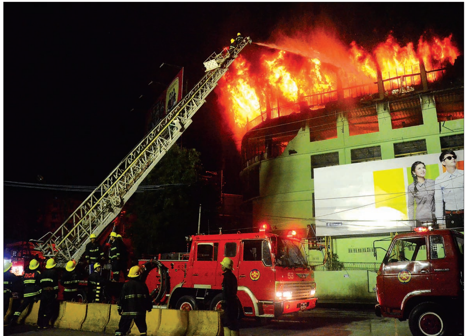
firefighters are fighting to extinguish the fire at Mingalar Market on 9 January, 2016.

The fourth floor, which was destroyed by the fire, had cosmetic and medicine stores while