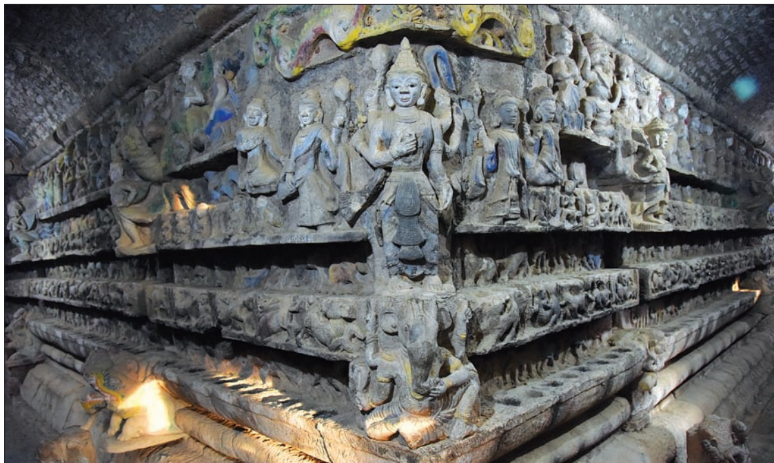
Antiquated sculptures are seen inside Shit-thoung Pagoda in Mrauk U.