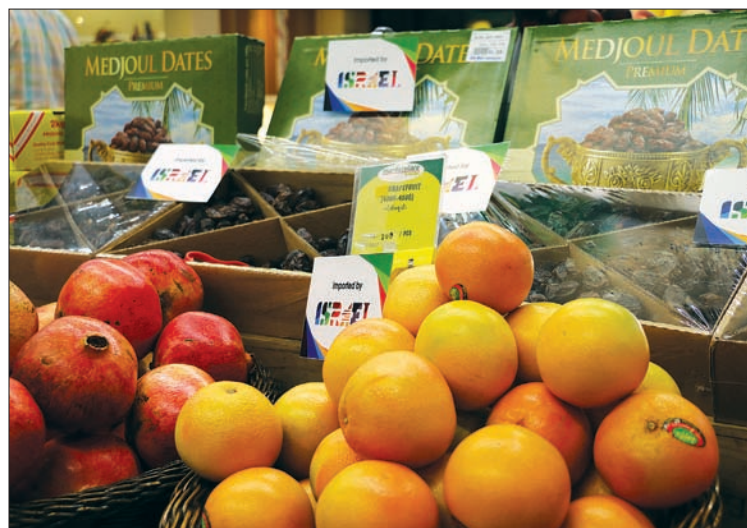
Fruits from Israel are displayed at a stall of City Mart shop in Yangon.