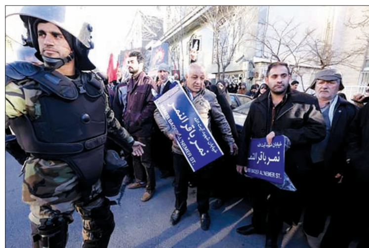
An Iranian riot police stands guard as protesters hold street signs with the name of Shi’ite cleric Sheikh Nimr al-Nimr during a demonstration against the execution of Nimr in Saudi Arabia, outside the Saudi Arabian Embassy in Tehran on 3 January.

powerful Revolutionary Guards told Saudi Arabia on Thursday it would “collapse” in coming years if it kept pursuing what he called its sectarian policies in the region.