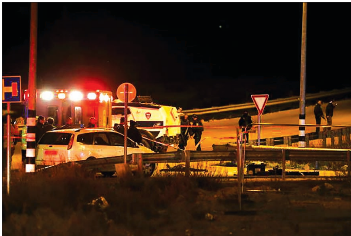
Israeli policemen stand next to the scene of a Palestinian stabbing attack close to the West Bank Jewish settlement of Migdal Oz on 7 January.

JERUSALEM — Israeli security forces on Thursday shot dead four Palestinians who launched two separate stabbing attacks in the occupied West Bank, the military said, as a surge in street violence entered its fourth month.