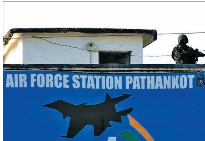
An Indian security personnel stands guard on a building at the Indian Air Force (IAF) base at Pathankot in Punjab, India, on 5 January.

Prime ministers Narendra Modi of India and Nawaz Sharif of Pakistan are struggling to keep their renewed dialogue on track after the militant attack killed seven Indian military personnel and wounded 22. Modi made a surprise stopover in Pakistan last month, the first time an Indian premier has visited in over a decade.—Reuters