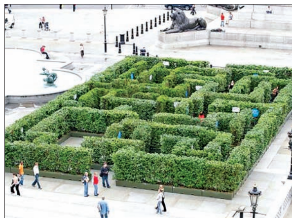
Visitors walk past a maze which had been set up in Trafalgar Square to promote London's West End shopping and entertainment district in 2010.

LONDON — The Finborough Theatre, a tiny off-West End stage tucked away above a pub, has built its reputation on innovative new writing and on occasions has a knack for seizing highly topical issues for its plays.