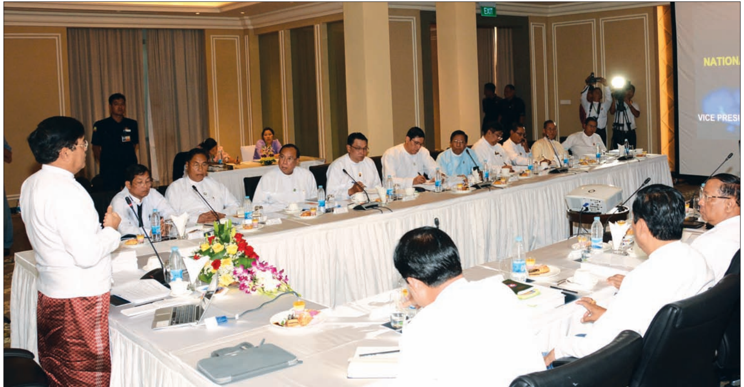
Vice President U Nyan Tun addresses National Energy Management Committee meeting 1/2016.

He remarked that it is of utmost importance to promote the production of energy, to reduce and finally do away with losses and wastages and to reserve the environment for future generations. In this function, the government has already formulated a national energy policy to be able to supply energy in a sustainable manner. This policy is based on international expert opinion and the government has laid down a