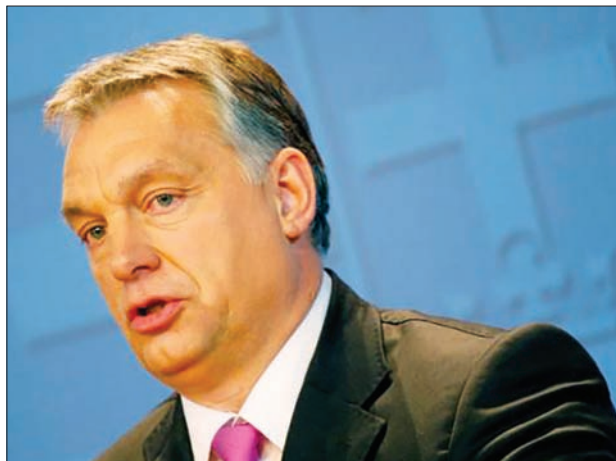
Hungarian Prime Minister Viktor Orban addresses news conference with British Prime Minister David Cameron (not pictured) in Budapest, Hungary on 7 January.

The barriers initially drew criticism from his European Union partners, but several countries, such as Slovenia and Austria, have since raised barriers of their own. Others have imposed checks within the EU's border-free Schengen