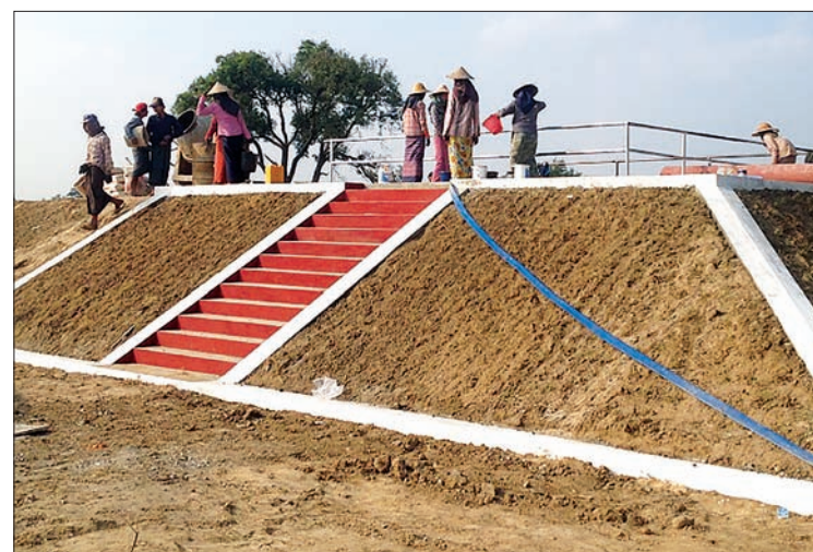
Villagers gather at Tamabin River Pumping Project to fetch water.

"The project will benefit 450 acres of farmlands across the region after it finished."— Min Htet Aung (Mandalay Sub-printing House)