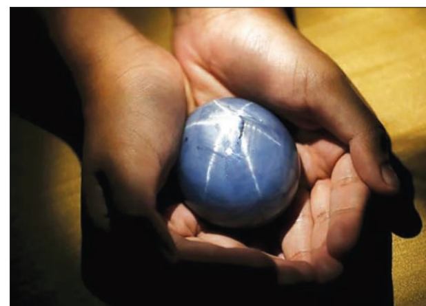
The owner of the world's largest blue sapphire holds it for photographs during an interview with Reuters in Colombo on 6 January.

The three largest blue sapphires have all been found Sri Lanka. The stone that was previously the largest star blue sapphire weighs 1,395 carats, the