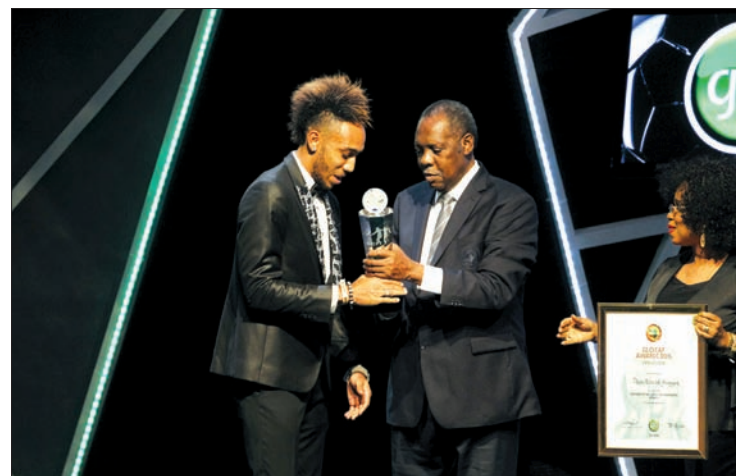
Gabon's Pierre-Emerick Aubameyang receives the Confederation of African Football (CAF) award for African Footballer of the Year from FIFA acting president Issa Hayatou in Abuja, Nigeria on 7 January.

"I thank the people of Gabon, this award is for them. I want to thank my team mates in the national team and also