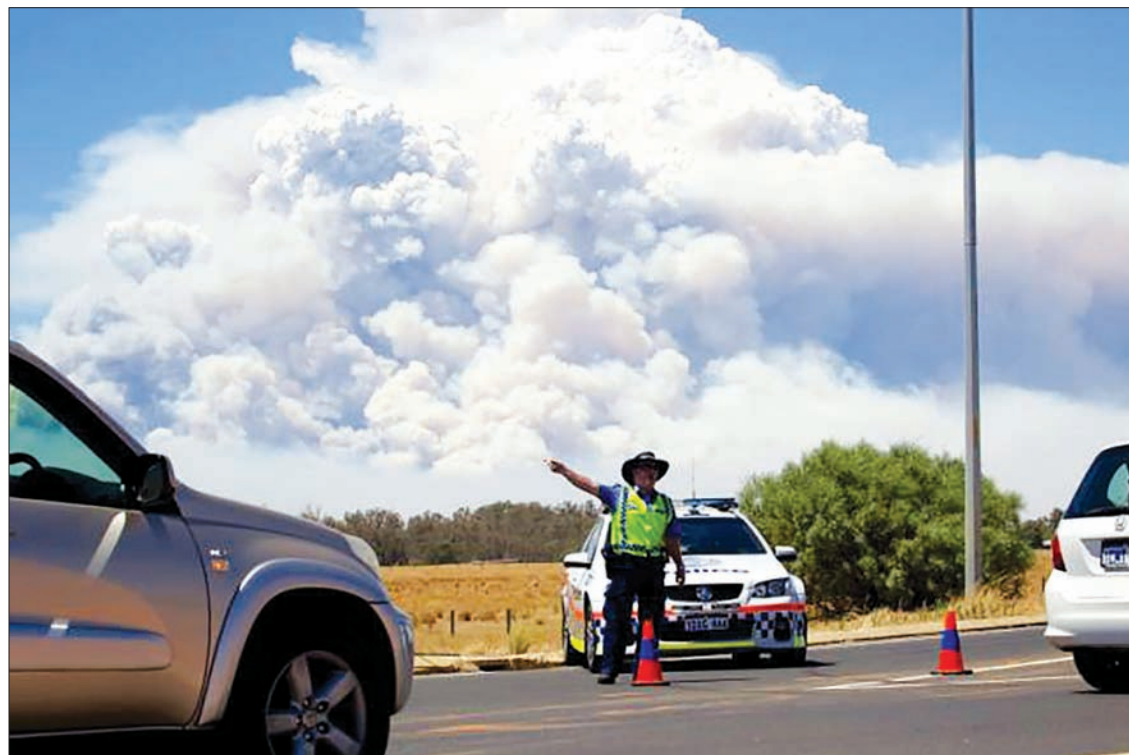
Smoke clouds from a large bush fire are seen behind a police road block at the turn off onto the South Western Highway near Pinjarra, Western Australia, on 7 January.

SYDNEY — A bushfire destroyed nearly 100 homes in western Australia as it swept through countryside south of Perth, but there were no casualties reported after emergency officials and local media said yesterday that three missing people had been found safe.