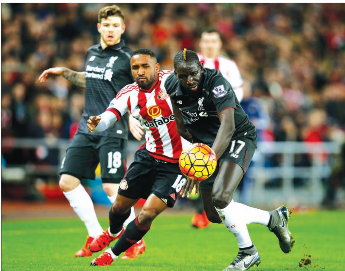
Liverpool's Mamadou Sakho in action with Sunderland's Jermain Defoe during Barclays Premier League at Stadium of Light on 30 December 2015.

"If he can continue being as good, and as clinical as he was last weekend, then long may it last." —Reuters