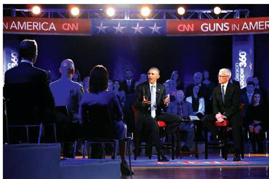
US President Barack Obama participates in a live town hall event on reducing gun violence hosted by CNN's Anderson Cooper (R) at George Mason University in Fairfax, Virginia on January.

The NRA sat out the town hall, aired live on CNN from a university just miles (km) from the group's Virginia headquar-