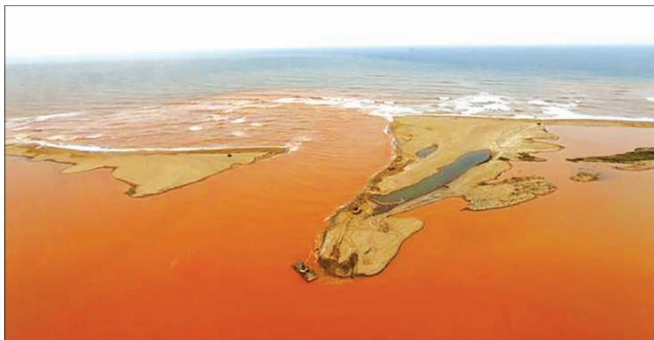
An aerial view of the mouth of Rio Doce (Doce River), which was flooded with mud after a dam owned by Vale SA and BHP Billiton Ltd burst, at an area where the river joins the sea on the coast of Espirito Santo in Regencia Village, Brazil, in November 2015.

MELBOURNE — Much less sludge was spilled than first estimated from a dam burst at a Brazilian iron ore mine last November which killed 17 people, co-owner BHP Billiton (BHP.AX) (BLT.L) said yesterday.