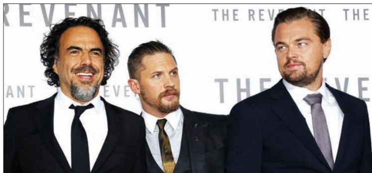
Director of the movie Alejandro Gonzalez Inarritu (L) poses with cast members Tom Hardy (C) and Leonardo DiCaprio at the premiere of "The Revenant" in Hollywood, California on 16 December 2015.

LOS ANGELES — With free-flowing champagne and blistering jokes that have yet to be told but have already been apologised for, Sunday's Golden Globes promise a rowdy night featuring Hollywood's top names and a wide-open awards race to keep viewers in suspense.