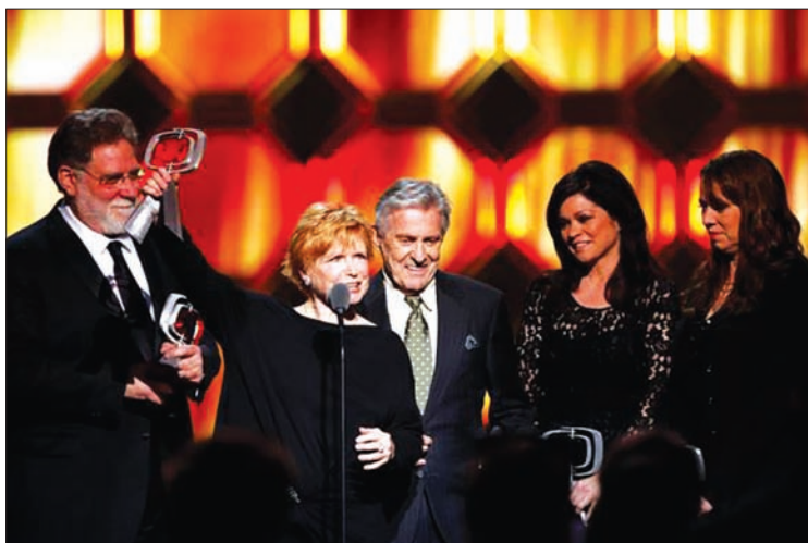
(L-R) Actors Richard Masur, Bonnie Franklin, Pat Harrington Jr., Valerie Bertinelli and Mackenzie Phillips accept an award for the show One Day at a Time during the 10th Anniversary TV Land Awards in New York in 2012.

In 1975, Harrington was cast as the faux suave Schneider in the CBS situation comedy that followed the lives of newly divorced