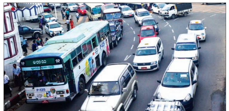
Typical downtown traffic seen here next to Sule Pagoda, Yangon.

With high demand for automobiles in the country, systematic public transportation should be given priority to meet international standards, some experts for civil affairs said.—001 ( The Mirror )