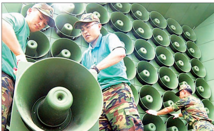
South Korean loudspeakers used for anti-North Korea propaganda broadcasts, near the Demilitarised Zone between the two Koreas in June 2004.

For decades, the two Koreas have bombarded each other's soldiers at the DMZ and people in nearby villages with propaganda, but the broadcasts were halted in