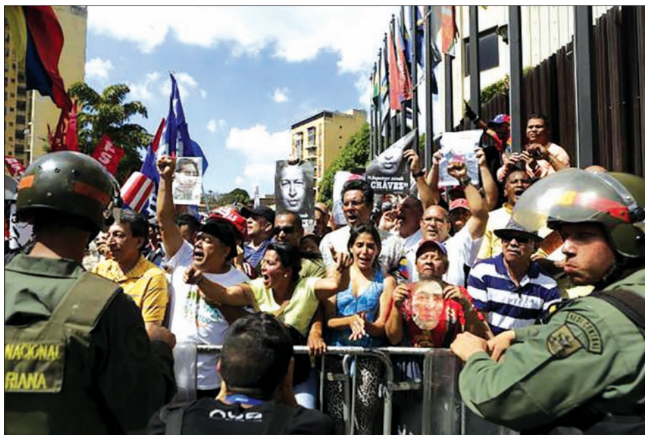
Supporters of Venezuela's President Nicolas Maduro hold up photographs of Venezuela's late President Hugo Chavez as they gather outside Supreme Court building in Caracas on 7 January.

"I've given the order that in the coming hours all the streets of Caracas, all the poles, all the fences, have the image of our liberator Simon Bolivar and the image of our Father Chavez," said Socialist Party heavyweight Jorge Rodriguez, with hundreds of government supporters at a Caracas square.