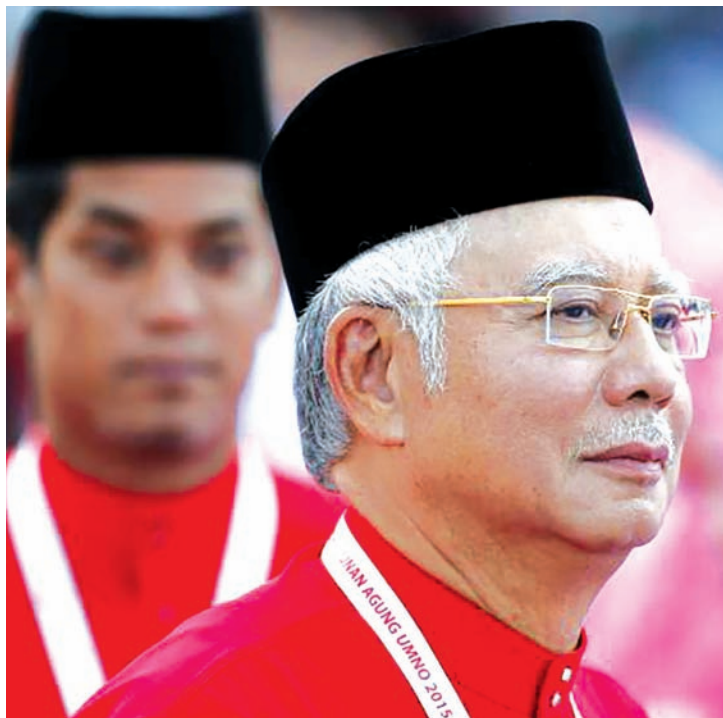
Malaysia's Prime Minister Najib Razak.

KUALA LUMPUR — Malaysian Prime Minister Najib Razak will table amendments to the 2016 budget “soon” that will take into account the challenges expected in the new year, state news agency Bernama quoted him as saying on yesterday.