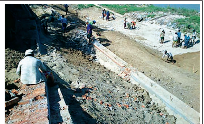
A minor damage to the embankment occurred in Nyaungdon on 2 January. Officials are still monitoring it and carrying out the maintenance of the embankment.

Landslides triggered by torrential monsoon rain continued to cause severe damage to Haka, the capital of Chin State in June and July last year, leaving major roads and households destroyed.—District IPRD