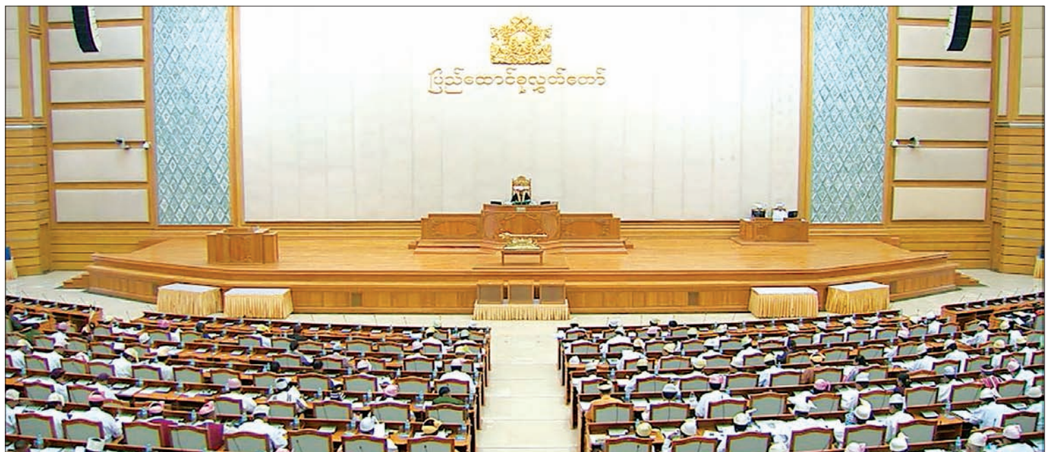
Pyidaungsu Hluttaw being convened in Nay Pyi Taw.

A total of 553 MPs attended the parliamentary meeting. — Myanmar News Agency