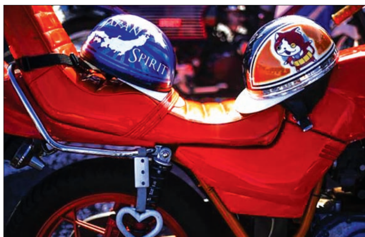
Helmets rest on the seat of a Bousouzoku style motorbike.