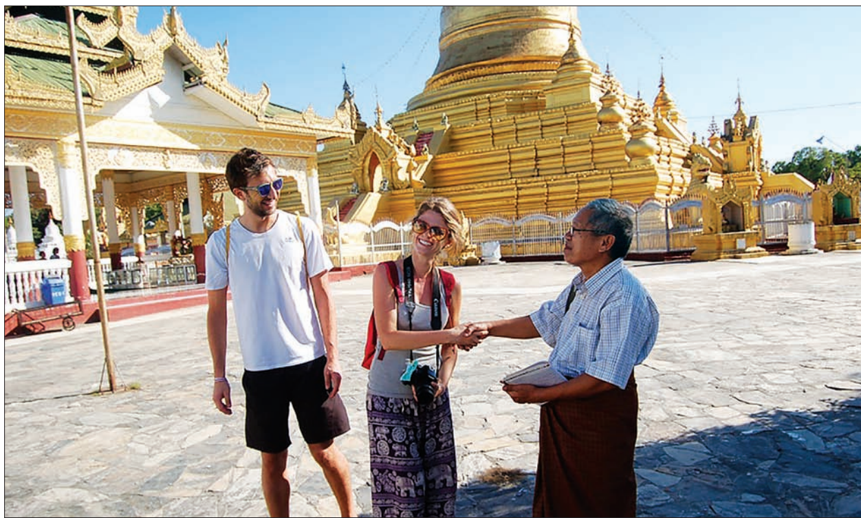
Tourists visit a Pagoda in Mandalay.

Currently, eight domestic airlines and five international airlines are operating services there.— Min Htet Aung (Mandalay Sub-printing House)