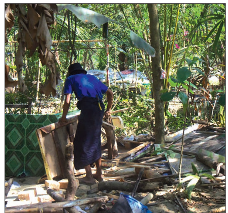
A man clears debris from illegal make-shift huts in National Races Village in Thaketa township, Yangon.

LOCAL authorities destroyed 55 illegal make-shift huts in the National Races village in Yangon on Thursday, taking action against 6 restaurants in connection with the case.