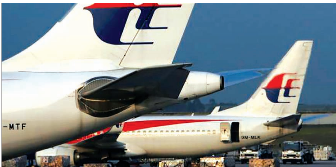
Malaysia Airlines planes sit on the tarmac at Kuala Lumpur International Airport in 2014.

The airline suffered two disasters in 2014. In March that year, its flight MH370 carrying 239 passengers and crew disappeared while on a flight to China and is believed to have gone down in the Indian Ocean.—Reuters