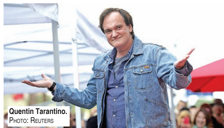
Quentin Tarantino.

"I wanted to put my hands and footprints in the Grauman's Chinese courtyard way before I ever had a career, so this is something I wanted to do my whole life," the director said.