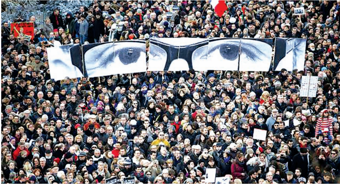
People hold panels to create an image depicting the eyes of late Charlie Hebdo editor Stephane Charbonnier, known as "Charb", as hundreds of thousands of French citizens take part in a solidarity march (Marche Republicaine) in the streets of Paris.

PARIS — One year on, an anxious, fragmented France is paying tribute to the victims of the killings at Charlie Hebdo magazine, with old divisions made worse by what President Francois Hollande has called "a terrible year".