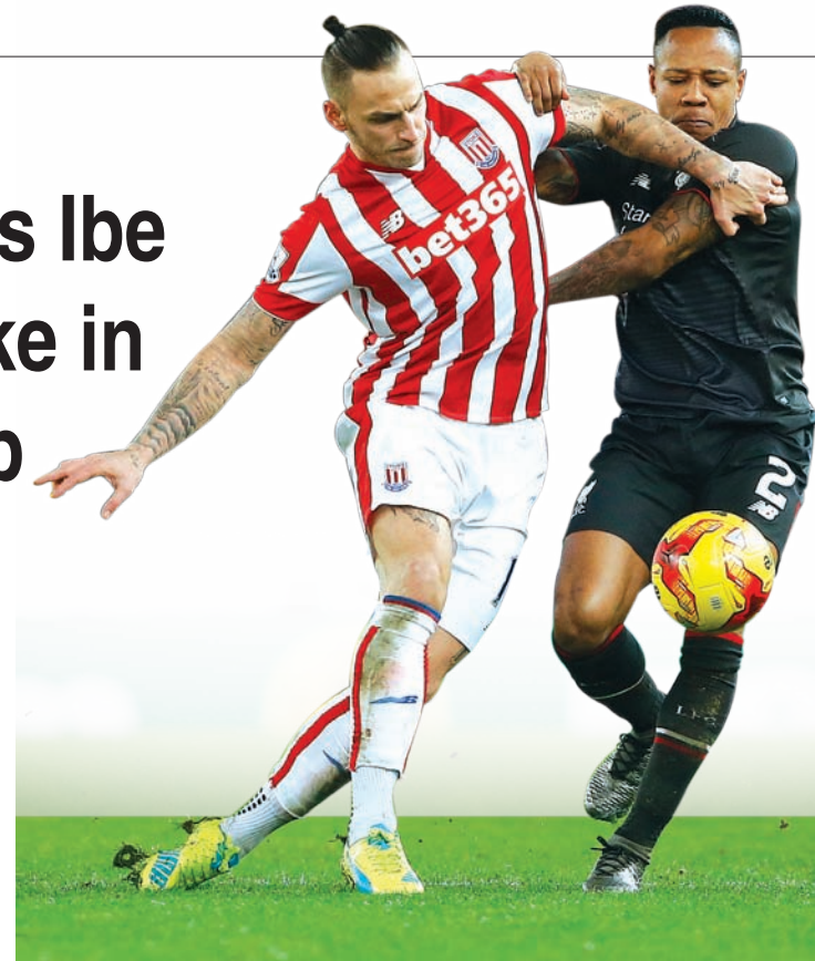
Liverpool's Nathaniel Clyne in action with Stoke's Marko Arnautovic during Capital One Cup Semi Final First Leg at Britannia Stadium on 5 January.

Klopp's delight at victory was tempered by yet more injury woe as Philippe Coutinho and Dejan Lovren succumbed to hamstring problems in a high-paced first half, while Toure was limping at the finish.