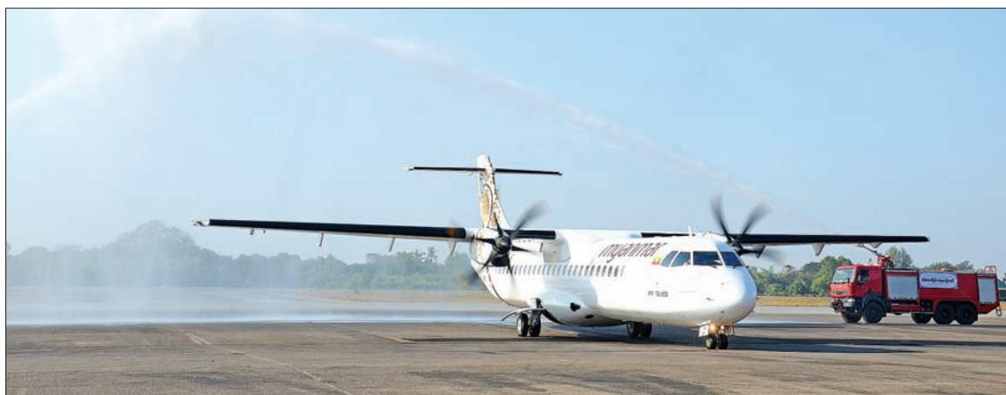
The second ATR aircraft of Myanmar National Airlines landed at Yangon International Airport.

MYANMAR National Airlines (MNA) welcomed its second ATR aircraft at Yangon International Airport on 5 January.