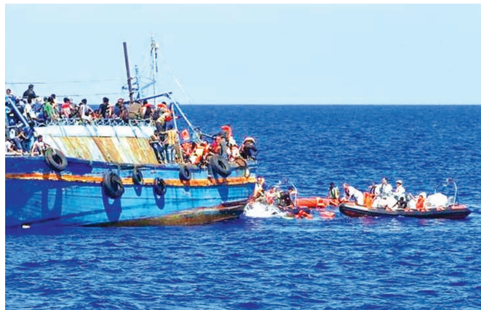
Migrants in the water scramble to get onto Migrant Offshore Aid Station (MOAS) rescue boats launched from the MOAS ship Phoenix after they jumped from an overloaded wooden boat during a rescue operation 10.5 miles (16 kilometres) off the coast of Libya in 2015.

It also called on EU countries to find safe and legal ways for refugees and migrants to reach Europe so that they did not have to rely on smugglers and rickety boats to make the journey.