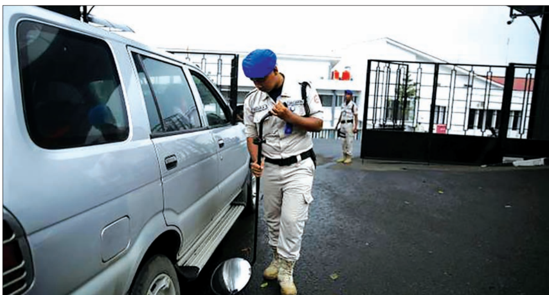
A security guard checks a car before entering the National Counter-Terrorism Agency building in Bogor, on 5 January.

However, security analysts believe a larger threat is emerging across the populous island of Java as networks of support for Islamic State grow.—Reuters