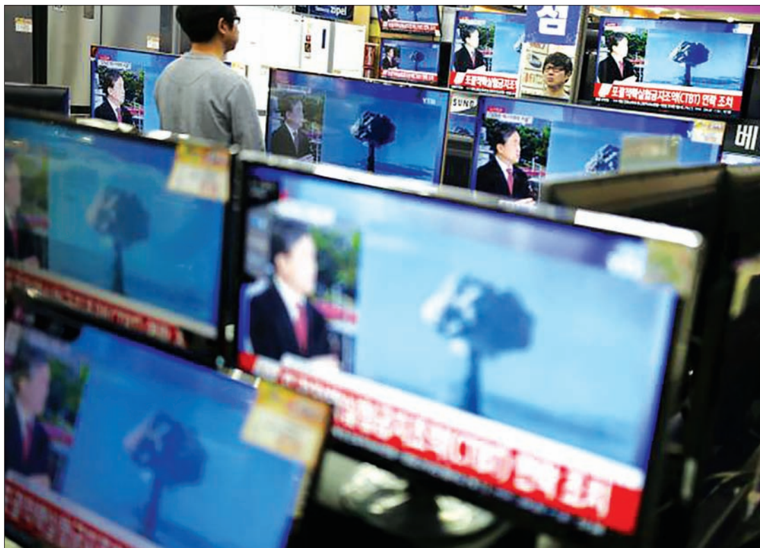
A sales assistant watches TV sets broadcasting a news report on North Korea's nuclear test, in Seoul, on 6 January.

SEOUL — North Korea said it successfully tested a miniaturised hydrogen nuclear device yesterday, claiming a significant advance in the isolated state's strike capability and setting off alarm bells in Japan and South Korea.