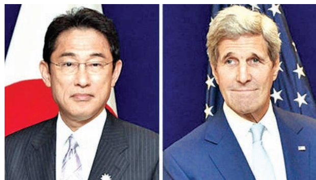
Japanese Foreign Minister Fumio Kishida & US Secretary of State John Kerry.

TOKYO — Japanese Foreign Minister Fumio Kishida and US Secretary of State John Kerry held talks over the phone yesterday, agreeing to seek to resolve tensions between Saudi Arabia and Iran through dialogue.