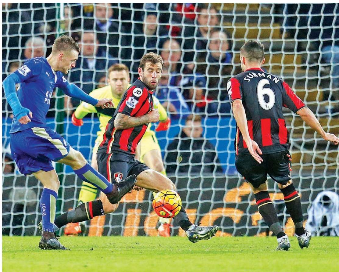
Leicester's Jamie Vardy shoots at goal during Barclays Premier League at King Power Stadium on 2 January.