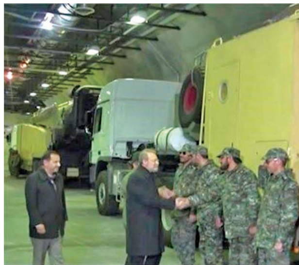
Iran's parliament speaker Ali Larijani shakes hands with a soldier as he inaugurates a new underground missile depot in this undated handout photo released on 5 January 2016 by Farsnews.com.

The Revolutionary Guards' second-in-command, Brigadier General Hossein Salami, said last Friday that Iran's depots and underground facilities are so full that they do not know how to store their new missiles.—Reuters