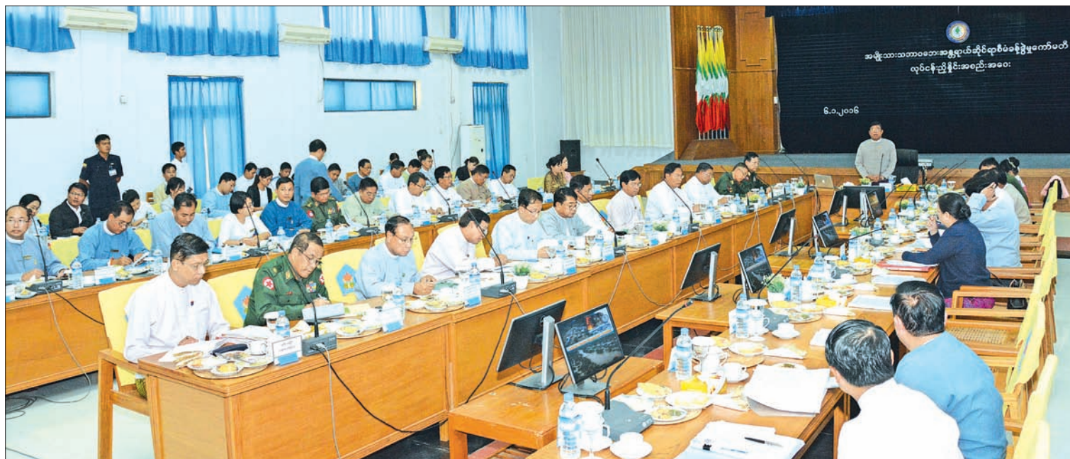
Vice President U Nyan Tun delivers address at the work co-ordination meeting of the committee for the National Disaster Management.

He also cited the Yangtze River Water Conservancy as another example of how irrigation networks have contributed to the socio-economic development of a local populace, saying the project has contributed to China's national development.