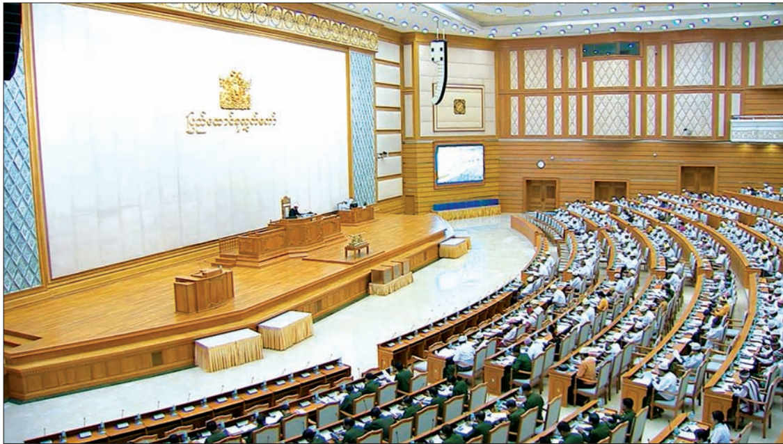
Pyidaungsu Hluttaw being convened in Nay Pyi Taw.

THE Ministry of National Planning and Economic Development released its National Comprehensive Development Plan (NCDP) yesterday at the Pyidaungsu Hluttaw session in Nay Pyi Taw.