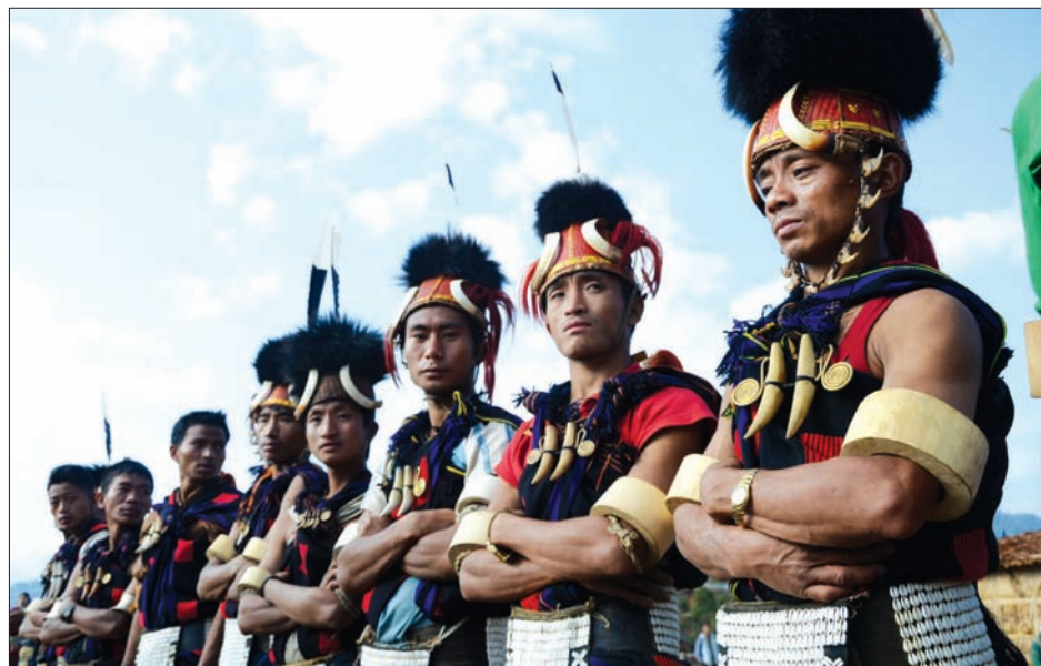
Naga men line up as they wait for dance in their new year festival.

This year's festival is expected to draw high interest from visitors because of better transportation services.— MMAL