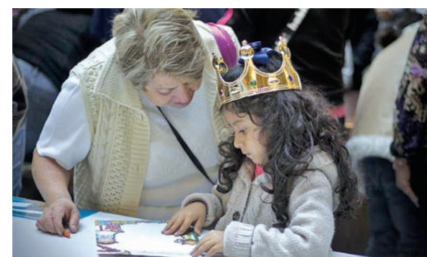
A girl accompanied by her grandmother writes a letter to the Three Kings during the Epiphany at Mexican Postal Service headquarters, in Mexico City, capital of Mexico, on 5 January.