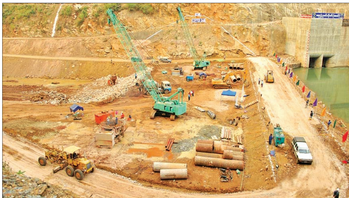
The Ahtet Yeywa hydropower project over the Dokhtawady River is seen under construction in northern Myanmar.

Upon completion, the five projects are expected to generate 1,936 MW in total.— Myanmar News Agency