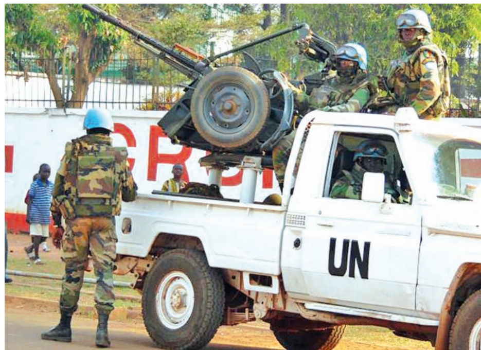
UN peacekeepers take a break as they patrol along a street during the presidential election in Bangui, the capital of Central African Republic, on 30 December 2015.

UNITED NATIONS — The UN peacekeeping mission in Central African Republic said on Tuesday it was investigating new allegations of sexual abuse of minors by peacekeepers in the conflict-torn African nation.