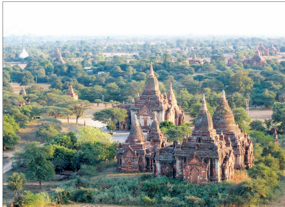
Bagan, one of tourists attractionsites of Myanmar.

THE NyaungU area in the ancient city of Bagan, located on the bank of the Ayeyawaddy River, has become crowded with visitors this high season with particular interest paid to the pagodas located there—Tuyin Taung, Tantkyi Taung, Shwezigon and Lawkananda.