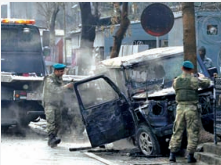
Turkish soldiers take pictures of a vehicle at the site of a suicide attack in Kabul on 26 Feb, 2015.

KABUL, 26 Feb — A suicide bomber rammed a car laden with explosives into a vehicle belonging to NATO's top envoy in Afghanistan, killing one Turkish soldier and wounding at least one person, Turkish officials said.