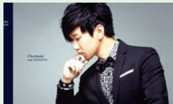
Singaporean singer-songwriter JJ Lin

SINGAPORE, 26 Feb — Addressing some 1,000 Singaporean teenage students at the China-Quotient Student Forum 2015 on Wednesday afternoon, Singaporean singer-songwriter JJ Lin encouraged students to upkeep their bilingual-bicultural competency and pursue their dreams. Speaking in Chinese, JJ Lin Junjie, 2014 Business China Young Achiever Award recipient, encouraged the students to capitalize on the vast opportunities made available to them within the educational framework, continue to hone their bilingual-bicultural competencies and work