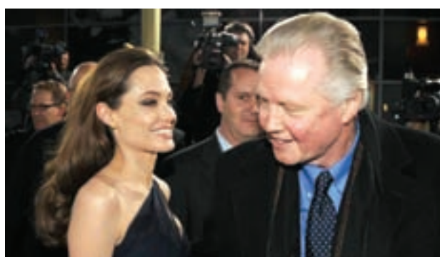
Actor Jon Voight has expressed his desire to work in a film directed by his daughter Angelina Jolie.

The actor also slammed the Oscars for snubbing Jolie’s name from the best director nominations list.