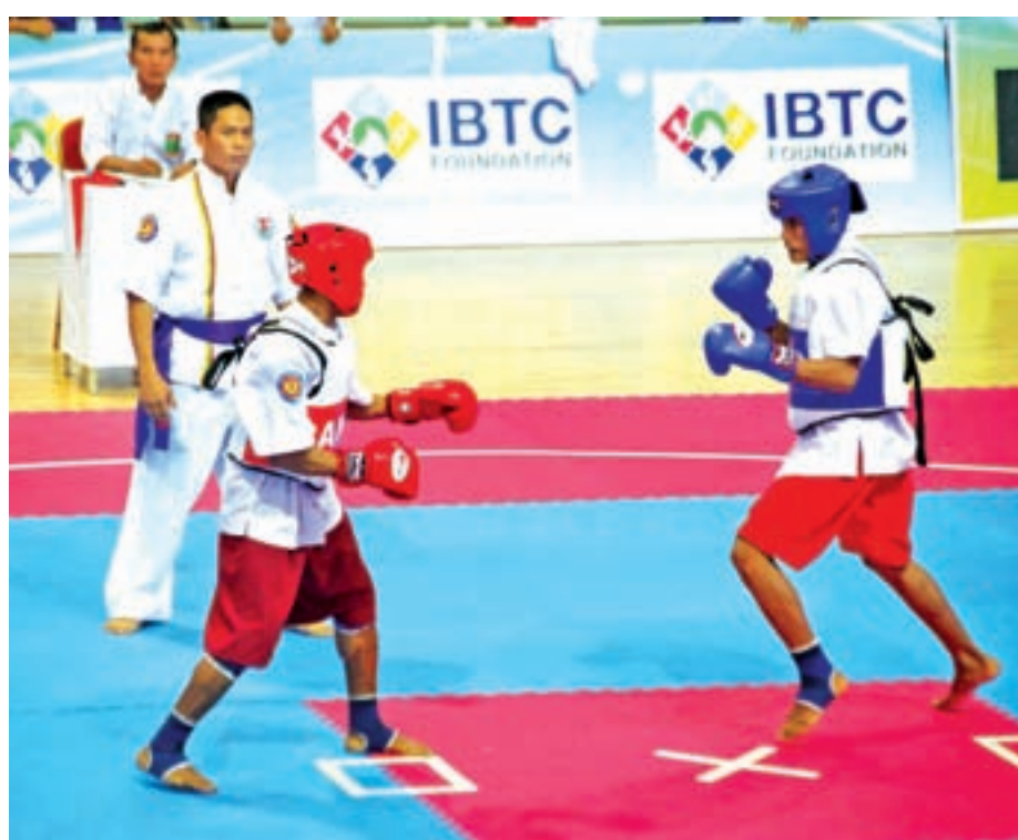
Two boxers compete for title at Wunna Theikdi Stadium.