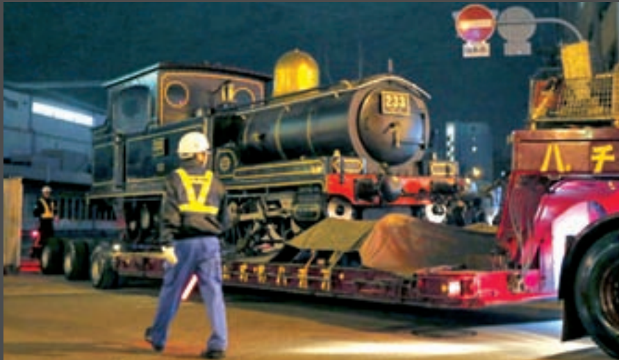
The oldest Japanese-made steam train in existence is transferred by trailer to Kyoto Railway Museum, which will open in the spring next year, from a closed Osaka museum on 26 Feb, 2015. Enthusiastic railroad fans observed the transfer of the train built in 1903.