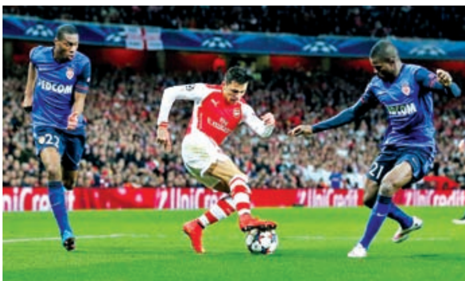
Alexis Sanchez (C) of Arsenal controls the ball during the UEFA Champions league Round of 16 first leg match between Arsenal and Monaco at the Emirates Stadium in London, Britain, on 25 Feb, 2015. Monaco won 3-1.

LONDON, 26 Feb — AS Monaco gave Arsenal a lesson in patient, counter-attacking football to win their Champions League last 16 first leg-match 3-1 in London on Wednesday, heaping more European agony on Arsene Wenger.