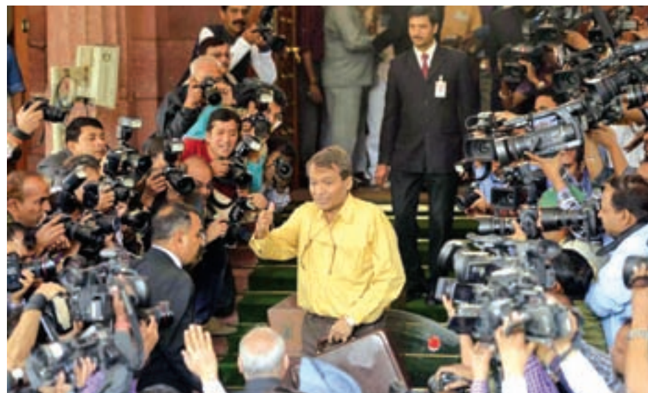
Indian Railway minister Suresh Prabhu (C) holds the briefcase containing the railway budget for the year 2015-16 upon arrival at the parliament in New Delhi, India, on 26 Feb, 2015. India's railway budget, to be presented later on Thursday, will signal the direction of long-term reforms needed to revamp the world's fourth-largest rail network, Prabhu said.

The Indian prime minister has hailed the budget,