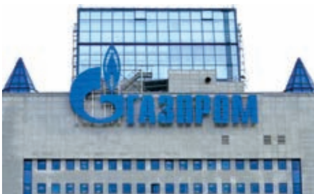
The Gazprom logo is seen on the side of the company's headquarters in Moscow, on 24 Feb, 2015.

Moscow, 26 Feb — Kremlin-controlled Gazprom said on Thursday it would exempt gas supplies to rebel-held regions from its main contract with Ukrainian Naftogaz, days before Kiev uses up gas volumes it has already paid for. The