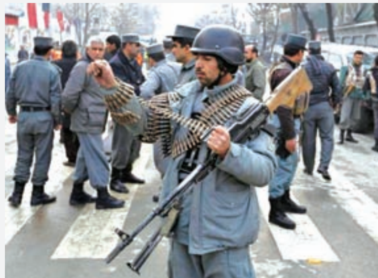
Afghan policemen stand at the site of a suicide attack in Kabul on 26 Feb, 2015.