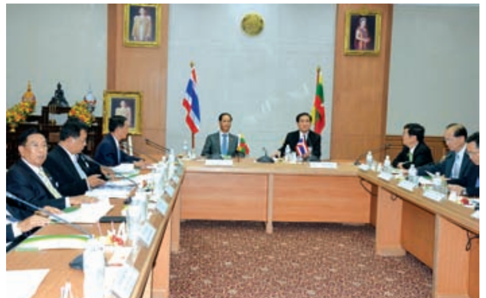
Vice President Dr Sai Mauk Kham holds talks with Health Minister Prof Dr Rajata Rajatanavin of Thailand.