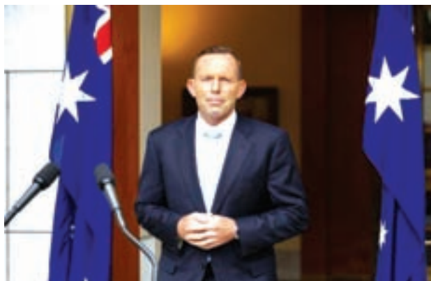
Australia's Prime Minister Tony Abbott addresses members of the media after a party room meeting at Parliament House in Canberra on 9 Feb, 2015.