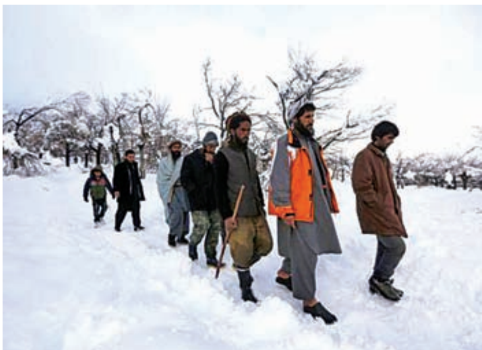
Relatives of avalanche victims return after conducting a search for the victims in Panjshir Province on 25 Feb, 2015.

KABUL, 26 Feb — More than 180 people have been killed in north Afghanistan in some of the worst avalanches there for 30 years, officials said on Thursday, with heavy snow set to last for two more days after an unusually dry winter led to fears of drought.