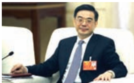
Zhou Qiang, President of China's Supreme People's Court,