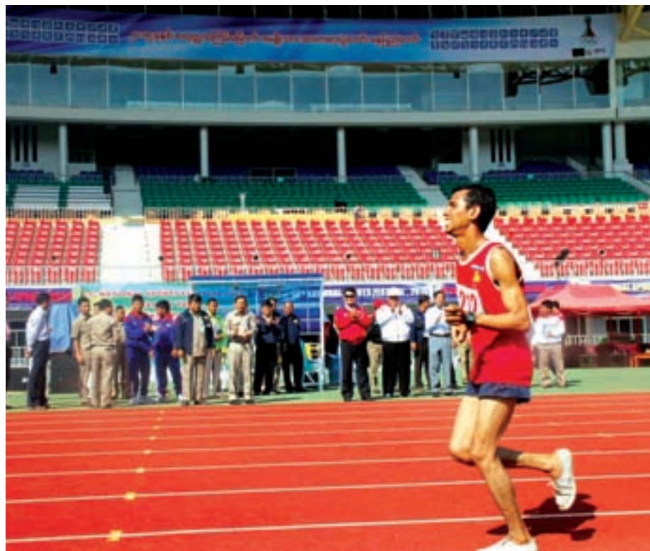
An athlete enters finishing line in men's marathon at Wunna Theikdi Stadium in Nay Pyi Taw.