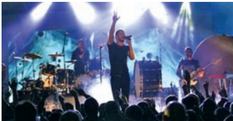
Imagine Dragons perform during the half-time show at the CFL’s 102 nd Grey Cup football championship between the Calgary Stampeders and the Hamilton Tiger Cats in Vancouver, British Columbia, on 30 Nov, 2014.

LOS ANGELES, 26 Feb — Alt-rockers Imagine Dragons knocked rapper Drake from the top spot of the weekly US Billboard 200 album chart on Wednesday, after a strategically placed commercial with retail store Target during the Grammy Awards drove up exposure.