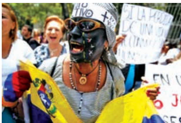
Opposition supporters shout during a gathering to protest the death of a student in Tachira State, in Caracas on 25 Feb, 2015.

"My son was neither an opposition supporter nor