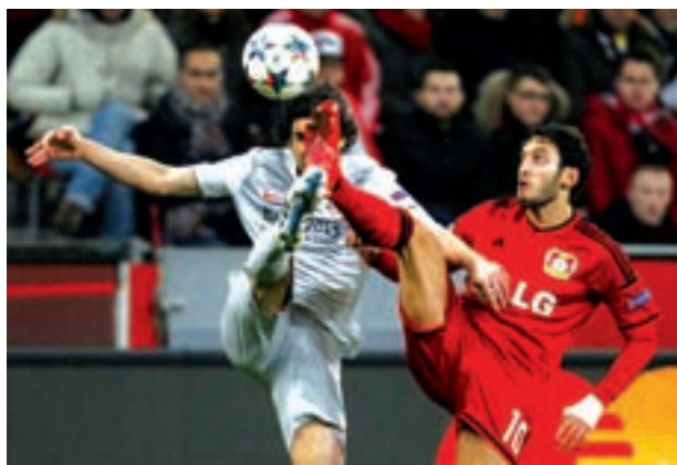
Bayer Leverkusen's Hakan Calhanoglu challenges Atletico Madrid's Tiago Mendes (L) during their Champions League round of 16, first leg soccer match in Leverkusen on 25 Feb, 2015.

The Spaniards needed almost 40 minutes to find their feet and responded