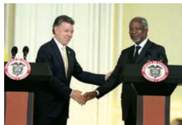
Colombia's President Juan Manuel Santos (L) shakes hands with former UN Secretary-General Kofi Annan at the presidential palace in Bogota on 23 Feb, 2015.

BOGOTA, 26 Feb — Those responsible for crimes committed during Colombia's 50-year war must be held accountable as part of a peace deal between the government and Marxist rebels, ex-United Nations Secretary General Kofi Annan said on Wednesday.