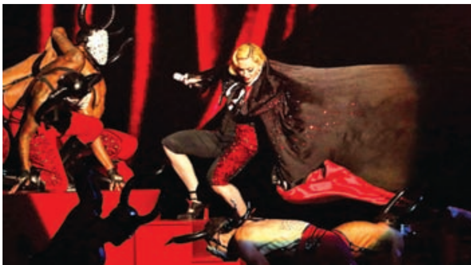
Madonna stumbles whilst performing on stage during the Brit Awards 2015 at the O2 Arena in London, on 25 Feb, 2015.