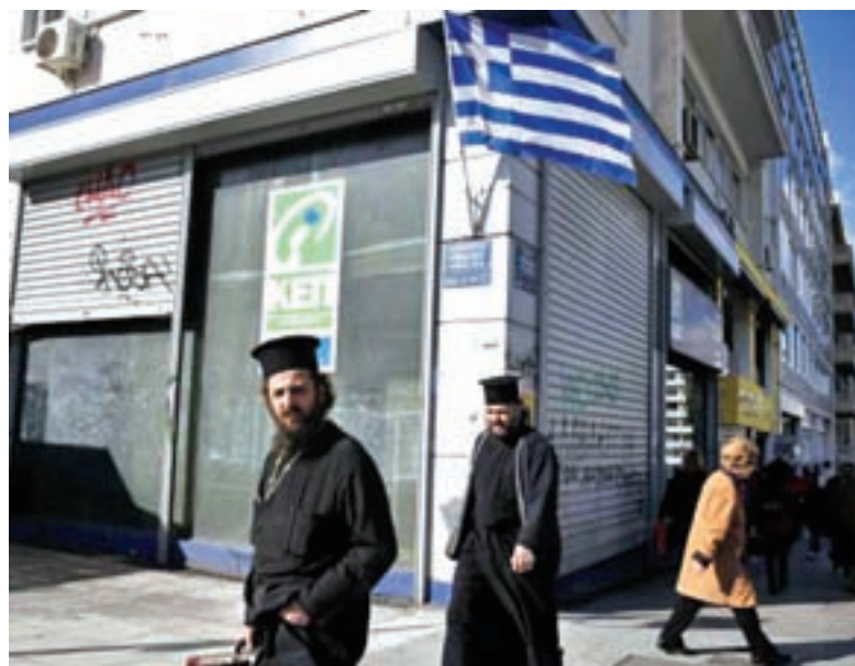
A Greek national flag flutters as Greek Orthodox priests make their way on main Constitution (Syntagma) square in Athens on 25 Feb, 2015.

The coalition has a big enough majority to easily win the vote on Friday to extend the rescue by four months. Still, many lawmakers, including Finance Minister Wolfgang Schäuble, have expressed concern in recent days about whether Athens can be counted on to stick to its reform promises.—Reuters