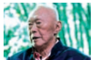
Singapore's former Prime Minister Lee Kuan Yew

SINGAPORE, 26 Feb — Singapore's elder statesman Lee Kuan Yew is still in the intensive care unit of a hospital three weeks after being admitted with severe pneumonia, the government said on Thursday.