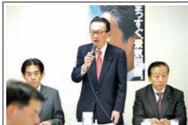
Hajime Funada (C), head of the Liberal Democratic Party’s taskforce to promote constitutional change, speaks during a meeting in Tokyo on 26 Feb, 2015, to discuss the issue of amending the supreme law. Funada and Prime Minister Shinzo Abe have agreed that a constitutional change should be proposed following an upper house election to be held in the summer of 2016.

More than 100,000 people have been punished for violating the law since 1953.