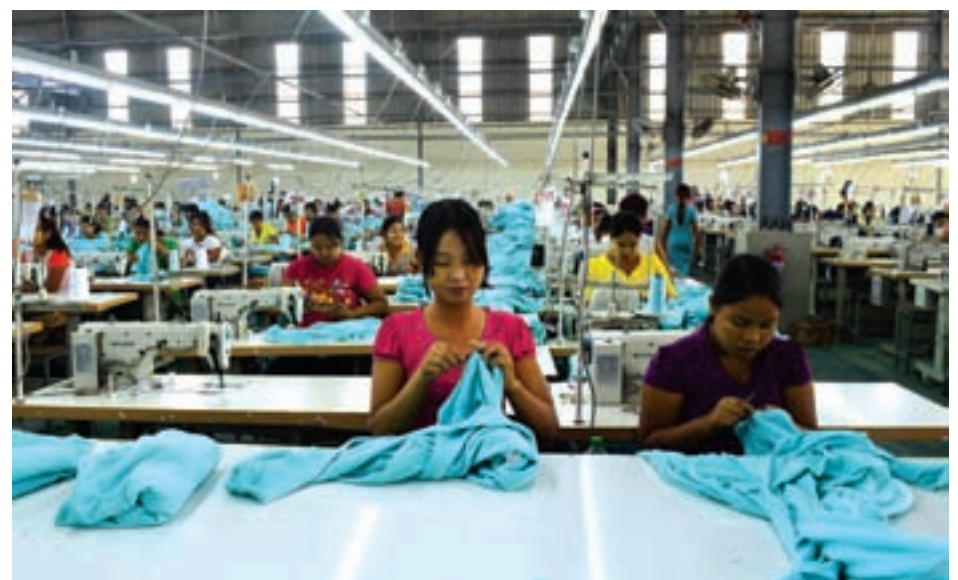
Female workers at production of textile at Ford Glory Garment Factory in Shwepyitha Industrial Zone.