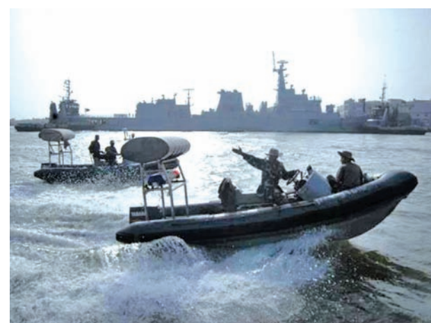
Pakistan Navy personnel keep guard near the Navy ship PNS Zulfiqar after it returned to Karachi on 23 June, 2011.

Analysts say the move is part of al-Qaeda's plan to take advantage of the planned withdrawal of US-led forces from Afghanistan and boost its influence in the Afghanistan-Pakistan