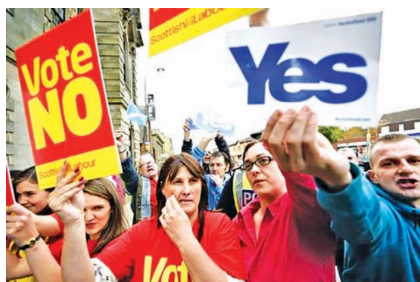
Pro and anti-independence supporters wave posters outside a campaign event in favour of the union in Clydebank, Scotland on 16 Sept, 2014.

All three polls showed nationalists had gained ground, but the fact that supporters of the union were ahead in the polls prompted investors to buy the pound, extending sterling’s gain against the US dollar.