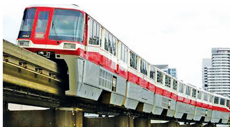
Rail cars painted to reproduce the 500 series Tokyo Monorail cars introduced in 1969 run as part of a "parade" of six types of rail cars previously and currently in service on 17 Sept, 2014, to commemorate the 50th anniversary of the monorail linking Tokyo's Haneda airport with the downtown area.—KYODO NEWS

The oldest monorail route currently in operation in Japan is at Tokyo's Ueno Zoo, which was constructed as a suspension system monorail in 1957.—Kyodo News