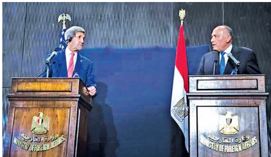
US Secretary of State John Kerry (L) listens to Egypt's Foreign Minister Sameh Shoukry during a joint news conference in Cairo on 13 Sept, 2014.

"We did not discuss this and no one asked this of us. We always say that the mission of the Egyptian army is to protect the Egyptian people and the coun-