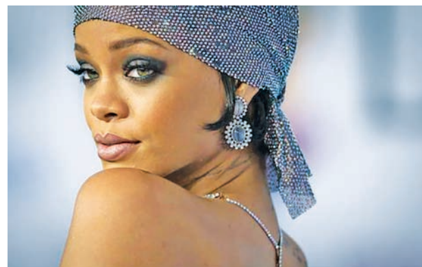
Singer Rihanna arrives for the Council of Fashion Designers of America Awards (CFDA) at Lincoln Center in New York in this on 2 June, 2014.

LOS ANGELES, 17 Sept — R&B singer Rihanna's record label on Tuesday said it has refused to license a song to CBS for its "Thursday Night Football" programme after the TV network chose not to use the song in its season opener because it was focused on the NFL's domestic violence scandal.