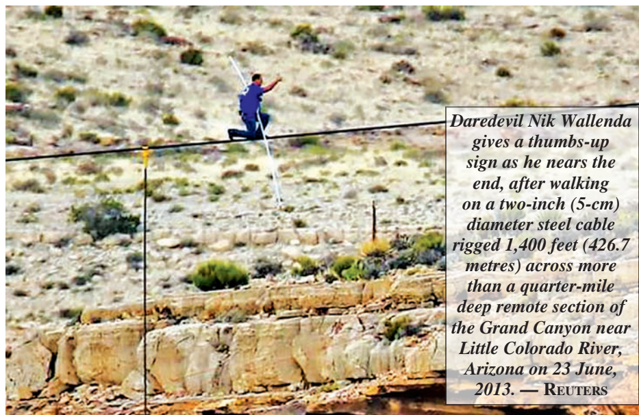
Daredevil Nik Wallenda gives a thumbs-up sign as he nears the end, after walking on a two-inch (5-cm) diameter steel cable rigged 1,400 feet (426.7 metres) across more than a quarter-mile deep remote section of the Grand Canyon near Little Colorado River, Arizona on 23 June, 2013.