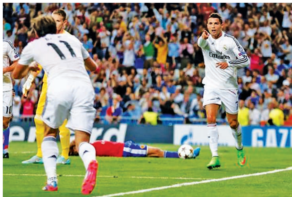
Real Madrid's Cristiano Ronaldo celebrates a goal with his teammate Gareth Bale (L) during their Champions League match against FC Basel at Santiago Bernabeu stadium in Madrid on 16 Sept, 2014.

MADRID, 17 Sept — Holders Real Madrid chased away some of their early-season blues when Gareth Bale scored the pick of the goals as the record 10-times winners routed FC Basel 5-1 in their Champions League Group B opener on Tuesday.