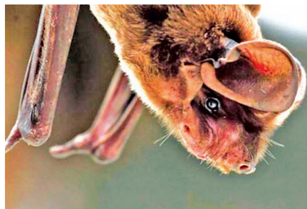
An injured Florida bonneted bat recuperates at Zoo Miami, in this handout picture taken in 2014 and provided by Zoo Miami. — REUTERS

Unlike the Oculus Rift, the Totem features front-facing video cameras that allow a user to switch their view to real life or mix real and virtual worlds and lenses that can be adjusted for various sight strength, Nepveu said. — Reuters