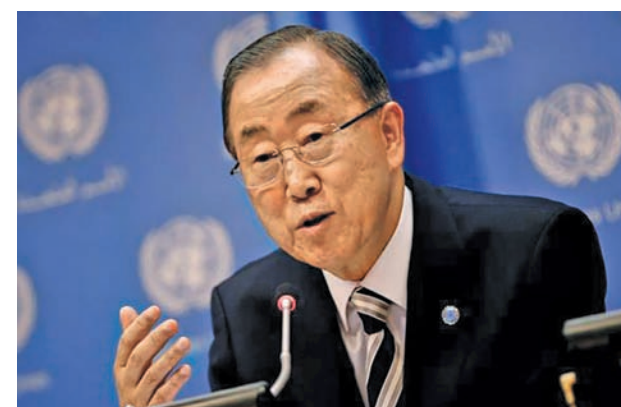
United Nations Secretary General Ban Ki-moon speaks at a news conference ahead of the 69th United Nations General Assembly at UN headquarters in New York, on 16 Sept, 2014.

Many Western states no longer recognise the government of Syrian President Bashar al-Assad as a legitimate authority but diplomats said it was unclear whether the opposition Syrian National Coalition would have the legal authority to invite military