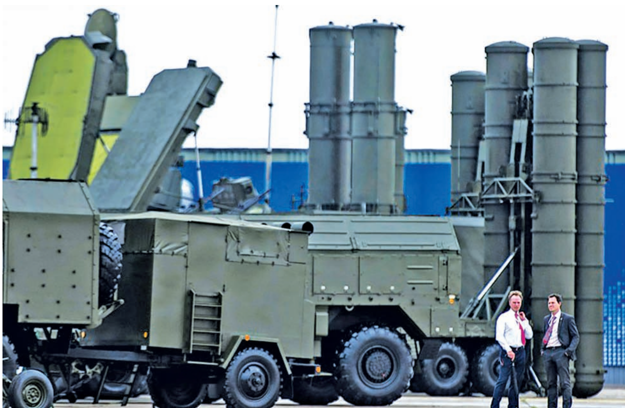
Military defence spending will rise in 2015 by 21.2%.

Moscow, 17 Sept — Russian military expenditures will grow in 2015 as it was planned despite foreign and domestic economic problems mainly thanks to weapons purchases, business news daily Vedomosti reported on Wednesday with reference to an explanatory note to the draft federal budget for 2015-2017. Military defence spending will rise in 2015 by 21.2% on 2014 to reach $78 bln.