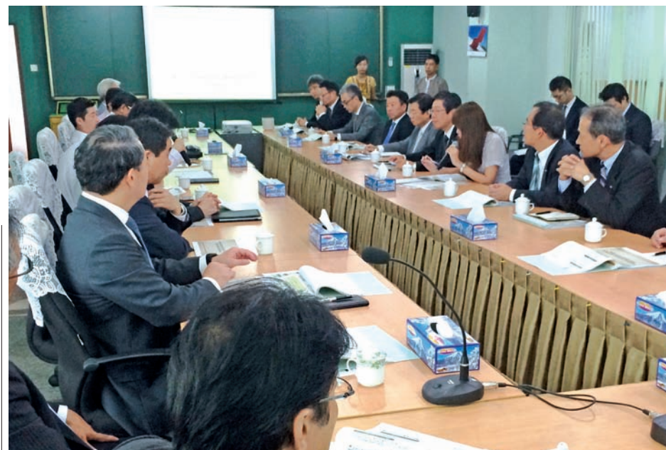
Delegation of Sumitomo Mitsui Banking Corporation holds talks with responsible persons of Myanmar Industries Association on Tuesday.

Japanese bank. Other than UMFCCI, the delegation visited MIA and several local companies to discuss possible investments from Japan and their underlying issues. The delegation also visited Thilawa SEZ and its One-Stop Service Center and discussed operational procedures related to investment into Thilawa.