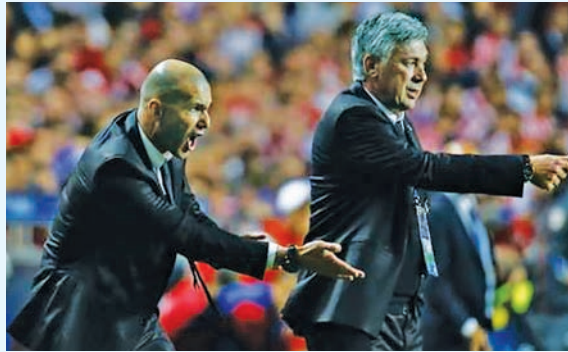
Real Madrid's coach Carlo Ancelotti (R) and his assistant Zinedine Zidane shout at their players during their Champions League final soccer match against Atletico Madrid at Luz stadium in Lisbon, May 24, 2014.

PARIS, 17 Sept — Former France great Zinedine Zidane, who helped Les Bleus win the 1998 World Cup on home soil, has hinted he could be interested in coaching the national team.