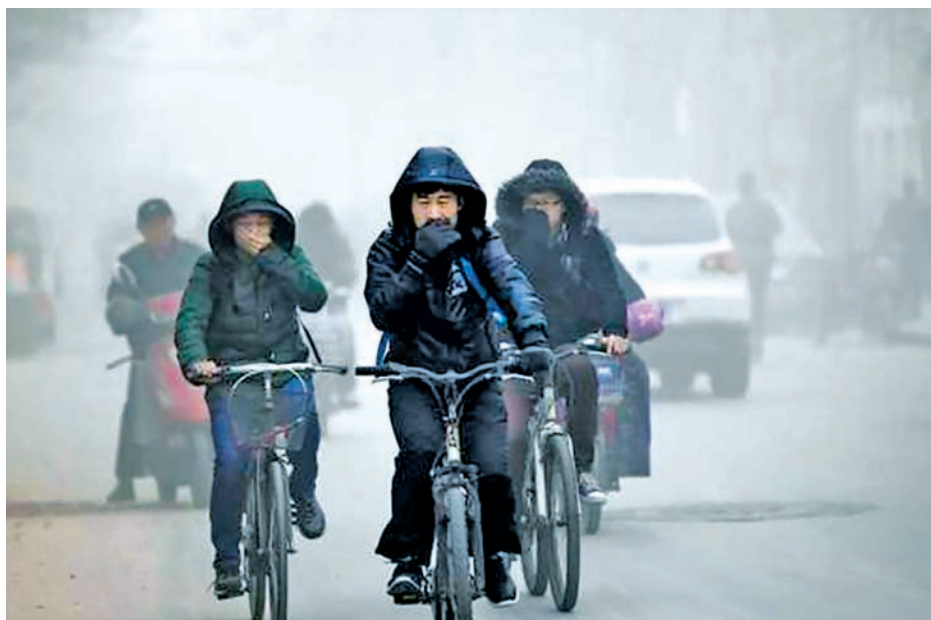
Residents cover their face from dust as they ride their bicycles along a street on a hazy day in Zhengzhou, Henan Province on 10 Dec, 2013.—REUTERS

"We particularly need to take rapid action on things that support sustainable development for low and moderate income countries so that they can realise their economic aspirations."—Reuters