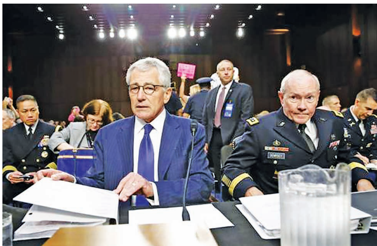
US Secretary of Defence Chuck Hagel (L) and Chairman of the Joint Chiefs of Staff Gen Martin Dempsey testify during the Senate Armed Services Committee hearing on US policy toward Iraq and Syria and the threat posed by the Islamic State on Capitol Hill in Washington on 16 Sept, 2014.

"But he has told me as well to come back to him