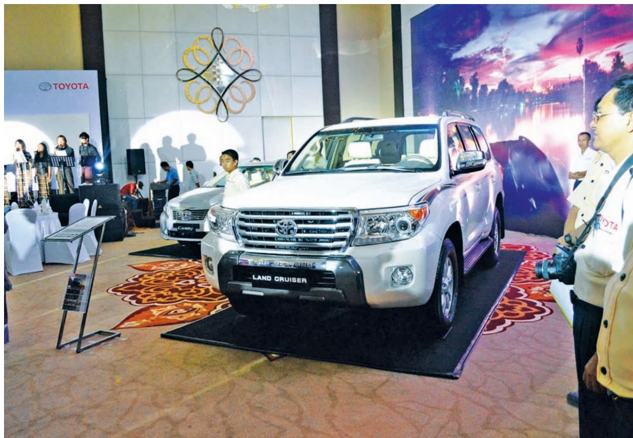
Aye & Sons Services Ltd. and TTAS Co., Ltd organize "Brand New Car Sales Launch Party" at Sedona Hotel in Yangon, introducing new Toyota cars to the people of Myanmar where Toyota established its brand presence in the country with the first imported Toyota ( J 20 ) in 1958.