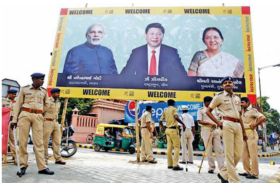
Police personnel stand guard in front of a boarding with images of (L-R) India's Prime Minister Narendra Modi, China's President Xi Jinping and Anandiben Patel, Chief Minister of the western Indian state of Gujarat, ahead of Xi's arrival in Ahmedabad on 16 Sept, 2014.

"As the two engines of the Asian economy, we need to become cooperation partners spearheading growth," Xi wrote in a column in The Hindu newspaper. He said China's strong manufacturing base and India's software and scientific skills had massive potential both