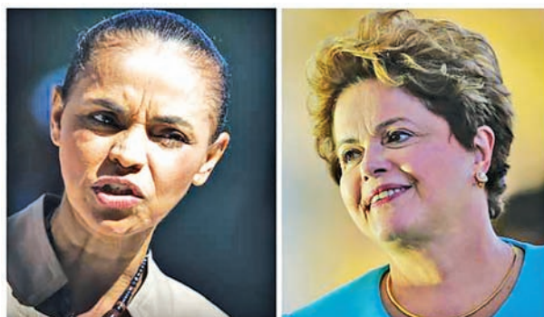
A combination picture of two file photos shows Brazil's presidential candidates Marina Silva (L) of the Brazilian Socialist Party (PSB) in Sao Paulo, and Dilma Rousseff (R) of the Workers' Party (PT) in Brasilia.—REUTERS

Brazil's benchmark Bovespa stock index rose as much as 3.96 percent in Tuesday trading and closed 2 percent higher on speculation that the Ibope poll would show gains for Silva.—Reuters