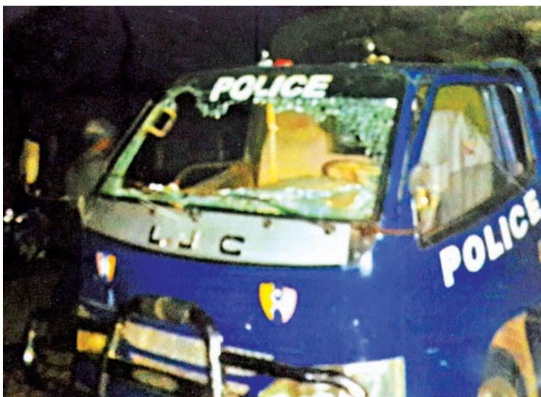
Photo displayed at the press conference shows a police car with its wind shield crashed by people who gathered near the factory.

Regarding the closure of the factory, which opened a year ago in the Hlinethaya Industrial Zone, Master Sports Myanmar Co Ltd issued an announcement at the beginning of July, saying the factory was experiencing financial problems due to the production of low-quality products that were not marketable, adding that agreements with potential buyers had to be revoked.—NLM