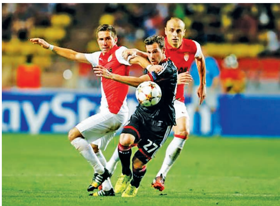
AS Monaco's Joao Moutinho (L) and Dimitar Berbatov (R) fight for the ball with Bayer Leverkusen's Gonzalo Castro during their Champions League Group C soccer match at Louis II stadium in Monaco on 16 Sept, 2014.

Monaco were struggling to keep Leverkusen at bay and Layvin Kurzawa and Yannick Ferreira Carrasco were both booked before the break, which Monaco were grateful to reach at 0-0. It was Leonar-