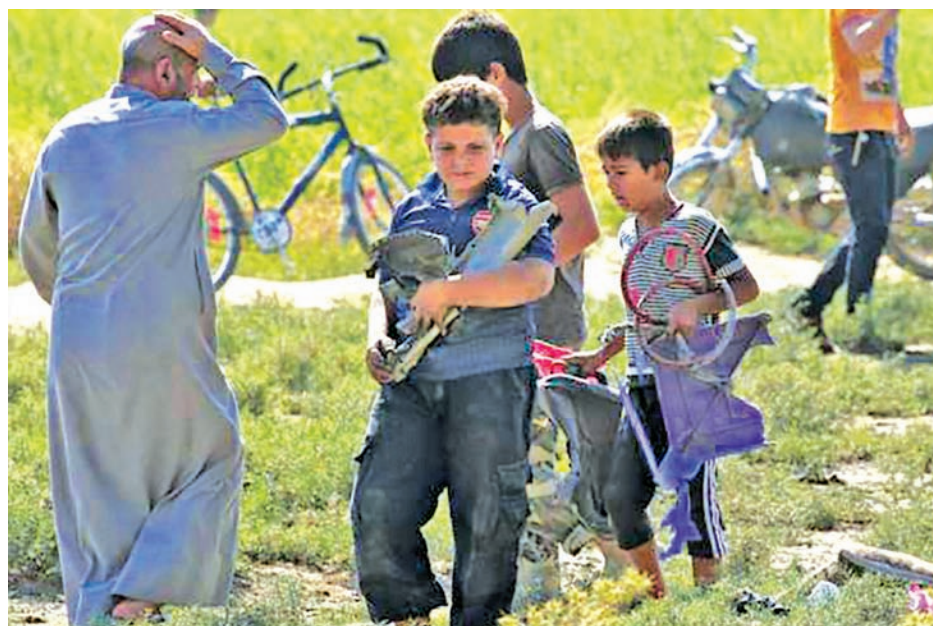
Children carry pieces of the wreckage of a war plane that crashed on the outskirts of Raqqa in northeast Syria on 16 Sept, 2014.