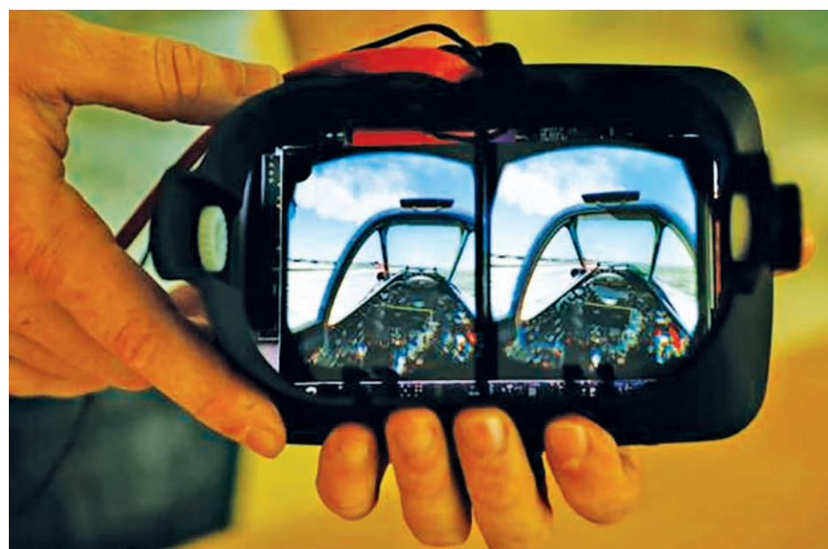
The stereoscopic view of an airplane cockpit is seen after the lenses are removed from a Vrvana virtual reality headset in Toronto on 12 Sept, 2014.

Nepveu said beyond games, the Totem could be