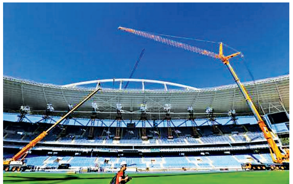
A view of the Joao Havelange Olympic Stadium, undergoing renovation to stage athletic competitions during the Rio 2016 Olympic Games, during the 2 nd world press briefing for the games in Rio de Janeiro on 6 Aug, 2014.