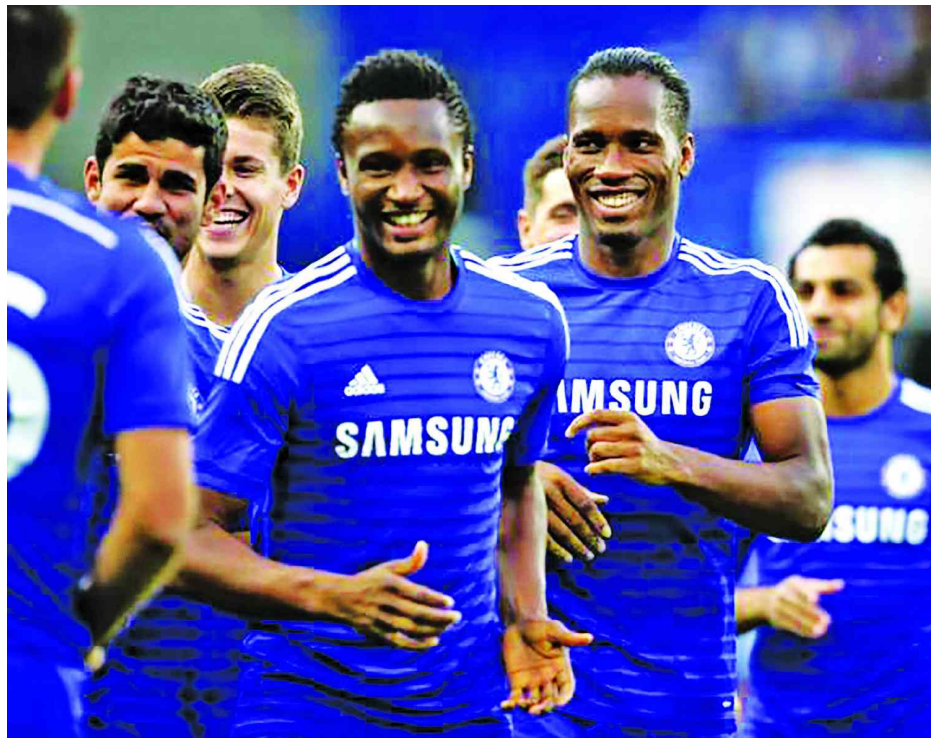
Chelsea's Didier Drogba (R) runs with his teammates as they warm up before their friendly soccer match against Real Sociedad at Stamford Bridge in London on 12 Aug, 2014.

LONDON, 16 Aug — Didier Drogba praised an Oscar performance on Friday when the returning Chelsea great was handed the number 11 shirt he made famous during his first spell at Stamford Bridge.