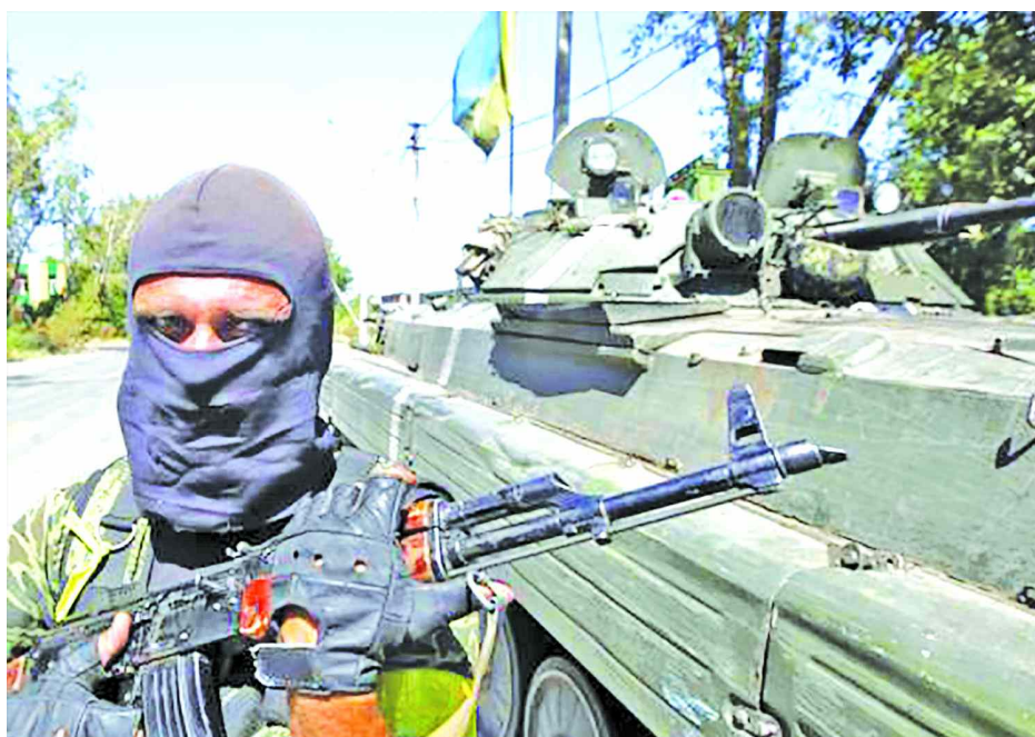
A Ukrainian serviceman guards a checkpoint outside Donetsk on 15 Aug, 2014.

In a call to US Defence Secretary Chuck Hagel, as reported by Russia’s state news agency RIA , Defence Minister Sergei Shoigu said Moscow was “seriously concerned” by increased NATO activity and called for a ceasefire to get aid into Ukraine. The agency did not specify what Western military movements he meant. The Pentagon said in a statement that Hagel had sought clarification about the Russian convoy during the phone call and was “guaranteed” it did not include Russian military personnel and would not be used as a pretext for inter-