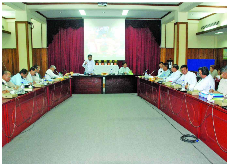
Union ministers discuss formation of region and state scouts associations, school and university scouts associations and opening of head office and scout equipment shop in Yangon.—MNA