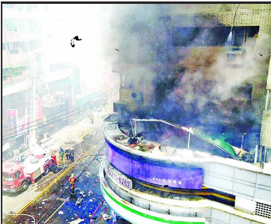
Firemen work at the site of a gas blast in New Taipei, southeast China's Taiwan, on 15 Aug, 2014. A gas explosion killed at least one person and injured 14 in the city of New Taipei in Taiwan on Friday.