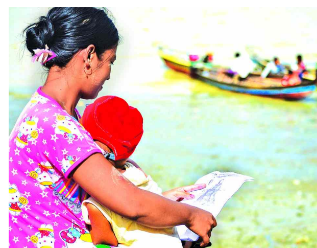
A mother with a child who is also among spectators on the riverbank looks at the sketch of Dhammazedi Bell.