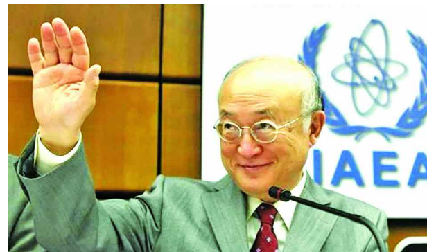
International Atomic Energy Agency (IAEA) Director General Yukiya Amano