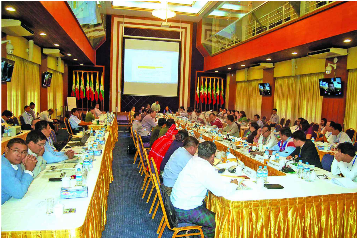
Union Peacemaking Working Committee focuses on nationwide ceasefire with ethnic armed groups for enabling entire people to enjoy peace and tranquillity.—MNA

YANGON, 16 Aug — Government's peace negotiation team and the ethnic armed groups reached agreements on the major controversial issues in the