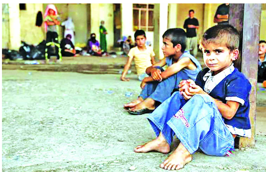
Displaced children from the minority Yazidi sect, fleeing violence in the Iraqi town of Sinjar west of Mosul, take refuge at Dohuk Province on 15 Aug, 2014.

Yet amid the signs that political accords were possible in the fractious nation, some 80 members of Iraq's