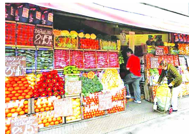
A customer buys vegetables at a greengrocer shop in Buenos Aires on 31 July, 2014.