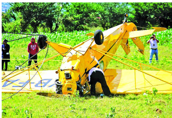
People gather at the scene where a small plane crashed in a farm field in front of La Salle University, in Santa Cruz Xoxocotlan township, Oaxaca state, Mexico on 15 Aug, 2014.