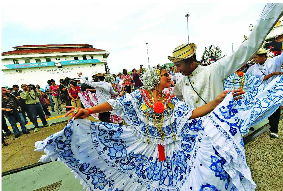
Dancers take part in the commemoration of the 100 th anniversary of the Panama Canal, at the Miraflores Locks, in Panama City, capital of Panama, on 15 Aug, 2014. Panama celebrated the 100 th anniversary of its canal with a ceremony and gala on Friday. The canal, an engineering masterwork that transformed global commerce, opened on 15 Aug, 1914, connecting the Atlantic and Pacific Oceans.

A highlight of the ceremony was an oversized cake bearing a replica of the Miraflores locks, where the event was taking place, complete with a passing ship whose