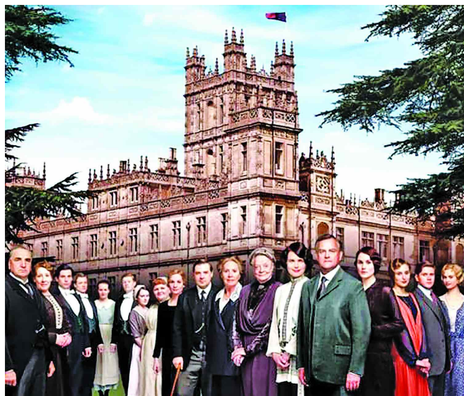
The cast of season 4 of Downton Abbey in an undated photo.

The top lot attracted a bid of 16,000 pounds for an overnight stay in rooms used during the filming of the first season as the guests of the Earl and Countess of Carnarvon, whose family