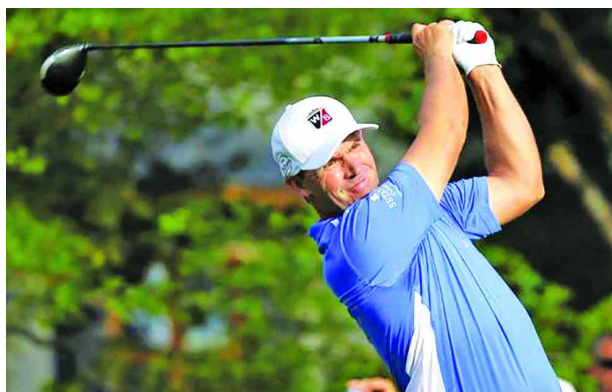
Padraig Harrington of Ireland tees off on the 10 th hole during the first round of the 2014 PGA Championship at Valhalla Golf Club in Louisville, Kentucky on 7 Aug, 2014.

"My expectations were very high this week," he said. "I didn't play well. I just can't get out of my own way. I'm certainly working on some good things but it will probably happen when I least expect it."—Reuters