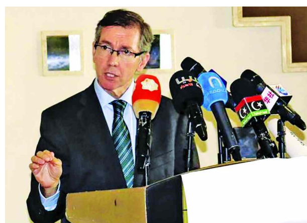
European Union envoy, Bernardino Leon

A statement by his office said Leon's Tripoli visit for talks would be conducted with the United Nations