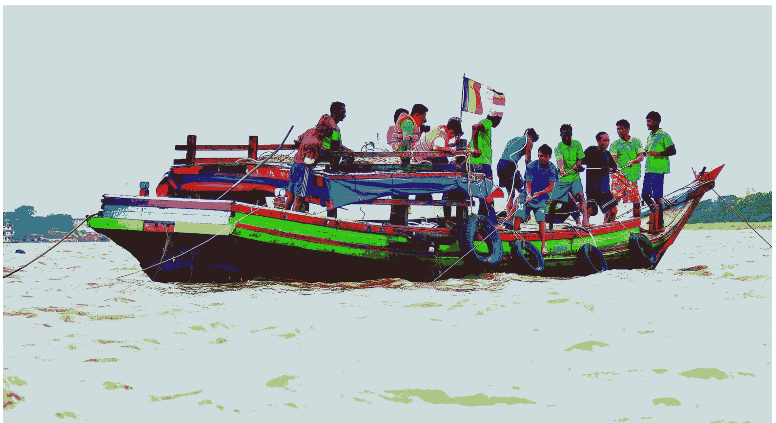
A salvage team in action in their search for one of the world biggest bell called Dhammazedi Bell.