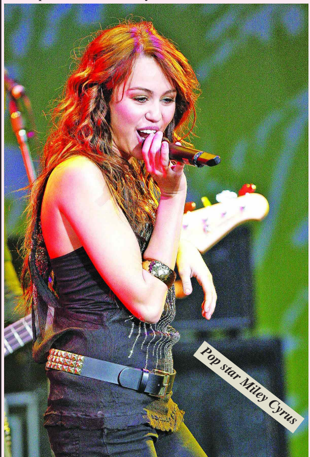
Pop star Miley Cyrus

"It was like a tornado hit the lobby. Miley and her posse took over, screaming and carrying on so much that management received a number of complaints," a source said. "Led by Miley, someone in the group was smoking pot, and they were swearing loudly and throwing themselves all over the expensive furniture," it added. Cyrus reportedly told staff who asked her to be quieter they "should be glad to have her" because she has "spent so much money there".—Reuters