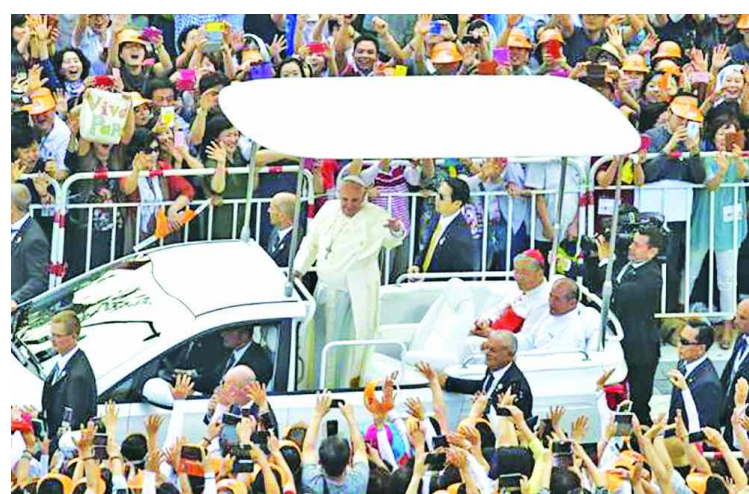
Pope Francis (C) waves to Catholic worshippers as he arrives to lead a mass at Gwanghwamun square in central Seoul on 16 Aug, 2014.

"Their example has much to say to us who live in societies where, alongside immense wealth, dire poverty is silently growing; where the cry of the poor is seldom heeded and where Christ continues to call out to us, asking us to love and serve him by tending to our brothers and sisters in need," he said. It was a theme the pope has been repeating since he arrived in South Korea on Thursday for his first trip to Asia since his election