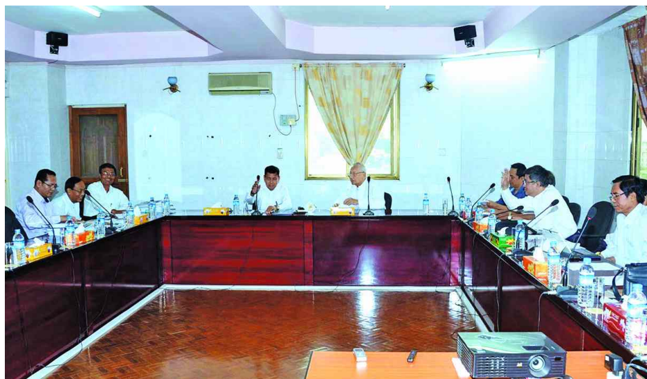
Union Minister U Ye Htut focuses on greater cooperation in implementing the country's media reforms in meeting with responsible persons of Myanmar Press Council (Interim).—MNA

YANGON, 16 Aug—Union Minister for Information U Ye Htut met with Vice Chairman U Khin Maung Lay (Po Thaw Kyar) and Secretary U Kyaw Min Swe