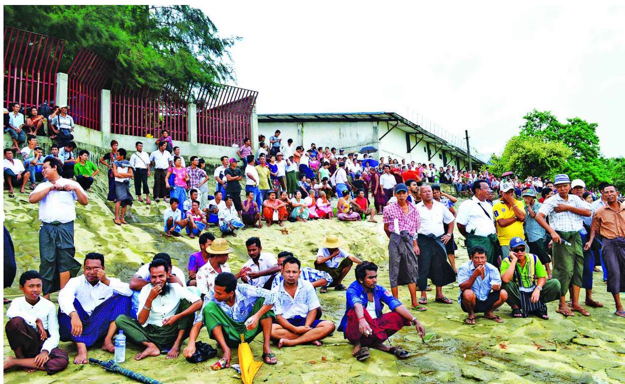
Enthusiasts watch efforts of search team working to salvage 270-ton cast bronze bell, which experts believe may be one of the largest bells in the world.