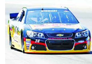
NASCAR Sprint Cup Series driver Tony Stewart (14) during practice for the Cheez-It 355 at Watkins Glen International on 9 Aug, 2014.

A track safety official would then direct the driver to leave the car and walk directly to an ambulance or other vehicle. The new rule puts into the books