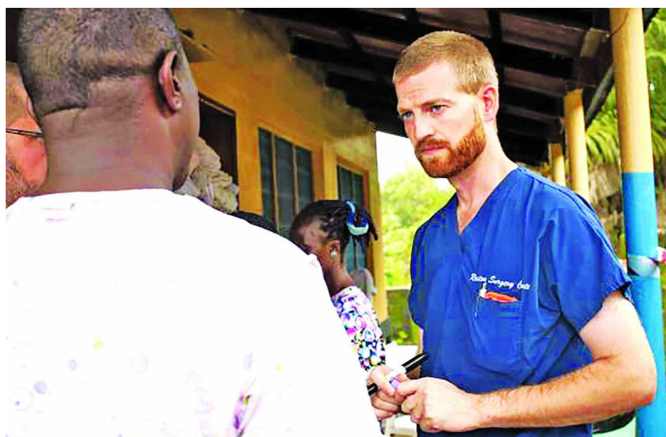
Dr Kent Brantly (R) speaks with colleagues at the case management centre on the campus of ELWA Hospital in Monrovia, Liberia in this undated handout photograph

WINSTON-SALEM, (NC), 16 Aug —The Texas doctor being treated for Ebola said on Friday that he was "recovering in every way" at an Atlanta hospital and hoped to be released soon.