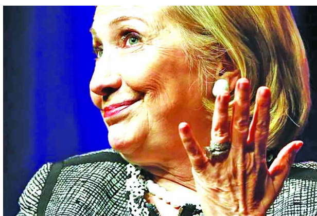
Former US Secretary of State Hillary Clinton reacts to a question as she discusses her new book "Hard Choices: A Memoir" at George Washington University in Washington on 13 June, 2014.

The respected broadsheet quoted German government sources saying the conversation had been picked up "by accident" and was not part of any plan to spy on Washington's top diplomat. The fact the recording had not been destroyed immediately was "idiocy", said one of the