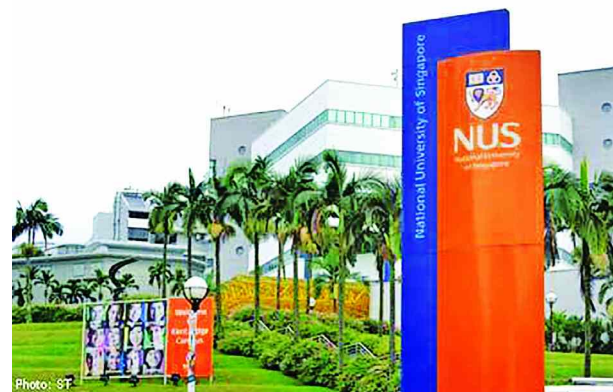
Photo of the National University of Singapore.