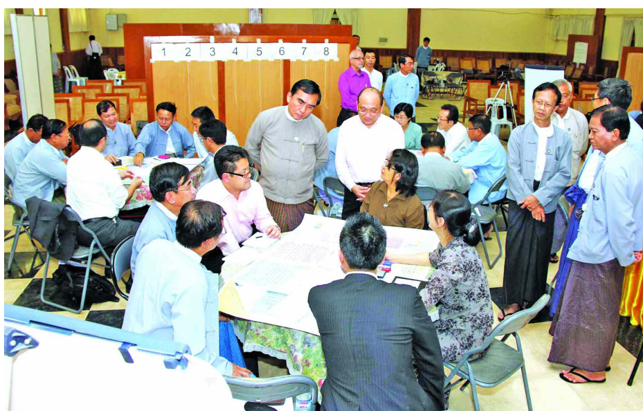
Union Minister U Myat Hein views drawing marketing strategies for telecommunications in Myanmar.

NAY PYI TAW, 16 Aug —A training course on marketing strategies for telecommunication sector is being conducted here for the staff of Myanma Posts and Telecommunications under the Ministry of Communications and Information Technology.