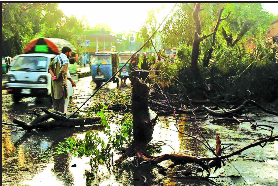
A tree falls on the road after heavy rain in northwest Pakistan's Peshawar, on 15 Aug, 2014. At least 13 people were killed and 55 others injured in two separate accidents caused by wind storms in Pakistan's northwest Peshawar city on Friday evening, local media reported.—XINHUA

Emergency relief aids were sent to the affected people, said Sutopo. Seasonal downpours have often incurred floods each year in Indonesia, a chain of 17,500 islands where over millions of people live in vulnerable flood plains that are near to rivers.—Xinhua