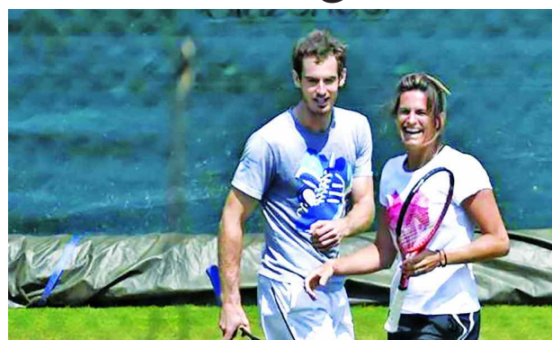
Amelie Mauresmo, newly appointed coach of Britain's Andy Murray, joins Murray for a training session at the Wimbledon Tennis Championships, in London on 1 July, 2014.

SINGAPORE, 16 Aug — Men's tennis will see a flurry of women coaches after Andy Murray broke down a gender barrier by hiring Amelie Mauresmo, says 18-times grand slam singles champion Martina Navratilova who is open to tutoring men.