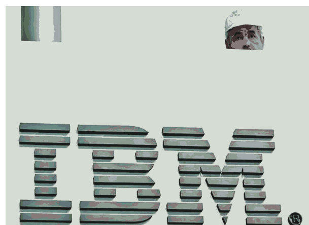
A worker is pictured behind a logo at the IBM stand on the CeBIT computer fair in Hanover on 26 Feb, 2011.

CFIUS, an interagency group chaired by the Treasury Secretary, reviews deals that could bring US businesses under foreign ownership and is required by law to assess any transaction involving a state-owned firm. Lenovo said in a statement that it remains on track to close the IBM server deal by the end of the year. Analysts say Lenovo will likely find it easier than IBM to sell the x86 servers to Chinese companies as Beijing tries to localize its IT purchases in the wake of revelations about US surveillance.— Reuters