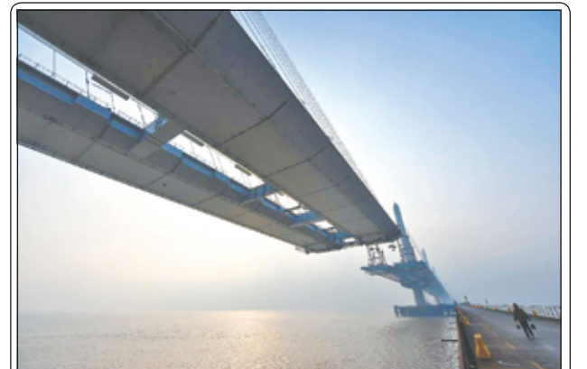
Photo taken on 2 Jan, 2013 shows the under-construction Jiaxing-Shaoxing Sea-Crossing Bridge in Haining, east China's Zhejiang Province. The Jiaxing-Shaoxing Sea-Crossing Bridge, which will be the second sea-crossing bridge of Zhejiang Province, is expected to halve the driving time from Shaoxing to Shanghai in east China after putting into use in June of 2013.

other damages during this New Year eve, although 53,000 policemen and gendarmes were mobilized across the country to secure safety places where hundreds of thousands of people were gathered for the New Year celebration, accidents still occurred as earlier reports said that a total of 1,193 vehicles were burnt on the New Year's eve in France.—Xinhua