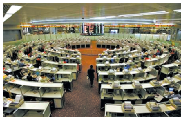
A trader walks at the Hong Kong Stock Exchange during morning trading on 15 Dec, 2011.