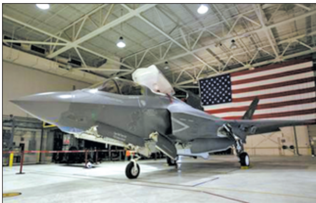
A F-35 Lightning II Joint Strike Fighter is seen at the Naval Air Station (NAS) Patuxent River, Maryland on 20 Jan, 2012.