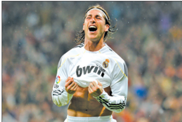
Real Madrid defender Sergio Ramos