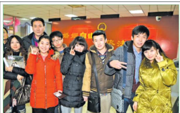
Couples pose for a photo at the marriage registration office in Changchun, capital of northeast China's Jilin Province, on 4 Jan, 2013. Many couples here chose to tie the knot on 4 Jan, 2013, or 2013/1/4, which sounds like "Love you forever" in Chinese.—XINHUA

The two neighbours have had sporadic border conflicts over territorial dispute near Cambodia's Preah Vihear Temple since the UNESCO listed the temple as a World Heritage Site on 7 July, 2008, but Thailand claims the ownership of 4.6 square kilometers of scrub next to the temple.—Xinhua