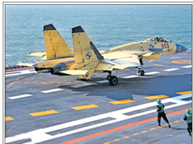
Photo shows a J-15 taking off from China's first aircraft carrier.

A court spokesman said the court had not yet received the appeal.—Reuters