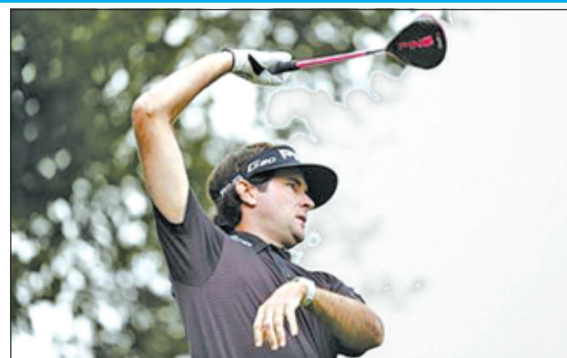
Bubba Watson of the US tees off on the second hole during the second round of the World Challenge golf tournament in Thousand Oaks, California, on 30 Nov, 2012.