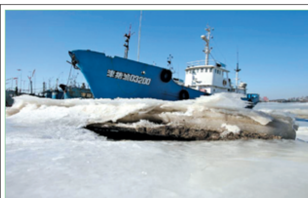
Photo taken on 3 Jan, 2013 shows the frozen sea surface at the Beitang port in north China's Tianjin Municipality. Sea ice continues to occur in some Chinese coastal provinces as a result of recent cold waves.

Indonesian air forces continues to develop accordingly with national strategic developments," he said in his remarks in the ceremony. He said that the new planes ready to serve the air forces' fleet this year consist of F-16 fighter jets, T-50 Super Tucano anti insurgent planes, CN-295 and C130 Hercules military cargo planes, Cougar Helicopters, KT-1 Woongbi trainer planes and Boeing 737-500. Besides new planes, the air forces is also expecting deliveries of new radars to enforce its early detection warning system.—Xinhua