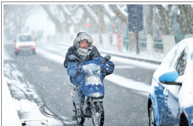
A citizen rides in snow on a street in Hangzhou, capital of east China's Zhejiang Province, on 4 Jan, 2013. A heavy snow hit many parts of Zhejiang on Friday.