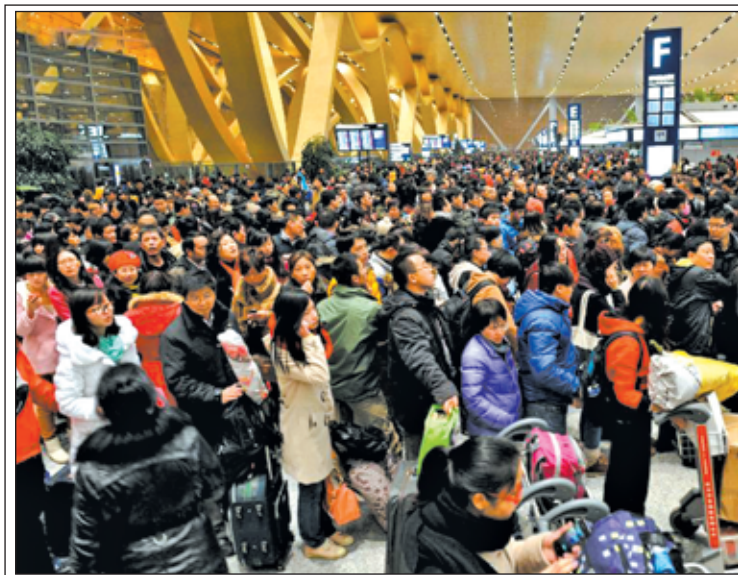
Passengers are trapped at Kunming Changshui International Airport in Kunming, capital of south-west China’s Yunnan Province, on 3 Jan, 2013. Affected by the dense fog, a total of 434 flights were cancelled and about 7,500 passengers were trapped in the airport until 9 pm Thursday.