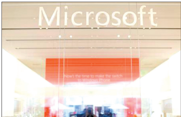
The interior of a Microsoft retail store is seen in San Diego on 18 Jan, 2012.