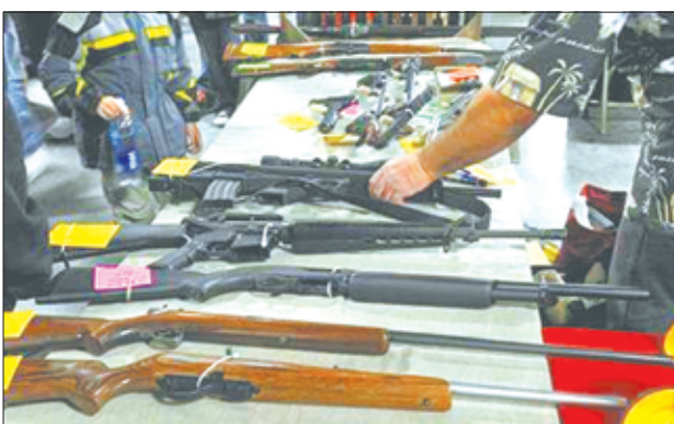
A dealer displays firearms for sale at a gun show in Kansas City, Missouri on 22 Dec, 2012.

Consumer demand for guns appears to have accounted for the uptick in activity. There were no changes in FBI background check procedures that would have affected the December numbers, FBI spokesman Stephen Fischer said. December is typically the busiest month of the year for checks, however, due in part to Christmas gift sales. The figures do not represent the number of firearms sold, a statistic the government does not track. They also do not reflect activity between private parties, such as family members or col-