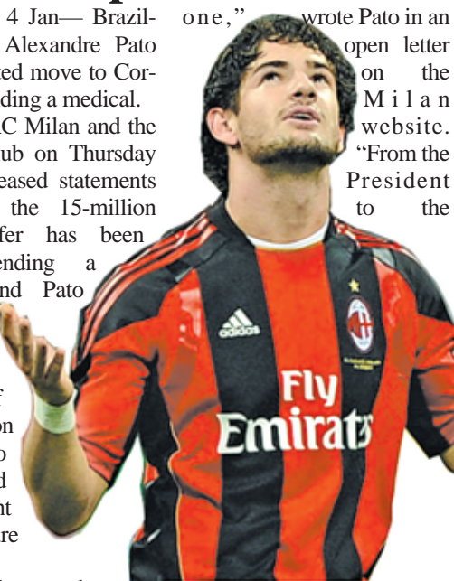
Brazilian striker Alexandre Pato

one," wrote Pato in an open letter on the Milan website. "From the President to the