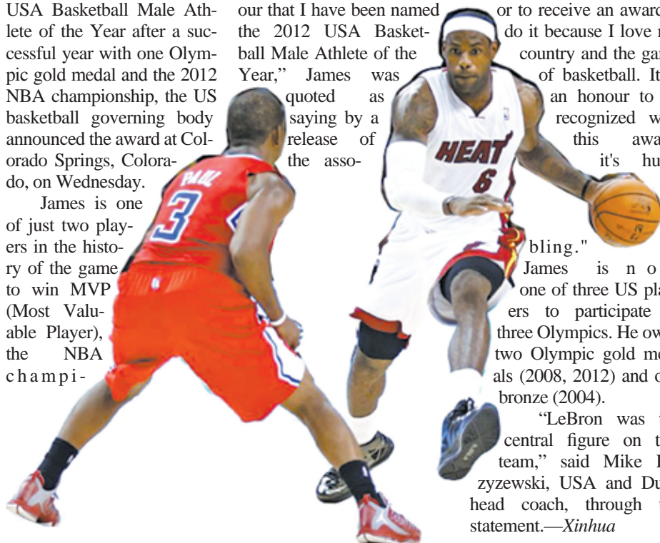
LeBron James (R) of Miami Heat drives the ball during the NBA China Games basketball game against Los Angeles Clippers in Shanghai, east China, on 14 Oct, 2012.

"LeBron was the central figure on this team," said Mike Krzyzewski, USA and Duke head coach, through the statement.—Xinhua