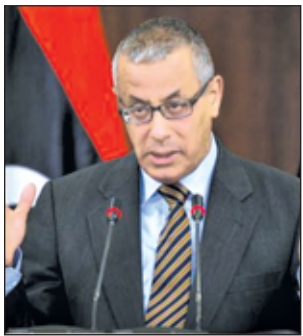
Libya's Prime Minister Ali Zeidan speaks during a news conference at the headquarters of the Prime Minister's Office in Tripoli, Libya on 3 Jan, 2013.

The corpse charred with hydrochloric acid and found in the Buhmeida