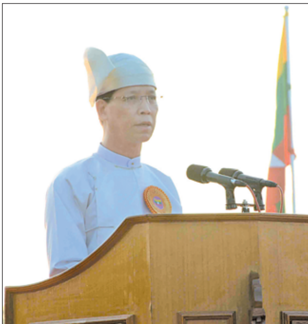
Vice-President Dr Sai Mauk Kham reads out the message sent by President U Thein Sein at State Flag-hoisting ceremony to mark 65 th Anniversary Independence Day.

NAY PYI TAW, 4 Jan—Over 30,000 people attended the State flag-hoisting and-saluting ceremony for 65 th Anniversary Independence Day (2013) held at the Nay Pyi Taw City Hall Square, here, this morning.