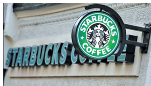
A sign is seen outside a Starbucks Coffee shop in central London on 3 Dec, 2012.