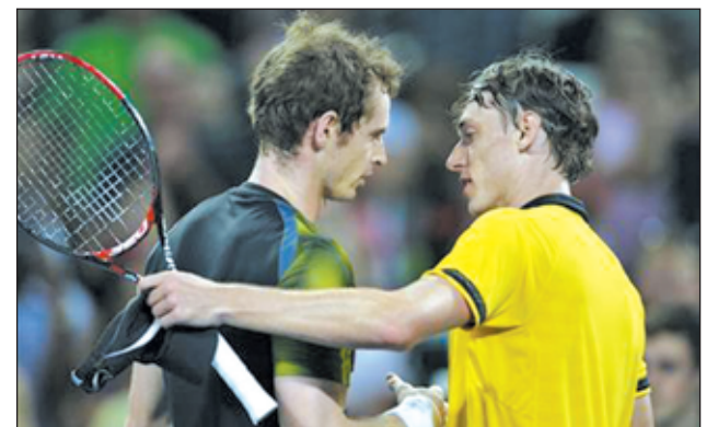
Andy Murray of Britain greets John Millman of Australia after their men's singles match at the Brisbane International tennis tournament on 3 Jan, 2013.