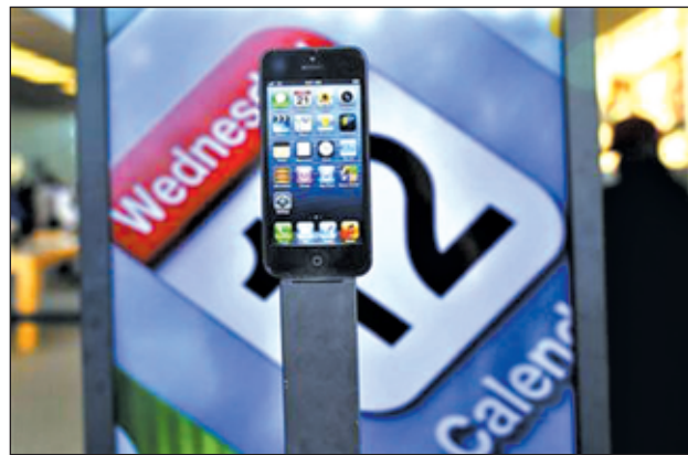
Apple's iPhone 5 is seen on display at the Apple store in Manhasset, New York on 21 Sept, 2012.

Apple launched iPhone 5 in September and it has been reported that the new iPhone will be released in the middle of 2013. Techradar.com reported last month that Apple could unveil the next version of its iPhone as early as the spring of 2013.—Reuters