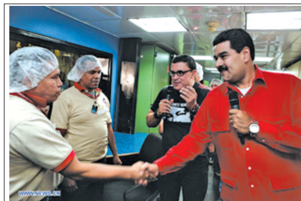
Image provided by Venezuela's Presidency shows Venezuelan Vice president Nicolas Maduro (R) greeting employees during an inspection to the coffee processing plant "Fama de America", in Caracas, Venezuela, on 3 Jan, 2013.

The record low mortgage rates have been acting as an important incentive for house refinancing and buying. With constant modest improvements recently, the US housing crash is said to have reached its bottom. However, many economists hold that the market still needs years to recover entirely as the bottom will be prolonged.—Xinhua