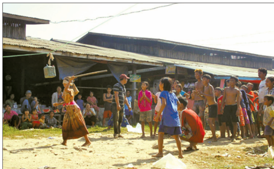
Children joyfully participate in funfairs to mark 65 th Anniversary Independence Day at their residence in Yangon.—MNA