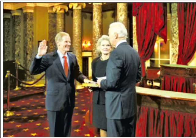
Sen Bill Nelson (D-FL)(L) raises his right hands while Vice President Joe Biden delivers the ceremonial swearing-in remarks in the Old Senate Chamber on Capitol Hill on Thursday, on 3 Jan, 2013. The new US Congress convened on Thursday with new members being sworn in.