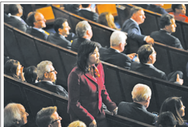
US Representative-elect Grace Meng (D-NY) attends the opening session of the 113th US Congress on Capitol Hill in Washington DC, capital of the United States, on 3 Jan, 2012. The new US Congress convened on Thursday with new members swearing in.—XINHUA

Ukraine's President Viktor Yanukovich said last week the economy is expected to grow by 1 percent in 2012, down from a previous estimation of 3.9 percent. According to the state budget of Ukraine for 2013, the nation's GDP will grow by 3.4 percent while inflation is expected to stand at 4.8 percent and deficit will be at 3.2 percent of GDP.—Xinhua