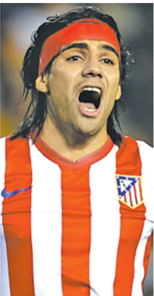
Cristiano Ronaldo, Leo Messi and Radamel Falcao

the Primera Liga will be the same trio that ended the year capturing headlines: Leo Messi, Cristiano Ronaldo and Radamel Falcao.