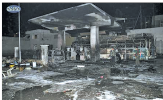
Men stand amidst wreckage and debris, after a car bomb exploded at a crowded petrol station in Barzeh al-Balad district in Damascus, in this handout photograph released by Syria’s national news agency SANA on 3 Jan, 2013.—REUTERS

After dramatic advances over the second half of 2012, the rebels now hold wide swathes of territory in the north and east, but they cannot protect towns and villages from Assad’s helicopters and jets. Hundreds of rebel fighters were attempting to storm the Taftanaz air base, near the highway that links Syria’s two main cities, Aleppo and Damascus.—Reuters