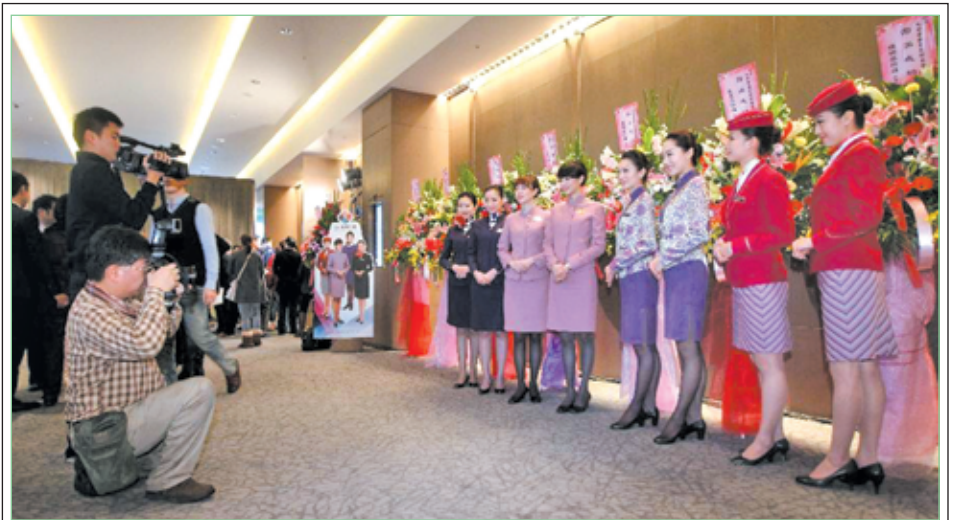
Airline stewardesses pose for group photos before the Press Conference in Taipei, on 3 Jan, 2013. China Southern Airlines, China Eastern Airlines, Xiamen Airlines from Mainland and China Airlines from Taipei on Thursday signed an cooperation contract and launched the "great China, fly together" programme, aiming at providing better services by sharing resources together.