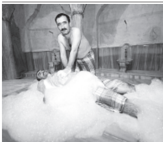
A man receives a bubble massage in a Turkish hamam named "Cemberlitas" as he takes a Turkish bath in Istanbul, Turkey, on 28 Dec, 2011.

of the Beijing municipal public security bureau, and its mission is to patrol the virtual society of the Internet and prevent harmful information from spreading, according to the statement. If the cyberpolice find harmful information being spread online, they will issue warnings to those who spread the information and handle the cases according to law, the statement said. In 2011, Beijing police cracked 2,600 Internet-related criminal cases, including Internet fraud and gambling, involving more than 2,600 suspects.— Xinhua