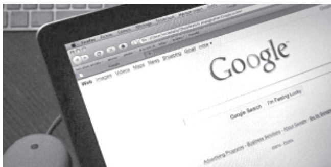
Google was the most visited US web brand in 2011.

Recently released statistics from data intelligence company Experian Hitwise found Facebook to be both the most searched for term and the most visited website in 2011. According to Experian Hitwise www.facebook.com accounted for 10.29% of all US visits from January to November 2011, while www.google.com ranked