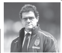
England manager Fabio Capello calls for end to 'stealing' of young stars