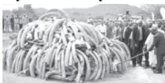
Elephants tusks are in huge demand in Asia.