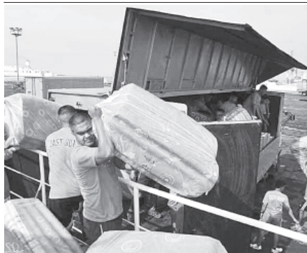
Philippine Coast Guard and crew from MV Spirit of Mol load sleeping mats and relief goods from government agencies to be shipped to flood-hit Cagayan de Oro City at a pier in Manila.