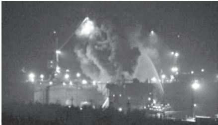
Firefighters work to extinguish fire at the Roslyakovo shipyard in the northern Russian region of Murmansk, in this still image taken from video, on 29 Dec, 2011.