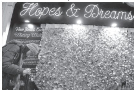
A woman writes her wish on a piece of confetti in front of the New Year's Eve Wishing Wall at Times Square Information Center in New York, the United States, on 29 Dec, 2011. All the pieces of confetti, bearing the best wishes for the year 2012 from people around the world, will rain down to revelers during the New Year's Eve celebration on Times Square.