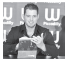
Canadian singer Michael Buble attends a signing of his illustrated memoir "Onstage, Offstage" at Waterstone's, Piccadilly in London on 14 Oct, 2011.

Rounding out the top tier are Lady Antebellum's "Own the Night" at No 6, Rihanna's "Talk That Talk" at No 7, Nickelback's "Here and Now" at No 8, the Black Keys' "El