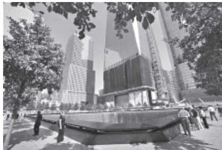
Visitors look at panels containing the names of the victims of the attacks, as well as one of the memorial pools, on the first day that the 9/11 Memorial was opened to the public at the World Trade Centre site in New York, on 12 September, 2011.