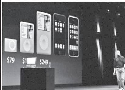
Twenty-five percent of teens are in danger of early hearing loss as a direct result of MP3 players, researchers in Israel say.—INTERNET

TEL AVIV, (Israel), 30 Dec—Twenty-five percent of teens are in danger of early hearing loss as a direct result of MP3 players, researchers in Israel say.