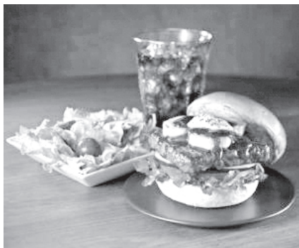
Wendy's officials said it plans to expand the restaurant overseas, but the $16.50 top shelf burger on sale at a Wendy's in Japan was none of its doing.—INTERNET

TOKYO, 30 Dec—Wendy's officials said it plans to expand the restaurant overseas, but the $16.50 top shelf burger on sale at a Wendy's in Japan was none of its doing.