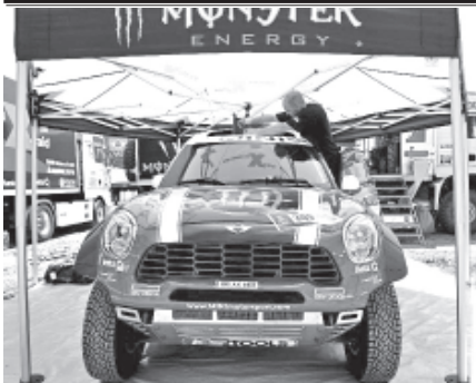
A mechanic works on a vehicle of BMW Monster team in the Dakar Village, located at the Apostadero Naval de Mar del Plata, property used by the organization of the Dakar 2012 Argentina-Chile-Peru for checks of cars participating in the Rally, in Mar del Plata City, 400 km from Buenos Aires City, capital of Argentina, on 29 Dec, 2011. The Dakar 2012 Argentina-Chile-Peru will begin on 1 Jan, 2012.