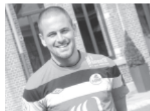
Lille midfielder Joe Cole