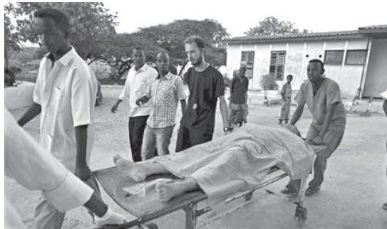
Madina hospital staff help to wheel an injured Medecins Sans Frontieres (MSF) personnel on a stretcher south of Capital Mogadishu on 29 Dec, 2011.