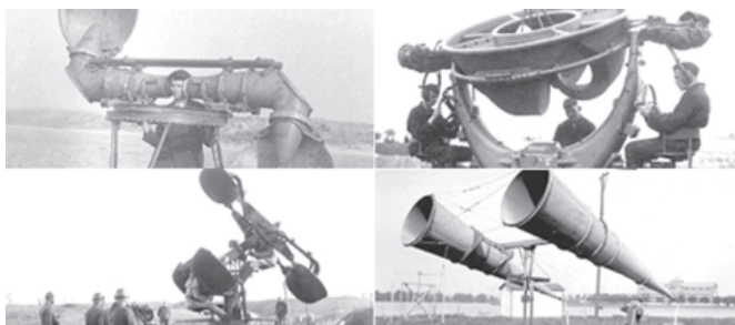
Before military radar was invented, soldiers used these equipment to detect the enemy planes during the wars.

Some 500 people were evacuated after a fire broke out at the Moscow University early Friday, the Itar-Tass news agency reported. The fire was later extinguished, and there has been no report of casualties from the incident, said the report.