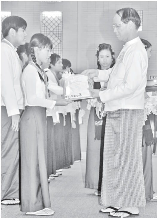
Vice-President Dr Sai Mauk Kham presents medals and certificates of honour to outstanding students who passed matric exam for 2011.

NAY PYI TAW, 30 Dec—The prize presentation for outstanding students for 2011-2012 academic year of the Ministry of Education was held at Myanmar International Convention Centre, here, at 3 pm today, attended by Vice-President of the Republic of the Union of Myanmar Dr Sai Mauk Kham.