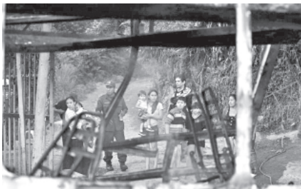
Bystanders watch at a burned bus at the site of an accident that killed at least 13 people in Caracas, Venezuela, on 29 Dec, 2011. A tanker truck filled with gasoline crashed and burst into flames devouring several cars and a bus.