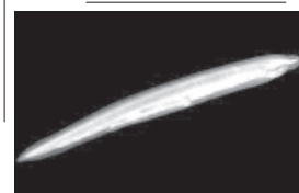
‘Brainless’ fish found off Scotland