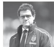
England manager Fabio Capello

He told The National: "A line needs to be drawn. Richer clubs are talent-scouting and stealing players by bidding higher and not thinking about the consequences for those countries. "These