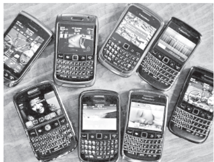
This picture shows a collection of Blackberry devices at a small restaurant in Jakarta on 10 December. BlackBerry maker Research In Motion's share of the US smartphone market declined during the three months ending in November, while Apple and Google's Android platform both made gains, industry tracker comScore said Thursday.

WASHINGTON, 30 Dec—BlackBerry maker Research In Motion's share of the US smartphone market declined during the three months ending in November, while Apple and Google's Android platform both made gains, industry tracker comScore said Thursday.