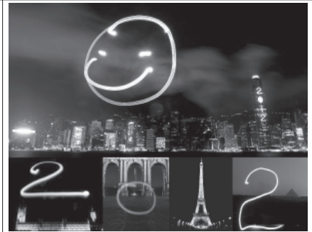
The combined light painting photo taken by Xinhua journalists respectively in China's Hong Kong (top), Britain's London, Belgium's Brussels, France's Paris and Egypt's Cairo (from L to R, bottom) shows a smiling face and the sign of "2012", to greet the coming New Year.