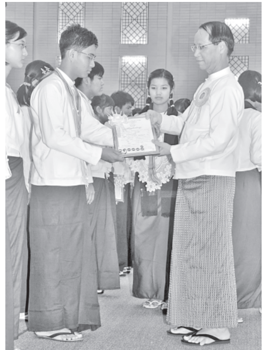
Vice-President Dr Sai Mauk Kham presents medals and certificates of honour to outstanding students who passed matric exam for 2011.

documentary photo with the prize winners.