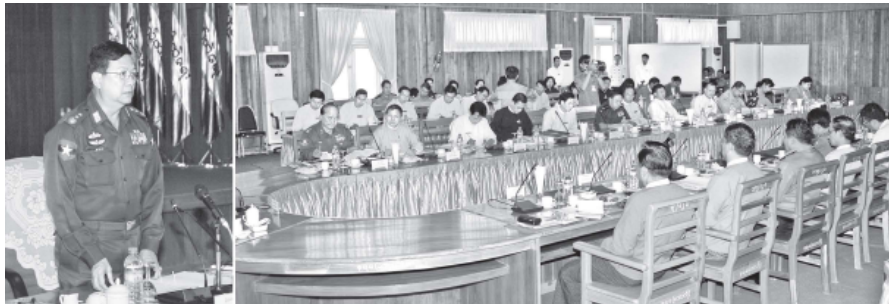
Union Minister for Home Affairs Lt-Gen Ko Ko delivers an address at Meeting 1/2011 of Central Committee for Prevention Against Human Trafficking.—MNA

The meeting ended with concluding remarks by Union Minister Lt-Gen Ko Ko.—MNA