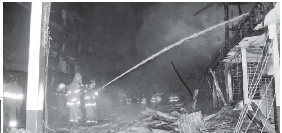
Fire brigade members putting out fire at No. 2 Basic Education High School in Kamayut Township of Yangon Region.—MNA

The people should be on alert to fire during the opening season and should take preventive measures against the fire.—MNA