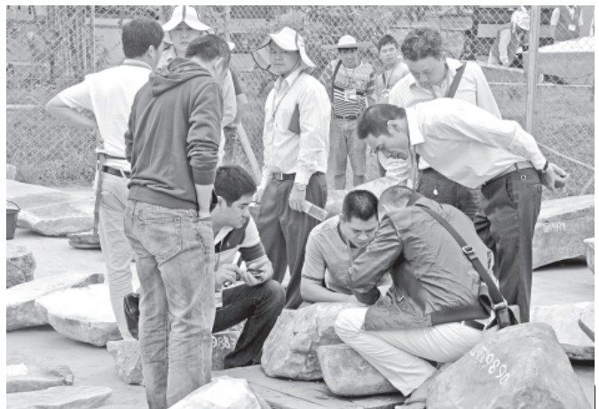
Local and foreign gems merchants observe jade lots.—MNA