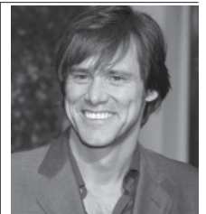
Hollywood comedian Jim Carrey

Camino" at No 9 and "Now 40" compilation CD at No 10. Internet