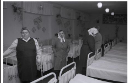
Female inmates are seen at the bedroom area of penal colony number 54 in this January 1992 file photo, the same prison where former Ukrainian Prime Minister Yulia Tymoshenko will be held after being sentenced to seven years for abuse of office, in Kharkiv.

A local court sentenced Tymoshenko to seven years in prison in October, saying she had exceeded her powers when forcing through a 2009 gas deal with Russia. Tymoshenko, who denies any wrongdoing, lost an appeal against the verdict one week ago.