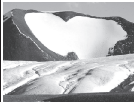
Photo taken on 19 Dec, 2011 shows a part of glacier in Purog Kangri, some 560 kilometers away from Nagqu Town in southwest China's Tibet Autonomous Region. The Purog Kangri glacier, whose ice field covers an area of 422 square kilometers, is considered to be the third largest in the world.

Fisker said fewer than 40 of these vehicles are with consumers and the rest remain in dealer inventories. The vehicles, made for the 2012 model year, were built from July to November of this year. Scrutiny of electric vehicles has intensified recently after battery fires in some NHTSA crash tests of General Motors Co's Chevrolet Volt.—Reuters