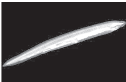
Brainless fish found off Scotland. —INTERNET

ORKNEY, 30 Dec — A survey of the waters around Scotland's coast, using underwater video and acoustic and 3D images, the researchers said.