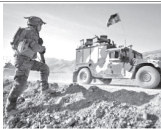
A soldier with the French Foreign Legion watches an Afghan National Army (ANA) vehicle driving by on the road near Tagab in Afghanistan's Kapisa Province on 26 January, 2011.