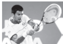
Serbia's Novak Djokovic returns the ball to Gael Monfils from France during the Mubadala Tennis Championship, in Abu Dhabi, United Arab Emirates on Thursday.

ABU DHABI, 30 Dec — Top-ranked Novak Djokovic began his preparations for the 2012 season with a 6-2, 4-6, 6-2 win over No. 16 Gael Monfils at the World Tennis Championship exhibition event on Thursday. Djokovic is coming off three Grand Slam wins during a 70-6 season. The 24-year-old Serb ended his best season with two tired losses at the ATP World Tour Finals last month. Djokovic will face