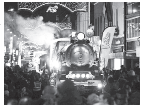
People attend the Christmas floats parade in Vilvoorde, a satellite town of Brussels, capital of Belgium, on 28 Dec, 2011. There were over 21 floats taking part in the parade this year, which made it the biggest in latest 10 years.

Four suspects involved in the Hotan and Kashgar attacks were sentenced to death by court in September.