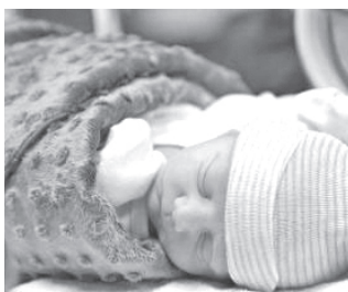
US researchers say studying electrical currents in sperm cells may offer hope to infertile couples but also may lead to an effective male birth control pill.