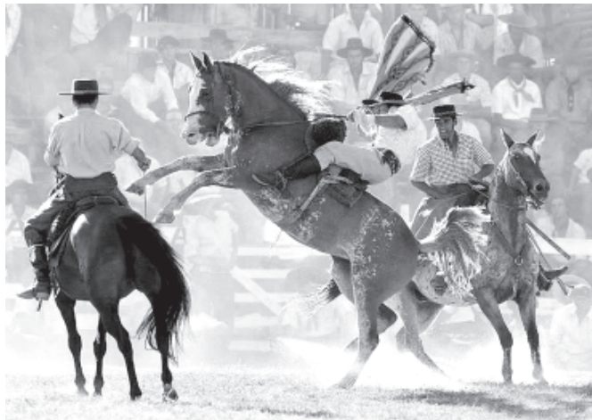
Men riding horses take part in a celebration marking the International Labour Day at a village 350 kms east of Bishkek, Capital of Kyrgyzstan, on 1 May, 2011. The photo is awarded the second prize of Xinhua International News Photo 2011 .

A total of 10.2 billion rubles (USD 325 mln) has been allocated from the city budget to the construction of stations and tunnels in 2011.— Internet