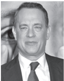
Tom Hanks arrives for the "Extremely Loud and Incredibly Close" premiere at the Ziegfeld Theatre in New York on 15 December, 2011.

Librarian of Congress James H. Billington Wednesday announced the titles of the films to be