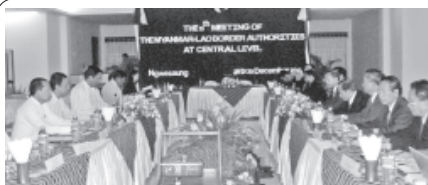
LPDR delegation leaves Yangon after attending 10 th Meeting of the Myanmar-Lao Border Authorities