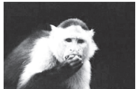
Will this monkey fight or flee? A study at the Smithsonian research station on Barro Colorado Island in Panama shows that the answer may depend on the size of the group it belongs to.

Researchers used recorded vocalizations to simulate territorial invasions into the ranges of wild white-faced capuchin monkey groups at the Smithsonian research station on Barro Colorado Island in Panama. Monkeys responded more vigorously to territorial challenges near the centre of their territories and were more likely to flee in encounters near the borders, they found, and defection by members of larger groups was more common than defection by members of smaller groups. These behavior patterns even the balance of power among groups and may explain how large and small groups are able to coexist, the researchers said.— Internet