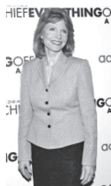
Donna Hanover, former wife to Rudy Giuliani and TV celebrity.

It "is set at the national convention where two candidates are vying for their party's nomination during the