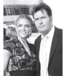
Charlie Sheen and wife Brooke Mueller

LOS ANGELES, 15 Dec—Brooke Mueller, the ex-wife of US actor Charlie Sheen, has entered long-term, inpatient rehabilitation to deal with her drug addiction, her publicist said. Mueller and Sheen are the parents of 2-year-old twin sons. "Brooke has decided to remove herself from the media spotlight and has entered a long-term, inpatient treatment centre