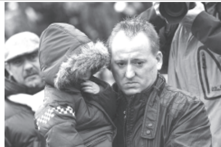
A father and his son mourn as they look at the scene Tuesday's attack in the City centre of Liege, Belgium, on 14 Dec, 2011. The body of a woman has been found in the garage of a grenade-lobbing gunman, bringing to four the number of people killed in an attack in the City of Liege, officials said Wednesday.

"Warum (why)?" asked one card, surrounded by toys, flowers and candles. The victims included a 1 1/2 year-old toddler and two teenage boys, both students. Five others are reported in critical condition.