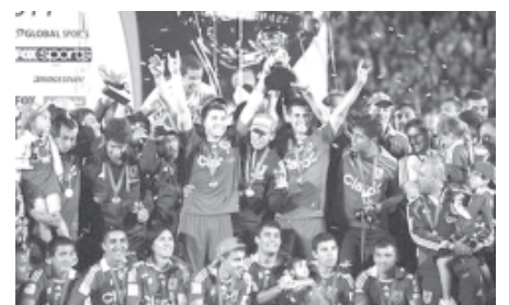
Chile's Universidad de Chile's players celebrate at the end of the Copa Sudamericana final soccer match against Ecuador's Liga Deportiva Universitaria in Santiago, Chile, on 14 Dec.

"He's an extraordinary player and he deserves what he