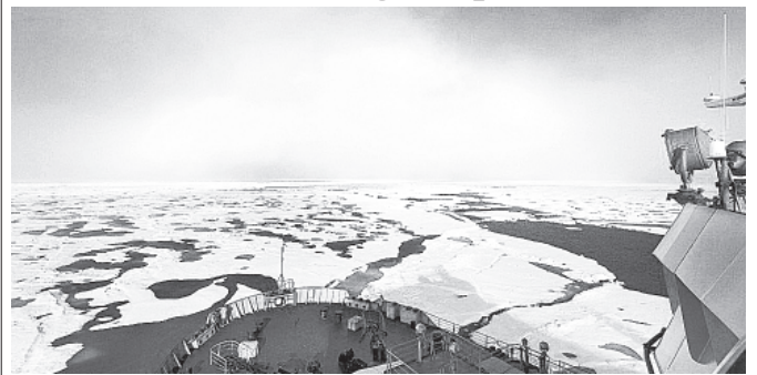
Cold voyage: As their ice breaking ship cruised through the chilly waters, Sam clocked the arching rainbow, but was stunned to see it was completely white.

LONDON, 15 Dec — This is the amazing year it was still fairly light. 'At first it just looked like a cloud, but as we got closer it was a solid rainbow, but white. 'We were so impressed with it we all got off onto a floating slab of ice to take a closer look. It is actually closer than it looks in the pictures. 'I was stunned and amazed by the natural miracle. Despite the fact I am totally obsessed with photography, I sometimes forgot to press the shutter button. 'I was just staring at the natural wonder in front of me.' The 51-year-old, from Russia, said: 'It was around midnight, but because of the time of