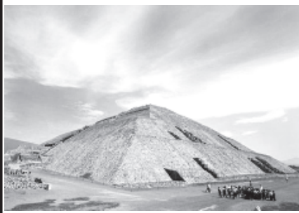
A general view of the site of the ancient Sun Pyramid at the Teotihuacan Citadel outside of Mexico City during the Gran Premio Gigante-Telmex, round 19 of the CART (Championship Auto Racing Teams) Fed Ex Championship Series on 15 Nov, 2002 at the Autodromo Hermanos Rodriguez in Mexico City, Mexico.