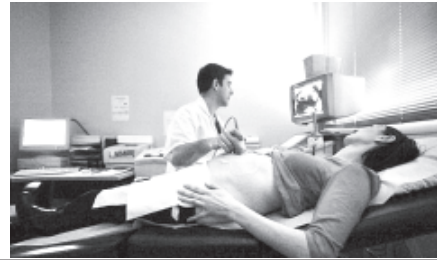
A doctor conducts a scan on a pregnant woman. Stillbirth is often caused by pregnancy complications such as problems with the placenta or preterm labor, said US research published on Tuesday aiming to shed light on the causes and risks.