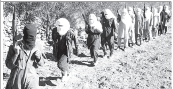
In this Sunday, on 11 Dec, 2011 photo, masked Pakistani Taleban militants take part in a training session in an area of Pakistan's tribal South Waziristan Region along the Afghan border.