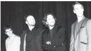
(L-R) Pearl Jam's Stone Gossard, Jeff Ament, Eddie Vedder and Matt Cameron attend the 'Pearl Jam Twenty' premiere at the Princess of Wales theater.

BURLINGTON, 15 Dec—Two men face charges they stole a guitar owned by a Vermont man whose brother got it from Pearl Jam three months before he died of cancer, police said. The Burlington Free Press reported the 1972 Fender Telecaster, which once belonged to Pearl Jam's Mike McCready, had been recovered, but the band members' signatures were removed. It was being held as evidence for the time being.