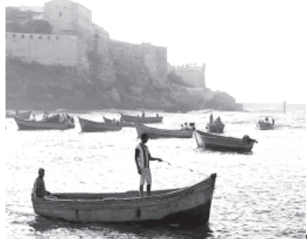
Moroccan fishing boats are seen in Rabat 2008. European Parliament lawmakers blocked a deal Wednesday allowing special access for EU fishermen to Moroccan waters, prompting Morocco to issue an immediate ban on European fishing boats.

In contrast, exports to the European Union (EU) contracted 5.1 percent on-year to 4.03 billion dollars last month, sending the nation’s trade deficit with the EU members to 380 million dollars. Meanwhile, imports expanded 11.1 percent on-year to 42.96 billion dollars in November due to robust demand for raw materials and consumer goods.—Xinhua