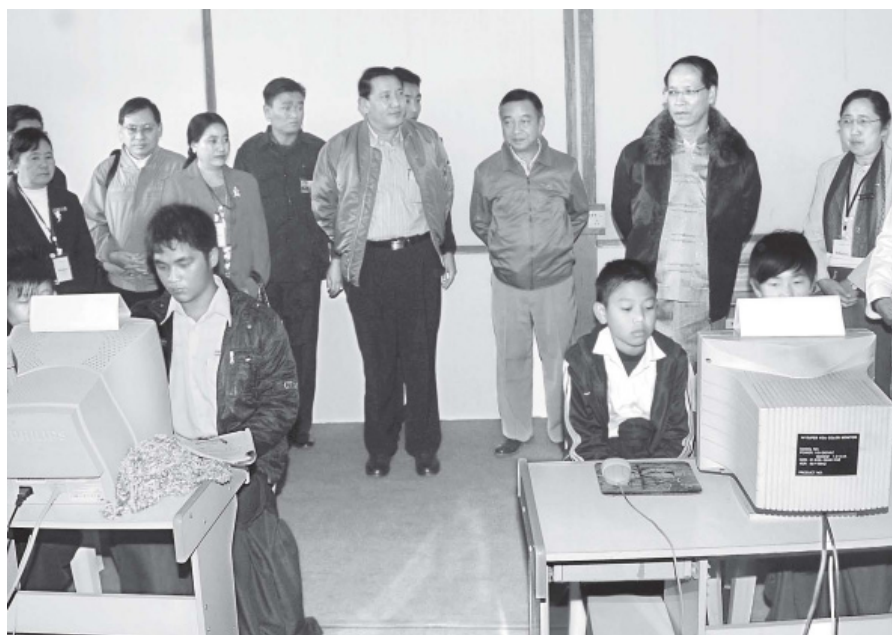
Vice-President of the Republic of the Union of Myanmar Dr Sai Mauk Kham visits Basic Education High School No. 1 in Muse.

The Vice-President and party visited learning of students at BEHS( branch) in Zay Ward in Muse. There, Kanbawza Bank Ltd, ACE Co, IGE Co, Loi Hein Co, Tamoenye Chantha Co, Asia World Co and Shwe Thanlwin Co donated K 120 million for construction of two-storied school building through the school head. The Vice-President and party posed for a documentary photo