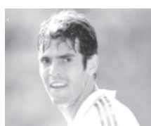
Real Madrid's Kaka

Kaka, the Brazil international, also hailed the importance of his side's 2-0 Copa del Rey victory against Ponferradina following the Clasico defeat.—Internet