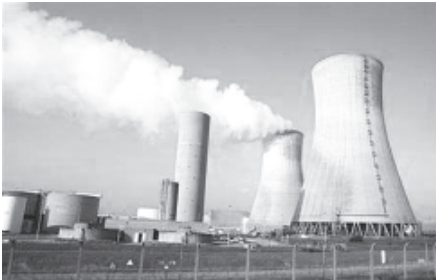
General view of the Areva nuclear power plant site in Tricastin, southern France, on 25 Nov, 2011.