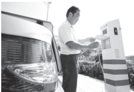
A man charges a BYD Co Ltd electric vehicle in Shenzhen. China is encouraging the development of electric vehicles to promote the use of clean energy, but a genuine increase in sales has yet to come.

“In the West, most people are not first-time buyers. They have a long history of using gasoline-powered cars. If you tell Chinese buyers what an electric car is and how convenient it is to charge the battery, they will prefer the green car.”—Xinhua