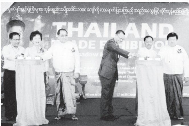
Chief Minister of Yangon Region U Myint Swe and officials press button to open Thailand Trade Exhibition-2011.—MNA

YANGON, 15 Dec— An opening ceremony of Thailand Trade Exhibition-2011 took place at Tatmadaw Convention Hall on U Wisara Road in Dagon Township here this morning, with an address of Director-General U Khin Maung Lay of Directorate of Trade under the Ministry of Commerce.