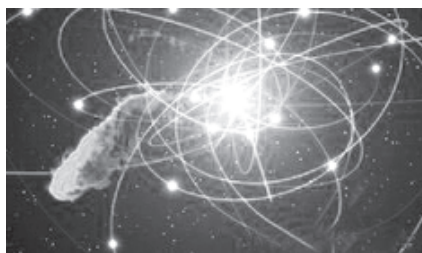
Simulations suggest that the cloud will be ripped to bits and partially swallowed by the black hole.

But this violent process will literally shed light on the closest example we have of an enigmatic celestial object.—Internet