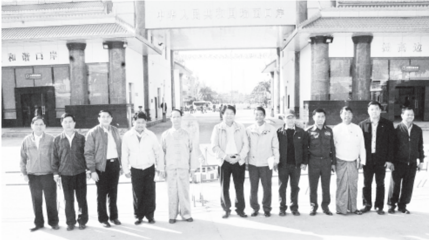
Vice-President Dr Sai Mauk Kham and party pose for documentary photo in front of border post at Muse Nandaw Gate of Myanmar-China border.