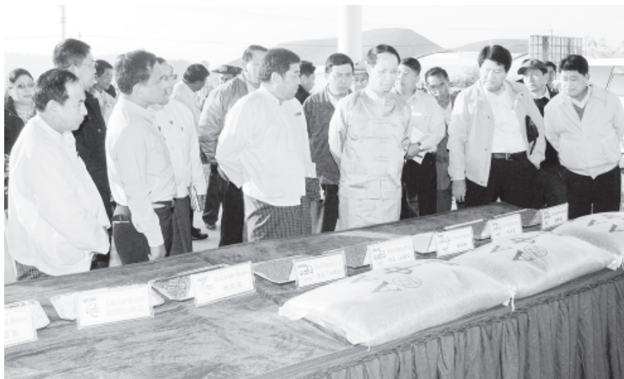
Vice-President of the Republic of the Union of Myanmar Dr Sai Mauk Kham views displays of beans, maize, sesame and agricultural produce brokerage at checkpoint of Muse 105-mile Border Trade Camp.—MNA