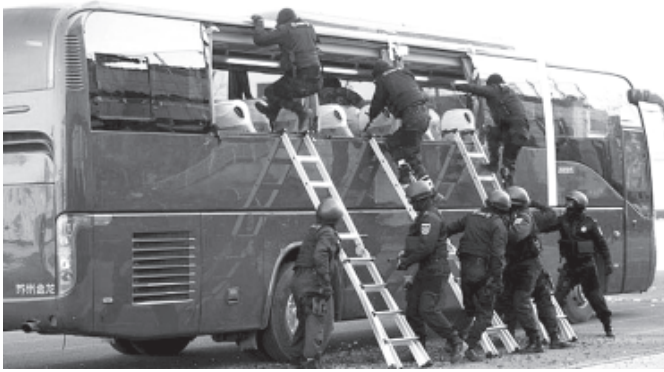
Members of the Beijing Police Special Weapons And Tactics (SWAT) team take part in a mock rescue drill during a police open day in Beijing, on 10 Dec, 2011.