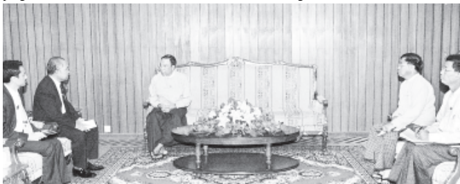
Deputy Minister for Hotels and Tourism U Htay Aung receives Indonesian Ambassador to Myanmar Mr. Sebastianus Sumarsono.