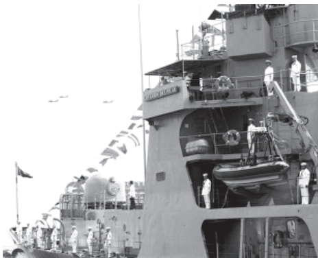
Philippine Navy small aircrafts fly over the country's newly-acquired Hamilton class warship BRP Gregorio Del Pilar (PF15) during commissioning ceremony on 14 Dec, 2011 at the Manila South Harbor in Manila, Philippines.