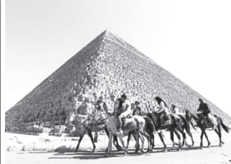
Egyptians ride horses past the great pyramids on the outskirts of Cairo in March. Tour guides and vendors are divided over the affects an Islamist-dominated parliament might have on the lucrative tourism industry.