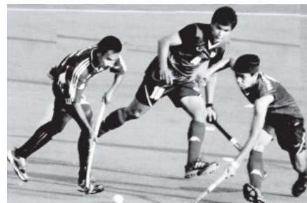
YANGON, 15 Dec— Second ASEAN Men's Hockey Tournament jointly organized by Asian Hockey Federation