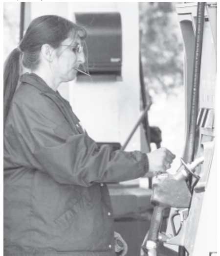
One driver begins the process of a credit card gas purchase in Denver on 15 April, 2011.—INTERNET

At the pump, the national average price of unleaded gasoline dropped slightly from Tuesday's $3.269 per gallon to $3.264, AAA said.— Internet