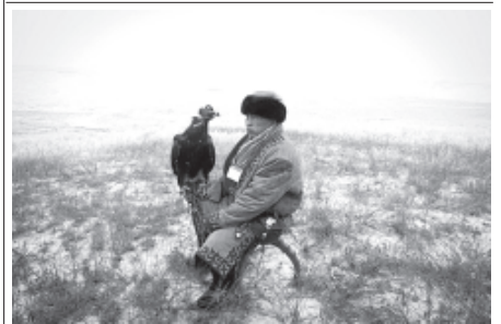
A hunter rests with his tame golden eagle during an annual hunting competition outside Almaty on 9 Dec, 2011.