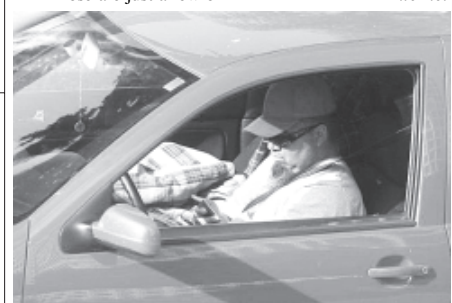
A driver uses a cellphone while driving on 14 Dec, 2011, in Los Angeles.