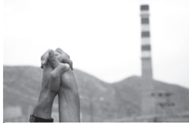
Iranian students hold up their hands as a sign of unity as they form a human chain around the Uranium Conversion Facility (UCF) to show their support for Iran's nuclear programme in Isfahan, south of Teheran, on 15 Nov, 2011.