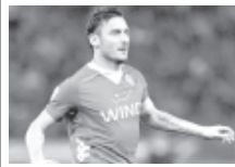
Roma captain Francesco Totti

Speaking before the club's Christmas dinner to Sky Sport Italia, Totti stated: "I've thought of leaving