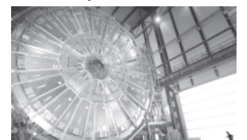
Scientists at Cern fire particles in opposite directions around a 27km long ring-shaped tunnel 100m below ground.

opposite directions around a 27km long ring-shaped tunnel 100m below ground. When the particles have accelerated to almost the speed of light they are encouraged to collide. Sensitive detectors are then used to examine the debris for new particles.