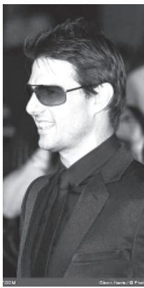
Hollywood actor Tom Cruise

Tom was recently in India for a special screening of "Mission Impossible: Ghost Protocol", 15 days prior to its general release on