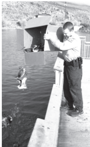
In this photo provided by Utah Division of Wildlife Services, a Utah Division of Wildlife Resources employee frees some surviving grebes on 13 Dec, 2011 at Stratton Pond in Hurricane, Utah after thousands of the birds crash landed throughout Southern Utah on Monday night. INTERNET

No human injuries or property damage have been reported. Officials say stormy conditions probably confused the flock of eared grebes, a duck-like aquatic bird likely making its way to the Mexican coast for the winter.— Internet