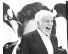
Actor and dancer Dick Van Dyke