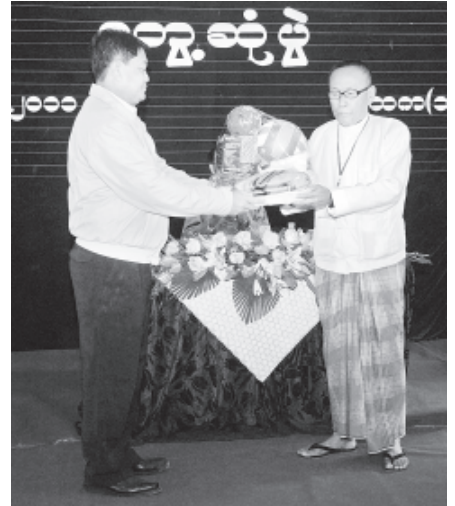
Union Minister for Sports U Tint Hsan presents sports gear for Basic Education High School No. 1 in Muse.

After hearing the reports by the responsible persons