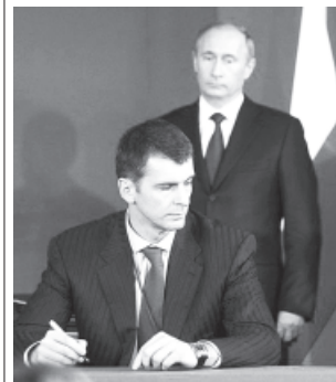
In this 27 Nov, 2009 file photo, Russian Prime Minister Vladimir Putin, right, looks on as Mikhail Prokhorov signs an agreement, during a Franco-Russian meeting in Rambouillet, France.