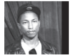
Composer Hans Zimmer and songwriter-producer Pharrell Williams are to serve as music consultants for Hollywood's 84th Academy Awards ceremony, organizers said Friday.

"Hans is one of the most accomplished and creative film composers of our time and Pharrell is a phenomenal songwriter with an amazing list of credits," Grazer and Mischer said in a statement. "This is an exciting and prestigious collaboration that promises to take the