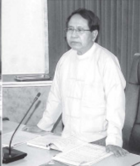
Union Minister U Kyaw Hsan meets the chairman and CEC members of MMA and officials of classic music, modern music, stereo music, mechanical and production groups.