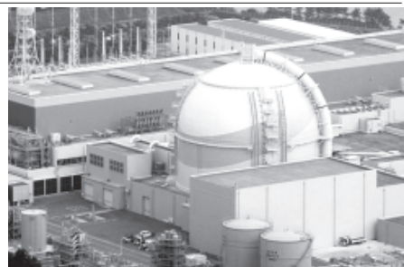
This photo taken in June 2011 shows the No 3 reactor building of Kyushu Electric Power Co's Genkai plant in the town of Genkai, southwestern Japan.