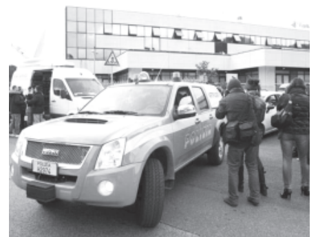
Italian bomb expert police officers leave Equitalia tax agency building in Rome, on 9 Dec, 2011, after a letter bomb exploded, lightly injuring the director general to whom it was addressed, police say.