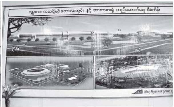
Vice-President Thiha Thura U Tin Aung Myint Oo hears reports presented by officials concerned on Mandalay Advanced Stadium and Gymnasium construction project.