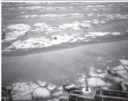
NASA’s Mars Exploration Rover Opportunity used its navigation camera to record this view at the end of a 111-meter (364-foot) drive on the 2,353rd Martian day, or sol, of the rover’s mission on Mars, on 6 September, 2010.