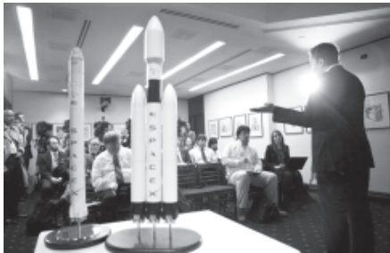
Elon Musk, CEO of Space Exploration Technologies Corp, speaks in April 2011 in Washington, DC. SpaceX will fly its Dragon capsule on an unmanned mission to the International Space Station in February, marking the first-ever bid by a private company to dock at the orbiting lab, NASA said Friday.

CAPE CANAVERAL, 10 Dec—A private company will make a trial cargo run to the International Space Station in February, a key step in a new US programme to buy spaceflight services on a commercial basis, NASA said on Friday. California-based Space