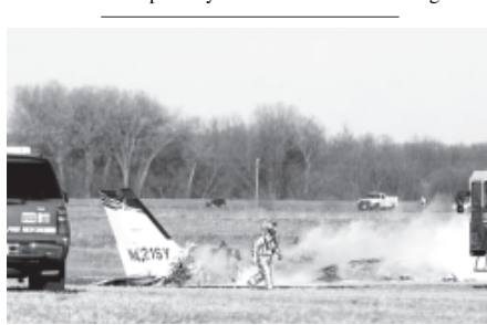
Emergency personnel respond to a plane crash in a field off Westport Ave and 60th St N just west of the Sioux Falls Regional Airport in Sioux Falls, SD, on 9 Dec, 2011.