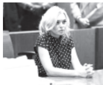
Editors at Playboy magazine are upset images from a photo shoot of Hollywood actress Lindsay Lohan have been leaked on the Internet, TMZ said Friday.

The issue, due out next week, is expected to be the