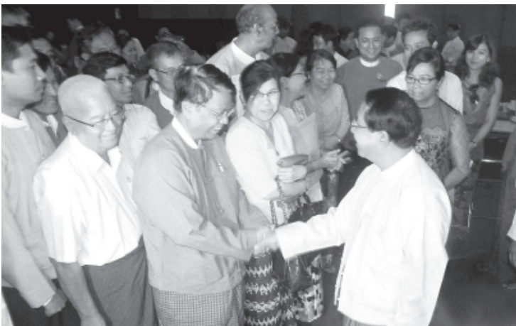
Union Minister for Information and for Culture U Kyaw Hsan greets those present at the meeting with patrons of MMPO, the chairman and executives, members of Motion Picture Censor Board and Video Censor Board.

shooting, producing and showing Myanmar movies not only at home but also abroad. Therefore, relentless