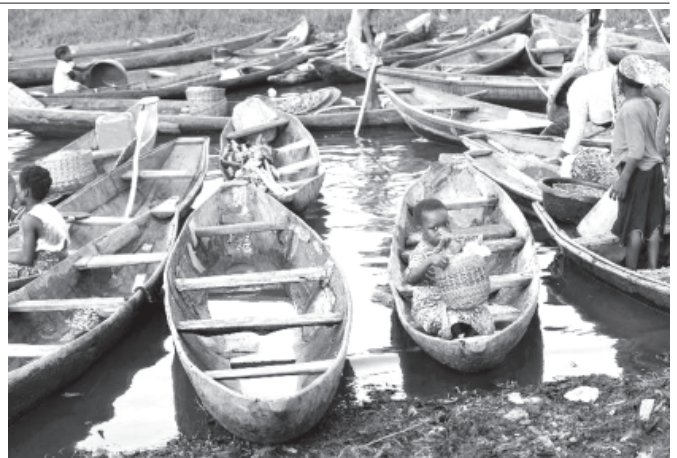
Photo taken on 7 Dec, 2011 shows villagers of the Ganvie water village walk on a dock near Cotonou, economic capital of Benin, nicknamed "Venice in Africa" and with a history of more than 300 years, the Ganvie water village on the Nogue lake in Cotonou is a water residential area that has been well-preserved in Africa.