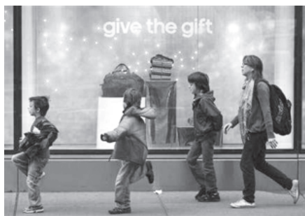
Children run past a storefront decorated for the holidays in New York, on 22 Nov, 2011.

US economic growth appears to be accelerating, even as the global economy slows. The euro zone, for example,