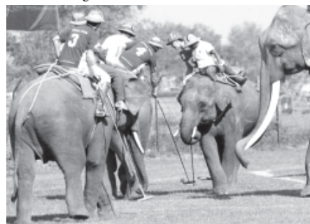
Elephant polo players from Team EFG Switzerland, in red, and Tiger Tops, in green, vie for the ball during the final of the 30th World Elephant Polo Championships at Meghauly Forest. For one week a year, Nepal's Chitwan National Park is home to playboys and aristocrats who pay around $3,500 each to attend the tournament.

Thus the tone is set for the exclusive business of