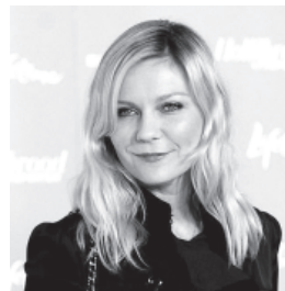
In this 7 Dec, 2011 file photo, actress Kirsten Dunst poses at The Hollywood Reporter's 20th annual Women in Entertainment Breakfast in Beverly Hills, Calif. INTERNET