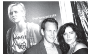
Cast member Patrick Wilson and his wife Dagmara Dominczyk arrive for the premiere of the film "Young Adult" in New York on 8 Dec, 2011.