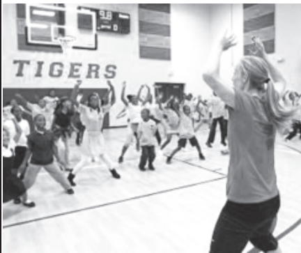
People who engage in no leisure-time physical activity can produce important improvements in health with small increases in activity, US health officials say.