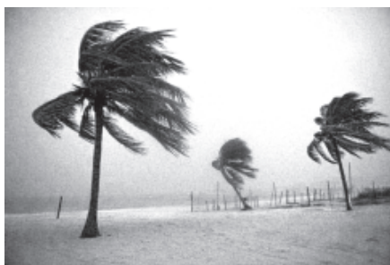
A tropical storm hits the beaches of Playa del Carmen, Mexico in October 2011.

After 1969’s Typhoon Flossie was followed three years later by a magnitude 6.2 quake in 1972, the