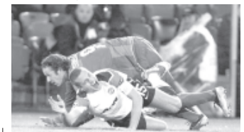
Manchester United skipper Nemanja Vidic injured himself against Basel

year-old has already had one spell on the sidelines this season, having spent two months out with a calf problem he suffered against West Brom on the opening day of the Barclays Premier League season.