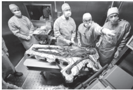
Ötzi the Iceman, a 5300-year-old mummy, was found in the Italian Alps 20 years ago.