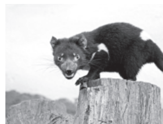
A deadly cancer riddling Tasmanian Devil has been found in an area thought to be free of the disease, troubling officials struggling to keep the animal alive in the wild.

The furry marsupials were declared endangered in 2009 after the contagious cancer began sweeping through the population, disfiguring their faces so badly they are unable