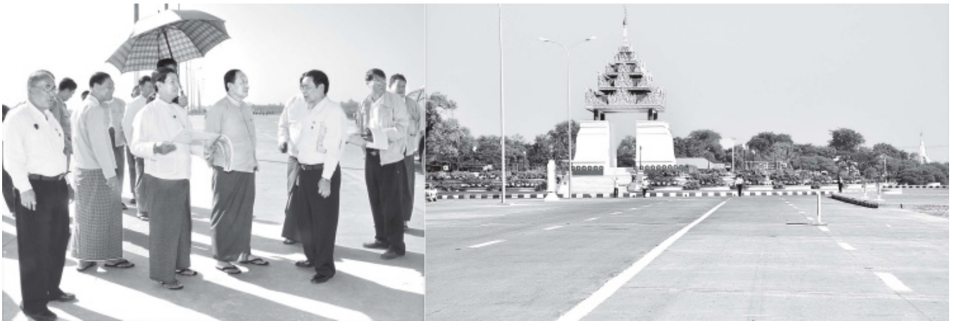
Vice-President of the Republic of the Union of Myanmar Thiha Thura U Tin Aung Myint Oo inspects Dagundaing Roundabout.

NAY PYI TAW, 10 Dec—Vice-President of the Republic of the Union of Myanmar Thiha Thura U Tin Aung Myint Oo, accompanied by Union Minister for Construction U Khin Maung Myint, Union Minister for Hotels and Tourism and for Sports U Tint Hsan, Deputy Minister for Information U Soe Win, Deputy Minister for Construction U Kyaw Lwin and officials, this morning left here by car along Yangon-Mandalay Expressway and arrived at Sagar-in Roundabout in Pyigyidagun Township of Mandalay Region at 9.30 am today.