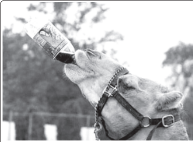
Funny moments caught on camera.