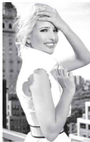
Iyanka Marie Trump (born on 30 October, 1981) is an American businesswoman, socialite, heiress, and fashion model. She is the daughter of the American business magnate Donald Trump and Executive Vice President of Development & Acquisitions at The Trump Organization.