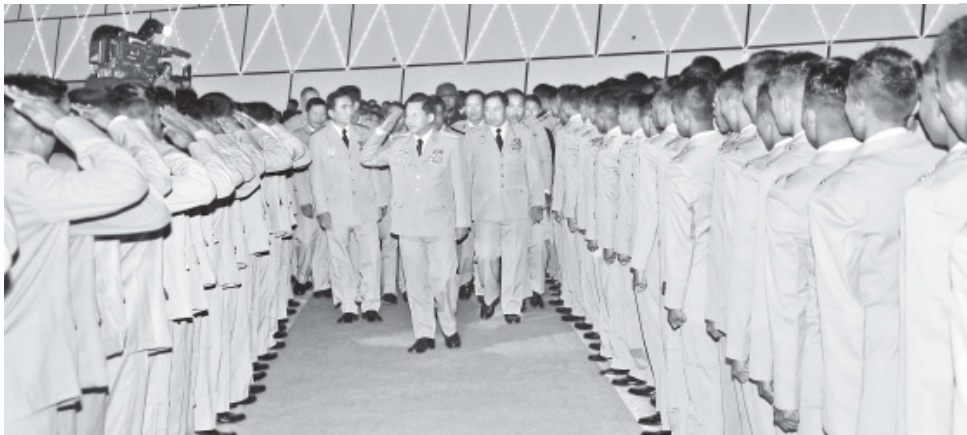
Commander-in-Chief of Defence Services General Min Aung Hlaing attends graduation dinner of the 54 th Intake of the Defence Services Academy.