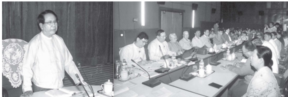
Union Minister U Kyaw Hsan meets patrons of MMPO, the chairman and executives, members of Motion Picture Censor Board and Video Censor Board.—MNA

Moreover, he said that special care was taken for smooth process between the Motion Picture Censor Board and those of motion picture world and that between the State and the people, and those of motion picture world. He said that the Ministry of Information on its part will cooperate with (See page 10)