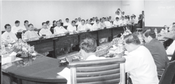
Pyithu Hluttaw Speaker Thura U Shwe Mann meets members of Studying, Examining and Reviewing Commission on Legal Affairs and Special Cases.

YANGON, 10 Dec—The Studying, Examining and Reviewing Commission on Legal Affairs and Special Cases was constituted with 15 members at the 48 th day second regular session of the first Pyithu Hluttaw held on 16 November 2011.