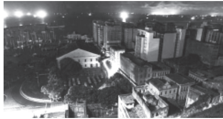
View of Salvador, the capital of the northeastern Brazilian state of Bahia. A meningitis epidemic has killed 109 people in Bahia since the start of the year, according to a report released by local authorities.

SALVADOR, 10 Dec—A meningitis epidemic has killed 109 people in the northeastern Brazilian state of Bahia since the start of the year, according to a report released by local authorities Friday. And Brazil's superstar singer Ivete Sangalo revealed that she had contracted viral meningitis, a mild form of the disease, press reports said. The 39-year-old, best-selling singer, who hails from Bahia, reportedly left hospital after undergoing treatment. But authorities said 109 people, most of whom contracted cerebro-spinal meningitis, have died since January. The mortality rate for cerebro-spinal meningitis, characterized by an