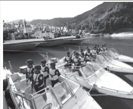
In this photo released by China's Xinhua News Agency, fully-armed Chinese police officers line up on their boats as their patrol missions along the Mekong River are ready to start in Guanlei, Dai Autonomous Prefecture of Xishuangbanna, southwest China's Yunnan Province, on 9 Dec, 2011. China said joint Mekong River security patrols with forces from Myanmar, Laos, and Thailand will begin on Saturday, a development likely to deepen Beijing's influence in the region on its southern flank.