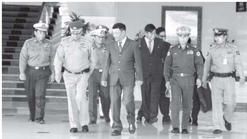
Lt-Gen Hla Htay Win of the Commander-in-Chief's Office being welcomed back by officials concerned at Yangon International Airport.—MNA

NAY PYI TAW, 10 Dec—The Tatmadaw delegation led by Lt-Gen Hla Htay Win from the Commander-in-Chief's Office arrived back at 11:30 am today, after attending The 11 th Langkawi International Maritime and Aerospace Exhibition 2011 (LIMA-11) held in Malaysia from 6 to 10 December, 2011.