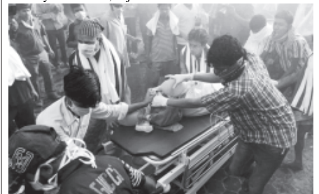
People help carry a patient out of a hospital after it caught fire in Kolkata, India, on 9 Dec, 2011. The fire swept through the multistory hospital in eastern India early Friday, trapping many elderly patients in the smoke-filled building, an official said.