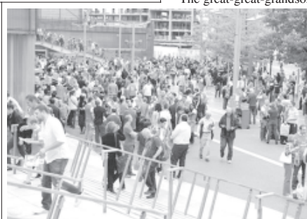
Fans will take part in a day of celebrations to mark Arsenal's 125th anniversary.