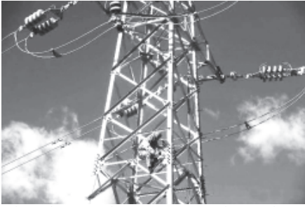
Photo shows a worker sitting on a new electric pylon in Lhunzhub County, southwest China's Tibet Autonomous Region. The Qinghai-Tibet electricity network project was completed and put into use Friday, by which the power grid of the Tibetan plateau is connected with power lines in other parts of China.