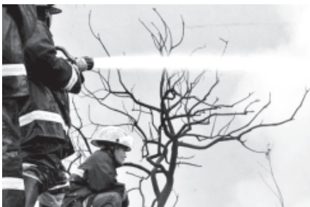
File picture shows firefighters dealing with a fire in a Manila suburb. A four-seater cargo plane crashed onto a Philippine slum on Saturday, sparking a fire that killed 13 people including three children and left at least another 20 injured, officials said.

MANILA, 10 Dec.—A four-seater cargo plane crashed onto a Philippine slum on Saturday, sparking a fire that killed 13 people including