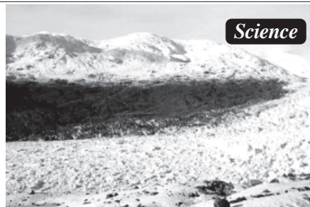
The Jorge Montt glacier is seen in Southern Patagonia, some 1,800 km south of Santiago. The Jorge Montt glacier in southern Chile is melting at a rate of a kilometer (0.6 miles) per year, making it one of the world’s most visible milestones of global warming, according to researchers.—INTERNET

killing more than 225,000 people and leaving one in seven homeless. An ensuing cholera epidemic left over 5,000 people dead. The researchers said their theory is that the heavy rains and landslide shift enough weight away from the surface load above the fault that a quake is triggered.—Internet