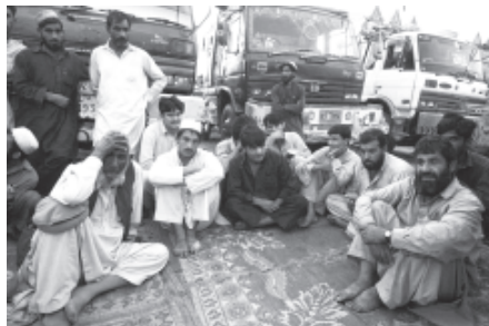
Pakistani truck drivers and their assistants gather at a terminal in Karachi, Pakistan.

US sentiment in Pakistan, drivers might not want to call publicly for the border to reopen. There is broad anger throughout the country over