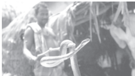
In this 2007 photo, an Indian villager removes a snake found beside a parked cycle at the entrance of a house in the village of Choto Poshla, about 130 kilometres northwest of Kolkata.

"The deaths and suffering from venomous snakebites remain largely invisible to the global health community." —Internet