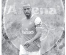
Arsenal legend Thierry Henry

York Red Bulls star was quick to praise the current form of Van Persie, suggesting only Barca star Messi and Real Madrid forward Ronaldo are in superior form at the moment. "What can I say about Robin? I saw him come in here and at the very beginning he wasn't the easiest guy to deal with - like I wasn't, I guess," Henry told Arsenal's official website.