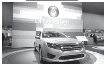
The 2010 Ford Fusion is seen in front of a sign that reads "Drive Green" at the 2010 North American International Auto Show during press days in Detroit, Michigan on 11 January, 2010.—INTERNET

The recall also affects vehicles with service steel wheels likely sold between mid-April 2010 and mid-November 2010.—Reuters