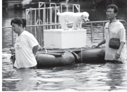
Local residents are seen here salvaging their belongings as their dog sits on top of the improvised float, in suburban Bangkok, in October.