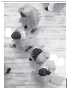
Participants in red ponchos walk out of a basketball arena to a field before attempting to assemble the world's largest human AIDS ribbon on World AIDS Day at Coppin State University in Baltimore, on 1 Dec, 2011. Organizers estimated that 1,000 people participated in the event, short of their goal of 4,000.