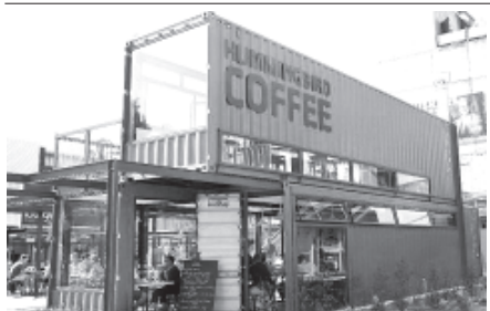
Shoppers rest inside a Shopping Mall built with pop-up shipping containers in central Christchurch, New Zealand, on 3 Dec, 2011. Twenty-seven shops and cafes have been built from 64 converted shipping containers in the mall, which became the first part of the city’s red zone to open for business since the 22 Feb quake which killed 181 people.