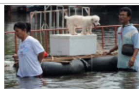
Local residents are seen here salvaging their belongings as their dog sits on top of the improvised float, in suburban Bangkok, in October.