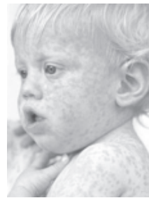
Measles is usually a mild illness - but can be fatal. — INTERNET

LONDON, 4 Dec — European countries need to act now to tackle measles outbreaks, the World Health Organization warns. The WHO report says there were over 26,000 measles cases in 36 European countries from January to October 2011. Western European countries reported 83% of those cases, with 14,000 in France alone. In England and Wales, there were just under 1,000 confirmed measles cases in that period — compared with just 374 in the whole of 2010.