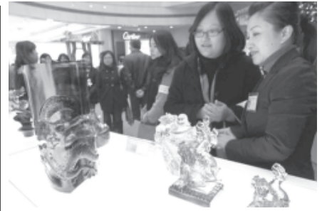
People view crystal glass artworks of dragon at a crystal glass artwork show in Shanghai, east China, on 2 Dec, 2011. The exhibition displayed 40 pieces of crystal glass artworks in the theme of dragon to greet the coming 2012, which is the Year of Dragon in Chinese lunar calendar.