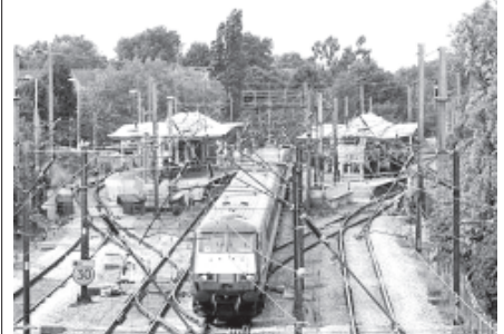
A train passes through Potters Bar rail station at Potters Bar in south east England on 13 May, 2011.

The government's proposal is for a new Y-shaped high-speed rail network. The initial phase would connect London and Birmingham by 2026, reducing journey times to 49 minutes from 84. Lines to Manchester and Leeds would open by 2033.