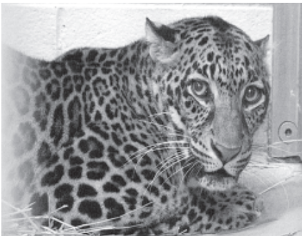
This file photo was previously provided by the Columbus Zoo and Aquarium and shows one of three leopards that were captured by authorities last month, a day after their owner released dozens of wild animals and then killed himself near Zanesville, Ohio.