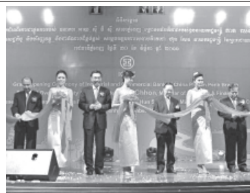
Opening of Industrial and Commercial Bank of China (ICBC) in Phnom Penh, Cambodia, on 30 Nov, 2011.