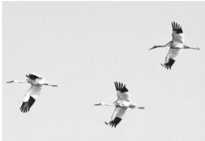
Momoge National Nature Reserve is located in Zhenlai County, Baicheng City, Jilin Province and takes up 144,000 hectares in total, including more than 80% wetland. It is the largest wetland reserve in Jilin Province. It is one of reserves with the most crane species in the nation.

They said they would be busy screen-grabbing old reviews, so they don't disappear along with the site.