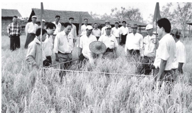
Officials seen at preparations for harvesting paddy on model plot in Mawlamyinegyun Township.

In measuring production of paddy per acre on model plots for Hsinthwelat paddy plantations, paddy farm of U Tun Myint of