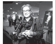
Actress Meryl Streep arrives for the premiere of her movie "The Iron Lady" in Washington, on 29 Nov, 2011.