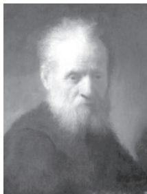
The self-portrait is hidden under this image of an old man, attributed to Rembrandt.