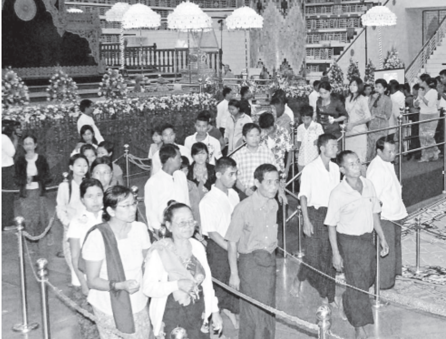
Pilgrims in the queue to pay homage to the Buddha Tooth Relic.

YANGON, 4 Dec—The Buddha Tooth Relic from the People's Republic of China has been kept for the 13 th day today in Maha Pasana Cave here, packed with pilgrims including members of the Sangha.