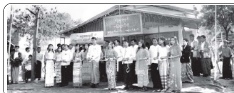
Self-reliant Ngwelayaung Library was opened in Shwedah Nyaunghtauk Village in Yamethin Township on 19 November.