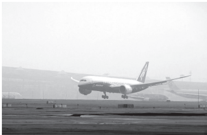
A Boeing 787 Dreamliner lands on the Beijing Capital International Airport, Beijing, China, on 4 Dec, 2011. The Boeing 787 Dreamliner arrived here Sunday, kicking off its six-month tour exhibition worldwide.

The Chinese's government is now fully aware that China must develop its economy in a green way, and is striving to nurture green industries, Wang added.—Xinhua