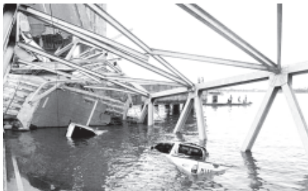
Rescuers hunted for survivors on last Sunday after a busy bridge spanning the Mahakam river in Indonesia's Borneo island collapsed, killing four people and injuring 19 others, according to officials. A public bus, cars and motorcycles plunged into Mahakam river in Kutai Kartanegara District after the 720 m long structure collapsed on last Saturday.