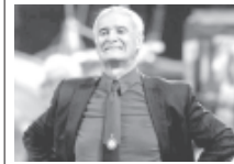
Inter head coach Claudio Ranieri

"A striker lives for a goal and not getting it does