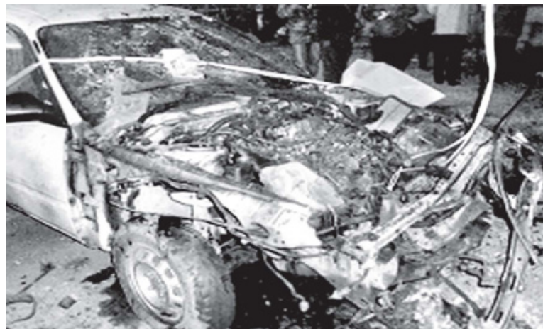
Photo shows destroyed vehicle due to bomb blast in Tatkon Ward in Myitkyina.