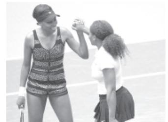
Venus Williams, left, and her sister Serena, of the United States, celebrate after winning a point during an exhibition doubles tennis match against Italy's Flavia Pennetta and Francesca Schiavone, in Milan, Italy, on Saturday.

7-3 before the Williams sisters won the doubles 3-7, 8-6, 8-6. The Italian pair delighted the crowd in the warmth by dancing to Michael Jackson's "Thriller."