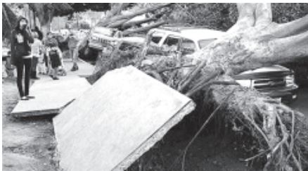
Residents look at slabs of the broken concrete pavement and uprooted eucalyptus trees after a heavy wind storm in the morning at Highland Park in Los Angeles, California on 1 December, 2011.