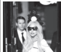
Lady Gaga arrives to promote the Gaga Workshop containing Lady Gaga-themed holiday gifts at Barneys in New York City on 21 Nov, 2011.