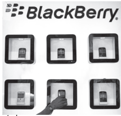
A salesman arranges a BlackBerry mobile phone inside a display box at a showroom in the western Indian City of Ahmedabad 13 October, 2011.