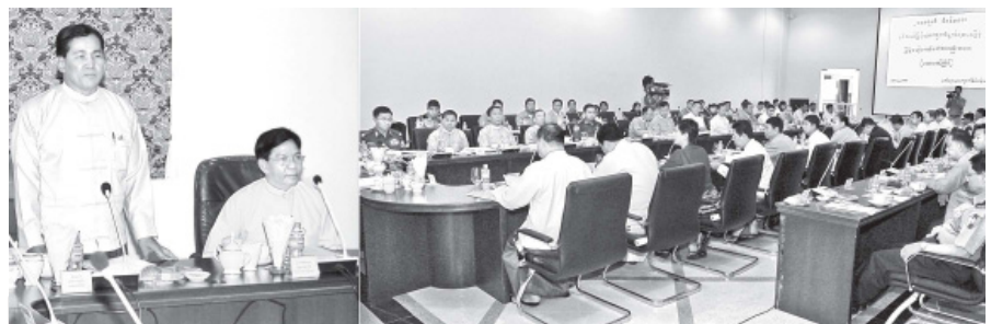
Union Minister for Mines U Thein Htaik addresses first meeting of central committee for organizing Mid-year Myanma Gems Emporium 2011.