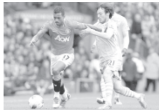
Manchester rivals United and City have 10 players between them on the shortlist.

The nominations are made in a secret ballot by the 50,000 professional