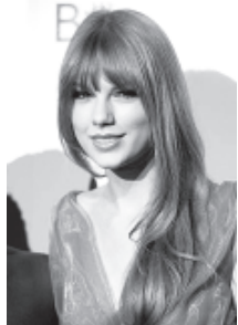
Woman of the Year award honouree singer Taylor Swift attends the 6th annual Billboard Women In Music event at Capitale on 2 Dec, 2011 in New York.

"I got three nominations. I was just so excited," she said Friday, before she was honoured as Billboard's "Woman of the Year." Among the Swift achievements that led to her Billboard honour was the best-selling performance of her third album