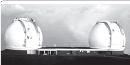
The twin telescopes at Keck Observatory in Hawaii.