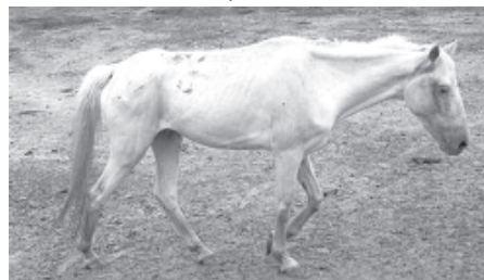
This undated handout image, obtained by Reuters on 3 Dec, 2011, shows an abandoned, malnourished horse in Texas at the Safe Equine Rescue in Gilmer, Texas.

“The price of hay and feed today is at levels we have never experienced before because of the drought,” Sigler said. “In addition to that, pastures are short, and folks who have horses on pasture have no grass for their horses. There is just no market for horses this year.”—Reuters