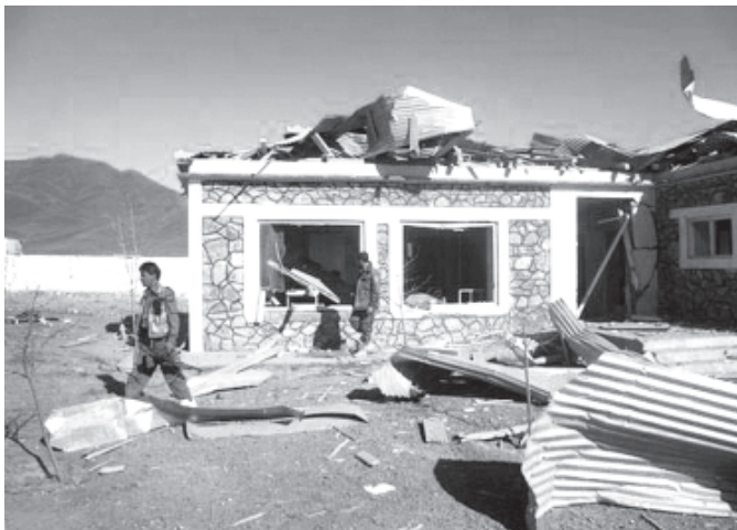
Afghan police officers walk past the outside of a clinic, damaged by an explosion in Mohammad Agha, Logar south of Kabul, Afghanistan, on 2 Dec, 2011. Afghan and NATO officials say a suicide bomber detonated a truck full of explosives outside a combat outpost in eastern Afghanistan, killing one person and wounding five people.