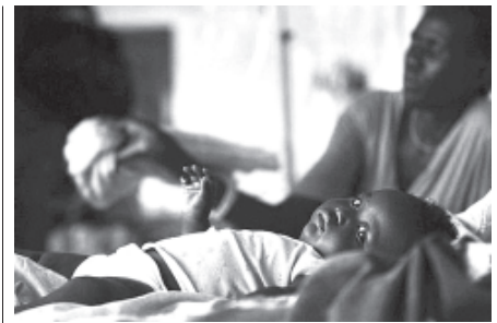
A malaria-infected baby lies in the main hospital in Juba, South Sudan. European scientists say they have identified a new way by which the malaria parasite survives in human blood, a finding that marks the latest laboratory advance against the disease.

Businesses and other organizations should encourage workers to use employee assistance programmes or other resources, such as counseling and stress management, to find ways to reduce the impact an abusive boss has on the family, the study authors said.— Internet