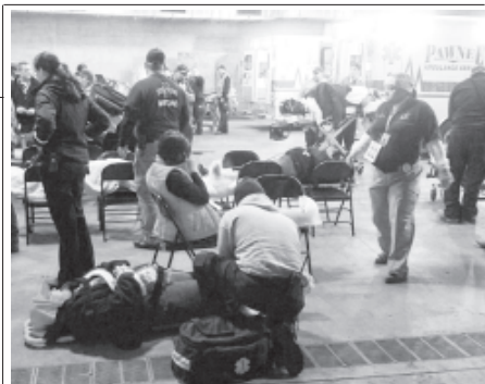
Emergency medical personnel tend to injured fans under Boone Pickens Stadium following Oklahoma State’s 44-10 win over rival Oklahoma in an NCAA college football game in Stillwater, Okla, on 3 Dec, 2011. Fans were injured during the course of celebrating, which included running onto the field and tearing down goal posts.—INTERNET