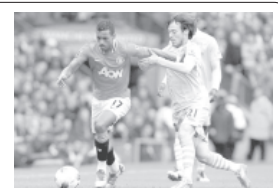
Manchester rivals United and City have 10 players between them on the shortlist.