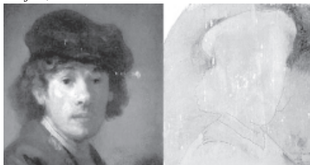
A known portrait of Rembrandt (L) with the newly uncovered painting (R).