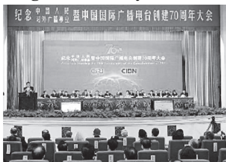
The Assembly Marking the 70 th Anniversary of the Establishment of CRI (China Radio International) is held in Beijing, capital of China, on 3 Dec, 2011.

Committee of the China (CPC) Central Political Bureau of the Communist Party of