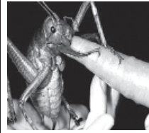
The world's largest insect

This is not good news for entomophobia sufferers. A former park ranger traveling in New Zealand has stumbled across the world's largest insect, a Weta Bug, with a wing span of seven inches and the weight of three mice.