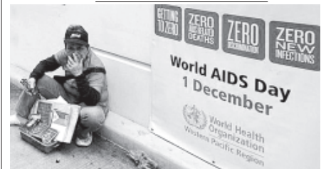
A vendor sits next to a world AIDS day poster displayed in front of the World Health Organization (WHO) regional office in Manila on 1 December.