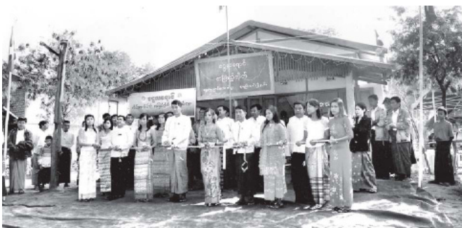
Self-reliant Ngwelayaung Library was opened in Shwedah Nyaunghtauk Village in Yamethin Township on 19 November. Departmental officials formally open the 28 feet long, 17 feet wide and 15 feet high library.—MYANMA ALIN