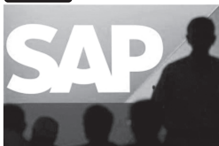
Shareholders arrive for the German software group SAP general shareholder assembly in Mannheim, 25 May, 2011.

BERLIN, 4 Dec— Germany's SAP announced a $3.4 billion cash deal to buy US web-based software company SuccessFactors, joining the scramble among technology firms to offer cloud-computing services to businesses.