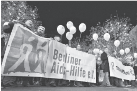
People march along Kurfuerstendamm street during an event to show love and care for HIV and AIDS carriers in Berlin, Germany, on 30 Nov, 2011.—XINHUA