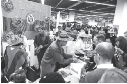
Visitors shop at the stand of Colombia during the International Charity Bazaar, which is organized by United Nations Women Guild Vienna, in Austrian capital Vienna on 3 Dec, 2011.