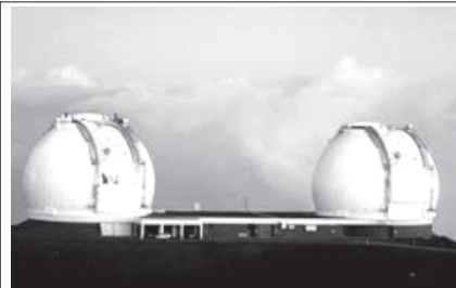
The twin telescopes at Keck Observatory in Hawaii. The astronomers used Keck to discover 18 new Jupiter-like planets orbiting massive stars.—INTERNET

few months after a different team of researchers announced the discovery of 50 newfound alien worlds, including one rocky planet that could be a good candidate for life. The list of known alien planets is now well over 700 and climbing fast.—INTERNET