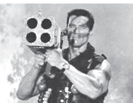
Hollywood action hero Arnold Schwarzenegger.