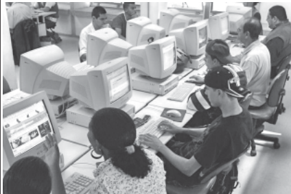
Brazilian internet users log on at a cybercafe in Sao Paulo, Brazil, in 2010. More than 78 million Brazilians have access to the Internet, according to third-quarter statistics provided Monday by the private consulting firm Ibope.—INTERNET

The total number of Brazil's 190 million people with access to the web at home, at work, in schools and cybercafes reached 73.9 million at the end of 2010. Of those with access to the Internet from home or from work, 46.7 million were active users in October, up 0.8 percent from September and up 11.9 percent from October last year. Meanwhile, online shopping sites registered 32.3 million customers in October, up 4.5 percent from September.— Internet