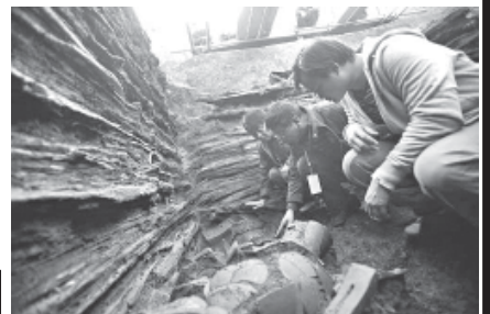
An ancient tomb more than 2,000 years old has been recently excavated in Northeast China's Liaoning Province.

As of November 2011, archaeologists working on the cluster as a whole have located 137 ancient tombs, cattle skulls and pottery in the style of the Central Plains of China.