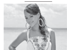
Pop star Rihanna