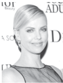
Actress Charlize Theron glasses because I was blind as could be and the boys didn't like [me],"

The 36-year-old star, who is portraying the character of a nasty schoolgirl in the new dark comedy 'Young Adult', recalled her own high school days as the girl who never fit in, especially with the boys. "I wore really nerdy