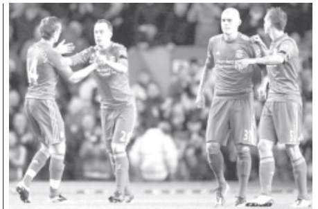
Liverpool are now unbeaten in eight Barclays Premier League matches

Tuesday night's game has been brought forward because of Barcelona's participation in the World Club Championship next month and the timing of the game means that Barca once again have little time to gather their strength, although nothing other than a win will serve their title ambitions.—Internet