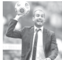
Barcelona coach Pep Guardiola

With the great rivals due to meet for the opening 'Clasico' of the campaign on 10 December at Real's Bernabeu stadium, Guardiola conceded the Madrid side had been the more impressive so far this season. "As a sportsman