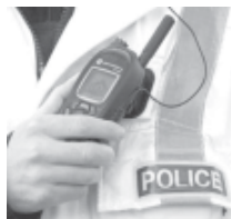
A man trying to break into his own house with a sledgehammer was questioned by police.

However, rather than a burglar, when police officers arrived they found a frustrated man armed with a sledge hammer - borrowed from another neighbour - trying to get into his home. An Essex Police