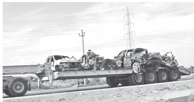
Vehicles destroyed by a suicide car bomb explosion are towed away in the town of Taji, about 12 miles (20 kilometres) north of Baghdad, Iraq, Monday, on 28 Nov, 2011. A suicide bomber slammed a car packed with explosives into the gate of a prison north of Baghdad on Monday, killing and wounding scores of people, police said.

A similar incident more than a year earlier left two Lebanese soldiers, a journalist and a senior Israeli officer dead. In May 2011, Israeli troops killed 10 people and wounded more than 110 others on Sunday on the border in south Lebanon during a Palestinian refugee protest to mark the anniversary of the 1948 creation of the Jewish state, which Palestinians term the "naqba," or catastrophe.—Internet