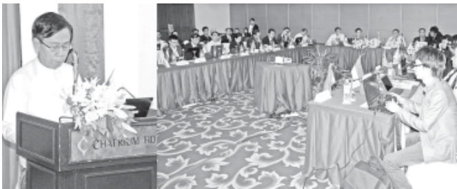
ASEAN-ITU Subregional CSIRT/CIRT/CERT Workshop for CLMV in progress.