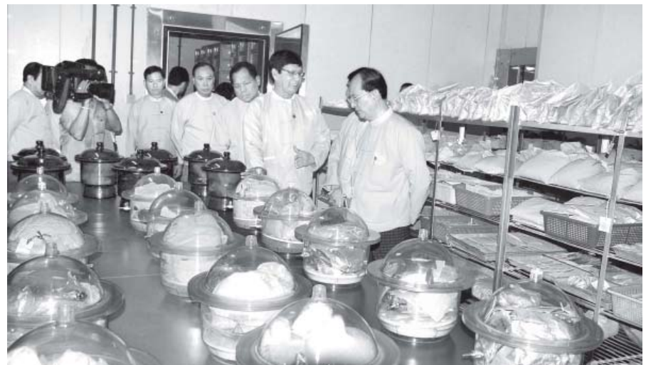
President U Thein Sein views preservation of strains at strains cold storage in Agricultural Research Department.