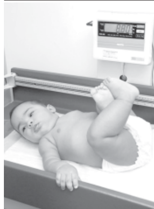
In this photo taken on 3 Oct, 2011, an infant's growth is measured during a check-up at Children's Hospital Boston. A new study by researchers there says babies who progress past at least two percentiles in weight and length on growth charts are at risk for obesity later in childhood.— INTERNET

bodies are produced to protect us against this bacteria, this could help in the development of vaccines and also in basically understanding better immune responses," she said. "What we were before lumping under the same umbrella, for example T cells or natural killer T cells, now we know that these cells are not just one type. "For each sub set there are other sub sets and we are increasingly understanding the specialisation of particular types of cells to perform very unique functions in the immune system."— Internet