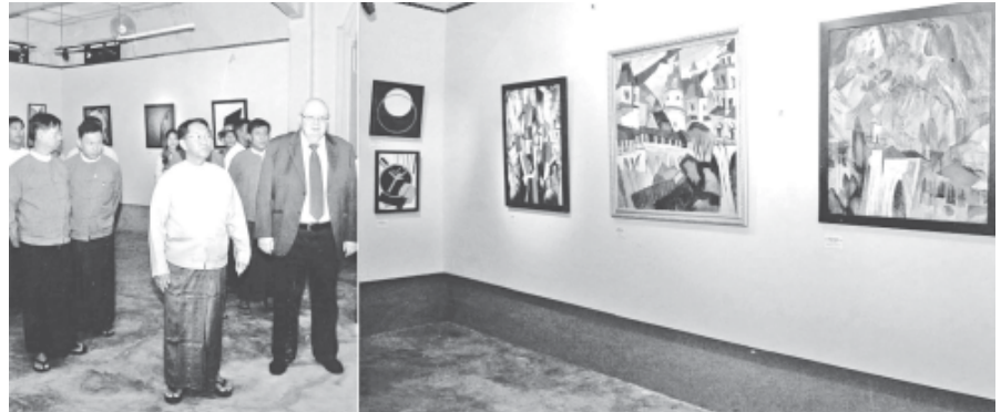
Yangon Region Chief Minister U Myint Swe and Russian Ambassador view paintings at Russian Avant Garde Art Exhibition.

YANGON, 29 Nov — Under the cultural exchange programme, the opening of Russian Avant-Garde Art Exhibition, jointly organized by the Ministry of Information, Ministry of Culture and Embassy of Russian Federation in Myanmar, took place at Painting and Sculpture Hall of the Ministry of Culture in Bahan Township, here, this morning, attended by Yangon Region Chief Minister U Myint Swe, the Region ministers, Russian Ambassador to Myanmar Dr. Mikhail Mgeladze and embassy staff,