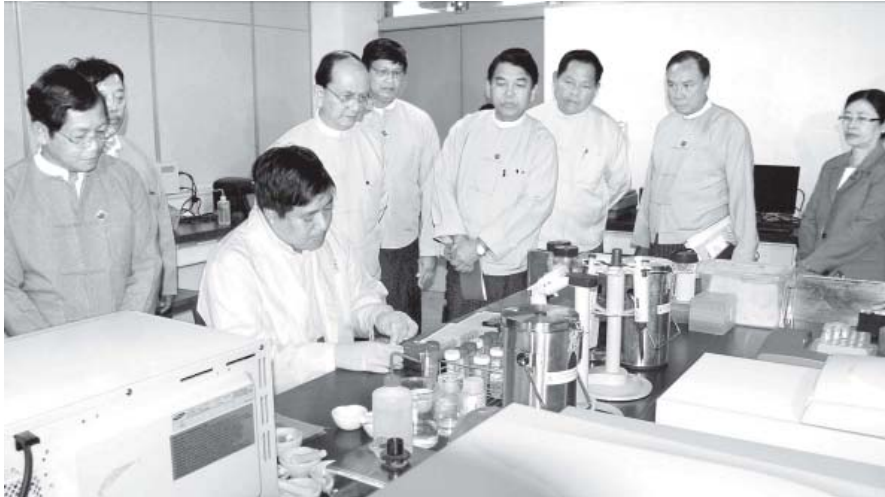
President U Thein Sein views testing of rice quality at plant biotechnological lab in Agricultural Research Department.