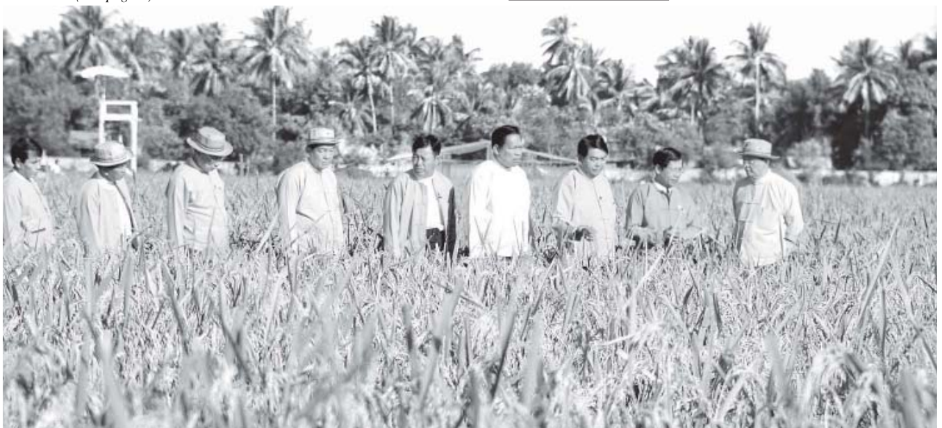
President U Thein Sein views 100-acre Palethwal high-yield and hybrid paddy strains in research farms at Yezin University of Agriculture.