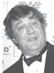
Actor Stephen Fry

The 54-year-old has joined comedian Ricky Gervais, actor Roger Moore and actress Susan Sarandon by voicing his support for TigerTime, which has launched a