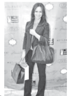
Actress Jennifer Love Hewitt

The 'I Know What You Did Last Summer' star will be playing the part of a mother forced to turn to prostitution to