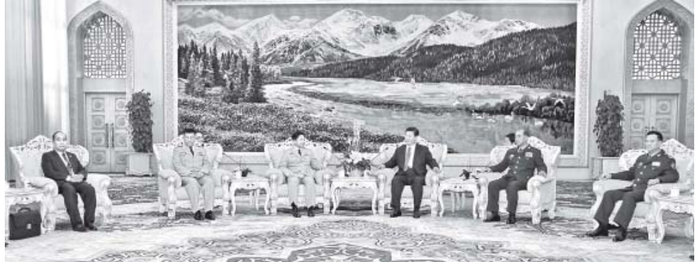
Commander-in-Chief General Min Aung Hlaing meets Vice-Chairman of Central Military Commission Vice-President of the People's Republic of China Mr Xij Jinping.