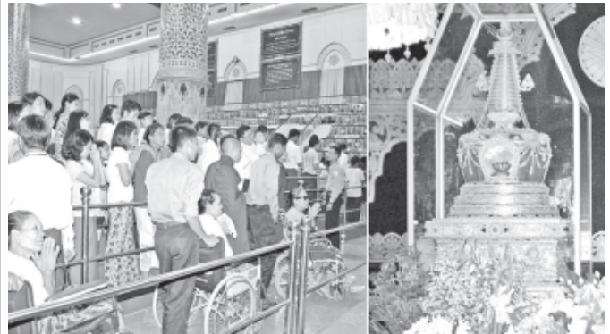
Pilgrims paying homage to Sacred Buddha Tooth Relic.

YANGON, 29 Nov— Pilgrims continued to crowd Kaba Aye Pagoda for the eighth day to pay obeisance to Sacred Buddha Tooth Relic at Maha Pasana cave on Kaba Aye Hill here today.