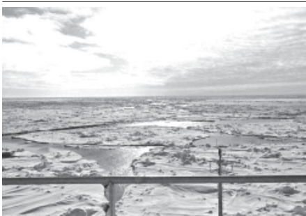
Photo taken on 28 Nov, 2011 from Chinese icebreaker Xuelong, or Snow Dragon, shows a sea area with intensive floating ice, on its expedition to Antarctica. The ice breaker Snow Dragon, carrying the Chinese Antarctic exploration team, would arrive at the Zhongshan Station at the end of November.

It even has "haptic feedback", or physical cues that allow surgeons to assess tissue and feel the amount of force applied during surgery, the