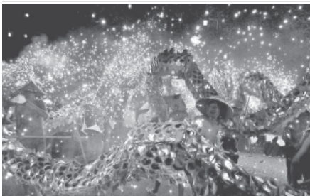
Dancers take part in the fire dragon dance during the Debao Tourism Festival in Debao County, southwest China's Guangxi Zhuang Autonomous Region, on 27 Nov, 2011. Fire dragon dance is a traditional custom in Debao County.

Liberal and left-leaning opposition parties have denounced the unilateral move by the conservative ruling party, which holds a comfortable parliamentary majority. Mass rallies voicing opposition to the agreement are held daily in downtown Seoul.—Xinhua