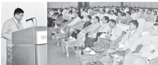
Deputy Governor U Maung Maung Win addresses Workshop on Developing Myanmar Bond Market.