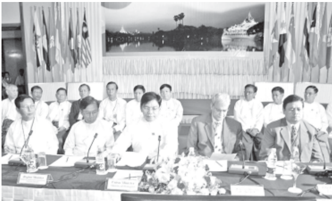
13 th Leading Committee Meeting of Cooperative Development of Operational Safety and Continuing Airworthiness Programme-South East Asia Programme (COSCAP-SEA-Programme) in progress.

NAY PYI TAW, 29 Nov— The 13 th Leading Committee Meeting of Cooperative Development of Operational Safety and Continuing Airworthiness Programme-South East Asia Programme (COSCAP-SEA-Programme) was held in Sedona Hotel in Yangon this morning.