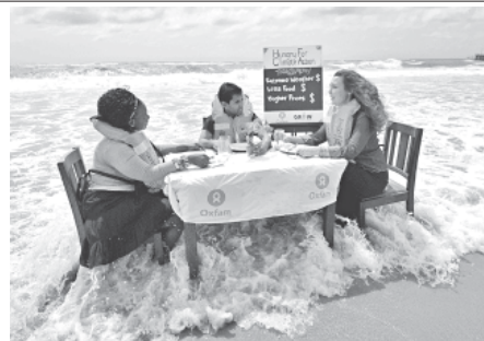
Oxfam activists make a protest aimed at 17th Conference of the Parties under the UN Framework Convention on Climate Change in Durban.