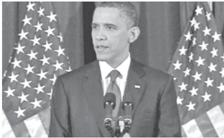
US President Obama

WASHINGTON, 29 Nov— As the election year approaches, US President Barack Obama is travelling more and more to states that were considered as contentious in next year's presidential contest.