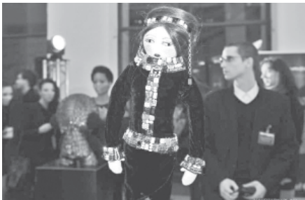
A doll designed by Chanel is shown during the exhibit of Frimousses de createurs at Petit Palais in Paris, France, on 28 Nov, 2011.