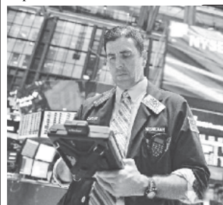
A trader works at the New York Stock Exchange in New York, the United States, on 28 Nov, 2011.

The Standard & Poor's 500 surged 33.88 points, or 2.92 percent, to 1,192.55. The Nasdaq Composite Index soared 85.83 points, or 3.52 percent, to 2,527.34.—Xinhua