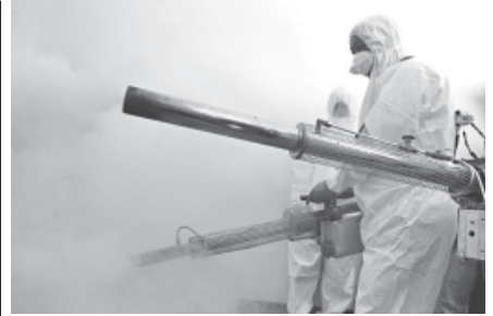
Thailand's Public Health Minister Withthaya Buranasiri fumigates a building after floodwaters receded in Ayuthaya Province on 26 Nov, 2011. Thailand's worst floods in 50 years have killed 610 people and devastated industry, but the situation is slowly improving, with water receding in many affected areas.