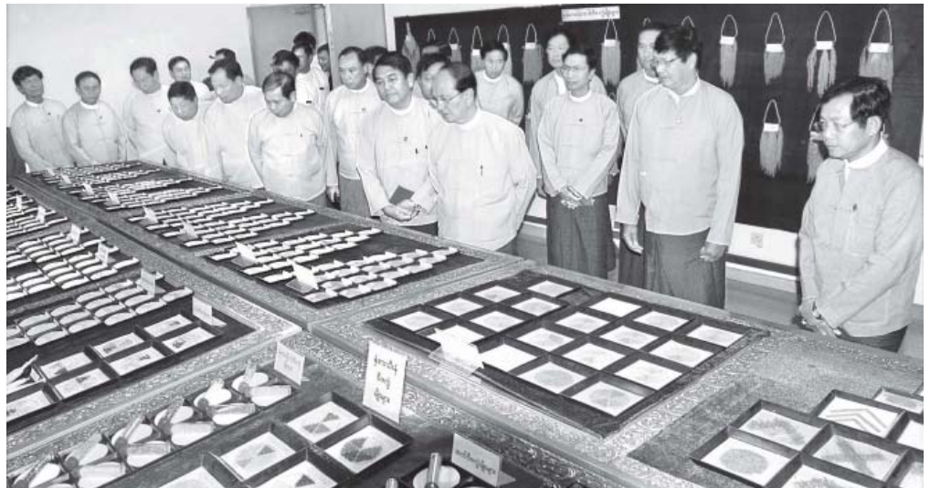
President U Thein Sein views display of strains collected from regions and states at crop species from different regions and states showroom.