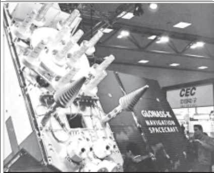
Glonass-K Satellite Model 1:1