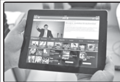
The new AFP (Agence France Presse) iPad application in Spanish is seen in Montevideo, Uruguay. Agence France-Presse (AFP) on Monday launched its iPad application in Spanish and Portuguese providing access to the latest stories, videos, pictures and graphics from its network of correspondents around the world.