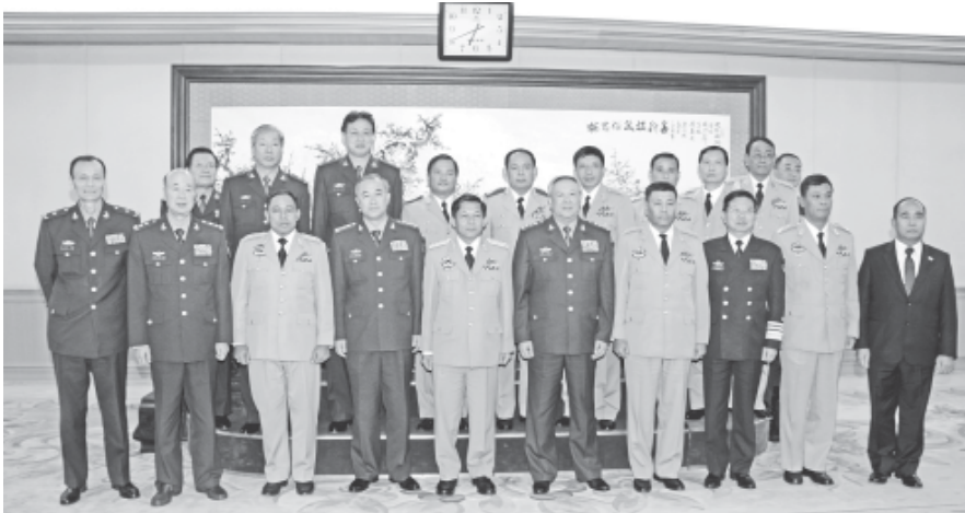
General Min Aung Hlaing and General Chen Bingde pose for documentary photo at the MoU signing between Myanmar and China on defence cooperation. (News on page 16)—MNA

Next, two Tatmadaw leaders exchanged gifts. Myanmar Tatmadaw delegation put up at Kuntai Royal Hotel. —MNA