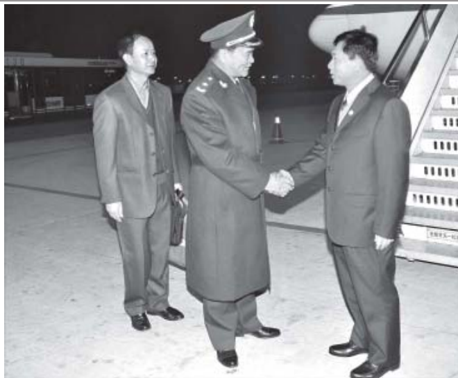
Commander-in-Chief of Defence Services General Min Aung Hlaing being welcomed by Director-General Maj-Gen Qian Lihua of Foreign Relations Department of People's Liberation Army of China at Beijing International Airport.—MNA