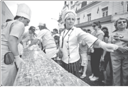
Bakers work on a 300-metre long apple pie in Buenos Aires, Argentina, on 27 Nov, 2011. The apple pie is believed to be the longest one in the world.