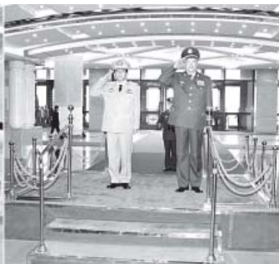
Commander-in-Chief General Min Aung Hlaing and Chief of PLA General Staff General Chen Bingde taking salute of Guard of Honour.