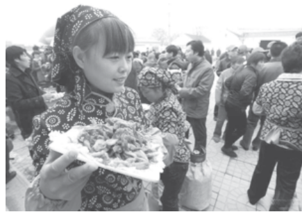
A competitor shows a dish of rural style at the farmhouse cooking festival of Baodi District of Tianjin, north China, on 26 Nov, 2011. The first farmhouse cooking festival of Baodi District kicked off at Zhanggangpu Village on Saturday, which attracted competitors from 29 farmhouses of this area. Tourists are able to participate in a series of rural tours and taste delicious food for free at the festival.