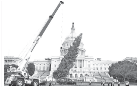
Workers load the 2011 US Capitol Hill Christmas Tree upon its arrival before the Capitol Hill in Washington DC, capital of the United States, on 28 Nov, 2011. The 118-year-old tree from California arrived in Washington, DC on Monday after a 23 days and 4280 miles journey across the country.