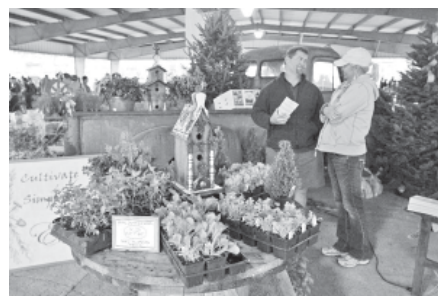
People choose vegetables in a weekend market in Sugar Land, Texas, the United State, on 26 Nov, 2011. Organic vegetables and fruits are directly supplied by farmers here every Saturday. XINHUA

The Etoile Filante soccer team were on their way to Sokode for a match on Sunday.—Xinhua