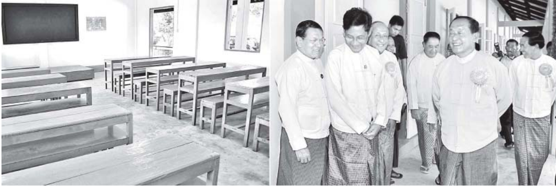
Vice-President Thiha Thura U Tin Aung Myint Oo looks round Shwemyo Basic Education High School (Branch).