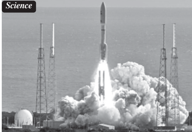
A United Launch Alliance Atlas V rocket carrying NASA's Mars Science Laboratory (MSL) Curiosity rover lifts off from Launch Complex 41 at Cape Canaveral Air Force Station in Cape Canaveral, Fla, on 26 Nov, 2011.

of another planet. It is equipped with a generator that converts heat from the natural decay of a non-weapons-grade