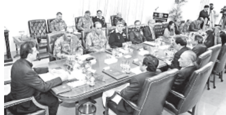
Pakistani Prime Minister Yousuf Raza Gilani (1st, L) chairs an emergency meeting of the Defence Committee of the Cabinet (DCC) in Islamabad, capital of Pakistan, on 26 November, 2011.