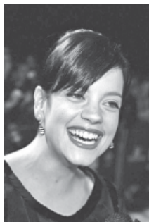
Singer Lily Allen

watching his appearance on television cookery show "Drop Down Menu" Thursday, reports contactmusic.com.