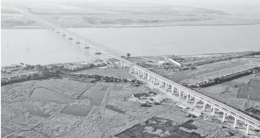
An aerial view of Ayeyawady Bridge (Nyaungdon).