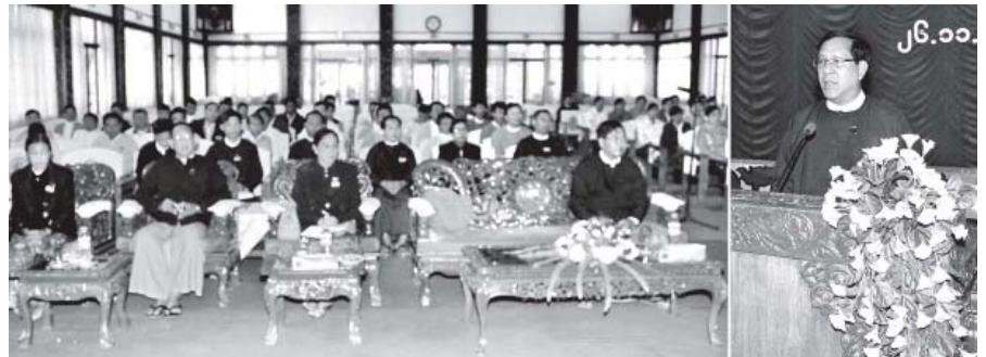
Chief Justice of the Union U Tun Tun Oo speaking to the chief justice and judges of the High Court of Shan State and judges, judicial officers and staff of courts.—MNA

NAY PYI TAW, 27 Nov—Chief Justice of the Union U Tun Tun Oo gave instructions on judiciary, court management and avoidance of bribe and corruption in meeting with the chief justice and judges of the High Court of Shan State and judges, judicial officers and staff of courts in Taunggyi