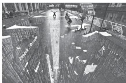
People break a world record as they take part in the world's largest and longest 3D anamorphic street painting, which is 60.46 metres (198.36 feet) long with a surface area of 892 metres square (9601 square feet), by British artist Joe Hill in the Canary Wharf district of London, on 17 Nov, 2011.

White was charged with misdemeanor counts of loitering and petty theft. He was released after posting $1,000 bond.