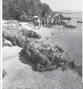
Visitors enjoy themselves at the geo park in Ma Shi Chau Special Area in Hong Kong, south China, 27 Nov, 2011. The 61-hectare Ma Shi Chau Special Area consists of Ma Shi Chau, Yeung Chau, Center Island and an unnamed islet. Home to well-outcropped rocks, the area is an ideal location for studying strata, rock properties, sedimentation features and different geological compositions. Tourists could visit along a 1.5 kilometers long route to visit attractions which highlight local geological features.