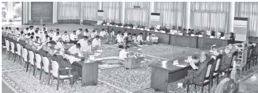
The 15 th Plenary Session of 47-member State Sangha Maha Nayaka Committee in progress.

works carried out during the term of office of the Sixth SSMNC (second branch) in respective sectors. Participants of the meeting discussed matters on Vinaya, learning and religious affairs and passed resolutions. The first-day meeting ended this afternoon.