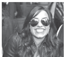
Actress Demi Lovato

"I learned how to be strong and healthy even through struggles. It also helped me open up about my issues and share them with others. Knowing that my family, friends and fans accept me for who I am is the greatest feeling ever," she added.— Internet