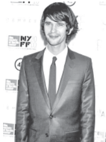
British actor Ben Whishaw

LONDON, 27 Nov—British actor Ben Whishaw will be portraying the character of Q in the new Bond flick 'Skyfall', his agent has confirmed. The role of 007's gadget designer was played by Desmond Llewelyn in From Russia With Love and most recently by John Cleese, opposite Pierce Brosnan, in 2002's Die Another Day .