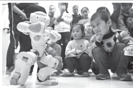
Children and their parents check out a robot practicing tai chi at the pediatric unit of Shandong University’s Qilu Hospital in Jinan, Shandong Province, on 12 Oct, 2011. The hospital brought the robot, which can sing and dance, to cheer up young patients.