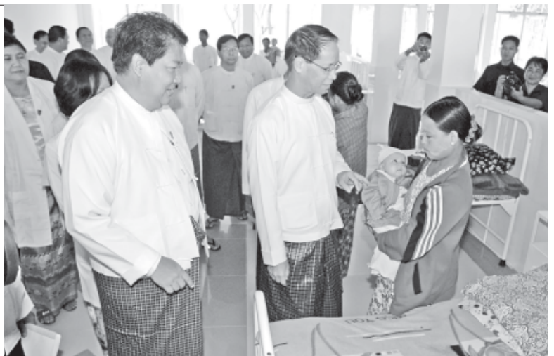
Vice-President Dr Sai Mauk Kham comforts patients at new Tatkon Township Hospital (100-bed).

He said that the past 50-bed Tatkon Township hospital was upgraded to the 100-bed hospital as of 26 May 2011. Due to difficulty of plot for extending the hospital building, the new hospital was built on the new