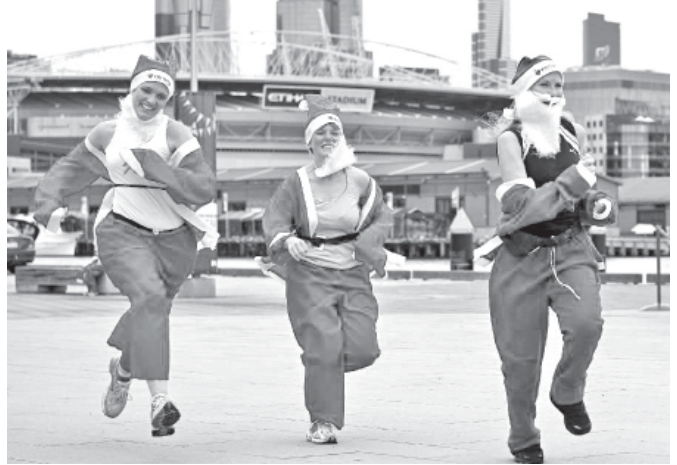
The participants of "Variety Santa Fun Run" are about to approach the finishing line after completing 5km fun run in Melbourne, Australia, on 27 Nov, 2011. The annual "Variety Santa Fun Run" was held in cities of Australia on Sunday and was aimed at collecting money for the children's fund before the Christmas Day.