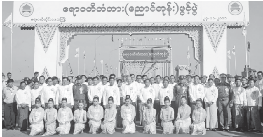
President U Thein Sein and personnel pose for documentary photo at the opening of Ayeyawady Bridge (Nyaungdon).