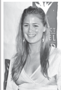
Actress Maura Tierney poses for photographers at the Project Angel Food's 11th annual Angel Awards in Los Angeles on 21 Aug, 2004.