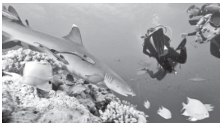
In this photo released by the PEW environment group, divers swim with a shark in this undated photo in the Coral Sea.—INTERNET

CANBERRA, (Australia) 27 Nov—Australia says it will create the world's largest marine reserve in the Coral Sea.