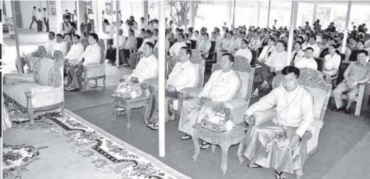
Vice-President Dr Sai Mauk Kham delivering address at the hospital (100- bed) handing-over ceremony.