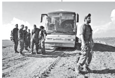
Israeli soldiers walk on Israel-Gaza border.

On Friday, Israeli ministers decided to maintain a freeze on the