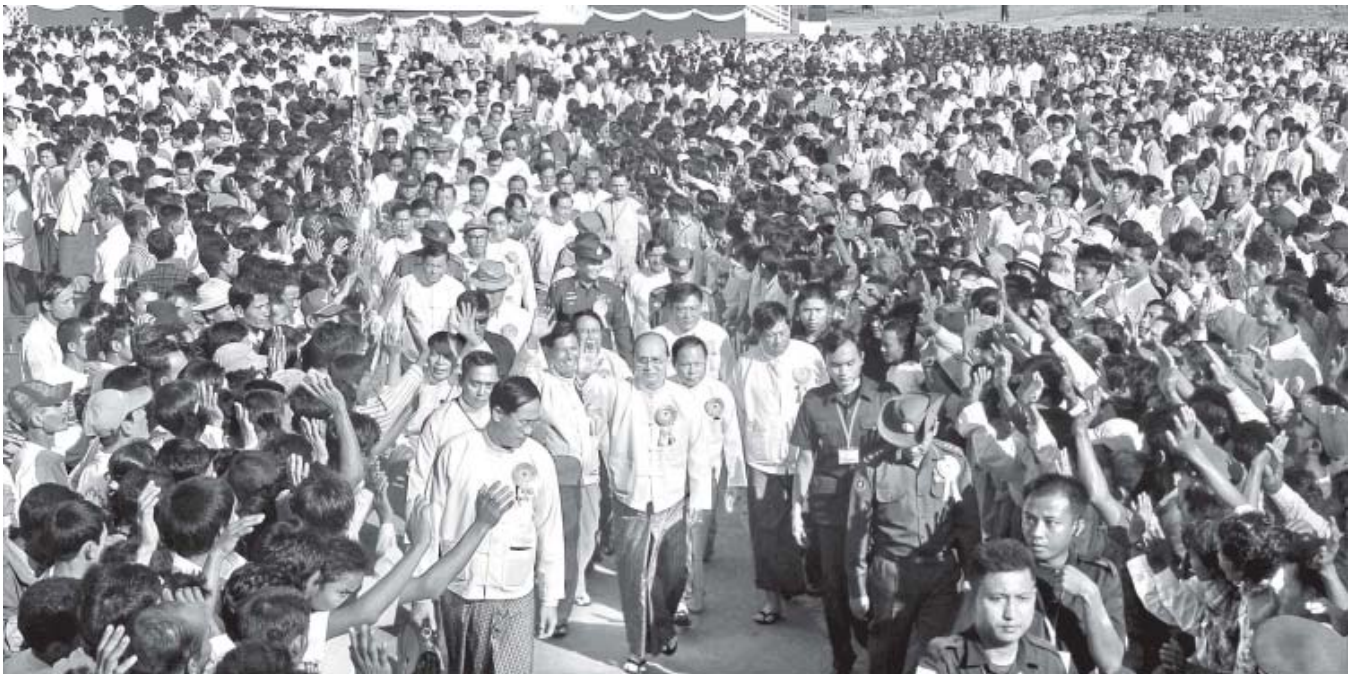
President U Thein Sein greets those at the opening ceremony of Ayeyawady Bridge (Nyaungdon).

YANGON, 27 Nov—Ayeyawady Bridge (Nyaungdon) constructed by Special Project Group No (5) of Public Works under the Ministry of Construction in Nyaungdon Township of Maubin District, Ayeyawady Region was inaugurated today, attended by President U Thein Sein.