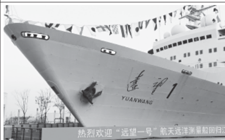
The "Yuanwang 1" Space Tracking Ship moors at the World Expo Park in Shanghai, east China, 27 Nov, 2011. "Yuanwang 1", China's first vessel for tracking and controlling rockets and spacecrafts that was retired in 2010 after 32 years on service, was moved to Shanghai's World Expo Park on Saturday. The vessel will serve as a museum for scientific education.