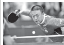
Ma Lin of China