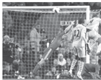
Vincent Kompany scores the opening goal for Manchester City at Liverpool.

Mario Balotelli was sent off for a second bookable offence. David Silva almost won it for the visitors but saw his shot cleared off the line in the final minute and then Hart made a superb stoppage-time save from Andy Carroll.— Internet