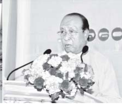
Vice-President Thiha Thura U Tin Aung Myint Oo attends presentation of educational assistance and scholarship awards to students by Aung Thiri Foundation in Pobbathiri Township.