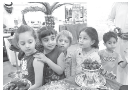
A group of kids wait in line for dates during the Emirates International Date Palm Festival in Abu Dhabi, UAE, on 22 Nov, 2011.

The mutated version of this protein leads to abnormal release of calcium from stores within the neurons which in turn disrupts the connections between neurons firing and muscle contractions, and eventually kills the neurons.—Internet