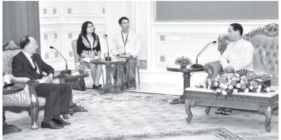
Vice-President Dr Sai Mauk Kham receives Director of State General Administration of Sports of China Mr Liu Peng and party.

NAY PYI TAW, 27 Nov— Vice-President of the Republic of the Union of Myanmar Dr Sai Mauk Kham received a seven-member Chinese delegation led by Minister of State General Administration of Sports Mr Liu Peng of the People's Republic of China at the hall of the President office at 11.30 am today.