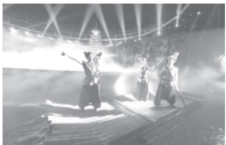
Actors perform during a dancing opera about the Dong ethnic group in Sanjiang Dong Autonomous County, southwest China's Guangxi Zhuang Autonomous Region, on 24 Nov, 2011.