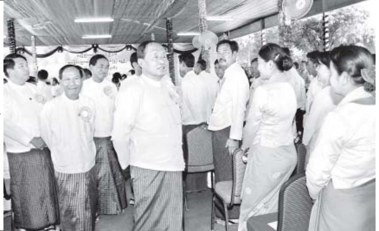
Vice-President Thiha Thura U Tin Aung Myint Oo cordially greets those present at handing over of school buildings at Shwemyo BEHS (Branch) in Tatkon Township.