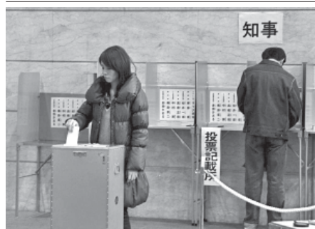
A voter casts her ballot at a polling station in Osaka city, Japan, on 27 Nov, 2011. The elections of the governor of Osaka Prefecture and the mayor of Osaka city was held on Sunday.