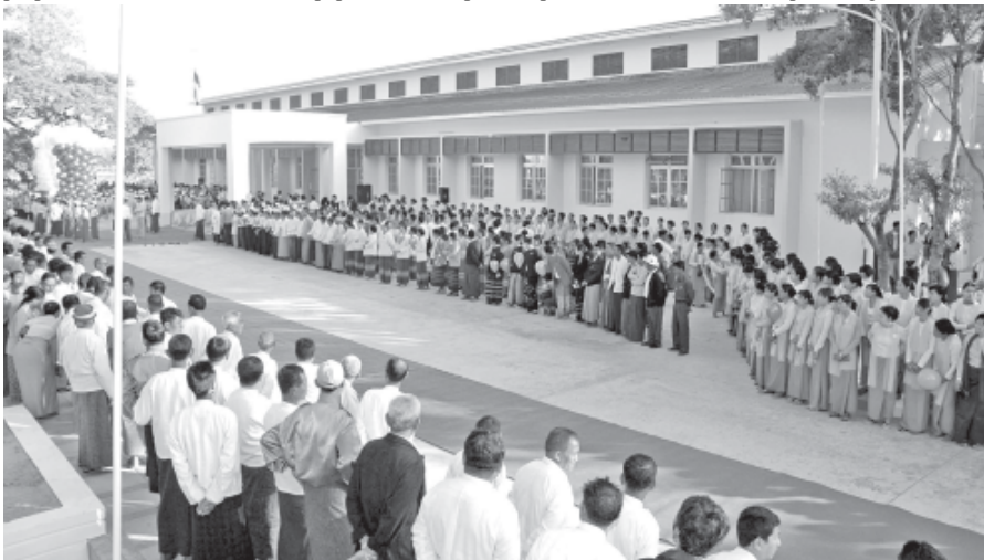
Opening ceremony of the hospital (100-bed) in Nay Pyi Taw Tatkon Township in progress.

The newly-opened township hospital (100-bed) is located on 30.55 acres of land at mile post 278/3 on Yangon-Mandalay Highway at the exist from Tatkon to Pyawbwe, in Bayintnaung Ward of Tatkon Township. The hospital constituted with five buildings was constructed by Shwedaung Development Co Ltd as of May 2011, spending K 3000 million allotted by the State.—MNA