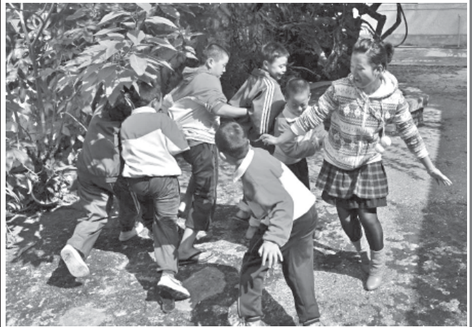
Children play with a teacher at a children's service centre in Ruili City, southwest China's Yunnan Province, on 18 Nov, 2011. Ruili City is located on the border between China and Myanmar, imperiled by the "Golden Triangle", an area where the borders of Myanmar, Thailand and Laos meet. A children's service centre, which was built on 31 May, 2010 for poor, weak and AIDS-affected children, provides those with education and cultivation of potential. The centre links the children with communities and schools. A total of 20 children study in the service centre.