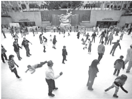
People ice skate at Rockefeller Centre in New York City. Manhattan retailers have decorated their department store displays for the season with elaborate designs and animated scenes.