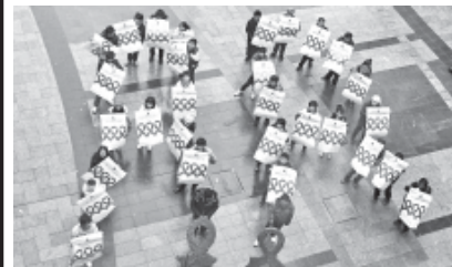
Volunteers holding posters of the red ribbons pose for photo at a shopping street in Shenyang, capital of northeast China's Liaoning Province, on 26 Nov, 2011. More than 100 volunteers from several universities in Shenyang on Saturday started an activity in shopping streets using posters and leaflets to publicize the knowledge about the AIDS to citizens, marking the 24 th World AIDS Day.—XINHUA

"This is the best gift I've ever had, and I will keep it forever," she said. Sun added rhinestones to her gift.—Internet