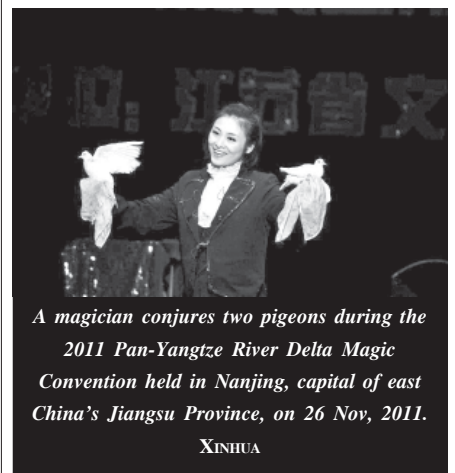
A magician conjures two pigeons during the 2011 Pan-Yangtze River Delta Magic Convention held in Nanjing, capital of east China's Jiangsu Province, on 26 Nov, 2011.