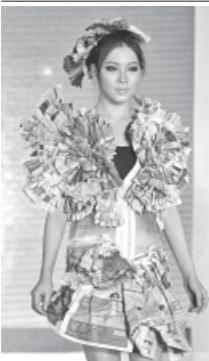
A student of Hubei Institute of Fine Arts presents costumes made of waste newspapers during a fashion show in Wuhan, capital of central China's Hubei Province, on 24 Nov, 2011.