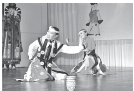
Mongolian artists perform during the ethnic festival in Ulan Bator, capital of Mongolia, on 24 Nov, 2011. The ethnic festival, hosted by the United Nations Development Programme (UNDP) and Mongolian National Chamber of Commerce and Industry, is held here on Thursday, presenting various traditional songs and dances, folk music, paintings, traditional foods and clothes as well as the improvement of production and living conditions here under the help of UNDP.