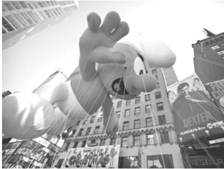
The Smurf balloon makes its way through Times Square in Macy's Thanksgiving Day parade in New York City. The 85th annual event is the second oldest Thanksgiving Day parade in the US.