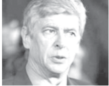
Arsene Wenger is surprised Arsenal are the only English side through.

LONDON, 25 Nov—Arsene Wenger is surprised Arsenal are the only Barclays Premier League side to progress in the Champions League. The Gunners boss was taken aback that his team qualified for the last 16 ahead