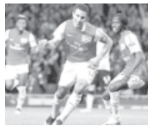
Robin van Persie scored twice against Dortmund to seal qualification

It seemed doubtful that the Londoners would even qualify for the group stages of the competition after struggling against Udinese in the playoffs, at a time when the club's form was so poor that