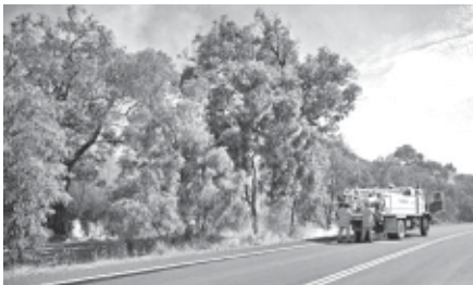
Fire fighters battle a breakout after a bush fire swept through the area on 24 Nov, 2011 in Margaret River, Australia.