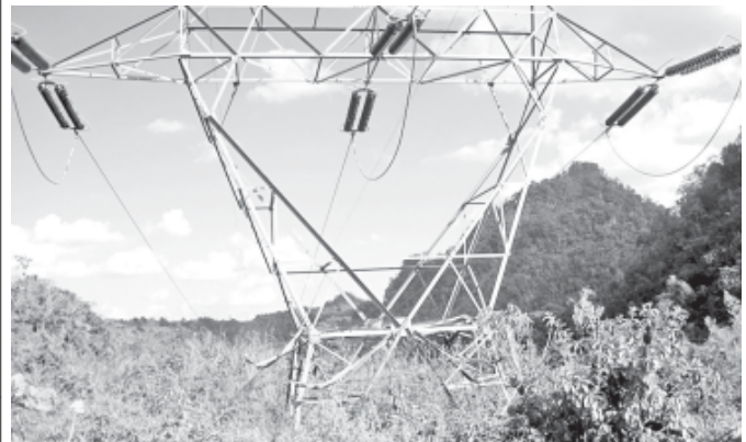
Tension Tower No.117 of the 230-KV Lawpita-Toungoo power grid seen after insurgents' mine blast. —MNA

NAY PYI TAW, 25 NOV — The tension tower No.117 of the 230-KV