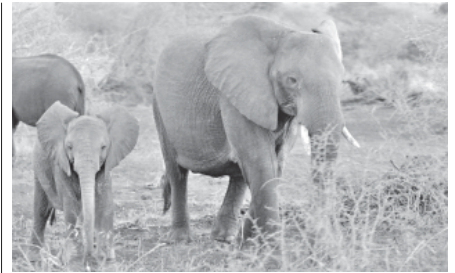
In this photo taken on 19 July, 2011, elephant walk through the Kruger National Park feeding of trees. Climate change could mean an unthinkable loss of wildlife in South Africa, which hosts talks on global warming that will bring government negotiators, scientists and lobbyists from around the world to the coastal city of Durban next week.