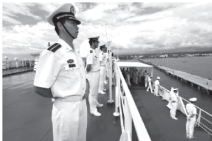
Sailors of the Chinese Navy “Peace Ark” hospital ship stand at attention upon arrival in Puntarenas, Costa Rica, on 23 Nov, 2011. The Chinese Navy “Peace Ark” hospital ship arrived in Puntarenas on 23 Nov, starting a seven-day visit in Costa Rica, the last stop of its four-nation goodwill visit to the Caribbeans and Central America.