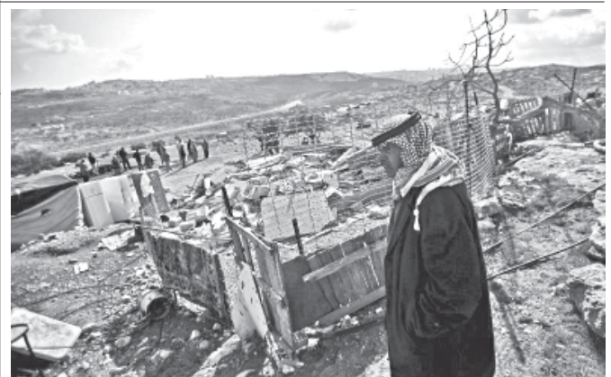
A Palestinian man surveys remains of his destroyed house in the West Bank village of Biet Hanena near the City of Ramallah, on 24 Nov, 2011. Israeli troops demolished four houses of Bedouin residents in the West Bank under the pretext of not having building permits on Thursday.