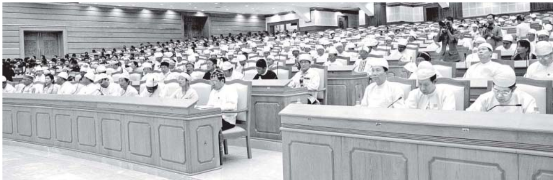
Pyidaungsu Hluttaw Representatives attend sixth day session of Pyidaungsu Hluttaw.