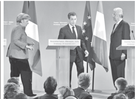
German Chancellor Angela Merkel (L), France's President Nicolas Sarkozy (C) and Italy's Prime Minister Mario Monti (R) give a Press conference in Strasbourg.