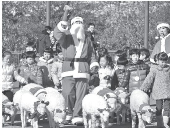
A sheep breeder dressed up as Santa Claus walks with a flock of sheep during an event celebrating the coming of Christmas at the Everland Resort in the City of Yongin, South Korea, on 24 Nov, 2011.