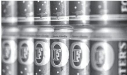
Photo illustration of cans of Foster's beer in Sydney 23 August, 2011.

Business CANBERRA, 25 Nov—Australia's government approved on Friday SABMiller's A$11.5 billion ($11.2 billion) deal to acquire Foster's Group Ltd under foreign acquisitions laws, but imposed conditions requiring the company to keep brewing operations in Australia. The government approval is the final regulatory condition to be cleared ahead of the Foster's shareholders vote set for 1 December, which is expected to pass the deal. Treasurer Wayne Swan, who also approved acquisition of the remaining 50 percent of Pacific Beverages now owned by Coca-Cola Amatil, said SABMiller must keep management of the iconic Australian beer brand in Australia. SABMiller must also continue to invest in Foster's, the maker of Victoria Bitter, Carlton Draught and Pure Blonde, and not shift any of Foster's existing brewing facilities offshore to produce beer for the Australian domestic market, he said. "SABMiller has agreed to a number of undertakings which recognize the significance of Foster's to our economy and to our community, and support Australian jobs," Swan said in a statement. SABMiller last week raised its cash takeover offer for Foster's to A$5.40 a share to make up for the loss of a 30 cents capital return after a tax ruling from Australian authorities. Reuters