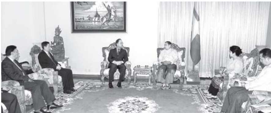
Union Foreign Affairs Minister U Wunna Maung Lwin receives Mr Faruk Khan, Minister of Commerce of the People’s Republic of Bangladesh.—MNA

NAY PYI TAW, 25 NOV—Mr Faruk Khan, Minister of Commerce of the People’s Republic of Bangladesh, paid a courtesy call on Union Foreign Affairs Minister U Wunna Maung Lwin at the latter’s office here today.