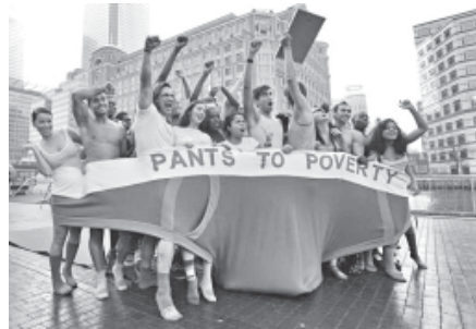
Participants in their underwear pose for a group photograph with their certificate after breaking a world record for the most number of people, 57, to fit in an over-sized pair of underpants measuring 5 metres by 1.5 metres in the Canary Wharf District of London, on 17 Nov, 2011.