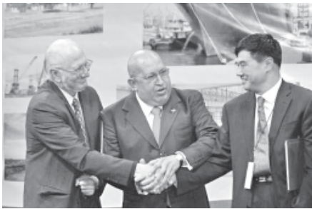
Venezuela's President Hugo Chavez (L) shakes hands with Vice Minister of China's National Development and Reform Commission Zhang Xiaoqiang (R), and Venezuelan Minister of Economy Jorge Giordani (C) in Caracas on 24 Nov, 2011.

CARACAS, 25 Nov—Venezuelan President Hugo Chavez Thursday hailed the country's strategic cooperation with China, saying it set an example for other Latin American countries.