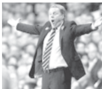
Harry Redknapp was surprised he was able to land the midfielder

LONDON, 25 Nov—Harry Redknapp was stunned that Tottenham Hotspur's rivals did not swoop for Scott Parker. The Spurs manager completed the signing of the former West Ham United midfielder on deadline day and has been delighted by the impact made by the midfielder. Parker was arguably the only player to emerge from the Hammers squad with any credit at the end of last term as they finished bottom of the Barclays Premier League.