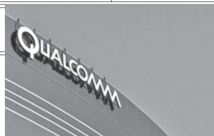
A sign sits atop the Qualcomm headquarters building on 1 Nov, 2011, in San Diego.

The display contains tiny mirrors that consume power only when they're moving, easing battery drain. Mirasol displays also quickly change from one image to the next and show video.