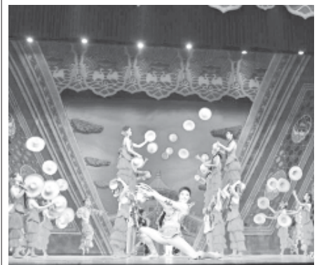
Photo taken on 24 Nov, 2011 shows a scene of the acrobatics show "Swan Lake", which is adapted from the classical Russian ballet with the same name, in Beijing, capital of China. It has been performed in more than ten countries and regions since 2004.

Incidents of retribution over witchcraft acts are common in rural parts of Zambia, where old people are usually the targets.