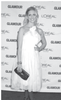
Actress Sarah Michelle Gellar arrives for the Glamour Magazine 2008 Women of the Year ceremonies held at Carnegie Hall in New York on 10 Nov, 2008.

George Clooney will also be honoured with the prestigious Chairman's trophy.