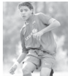
Mexican midfielder, Jonathan Dos Santos