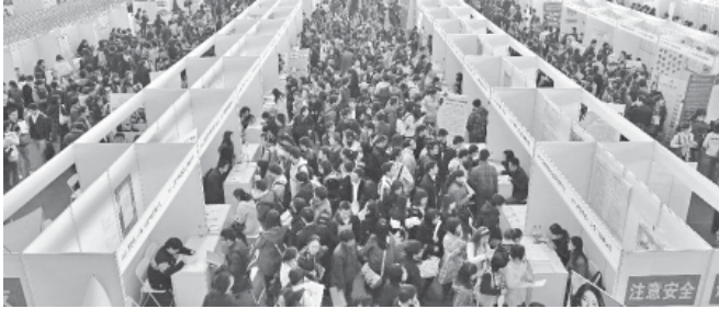
Crowded job seekers are seen at a recruitment fair in the Donghua University in Shanghai, east China, on 24 Nov, 2011. Some 500 domestic and oversea enterprises offered about 20,000 job vacancies for graduates at the fair.