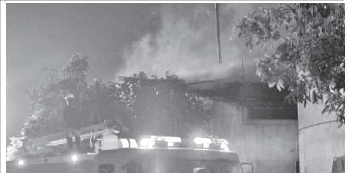
Photo taken on 24 Nov, 2011 shows blast site of the Futian Chemical Company in Wenbian Village of Panyu District in Guangzhou, capital of south China's Guangdong Province.