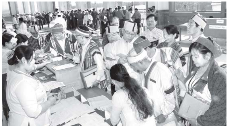
Representatives of Pyidaungsu Hluttaw sign in attendance books.

In his speech, the Speaker said that it is necessary to seek the resolution of the Pyidaungsu Hluttaw whether it is agreed to combine the Ministry of Industry-1 and the Ministry of Industry-2 to be the Ministry of Industry . Although the dates should be designated for the Hluttaw representatives wishing to enlist and to participate in the discussions on reformation of the ministry, the dates for submission on list of representatives