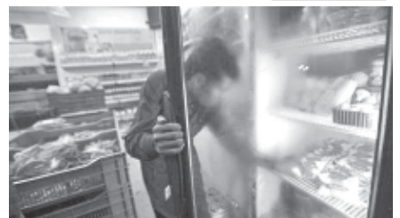
A man takes out a packet of yogurt from a refrigerator at a food store in Noida on the outskirts of New Delhi on 24 Nov, 2011.

Business NEW DELHI, 25 Nov—India threw open its $450 billion retail market to global supermarket giants on Thursday, approving its biggest reform in years that may boost sorely needed investment in Asia's third-largest economy. The world's largest retail group, Wal-Mart Stores Inc, and its rivals see India's retail sector as one of the last frontier markets, where a