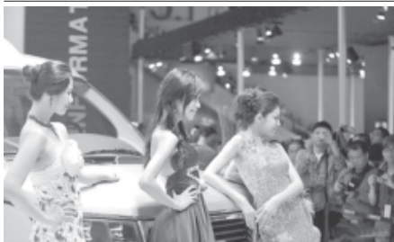
Models show a GMC Multi-Purpose Vehicle (MPV) at the 9th Guangzhou Auto Show in Guangzhou, south China, on 24 Nov, 2011. Themed as 'Green Technology and Harmonious Future', the 9th Guangzhou International Automobile Exhibition displayed 900 automobiles, including 30 world premiered cars and 54 new energy vehicles.