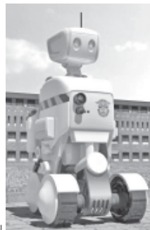
Korean robotic prison guard.

alongside robots in the near future. A group of scientists, who developed the robots in cooperation with the country's justice ministry, spent a billion won ($850,000) developing the robotic prison guard, which is supposed to enable its human counterparts to concentrate more on rehabilitation work with offenders.