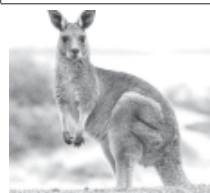
Native species: The kangaroo only hopped away when it was scared off by the boy's father (file picture).