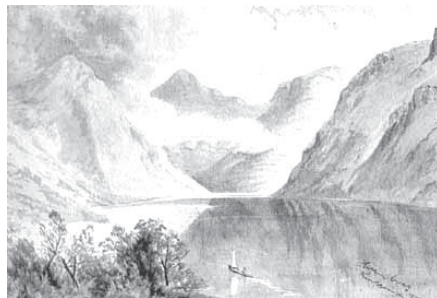
Adolf Hitler's painting.—INTERNET

The blog post came in response to the two petitions launched by UFO enthusiasts, which indicted the government of covering up knowledge or contact with life beyond Earth.— Internet