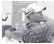
Golfer Tiger Woods (L) of the US

"It was a wrong thing to say, something that