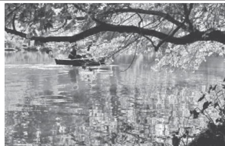
Tourists go boating in the Central Park in New York, the United States, on 7 Nov, 2011.