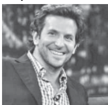
Actor Bradley Cooper

"I remember when I first did 'Alias' my parents would call and say, 'We can't understand you! You're mumbling! Stop looking down! Tell them not to put the camera so close, your nose looks huge and your face is all distorted'," he added.— Internet