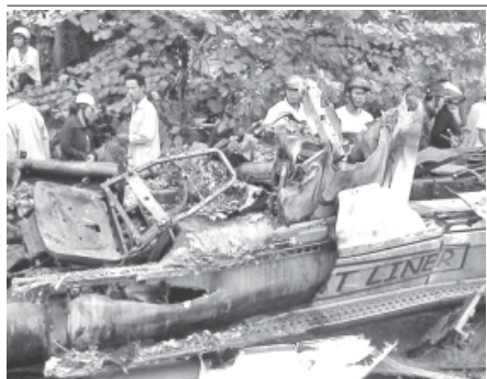
Rescue workers gather at the scene of a road accident in Ham Thuan Bac District in Vietnam's central Binh Thuan Province.

We'll do an analysis to determine how we can minimize disruptions like this in the future."—Internet