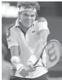
Milos Raonic of Canada returns the ball to Julien Benneteau of France during their match at the Paris Tennis Masters tournament, in Paris, on 7 Nov, 2011.