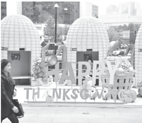
A woman walks past the "corn house", in Nanjing, capital of east China's Jiangsu Province, on 8 Nov, 2011. The "corn house" is designed for the upcoming Thanksgiving Day, and also to remind people of cherishing food. The house using green materials can provide enough space for two to three person sitting inside to rest or to take shelter from rain.