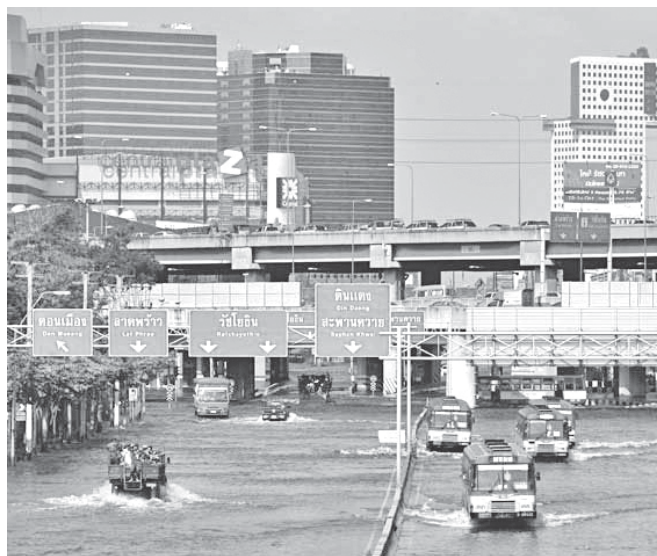
Vehicles make their way on a flooded road at Lad Phrao intersection in Bangkok, Thailand.