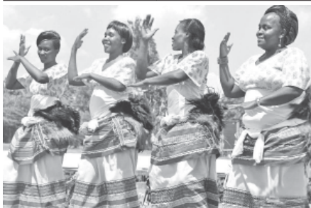
Uganda has been ranked the Number One destination for tourists for the year 2012 by publisher Lonely Planet.