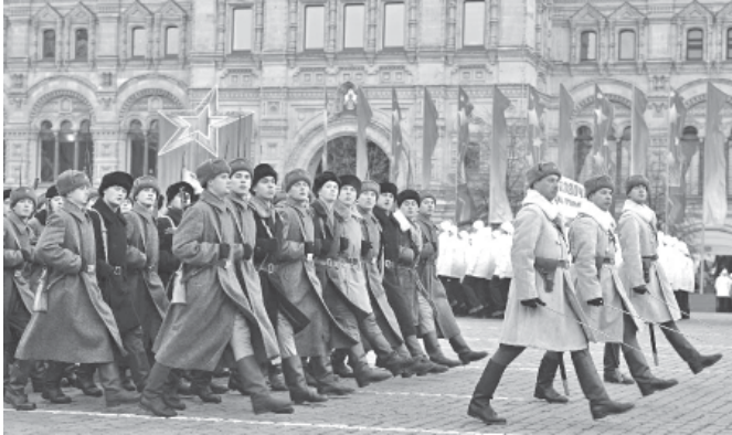
Russian servicemen in historical uniforms take part in a military parade at the Red Square in Moscow, Russia, on 7 Nov, 2011. The parade marks the 70th anniversary of a historical parade in 1941 when Soviet soldiers marched through Red Square towards the front lines during World War Two.