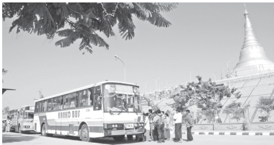
Transportation Sub-committee provides free transportation services to pilgrims of Sacred Buddha Tooth Relic with buses.