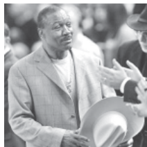
Boxing Legend Joe Frazier

"We The Family of the 1964 Olympic Boxing Heavyweight Gold Medalist, Former Heavyweight Boxing Champion and International Boxing Hall of Fame Member Smokin' Joe Frazier, regrets to inform you of his passing," the statement