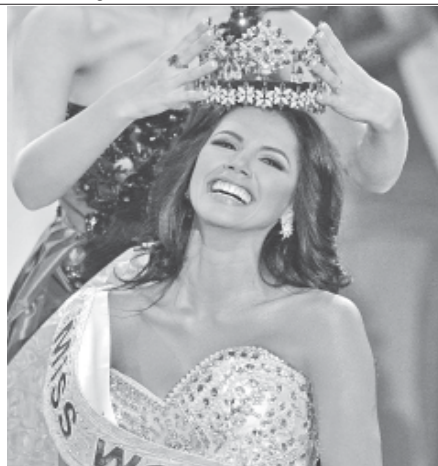
Miss Venezuela, Ivian Sarcos, reacts after being crowned Miss World 2011 in Earls Court in west London on 6 Nov, 2011.