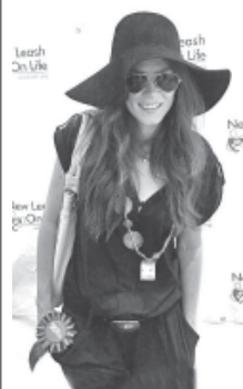
Actress Anna Friel

"I thought the relationship would last forever, but as you get older you realise that certain relationships are for certain times," she added.