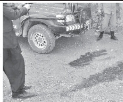
Photo taken on 7 Nov, 2011 shows the Taliban militants' attack site in Baghlan Province, north of Kabul. Two suicide bombers were killed and six people were injured Monday morning when a suicide bombing rocked Baghlan Province 160 km north of Afghan Capital of Kabul, police spokesman in the province said.