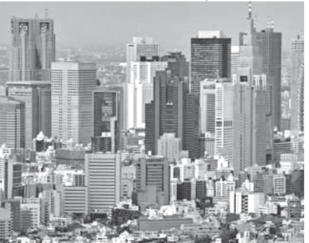
A view of the Shinjuku area of Tokyo, a commercial and administrative hub, known as the metropolis' second centre.

Japan has purchased a total of 2.975 billion euros of EFSF bonds so far this year.