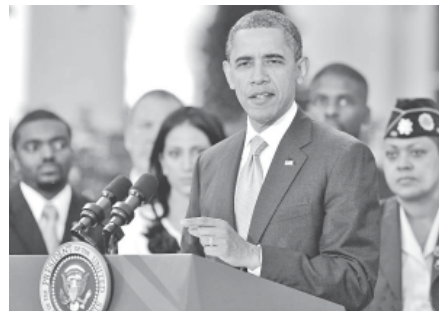
US President Barack Obama delivers a speech on tax credits included in the American Jobs Act and new executive actions in the Rose Garden of the White House in Washington DC, capital of the United States, on 7 Nov, 2011. Obama on Monday announced three new initiatives to get veterans back to work, as part of recent executive actions the president has taken to jump start the economy and create more jobs.