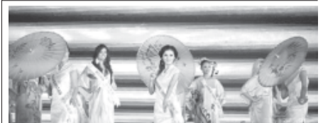
Contestants give performance during the Miss Tourism World 2011 World Final competition in Yingtan City, east China's Jiangxi Province, on 5 Nov, 2011. The Miss Tourism World 2011 World Final was held in Yingtan on Saturday, during which 53 beauties from all over the world competed for the Miss Tourism World laurel, which was finally won by an Indian beauty.