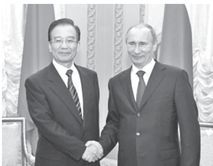
Chinese Premier Wen Jiabao (L) meets with Russian Prime Minister Vladimir Putin in St Petersburg, Russia on 7 Nov, 2011.

He notes that enhanced strategic coordination will