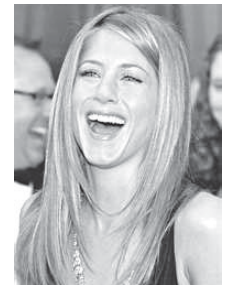
Actress Jennifer Aniston