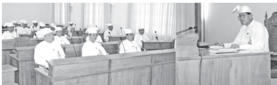
Second-day session of Taninthayi Region Hluttaw in progress.

NAY PYI TAW, 8 Nov—The Kachin State Hluttaw meeting was held for the first day at State Hluttaw Building today, attended by State Chief Minister U La John Ngan Sai and, Speaker of State Hluttaw U Ya Wan Jone and 46 Hluttaw representatives. 13 questions were asked and answered and three new proposals were submitted at the meeting.