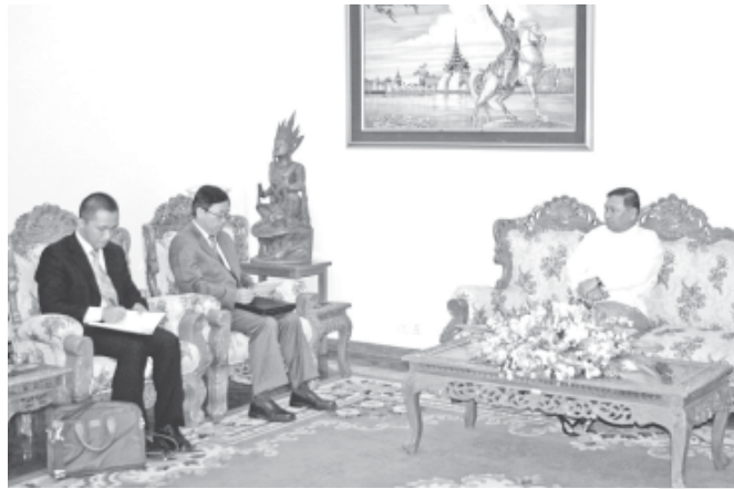
Union Foreign Affairs Minister U Wunna Maung Lwin receives Chinese Ambassador to Myanmar Mr Li Junhua.