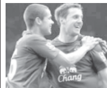
Phil Jagielka says Jack Rodwell deserves his England call.

LONDON, 8 Nov —Defender Phil Jagielka says Everton team-mate Jack Rodwell fully deserves his first England call-up.