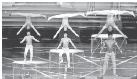
Vietnamese acrobats perform in Cangzhou, north China's Hebei Province, on 4 Nov, 2011. A three-day acrobatics performance started in Cangzhou on Friday, showcasing awarded programmes of the 13th China Wugiao International Circus Festival which had concluded in the provincial Capital Shijiazhuang on 30 Oct.

Hitler failed to be accepted by the Vienna Academy of Art. The German leader, in his early life, earned money by drawing advertisements and postcards.