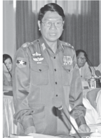
Union Minister for Defence Lt-Gen Hla Min makes clarifications. MNA

Next, the Vice-President called on those present to give suggestions on requirements, difficulties and rehabilitation works to be done in Pakokku District by