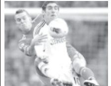
Agger says Liverpool played like headless chickens against Swansea.

"Sometimes we looked like headless chickens running around after the ball," Agger said.— Internet