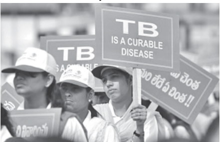
Indian medical nurses display placards in Hyderabad in March 2011. Indian researchers said Monday they were close to developing an "electronic nose" to sniff out tuberculosis on the breath — offering rapid diagnosis that could save hundreds of thousands of lives.—INTERNET