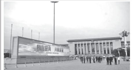
People view a photo exhibition celebrating the 80th founding anniversary of the Xinhua News Agency at the Tian'anmen Square in Beijing, Capital of China, on 7 Nov, 2011. More than 120 photos taken by Xinhua reporters in the past 80 years are displayed at the exhibition, which kicked off here Monday.