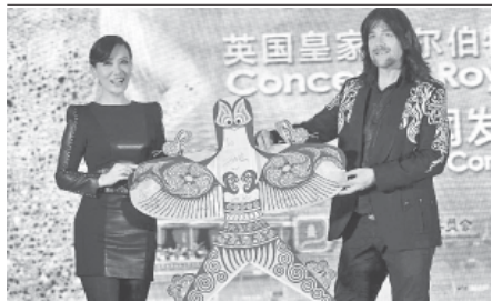
Chinese singer Tan Jing (L) presents a Chinese traditional kite to Swedish composer pianist Robert Wells (R) at a Press conference in Beijing, Capital of China, on 7 Nov, 2011.