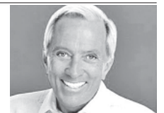
Singer Andy Williams

Williams vowed to return to the stage next September and October to celebrate his 75 th anniversary in show business.— Internet