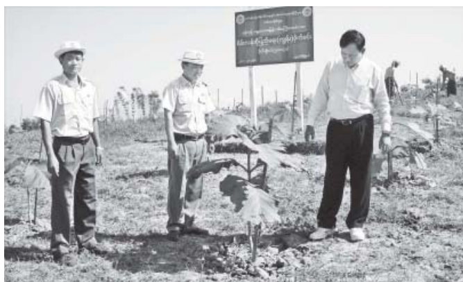
Nay Pyi Taw Council Member U Myint Swe inspects teak plantations near mile post No. 213/5 on Yangon-Mandalay Expressway and eucalyptus plantations in Mingon Village-tract in Nay Pyi Taw Council Area.—MNA

Respective ministries are repairing railroads, motor roads and bridges for timely transportation. On 14 November, Shwechaung bridge will be able to pass as repair works for temporary passage will be finished. Works for cultivating substituted crops, establishing model villages, low-cost housings, schools and clinics, and reestablishing vocational industries are being carried out. Measures are being taken sector-wise to rejuvenate psychological and physical strength of victims.—MNA