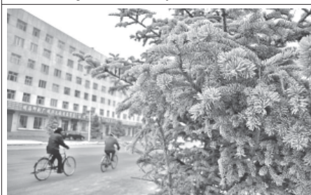
People ride past rime-covered trees in Yakeshi City, north China's Inner Mongolia Autonomous Region, on 8 Nov, 2011, the traditional solar term of the Beginning of Winter this year.—XINHUA