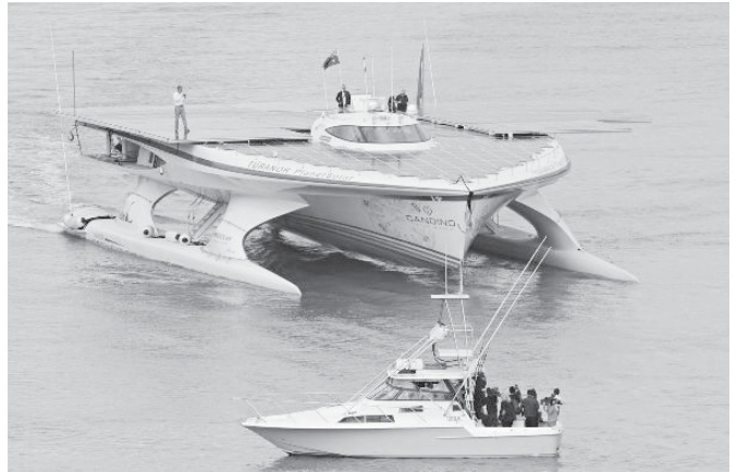
The world's largest solar-powered boat, the Turanor PlanetSolar, is sailing into Brisbane, after crossing the Pacific from the Panama Canal, as part of its quest to become the first fully solar-powered vessel to circumnavigate around the world.