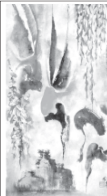
Freehand brushwork "Rhythm of Chinese Ink" by Sun Guokang.