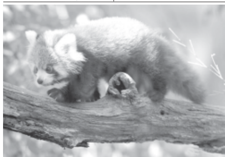
Kaj, a four-month-old red panda, walks on a tree during celebration of Red Panda Day in Zagreb Zoo, on 5 Nov, 2011. On the occasion of International Red Panda Day, Zagreb Zoo invited visitors to suggest names for the newborn baby red panda.