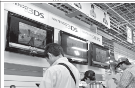
Customers try to play Nintendo's handheld game console 3DS at a Tokyo electric shop, July 2011. Nintendo said its net loss swelled to 70.3 billion yen ($925 million) for the six months to September as it forecast a full-year loss, citing the strong yen and a lack of hit game titles.