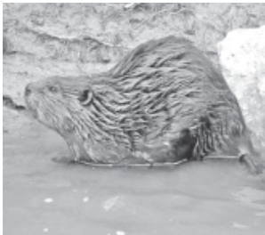
A beaver.

A Canadian senator is calling for the country to remove the beaver, which she called a "dentally defective rat," from its national emblem.