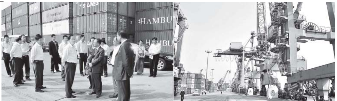
Vice-President of the Republic of the Union of Myanmar Thiha Thura U Tin Aung Myint Oo visits Huang Pu Port of Gurazhou Port Group in Guangzhou.

NAY PYI TAW, 29 Oct— The Myanmar delegation led by Vice-President of the Republic of the Union of Myanmar Thiha Thura U Tin Aung Myint Oo, accompanied by Chinese Ambassador to Myanmar Mr Li Junhua, arrived at Yantang dairy product factory in Guangzhou on 26 October morning.