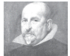
The portrait was confirmed to be by Velazquez after x-ray examination.