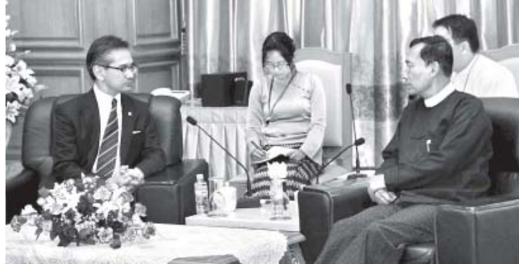
Pyithu Hluttaw Speaker Thura U Shwe Mann receives Indonesian Foreign Affairs Minister Dr R.M. Marty M. Natalegawa.

NAY PYI TAW, 29 Oct—Pyithu Hluttaw Speaker Thura U Shwe Mann received Indonesian guests led by Indonesian Foreign Affairs Minister Dr. R. M. Marty M. Natalegawa at Pyithu Hluttaw hall of the Hluttaw Building here at 3:00 pm today.