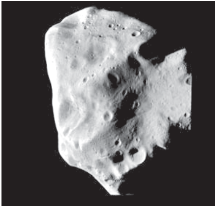
A year after the flyby, the analysis shows that Lutetia is a primordial asteroid, with a surface covered in craters, pulverized rocks and landslides. It may also have tried to form an iron-core billions of years ago.

PARIS, 29 Oct—Data from a European spacecraft study of a distant asteroid show it is a primitive body left over as planets were forming in the solar system, astronomers said. The European Space Agency's Rosetta spacecraft flew by the asteroid Lutetia in July 2010 and scientists have finished analyzing the data gathered during the brief encounter, a release from ESA headquarters in Paris said Thursday. The analysis confirms their initial impression of Lutetia as an old, primitive "mini-world," the release said.