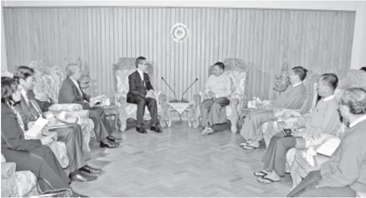
Union Minister for Labour and Social, Relief and Resettlement U Aung Kyi receives Indonesian Foreign Affairs Minister Dr R.M. Marty M. Natalegawa and party.

NAY PYI TAW, 29 Oct— At the invitation of Union Minister for Foreign Affairs U Wunna Maung Lwin, Indonesian guests led by Indonesian Foreign Affairs Minister Dr R.M. Marty M. Natalegawa arrived Nay Pyi Taw from Yangon at 7:45 am today. They were warmly welcomed by Deputy Minister for Foreign Affairs U Maung Myint and officials concerned at Nay Pyi Taw Airport.