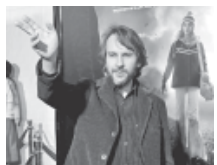
Director Peter Jackson says "The Hobbit: An Unexpected Journey" will debut in his hometown of Wellington, New Zealand, next year.