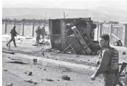
Foreign and Afghan forces arrive at the site of a suicide attack in Kabul 29 October, 2011.

KABUL, 29 Oct—A suicide car bomber killed 13 foreign troops in the Afghan capital Kabul on Saturday, the deadliest single ground attack in 10 years of war in Afghanistan. "We can confirm that 13 International Security Assistance Force members have died," said a spokesman for the NATO-led International Security Assistance Force (ISAF), giving no further details.