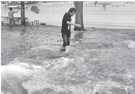
A Thai person wades through floodwaters in Bangkok, Thailand, on 29 Oct, 2011. The complex network of flood defences erected to shield Thailand's capital from the country's worst floods in nearly 60 years was set for a serious test Saturday as coastal high tides approached their peak.

BANGKOK, 29 Oct—Floods engulfing parts of Bangkok should start to recede in the first week of November, the prime minister said Saturday after barriers along the swollen main river prevented a disastrous overflow.