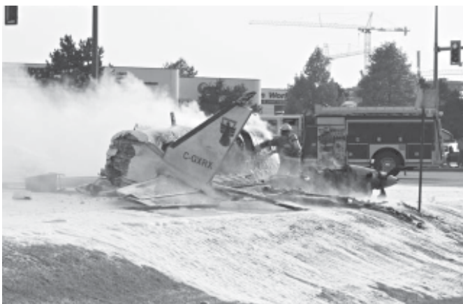
A small plane crash-landed on a road, hit a car and burst into flames after take-off in Vancouver, sending all nine aboard as well as two in the car to hospital, some with critical injuries.