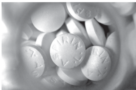
Long-term, daily doses of aspirin led to a fall of some 60 percent in cases of colorectal cancer among people with an inherited risk of this disease, the journal The Lancet reported on Friday.— INTERNET

There were 23 cancers in the placebo group, but only 10 in the aspirin group, amounting to a fall of 63 percent. The difference began to be seen after five years.— Internet