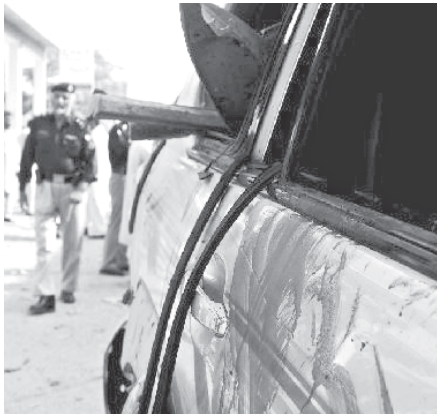
People and policemen gather at the blast site near northwest Pakistan's Nowshera on 28 Oct, 2011.

The injured were shifted to a hospital and