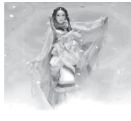
A model presents a creation by Qu Tingnan during China Fashion Week in Beijing, capital of China, on 28 Oct, 2011.

The film's main unit was shooting several hours away in Bansko. One man was killed at the site and