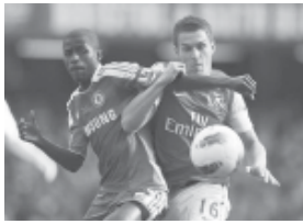
Chelsea's Ramires challenges Arsenal's Aaron Ramsey during their English Premier League soccer match in London.

LONDON, 29 Oct—Arsene Wenger promised the Premier League would see a stronger, tighter, more confident Arsenal after they ran roughshod over London rivals Chelsea in the closing minutes of a pulsating 5-3 away win on Saturday. The Arsenal manager said that coming back from behind twice in the match showed his young team's new belief. A hat-trick for Robin van Persie demonstrated the Dutch forward's exceptional finishing but also the service he had started to receive from his ebullient team mates.