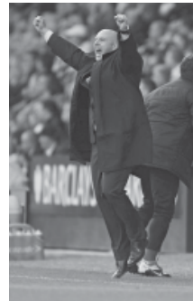
Blackburn Rovers manager Steve Keane celebrates a goal during the Barclays Premier League match between Norwich City and Blackburn Rovers at Carrow Road on 29 October, 2011 in Norwich, England.

NORWICH, 29 Oct—Grant Holt scored a stoppage-time equalizer from the spot after a