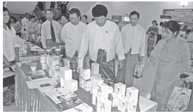
Union Health Minister Dr Pe Thet Khin views educative materials on stroke.

NAY PYI TAW, 29 Oct — Union Minister for Health Dr Pe Thet Khin called on the people for urgent action to address the silent stroke