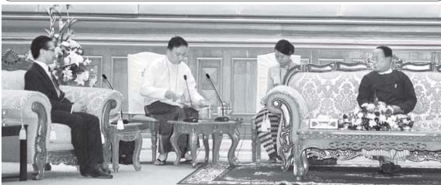
Pyidaungsu Hluttaw Speaker U Khin Aung Myint receives Indonesian guests led by Indonesian Foreign Affairs Minister Dr R.M. Marty M. Natalegawa.—MNA

NAY PYI TAW, 29 Oct— Pyidaungsu Hluttaw Speaker U Khin Aung Myint received Indonesian guests led by Indonesian Foreign Affairs Minister