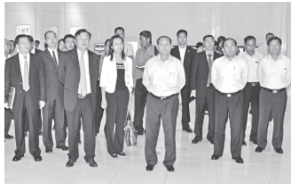
Vice-President of the Republic of the Union of Myanmar Thiha Thura U Tin Aung Myint Oo views advanced electrical communication devices at head office of Huawei in Shenzhen.—MNA