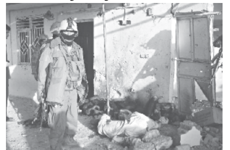
Policemen stand guard at the attack site in Kandahar, Afghanistan, 28 Oct, 2011.