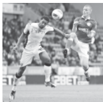
Fulham's Moussa Dembele, left, challenges Wigan Athletic's Ben Watson for the ball during the English Premier League soccer match at the DW Stadium, Wigan, England, Saturday 29 Oct, 2011.

Wigan, which has lost eight straight league games, has five points from 10 games, while Fulham has 10 from 10.