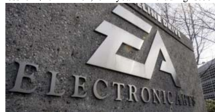
This 25 Feb, 2008, file photo, shows the exterior view of Electronic Arts Inc headquarters in Redwood City, Calif. Electronic Arts Inc reports quarterly earnings on 27 Oct, 2011, after the market close.

ending on 30 Sept grew to $340 million, or $1.03 per share. Last year, the company had a quarterly loss of $201 million, or