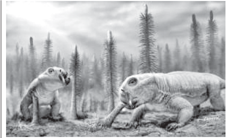
Survivors: Lystrosaurus , a relative to mammals, was one of a handful of "disaster taxa" to escape from the rubble of the Permian Period, along with the metre-high spore-tree Pleuromeia . Low diversity of animals delayed the full recovery of land ecosystems by millions of years.