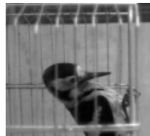
This slow-motion footage reveals the woodpecker's head-banging antics in detail.