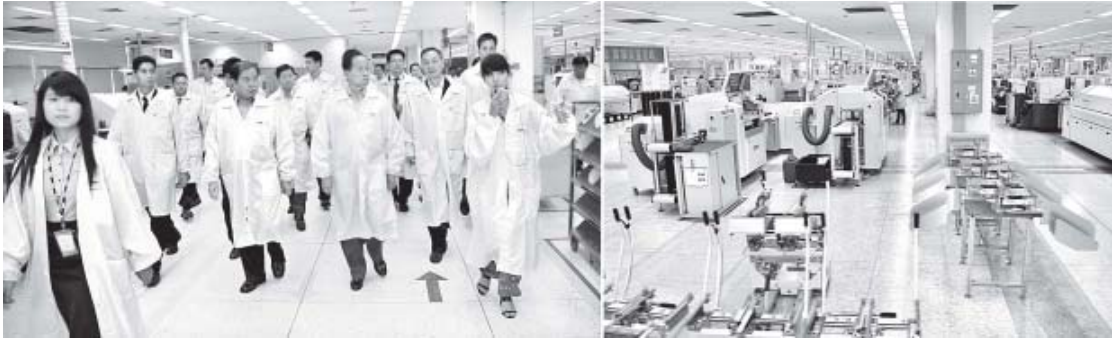
Vice-President Thiha Thura U Tin Aung Myint Oo visits factory of ZTE Corporation in Shenzhen. (News on page 16)