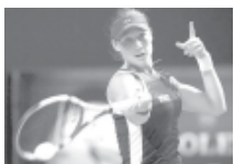
Samantha Stosur of Australia returns the ball to China's Li Na at the WTA tennis championship finals in Istanbul, Turkey, on Friday.

ISTANBUL, 29 Oct—Australia's Samantha Stosur beat China's Li Na 6-1, 6-0 on Friday to qualify for the semifinals of the WTA Championships. Stosur, the US Open champion, dominated the French Open winner, dropping only the fifth game of the first set as she