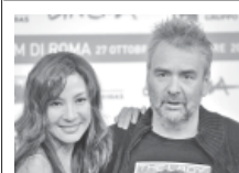
Director Luc Besson (R) and actress Michelle Yeoh pose during the photo-call for the film "The Lady" at the 6th International Rome Film Festival in Rome, Italy, on 27 Oct, 2011. "The Lady" by Luc Besson opened the 6th International Rome Film Festival on Thursday.