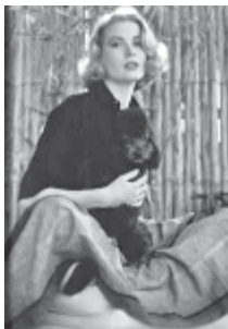
actress Grace Kelly

WASHINGTON, 29 Oct—A biopic is being planned on the life of iconic actress Grace Kelly, who went on to become a member of the royal family of Monaco when she married Prince Rainier of Monaco in 1956.