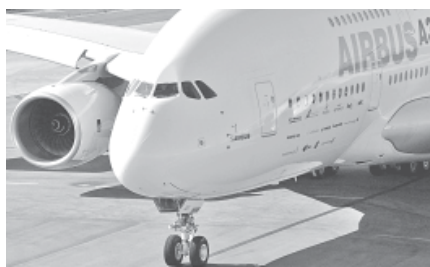
Airbus A380.

PARIS, 29 Oct—Airbus unveiled a provisional deal on Friday to sell four A380s worth $1.5 billion at list prices to Transaero Airlines, marking the first sale of Europe's superjumbo to a Russian airline.