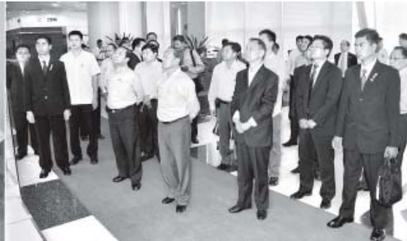
Vice-President Thiha Thura U Tin Aung Myint Oo visits factory of ZTE Corporation in Shenzhen, PRC.