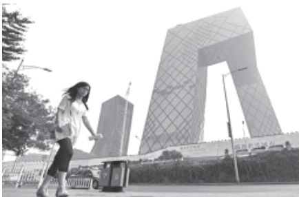
A woman walks pass the China Central Television (CCTV) complex in Beijing in 2010. China's state broadcaster CCTV plans to expand its global operations next year, state media said Thursday.

She said the overall flood situation in central parts of Thailand had improved and volumes of water flowing through the Chao Phraya had decreased.