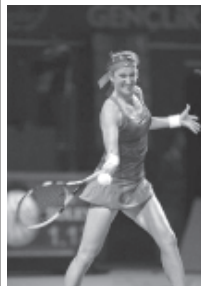
Victoria Azarenka of Belarus