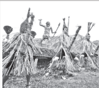
People of Tujia ethnic group perform Maogusi dance in Xiangxi Tujia and Miao Autonomous Prefecture, central China's Hunan Province, on 15 Oct, 2011. Maogusi is an old form of dance popular among the Tujia people living in the western Hunan Province. It is performed to remember their ancestors' achievements in cultivation, halieutics and hunting.