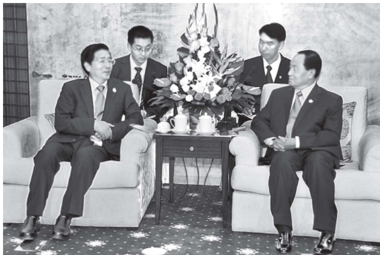
Vice-President Thiha Thura U Tin Aung Myint Oo receives Standing Committee Chairman of People's Congress of Guangxi Zhuang Autonomous Region of PRC Secretary of Guangxi Committee of Communist Party of China Mr Guo Shengkun.

NAY PYI TAW, 27 Oct— Vice-President of the Republic of the Union of Myanmar Thiha Thura U Tin Aung Myint Oo received Standing Committee Chairman of People's Congress of Guangxi Zhuang Autonomous Region of the People's Republic of China Secretary of Guangxi Committee of Communist Party of China Mr Guo Shengkun at Li Yuan Resort in Nanning on 20 October evening.