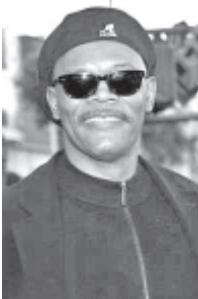
Actor Samuel L Jackson

NEW YORK, 27 Oct — Actor Samuel L Jackson, who has grossed 7.42 billion dollars through-out his entire film career, has been declared as highest-grossing actor of all time by the Guinness Book of World Records .