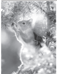
A squirrel eats berries in a tree in Cologne, Germany.