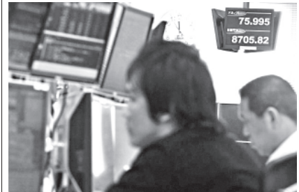
Money traders work under a screen indicating the exchange rate of the Japanese yen against the US dollar at a foreign exchange firm in Tokyo on 26 Oct, 2011.—INTERNET