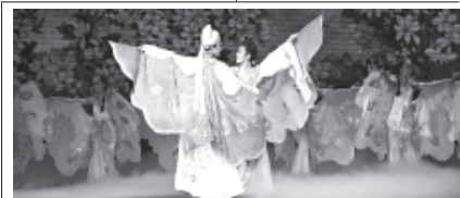
Artists from the Phibada Opera Troupe give performance in Changchun, capital of northeast China's Jilin Province, on 25 Oct, 2011. An opera adaptation of "the Butterfly Lovers", a traditional Chinese love tragedy, was staged by Phibada Opera Troupe from the Democratic People's Republic of Korea (DPRK) in Changchun on Tuesday, which launched the troupe's 3-month performance tour around China.

consumers of non-diet carbonated soft drinks, the probability of aggressive behaviour was 9 to 15 percentage points higher - the same magnitude as the impact of alcohol or tobacco - the findings showed. —Internet