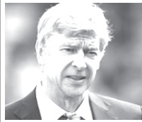
Arsene Wenger was delighted with Park's display in attack.

LONDON, 27 Oct—Arsenal manager Arsene Wenger felt Park Ju-young showed exactly what he is capable of in the Carling Cup on Tuesday.