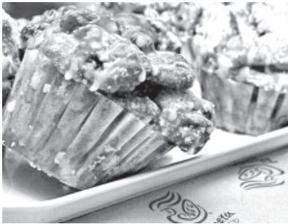
A muffin on display at a Panera Bread Co restaurant in Chicago 12 February, 2009.