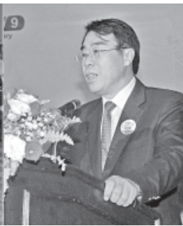
Deputy Minister Mr Tain Jin of National Broadcast, Film and Television General Bureau speaking at ceremony to launch CCTV international channels.