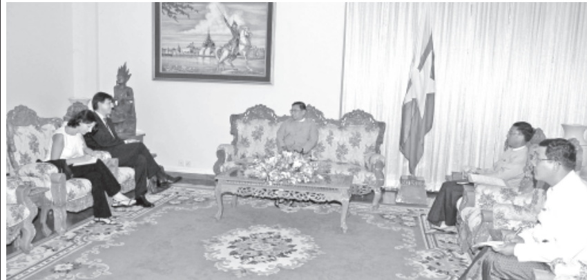
Union Minister for Foreign Affairs U Wunna Maung Lwin receives Italian Ambassador to Myanmar Mr Paolo Andrea Bartorelli.

NAY PYI TAW, 27 Oct— Union Minister for Foreign Affairs U Wunna Maung Lwin received Italian Ambassador to the Republic of the Union of Myanmar Mr. Paolo Andrea Bartorelli at this noon at his office