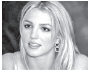
Pop star Britney Spears

LONDON, 27 Oct — Pop star Britney Spears has taken a liking to the distinctive taste of the bread spread