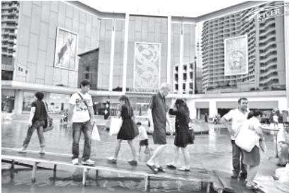
People walk on temporary walk way in front of shopping mall on 26 Oct, 2011 in Bangkok, Thailand.

BANGKOK, 27 Oct—Bangkok residents were fleeing the capital Thursday after authorities called an emergency five-day holiday and urged people in flood-prone parts of the city to leave to avoid a massive deluge. Flood waters were already seeping into central parts of Bangkok in the morning, with waters entering the iconic Grand