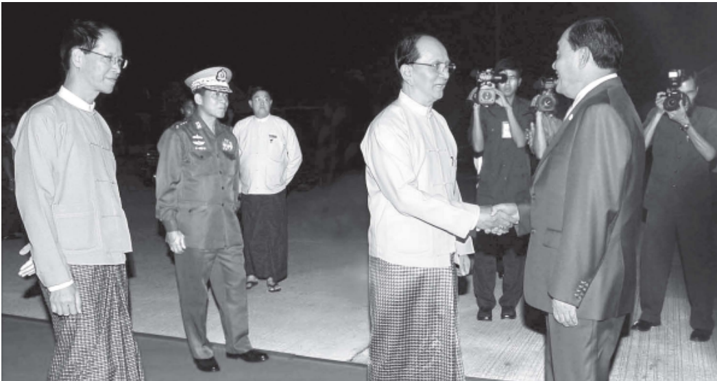
President of the Republic of the Union of Myanmar U Thein Sein welcomes back Vice-President Thiha Thura U Tin Aung Myint Oo on his return from China after attending the 8 th China-ASEAN Expo and Business and Investment Summit in Nanning, People's Republic of China.