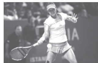
Li Na of China

Zvonareva overcome Caroline Wozniacki 6-2, 4-6, 6-3 in three sets to record her first win of the tournament.