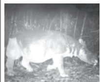
Genetic analysis of rhino dung samples revealed that there was only one individual left in Vietnam.—INTERNET

LONDON, 27 Oct — A critically endangered species of rhino is now extinct in Vietnam, according to a report by conservation groups. The WWF and the International Rhino Foundation said the