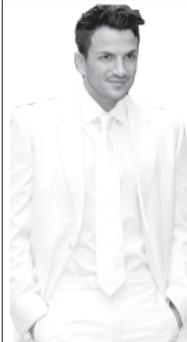
Singer Peter Andre