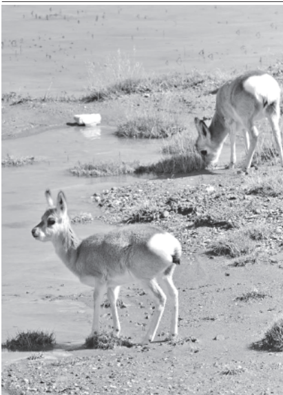
Photo taken on 23 Oct, 2011 shows Tibetan gazelles in protection zone of northwest China's Qinghai Province. Flocks of Tibetan antelopes, wild asses and Tibetan gazelles live in the protection zone.