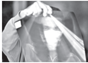
A man holds his lung X-rays in Rio de Janeiro 2009.

Subjects were either offered a chest X-ray or no screening at all. After four