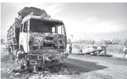
A fuel truck is seen destroyed after an explosion in Parwan Province, Afghanistan, on 26 Oct, 2011.—XINHUA

The paper said the infection included a "backdoor" virus, which opens a route into a computer's system to allow access by a remote hacker, who could use it to steal data. On Tuesday the Asahi Shimibun reported that computers in the lower house of parliament were hit by cyber attacks from a server based in China that left information exposed for at least a month.— Internet