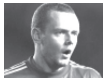
Jay Spearing knows he must keep working hard to stay in Kenny Dalglish's thoughts.

The 22-year-old is determined to demonstrate his worth to Reds manager Kenny Dalglish, and views the contest against Tony Pulis's uncompromising Potters team as the ideal opportunity to show he can handle a physical assignment.—Internet