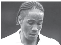
Steven Pienaar has recovered after groin surgery in the summer.

South Africa midfielder Pienaar underwent groin surgery in the summer and French defender Gallas has been battling calf injuries, resulting in both missing the start of the season.