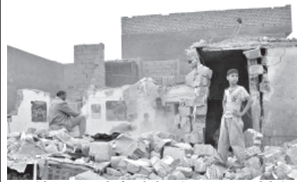
Residents search for belongings among debris after a bomb attack in the Town of Isakandariya, 40 km (25 miles) south of Baghdad, on 25 Oct, 2011.