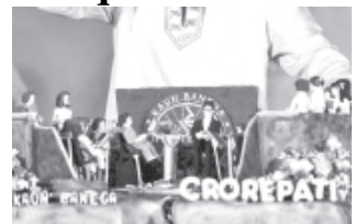
A computer operator who earns just $130 a month has become the first person to win the $1 million top prize on the Indian version of the "Who Wants to be a Millionaire?" television quiz.