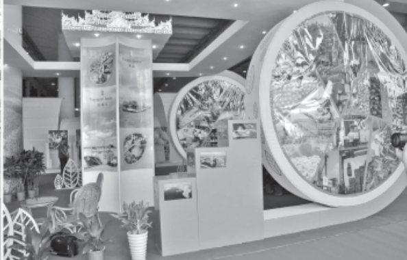
Vice-President Thiha Thura U Tin Aung Myint Oo observes Myanmar booth to be displayed at 8 th China-ASEAN Expo at Nanning International Convention & Exhibition Centre in Nanning of Guangxi Zhuang Autonomous Region of China.