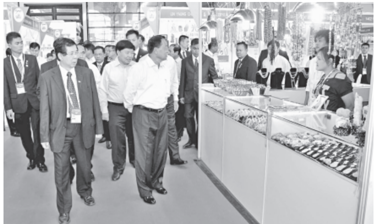
Vice-President Thiha Thura U Tin Aung Myint Oo observes Myanmar booth to be displayed at 8 th China-ASEAN Expo at Nanning International Convention & Exhibition Centre in Nanning of Guangxi Zhuang Autonomous Region of China.

The Vice-President viewed display of documentary photos on Nay Pyi Taw as pleasant capital at the hall of the pleasant capitals of countries. Officials of the Ministry of Commerce and RUMFCCI reported on display of the booth at the expo.