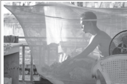
A Cambodian man sits inside a mosquito net in Kandal Province, Cambodia, on 26 Oct, 2011.