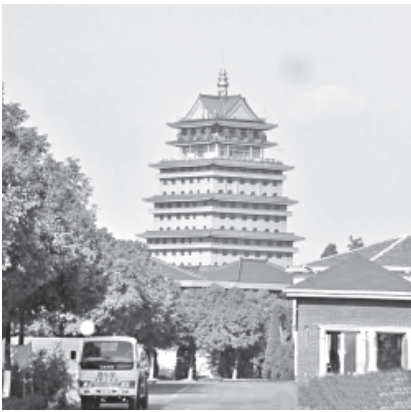
Huaxi Village in east China's Jiangsu Province is dubbed "China's richest village."