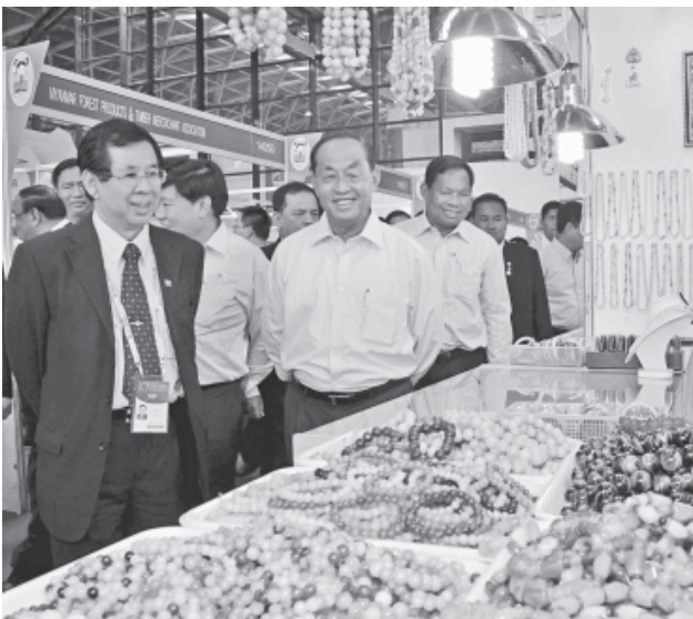
Vice-President Thiha Thura U Tin Aung Myint Oo observes Myanmar booth to be displayed at 8 th China-ASEAN Expo at Nanning International Convention & Exhibition Centre in Nanning of Guangxi Zhuang Autonomous Region of China.