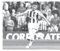
Long was injured by a tackle from Aston Villa's Alan Hutton.