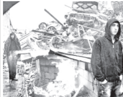
Homeless survivors warm themselves at a bonfire after the earthquake in Erzis.

Bomb disposal squad confirmed the usage of explosive in the blast and said the bomb was planted in an empty cooking oil tin besides the shop while linking its trigger with the gate of the shop.— Xinhua