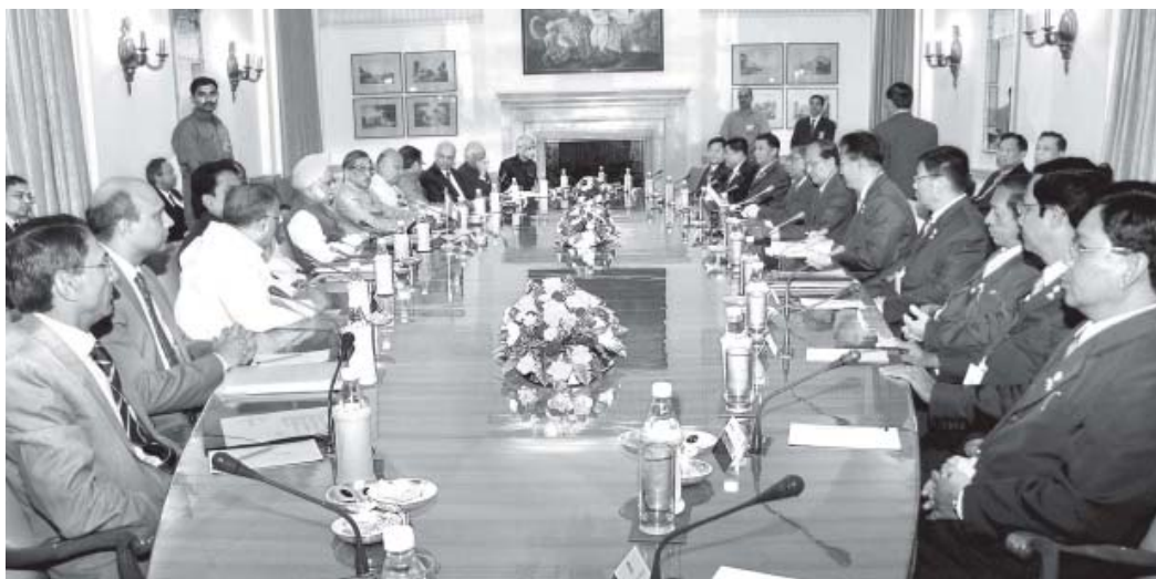
President U Thein Sein holds discussion with Indian Prime Minister Dr Manmohan Singh at Conference Room of Hyderabad House in New Delhi.

NAY PYI TAW, 15 Oct—President of the Republic of the Union of Myanmar U Thein Sein and Indian Prime Minister Dr Manmohan Singh