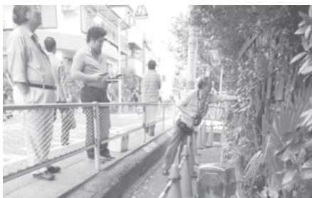
The cordoned off area of a Tokyo street where the high radiation reading was found.

An investigation traced the contamination to several bottles that had been stored in a card-