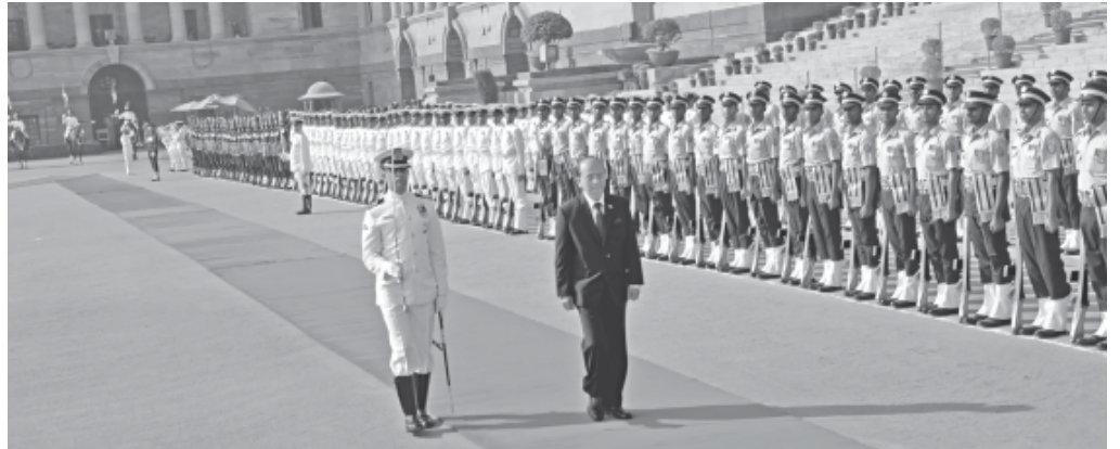
President U Thein Sein inspects Guard of Honour of India.—MNA

U Nyan Tun Aung, Union Minister for Energy U Than Htay, Union Minister for Science and Technology U Aye Myint, Union Minister for Commerce U Win Myint, Deputy Minister for Health Dr Win Myint, the Myanmar ambassador and high-ranking officials. The Indian President was accompanied by Indian prime minister, ministers and high-ranking officials.—MNA