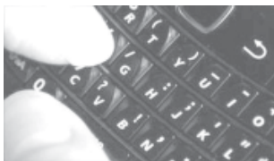
Often not as clean as it looks.

nated phones was in Birmingham (41%) while Londoners were caught with the highest proportion of E. coli present on hands (28%). But the sample size in each city was small, so the variations between them could be a statistical anomaly. However Dr Val Curtis, from the London School of Hygiene says the study showed clear differences between north and south.