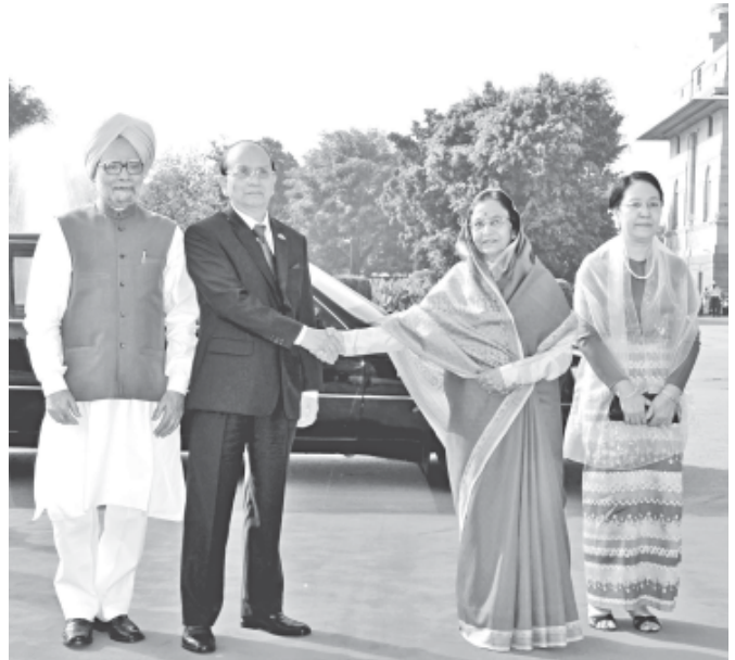
President U Thein Sein and wife Daw Khin Khin Win being warmly welcomed by Indian President Mrs Pratibha Devisingh Patil at Rashtrapati Bhavan in New Delhi.