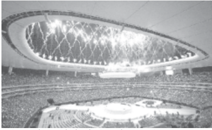
Fireworks explode during the opening ceremony of the 16th Pan American Games Guadalajara 2011 at the Omnilife stadium in the city of Guadalajara, Mexico, on 14 Oct, 2011.