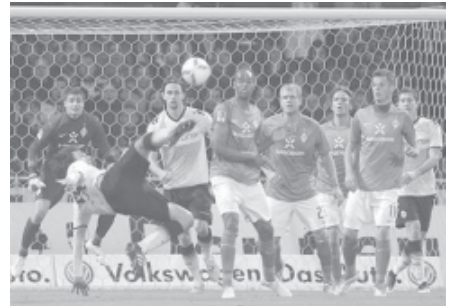
Dortmund's Robert Lewandowski of Poland, front left, kicks the ball during the German first division Bundesliga soccer match between Werder Bremen and Borussia Dortmund in Bremen, Germany, on 14 Oct, 2011.