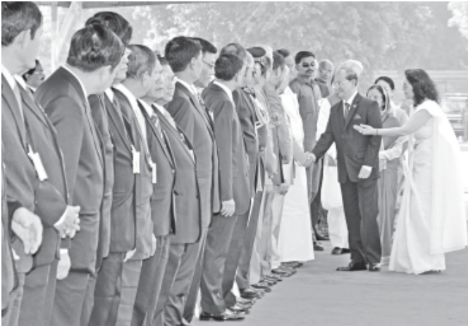
Indian President Mrs Pratibha Devisingh Patil introduces Indian Prime Minister Dr Manmohan Singh, ministers, deputy ministers and senior officials at ceremony to welcome President U Thein Sein and wife Daw Khin Khin Win.