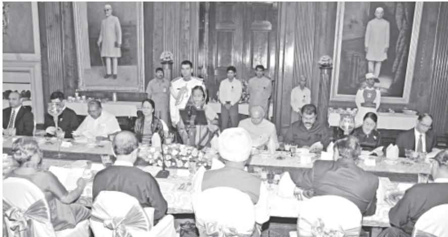
Indian President Mrs Pratibha Devisingh Patil delivers speech at banquet in Banquet Hall of the Republic of India.