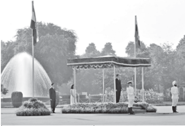
President U Thein Sein takes salute of Guard of Honour of India.