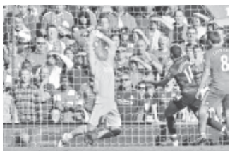
Javier Hernandez preserved Manchester United's unbeaten start to the season with an 81st-minute equaliser as Liverpool were held 1-1 at Anfield on Saturday.

LIVERPOOL, 15 Oct—Substitute Javier Hernandez rescued a point for Manchester United with a late equalizer as Liverpool were held to a 1-1 draw in the Premier League at Anfield on Saturday. Steven Gerrard looked to have earned his side all three points after scoring with a 68th-minute free kick in his first start for seven months. But United, which started the game with leading scorer Wayne Rooney on the bench, continued its unbeaten start to the season thanks to Mexico international Hernandez, who headed home an 81st-minute goal. The capacity 45,065 crowd at Anfield included two-time NBA MVP LeBron James, who watched Liverpool play live for the first time since becoming a minority owner of the club. James, who made a $10,000 donation to the Liverpool's foundation charity, did well not to nod off in a first half when chances were sparse as United manager Alex Ferguson left Rooney out with the England striker "devastated" over a three-match Euro