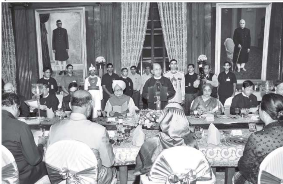
President U Thein Sein delivers an address at dinner at Banquet Hall.

NAY PYI TAW, 15 Oct—Mrs Pratibha Devisingh Patil, President of the Republic of India, hosted a dinner in honour of President of the Republic of the Union of Myanmar U Thein Sein and wife Daw Khin Khin Win at Presidential Palace in New Delhi yesterday.