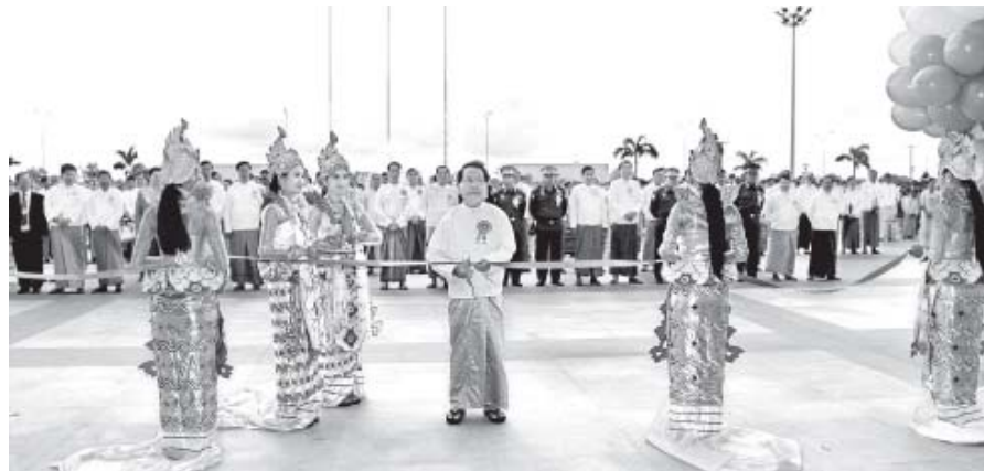
Union Minister for Information and for Culture U Kyaw Hsan formally opens 18 th Myanmar Traditional Cultural Performing Arts Competitions.—MNA

Organization and sung by artists. Afterward, Vice-President Dr Sai Mauk Kham and party cordially greeted attendees. MNA