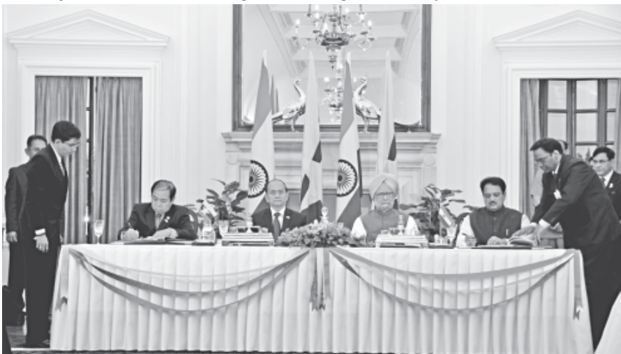
Union Minister for Science and Technology U Aye Myint and Indian Minister for Science and Technology Shri Vilasrao Deshmukh sign agreement on Programme on Cooperation in Science and Technology in the presence of President U Thein Sein and Indian Prime Minister Dr Manmohan Singh.