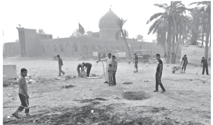
People gather at the scene of a car bomb attack in a town just outside Hillah, about 60 miles (95 kilometres) south of Baghdad, Iraq recently.