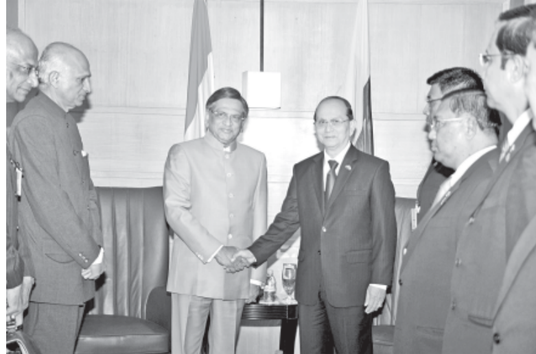
President of the Republic of the Union of Myanmar U Thein Sein cordially greets Indian Minister of External Affairs Shri S M Krishna. MNA

NAY PYI TAW, 15 Oct—President of the Republic of the Union of Myanmar U Thein Sein yesterday received Minister of External Affairs Shri S M Krishna at ITC Maurya Hotel in New Delhi.