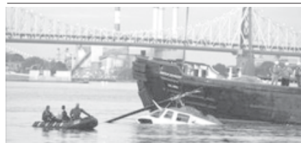
The helicopter had been undergoing routine checks days before the crash.