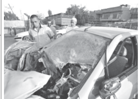
People inspect a damaged car at the scene of a bomb attack in Baghdad, Iraq, on 14 Oct, 2011. Two explosions on Thursday night in Sadr City neighbourhood killed and wounded scores of people, police said.