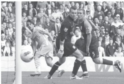
Manchester City's David Silva (L) watches his shot go wide of the Aston Villa post during their English Premier League soccer match in Manchester, 15 Oct, 2011.

LONDON, 15 Oct —Manchester City dismissed Aston Villa 4-1 on Saturday to move two points clear of city rival Manchester United at the top of the Premier League after the defending champions were held to a 1-1 draw at Liverpool.