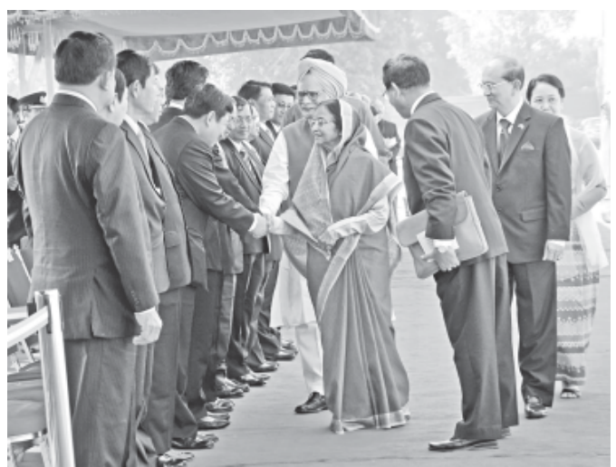
President U Thein Sein introduces members of Myanmar delegation to Indian President Mrs Pratibha Devisingh Patil.