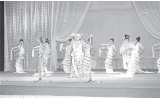
Union Minister for Information and for Culture U Kyaw Hsan, Union Minister U Aung Min and wife, Union Auditor-General U Lun Maung watch “Birth of Buddha” drama.