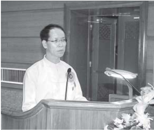
Vice-President Dr Sai Mauk Kham addresses opening ceremony of 18 th Myanmar Traditional Cultural Performing Arts Competitions.